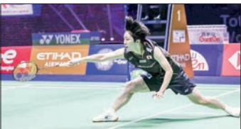
Akane Yamaguchi won gold in Paris.

AKANE Yamaguchi beat former world number one Chen Yufei of China 21-9, 21-13 on Sunday to win the women’s singles badminton world championship final. The Japanese fifth seed rarely looked troubled on court in Paris and needed just 37 min-