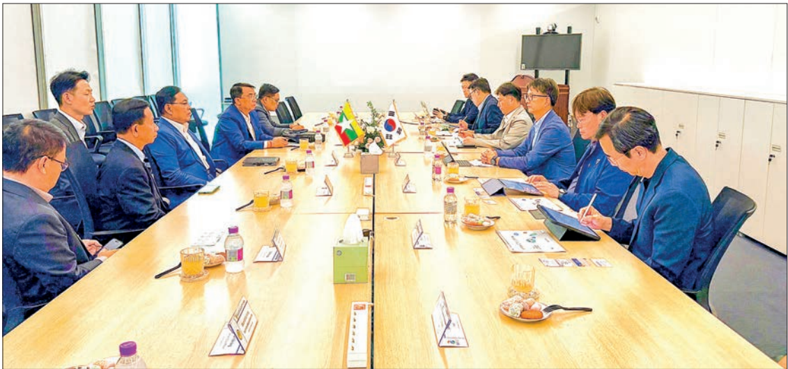
Union Minister U Myo Thant meets companies responsible for construction and consultancy works of the Dala Bridge in Seoul, Republic of Korea.

They also visited the Korea Authority of Land and Infrastructure Safety (KALIS)