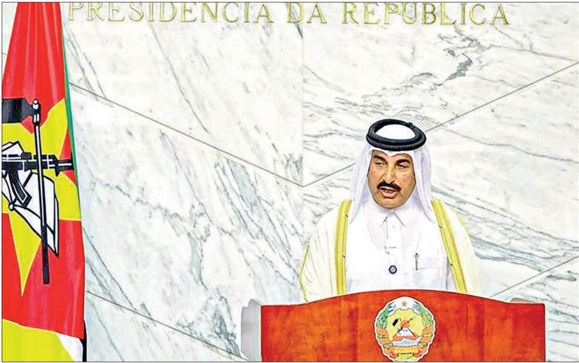
Qatari royal Sheikh Mansour bin Jabor bin Jassim Al Thani during his visit to Mozambique.

Analysts view these investments as strategic moves amid declining US funding in the region, signaling growing Qatari influence in southern Africa's development landscape.