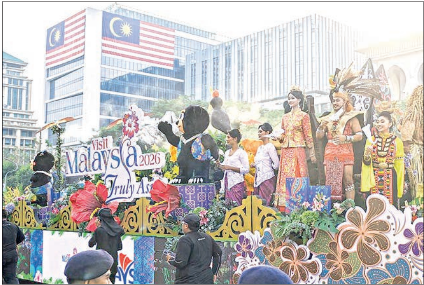
Performers are pictured during a celebration event marking Malaysia's 68 th anniversary of independence in Putrajaya, Malaysia, 31 August 2025. Malaysia celebrated its 68 th anniversary of independence on Sunday.

MALAYSIA marked the 68 th anniversary of independence on Sunday, with national leaders joining a huge public turnout at the administration centre of Putrajaya to witness a parade celebrating the National Day.