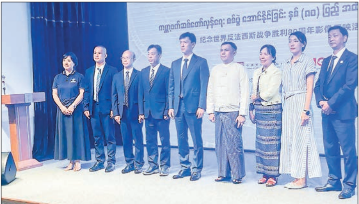
The commemorative video show of the 80 th Anniversary of the Victory in the World Anti-Fascist War is in progress at Chinese Culture Centre in Yangon on 30 August.