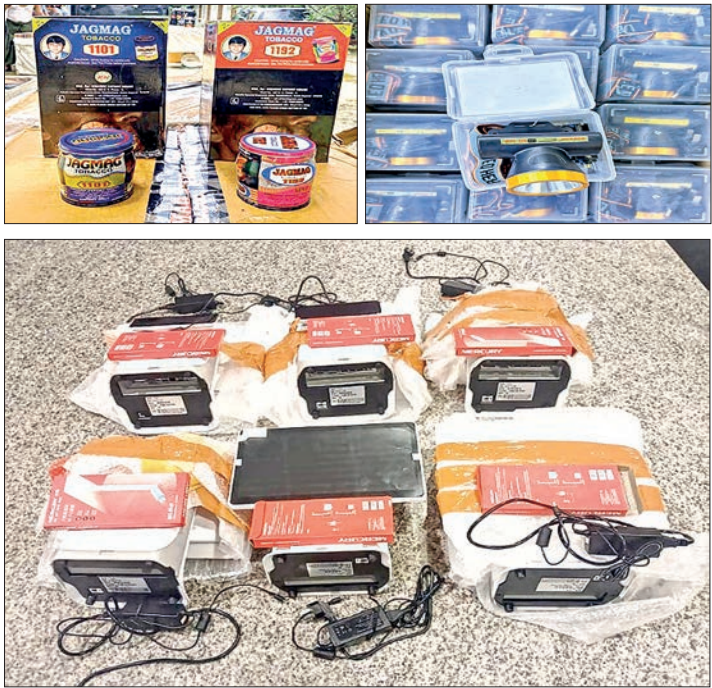
Photos show confiscated illegal tobacco, Cash register with accessories and LED head light.

UNDER the supervision of the Illegal Trade Eradication Steering Committee, efforts to combat the illicit trade are continued effectively by the law. On 27 and 28 August, the combined teams impounded four unregistered vehicles worth K33.5 million in Myeik and Bokpyin Townships, illegal timbers valued at K890,040 in Pyu and DaikU Townships and a Mitsubishi Rosa (approximately K25 million) carrying foodstuff worth K140.4 million without official documents near the checkpoint on the outskirts of Thanetpin Township. The action was taken under the Export/Import Law, the Forest Law, and Customs procedures. Additionally, on 26, 27 and 29 August, combined on-duty teams seized illegal fuel oil and lubricant worth K1.36 million at the Yadanabon bridge (Hnapauk) checkpoint, illegal teaks, hardwoods and other timbers from an unregistered vehicle and an unregistered motorbike valued at K86.428 million in PyinOoLwin, Kyaukse, TadaU, Patheingyi, Amarapura, Thazi and Yamethin Townships, illegal timbers worth K250,340 in Kyangin Township, industrial material worth K346.185 million without official documents from a