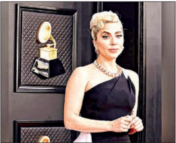
The song’s arrival coincides with the release of the second half of the Netflix show on the same day.

SINGER Lady Gaga is the latest addition to the slate of performers for the MTV VMAs, taking place on 7 September and airing on CBS and Paramount+, according to Variety. Gaga received the most nominations for this year’s ceremony, racking up a dozen nods for ‘Die With a Smile,’ ‘Abracadabra,’ and her latest album ‘Mayhem.’ Bruno Mars trailed behind her with 11 nominations, followed by Kendrick Lamar with 10, Sabrina Carpenter and Rose with eight, and Ariana Grande and the Weekend with seven, reported Variety. Additional performers include Carpenter, Post Malone, Sombr, Doja Cat, Conan Grey, Alex Warren, DJ Snake, Jelly Roll, J Balvin and Tate McRae, reported Variety. — ANI