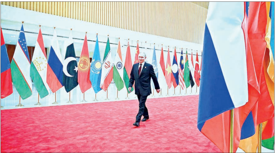
The summit, held at the Meijiang Convention and Exhibition Centre from 31 August to 1 September, began with a reception hosted by President Xi for heads of national delegations. PHOTO: SPUTNIK

with a reception held for heads of national delegations in President Xi’s name. The SCO summit, the largest in history, is being held at the Meijiang Convention and Exhibition Centre from 31 August to 1 September. It is expected to draw more than 20 foreign leaders and representatives of international organizations. — SPUTNIK