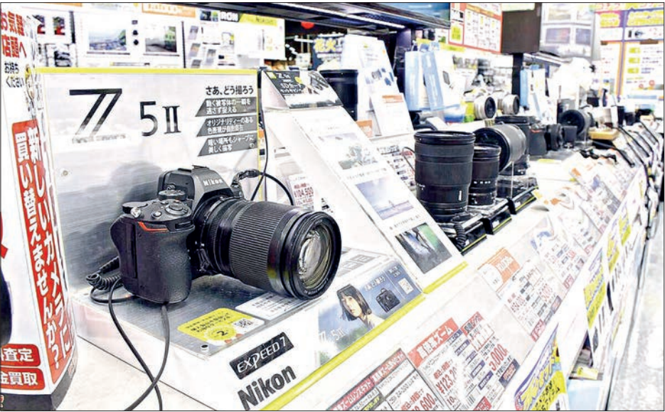
Nikon mirrorless cameras on display at an electronics store in Tokyo on 7 August 2025.

MAJOR Japanese camera manufacturers are ramping up their mirrorless offerings as they seek to tap into growing demand for advanced features such as artificial intelligence-assisted shooting. While global shipment volumes of digital cameras have declined with the rise of camera-equipped smartphones, makers are moving to seize new business opportunities amid an era of high-quality content creation driven by social media. According to the Camera & Imaging Products Association, global shipments of digital cameras by major Japanese manufacturers totaled 8.49 million units in 2024, less than 10 per cent of the peak of 121.46 million units in 2010. But mirrorless cameras are helping to boost numbers, with global shipments rising 22.5 per cent in the first six months of 2025 from the same period last year. Meanwhile, single-lens reflex cameras fell 21.5 per cent. — Kyodo