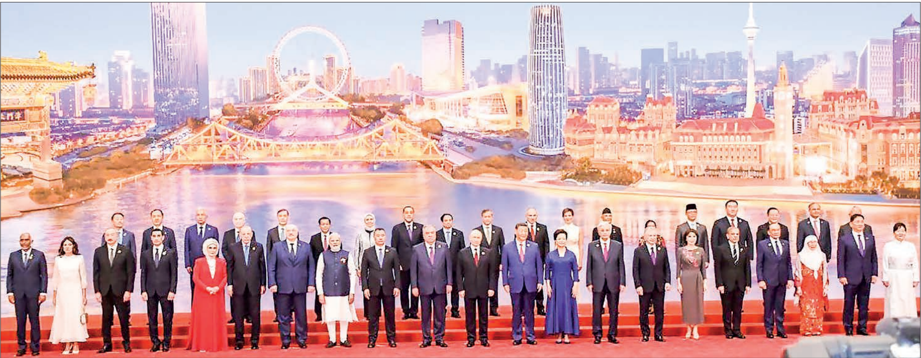
Acting President of the Republic of the Union of Myanmar, Chairman of the State Security and Peace Commission of the Republic of the Union of Myanmar, Senior General Min Aung Hlaing poses for a group photo with Chinese President Mr Xi Jinping and his wife, Peng Liyuan and international guests before a welcoming dinner at the Meijian Convention Centre in Tianjin, north China, 31 August 2025.

(An excerpt from guidance given by Chairman of the State Administration Council, Prime Minister Senior General Min Aung Hlaing to Shan State cabinet members and state-level departmental officials on 3 September 2024)