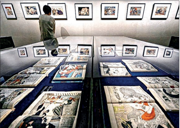
Despite their seedy image, shunga represents the craftsmanship of some of Japan’s finest ukiyo-e artists.

A rare Tokyo exhibition showcases around 150 pieces of shunga, traditional Japanese erotic ukiyo-e art from the Edo period, focusing on female pleasure and empowerment. Despite its explicit depictions of nudity, genitals, and sex, shunga is distinct from male-centred pornography and reflects a deep appreciation of female sensuality, including vulva, oral stimulation, and same-sex intimacy. The genre was suppressed during Japan’s 19 th -century westernization and remains stigmatized, often mistaken for commercial porn. Experts and visitors highlight shunga’s artistic craftsmanship by masters like Hokusai and Utamaro, noting its humor, technique, and realistic portrayals despite exaggerated elements. The exhibition, held in Tokyo’s Kabukicho district, aims to shift public perception from taboo to cultural and artistic value, encouraging interest in ukiyo-e and traditional kabuki theatre. Organizers acknowledge ongoing prejudice but hope the vibrant colours and humanistic themes will inspire broader appreciation and destigmatize this unique art form. — AFP