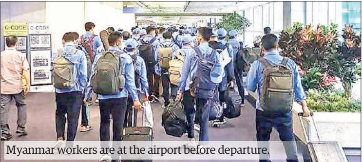
Myanmar workers are at the airport before departure.

the Ministry of Labour through the Ministry of Foreign Affairs. It is about 369 demand letters that the embassy submitted to the Ministry of Foreign Affairs after verification until 3 June 2025. According to it, more than 260 Myanmar male workers and more than 1,300 Myanmar female workers, totalling over 1,500, would be employed. A statement on 15 August said up to 360 Japanese companies would provide jobs for around 1,500 Myanmar workers. — MT/ZS