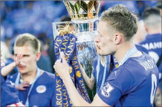
Jamie Vardy won the Premier league with Leicester City in 2016.

JAMIE Vardy is close to completing a move to Cremonese, who are level on points with Serie A leaders Napoli, a source at the promoted club confirmed to AFP on Sunday. The source told AFP that former Premier League winner Vardy will arrive in Milan on Sunday evening ahead of completing a one-season deal with an option for another should Cremonese stay in Italy’s top flight. Cremonese are on a perfect six points from their first two fixtures of the new Serie A season after beating Sassuolo 3-2 on Friday and winning against AC Milan at the San Siro last weekend. Vardy left Leicester City after 13 years at the end of last season, bringing down the curtain on a relationship which created one of the most romantic stories in recent football history. The 38-year-old signed for Leicester from non-league club Fleetwood town while in his mid-20s, having previously combined playing with a job as a factory worker. He quickly made an impact in England’s