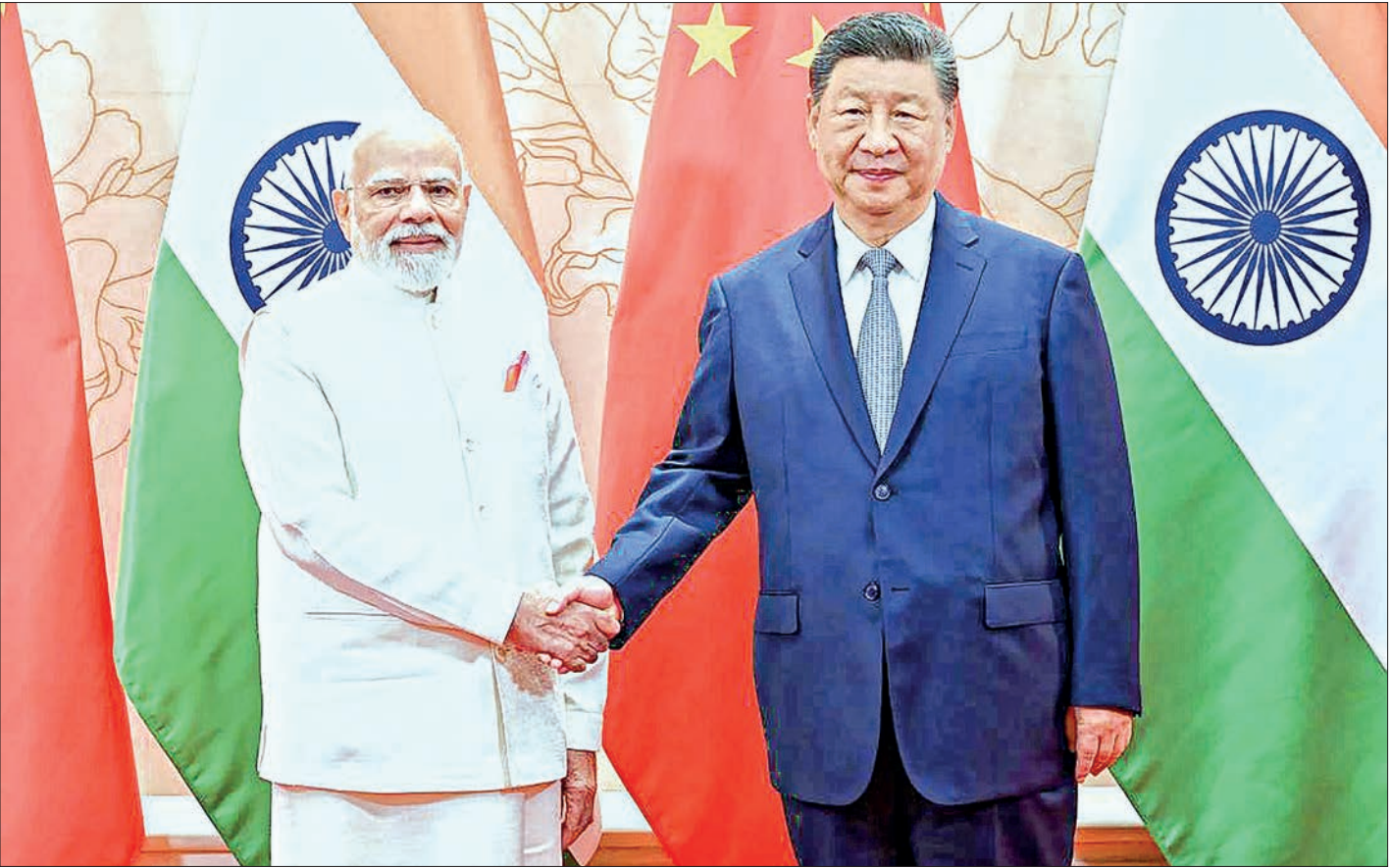
Chinese President Xi Jinping meets Indian Prime Minister Narendra Modi in Tianjin, north China, 31 August 2025. Modi is in China to attend the Shanghai Cooperation Organization (SCO) Summit 2025.

Xi highlighted the importance of adhering to this cooperative approach to ensure steady and long-term growth in China-India relations.