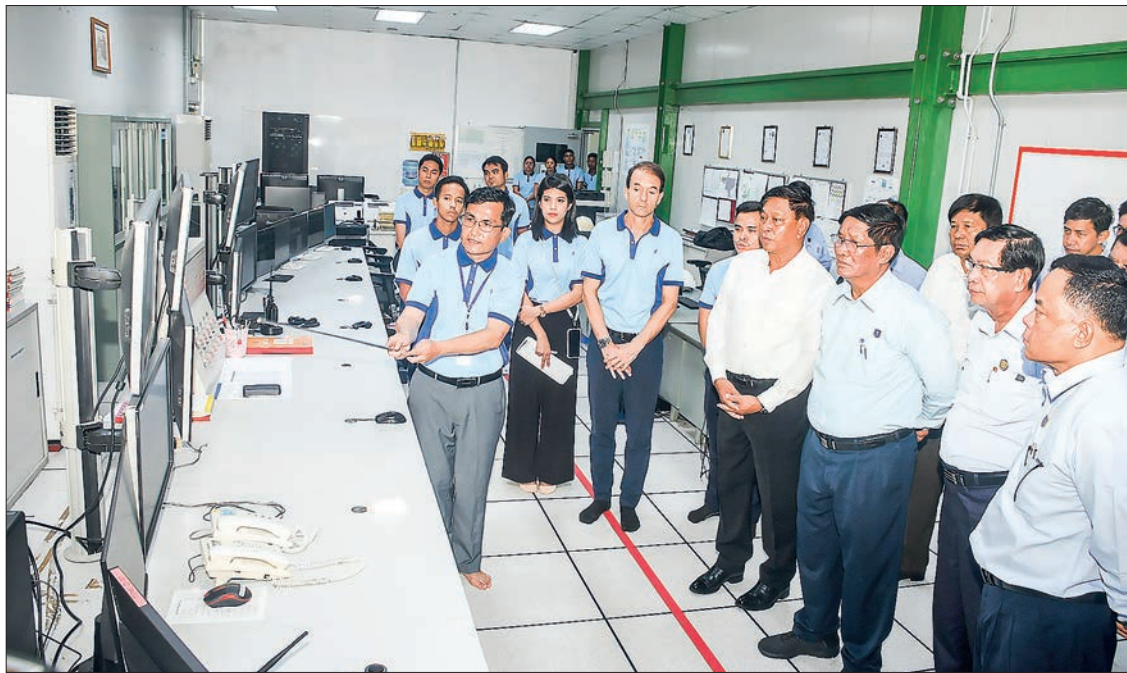
Union Minister U Tin Aung San inspects the power generation fed to the national grid in the control room in Yangon yesterday.

Regarding the presentations, the Commission Chairman noted that the installed capacity of natural gas and waste-to-energy power plants in Myanmar accounts for about 40 per cent of the total electricity generation capacity, second only to the hydroelectric sector, emphasizing