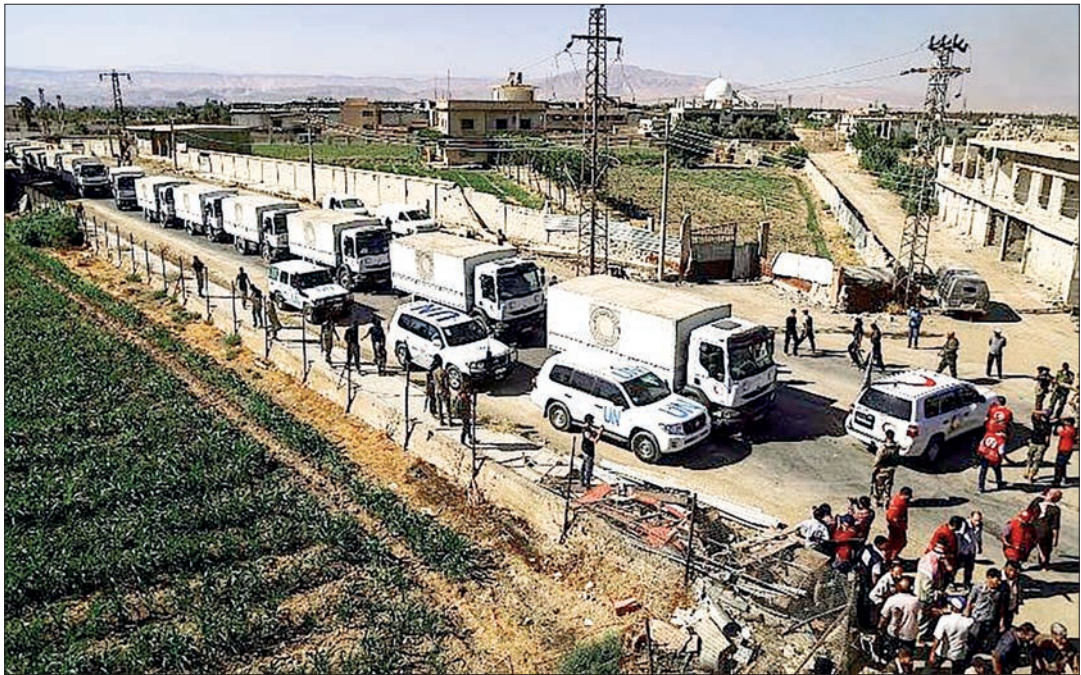
Illustrative: This photo taken on 30 July 2017 shows a United Nations and Syrian Arab Red Crescent convoy delivering aid packages in the rebel-held town of Nashabiyah in eastern Ghouta for the first time in five years.

Ministry said. With the continuing “serious humanitarian situation” in Syria and more refugees returning to their homes, helping people secure a safe living environment has become a “pressing issue”, the ministry said in a recent press release. — Kyodo