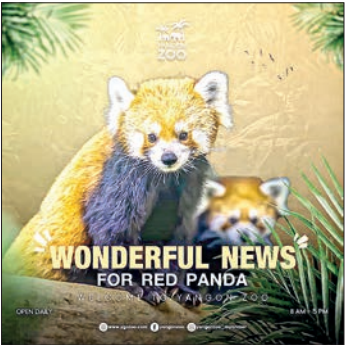
This photo showcases the new red pandas that arrived again at the Yangon Zoo. am to 4 pm daily. The entrance fee is K2,500 for adults and K1,500 for children.

and supervisors. As red pandas are listed on the IUCN Red List of Threatened Species, the Yangon Zoo is carefully protecting them from extinction, and visitors are welcome for observation at the zoo, which opens daily. Red pandas are mammals that live in the eastern Himalayas and western China. They have a peaceful nature and feed before dawn and at dusk, sleeping in the afternoon. The Yangon Zoo is a public recreation area open from 8