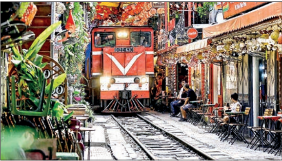
Authorities have repeatedly tried to shut down the tumbledown quarter of the Vietnamese capital for safety reasons.

IN Hanoi, a unique “train street” has become a popular tourist attraction despite safety concerns and government attempts to shut it down. Visitors gather in cafes lining the narrow railway tracks, inches away from slow-moving trains, creating a thrilling experience widely shared on social media. Originally built by French colonial rulers in the early 1900s, the railway was damaged during the Vietnam War but still serves budget travelers on old metre-gauge tracks managed by Vietnam Railways Corporation. The area, once a rough neighbourhood known for drug use and squatters, has transformed into a cleaner, safer, and more vibrant spot thanks to tourism. Local cafe owners oppose closure efforts, viewing the street as a valuable tourism asset. Tourists appreciate the organized safety measures, with staff guiding visitors to clear the tracks when trains approach. Vietnamese and foreign visitors alike consider the train street a distinctive and irreplaceable part of Hanoi’s tourism scene. Meanwhile, Vietnam plans a $67 billion high-speed rail project to modernize its infrastructure and boost economic growth. — AFP