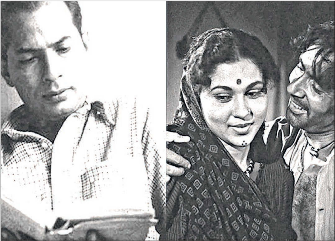
The restoration faced technical challenges, including incomplete negatives and problematic audio, but showcases the film’s humanism and social themes still resonant today.