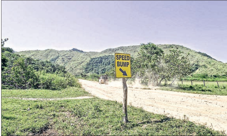
A car drives on 'The Trail' in Guyana's Essequibo region, which could greatly benefit from the road's modernization.

The new highway will connect to the Takutu Bridge into Brazil, opening access to a market of 20 million people, vastly larger than Guyana's population of 800,000. It will also link to the Palmyra deepwater port near Suriname, reducing shipping times for Brazilian goods from 21 days to 48 hours. — AFP