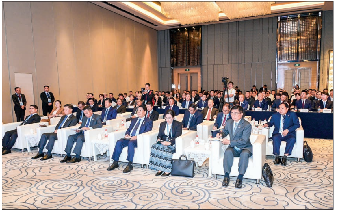
Acting President of the Republic of the Union of Myanmar, Chairman of the State Security and Peace Commission of the Republic of the Union of Myanmar, Senior General Min Aung Hlaing delivers a speech at the Myanmar-China economic cooperation promotion meeting at Tangle Hotel in Tianjin, China, yesterday.