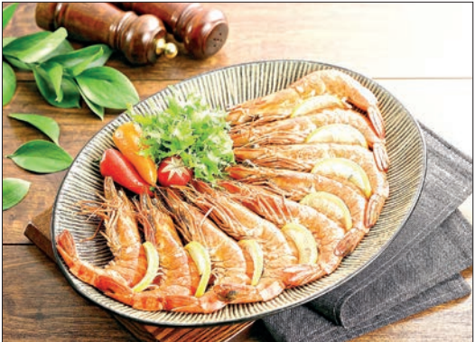
India's shrimp export volumes are expected to decline by 15-18 per cent in the current fiscal year following a sharp hike in US tariffs.

temporary surge in shipments during the first quarter as exporters rushed to fulfil orders ahead of the tariff hike. — ANI