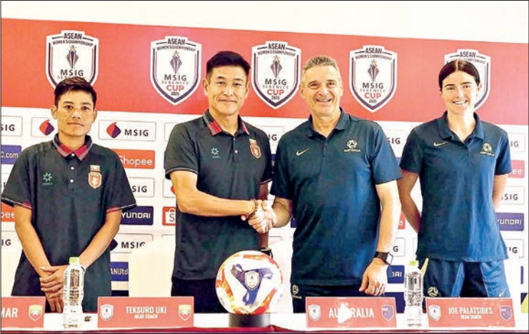
Coaches and players from Myanmar and Australia attend the Group B pre-match press conference ahead of their opening match.