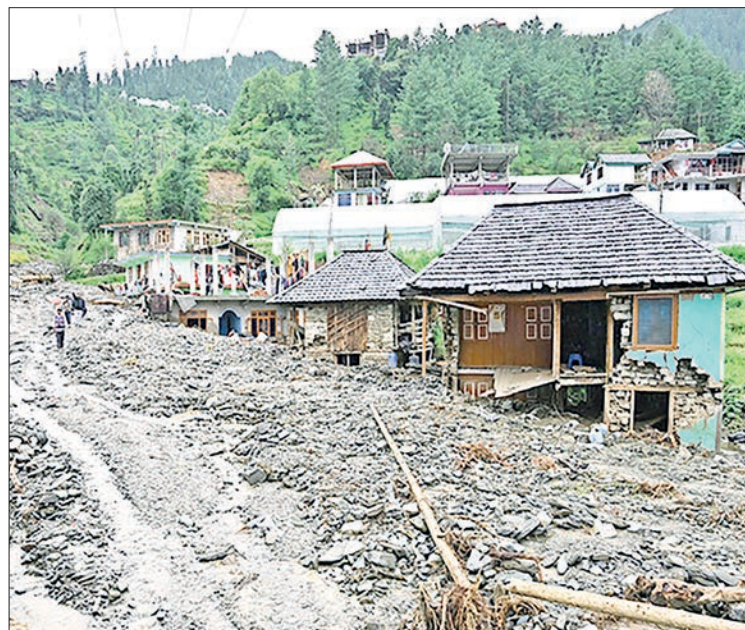
Property damage across the state is extensive.

Property damage across the state is extensive. As per official data, 579 houses have been destroyed while 1,741 houses suffered partial damage. Commercial losses include damage to 345 shops and 2,012 cowsheds. — ANI