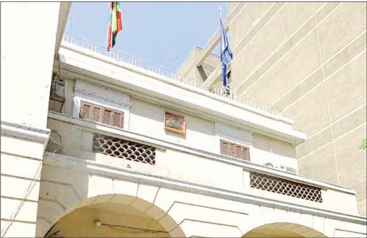
The Myanmar Embassy in Cairo.

Parents will need to be Citizenship Scrutiny Card holders. If parents are National Registration Card holders, they will need to update their registration by law to proceed with birth registration for their child. Only after birth registration is granted by the Department of Immigration and Population through the embassy so that the passport application be eligible. Application can be sent to the Myanmar Embassy via email me.cairo@gmail.com or +20 (2) 27362644,27363123, or can visit the embassy website www.mecairo.org . — MT/ZS