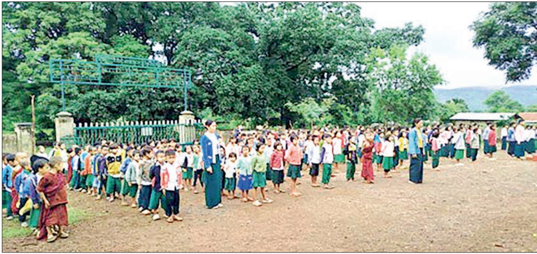
This photo shows schoolchildren and teachers lining up in unison for a morning assembly in Nawnghkio.

Following the ceremony, the Deputy Minister and the Ambassador visited the China-Myanmar Friendship Sports Grounds located at both No 14 and No 7 Basic Education High Schools, where students were seen actively participating in recreational activities.