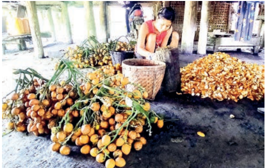
This photo shows a worker peeling betel nut.

India's areca nut import amounted to $143.45 million in FY 2024-2025, $147.99 million in FY 2023-2024 FY and $90.18 million in FY 2021-2022.