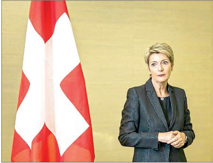
Swiss President Karin Keller-Sutter will seek to make a 'more attractive offer' to US officials in Washington.

The goal of their visit was to present a more attractive offer to the US to lower reciprocal tariffs on Swiss exports while addressing US concerns.