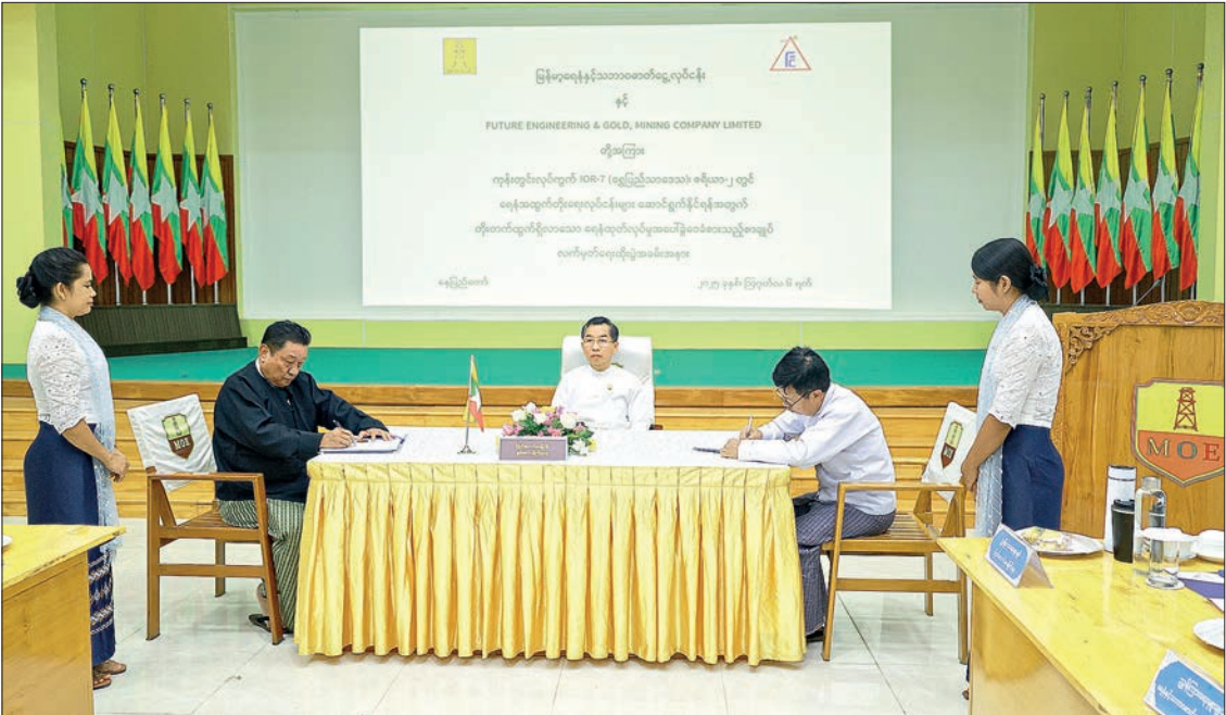
Officials from Myanmar Oil and Gas Enterprise and Future Engineering & Gold, Mining Co Ltd sign the production-sharing contracts yesterday in the presence of Union Minister U Ko Ko Lwin.

THE Myanmar Oil and Gas Enterprise of the Ministry of Energy signed production-sharing contracts with HNA Myanmar Oil & Gas Ltd for onshore block IOR-4 (Pyay) area-1 and IOR-6 (Myanaung) area-3 and with Future Engineering & Gold Mining Co Ltd for IOR-7 (Shwepyitha) area-2 in Nay Pyi Taw yesterday. Speaking at the event, Union Minister U Ko Ko Lwin said the energy sector plays a key role in the economic development of the country. Four objectives of the National Defence and Security Council include “to ensure sustainable development of the agriculture sector, which plays a vital role in the national economy, and the continual growth of socioeconomic life of the people will be achieved through the develop-