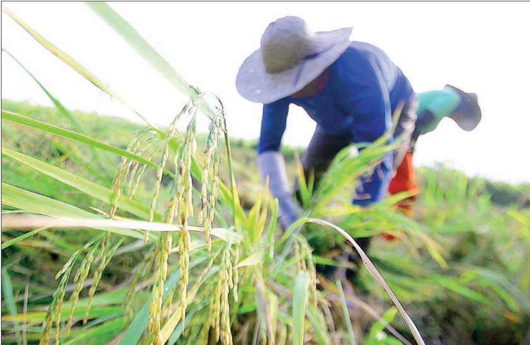
Farmers harvest rice at a rice field in Bulacan Province, the Philippines, 3 March 2016.

The directive aims to protect Filipino farmers during the current harvest season.