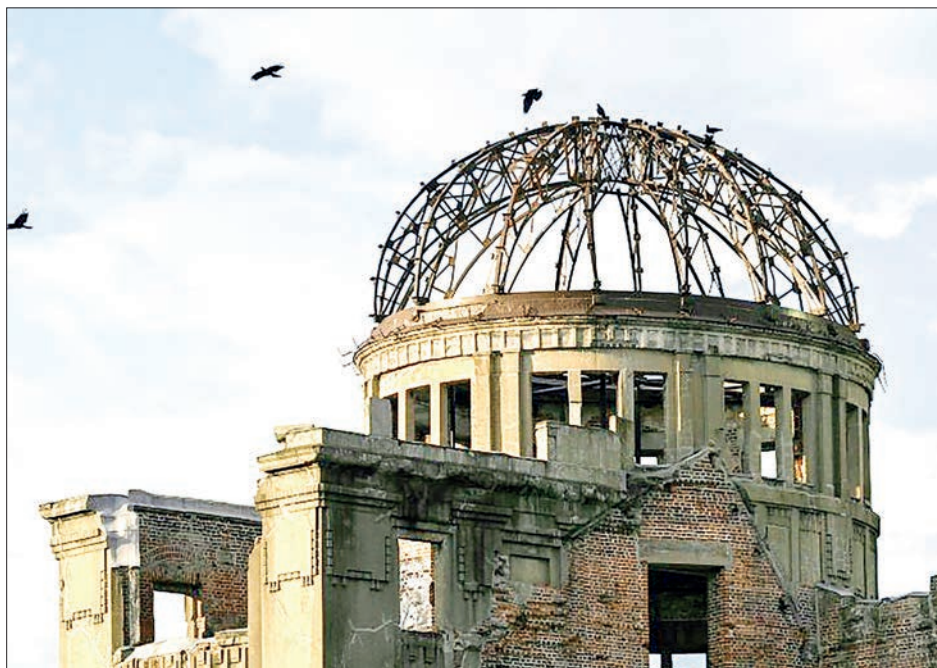
Hiroshima is marking 80 years since the world's first atomic bomb attack.

The navy said that during the final stage of the exercise, the Russian navy and the PLA navy carried out measures to search for and destroy an "enemy" submarine. — SPUTNIK