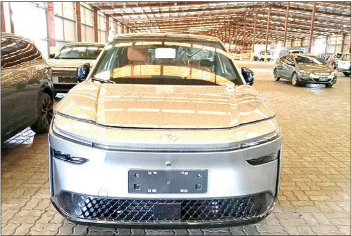
A GAC Toyota bZ3X electric vehicles imported by Shwe Thway Co Ltd seen at a warehouse of Yangon port.

WITH the approval of the Steering Committee on National-Level Development for Electric Vehicles and Related Industries, GAC Toyota bZ3X electric vehicles imported by Shwe Thway Co Ltd. and Changan Avatr 12 electric vehicles imported by Tharaphu Soe Myint Co Ltd, both manufactured in China, have arrived at the Port of Yangon. The vehicles were permitted to be released yesterday in conformity with official procedures. — MNA/MKKS