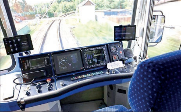
No driver is needed – except by legislation to supervise its operation, at least for now.

requires a driver for supervision due to existing legislation, the train has successfully navigated various obstacles, including animals on the track. So far, it has travelled around 1,700 kilometres (1,060 miles) with