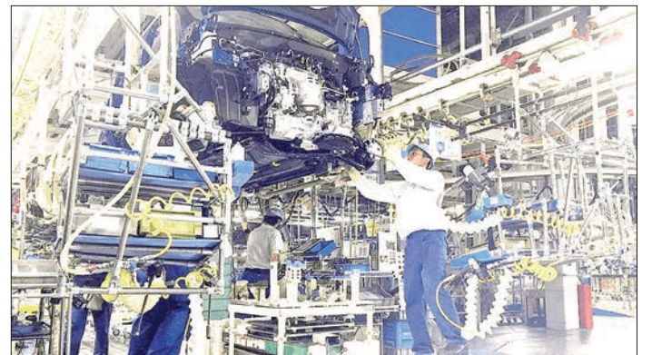
The survey covered 247 large companies with 500 or more employees across 23 industries.

5.42 per cent in the manufacturing sector, an increase of 19,063 yen, while the nonmanufacturing industry saw a 5.34 per cent gain, or 19,487 yen.