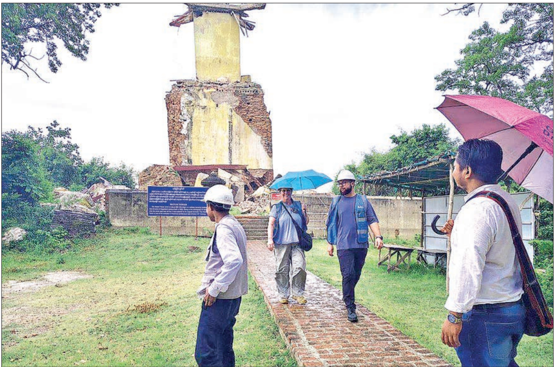
Photos reveal religious buildings damaged by the Mandalay earthquake, with local and foreign experts inspecting the damage.

inspections on ancient heritage buildings in the Mandalay Region that were damaged by the Mandalay earthquake. They visited Amarapura, Inwa, and Mandalay in the Mandalay Region from 14 to 21 July to conduct a first-phase inspection of the damage to cultural heritage, with the second phase scheduled to begin in the third week of August. Experts conducted field visits to the Shwegugyi Pagoda in Amarapura; the Four-Storeyed Monastery in Inwa; Mae Nu Oak- kyaung; Kyauktawgyi Pagoda, Kuthodaw Pagoda, and Mandalay Palace in Mandalay Region to carry out advanced inspections aimed at determining emergency restoration measures as part of a long-term restoration plan. — ASH/TH