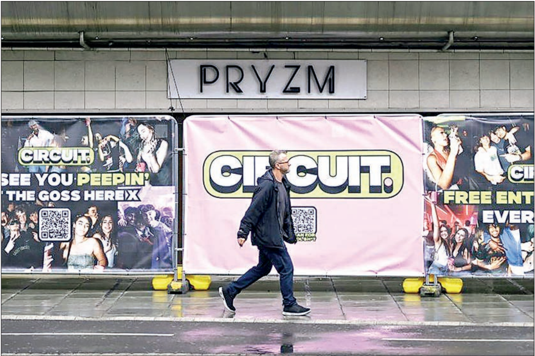
A man walks past the boarded up entrance to the closed-down PRYZM club in Kingston, west London.