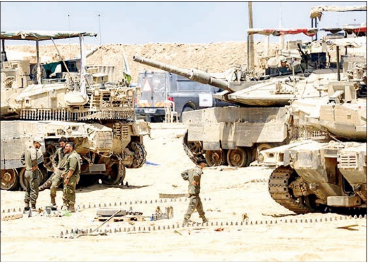
Israeli army soldiers perform maintenance tasks near the border with the Gaza Strip.

His office later said he had held a three-hour “security discussion” with army chief Eyal Zamir, but did not disclose any new war plans. — AFP