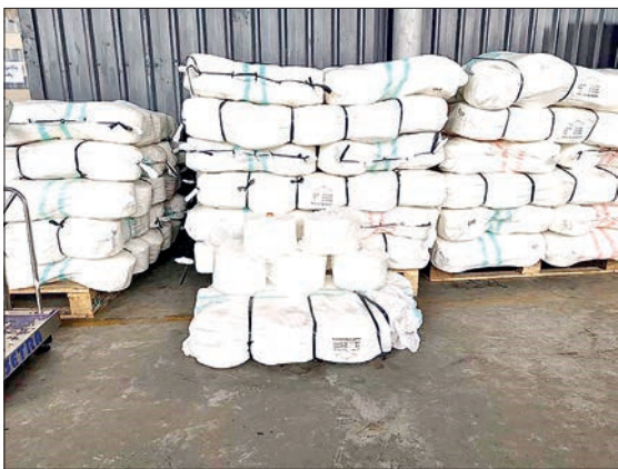
Confiscated illegal tyres and yarn across regions and states in July.

UNDER the supervision of the Steering Committee for the Prevention of Illegal Trade, special task forces have been formed to combat illegal trade in Nay Pyi Taw Council Territory, as well as in regions and states across the country. Additionally, One Stop Service teams led by the Customs Department have been established to enhance enforcement. Operations are being effectively carried out at border entry and exit points, border trade offices and camps, permanent checkpoints, along trade routes, at warehouses, international ports and airports, and river ports. Reliable and timely in-