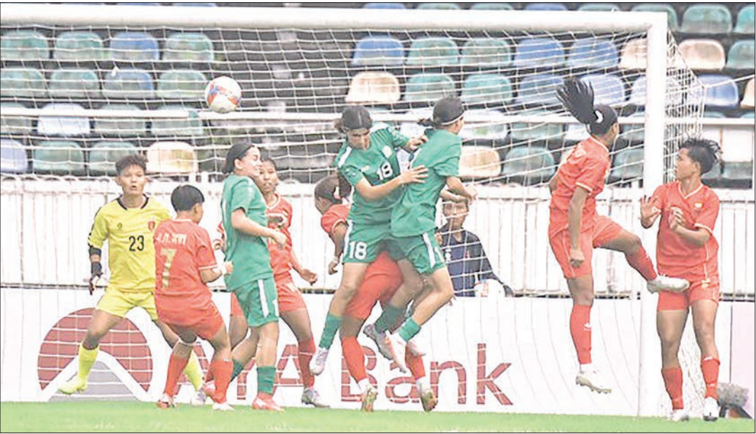
Myanmar and Turkmenistan players in action during the Group D opening match.

PREMIER League sides Manchester United and Newcastle have both placed competing bids for in-demand RB Leipzig striker Benjamin Sesko, German tabloid Bild reported Tuesday. The German tabloid said the Red Devils made an initial bid of 85 million euros (£73.9 million) on Tuesday for the 22-year-old centre forward. Newcastle had offered a reported 80 million euros for the striker on Saturday, upping that to 85 million with bonuses on Monday. — AFP