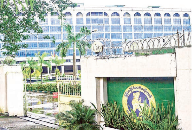
The office building of the Central Bank of Myanmar in Yangon.

CBM aims to curb the instability in the foreign exchange market and currency devaluation. According to CBM's notification on 15 March 2024, it has been collaborating with law enforcement agencies to combat and prosecute those who attempt to manipulate the currency market under the existing laws. CBM allowed authorized dealers (private banks) to operate online foreign exchange trading freely as per the market rate, depending on supply and demand, starting from 5 December 2023. — NN/KK