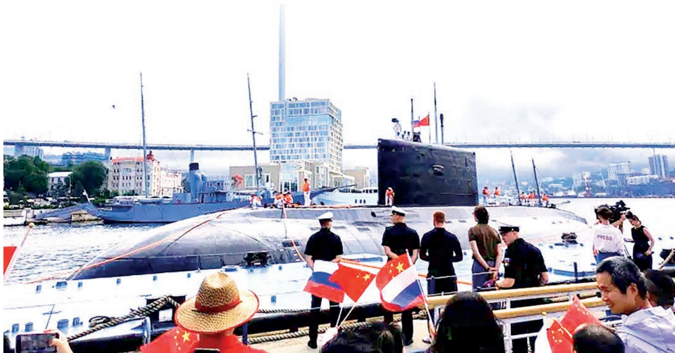
People take part in a ceremony marking the start of the upcoming Russian-Chinese joint naval drills in Vladivostok, Russia, on 31 July 2025.

While wooing voters during the campaign, Nawrocki signed an eight-point pledge prepared by far-right leader Slawomir Mentzen. — AFP