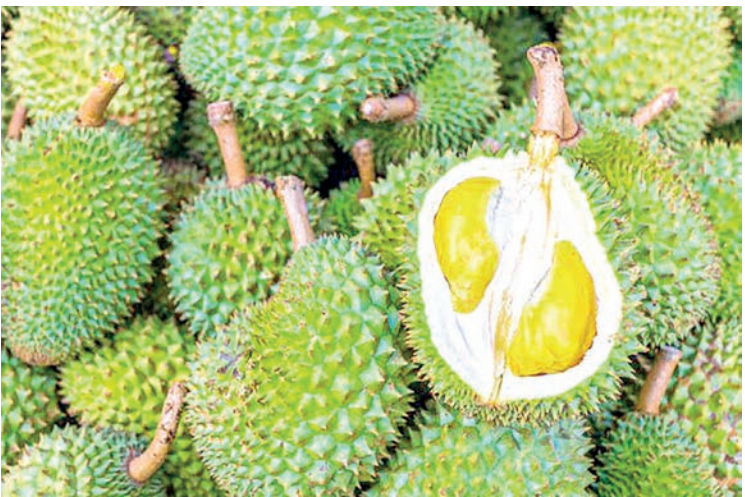
A vendor shows an opened durian at a durian shop.

It is the fifth group of Myanmar Durian Growers and Exporters organized so far. The respective groups have been formed in Yangon and Bagan and Mon, and Kayah states. — NN/KK