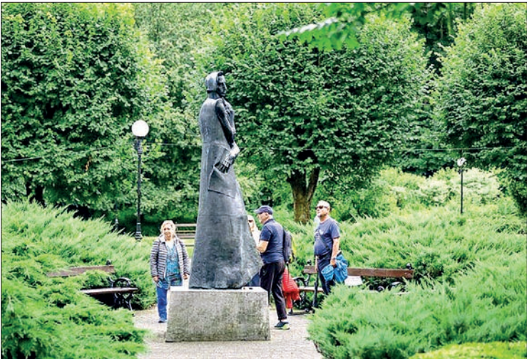
The Frederic Chopin monument in Duszynki Zdroj, where the composer’s legacy is visible everywhere.