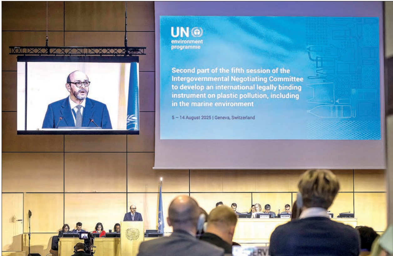
The chairman of the negotiations, Ecuadorian ambassador Luis Vayas Valdivieso (5 th -L) is displayed on a screen (Top-L) as he delivers a speech during the plastics treaty negotiations at the United Nations Offices in Geneva on 5 August 2025.

This is the highest level in the observatory's three-tier heavy rain alert system. This indicates that heavy rain has fallen or is expected to fall generally over Hong Kong, exceeding 70 millimetres in an hour, and is likely to continue. Due to seriously flooded roads and inclement weather conditions, people are advised to take shelter in a safe place. An emergency coordination centre of the Home Affairs Department of the Hong Kong Special Administrative Region (HKSAR) government is in operation. The department has opened temporary shelters for needy people. In light of the severe rainstorm, some public services and activities in the HKSAR have been suspended. — Xinhua