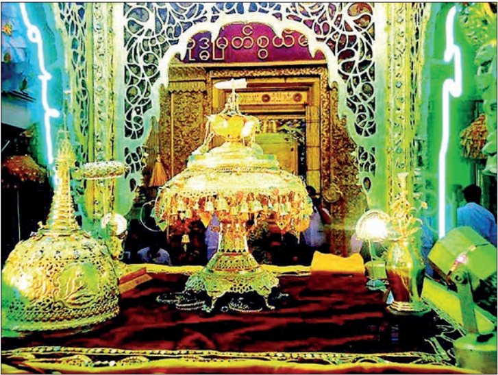
Photos showcase the sacred Buddha Tooth Relic seen during the previous year's festival.