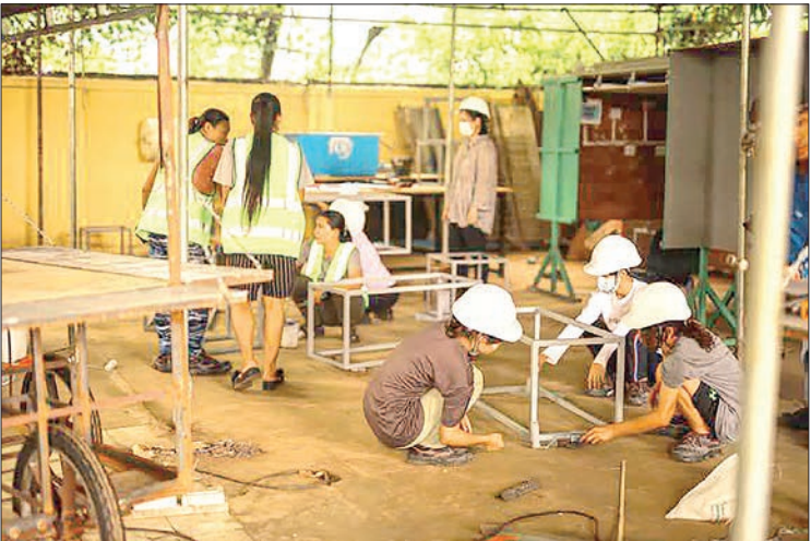
Women diligently working in the construction industry.

Throughout the programme, health insurance and stipends will be provided, and all job-seeking women between the ages of 18 and 40, including undergraduates and graduates, are encouraged to apply. The programme is described as a platform for women to share skills in the construction industry as well as life skills and to help them establish themselves as professionals on an equal footing with men in the construction industry. After learning life skills for three months, trainees will be provided with consultations on job opportunities by experts, including working as an apprentice for one month. – MT/ZN