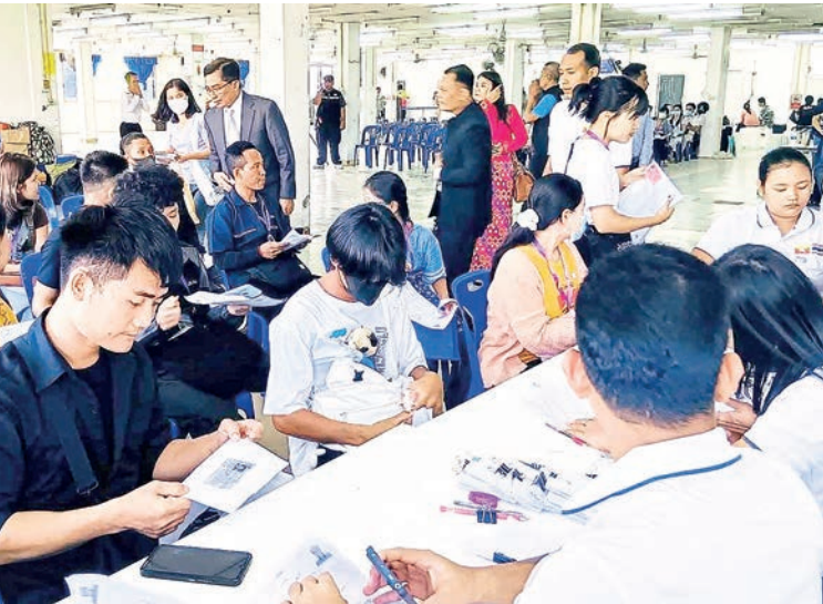
Certificate of Identity services provided at four stations.

CERTIFICATE of Identity (C of I) replacement service will be provided for Myanmar migrant workers in Thailand by setting up four stations, said the Office of the Labour Attache in Bangkok. In cooperation between Myanmar and Thai labour ministries, C of I replacement will be provided at four stations: Samut Sakhon, Samut Prakan, Surat Thani and Chiang Mai, starting from 6 August, for C of I holders