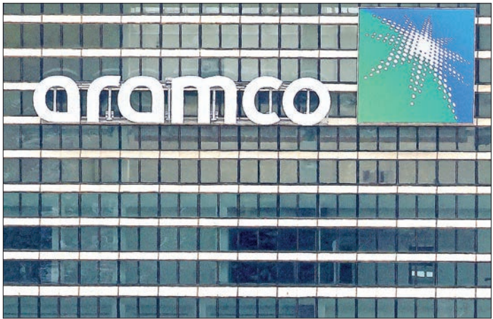
(FILES) The logo of the Saudi Arabian Oil Company (Saudi Aramco) is pictured atop the Aramco tower at the King Abdullah Financial District (KAFD) in Riyadh on 16 April 2023

"Market fundamentals remain strong and we anticipate oil demand in the second half of 2025 to be more than two million barrels per day higher than the first half," he said in the report. — AFP