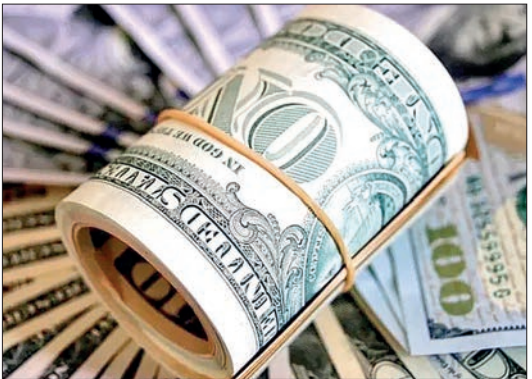
Greenbacks are seen at the exchange counter.

THE Central Bank of Myanmar (CBM) announced on 4 August that it would sell 10 million yuan and 50 million baht to importers. CBM also sold over $1.08 million to edible oil importing companies and $620,200 to fuel oil importing companies on that day. CBM also pumped over $1.04 million into edible oil-importing companies and over $434,400 into fuel oil-importing companies on 1 August. CBM sold $36.5 million purchased from companies working on a Cut, Make and Pack basis, in addition to an injection of $8.8 million, 13.3 million baht, 10.5 million yuan and 500,000 rupees in July. Furthermore, CBM sold over $2.3 million to other commodities-importing companies as per its initial announcement of selling $10 million. CBM sold $8.4 million, 13.9 million baht and 5.2 million yuan in June 2025, in addition to an injection of $14.9 million that was purchased from the CMP enterprises into the financial market. CBM aims to curb the instability in the