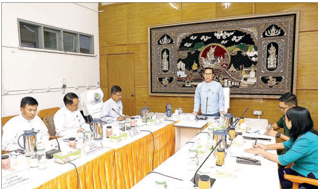
Union Minister U Maung Maung Ohn speaks at the coordinatin meeting on upgrading the Wazra Cinema yesterday.

UNION Minister for Information U Maung Maung Ohn presided over a coordination meeting on upgrading the Wazira Cinema in Nay Pyi Taw yesterday.