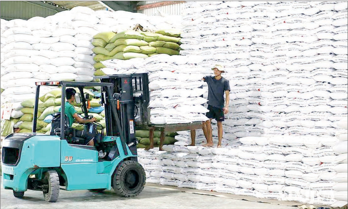
SEE PAGE 7 Workers diligently organizing rice bags for export.

MYANMAR’S rice and broken rice exports reached over 840,000 tonnes in April-July of the current financial year 2025-2026, bagging US$290 million, according to Myanmar Rice Federation (MRF). Myanmar exported over 142,700 tonnes of rice and broken rice worth $52 million in April, over 529,500 tonnes worth $91 million in May, over 212,400 tonnes worth $71 million in June, and 230,671 tonnes valued at $77 million in July. Rice exports mainly depend on sea trade, while only small volumes were exported to neighbouring countries via border points. The federation aims to achieve three million tonnes of rice exports in the current FY. Myanmar bagged over US$1.129 billion from 2.48 million tonnes of rice and broken rice exports in the financial year 2024-2025 (1 April-31 March). The federation projected to export 2.5 million tonnes of rice in the FY 2024-2025, falling short of the target.