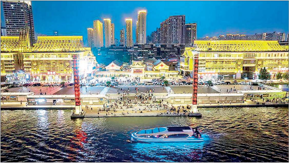
This aerial drone image taken on 3 August 2025 shows an ancient cultural street in north China’s Tianjin Municipality.

has expanded its night economy through upgraded streets, displays of intangible cultural heritage, pop-up art, and immersive cultural experiences.