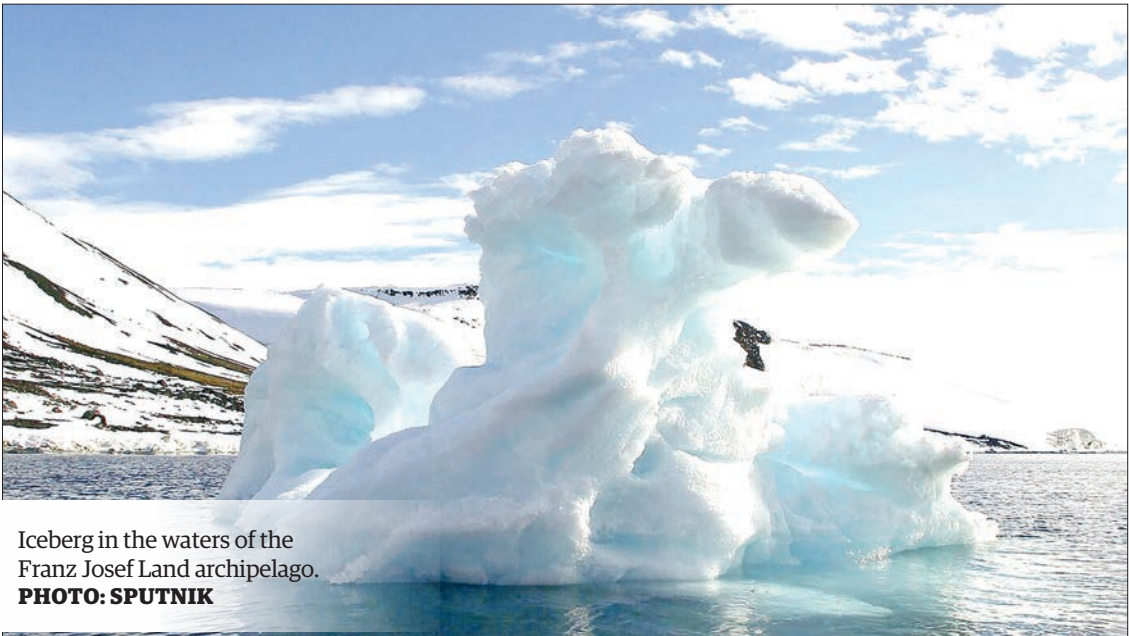
Iceberg in the waters of the Franz Josef Land archipelago.

RUSSIA and the United States can successfully cooperate in the Arctic, Russian Direct Investment Fund (RDIF) CEO Kirill Dmitriev, who is also the Russian president’s special representative for investment and economic cooperation with foreign countries, believes. “Russia and the US can successfully cooperate in the Arctic,” Dmitriev said on X, commenting on an analysis in the Foreign Policy magazine, where the authors, in particular, suggested that the US policy aimed at further isolating Russia could potentially accelerate cooperation between Russia and China