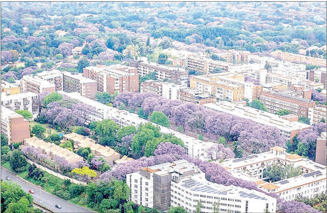
This aerial photo taken on 22 October 2024 shows blooming jacaranda trees in Johannesburg, South Africa.

"South Africa seeks to conclude deals that promote value addition and industrialization, rather than extractive relations that deprive the country of the ability to benefit from our mineral wealth by mimicking extractive colonial era trade relations,"