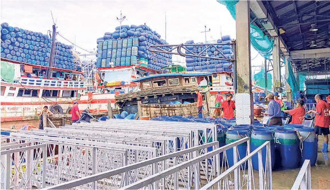
Fishery workers at the port await catches from arriving fishing vessels.

IN the first week of August, the fishing boats carrying various fish from the sea enter the Yangon jetties and the products are stored at the cold storage facilities for foreign export. There are over 500 fishing boats in Yangon, and over 350 capture fish and prawns in the sea. The fishing boats sheltered for one week at the islands while the sea got rough during the stormy period. The fish and prawn captured from 28 July to date arrive at 10 jetties in Yangon. “Currently, there are over 350 fishing boats from Yangon in the sea, and they return to normal condition. The fishing boats enter the jetty daily. The consumption of freshwater for the entry of saltwater products is a supportive action for the local marine product security. Then, it earns foreign income from the