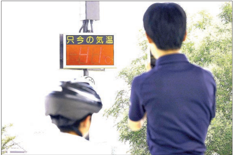
A temperature display board in Isesaki, Gunma Prefecture, shows a 41 C reading on 5 August 2025.

wards a low-pressure system moving east near the country’s northernmost main island of Hokkaido. The Kanto region, covering Tokyo and surrounding prefectures, was also likely affected by warm winds blowing down from mountains in a phenomenon called Foehn winds, the weather agency said. Temperatures exceeded 40 C in around 10 locations in Kanto, itself a record number. The agency and the Environment Ministry have issued heatstroke alerts for 44 of Japan’s 47 prefectures, the most since the 2021 introduction of the national system. — Kyodo