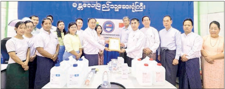
Members of the Myanmar-China Friendship Association donating medicines and supplies to the Mandalay General Hospital.