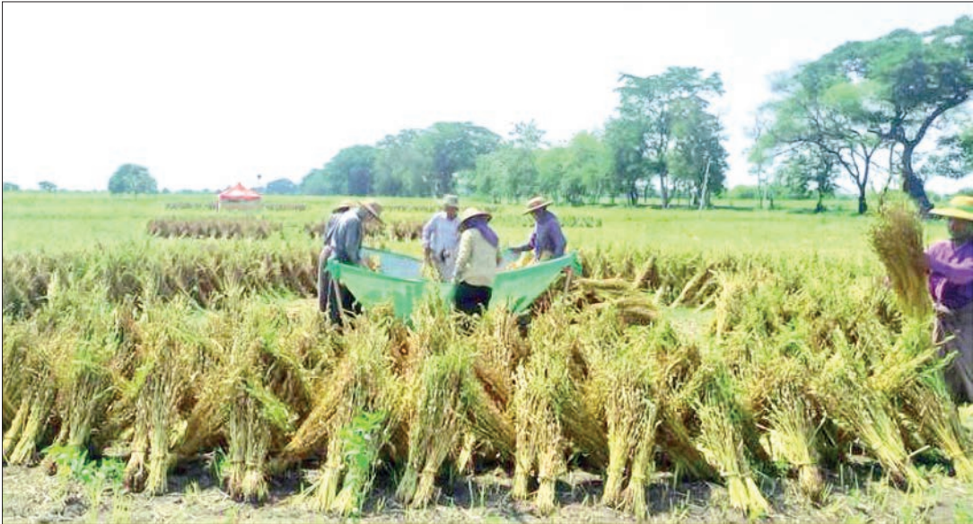
This photo features a collaborative sale of sesame and peanuts grown under the Good Agricultural Practices (GAP) system.

said U Han Nyunt, chairman of the Magway Region Farmers Development Association. As agricultural products continue to fetch good market prices, farmers in the Magway Region are showing increasing interest in adopting GAP practices each year. As a result, the number of farmers growing under the GAP system is steadily rising. — ASH/TH