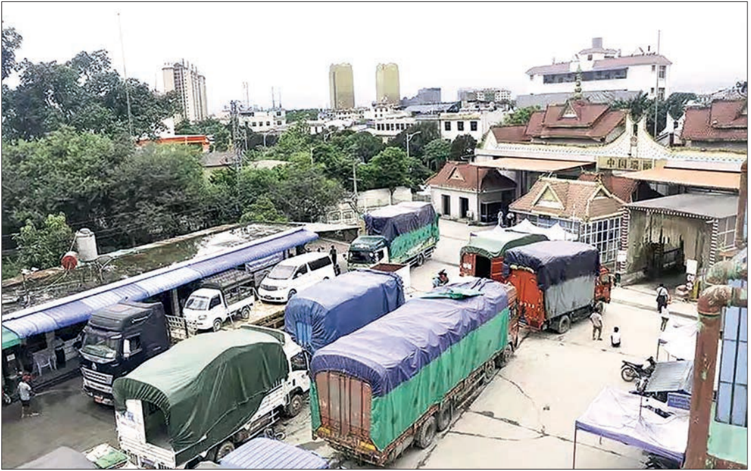
Export and import lorries await crossing at the Myanmar-China border.

The people are urged to receive vaccination of COVID-19 without fail as full-time vaccination of COVID-19 and receiving booster shots can effectively mitigate infection of the virus, severe suffering from the disease and increase of death rate due to the disease.