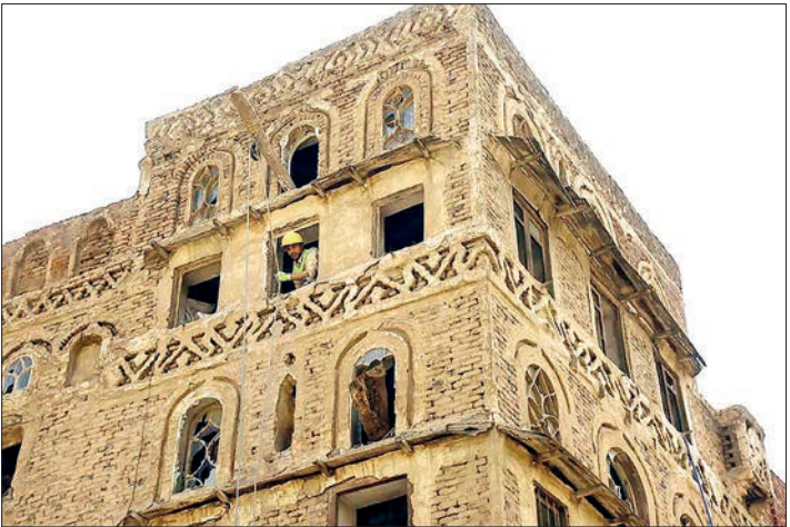
A man works on restoration of old buildings in the Old City of Sanaa, Yemen, 30 July 2025.

residents in Yemen perish in extreme weather-triggered collapses. For example, severe flooding hitting several provinces of Yemen since mid-July 2024 left over 150 people dead and thousands more displaced as of September last year. — Xinhua