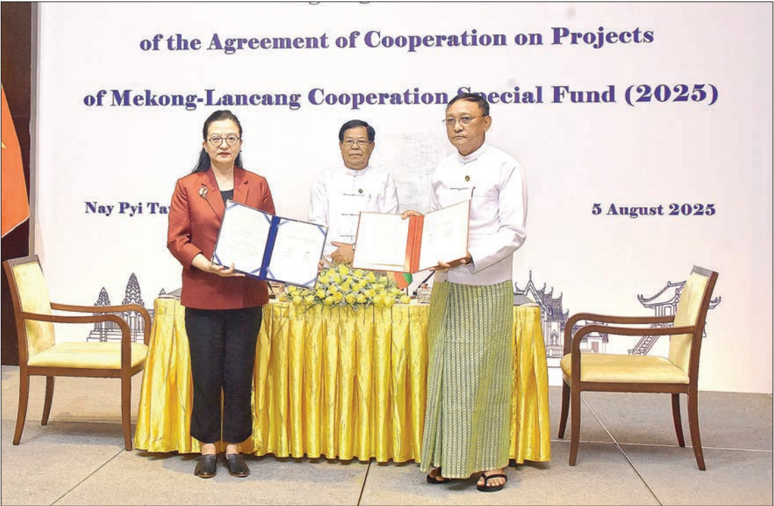
The exchange of the cooperation agreement on the projects of the Mekong-Lancang Cooperation Special Fund (2025) in progress in the presence of Union Minister U Than Swe.

THE signing ceremony of the Agreement of Cooperation on Projects of the Mekong-Lancang Cooperation Special Fund (2025) was held yesterday morning at the Parkroyal Hotel, Nay Pyi Taw. Union Minister for Transport and Communications U Mya Tun Oo, Union Minister for Foreign Affairs U Than Swe, Union Minister for Legal Affairs and Union Attorney-General Dr Thida Oo, Union Minister for Religious Affairs and Culture U Tin Oo Lwin, Union Minister for Agriculture, Livestock and Irrigation U Min Naung, Union Minister for Natural Resources and Environmental Conservation U Khin Maung Yi, Union Minister for Industry Dr Charlie Than, Union Minister for Education Dr Chaw Chaw Sein, Union Minister for Science and Technology Dr Myo Thein