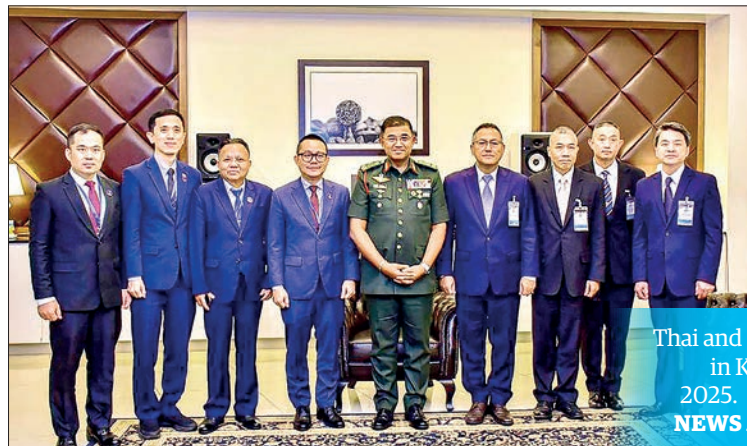
Thai and Cambodian officials pose for photos in Kuala Lumpur, Malaysia on 4 August 2025.

Plastic pollution is so ubiquitous that microplastics have been found on the highest mountain peaks, in the deepest ocean trench and scattered throughout almost every part of the human body. — AFP