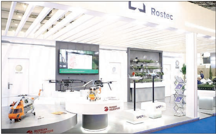
A view shows the Rostec Corporation’s stand during the World Defence Show exhibition, in Riyadh, Saudi Arabia. PHOTO: SPUTNIK

in the Arctic. According to the publication, in order to protect the long-term influence of the United States in the region and combat the growing influence of China there, the administration of US President Donald Trump is more effective in pursuing a strategy of “selective cooperation” with Moscow. The authors also pointed out that, in the long term, the Arctic remains one of the few areas where “strategic ambiguity is not a weakness”. They note that it is an increasingly critical region “where diplomacy and deterrence can and do coexist”. — SPUTNIK