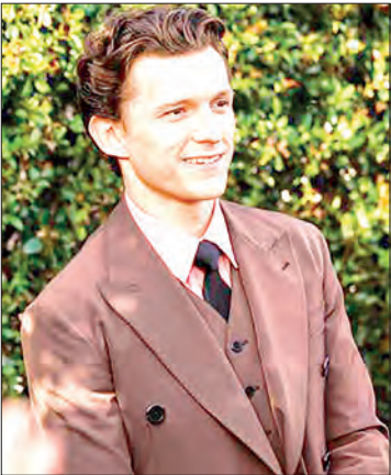
The Hollywood star has recently addressed rumors regarding his potential casting in the James Bond franchise.

The actor has been on a busy slate lately, with back-to-back films including Marvel's 'Spider-Man: Brand New Day' and 'Christopher Nolan's 'The