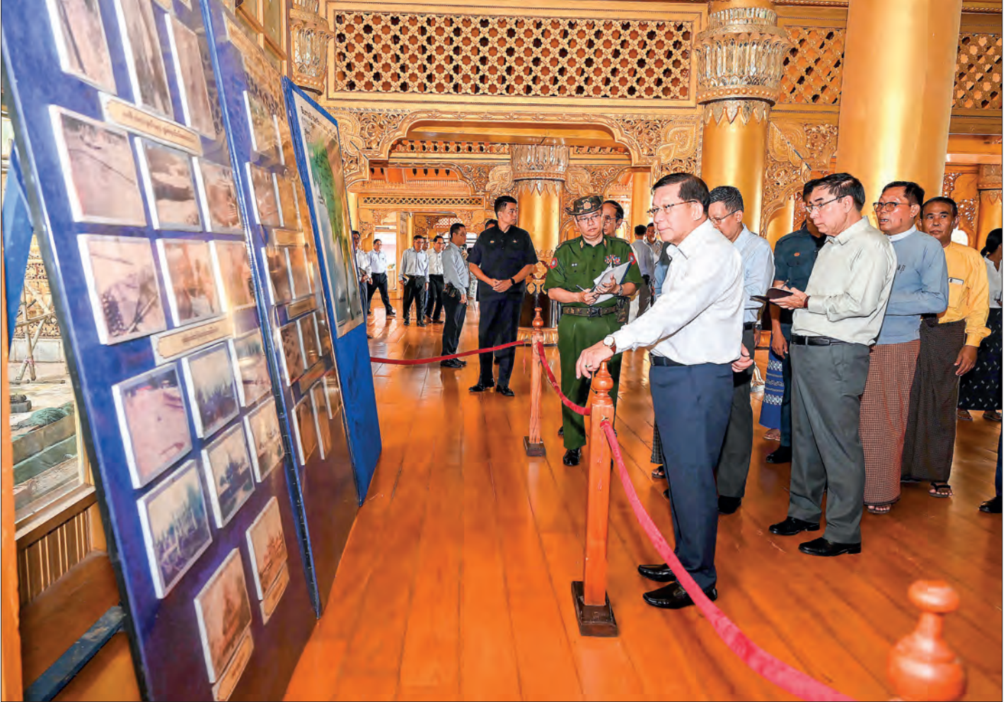
State Security and Peace Commission Chairman of the Republic of the Union of Myanmar Senior General Min Aung Hlaing inspects documentary photos displayed at the Kanbawzathadi Palace in Bago yesterday.