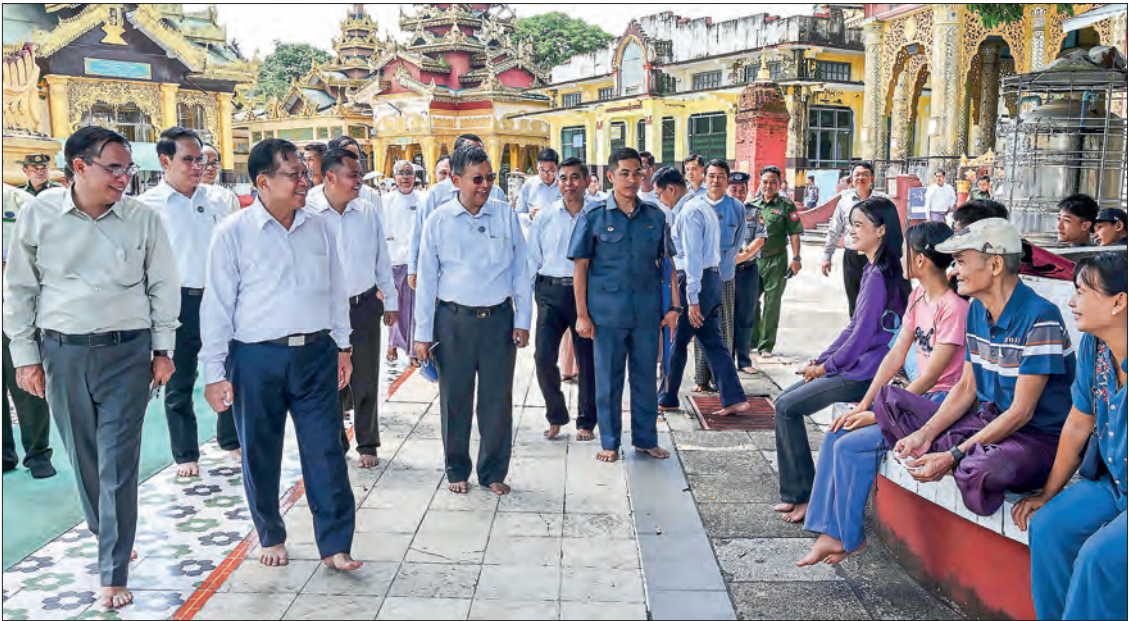
Senior General Min Aung Hlaing warmly greets pilgrims at Hsutaungpyae Shwemawdaw Pagoda in Bago yesterday.

be placed on the platform of the pagoda for convenience of pilgrims. In so doing, the platform must be placed with systematic drainage facilities. And, officials were urged to supervise the work process to be completed as quickly as possible. The Senior