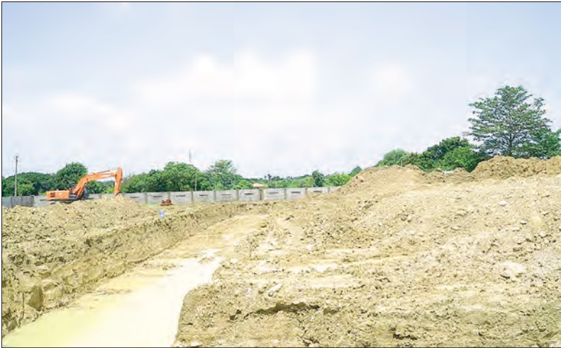
Union Minister for Industry Dr Charlie Than looks into the construction site of a plant for assembling and manufacturing solar panel and related equipment in Nay Pyi Taw yesterday.

During the inspection, the Union minister stated that the ministry will closely supervise the installation work to ensure it is completed on time, systematically, and in line with current needs, while the company must prepare checklists to support timely project completion and strive to make its products competitive in both price and quality with similar imported goods. He also stated that the State is