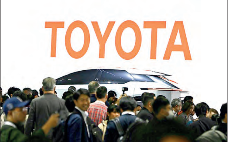
Toyota's global production topped 10 million units for the first time in 2023, reaching 10.03 million.

TOYOTA Motor Corp. has revised upward its global production plan for 2025 to around 10 million vehicles, which would mark the first time in two years it has reached that level, sources close to the matter said Saturday. The automaker initially set an annual global production target of 9.9 million units due to the uncertainty over higher US tariffs, but sales of its cars