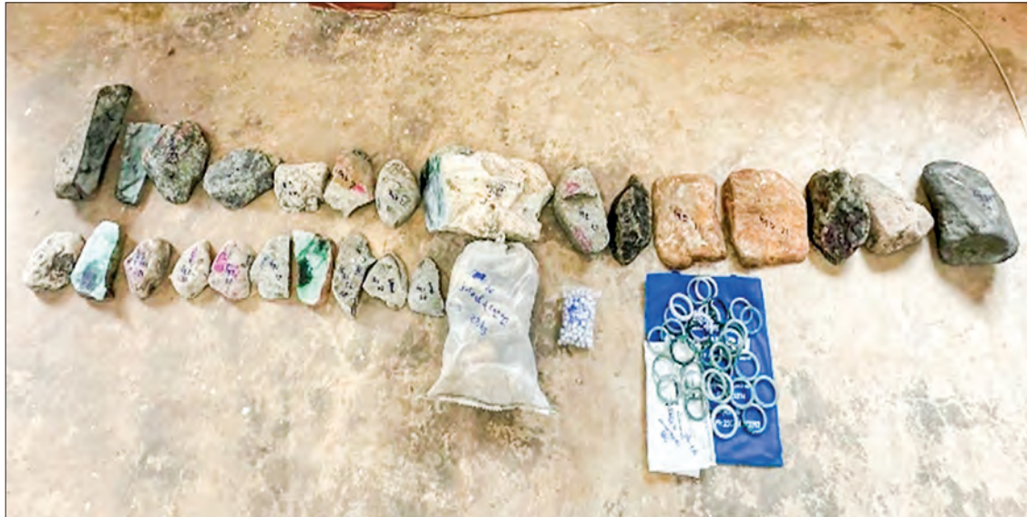
Photo shows confiscated pieces of stone believed to be jade and five kinds of stone being cut without legal documentation.

Acting under the coordination of the Kayin State Illegal Trade Eradication Task Force, a combined team conducted inspections near Thayakon Village in Hpa-an Township on 1 August. During the operation, five trucks were found stationary, loaded with 14 types of industrial goods and seven types of consumer goods without valid