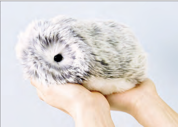
Photo shows Casio Computer Co.’s AI robot pet Moflin.

“Development began with women as our target audience. We imagined a sidekick that could provide