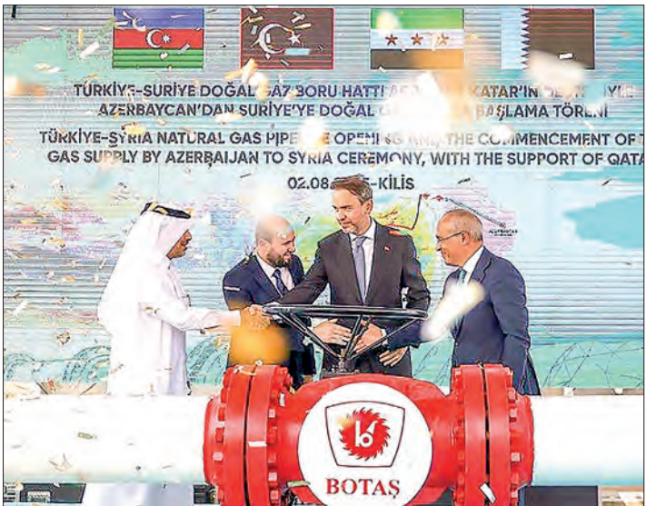
The ceremony was attended by Turkish, Syrian, Azerbaijani and Qatari officials.

TÜRKIYE on Saturday turned on a supply of natural gas from Azerbaijan to Syria, whose infrastructure was ravaged by civil war, with annual deliveries expected to reach up to two billion cubic metres. Syria's Islamist authorities, who toppled Bashar al-Asad in December, are seeking