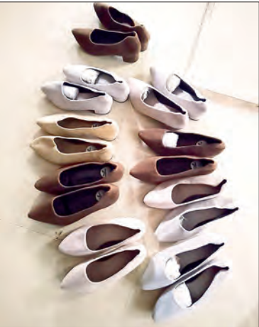
Greater club-rush ( Scirpus grossus ), a product made from greater club-rush and shoes made from banana hemp.