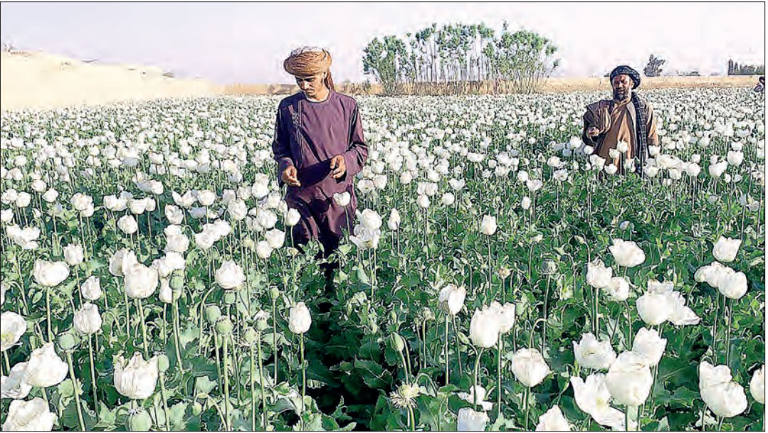
The Afghan interim government has banned the cultivation of poppy and the trafficking of narcotics as part of a broader initiative to eliminate drug abuse and its impact on society.

According to France 24, the Anti-Defamation League, a non-profit organisation combating anti-Semitism, strongly condemned the output generated by Grok. "What we are seeing from Grok LLM right now is irresponsible, dangerous and anti-Semitic, plain and simple. This supercharging of extremist rhetoric will only amplify and encourage the antisemitism that is already surging on X and many other platforms," the ADL stated on X. — ANI