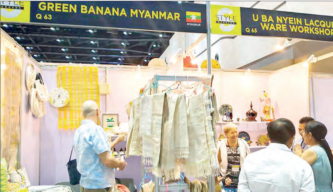
People observe the value-added products displayed at the Myanmar booths at 2025 Style Bangkok in Bangkok, Thailand.

GREEN Banana Myanmar, an entrepreneurial venture, will produce high-value consumer goods from greater club-rush ( Scirpus grossus ), a species of weeds, and showcase them at ASEAN and international trade fairs, as the country continues to promote MSMEs and entrepreneurship, according to the Myanmar-based company.