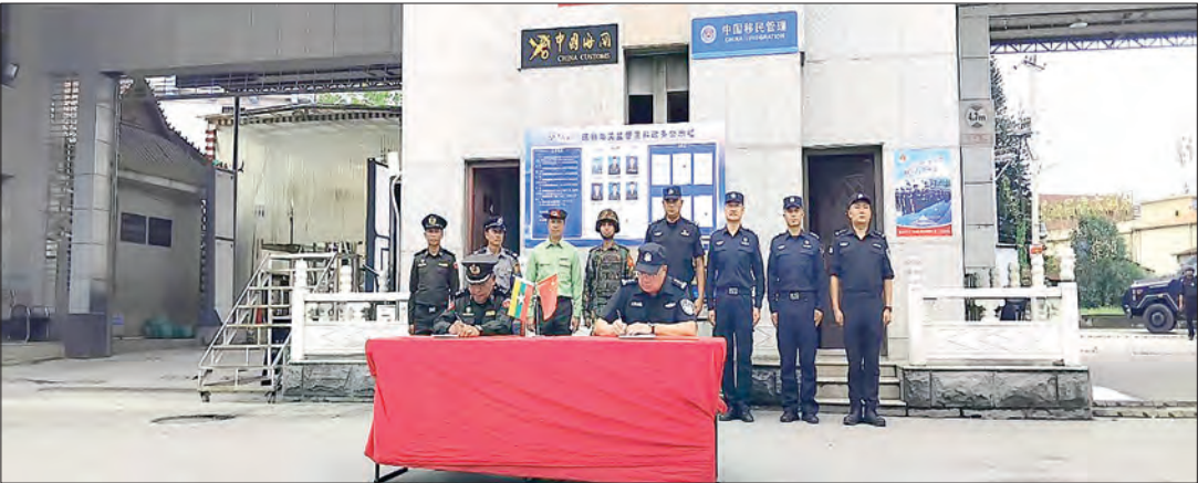
Officials from Tatmadaw and Myanmar Police Forces and officials from Ministry of Public Security of China are seen at the hand over event of Chinese nationals operating online telecom fraud at the Mang Wein border check point on 31 July.

ufacturing plant, launched on 25 July, is expected to begin production in January 2026, and it will assemble and produce high-quality solar panels, inverters, batteries, and PV brackets upon completion. — MNA/TH