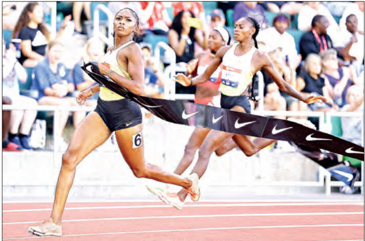
Melissa Jefferson-Wooden blasts to 100m victory in a world-leading time at the US track and field championships.

like this, and it's finally starting to come true," Jefferson-Wooden told reporters, adding that she was still pinching herself at vaulting up the all-time 100m list. — AFP