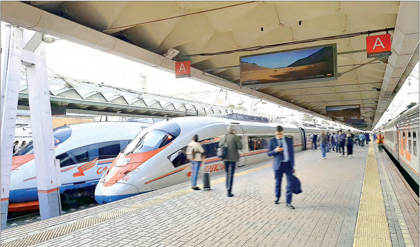
Russian President Vladimir Putin highlighted the significance of high-speed railway projects in meeting public demand and bolstering Russia’s economy.

The first high-speed rail project, connecting Moscow and St Petersburg, is expected to be completed by 2028, reducing travel time to just 2 hours and 15 minutes.