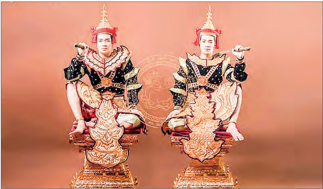
A picture depicting the dress style of the two Taungbyone princes.