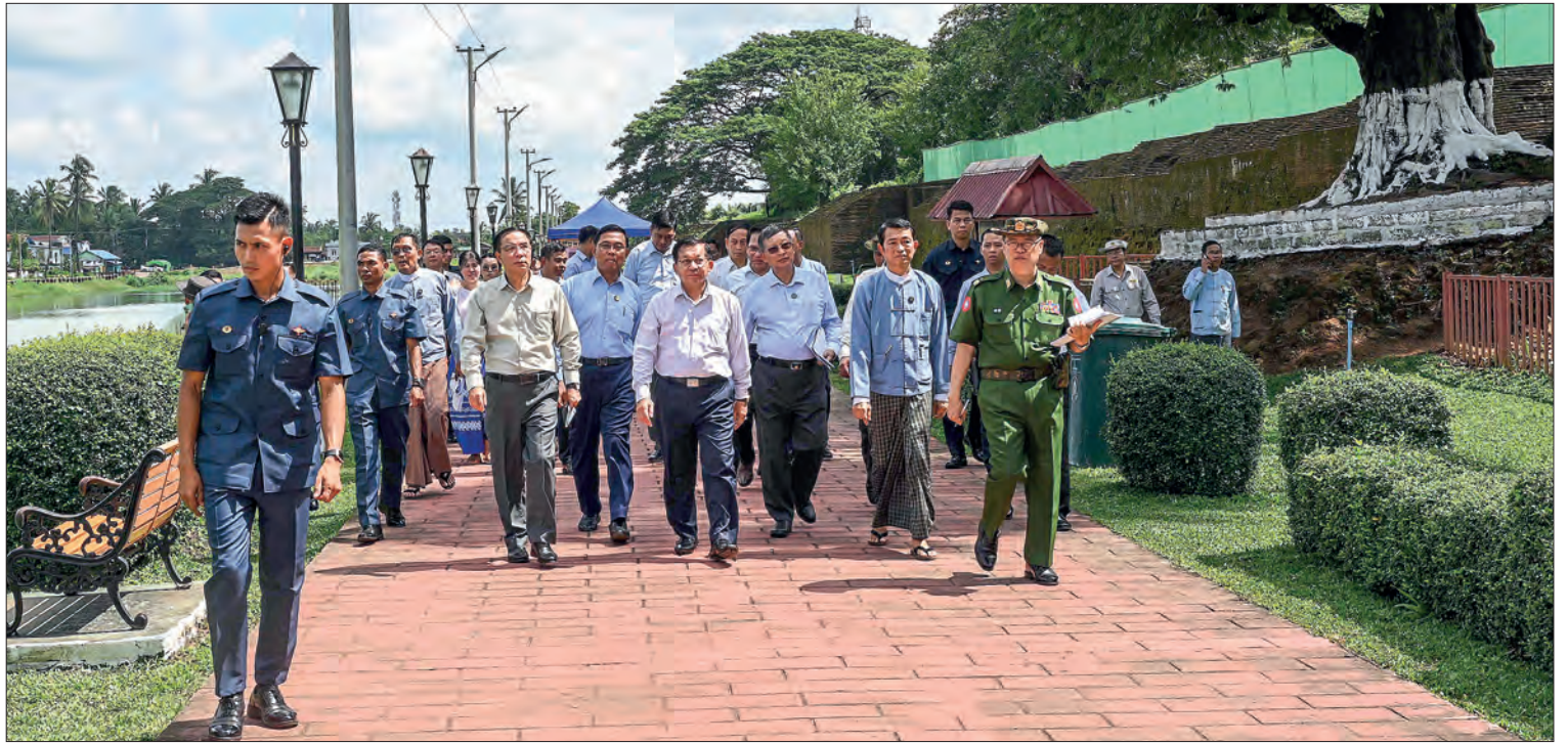
Senior General Min Aung Hlaing inspects the moat, the walls and the gates of Hanthawady Ancient City during his tour in Bago Region yesterday.

He continued that it is necessary to preserve and showcase the traditions, customs, fine arts, grand royal palaces, and the widespread influence of ancient Myanmar kings, which reflect the nation's heritage, religion,