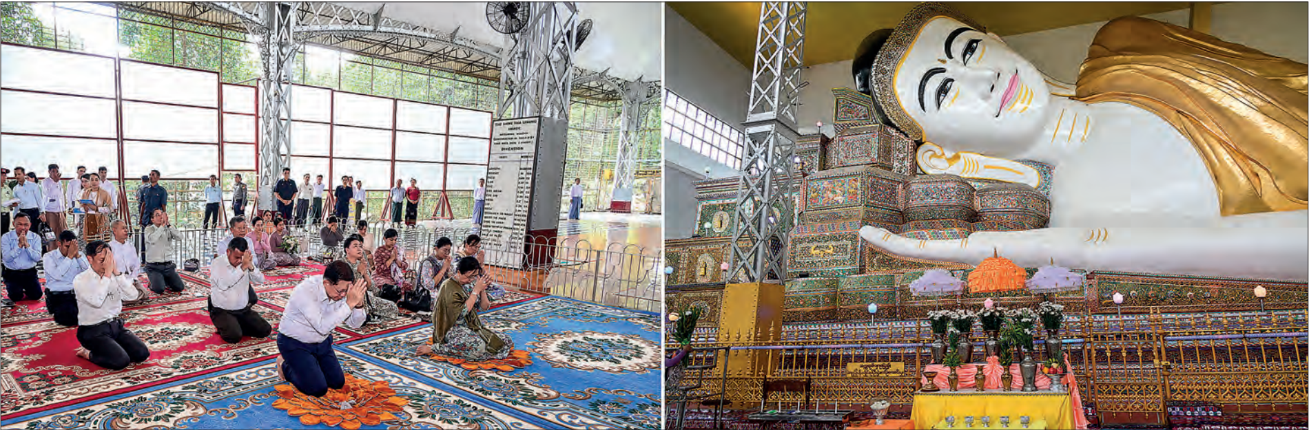
State Security and Peace Commission Chairman of the Republic of the Union of Myanmar Senior General Min Aung Hlaing and his wife Daw Kyu Kyu Hla pay homage to Shwethalyaung reclining Buddha image in Bago yesterday.

(An excerpt from guidance given by Chairman of the State Administration Council, Prime Minister Senior General Min Aung Hlaing to Shan State cabinet members and state-level departmental officials on 3 September 2024)