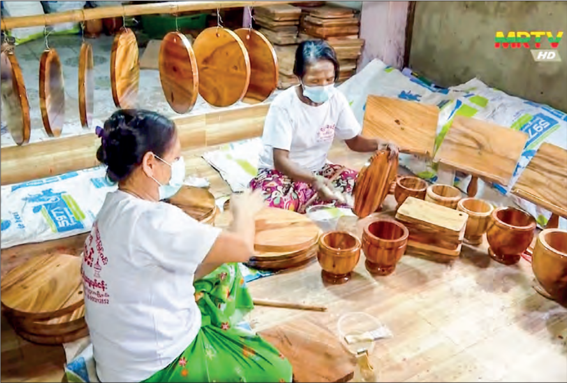
Some Myanmar traditional items made by turnery art.