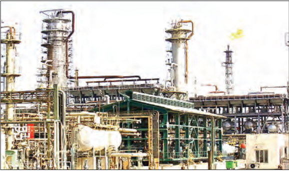
The group of eight oil-producing countries, referred to as the “Voluntary Eight” (V8), is planning this output increase as part of a series of hikes that began in April. PHOTO: AFP/FILE

Analysts expect the V8 group — namely Saudi Arabia, Russia, Iraq, United Arab Emirates, Kuwait, Kazakhstan, Algeria and Oman — to agree on another output increase of 548,000 bpd for September, a target similar to the one approved in August. — AFP