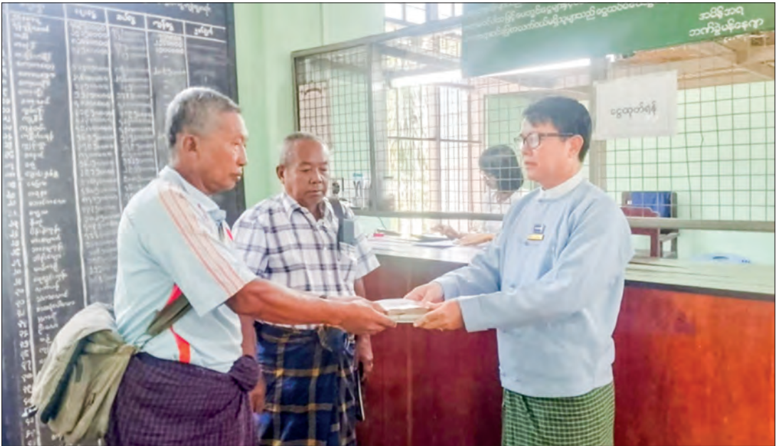
An official of MADB branch in Kyaikmaraw Township of Mon State presents 2025 monsoon agricultural loans to farmers on 19 May.

THE Myanmar Agricultural Development Bank stated that more than K208 billion loans are being disbursed to over 200,000 farmers from regions and states across the nation in 2025-26 financial years. Reportedly, monsoon crop cultivation loans for 2025 are already being disbursed starting from 19 May 2025 through relevant district and township bank branches of MADB. These