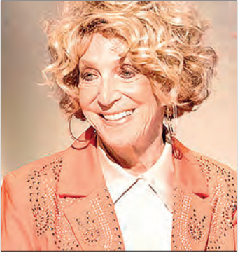
In 1967, Seely became a member of the Grand Ole Opry.

member of the Grand Ole Opry. She was the first woman to regularly host and emcee segments on the Opry stage. She performed there more than 5,000 times, and also became one of the most frequent performers in its history.