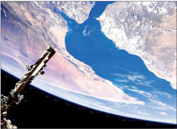
The ISS frequently encounters small meteorites, but it is mostly shielded from this threat.

JAPAN will seek to establish international rules for the removal of human-made objects in space that could pose collision risks to satellites and the International Space Station if left in orbit, according to officials.