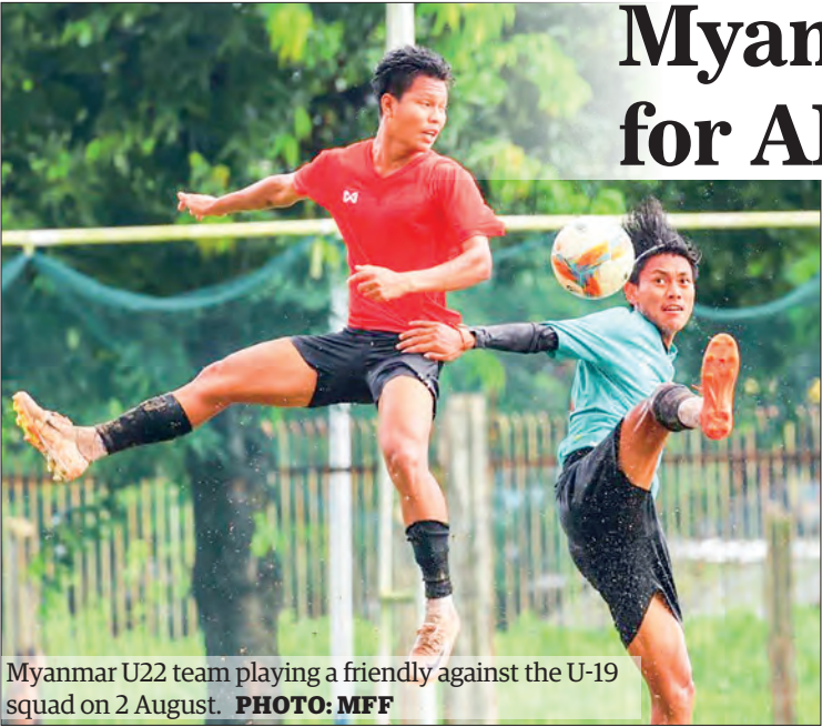
Myanmar U22 team playing a friendly against the U-19 squad on 2 August.

THE Myanmar U22 national football team resumed training on 2 August in preparation for upcoming international tournaments scheduled for later this year. Following their participation in the 2025 ASEAN U23 Championship held in Indonesia from 15 to 29 July, the team took a short break before regrouping. They are now preparing for the 2026 AFC U23 Asian