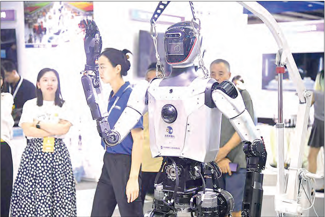
A humanoid robot is pictured during the World Robot Conference 2024 in Beijing, capital of China, 21 August 2024.

MORE than 100 cutting-edge robotics products will make their debuts at the upcoming 2025 World Robot Conference in Beijing, nearly twice as many as last year, highlighting the conference’s growing role as a global stage for innovation. Set to take place from 8 to 12 August in Beijing Economic-Technological Development Area, also known as Beijing E-Town, the 2025 edition of the conference will be held under the theme “Making Robots Smarter; Making Embodied Agents More Intelligent.” The event will showcase over 1,500 exhibits from more than 200 leading robotics companies from around the world. A key feature will be the debut of cutting-edge products, ranging from agile quadruped robots, rescue robots, and inspection robots to novel catheter-shaping robots and robotic lawn mowers, offering attendees a glimpse into the future of intelligent machines. Humanoid robots remain a major attraction of the conference, with 50 manufacturers of full-body humanoid robots showcasing their latest innovations. In 2024, China accounted for two-thirds of global robot patent applications and produced 556,000 industrial robots, remaining the world’s top manufacturer. Over the past decade, the number of international supporting institutions at the conference has grown from 12 to 28, while overseas participants have increased from just over 10 to more than 80, according to Xu Xiaolan, president of the Chinese Institute of Electronics. — Xinhua