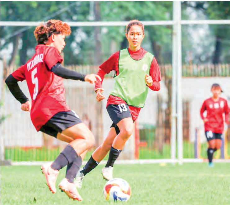
The Myanmar women's national team during training.

The team returned to Yangon on 1 August and completed final preparations on 2 and 3 August. A 23-player squad will depart for Vietnam on 4 August. Eight teams will compete in the tournament. Myanmar is in Group B alongside the Philippines, Australia U23, and Timor-Leste. Group A includes Vietnam, Thailand, Indonesia, and Cambodia. Myanmar will face Australia U23 on 7 August, Timor-Leste on 10 August, and the Philippines on 13 August during the group stage. — Shine Htet Zaw/KZL