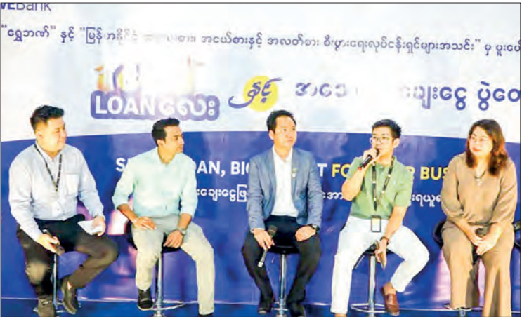
The Microfinance festival is held on 1 August.

Lay aims for micro and small businesses, and the loan quantum is from K10million to K50 million with an annual interest rate of 14.5 per cent or 15 per cent. MSME loan aims for SMEs and interest rate is from three to five per cent, depending on business size, with a maximum loan quantum K100 million. At the microfinance festival, MSME seminar and booths of SME products were included. — Htun Htun/ZS