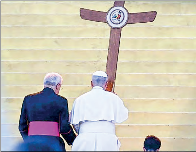
The pope took to the stage carrying a large wood cross.