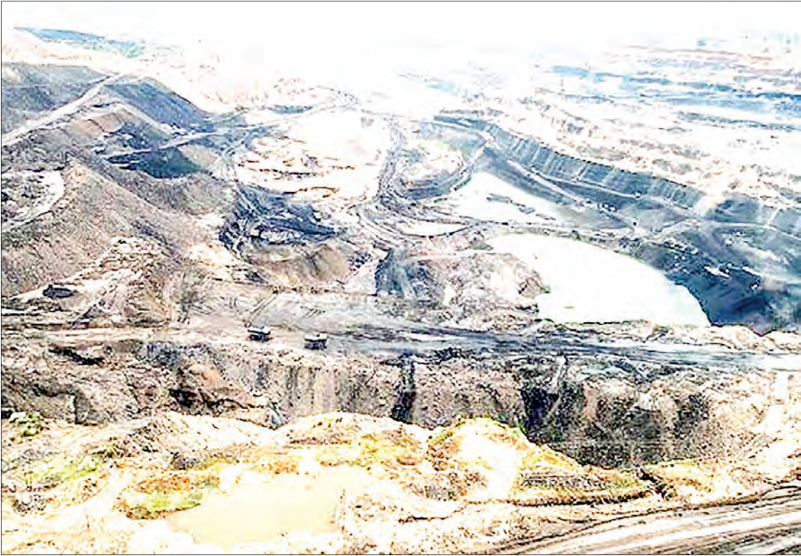
The auctions aim to address the nation's energy demands, promote economic stability, and create employment opportunities.

This initiative is part of the Ministry of Coal's strategy to transform the coal sector into a key driver of economic growth.