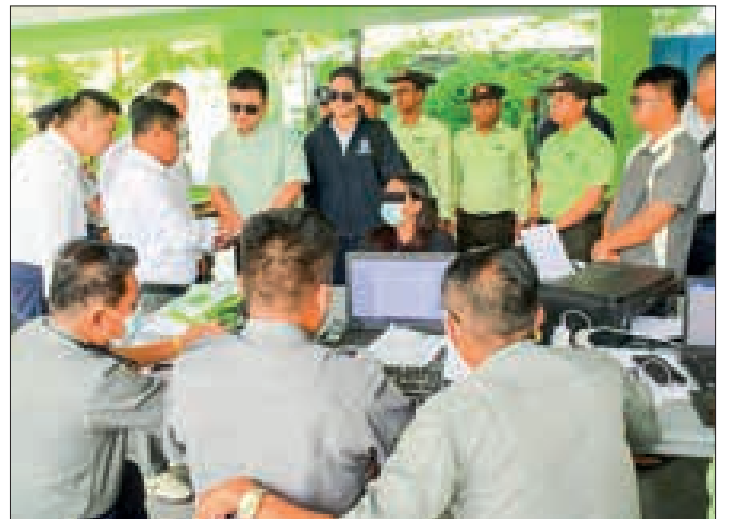
Immigration process is underway for the deportation of the undocumented Chinese entrant.

Between 30 January and 7 July 2025, a total of 9,199 illegal immigrants were identified and detained in Myanmar. Of this number, 8,987 individuals have already been deported through Thailand