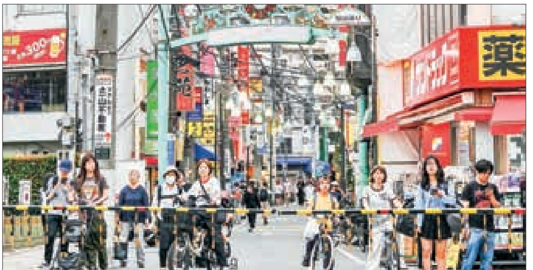
This photo taken on 8 June 2025 shows people waiting at a level crossing for a train to pass by, along a shopping street at the Nakano ward of Tokyo. PHOTO: AFP

The leading index of business conditions, which forecasts the situation in the coming months, rose 1.1 points to 105.3, up for the first time in four months. — Kyodo