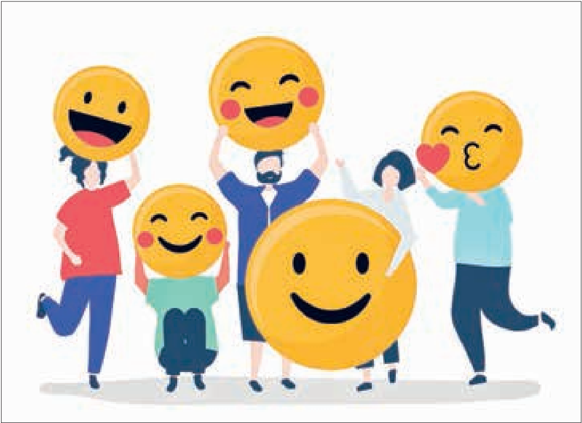
Individuals must carry smiles in their relationships to build a happy society daily.

A smile is a natural and deeply valuable human behaviour that belongs to everyone. For exam-