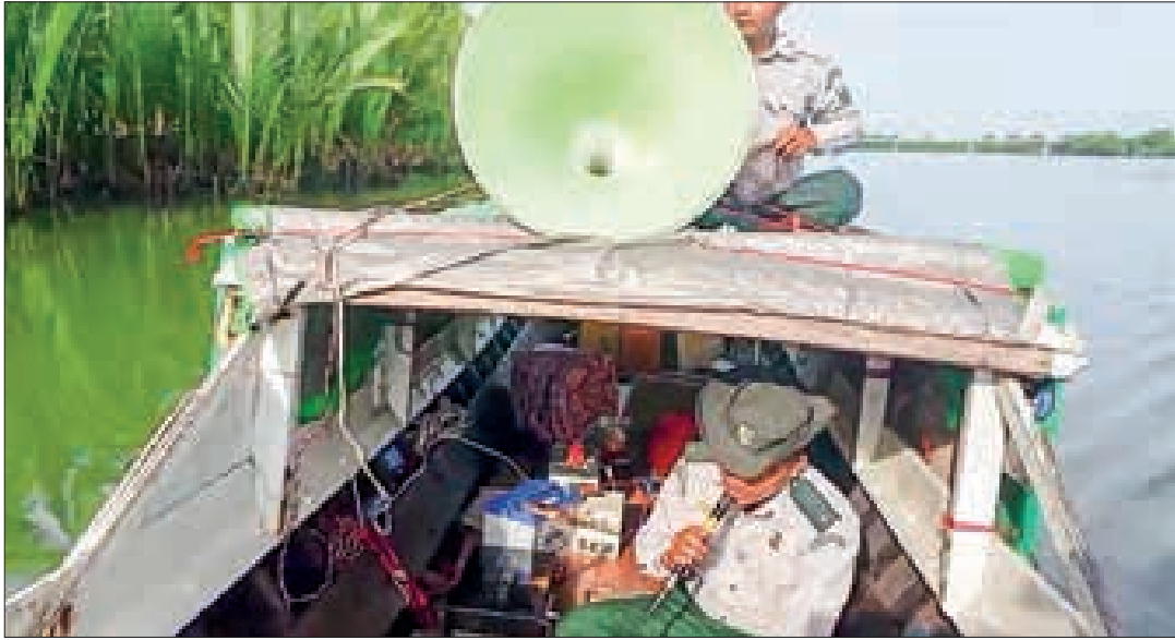
Officials announce crocodile danger alert near Meinmahla Kyun Wildlife Sanctuary.