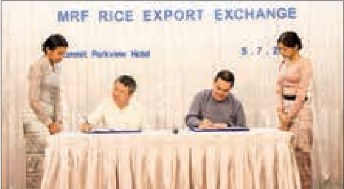
This picture shows a signing ceremony for the MRF Rice Export Exchange.

THE Myanmar Rice Federation (MRF) and 17 solar companies signed a memorandum of understanding (MoU) to utilize solar-powered energy in rice mills designated for exports.