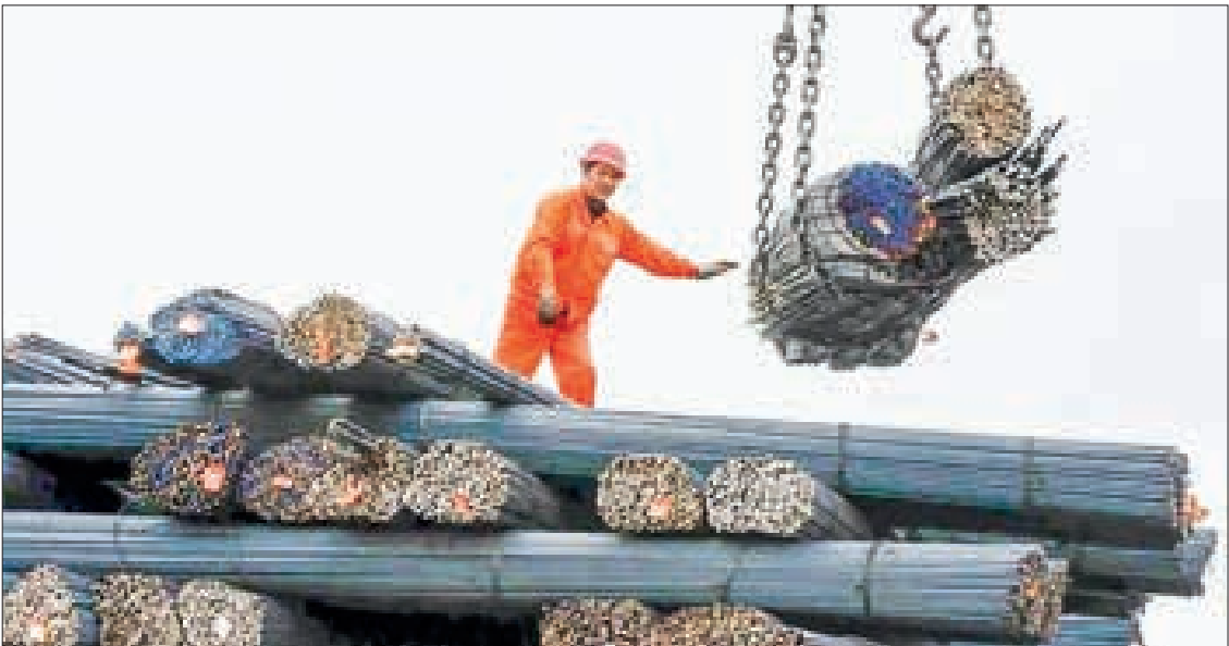
This photo shows a worker unloading rebars that are being imported.

THE Ministry of Industry will set up a new laboratory equipped to conduct conformity test activities on imported iron and steel. In order to perform tests and analysis on domestically produced and imported iron and steel according to established standards, samples of deformed bars (rebar) utilized in the country will be tested. The Ministry of Industry has also discussed with representatives of the Myanmar Iron and Steel Association to draft an iron and steel policy roadmap. Furthermore, efforts to set three common methods of testing iron and steel materials for local manufacturers and importers are underway. A certified laboratory will be set up in order to