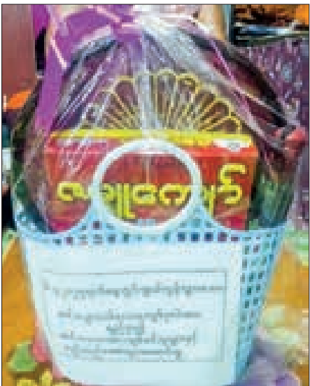
This image reveals donated items offered to monks in dedication to the dead little elephant.

surgery for his age and endurance. We had a consultation with international experts to help him fully recover, though we had to acknowledge that we couldn't, but chose to give priority to relieve his pain," said the camp. Due to the autopsy result, the