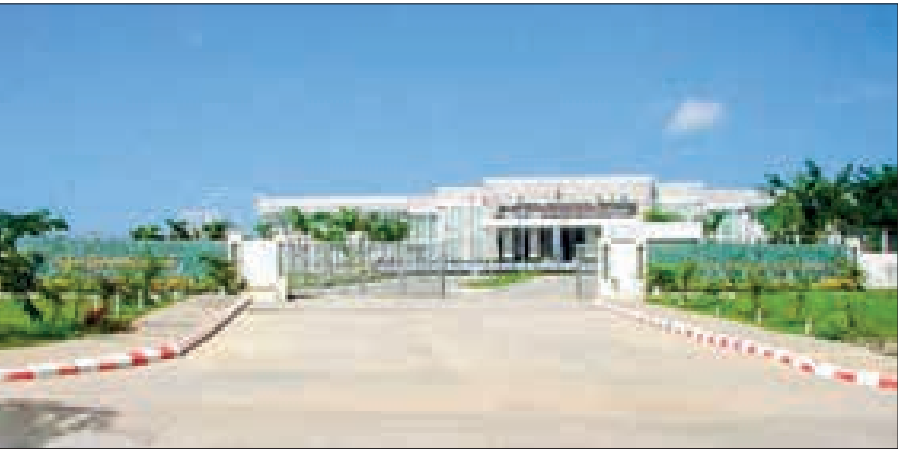
The facade of the Central Bank of Myanmar (CBM) in Nay Pyi Taw.

THE Central Bank of Myanmar (CBM) sold US$8.4 million, 13.9 million baht and 5.2 million yuan in June 2025, in addition to an injection of $14.9 million that was purchased from the CMP enterprises into the financial market.