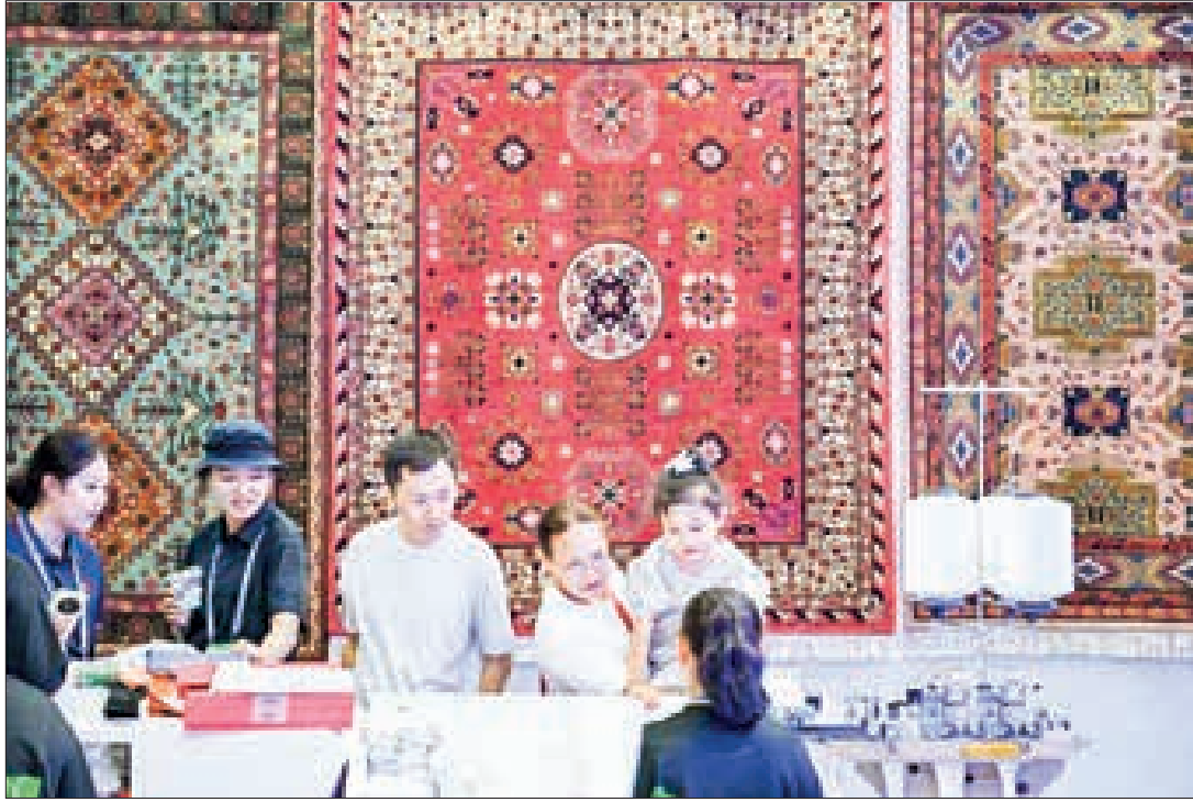
Visitors learn about the products of a local textile company during the 2025 (China) Eurasia Commodity and Trade Expo in Urumqi, northwest China's Xinjiang Uygur Autonomous Region, 26 June 2025.

CHINA'S textile industry posted stable growth in the first four months of the year, official data showed Monday.