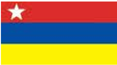
Flag of the Zomi National Party.