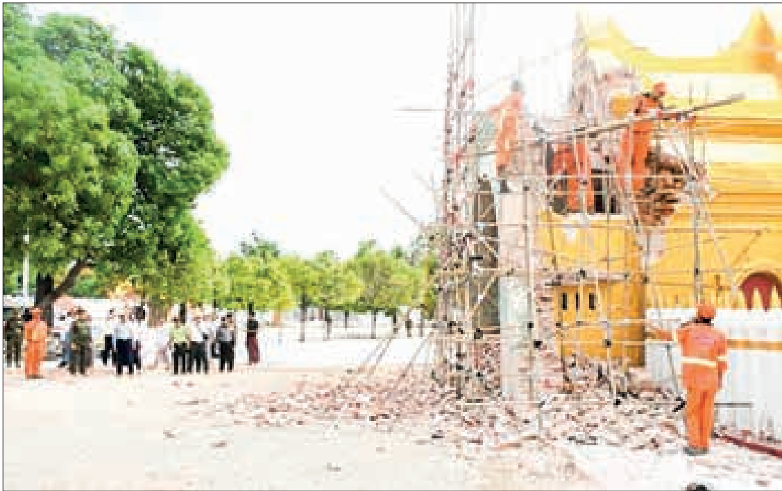
Lt-Gen Thet Pon and officials are pictured during their inspection of religious sites in Sagaing.

COORDINATED rehabilitation efforts involving various organizations and local communities continue at full strength across the affected regions, following the powerful Mandalay earthquake that caused widespread destruction.