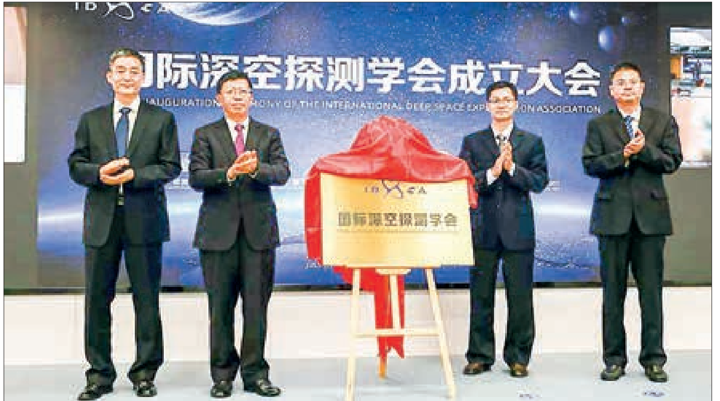
Guests unveil the plaque of the International Deep Space Exploration Association during the inauguration ceremony of the association in Hefei, east China's Anhui Province, 7 July 2025.