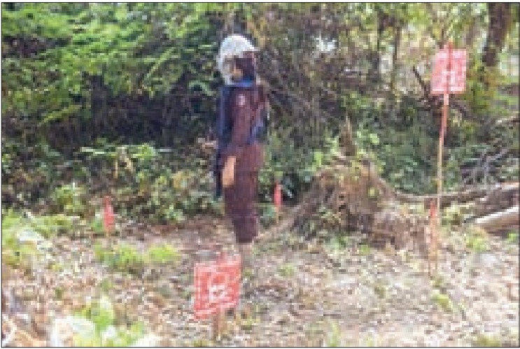
A deminer searches for mines and unexploded ordnance at a minefield in Siem Reap province, Cambodia, 16 January 2024.

Chaker said that over the past 20 years, Cambodia has made remarkable progress in strengthening mine action management, developing policies, legal frameworks, standards, and information systems for land clearance and release, raising