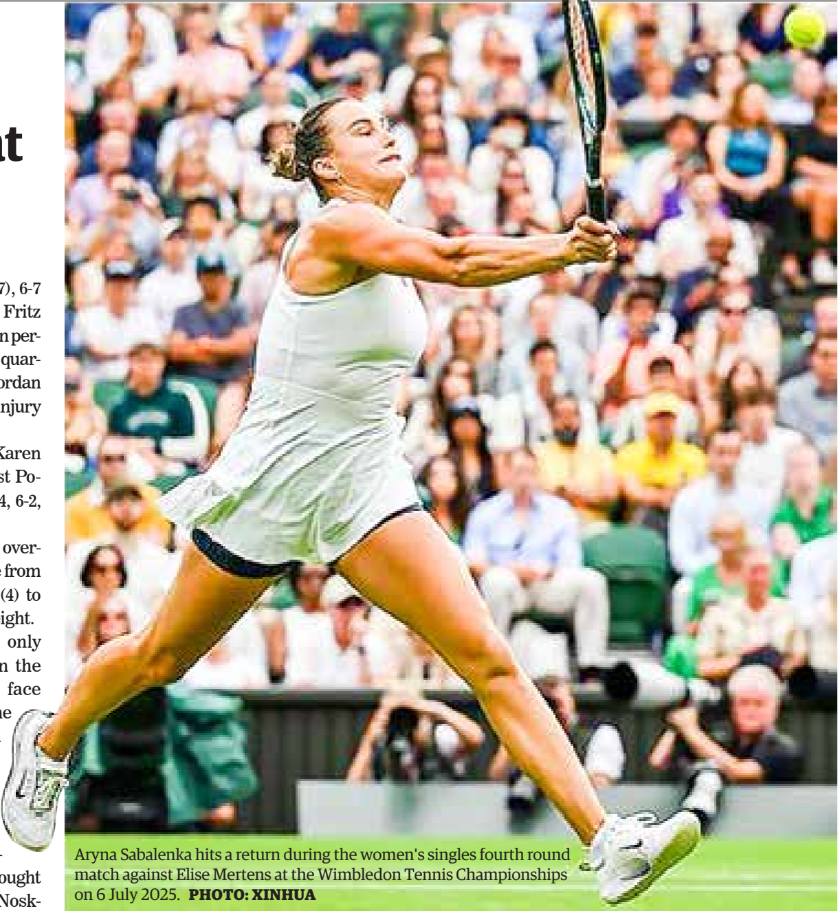
Aryna Sabalenka hits a return during the women's singles fourth round match against Elise Mertens at the Wimbledon Tennis Championships on 6 July 2025.

American Amanda Anisimova bolstered her title credentials with a hard-fought 6-2, 5-7, 6-4 win over Linda Noskova. — Xinhua