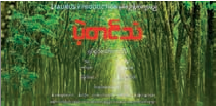
This photo showcases a poster for the film.