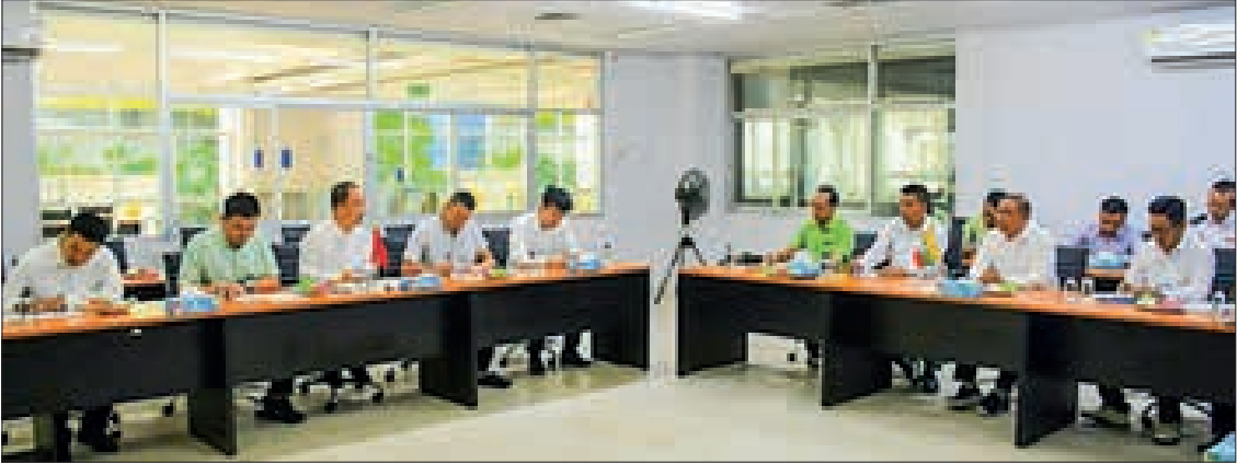
Myanmar, China and Thailand meet on the repatriation of detainees, the preventive system, and further cooperation yesterday in Myawady.