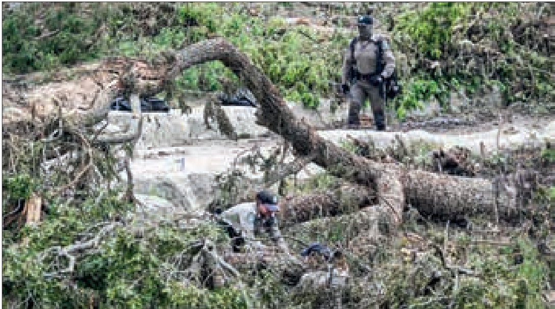
Members of a Texas Game Warden look for missing people on the Guadalupe River in Kerrville, Texas, on 6 July 2025, following severe flash flooding that occurred during the 4 July holiday weekend.

ASEAN (the Association of Southeast Asian Nations) groups Brunei, Cambodia, Indonesia, Laos, Malaysia, Myanmar, the Philippines, Singapore, Thailand, and Vietnam. — Xinhua