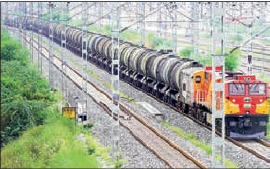
A train transports oil tankers in Ajmer on 7 July 2025. Most Asian markets fell on 7 July as countries fought to hammer out trade deals days before Donald Trump's tariff deadline, though investors took heart after he said the levies would not kick in until the start of next month.

with Trump declaring that an extra 10 per cent import levy would be added to any country "aligning themselves with the Anti-American policies of BRICS" — an 11-member alliance including Brazil, Russia, India and China.