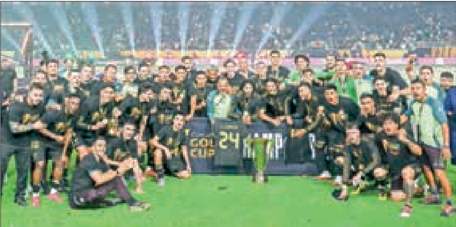
Mexico's players celebrate their victory at the end of the Concacaf Gold Cup final football match between Mexico and USA at NRG Stadium in Houston, Texas on 6 July 2025.

"It's a very emotional moment for me," the West Ham midfielder said afterwards.