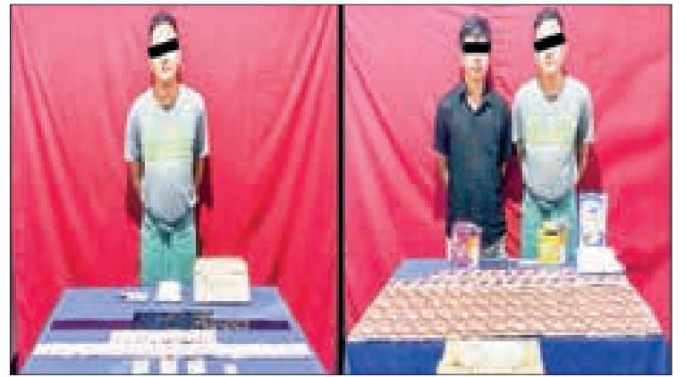
Offenders are seen alongside seized drugs.

Those suspects have been charged under the Narcotic Drugs and Psychotropic Substances Law. — MNA/MKKS