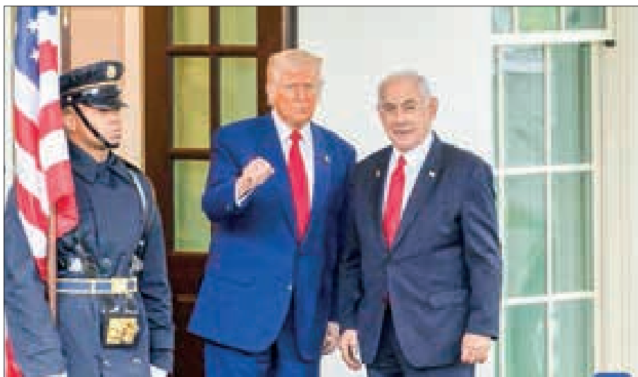
US President Donald Trump (C) welcomes Israeli Prime Minister Benjamin Netanyahu (R) at the White House in Washington, DC, the United States, on 7 April 2025.

Speaking to AFP on condition of anonymity, the official said the delega-