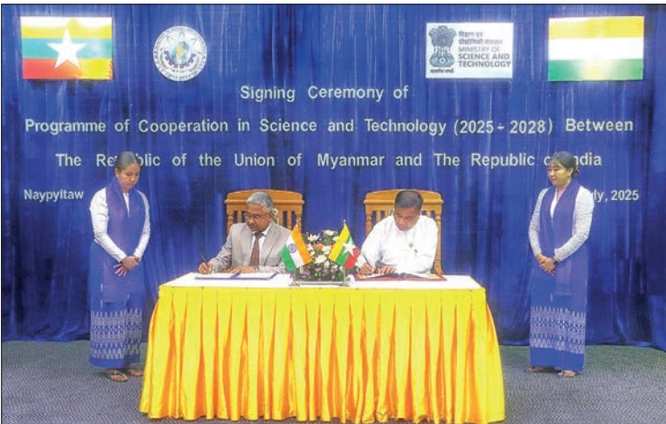
The POC signing event between the Ministry of Science & Technology and India in progress yesterday.

THE Union Minister for Science and Technology and Ambassador of the Republic of India to the Republic of the Union of Myanmar signed a Programme of Cooperation (POC) in Science and Technology yesterday at the Ministry Office in Nay Pyi Taw. Since 2012, POC (2012-2015) and POC (2018-2021) have already signed on behalf of the Republic of the Union of Myanmar and the Republic of India for strengthening cooperation between the two countries in the fields of science and technology.