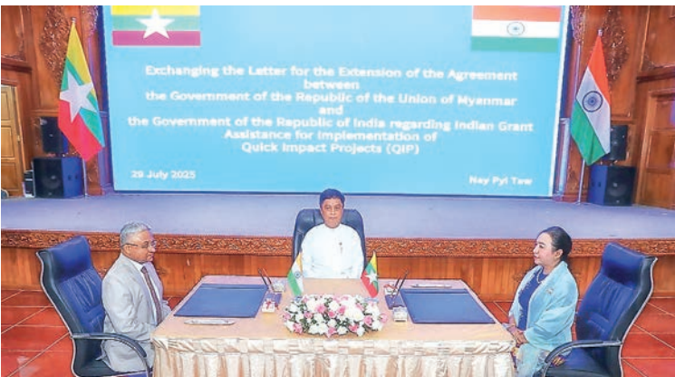
The exchange event of agreement extension for quick impact projects underway yesterday.