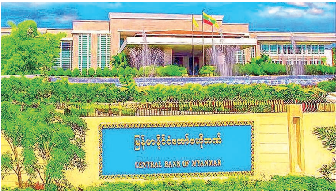
The facade of the Central Bank of Myanmar (CBM) in Nay Pyi Taw.

THE Central Bank of Myanmar (CBM) announced on 28 July that it would sell US$30 million to fuel oil businesspeople. CBM sold over $354,900 to fuel oil-importing companies in addition to an injection of 1.184 million yuan on 28 July. CBM sold over $1.29 million to edible oil-importing companies and $485,266 to fuel oil-importing companies on 25 July again. CBM sold over $1.345 million, which were purchased from companies working on a Cut-Make and Pack basis, to edible oil-importing companies on 24 July. CBM sold over $2.36 million to edible oil-importing companies and $320,700 to fuel oil-importing companies on 23 July 2025. CBM announced on 22 July that it would sell $27 million to those engaged in the fuel oil industry and 130 million baht to importers. CBM injected $660,000 and 474,900 yuan on 22