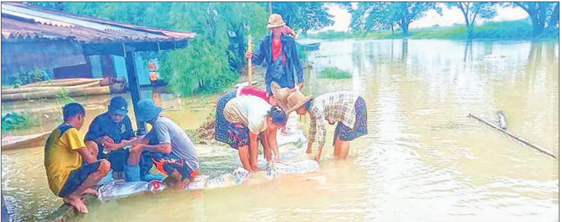
In July and August 2024, 56 fish farmers faced losses due to floods, and the Bago Region government and Fisheries Department provided 2,000 fingerlings. One of the flooded areas in Bago is pictured.

THE Fisheries Department and Myanmar Fisheries Federation released notices for the fish farmers to be aware of weather conditions and make preparations, as some of the regions and states face flooding due to storms in the 2025 monsoon. In the 2024 monsoon, 4,215.93 acres of fish ponds in Bago Region were flooded, and the Fisheries Department provided fingerlings to resume fish farming. According to the weather forecast of the Department of Meteorology and Hydrology yesterday, five regions and states, including Bago Region, will have heavy rainfalls, and the low-lying areas such as Kyaukgyisu ward, southern Zaiganine, Kyunthaya ward and Myothit ward are flooded, but not the fish ponds. In October 2023, Bago Region also experienced sudden heavy rain, causing fish ponds to flood and water to overflow up to the foot of the Shwemawdaw