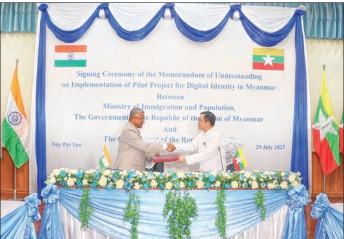
The MoU signing event between the Ministry of Immigration and Population on pilot cooperation in Myanmar's Digital Identity Programme in progress yesterday.

A signing ceremony for the Memorandum of Understanding (MoU) on pilot cooperation in Myanmar's Digital Identity Programme between the Ministry of Immigration and Population (MoIP) and the Government of the Republic of India was held yesterday at the Ministry's meeting hall in Nay Pyi Taw. Union Minister for Immigration and Population U Myint Kyaing, Deputy Ministers U Htay Hlaing and Dr Myo Thant, Indian Ambassador to Myanmar Mr Abhay Thakur, senior officials, and departmental staff attended the ceremony.