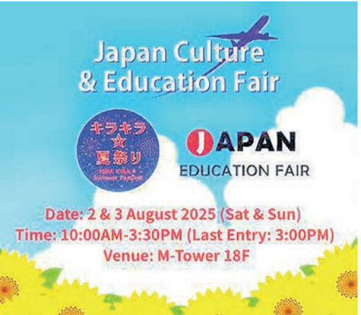
This image showcases an invite advert for the Japan Culture and Education Fair.

THE Japan Culture and Education Fair, a combination of Kira Kira Japan Summer Festival, which can give a taste of Japanese summer and Japan Education Fair, which can provide advice on studying in Japan, will be held on 2-3 August.