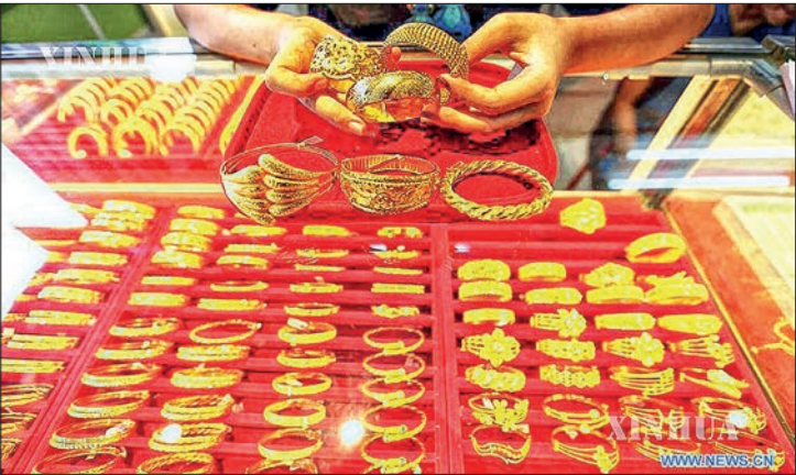
A gold shopkeeper displays a variety of gold ornaments for sale.

SURPRISE inspection was carried out at gold shops in Yangon Region to check their compliance, according to the Yangon Region Gold Entrepreneurs Association. Under the instruction of the gold market monitoring and steering subcommittee (Nay Pyi Taw), an inspection team (Yangon) comprising its members, YGEA, and the registration board of the respective departments undertook a surprise check on gold shops such as Shwe San Eain Gold Shop, Thamadi Gold Shop and Thin Shwe Sin Diamond and Gold Shop in Lanmadaw Township, Kyauktada District, Sein Nan Taw, Lucky and Three Eagle Jewellery in Latha Township on 28 July. According to the directive of the subcommittee, the team checked on-ground whether the gold shops conduct transaction according to daily reference price of the Mineral (Gold) Reference Price Determination Committee, they hold a valid licence or not, they