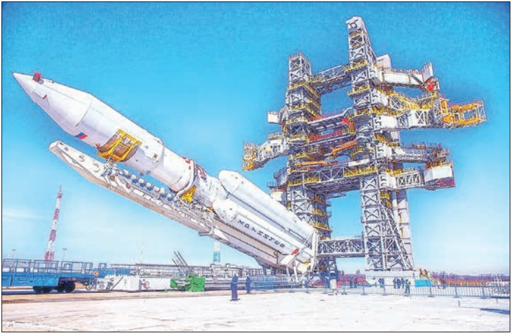
In this handout photo released by the Russian Space Agency Roscosmos, the Angara A5 rocket is lifted on the launchpad ahead of its upcoming launch at the Vostochny cosmodrome in Amur Region.