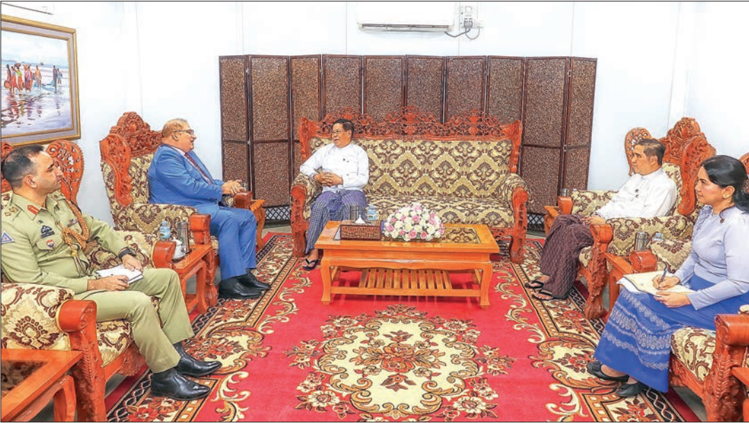
Pakistani Ambassador Mr Imran Haider calls on Deputy Prime Minister MoFA Union Minister U Than Swe yesterday.

DEPUTY Prime Minister and Union Minister for Foreign Affairs U Than Swe received Ambassador of Pakistan to Myanmar Mr Imran Haider, who is leaving Myanmar after the