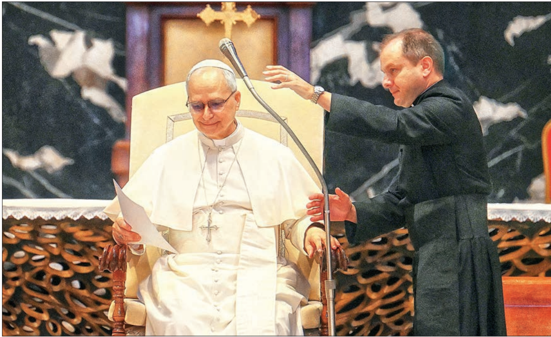
Pope Leo XIV (L) attends the mass for the Jubilee of digital missionaries and Catholic influencers celebrated by Filipino Cardinal Luis Antonio Tagle at St Peter's Basilica at the Vatican on 29 July 2025.

POPE Leo XIV on Tuesday called on the world to protect human "dignity" online as it faces the "challenge" of AI, at the Vatican's first mass for Catholic influencers.