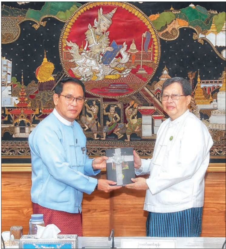
Union Minister U Maung Maung Ohn accepts the donated books in Nay Pyi Taw yesterday.