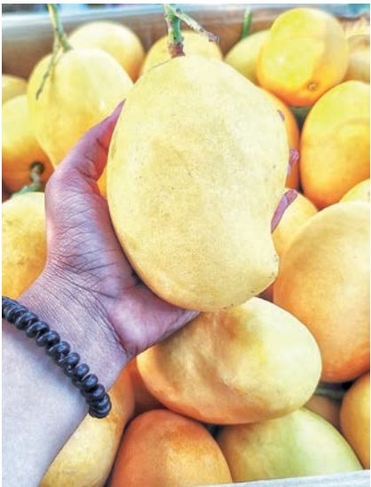
A vendor displays mangoes for sale.