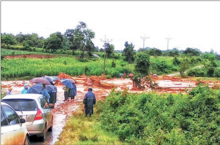
Flooding in Pindaya.

HEAVY rains caused flooding and landslides in Pindaya and Ywangan townships in southern Shan State, which also caused fatalities, according to locals. The authorities have issued a warning to residents to take special care, and search and rescue operations are being carried out, the humanitarian organizations said. "For the time being, the bridge at Mai In village on Pyidaungsu Road in Yaksawk was closed. We recovered five bodies killed by a landslide in Kone Saung village, including children. Some are missing. We are still working on the rescue operation," said a member of the relief association. Flooding began at midnight on 27 July in Pindaya, triggered by landslides that covered hundreds of acres of farmland. Some villages in the northern Pindaya were also flooded, and the road to the ShweUMin Pa-