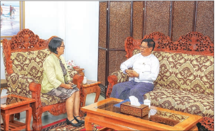
The UNHCR Representative in Myanmar calls on Deputy Premier MoFA Union Minister U Than Swe in Nay Pyi Taw.

ongoing activities in Myanmar as well as ways and means for further cooperation between the Government of Myanmar and UNHCR. Also, present at the meeting were senior officials from the Ministry of Foreign Affairs. — MNA