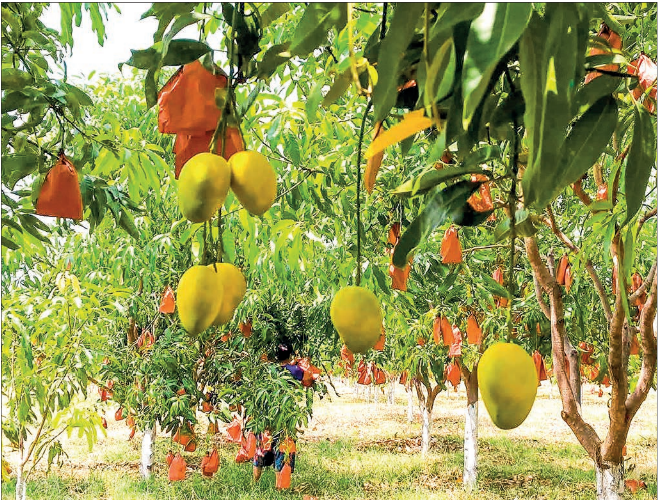
This image showcases a flourishing mango plantation in Myanmar.