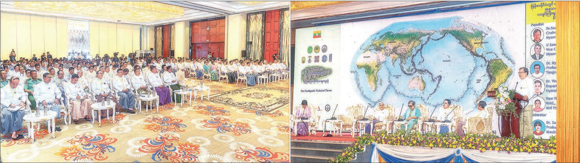
SAC Member Deputy Prime Minister Union Defence Minister General Maung Maung Aye speaks on the second-day occasion of the Post-Earthquake Technical Forum in Nay Pyi Taw yesterday.

THE State Administration Council enacted the Sixth Amendment to Amyotha Hluttaw Law as the SAC Law No 46/2025 under Section 419 of the Constitution of the Republic of the Union of Myanmar on 29 July. The law stated its amendments to some provisions of Sections 2, 4, 8, 13, 14, 17, 18, 19, 22, 24, 27, 28, 30, 35, 40, 41, 43, 45, 46, 48, 49, 52, 55, 58, 64, 65, 66, 70, 78, 81, 82, 88 and 89, respectively. — GNLM/TTA