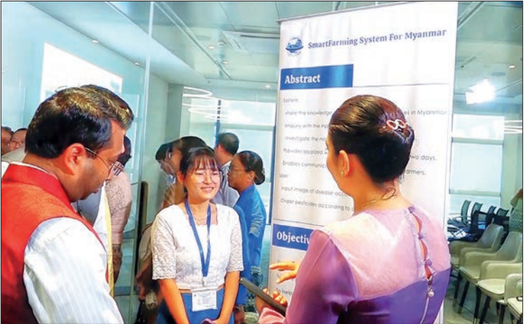
This photo features teachers, students, and equipment at the "Internship Programme Graduation and My Story (Story of July) Digital Talent Show 2025" ceremony.

cased their AI and e-commerce projects, business management innovations, new creations in the ICT field, and other demonstrations of AI technology and digital talent. Aiming to bridge the gap between university education and workplace needs, the ICTRC and the MDEA jointly offer a three-month internship programme for computer science students, and this year, 100 students from 19 computer universities — 80 in computer science and 20 in computer technology — completed the programme, with 32 of them receiving scholarships. — ASH/TH