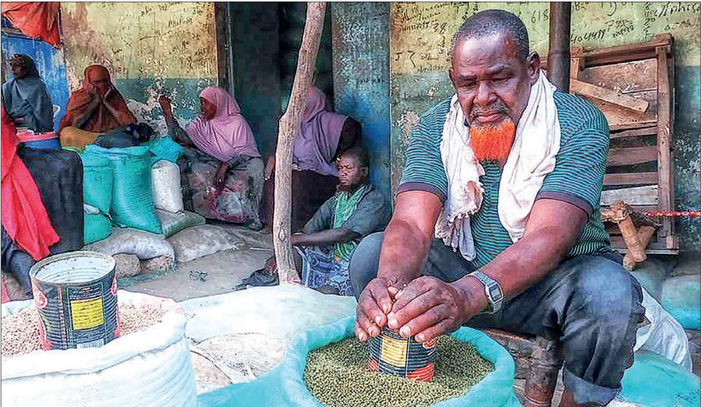
A man sells food products in Balcad town, Shabelle region of Somalia, 7 December 2024.

GLOBAL hunger levels declined in 2024 for the second consecutive year, with an estimated 15 million fewer people affected than in 2023, according to the latest United Nations (UN) report on food security. However, progress remains uneven, as hunger continues to rise in parts of Africa and Western Asia amid ongoing food crises and inflationary pressures. The 2025 edition of The State of Food Security and Nutrition in the World (SOFI) was released Monday by five UN agencies, including the Food and Agriculture Organization (FAO), the World Food Programme (WFP), and the World Health Organization (WHO), at the UN Food Systems Summit Stocktaking Moment in Addis Ababa. Globally, 8.2 per cent of the population - between 638 million and 720 million people - experienced hunger in 2024. This represents a modest improvement from 8.5 per cent in 2023 and 8.7 per cent in 2022. The overall decline was largely driven by progress in South-East Asia, Southern Asia, and South America. However, the report warned that these gains are being offset by worsening hunger trends in most sub-regions of Africa and Western Asia, particularly in countries facing prolonged conflict, displacement, or economic instability.