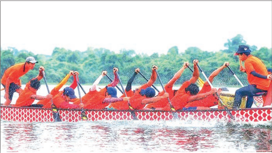
Rowers from the Myanmar national dragon boat team in action in the training session.

The delegation will comprise six male athletes, six female athletes, one team captain, one manager and two coaches.