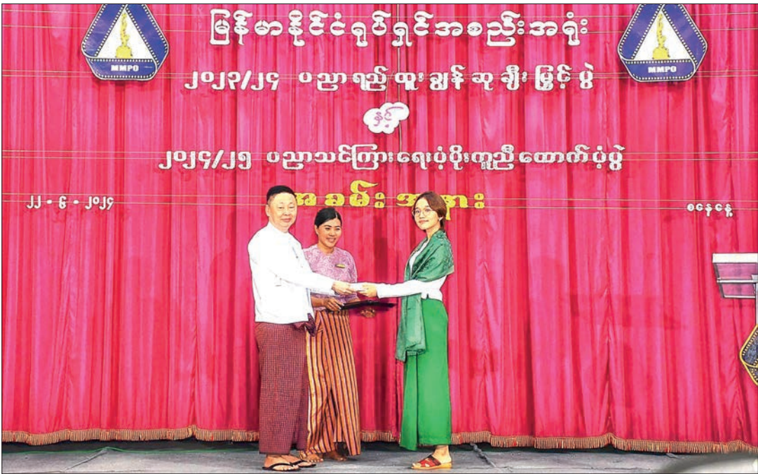
The ceremony of honouring outstanding students and giving financial support for the 2024-2025 academic year is in progress.

MYANMAR Motion Pictures Organization (MMPO) will honour its members' children who passed the matriculation exam in the 2024-2025 academic year at the 20th awarding ceremony. In addition to students who passed the exam with flying colours, those who didn't have distinction will