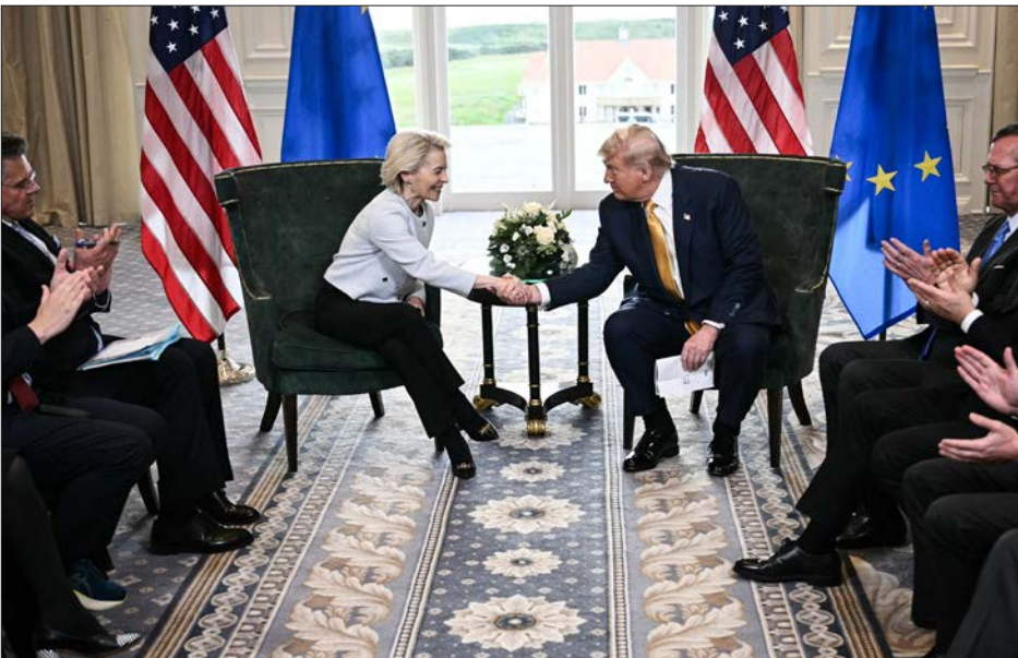
US President Donald Trump (R) shakes hands with European Commission President Ursula von der Leyen (L) after agreeing on a trade deal between the two economies following their meeting, in Turnberry south west Scotland on 27 July 2025, on the third day of his visit to the country, since his second tenure as President began.

London also advanced, boosted by a three-per-cent rise to the share price of