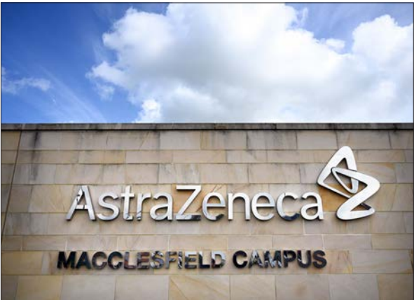
(FILES) A logo is pictured on a wall outside the offices of pharmaceutical company AstraZeneca in Macclesfield, central England on 11 May 2021. PHOTO: AFP

Traders kept an eye on US talks with other major economies, including India and South Korea, and negotiations between top US and Chinese officials in Stockholm. — AFP