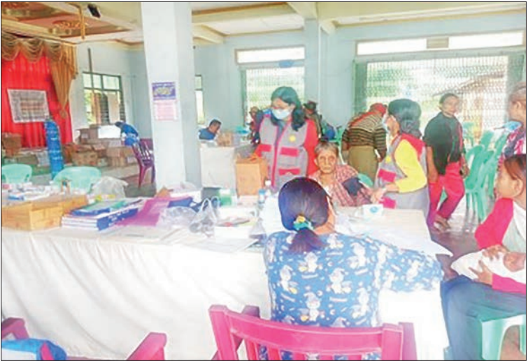
Students are seen learning peacefully in the classroom (L) and locals receive healthcare services (R) in Nawngkhio.

are provided with free textbooks, stationery and school uniforms provided by the Ministry of Education. In addition, doctors and medical workers from Tatmadaw and the Ministry of Health jointly conducted a temporary hospital in the Myanan Tawwin Mingala Hall to facilitate the healthcare of local ethnic people and provide medical treatment. To date, 137 local ethnic people have received necessary healthcare. — MNA/MKKS