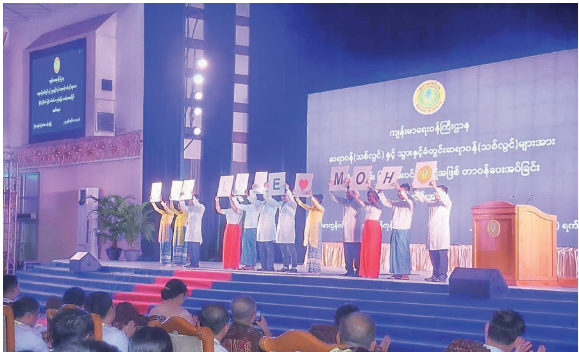
The performance of the health staff at the ceremony.

and Myanmar Dental Council President Dr Paing Soe briefed the ethics to be followed by the medical doctors and dentists. The officials presented order letters to be assigned as assignment of