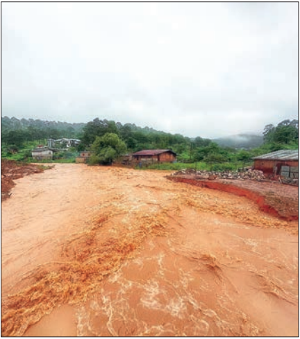
This photo captures Kalaw being flooded on 28 July.

A flood has happened in southern Shan State's Kalaw starting from 28 July morning, according to residents. "This morning, a flood happened in Kalaw's downtown Wards 2, 3 and 4, and some houses have been under water," said a resident. It rained for long hours in Taunggyi a few days ago, prompting authorities to urge residents in lowland areas of Aungban, Nyaungshwe, Inle and Kalaw to prepare. In past, flood was described as an abnormal weather condition for highland regions, but lately, this disaster has been happening frequently. — Htun Htun/ZS