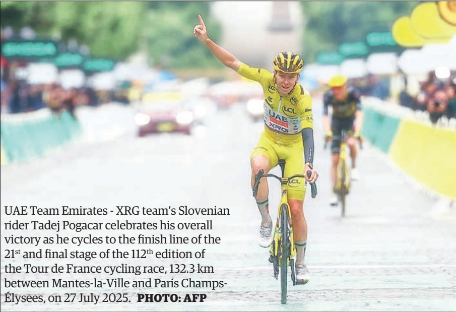
UAE Team Emirates - XRG team's Slovenian rider Tadej Pogacar celebrates his overall victory as he cycles to the finish line of the 21 st and final stage of the 112 th edition of the Tour de France cycling race, 132.3 km between Mantes-la-Ville and Paris Champs-Élysees, on 27 July 2025.

his attack in the Montmartre climbs amid the fans' cheers, only to see Van Aert roar back for a stage win. Pogacar crossed the line in fourth place. — Xinhua