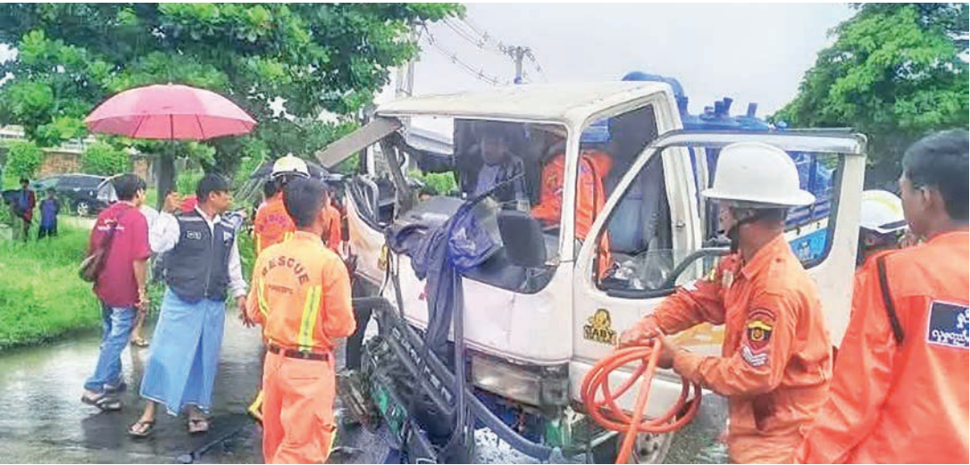
This photo reveals that YBS and a drinking water truck collided on Yadana Street in Ward 61, Dagon Myothit (Seikkan) Township, Yangon Region, on 21 July 2025.

OVER six months in 2025, the death rate from road traffic accidents declined by 256 compared to the same period last year, according to the chart on traffic accidents in regions and states and the Yangon-Mandalay Highway. Including Nay Pyi Taw and all states and regions and the highway, as from January to June 2024, there was a total of 2,163 cases, in which 3132 were injuries and 1,148 were deaths; however total of 1,692 accidents happened, leaving 2,478 injuries and 892 deaths over the same period this year. This year's death rate rose by 12 in Sagaing Region, 6 in Taninthayi Region and one in Kayah State compared to last year, however fell by 49 in Mandalay Region, 44 in Yangon Region, 31 in Magway Region, 24 on the highway, 23 in Bago Region, 22 in Shan State and Mon State, 21 in Kachin State, 14 in Ayeyawady Region, 13 in Kayin State, five in Nay Pyi Taw, four in Rakhine State and three in Chin State. Last year, there were 433 accidents in Yangon Region with 497 injuries and 222 deaths, 346 accidents in Ayeyawady Region with 534 injuries and 137 deaths, 310 accidents in Bago Region with 469 injuries and 141 deaths and 292 accidents in Mandalay Region with 405 injuries and 164 deaths. In 2025, there were 386 cases in Yangon Region with 369 injuries and 178 deaths, 272 cases in Ayeyawady Region with 452 injuries and 123 deaths, 242 cases in Bago Region with 325 injuries and 118 deaths and 185 cases in Mandalay Region with 246 injuries and 115 deaths. — MT/ZS