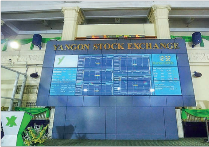
Display panel showing share indexes at Yangon Bourse.

AMATA Holding Public Company Limited informed its shareholders about the company's current operations, in which Amata Resort & Spa and Oriental Ballooning Service are temporarily closed. AMATA Holding Public Company Limited commenced share trading on the Yangon Stock Exchange on 3 June 2021 as the seventh listed company and the first ever company in the hotel and tourism services sector listed on the exchange. The company's business operations are managed by its subsidiaries; United International Group Limited (UIG) running hotel and tourism services under the name Amata and Myanmar Ballooning Company Limited (MB) operating passenger hot air balloon services under the brand “Oriental Ballooning”, in key tourism sites such as Ngapali, Inlay, Bagan, and Myeik Archipelago regions. Nonetheless, the compa-