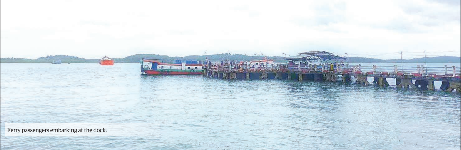
Ferry passengers embarking at the dock.

weather improves and the vessels are allowed to leave when the Department of Meteorology and Hydrology (Taninthayi Region) permits it. As the weather is currently good, the ferry service has been operating to Kyunsu and Myeik as scheduled since 16 July, with two up-down daily ferry trips and one up-down cargo boat trip. — ASH/MKKS