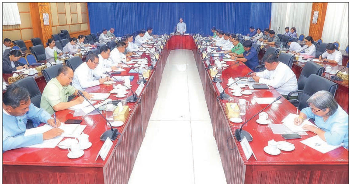
Union Minister U Ko Ko Hlaing addresses the third coordination meeting of the Working Committee on the Development of a Resilient and Strong Social Community.

Moreover, four sectors will be implemented in the pilot project of Nay Pyi Taw, aiming to