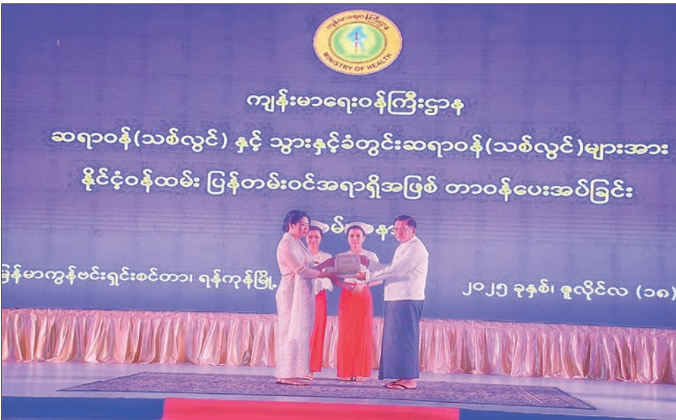
The SAC Chairman presents certificates of State gazetted officer appointment to a representative from the medical universities.

health of the nation”, the Ministry of Health (MOH), Myanmar, laid down the two objectives, to enable every citizen to attain total life expectancy and enjoy longevity of life, and to ensure that every citizen is free from diseases. To do that, the newly appointed medical doctors and dentists are the main implementing human resources.