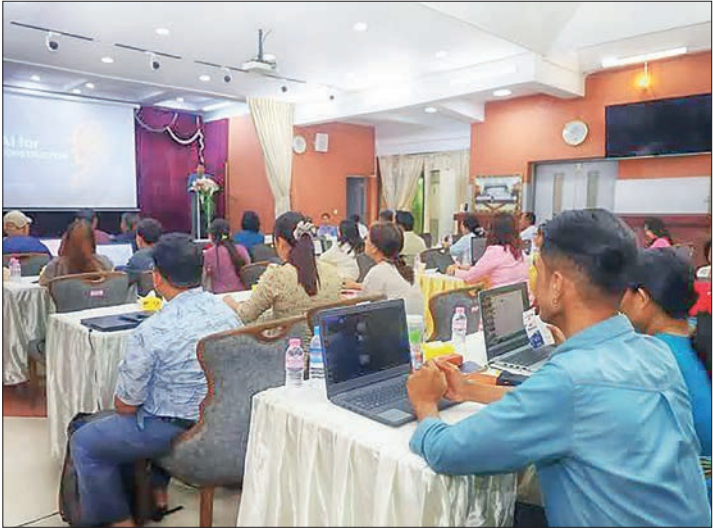
This image captures an AI training course provided by the MCEF Technology Development Committee.

ACCORDING to the Myanmar Construction Entrepreneurs Federation, its Technology Development Committee will continue to offer AI courses. The MCEF invites those interested to contact the association for details about these AI courses. A one-day training session titled Introducing AI to Modern Construction, organized by the MCEF and the Yangon Region Computer Industry Association (MCIA Yangon), was held at the MCEF Conference Hall on 26 July. Topics covered included AI applications for the construction industry, such as creating business plans, improving project management, utilizing AI in the design and pre-construction