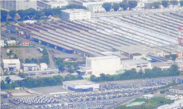
Photo taken from a Kyodo News helicopter shows an Isuzu Motors Ltd factory in Fujisawa, Kanagawa Prefecture on 28 July 2025.

JAPANESE truck maker Isuzu Motors Ltd is considering moving the production of light-duty trucks from its factory near Tokyo to the United States for 2028 to reduce the effect of tariffs imposed by US President Donald Trump, its president said.