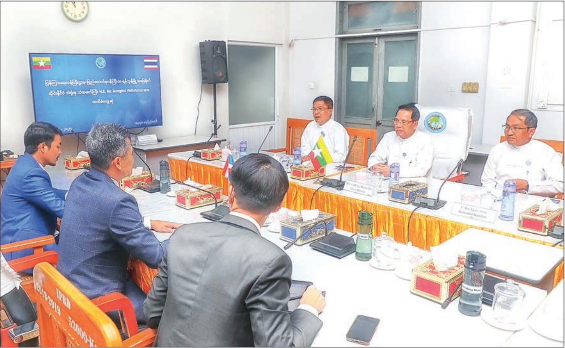
Thai Ambassador to Myanmar Mr Mongkol Visitstump calls on Union Minister U Maung Maung Ohn yesterday.

lish accurate news, promoting cultural and tourism sectors as well as cooperation in all sectors, not just the media sector, between the two countries. Deputy Minister U Ye Tint, the Permanent Secretary and officials from the Thai Embassy attended the meeting. — MNA/MKKS