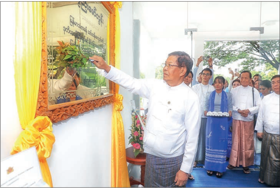
Deputy Prime Minister and Union Foreign Affairs Minister U Than Swe sprinkles scented water on the commemorative plaque of newly inaugurated Myanmar Diplomatic Academy.

In his address, Deputy Prime Minister and Union Minister U Than Swe emphasized that the launch of the Myanmar Diplomatic Academy is a milestone for the Ministry of Foreign Affairs, and an important investment for the future of Myanmar’s international relations. He also stated that diplomacy is one of the key foundations for peace, stability and