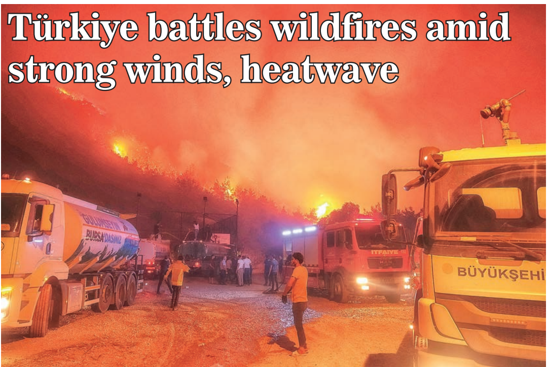
Residents and firefighters attempt to extinguish a wildfire as smoke and flames rise from a forested area in the Gursu district of Bursa early on 27 July 2025.

and a rise in deforestation have heightened the likelihood of fires and haze, the report said, noting a surge in hotspots and smoke haze across parts of Sumatra in mid-July this year, with transboundary haze drifting from central Sumatra into parts of Peninsular Malaysia. Economic and policy shifts could also inadvertently drive deforestation and increase haze risk if fire continues to be used for land clearing, the report warned. — Xinhua