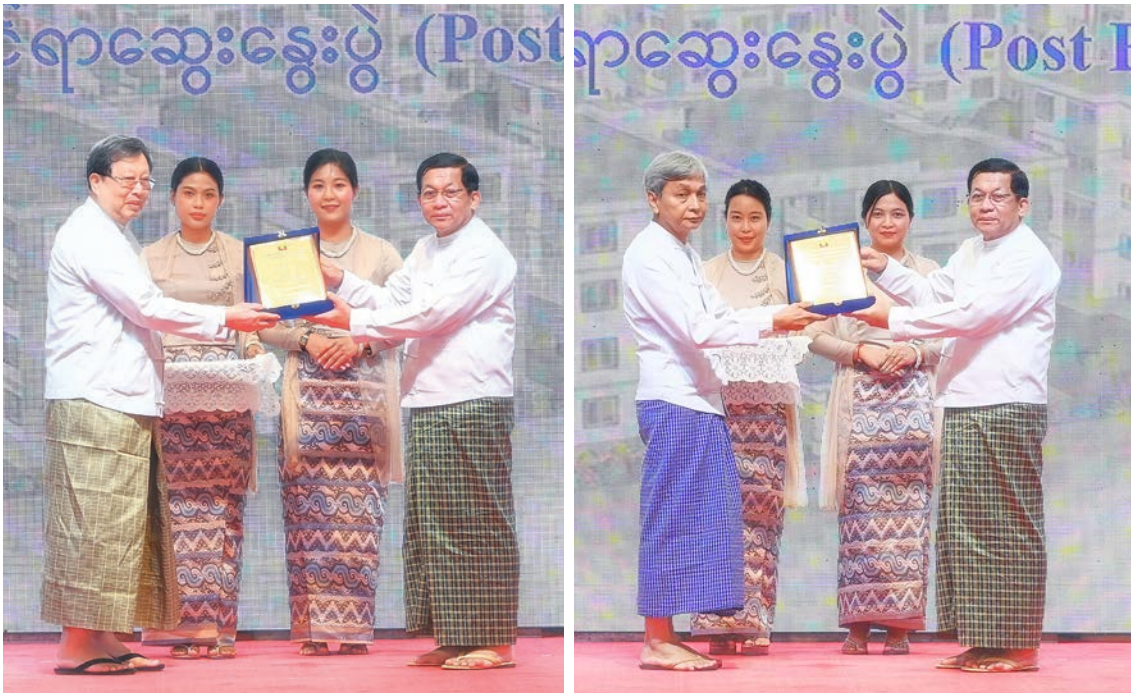
Photos show Senior General Min Aung Hlaing presenting honorary certificates of appreciation at the Post-Earthquake Technical Forum yesterday.

To ensure the proper implementation of standards in construction activities, he noted that as the Ministry of Construction, together with the Myanmar Engineering Council, the Myanmar Architects Council, the Federation of Myanmar Engineering Societies, the Myanmar Geosciences