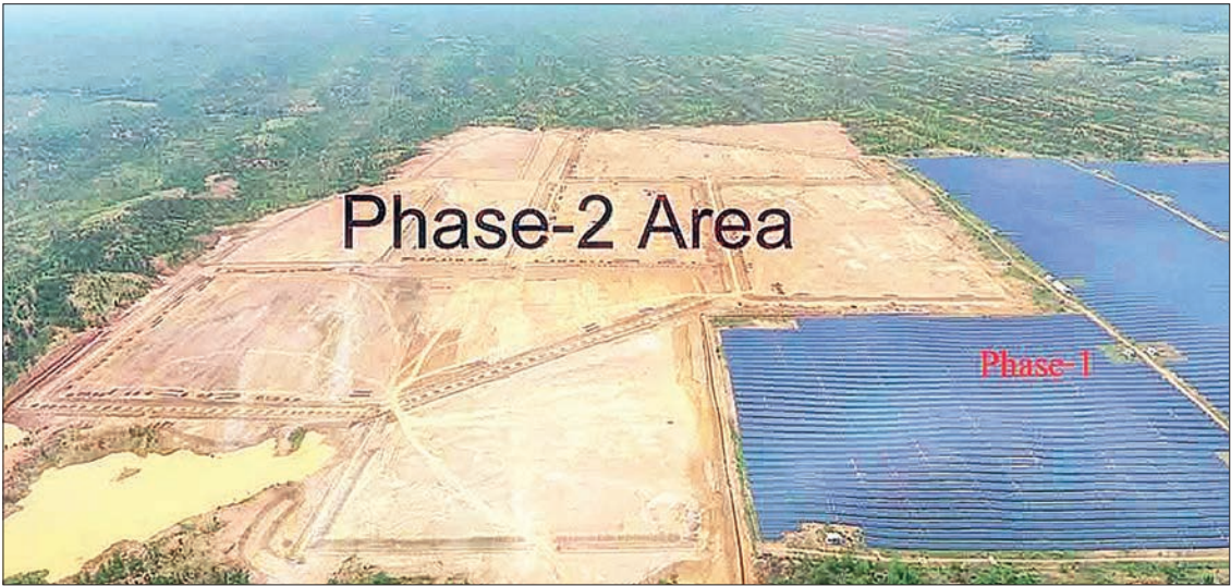
The Minbu Energy power plant site in Minbu Township, Magway Region.

ble common solution for electrifying remote areas in Myanmar. The project scales up mini-grid sites to provide reliable, affordable and clean energy in remote areas in Ayeyawady and Tanintharyi regions. “Small-scale solar system for a single house has been planned for 28,076 households in 339 villages in Nay Pyi Taw Union Territory, Yangon, and Ayeyawady regions and southern and eastern Shan State. Mini-grids will reach 10 villages in Ayeyawady and Taninthayi regions, extending the electrification project to 2,154 households, said an official of the ministry. Rural electrification projects also spent K22 billion in