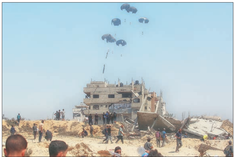
A military transport aircraft drops humanitarian aid over the northern Gaza Strip, on 27 July 2025.