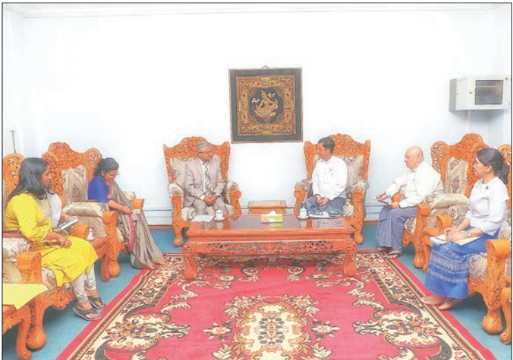
The Indian ambassador calls on Deputy Minister U Lwin Oo yesterday.

DEPUTY Minister for Foreign Affairs U Lwin Oo received Mr Abhay Thakur, Ambassador of India to Myanmar, at the Ministry of Foreign Affairs in Nay Pyi Taw yesterday. They cordially discussed