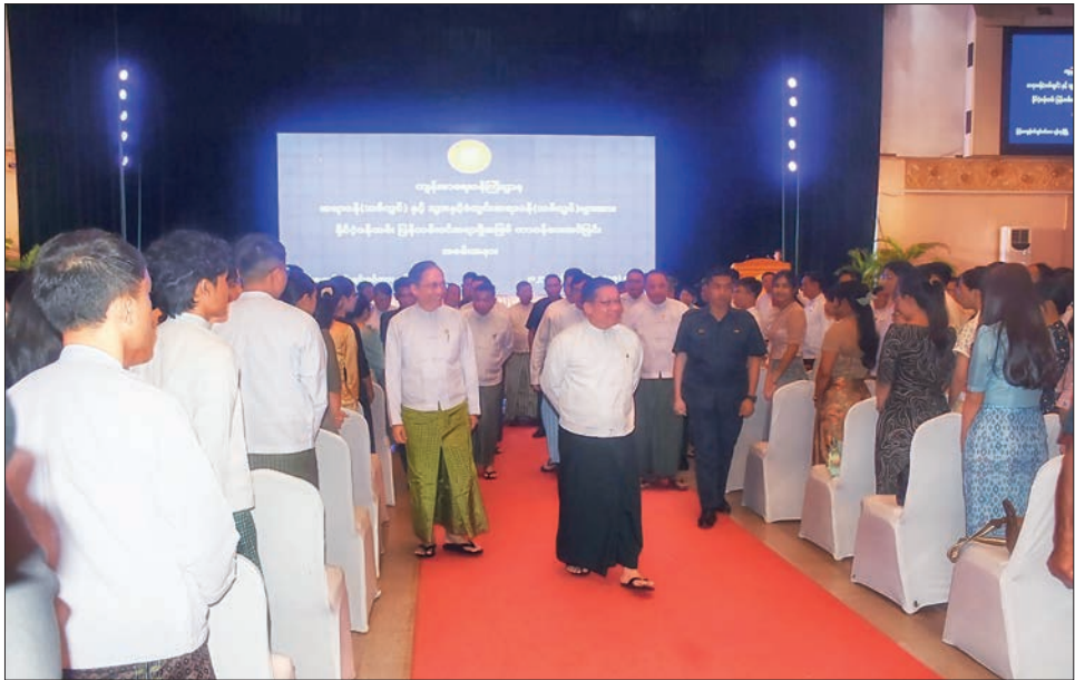
The SAC Chairman greets newly appointed medical doctors and dentists warmly.

that the medics should follow the professional ethic, medical ethic, and civil rules and ethics. The Union Minister stated the need to be mature and stable, to view everything with a wide perspective, and to have a sense of re-