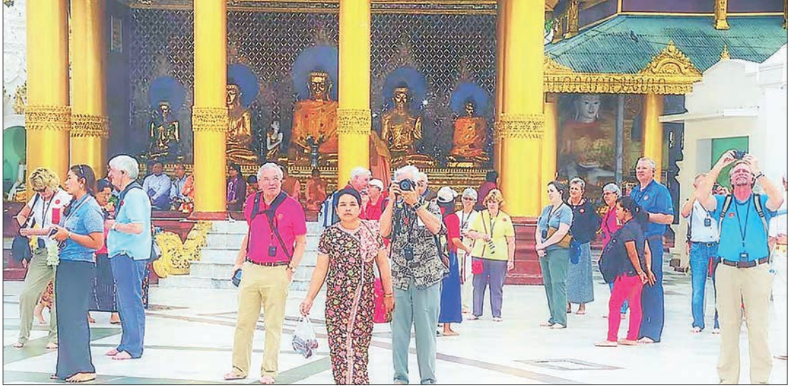
International travellers are seen on the Shwedagon Pagoda platform.