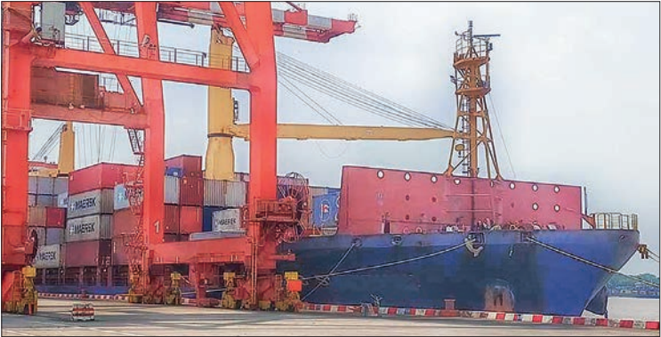
A container vessel is seen docking for loading and unloading cargo at Yangon Port.

The association aims to meet the export target of 90,000 tonnes of sesame this FY. Myanmar's sesame is primarily exported to China, and is also sent to Thailand, the Republic of Korea, Japan and Singapore. — NN/KK