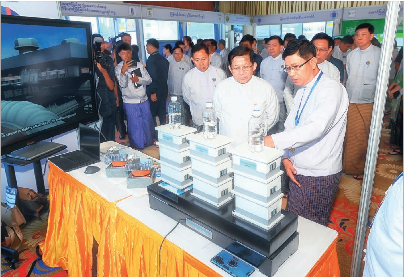
State Administration Council Chairman Prime Minister Senior General Min Aung Hlaing looks into the booths displayed at yesterday's forum in Nay Pyi Taw.

Speaking at the forum, the Senior General said that the established infrastructure must meet earthquake-resistant standards and quality benchmarks in order to effectively protect the lives and property of the people from losses and damages. The State has initially provided K500 billion as funding to support the reconstruction of homes and buildings of the people damaged by the disaster. In addition, a further K2 trillion is being provided to continue supporting reconstruction and rehabilitation efforts.