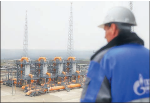
An employee looks at Kazachya gas compressor station, facility of Gazprom's TurkStream gas pipeline, in Krasnodar region, Russia.

Slovakia’s PM Robert Fico has repeatedly called the EU plan “economic suicide.” — SPUTNIK