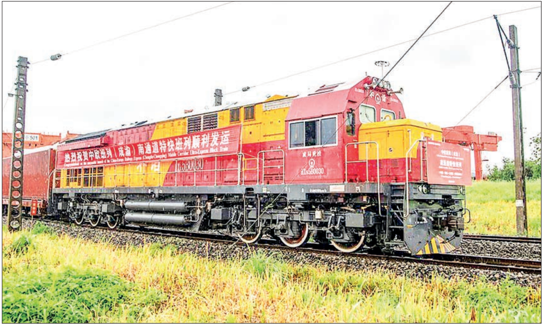
The China-Europe Railway Express (Chengdu-Chongqing) Middle Corridor Ultra-Express Block Train departs from Tuanjiecun Station in southwest China’s Chongqing Municipality, 9 July 2025.

CHINA’S railway freight volume reported stable growth in the first half of 2025, with more efficient network operation and improved services, the national railway operator said Sunday. The national railway system transported a total of 1.98 billion tonnes of cargo in the period, marking a year-on-year increase of three per cent, according to China State Railway Group Co Ltd. The daily average