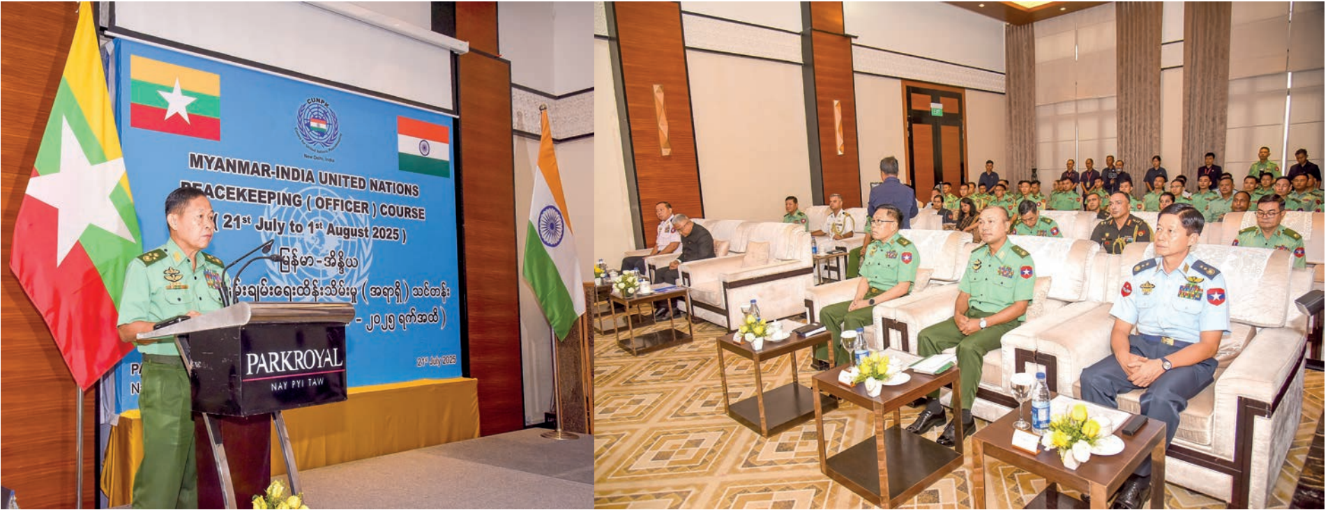
State Administration Council Vice-Chairman Deputy Prime Minister Defence Services Deputy C-in-C, C-in-C (Army) Vice-Senior General Soe Win delivers the inaugural address at the UN Peacekeeping Officer Course jointly conducted by Myanmar Tatmadaw and Indian Armed Forces.

A CEREMONY to open the UN Peacekeeping Officer Course jointly organized by Myanmar Tatmadaw and Indian Armed Forces took place at Parkroyal Hotel in Nay Pyi Taw yesterday morning. The training course aims to enable officers and other ranks from Myanmar Tatmadaw to know their duties and functions in the UN Peacekeeping process. Vice-Chairman of the State Administration Council, Deputy Prime Minister,