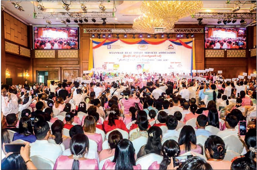
Members of the Myanmar Real Estate Services Association seen at an annual general meeting.

The Myanmar Real Estate Services Association signed memoranda of understanding in June 2025 at Nihon