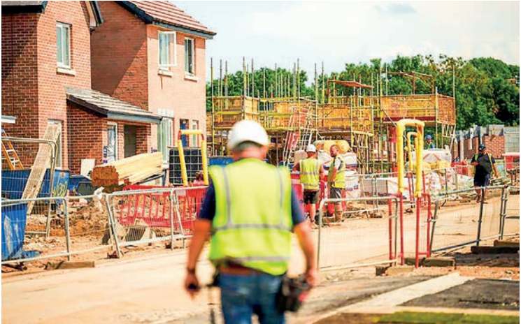
This photo taken on 22 June 2023 shows a construction site in Liverpool, Britain.

sending big risks to investment and productivity.” According to Bharier, the BCC’s most recent economic forecast suggests hiring will remain subdued and the unemployment rate is expected to stay