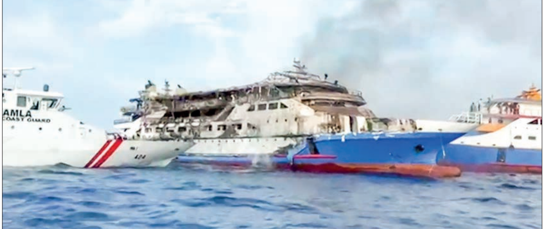
This screen grab taken from video released by Indonesia’s National Search and Rescue Agency (BASARNAS) and the Indonesian Coast Guard on 20 July 2025 shows the KM Barcelona 5 ferry after a fire broke out while on its way to Manado, the capital of North Sulawesi province.

THREE people died and more than 500 others were rescued after a ferry caught fire off the Indonesian island of Sulawesi, emergency officials said Monday.