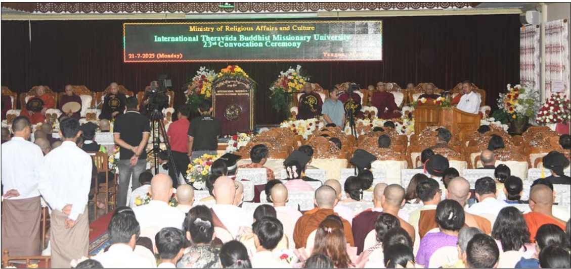
The 23 rd graduation event of the International Theravada Buddhist Missionary University is in progress yesterday in Yangon.