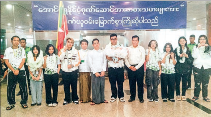
Triumphant Myanmar's esports team is seen being welcomed at Yangon International Airport.