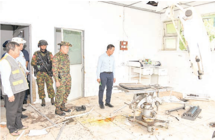
Vice-Senior General Soe Win inspects the damage to the hospital destroyed by terrorists.

At the town hall in Nawnghkio, the Vice-Senior General delivered a speech in honour of victorious Tatmadaw members.