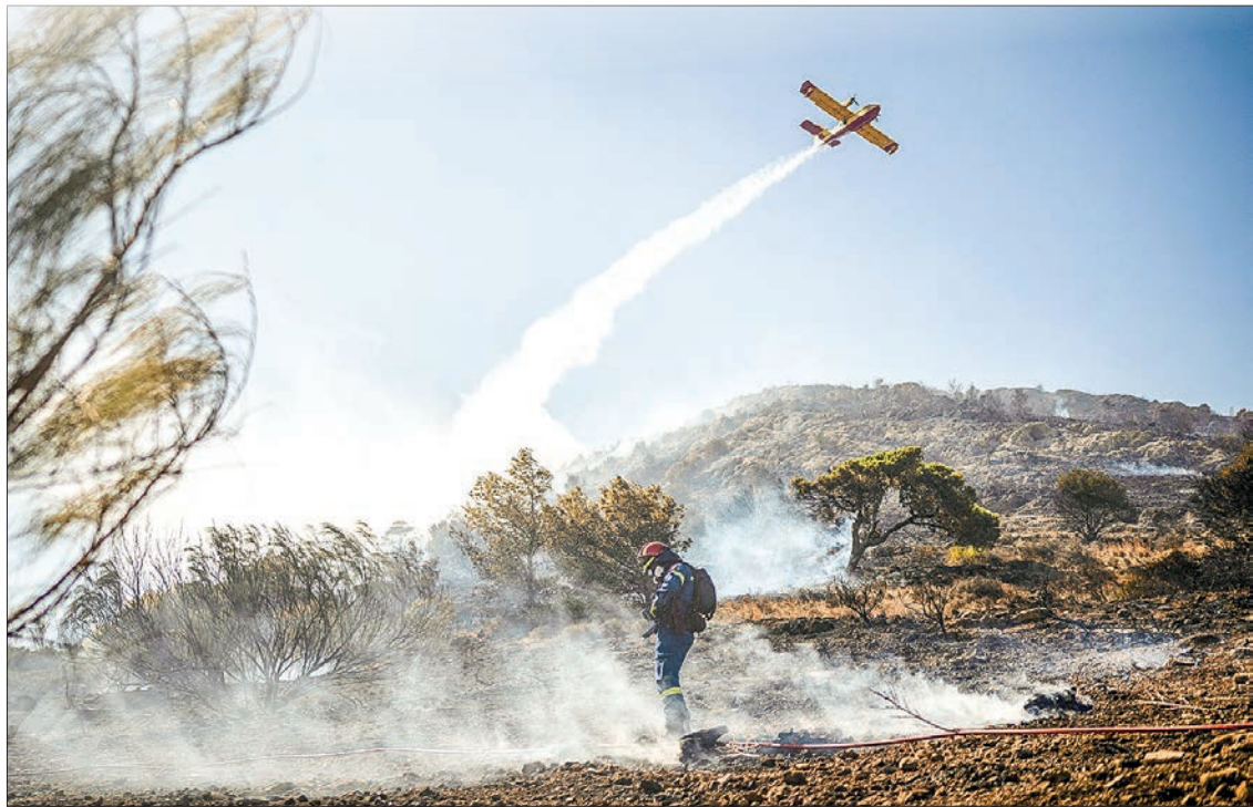
This photograph shows an airplane dropping water on a wildfire that broke up in Koropi, some 40 Kilometres of Athens on 4 July 2025.

Elsewhere, Türkiye recorded 761 wildfires in the 10 days following 26 June. The fires flaring in and around the western Izmir Province have claimed the lives of an elderly man and a forestry worker. Across Europe, at least eight heat-related deaths have been reported in countries including Spain and Italy as the continent is baked in the heat-wave. — Xinhua