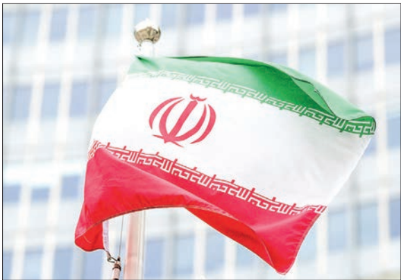
The flag of Iran flutters in the wind outside of the IAEA headquarters during the International Atomic Energy Agency IAEA's Board of Governors meeting at the agency's headquarters in Vienna, Austria, on 20 November 2024.

He noted that after the US withdrew from the Joint Comprehensive Plan of Action in 2018, Iran exhausted dispute resolution mechanisms before taking reme-