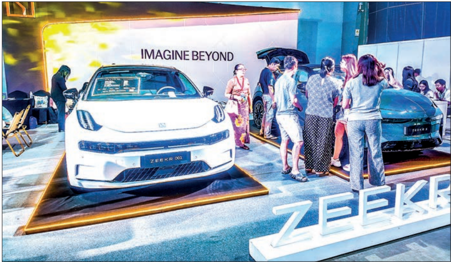
This picture shows different EV brands.

MYANMAR International Auto Expo was successfully held at Yangon Con-