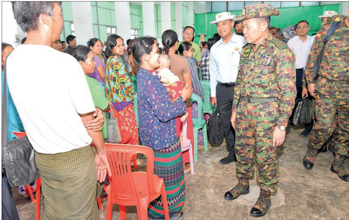
The Vice-Senior General warmly greets locals in Nawnghkio.

The Vice-Senior General continued that after Tatmadaw's successful recapture of Nawnghkio, the Prime Minister gave the very first guidance that, since the present era is one of knowledge, only through basic education can higher knowledge be attained. Therefore, in order to nurture a greater number of educated individuals, basic education schools must be reopened as quickly as possible, so that students can