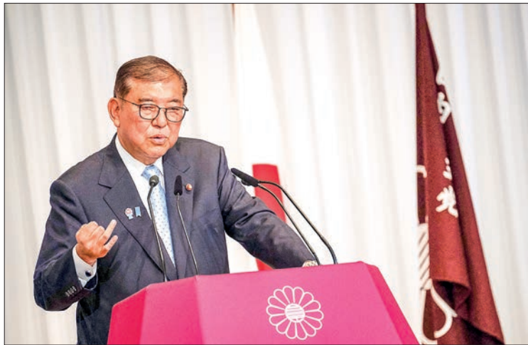
Japan's Prime Minister Shigeru Ishiba attends a press conference at the headquarters of the Liberal Democratic Party (LDP) in Tokyo on 21 July 2025, the day after the prime minister's coalition lost its upper house majority.

Deepening Ishiba’s woes, the LDP’s worst election outcome in years triggered calls from his own party for his resignation and prompted an emboldened opposition bloc to