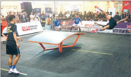
This photo captures the Teqball demonstration event. THE Teqball demonstration event, organized by the Department of Sports and Physical Education and the Myanmar Teqball Federation, was held at the Myanmar Plaza Promotion Area on Kaba Aye Pagoda Road, Yangon, on the morning of 20 July. The demonstration included a video clip explaining how to play Teqball, rules and regu-

won third place. In this competition, the Myanmar women's esports team matched with 16 teams from 14 countries at the world-class competition MLBB Women Invitational 2025 (MWI 2025). A total of 10 Myanmar players participated, including one team manager, one general manager, one team manager, one coach, five players, and one reserve player. Terror Queens, a member team of the Myanmar e-Sports Federation, won the "MWI 2025 Myanmar Qualifier" Mobile Legends tournament in Monsoon Mobile Legends from 10 to 15 June and was awarded the right to compete in the Esports World Cup MLBB Women Invitational 2025 (MWI 2025) to be hosted in Saudi Arabia.