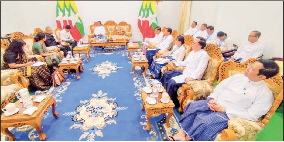
Union Minister U Nyan Tun receives Indian Ambassador Mr Abhay Thakur yesterday.

bilateral cooperation in electric power and cross-border power grid connection. Also, present at the meeting were Deputy Minister U Aye Kyaw, officials from the department concerned and the embassy. — MNA/KTZH