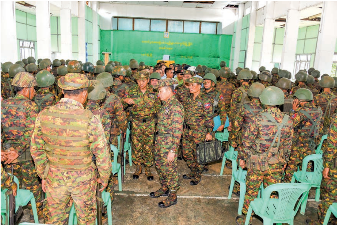
The Vice-Senior General is seen after presenting battlefield one-step promotion badges in recognition of outstanding performance.

VICE-CHAIRMAN of the State Administration Council Deputy Prime Minister Deputy Commander-in-Chief of Defence Services Commander-in-Chief (Army) Vice-Senior General Soe Win, accompanied by Shan State Chief Minister U Aung Aung, senior Tatmadaw officers from the Office of the Commander-in-Chief and deputy ministers, yesterday afternoon met with Tatmadaw members in Nawnghkio, Shan State (North), reoccupied by Tatmadaw which conducted the counter-terrorism operation to enable people to live peacefully. He inspected the people’s hospital and schools destroyed by terrorists and met departmental officials and residents to fulfil their requirements.