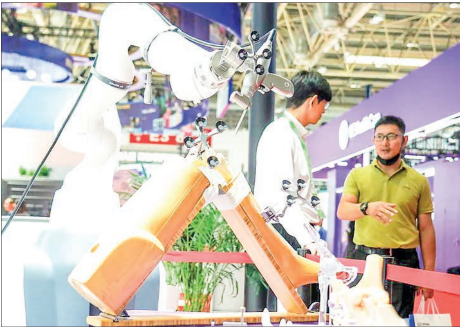
An AI-powered orthopedic surgical robot is seen in the Healthy Life Chain area of the third China International Supply Chain Expo (CISCE) in Beijing, capital of China, 17 July 2025.