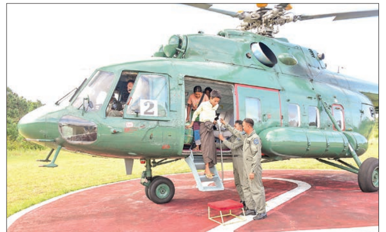
This photo shows a malaria patient being transferred from the Nawnghkio Township People's Hospital to the PyinOoLwin Tatmadaw Hospital.

Vice-Senior General inspected the halls of the school and the school head's office. The Township Education Officer and teachers reported to the Vice-Senior General on plans to admit students starting from 22 July and teach them. The Vice-Senior