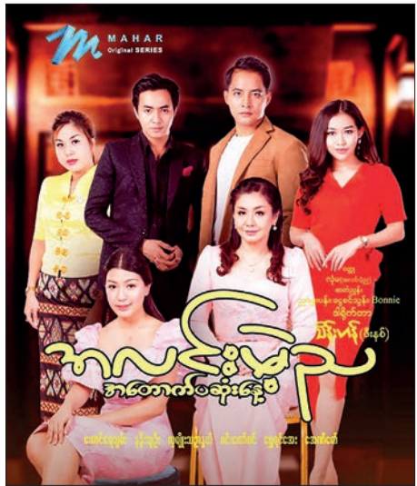
This image depicts a poster for the drama series ‘A Dark Night, The Brightest Day’.

THE family drama series ‘A Dark Night, The Brightest Day’, which explores the bonds between parents and children, will be broadcast in HD quality via the Mahar application during August.