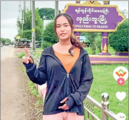
An estate agent is seen selling land in a TikTok video.