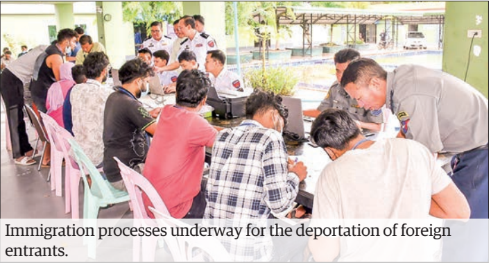
Immigration processes underway for the deportation of foreign entrants.

individuals are currently under detention while awaiting repatriation. The government is strictly cracking down on online scams and online gambling by cooperating with other countries, including neighbouring countries. — MNA/KTZH