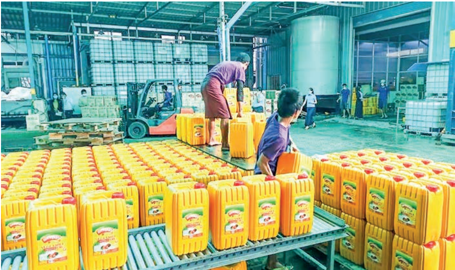
Workers are seen organizing cooking oil for distribution and sale.

THE wholesale reference rate of palm oil set for the Yangon market was set a bit higher at K6,055 this week ending 27 July from K6,030 per viss for a week ending 20 July, according to the Supervisory Committee on Edible Oil Import and Distribution. The Supervisory Committee on Edible Oil Import and Distribution under the Ministry of Commerce has been closely observing the FOB prices in Malaysia and Indonesia, adding transport costs, tariffs and banking services to decide the wholesale market reference rate for edible oil weekly. Despite the reference price, the market price is way too high. To control overcharging, the Consumer Affairs Department under the Ministry of Commerce informed consumers of lodging complaints for overcharging through the call centre hotline in late August. The department urges consumers not to buy palm oil at high prices. The Committee notified that any person who is involved in price gouging and oil storage to attempt market manipulation will face legal action under