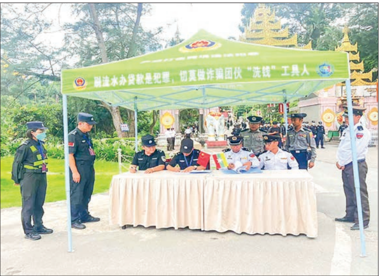
The handover of 207 Chinese nationals at the Myanmar-Sino border.