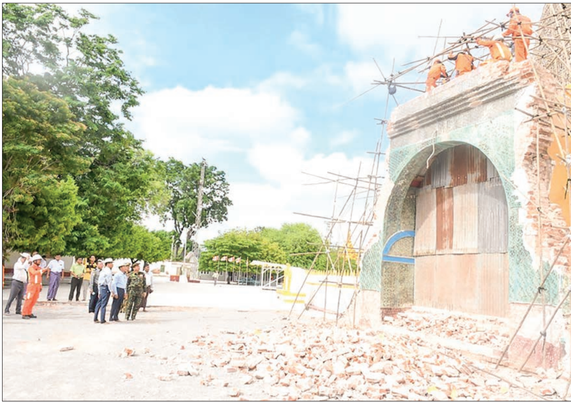
Rehabilitation efforts are underway in religious sites in Sagaing.

PEOPLE, together with members from relevant organizations, participate in rehabilitation efforts in damaged areas caused by the Mandalay earthquake. Yesterday, Lt-Gen Thet Pon from the Office of the Commander-in-Chief (Army) observed the clearance of debris at the religious sites in Sagaing, and the land area to reconstruct the Maha Zedi Hla Pagoda severely destroyed by the quake, and other cleaning activities in the compounds of pagodas and nunneries. Likewise, Lt-Gen Soe Tint Naing from the Office of the Commander-in-Chief (Army) inspected the removal of damaged parts of the Yadanabontha Pagoda and clearing of debris at the Myinwun Mingyi monastery in Mahaangmyay Township, systematic clearing of damaged staff housing with the use of heavy machinery in Chanmyathazi Township, and fulfilled the needs. — MNA/KTZH