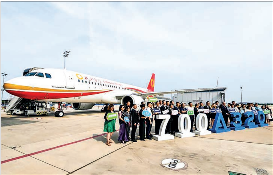
Guests attending the delivery ceremony of the 700 th A320 family aircraft assembled by Airbus Tianjin to Chengdu Airlines pose for a group photo in front of the A320neo aircraft in Tianjin, north China, 8 July 2024.

As an example of high-tech cooperation between