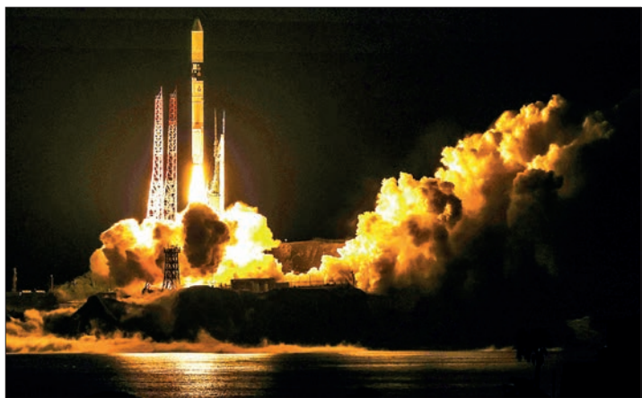
A Japanese H2A rocket, carrying a satellite for greenhouse gas and water cycle observation, lifts off from the Tanegashima Space Centre in Kagoshima Prefecture, southwestern Japan, on 29 June 2025.

JAPAN successfully launched its 50 th and final H2A liquid-fuel rocket from a southwestern Japan island on Sunday, drawing the curtain on the series' 24-year career in support of the country's space development programme.