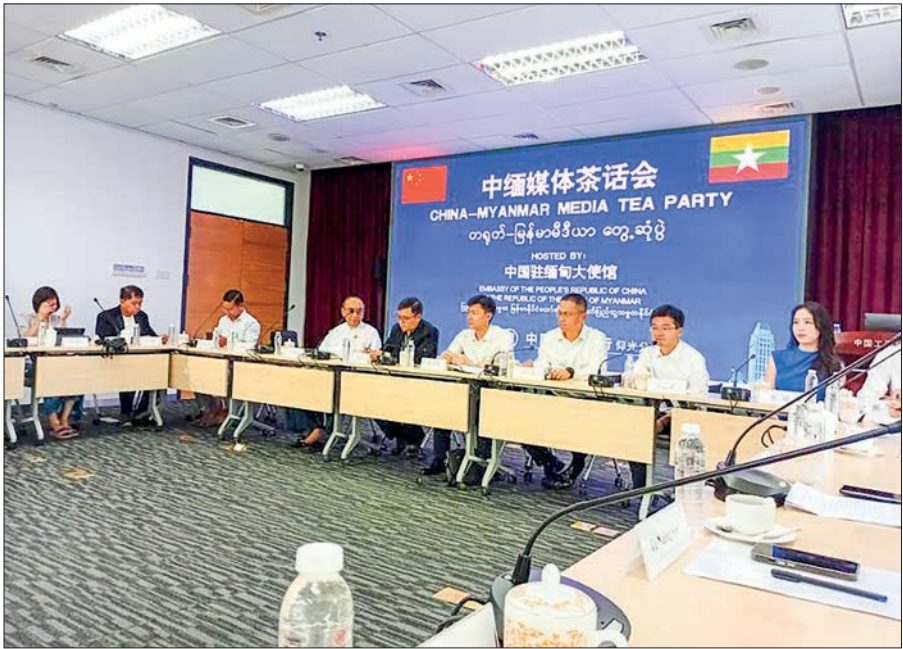
The Myanmar-China media meeting in progress in the second quarter of 2025.