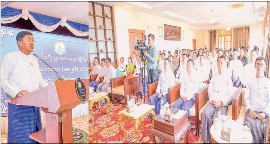
Union Minister U Kyaw Soe Win addresses the opening of the Basic Russian Language Course yesterday.

A basic Russian language course opening ceremony was held yesterday morning at the Golden Palace Hotel in Nay Pyi Taw, to provide better services to Russian tourists visiting Myanmar. The event was attended by Union Minister for Hotels and Tourism U Kyaw Soe Win, Deputy Minister U Phyo Zaw Soe, Nay Pyi Taw Council Member U Zeya Lin, departmental officials, representatives from hotel and tourism associations in Nay Pyi Taw, hotel staff, members of the Russia-Myanmar Friendship