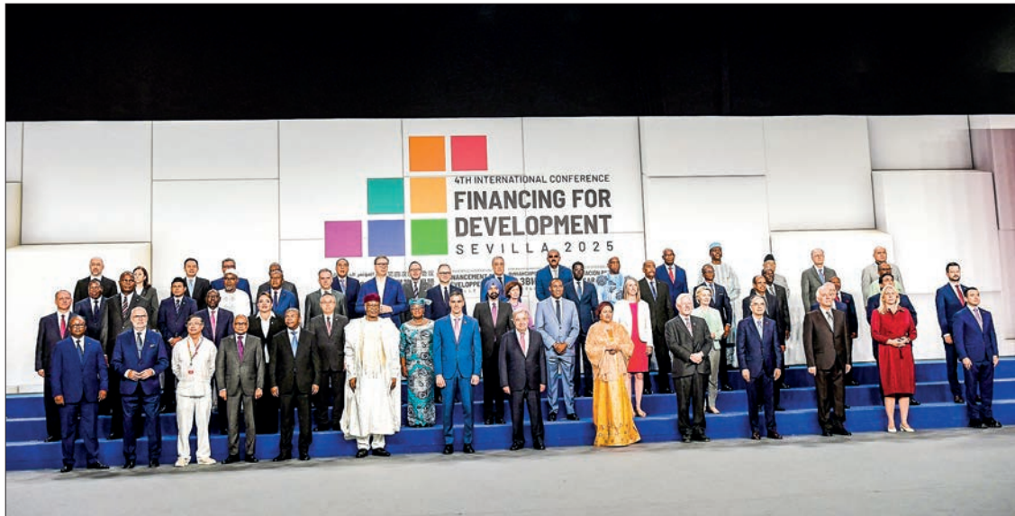
Spanish Prime Minister Pedro Sanchez (CL) and United Nations Secretary-General Antonio Guterres (CR) pose for a family photo with the rest of heads of state and representatives attending the United Nations 4 th International Conference on Financing and Development in Seville, on 30 June 2025.

Opening a UN aid conference in Spain, Guterres said delegates were gathered "to repair and rev up the engine of development to accelerate investment" faced with the "massive headwinds" buffeting the