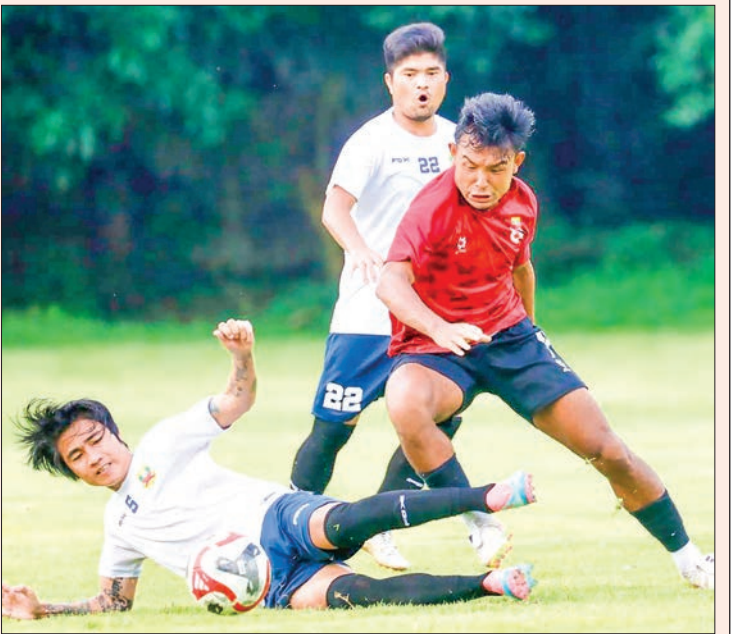
The Myanmar U22 team and Shan United are seen in a warm-up match on 30 June.

MYANMAR U22 football team is taking intensive training as part of preparations to take part in the AFF U23 Championship 2025 to be held in mid-July this year.