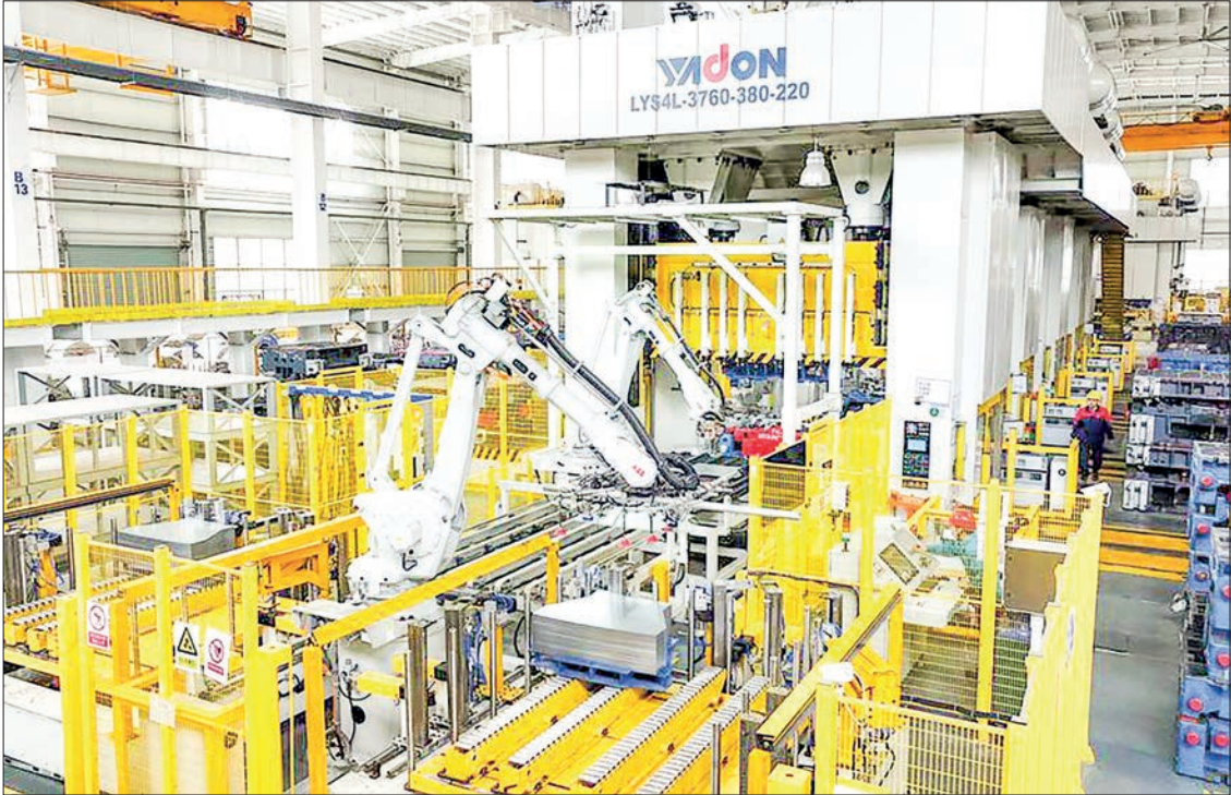
Robotic arms operate at a workshop of an auto parts manufacturing company in Feixi County of Hefei, east China’s Anhui Province, 31 March 2025.

Monday’s data also showed that the non-manufacturing PMI came in at 50.5 in June, up 0.2