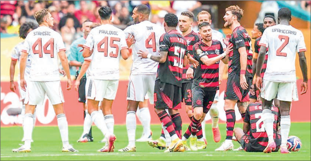
Players react during the round of 16 match between CR Flamengo of Brazil and Bayern Munich of Germany at the FIFA Club World Cup 2025 at the Hard Rock Stadium, Miami, Florida, the United States, 29 June 2025.

Portugal international Neves opened the scoring for the European champions by meeting a sumptuous free-kick from compatriot Vitinha to head home at the far post. Neves then combined with Fabian Ruiz for an easy tap-in after Sergio Busquets gave the ball away in front of his own box.