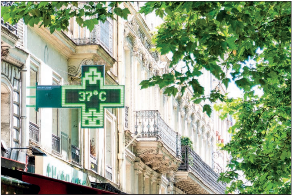
This photograph shows a pharmacy sign indicating a temperature of 37 degrees Celsius in Paris on 30 June 2025.

"We didn't anticipate it being so hot," said her daughter-in-law, Valentine Jung. "It's a good thing we've got air-condi-