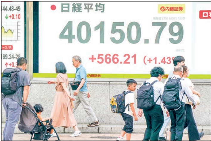
Pedestrians walk in front of an electronic quotation board displaying the Nikkei Stock Average closing price at 40,000 yen level on the Tokyo Stock Exchange in Tokyo on 27 June 2025.

High-tech manufacturing — a key pillar of the industrial transformation — saw its value-added output jump 8.6 per cent year on year in May. The output of new energy vehicles and solar cells surged by 31.7 per cent and 27.8 per cent, respectively, continuing their rapid growth trajectory. — Xinhua