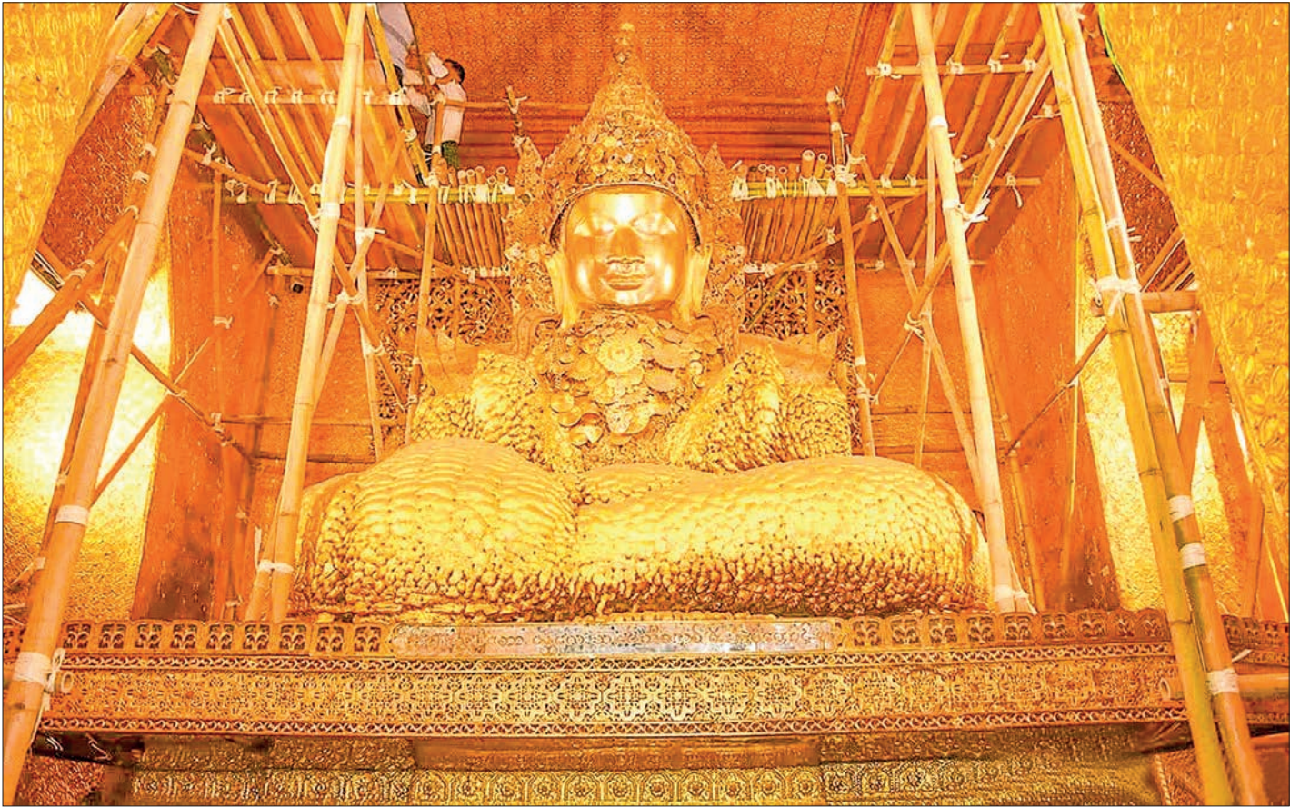
Restoration is underway at the Mahamuni Pagoda in Mandalay.

Pagoda now open to public every Sabbath day