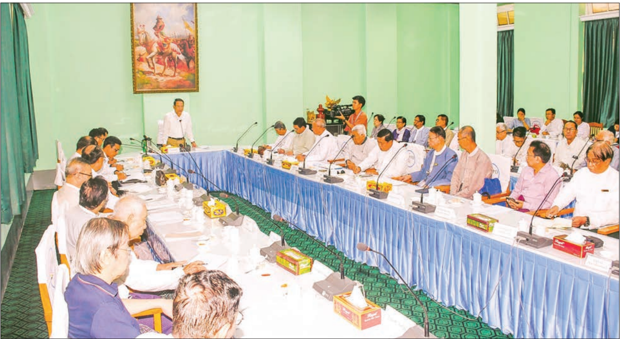
Union Minister U Maung Maung Ohn speaks at the meeting with members of the National Literary Award Selection Committee and the Sarpay Beikman Manuscript Award Selection Committee in Yangon yesterday.

various forms since 1948 up to the present day. He also urged them to appreciate and honour the experts who have dedicated themselves to the literature. First Vice-Chair U Sein Hlaing (Thura Zaw) of the National Literary Award Selection Committee, Chair U Ohn Maung (Myinmu Maung Naing Moe) of the Sarpay Beikman Manuscript Award Selection Committee and attendees participated in the discussion, and the Union minister provided proper instructions. — MNA/KTZH