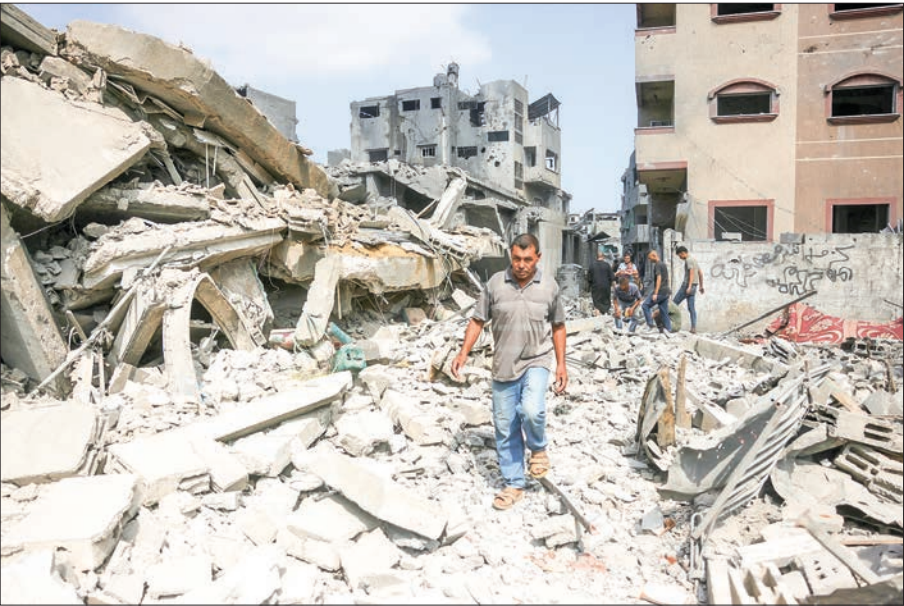
A Palestinian man walks next to the rubble of a residential house that was hit in overnight Israeli strikes in Jabalia in the northern Gaza Strip on 30 June 2025, as the war between Israel and the Hamas Islamist militant movement continues.

Meanwhile, on the ground, Gaza's civil defence agency said that 34 people had been killed by Israeli strikes or gunfire since midnight.