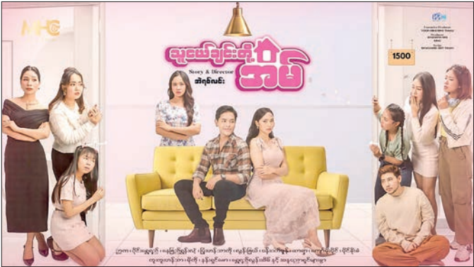
Lead actors from the Friends' House movie featured in the promotional poster.

THE Myanmar television drama series titled 'Thungechin Doh Ein' (Friends' House) will begin airing on Fortune TV from 5 July, broadcasting every Saturday and Sunday at 8:30