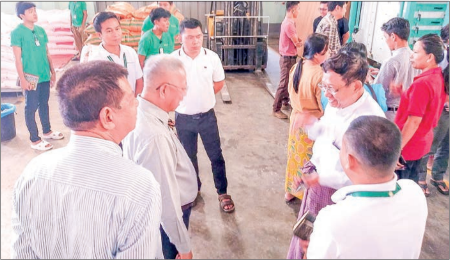
Discussions are underway to open the rice processing technology course.

modation and food. This free-of-charge course is employment-guaranteed training at rice mills and companies upon completion. This course is tailored to those who attended AGTI, those with industrial experience in rice milling businesses, and those who have worked for factories. Those who passed the entrance interview will be notified. The course is trying to provide effective learning with a curriculum. Curriculum experts also went on a curriculum research tour to the SITE and Shwewah Yaung Rice Mill, Sein Lae Myay Rice Mill and Good Brothers Rice Mill on 24 June.