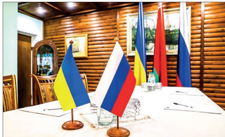
Photo taken on 7 March 2022 shows a view of the third round of talks between Russian and Ukrainian delegations at the Belovezhskaya Pushcha.

The US scheme for arms supplies to Ukraine is business, Kremlin spokesman Dmitry Peskov added. "This is business. There were deliveries before. No one stopped them. It is just a question of who pays for them," Peskov told reporters when asked to assess US President Donald Trump's decision to sell weapons to Europe so that they can supply them to Ukraine. — SPUTNIK