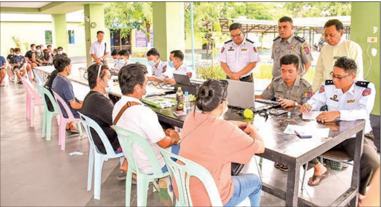
Myanmar Immigration and officials processing undocumented foreign entrants.

Thailand to their respective countries, while arrangements are being made to deport the remaining 192 individuals. These individuals are currently under detention while awaiting repatriation. The government is strictly cracking down on online scams and online gambling by cooperating with other countries, including neighbouring countries. — MNA/KTZH