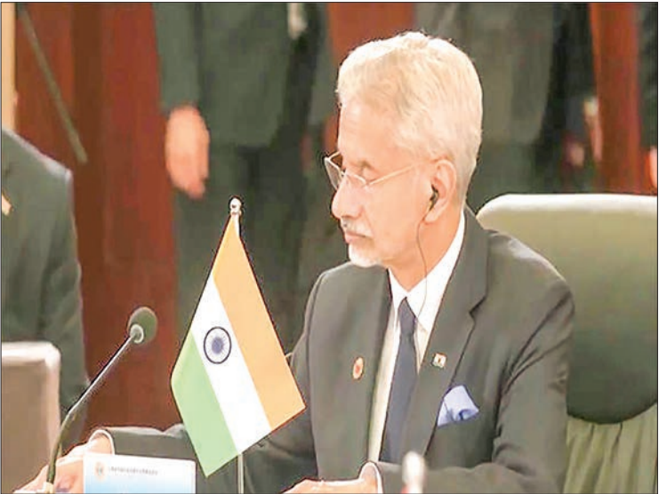
External Affairs Minister S Jaishankar highlighted that India is taking a leading role in promoting innovation, startups, traditional medicine, and digital public infrastructure within the Shanghai Cooperation Organization (SCO).

proach new ideas and proposals that are genuinely for our collective good,” he wrote. He also pointed out that deeper regional collaboration requires more trade, investment, and connectivity. However, he raised concerns about the lack of assured transit within the SCO region, calling it a major barrier to economic cooperation. — ANI