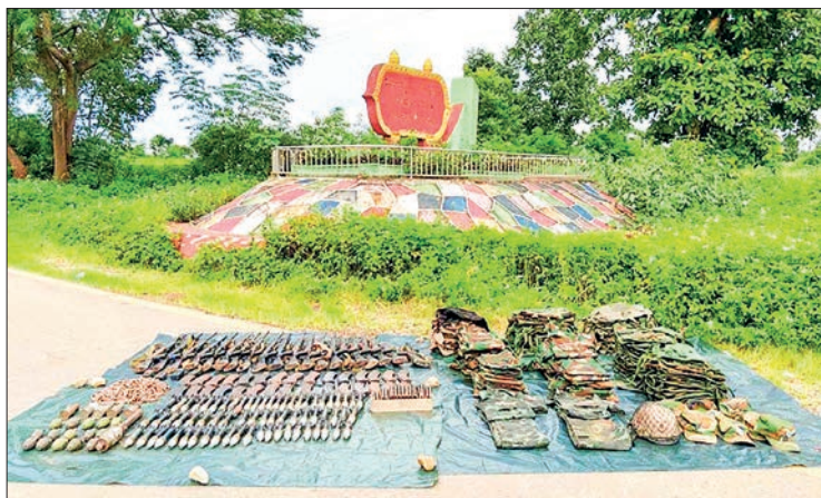
This photo shows firearms and ammunition seized from terrorists.

Tatmadaw deployed commandos, additional troops and administrative orders in Taungkham, and explored the ground situation with the air and heavy weapon support. Starting from 25 August 2024, Tatmadaw launched the Counter-Terrorism Operation in certain areas controlled by the terrorists. On 28 February 2025, Tatmadaw re-controlled the routes that con-