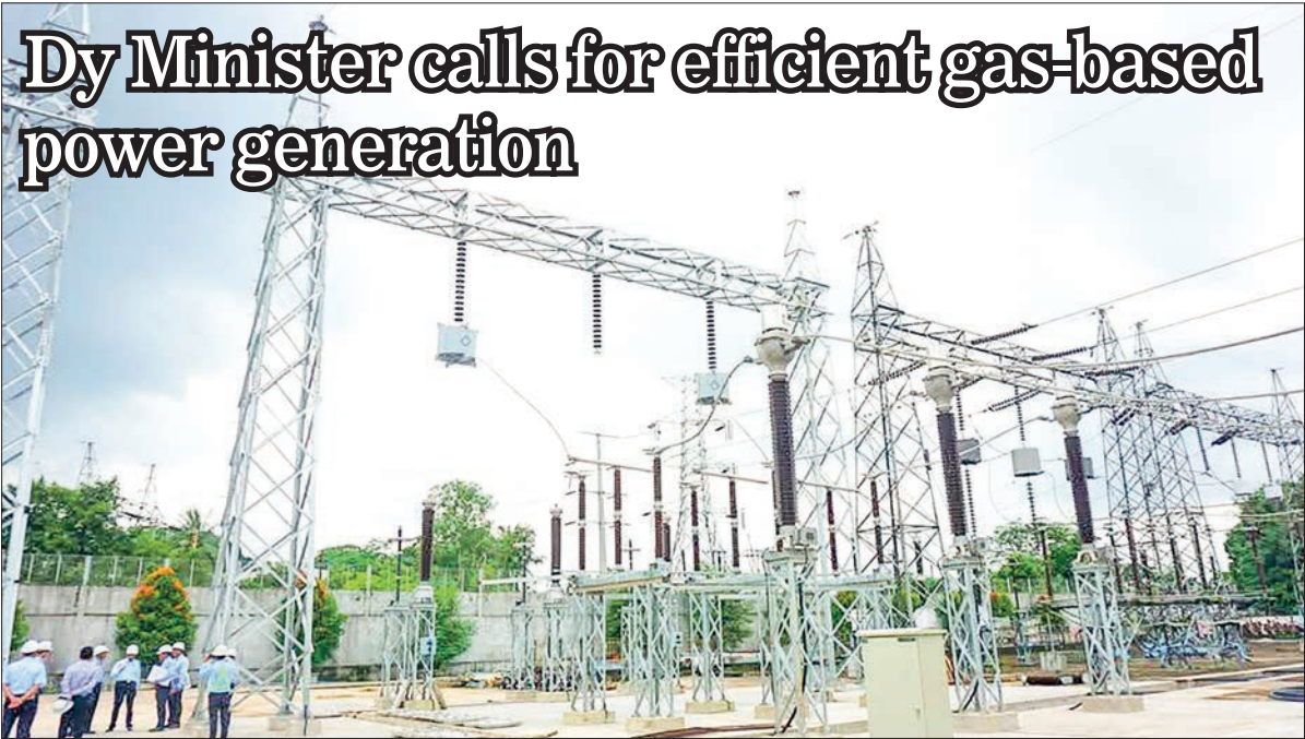
The 230-kVA Hlawga Main Power Station.

At present, the majority of visitors are locals, though the tourist arrival is likely to mount in peak season, Thadingyut. “The arrival of foreigners seems larger when the weather is cold. But local visitors have made travelling as long as they feel convenient, and when it doesn’t rain a lot,” he said. Currently, local tourists have gone on vacation in Hpa-an, Bagan-NyaungU, Bago and resorts on the outskirts of Yangon. — MT/ZS