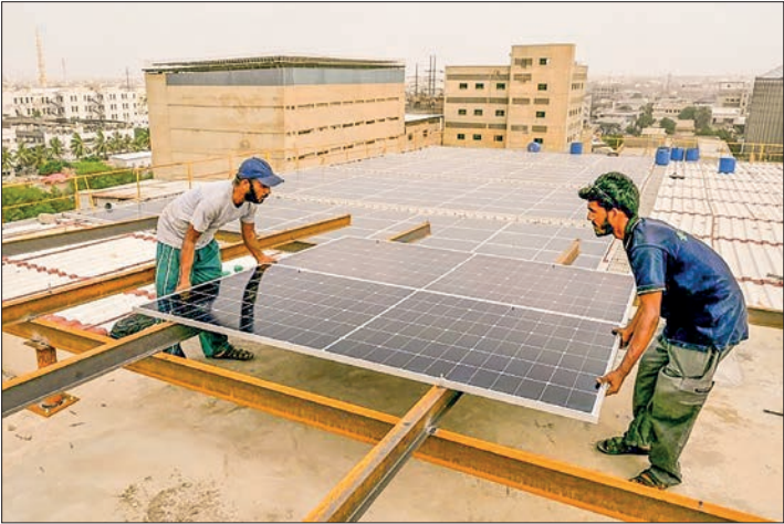
Pakistan has unexpectedly surged towards its target of renewable energy, making up 60 per cent of its energy mix by 2030. PHOTO: AFP

PAKISTAN is experiencing a significant shift towards solar power, with an increasing number of households opting for rooftop solar panels to escape the burdens of the national grid. In Karachi, residents like Fareeda Saleem have turned to solar power for uninterrupted electricity, despite the initial installation costs. After being cut off from the grid due to unpaid bills, Saleem sold her jewelry and borrowed money to purchase solar panels, an inverter, and a battery for energy storage. — AFP