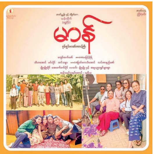
A poster for the film 'Mahn'.