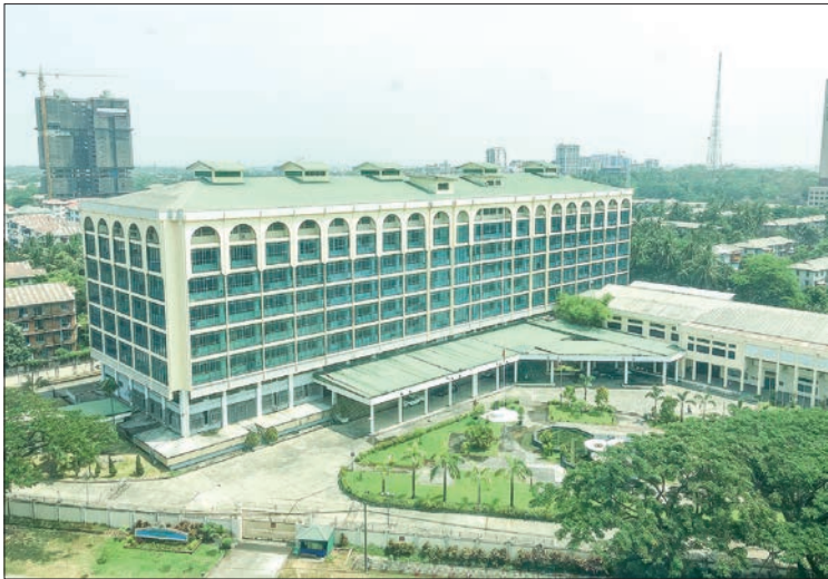
File photo shows the Central Bank of Myanmar (CBM) Yangon Branch.

THE Central Bank of Myanmar (CBM) announced on 15 July that it would pump US$33 million into the fuel oil industry. In addition to an injection of over 324,360 yuan into the financial market, CBM sold over $771,290 million to the edible oil-importing companies on that day. CBM sold over $757,230 and 1.426 million yuan on 14 July. Furthermore, CBM sold over $1.58 million to edible oil-importing companies and over $359,230 to commodities-importing companies as well. CBM sold over $1.7 million to edible oil-importing companies on 11 July 2025. CBM sold over $1.5 million purchased from CMP companies to edible oil-importing companies on 10 July, in addition to an injection of $621,000 and 600,000 yuan