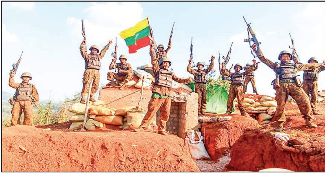
Tatmadaw members seen on a hill near Taungkham where they recaptured from terrorists.

Due to their sudden ambush, Tatmadaw officers, other ranks and convoys defended to lose their outposts and headquarters, sacrificing their lives. However, the dead and injured became high, and also due to the high numbers of terrorists, Tatmadaw members retreated to intermediate positions and cooperated with the bases of Taungkham and PyinOoLwin. Then, they established a temporary defence