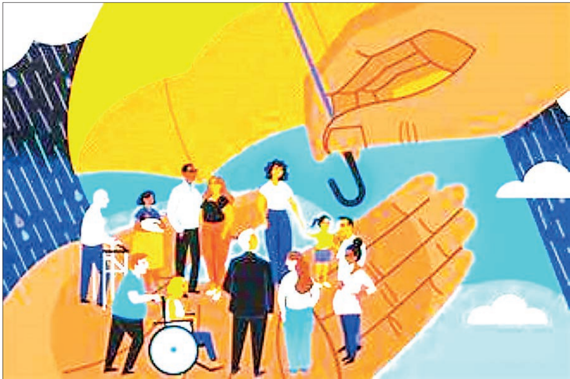
Public health surveillance provides the scientific and factual database essential to informed decision-making and appropriate public health action. The key objective of surveillance is to provide information to guide interventions.

One of the most important reasons for public health surveillance is the early detection of disease outbreaks. By continuously monitoring health data, public health officials can quickly identify unusual patterns or increases in illness. For example, if surveillance systems detect a sudden rise in flu cases, they can alert healthcare providers and the public, allowing preventive measures such as vaccination campaigns or public advisories to be put in place.