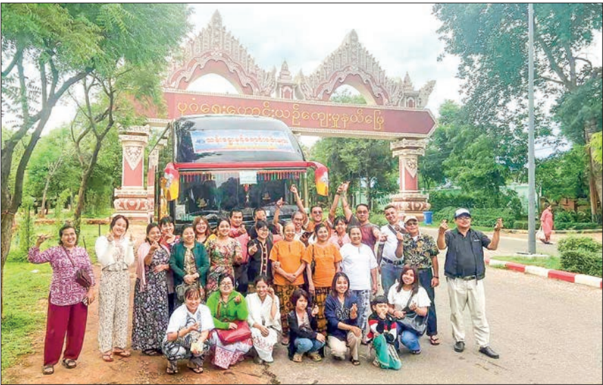
Vacationers in Bagan during monsoon.

THE arrival of visitors to Bagan has been normal, but it has been seen usually larger on public holidays, according to residents. The visitor arrival has been low generally in monsoon when compared to that of the peak season, not meaning a complete halt, but normal. “This is monsoon, so the arrival of visitors is just moderate, but many pilgrims visit on weekends and holidays. We have loads of visitors on Full Moon Day of Waso,” said a resident.