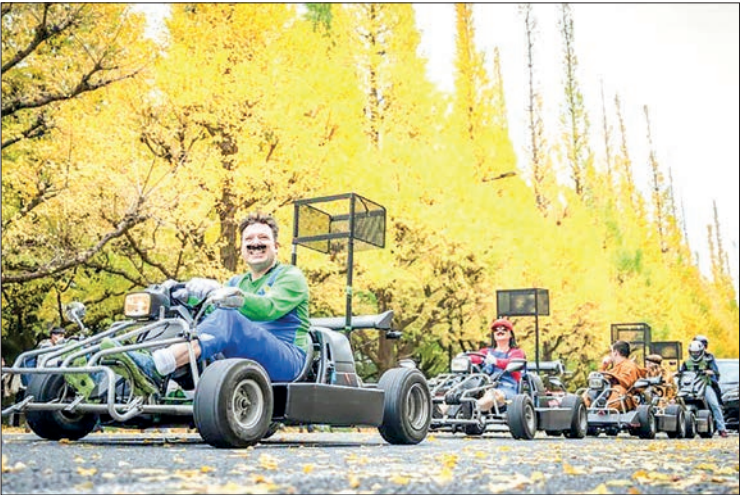
People drive go-karts while dressed in Super Mario costumes in Tokyo in 2022.

Tokyo company that operates go-karting tours, with flames spreading to its parked go-karts. Nearby walls were also burned, but the fire was quickly extinguished, police said. Public broadcaster NHK quoted the suspect as telling investigators that he was "stressed out by the engine noise of the go-karts". His workplace was reportedly located adjacent to the scene of the fire. The go-karting operator received a letter in May threatening to "set karts aflame if engines are turned on after tomorrow", NHK reported, adding that police were probing a link to the arson attack. — AFP