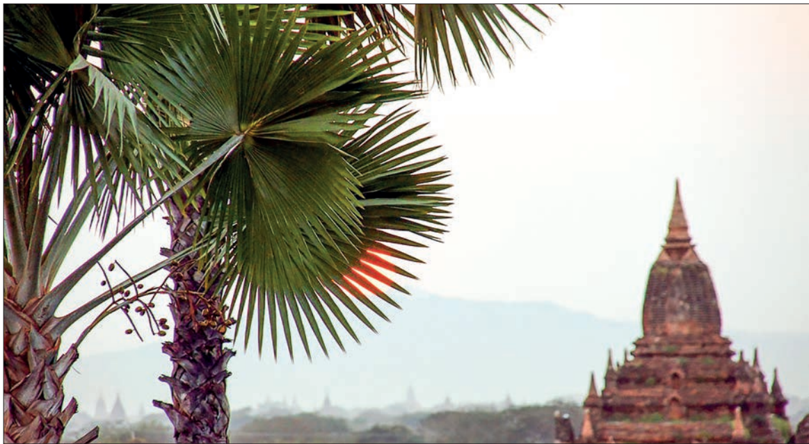
Native language teachers must enhance their methods, study language intricacies, and engage students with humour and relevant content. ILLUSTRATION: PIXABAY

OF THE world's languages, the Myanmar language is included in the global linguistic field as a great language, as far as I can see. Most people say that the English language is easy to learn but hard to master. On the contrary, the Myanmar language will be difficult to study as well as to have a good command, particularly if the learner is not a native speaker. In the Myanmar curriculum for high schools of our nation, the subject of the Myanmar language is categorized into three sessions: Part I, Speaking Lessons, Part II,