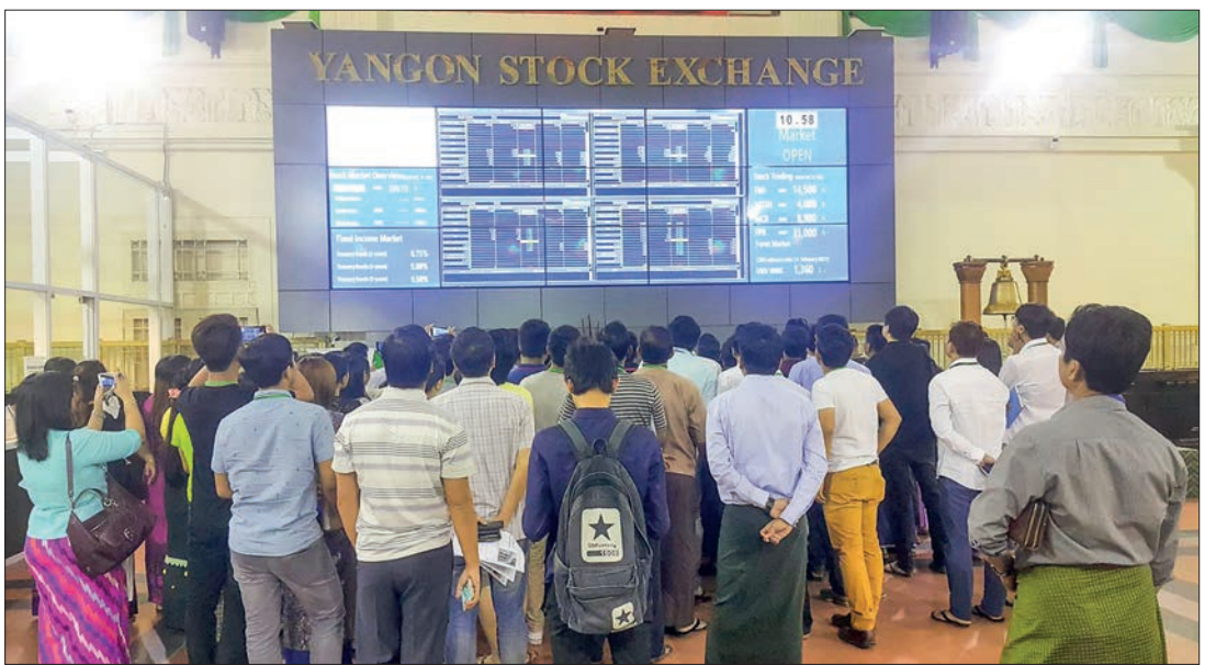
Shareholders observe the index panel at the Yangon Stock Exchange.

THE grand trading value of the eight listed companies on the Yangon Stock Exchange (YSX) totalled K522 million from 187,634 shares traded in June 2025, according to YSX's statistics. At present, shares of eight listed companies: First Myanmar Investment (FMI), Myanmar Thilawa SEZ Holdings (MTSH), Myanmar Citizens Bank (MCB), First Private Bank (FPB), TMH Telecom Public Co Ltd (TMH), the Ever Flow River Group Public Co Ltd (EFR), Amata Holding Public Co Ltd. (AMATA) and Myanmar Agro Exchange Public Co Ltd (MAEX) are traded in the securities market. MTSH topped the trading on equity with over K170 million from 56,880 shares, followed by FPB with stocks worth K98.8 million from 54,061 shares, FMI with K92.3 million from 14,003 shares, EFR with K45.89 million from 28,533 shares, MAEX with K38.24 million from 12,563 shares, AMATA with K34.22 million from 8,888 shares, TMH with K31.17 million from 11,155 shares and MCB with K11.43 million from 1,551 shares. The stock trading values were estimated at K619.24 million in May, with 176,845 shares traded in May. The stock trading in June is up by over K24 million (39,419 shares) compared to that of May. — NN/KK