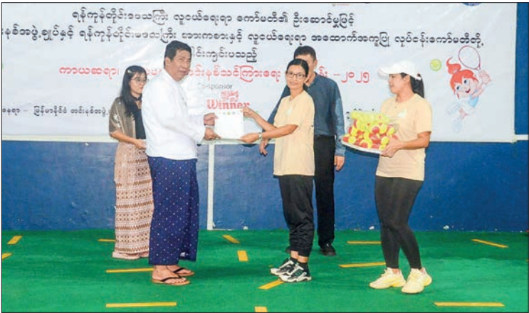
Award presentation to trainees.

THE closing ceremony of the 2025 Tennis Coaching Course, jointly organized by the Myanmar Tennis Federation (MTF) and the Yangon Region Education Office, was held on 14 July at the Theinbyu Tennis Court in Mingala Taungnyunt Township, Yangon Region. This course was offered to physical education teachers from basic education schools across Yangon Region, including teachers from private and international schools. A total of 45 teachers attended the course. The course aimed to inspire student interest in sports, provide fundamental training in tennis and help nurture a new generation of talented tennis