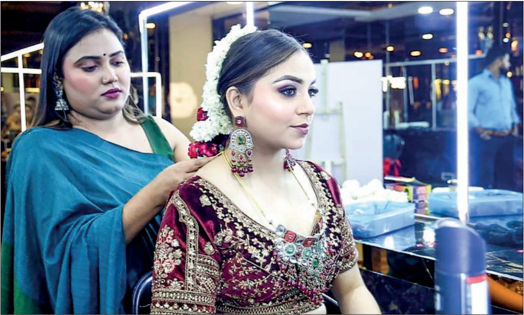
The rising popularity of artificial jewellery was prominently showcased at the Indian Fashion Jewellery and Accessories Show 2025.