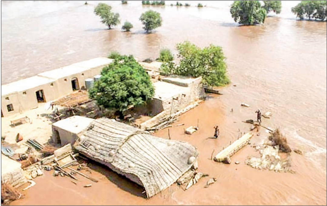
Torrential monsoon rains and flash floods have killed at least 116 people and injured 253 others across Pakistan since 26 June.

Kashmir, while no casualties were recorded in Gilgit-Baltistan and the Islamabad Capital Territory, said the NDMA. The agency has issued a weather alert, warning of potential flash floods in parts of Punjab, Khyber Pakhtunkhwa, and Balochistan provinces, as heavy rainfall is forecast to continue through Thursday. — Xinhua