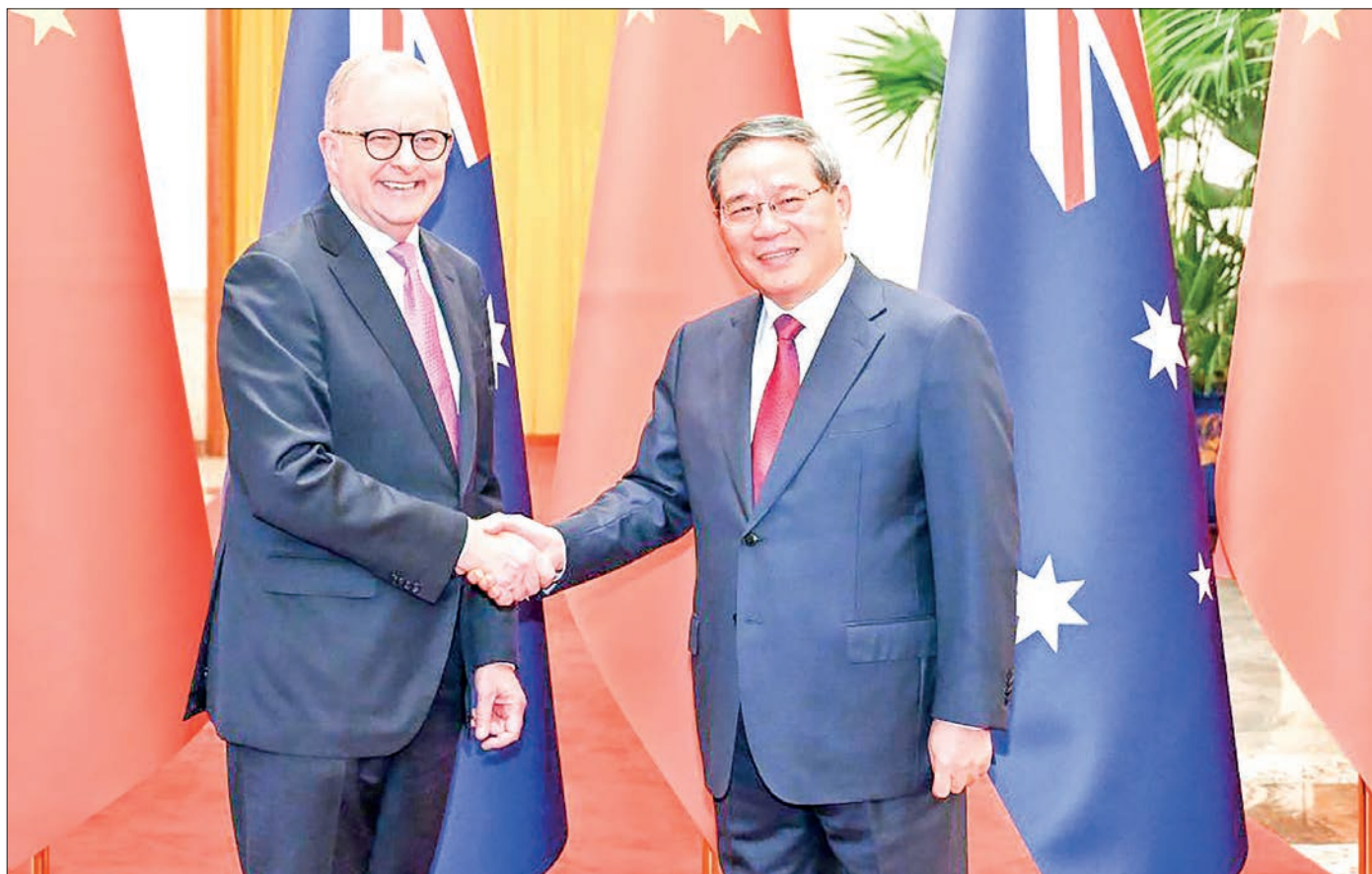
Chinese Premier Li Qiang and Australian Prime Minister Anthony Albanese, who is on an official visit to China, hold the 10 th China-Australia Annual Leaders' Meeting at the Great Hall of the People in Beijing, capital of China, 15 July 2025.

Since its entry into force in 2015, the China-Australia Free Trade Agreement has significantly enhanced bilateral economic and trade relations.