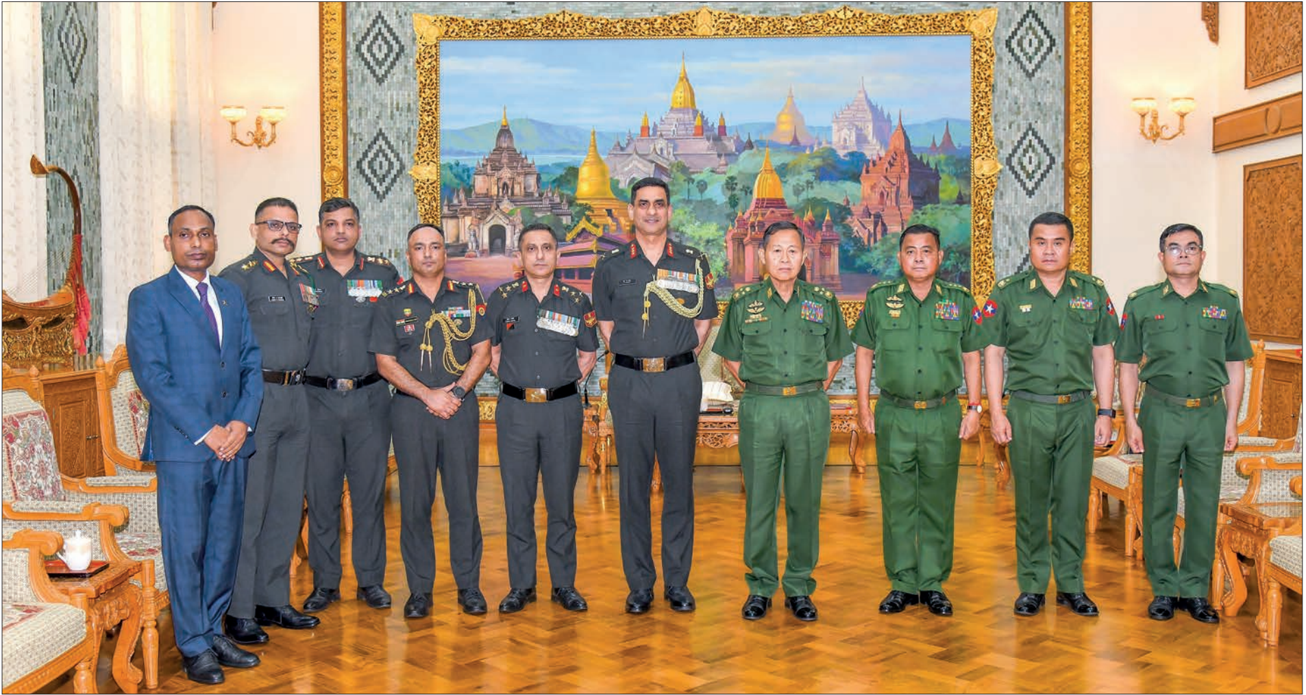
State Administration Council Vice-Chairman Defence Services Deputy Commander-in-Chief, Commander-in-Chief (Army) Vice-Senior General Soe Win pose for the documentary photo alongside the Indian delegation and meeting attendees yesterday.

Plans are underway to further cooperate in peace, stability, the rule of law, security and development in the border area between Myanmar and India.