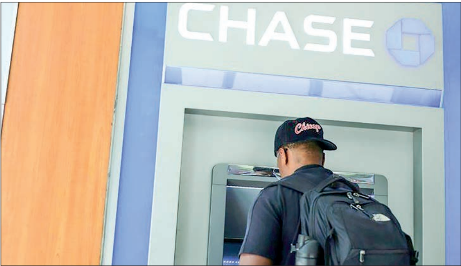
Bank executives said more clients are pushing ahead with decisions despite tariff uncertainty.

LARGE US banks reported results that topped estimates Tuesday as executives pointed to American economic resilience and said businesses were adapting to tariff uncertainty. Executives from JPMorgan Chase and Citigroup described US consumers as still fundamentally in good shape despite continued risks to the outlook. Both banks now see a lower risk of recession compared with April, when they last reported results. Top officials with the banks also