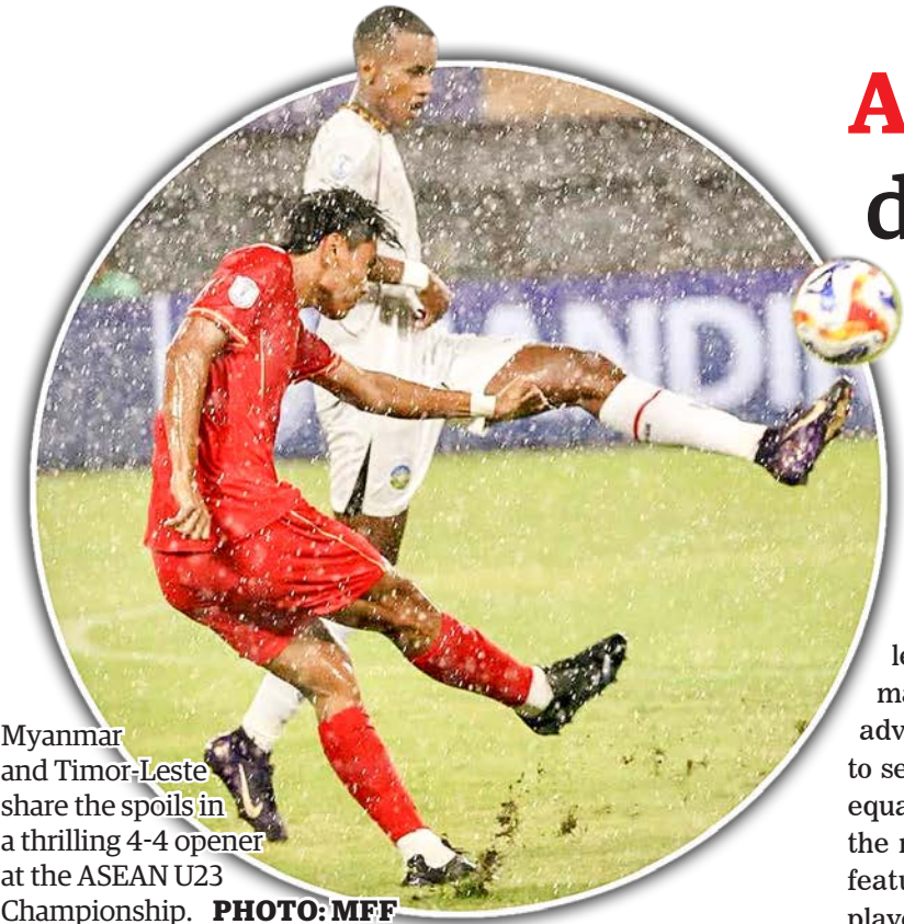
Myanmar and Timor-Leste share the spoils in a thrilling 4-4 opener at the ASEAN U23 Championship.

Myanmar will next face Thailand in their final group match on 22 July. — Ko Nyi Lay/KZL