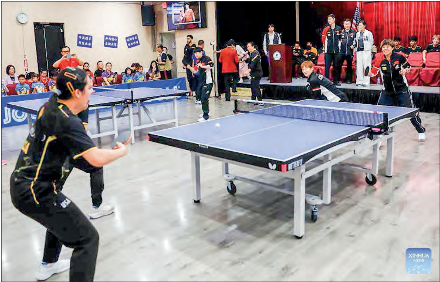
This photo taken on 13 July 2025 shows a view of an event commemorating the 54 th anniversary of “Ping-Pong diplomacy” in Las Vegas, the United States.

CHINESE and US table tennis athletes and local enthusiasts gathered in Las Vegas on Sunday to commemorate the 54 th anniversary of