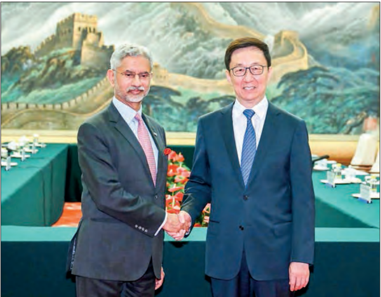
Chinese Vice-President Han Zheng meets Indian External Affairs Minister Subrahmanyam Jaishankar in Beijing, capital of China, 14 July 2025.

Noting that China and India are both major developing countries and important members of the Global South, Han said it is the right choice for both sides to be partners contributing to each other’s success. — Xinhua