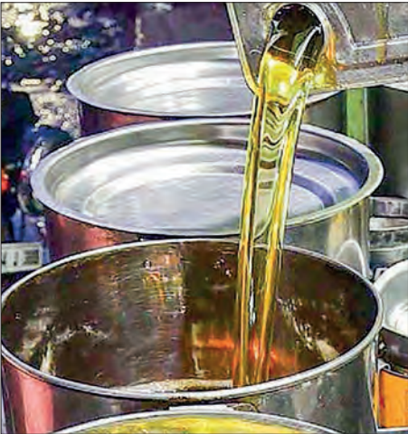
Vendors prepare cooking oil for sale.

The domestic consumption of palm oil is estimated at one million tonnes per year. The local palm oil production is just about 400,000 tonnes. About 700,000 tonnes of palm oil are yearly imported through Malaysia and Indonesia to meet domestic demands. — NN/KK