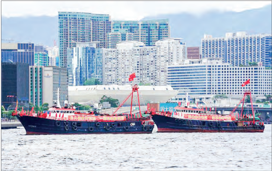
Fishing vessels cruise at Victoria Harbour in Hong Kong, south China, 1 July 2025.

PAUL Chan, financial secretary of the Hong Kong Special Administrative Region (HKSAR) government, on Sunday highlighted the growing significance of regional cooperation amid changing global dynamics and affirmed Hong Kong’s commitment to foster multi-layered interactions with various economies in the region to solidify the foundation for collaboration.