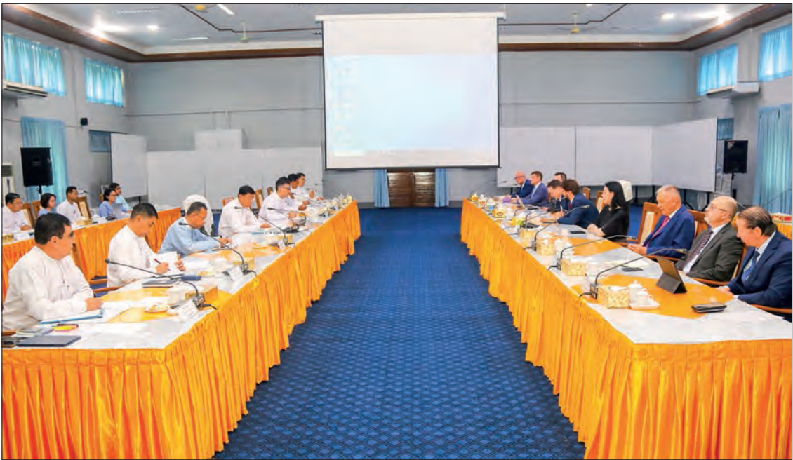
State Administration Council Member Deputy Prime Minister Union Transport & Communications Minister General Mya Tun Oo meets the Russian delegation in Nay Pyi Taw.

Union Minister for Investment and Foreign Economic Relations Dr Kan Zaw, Union Minister for Electric Power U Nyan Tun, Union Minister for Commerce U Tun Ohn, Union