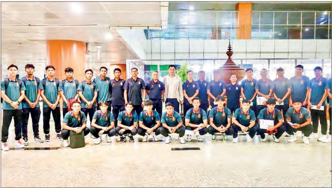
Myanmar U23 squad seen with officials at the lounge of Yangon International Airport.

Cambodia and Laos. Group C includes Thailand, Myanmar and Timor-Leste. The Myanmar team will play the group match with Timor-Leste on 16 July and with Thailand on 22 July. The top teams from all groups and the best second-positioned team will have the chance to advance to the semifinals. Myanmar youth squad is