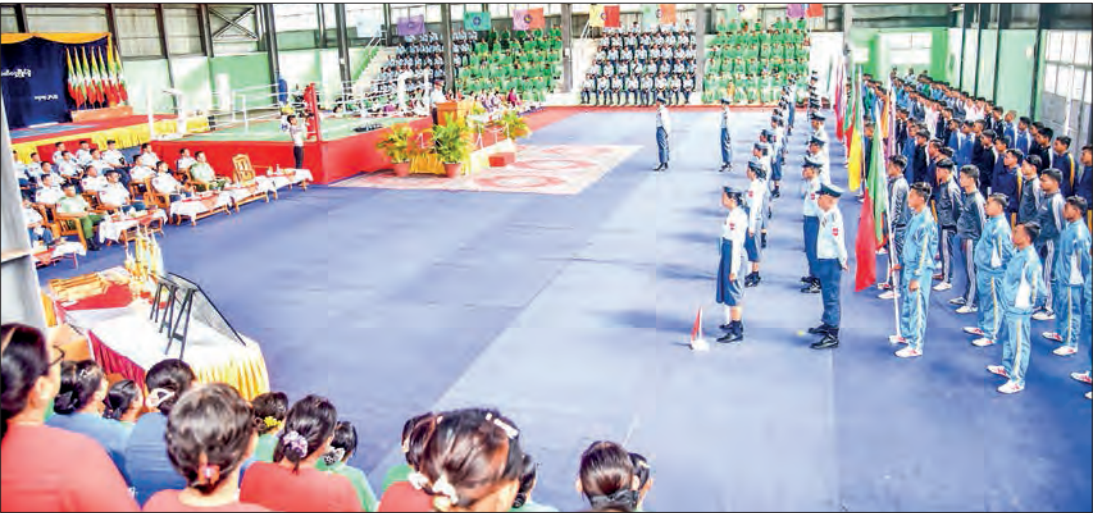
The launch of the 31 st Commander-in-Chief (Air) Boxing Championship in action yesterday.

SENIOR air force officers, Tatmadaw members and family members of Tatmadaw (Air), representatives from the Myanmar Boxing Federation, competing athletes, and sports fans attended the 31 st Commander-in-Chief (Air) boxing cham-