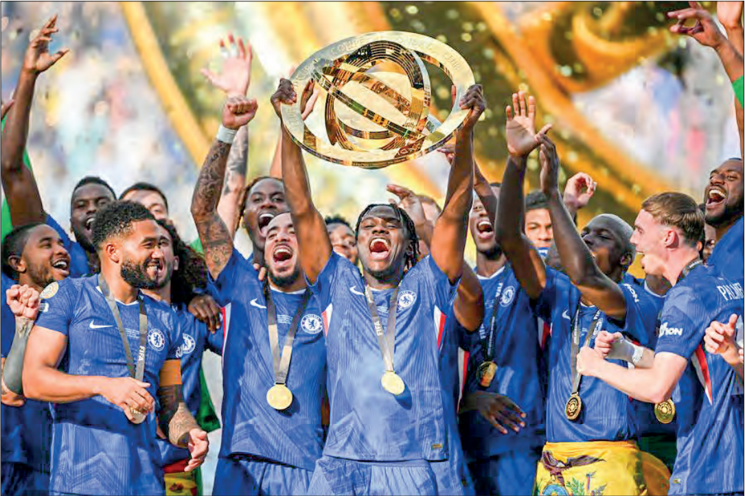
Players of Chelsea FC celebrate with trophy during the award ceremony after their final win over Paris Saint-Germain at the FIFA Club World Cup 2025 at the MetLife Stadium, New Jersey, the United States, 13 July 2025.

corner again. Palmer capped his brilliant half in the 43 rd minute, carrying the ball through midfield before threading a pinpoint pass behind the defence for Pedro, who calmly finished to make it 3-0. PSG pushed for a response in the second half, but Chelsea goalkeeper Robert Sanchez denied several attempts, including a close-range effort from Ousmane Dembele in the 53 rd minute. — Xinhua