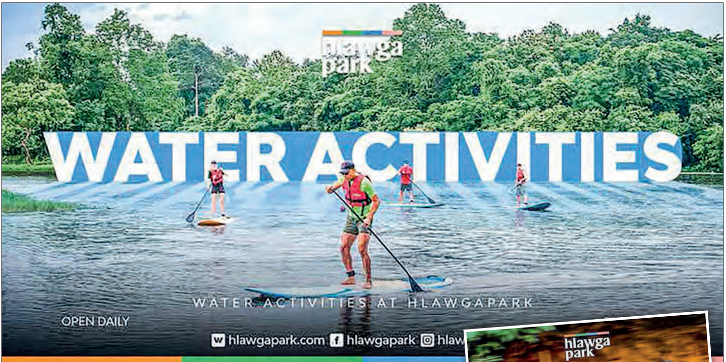
Images showcase activities inviting to the Hlawga Park.

The park welcomes everyone – from individuals to families and friends – to enjoy its fun activities, open daily from 8 am to 5 pm.