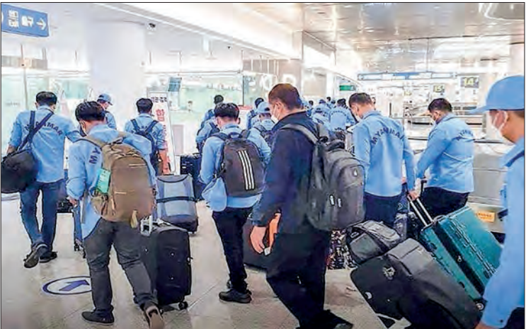
Myanmar workers are at the airport to leave for Korea.

Copy of colour-printed passport, three passport photos, original health test record,