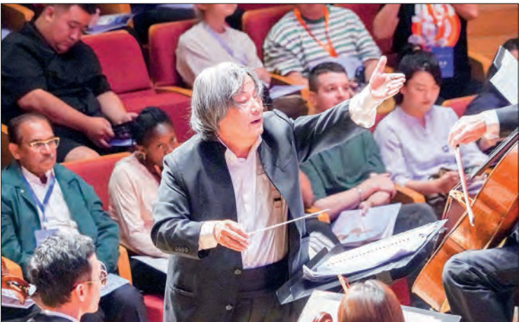
Conductor Tang Muhai conducts at the opening concert of the 2025 Schoenfeld International String Competition in Harbin, northeast China’s Heilongjiang Province, on 13 July 2025.