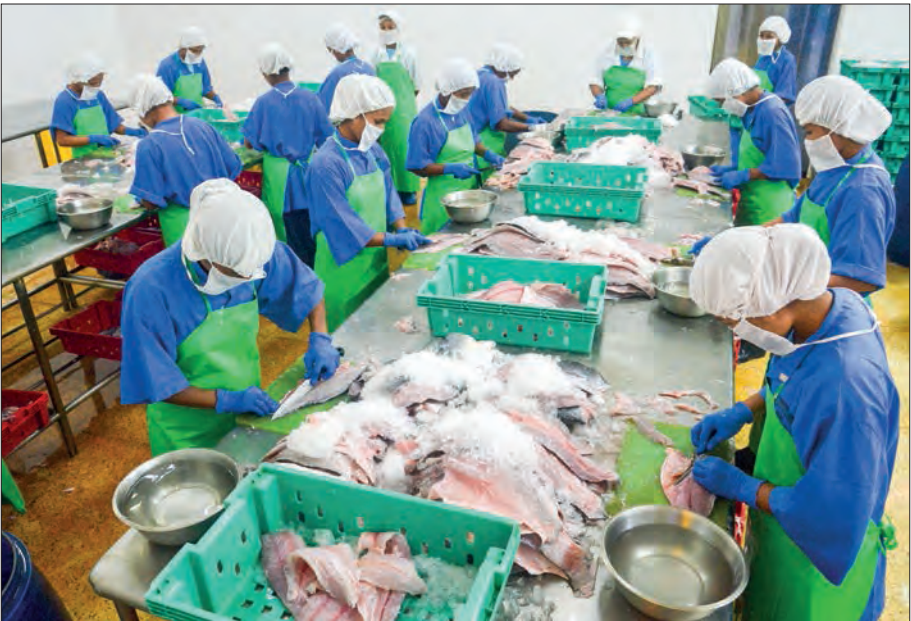
Workers diligently operate the fishery production line at the cold storage facility.

July 2025, 3,704 applications by 1,777 factories have been forwarded to the GACC through the Agriculture Department (3,529 applications), the Fisheries Department (152), the Livestock Breeding and Veterinary Department (14) and the Food and Drug Administration Department (nine).