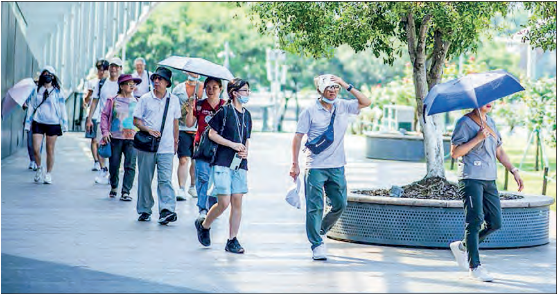
Tourists visit Qianjiang New City in Hangzhou, east China's Zhejiang Province, 3 July 2025.

According to forecasts, the heatwave will continue to spread in the coming days, with 15 to 16 July anticipated to be the peak