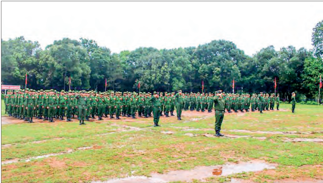
The opening event of the People's Military Service Training 15 is underway yesterday.

THE opening ceremonies for the People’s Military Service Training 15 were held at various military commands yesterday. Eligible citizens attended the military training in their respective regions. The commanders of training depots gave opening speeches.