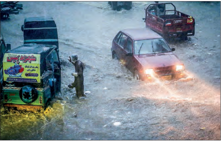
Commuters make their way through a flooded road during heavy monsoon rains in Hyderabad, Sindh province, on 14 July 2025.

Meanwhile, the national meteorological service has issued a warning for further heavy rainfall in the northern and eastern regions of the country, with the potential for urban flooding, landslides, and infrastructure damage due to