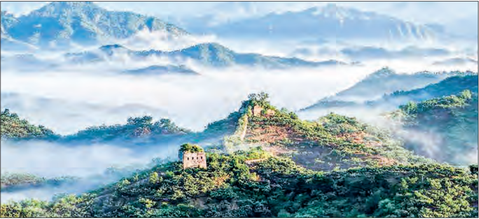
An aerial drone photo taken on early 13 July 2025 shows a view of the Hongshankou Great Wall in Zunhua City, north China's Hebei Province. to reduce waiting times and improve the travel experience. The surge has been driven by China's continued easing of entry policies for foreign visitors. — Xinhua

CHINA is witnessing a surge in foreign tourist arrivals as the summer vacation season kicks off, with more international travellers drawn to the country's unique blend of ancient culture and modern vitality. According to official data, Beijing's ports of entry handled over 640,000 inbound and outbound travellers between 1 and 10 July, including 171,000 foreign tourists, marking a 22.1 per cent year-on-year increase. A total of 2.56 million foreign travellers entered China through Shanghai's Pudong and Hongqiao international airports in the first half of this year, marking a 44.7 per cent year-on-year increase. To meet the growing demand, immigration authorities at major border checkpoints have introduced a range of measures