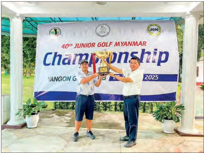
An awarding ceremony for the 40 th JGM is in progress.

THE 41 st Junior Golf Myanmar Championship (JGM) will be held for three days, said Junior Golf Myanmar. Jointly organized by Myanmar Golf Federation and JGM and mainly sponsored by Myanmar Max Purified