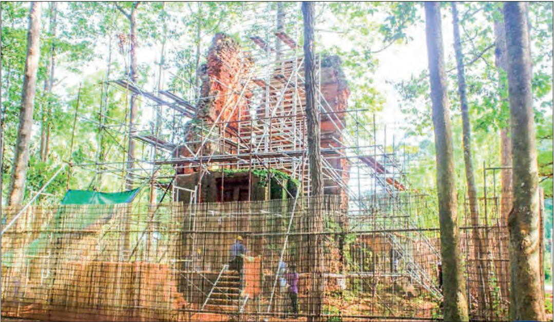
This photo taken on 9 July 2025 shows restoration site of the ninth dilapidated brick tower of Bakong temple in Siem Reap province, Cambodia.