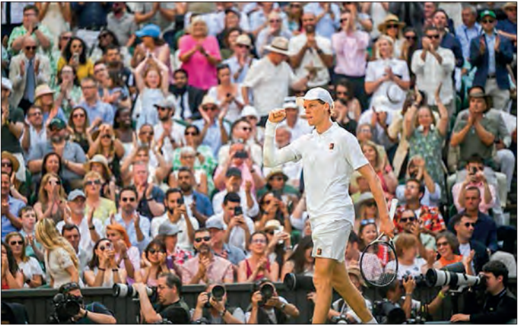
Jannik Sinner celebrates scoring during the men's singles final against Carlos Alcaraz of Spain at the Wimbledon Tennis Championships in London, Britain, 13 July 2025.

WORLD No 1 Jannik Sinner held off defending champion Carlos Alcaraz 4-6, 6-4, 6-4, 6-4 to win his first Wimbledon title on Sunday. The top seed avenged his heartbreaking French Open loss to Alcaraz five weeks ago with a commanding performance, breaking the second-seeded Spaniard once in each set to secure his fourth Grand Slam title. After failing to convert three championship points in the fourth set of the French Open final, Sinner made no mistake this time. Facing a similar scenario at Wimbledon, he sealed the match on his second championship point with a thunderous serve. The Italian downplayed his win, saying he had benefited from fine margins. "The differences are