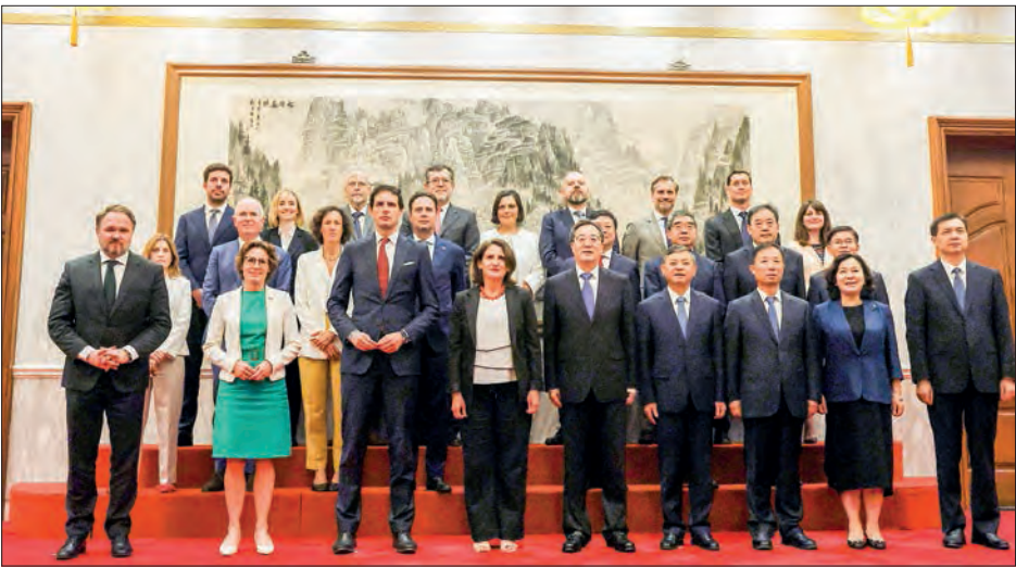
Chinese Vice-Premier Ding Xuexiang (front row centre R), EU Executive Vice-President for a Clean, Just and Competitive Transition, Teresa Ribera (front row centre L) and EU Commissioner for Climate, Net Zero and Clean Growth Wopke Hoekstra (front row 3 rd L) pose for a group photo with other members of the delegation during the China-EU Sixth High Level Environment and Climate Dialogue (HECD) at the Diaoyutai State Guesthouse in Beijing on 14 July 2025.

He said that China attaches great importance to ecological and environmental protection and responding to climate change, has formulated and implemented a series of practical measures,