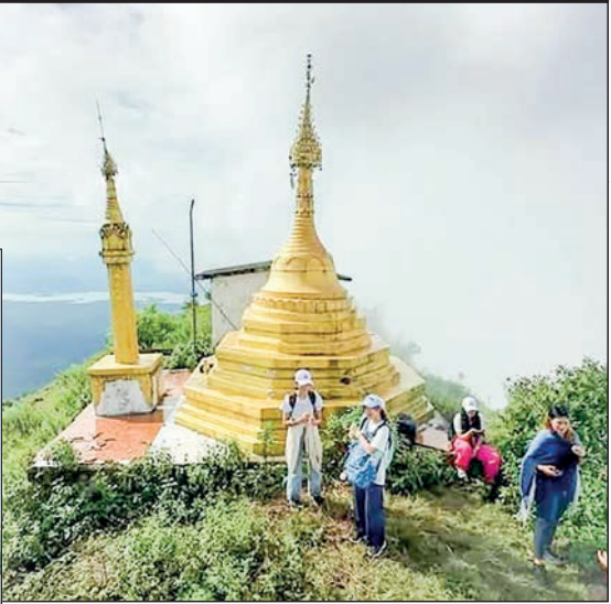
Photos show some of the hiking trails and hikers on their way to Mount Popa.

THERE has been a high number of tourists climbing Mount Popa in December, according to Popa locals. Since the Thadingyut holidays, they have seen a steady flow of tourists to Mount Popa with daily arrivals during December, the best time to climb, and hundreds of visitors during the holidays. “In December, we have the highest number of tourists climbing Mount Popa. There are more visitors than the previous festival