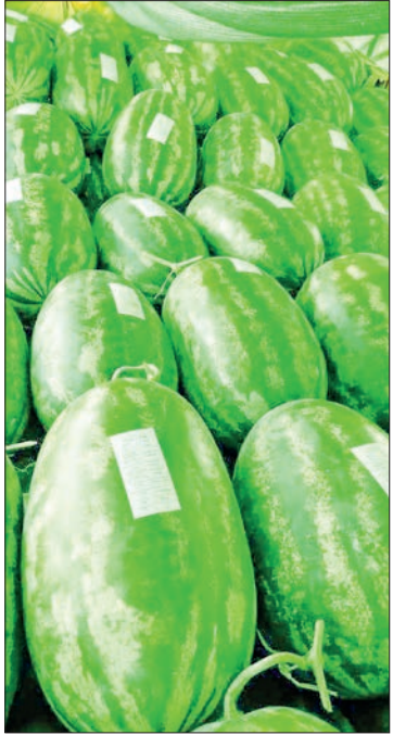
Watermelon in Yangon fruits market. made the consumption of watermelon enlarged in Yangon.

IT is expected that the watermelon and muskmelon prices will increase this year, hoping to help farmers enjoy profits. In Kyaukse Township, muskmelon season hasn't fallen yet but the yield is likely to decline as the number of growers has been fewer plus transportation barriers, however there is likelihood of price increased. "It isn't the harvest season yet. Muskmelon season begins in late January. In this year, the number of farmers has been low so the production is expected to decline. As a result, the price will be high and demand will be high too. So this is a year that can make farmers happy," said a muskmelon farmer in Kyaukse Township. In March, watermelon price was good depending on size and extreme summer heat