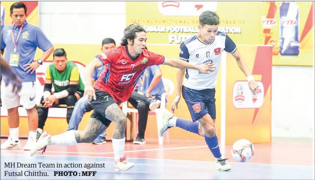
MH Dream Team in action against Futsal Chitthu.