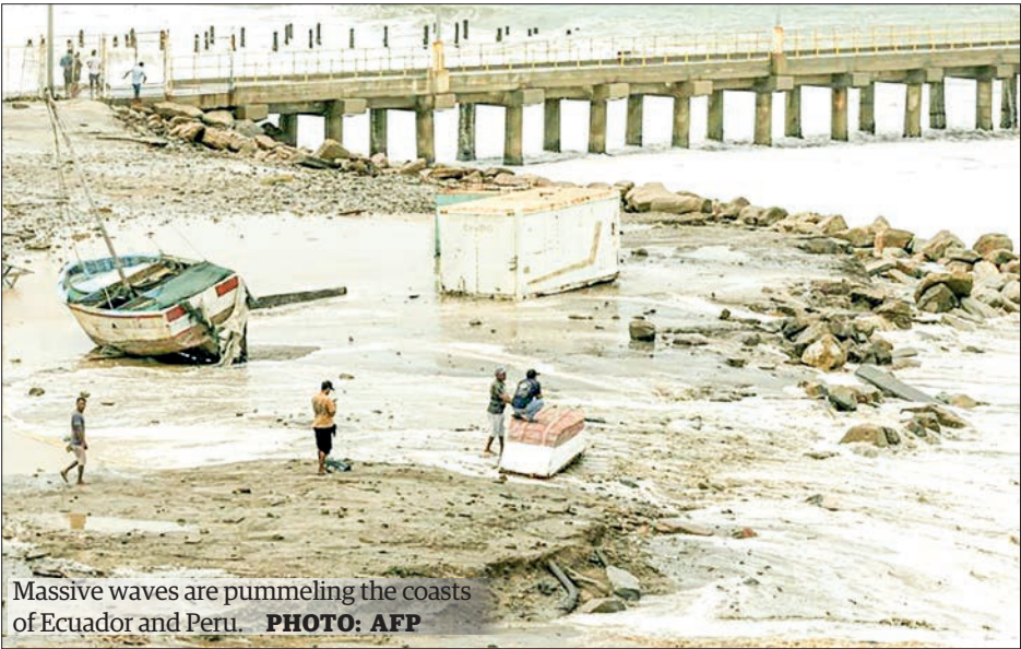
Massive waves are pummeling the coasts of Ecuador and Peru.

MASSIVE waves of up to 13 feet (four metres) are pummeling the coasts of Peru, leaving scores of ports closed on Saturday, authorities said. Peru closed 91 of its 121 ports until 1 st January, the National Emergency Operations Centre said on its X social media account. Callao, which sits adjacent to the capital Lima and is home to Peru’s largest port, has closed several beaches and barred tourist and fishing boats from venturing out. Many beaches along the central and northern stretches of the country were closed to prevent risk to human life, authorities said. Dozens of fishing boats were damaged, while those that were spared were still unable to work in the dangerous con-