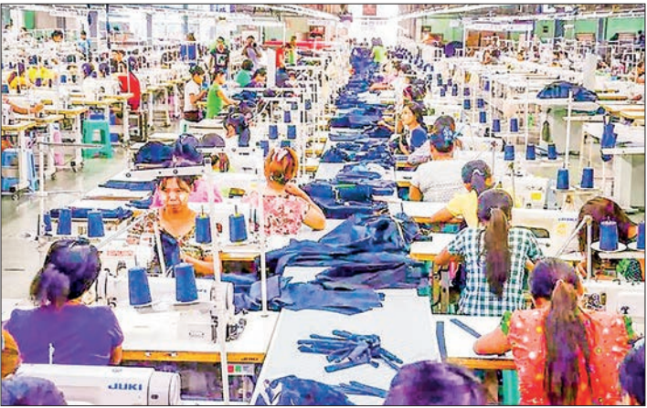
Previously permitted CMP system garment industry in Yangon Region.

There are about 35 fermented bean paste making businesses in NyaungU and Ngathayauk, from there, fermented bean paste are distributed under different brand names across Myanmar, through wholesalers. They sell fermented bean paste in dried and wet types and cook it into mild sweet flavour and sour flavour. Now, fermented bean paste making industry has been flourishing. — Thit Taw/ZS