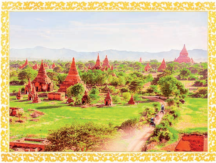
Bagan landscape.

( An excerpt from the speech delivered by Chairman of the State Administration Council, Prime Minister Senior General Min Aung Hlaing on the occasion to mark the Ninth Anniversary of the Signing of the Nationwide Ceasefire Agreement (NCA) held on 15 October 2024)