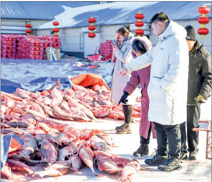
People purchase fish at a market at Chagan Lake in Songyuan City of northeast China's Jilin Province, 27 December 2024.

A winter fishing-themed cultural and tourism festival kicked off on Saturday at Chagan Lake. Chagan Lake, located in Songyuan City of Jilin Province, is the largest natural lake of the province with abundant fishery resources. Locals living by Chagan Lake have kept alive the tradition of ice fishing by hand-drilling holes through the thick ice and casting nets into the icy waters to catch fish. The winter fishing at Chagan Lake, included in the national intangible cultural heritage list, has become a famous tourism attraction in the city. — Xinhua