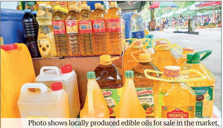
Photo shows locally produced edible oils for sale in the market.

Moreover, by-products from local oil mills, such as oilcake, are being used as animal feed for pigs, chickens, and fish, further reducing the country’s dependence on imported feed, the association highlighted. —ASH/KZL