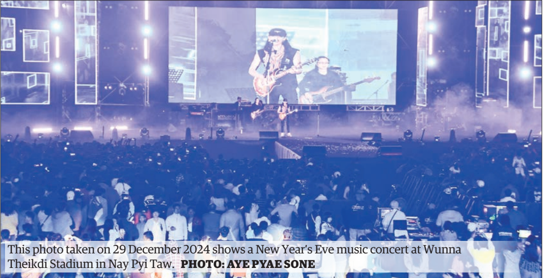
This photo taken on 29 December 2024 shows a New Year's Eve music concert at Wunna Theikdi Stadium in Nay Pyi Taw.

marketplace. Organizers ensured a clean and orderly environment by providing ample rubbish bins and mobile toilets for the convenience of visitors. For those planning to join the New Year celebrations, a variety of entertainment programmes are scheduled. On 30 December, events will run from 3:00 pm to 10:00 pm, featuring a traditional Myanmar dance troupe performance at 5:00 pm. On 31 December, the countdown celebration will begin at 5:00 pm and continue until 1:00 am. Admission is free, and free shuttle bus services will operate along three routes to facilitate transportation for festival-goers. — Lu Lin Pyo/TRKM