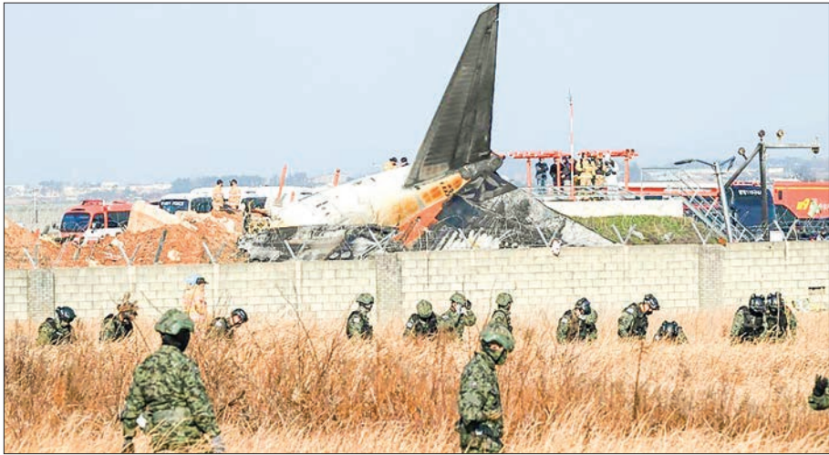
After issuing a “mayday,” the plane belly-landed, hitting a wall and bursting into flames. PHOTO: AFP

worst ever aviation disaster on South Korean soil — which flung passengers out of the plane and left it “almost completely destroyed”, according to fire officials. Video showed the Jeju Air Boeing 737-800 landing on its belly at Muan International Airport, skidding off the runway as smoke streamed out from the engines, before crashing into a wall and exploding in flames. “Of the 179 dead, 65 have been identified,” the country’s fire agency said, adding that DNA retrieval had begun. Inside the airport terminal, tearful family members gathered to wait for news. An official began calling out the names of the 65 victims who had been identified, with each name triggering fresh cries of grief from waiting relatives. Only two people — both flight attendants — were rescued from the crash, the fire department said. — AFP