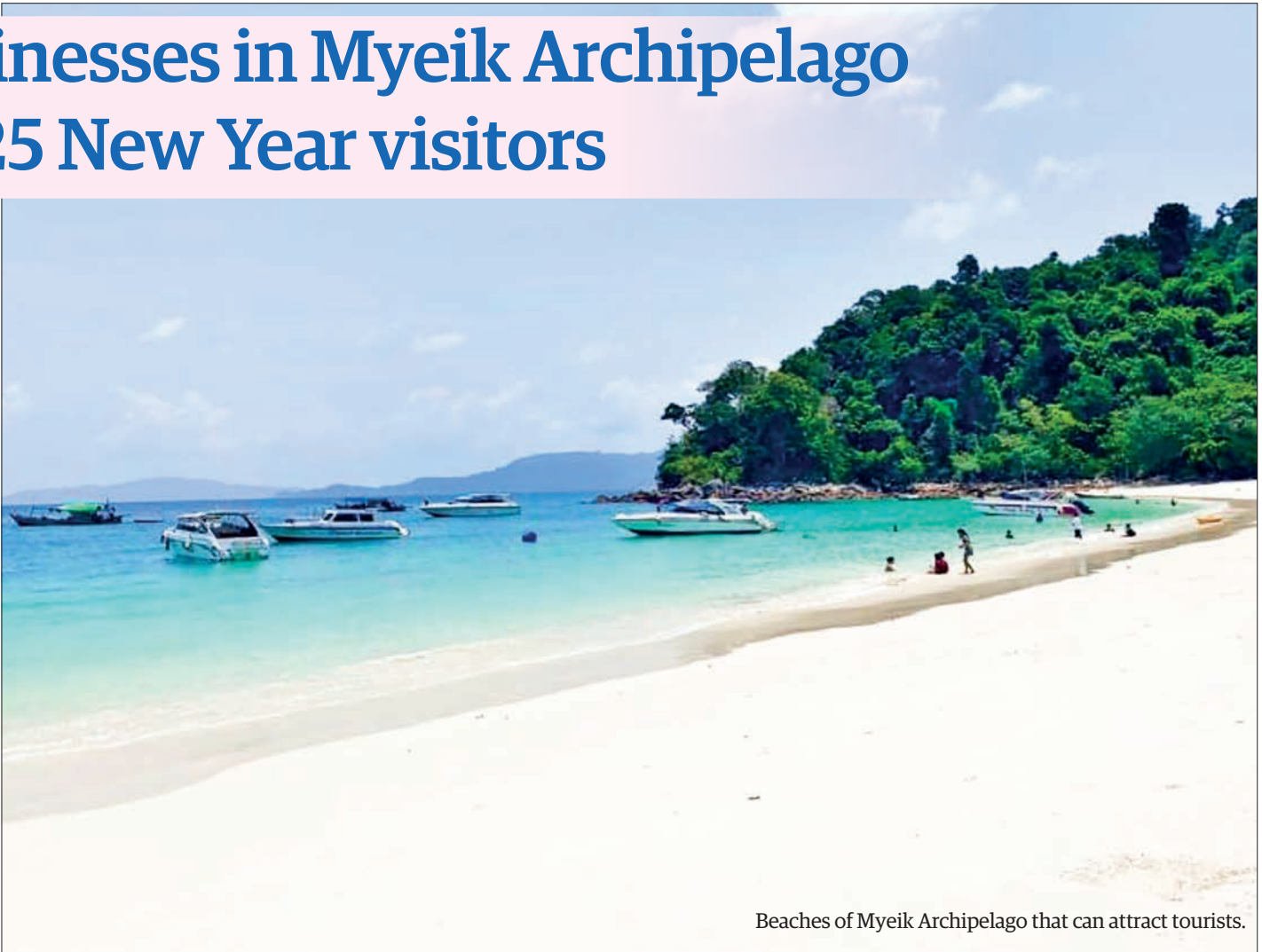
Beaches of Myeik Archipelago that can attract tourists.

He added, “Tourism is about raising awareness. We must continuously educate domestic and international tourists about the beauty of Myanmar and its regions. Effective promotion is essential,