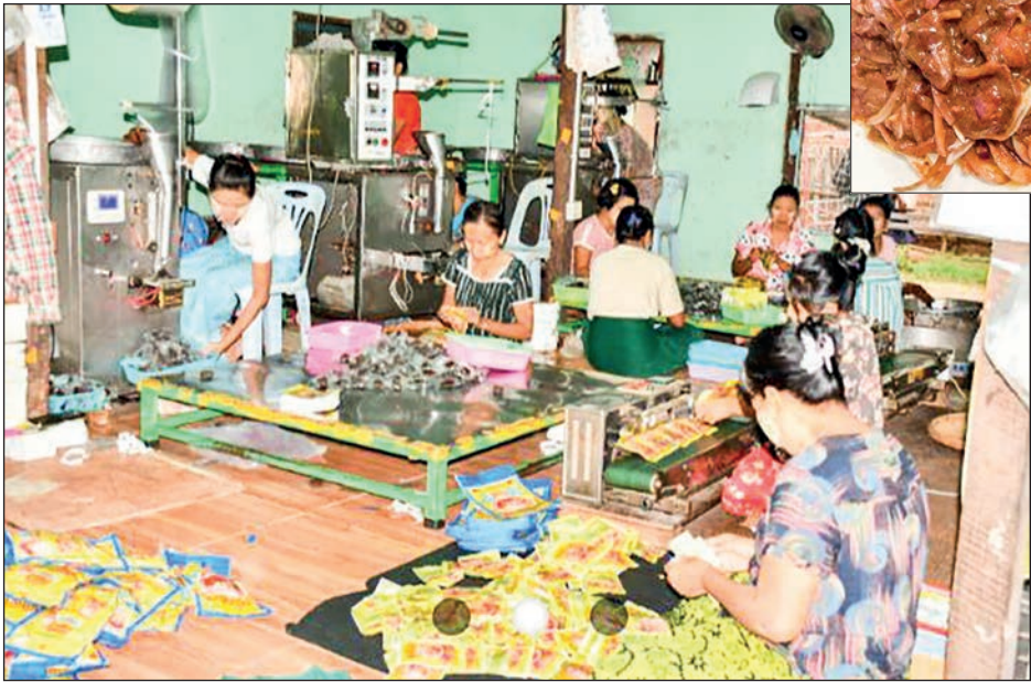
Fermented bean paste produced from Anyar and fermented bean paste making business in Anyar.

salad made of fermented bean paste as well as chicken and pork