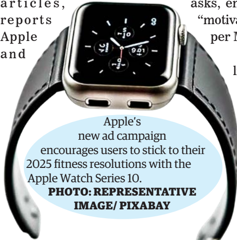
Apple’s new ad campaign encourages users to stick to their 2025 fitness resolutions with the Apple Watch Series 10. PHOTO: REPRESENTATIVE IMAGE/PIXABAY

The campaign highlights the Apple Watch’s consistent reminders, including activity ring prompts and workout milestone notifications. It emphasizes running features like pace tracking and alerts encouraging users to push harder. — ANI