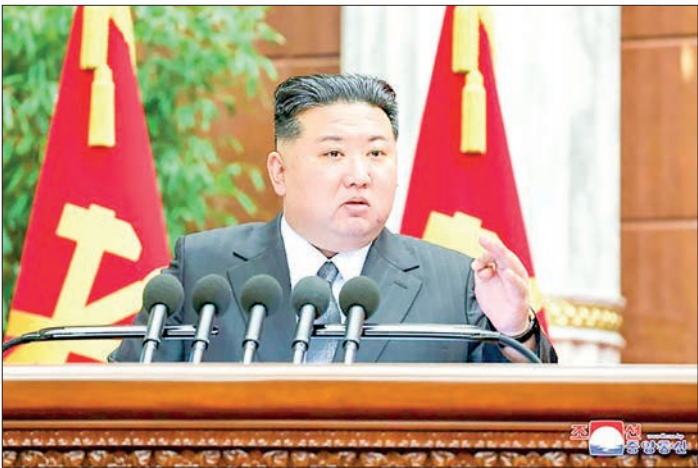
This picture taken during the period of 23 to 27 December, 2024 and released from North Korea’s official Korean Central News Agency on 29 December shows Kim Jong Un attending the party meeting.

North Korea condemned the military ties between South Korea, the US, and Japan, calling it a “nuclear military bloc” and announced a tough counter strategy.