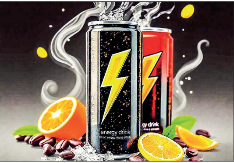
With energy drink consumption set to rise, it's crucial to raise awareness about these risks to prevent long-term health problems in future generations. ILLUSTRATION: REPRESENTATIVE IMAGE/ VISUAL ART