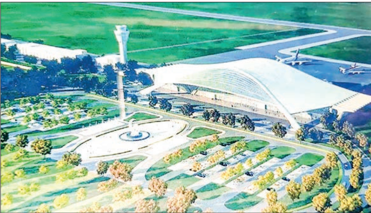
Originally scheduled to begin operations on 1 January 2025, the airport, which is a key part of the China-Pakistan Economic Corridor (CPEC), will now remain closed indefinitely, the Balochistan Post reported.

na at a cost of US$ 250 million, is designed to accommodate large aircraft such as the Airbus A380. The airport's original opening date of 14 August 2024, was planned to coincide with Pakistan's Independence Day celebrations but was postponed due to protests organised by the Baloch Yakjehti Committee (BYC). The second delay followed a series of deadly attacks by the Baloch Liberation Army (BLA), which targeted key CPEC-related infrastructure, including highways, railway bridges, and mineral transport vehicles, as reported by The Balochistan Post. — ANI