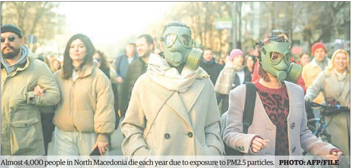
Almost 4,000 people in North Macedonia die each year due to exposure to PM2.5 particles.

It was the second such demonstration in less than a month in Skopje, with the previous march involving a slightly smaller crowd of several hundred people. The participants of Saturday's march through downtown Skopje, dubbed "Come out for clean air", sought from the authorities to undertake immediate