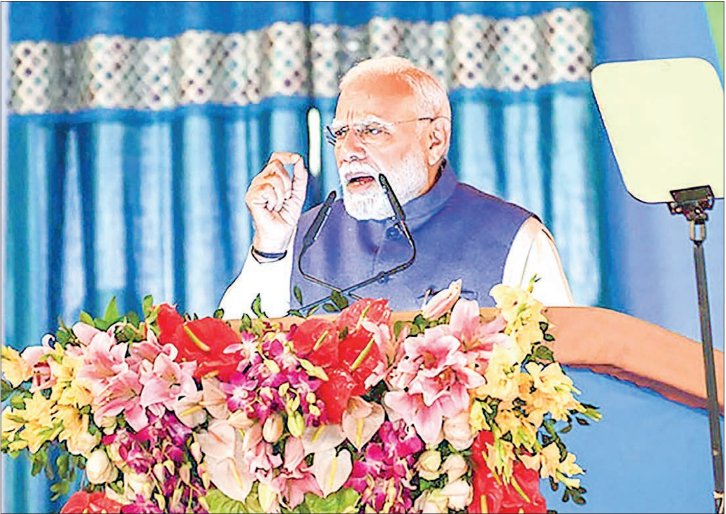
Prime Minister Narendra Modi expressed pride in Tamil, calling it the oldest language in the world.

PRIME Minister Narendra Modi on Sunday expressed pride in Tamil being the oldest language in the world. He noted the increasing global interest in learning Tamil, citing the recent launch of a Tamil Teaching Programme in Fiji with the support of the Indian government. PM Modi further praised the Indian Embassy to Paraguay for promoting Ayurveda, with local residents seeking traditional health consultations. PM Modi addressed the 117 th episode of Mann Ki Baat, his monthly radio programme, where he engages with citizens on important national issues and themes impacting India. He said, “It is a matter of great pride for us that Tamil is the oldest language in the world and every Indian is proud of it. The number of people learning it is constantly rising in countries around the world. At the end of last month, a Tamil Teaching Programme was started in Fiji with the support of the Government of India. This is the first time in the last 80