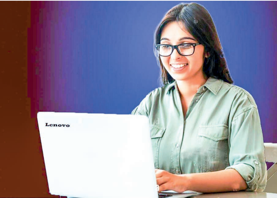
A digital detox refers to a period of intentional disengagement from digital devices and technology, such as smartphones, computers, and social media.

A digital detox can lead to better sleep, especially when you reduce screen time in the hours before bedtime. The blue light emitted by screens interferes with the production of melatonin, the hormone that regulates sleep, making it harder to fall and stay asleep. By stepping away from devices in the evening, you allow your body to follow its natural sleep-wake cycle. This simple change can result in deeper, more restorative sleep, leaving you feeling refreshed and energized the next day. Over time, this improved sleep quality contributes to better overall health and well-being.