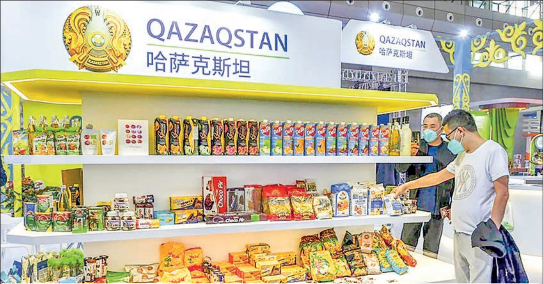
A visitor views commodities at the booth of Kazakhstan at the seventh China-Eurasia Expo in Urumqi, northwest China's Xinjiang Uygur Autonomous Region, 20 September 2022.

KAZAKHSTAN has solidified its position as the leading investment destination in North and Central Asia, drawing US$ 15.7 billion in new projects in 2024, as per the United Nations Economic and Social Commission for Asia and the Pacific (ESCAP) report released on 25 December. This marks an 88 per cent year-on-year surge, with Kazakhstan accounting for 63 per cent of the region’s total investments, The Astana Times reported.