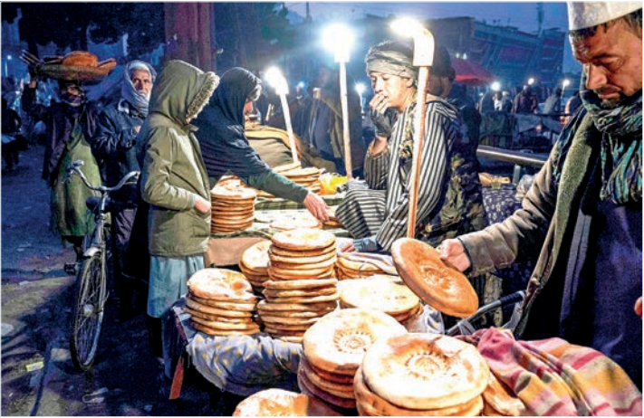
This photograph taken on 16 December 2024 shows Afghan vendors selling traditional flatbreads locally known as Naan, at a roadside market in Kabul.

In Afghanistan, bread is not just food — it’s a cultural cornerstone. Bakery worker Shafiq emphasizes the coun-