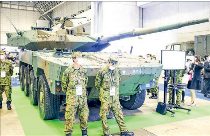
File photo taken on 15 March 2023, shows the Japan Ground Self-Defence Force's Type-16 maneuver combat vehicle displayed at a major defence show in Makuhari Messe convention centre in Chiba, near Tokyo.

THE top five Japanese defence firms tallied sales of $10 billion in 2023, up 35 per cent from the year before, according to an international security think tank, as the country continues its defence buildup amid Chinese and North Korean threats. Globally, the combined arms revenues of the world's 100 largest arms-producing and military services companies rose 4.2 per cent to $632 billion, the Stockholm International Peace Research Institute said in an annual report, citing increased demand for weapons worldwide. Companies in regions where wars are being waged marked the largest percentage increases, with the two Russian companies with available data and six Middle Eastern firms on the list seeing combined sales climb 40 per cent and 18 per cent, respectively. Asia and Oceania saw a 5.7 per cent rise, with Japanese and South Korean companies leading the growth in the region. — Kyodo