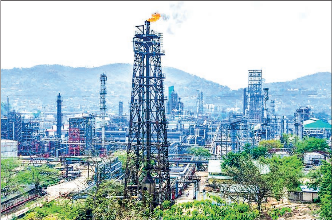
India has emerged as one of the fastest-growing fuel consumption centres globally.

INDIA is finishing 2024 with its oil demand growth rate outpacing neighboring countries, a trend expected to continue into the next year, according to S&P Global Commodity Insights. The country has emerged as one of the fastest-growing fuel consumption centers globally. As per the global commodities information services provid-