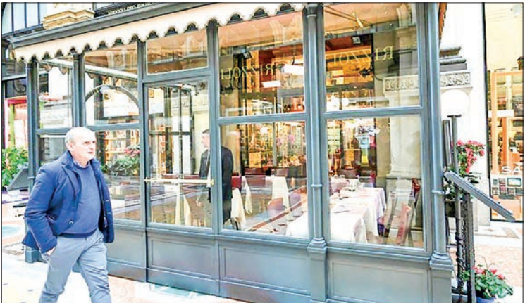
Italy is implementing text cut policies that aim to streamline business operations and reduce administrative burdens.

domestic product (GDP) in the European Union. Meloni’s hard-right coalition has committed to reducing the public deficit to 3.3 per cent of GDP in 2025, down from an expected 3.8 per cent this year. But the budget comes amid slowing growth, with the ISTAT national statistics office estimating GDP this year to increase just 0.5 per cent — half what it forecast in June. The measures approved include making permanent a merging of the lower two income tax brackets, so people earning 28,000 euros a year can pay 23 per cent instead of 25 per cent. — AFP