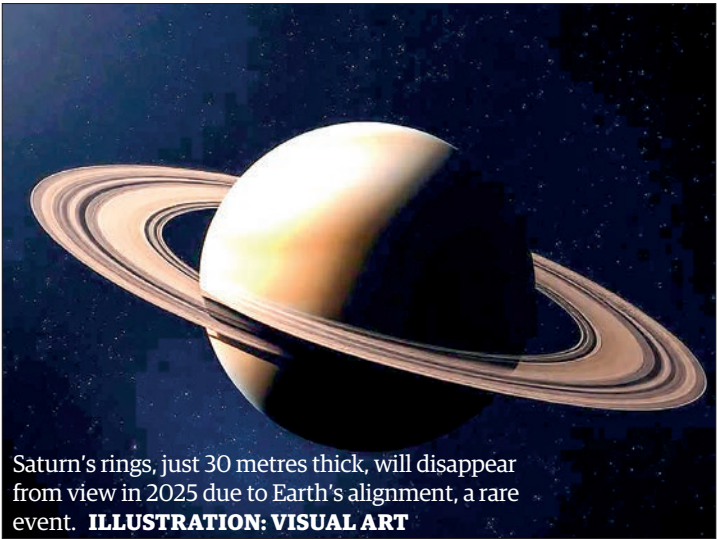
Saturn's rings, just 30 metres thick, will disappear from view in 2025 due to Earth's alignment, a rare event. ILLUSTRATION: VISUAL ART

Saturn's rings will appear to disappear twice in 2025—once in spring and once in autumn—due to Earth's alignment.