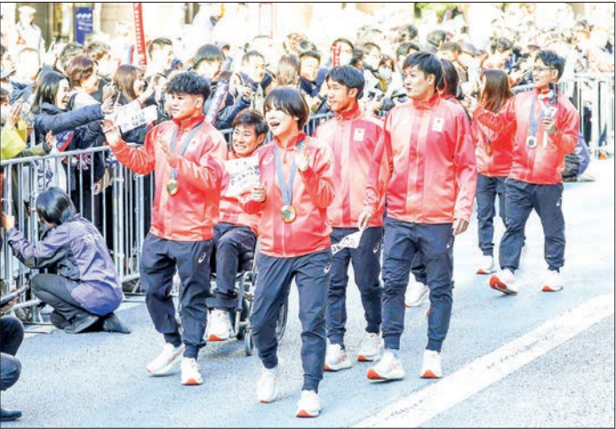
File photo shows Japanese Olympic and Paralympic athletes, who competed in Paris in the summer, holding a joint parade in Tokyo in November 2024.

THE Japanese Olympic Committee and Japanese Paralympic Committee plan to allow companies to sign a single joint sponsorship contract with both bodies from 2025, sources familiar with the matter said Sunday. Until now, companies wanting to sponsor both the Olympics and Paralympics have had to sign separate contracts with each. At present, five companies sponsor both the JOC and JPC. The two committees' decision to join hands is aimed at increasing the number of sponsors and public exposure. There have been many calls from companies for joint Olympic-Paralympic contracts, but the JOC and JPC had been unable to reach agreement as their deals were based on separate sets of rules. "We want to promote Japanese athletes and the games by benefitting from the strengths of both the Olympics' and Paralympics' strength," one source said. Since Tokyo was awarded the hosting rights in 2013 for the 2020 Olympics, the idea of having the Olympics and Paralympics promote each other has become widespread. Joint parades of Japan's Olympic and Paralympic athletes took place after the 2016 games in Rio de Janeiro and again after this year's games in Paris. — Kyodo