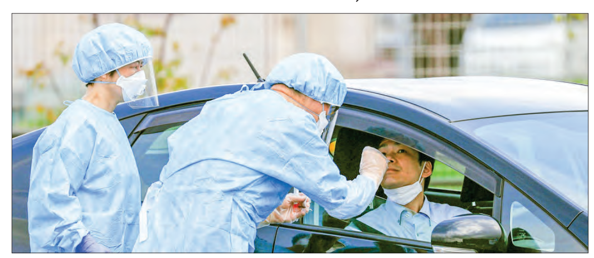
The plan prioritizes vaccinating 100 per cent of healthcare workers and vulnerable groups, including older persons and those with underlying conditions, in line with efforts to vaccinate 70 per cent of the global population.

ALTHOUGH the COVID-19 vaccination rollout is the biggest and fastest in history, many people most at risk are still not protected against the disease, the World Health Organization (WHO) said on Friday, announcing an updated inoculation strategy.