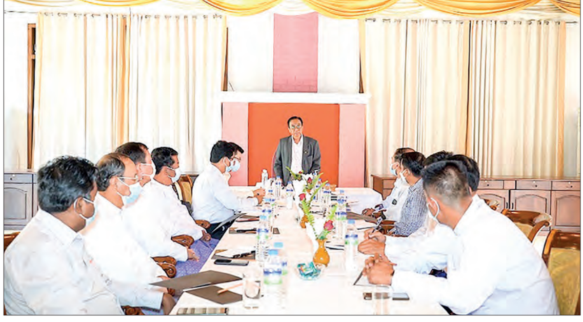
Union Minister for Hotels and Tourism Dr Htay Aung meets departmental officials and officials of hotels and tourism organizations in PyinOoLwin Township on 23 July.

Arrangements are being made to conduct the Russian language course in Yangon in cooperation with the Ministry of Education, adding local authorities, private sector and local people are to cooperate with each other in successfully holding the Russian language course for hotels and tourism services in PyinOoLwin to be conducted by the Defence Services Academy.