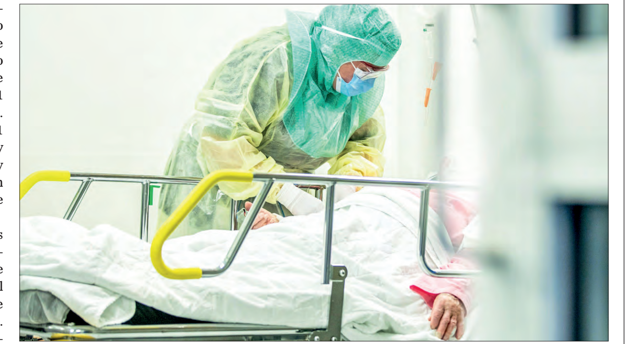
According to Gusdon, the study's first author, "OP-101 is a novel nanotherapeutic drug that selectively targets active macrophages and microglia, the key immune cells in the brain.

A nanotherapeutic substance called OP-101 has been tested in a number of animal models of inflammatory disease and has demonstrated superior anti-inflammatory and anti-oxidant