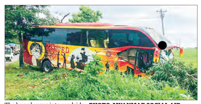
The bus plunges into roadside.

It is reported that the injured were taken to Pyay Gen-