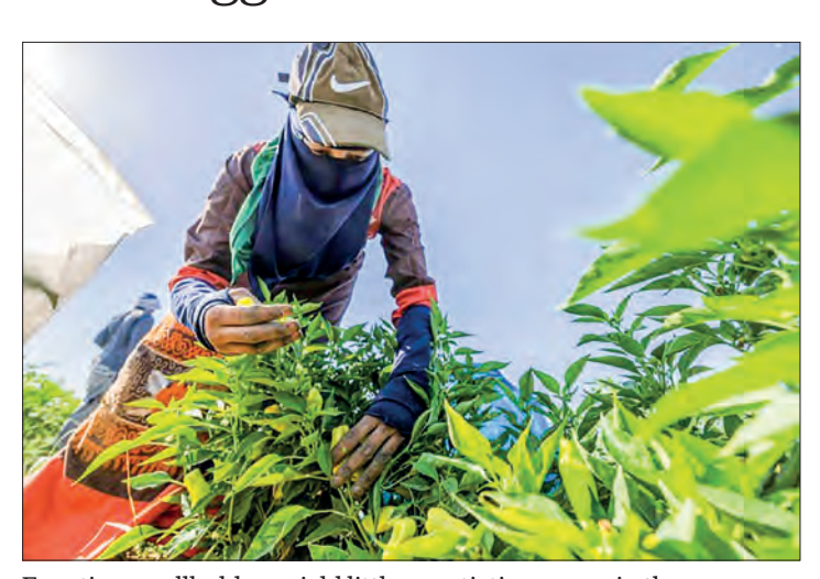
Egyptian smallholders wield little negotiating power in the marketplace making it difficult for them to avoid sliding into debt.

EGYPTIAN smallholders grow nearly half of the country's crops, a lifeline role increasingly important after grain imports were stalled by war in Ukraine — but they are struggling to survive