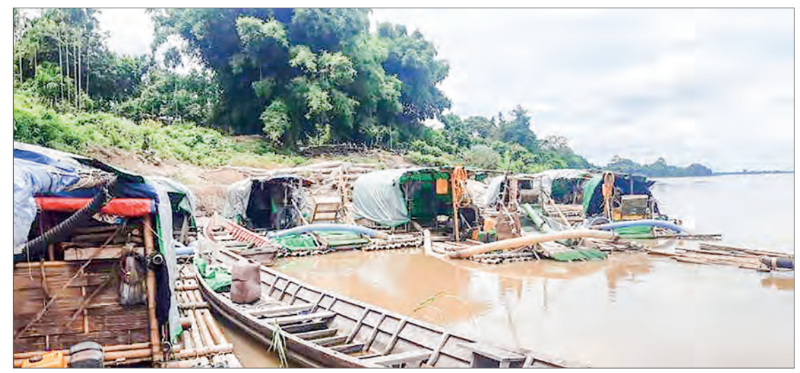
Boats and rafts are seized together with mining equipment in Myitkyina Township of Kachin State on 22 July.

SUPERVISED by the Anti-Illegal Trade Steering Committee, effective action is being taken to prevent illicit trade under the law.