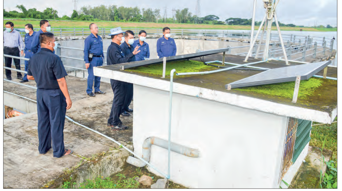
Yangon Mayor U Bo Htay inspects water supply facilities in Mingaladon Township on 24 July.

He also inspected the construction of a pedestrian and bicycle path, including landscaping, between Thamine College Road and the Department of Applied Geology.—MNA