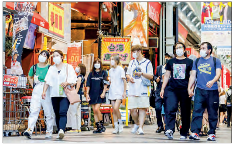
People wearing face masks for protection against the coronavirus walk down the Osu shopping street in the central Japan city of Nagoya on 23 July 2022.

The national daily tally came to 200,975 patients, roughly dou-