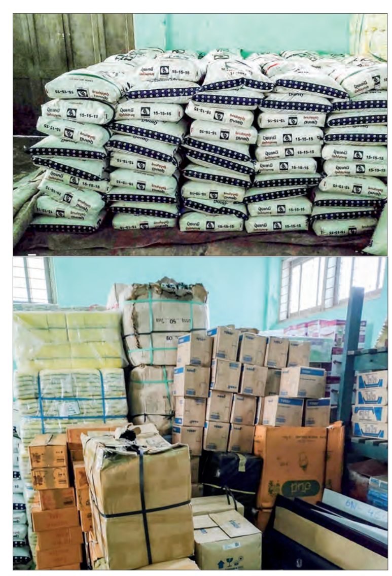
Bags of fertilizers and cartons of kitchen wares are seized in Mudon Township on 23 July.

Therefore, 14 cases (estimated value of K267,572,484) were taken action from 21 to 23 July, according to the Anti-Illegal Trade Steering Committee.