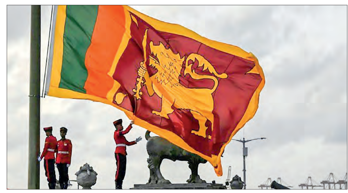
Military personnel in ceremonial uniform lower the Sri Lanka national flag at Galle Face Green in Colombo.

Troops armed with batons and automatic weapons cleared the 92-year-old presidential secretariat in a pre-dawn raid Fri-