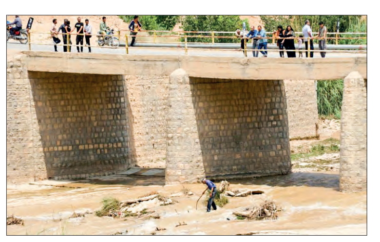
Iran has in recent weeks seen protests against the drying up of rivers, particularly in central and northwestern areas.

FLOODING in southern Iran has killed at least 22 people and left one person missing follow-