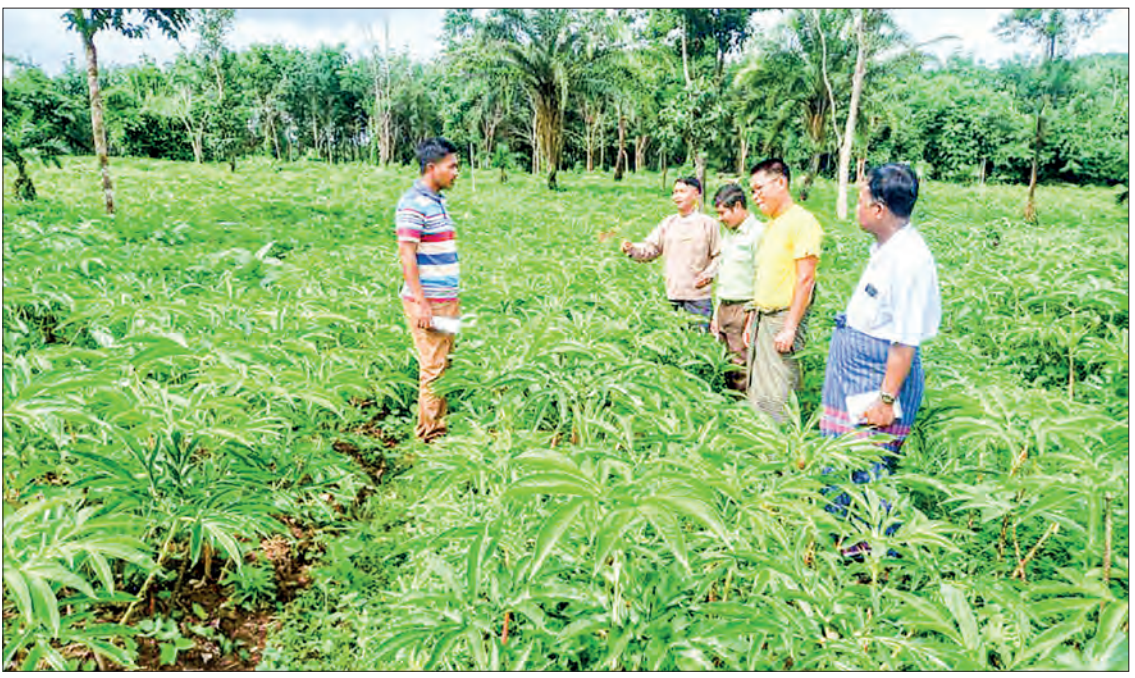
Konjac plants are thriving in the farms in Palauk of Palaw Township in Taninthayi Region.

vate Konjac over 30 years ago in Kachin, Chin, Shan, Mon and Kayin states and Bago Region. Konjac cultivation commenced in Taninthayi Region in the 2020-2021 Financial Year. At present, konjac has become intercrop in rubber plantations in the region.