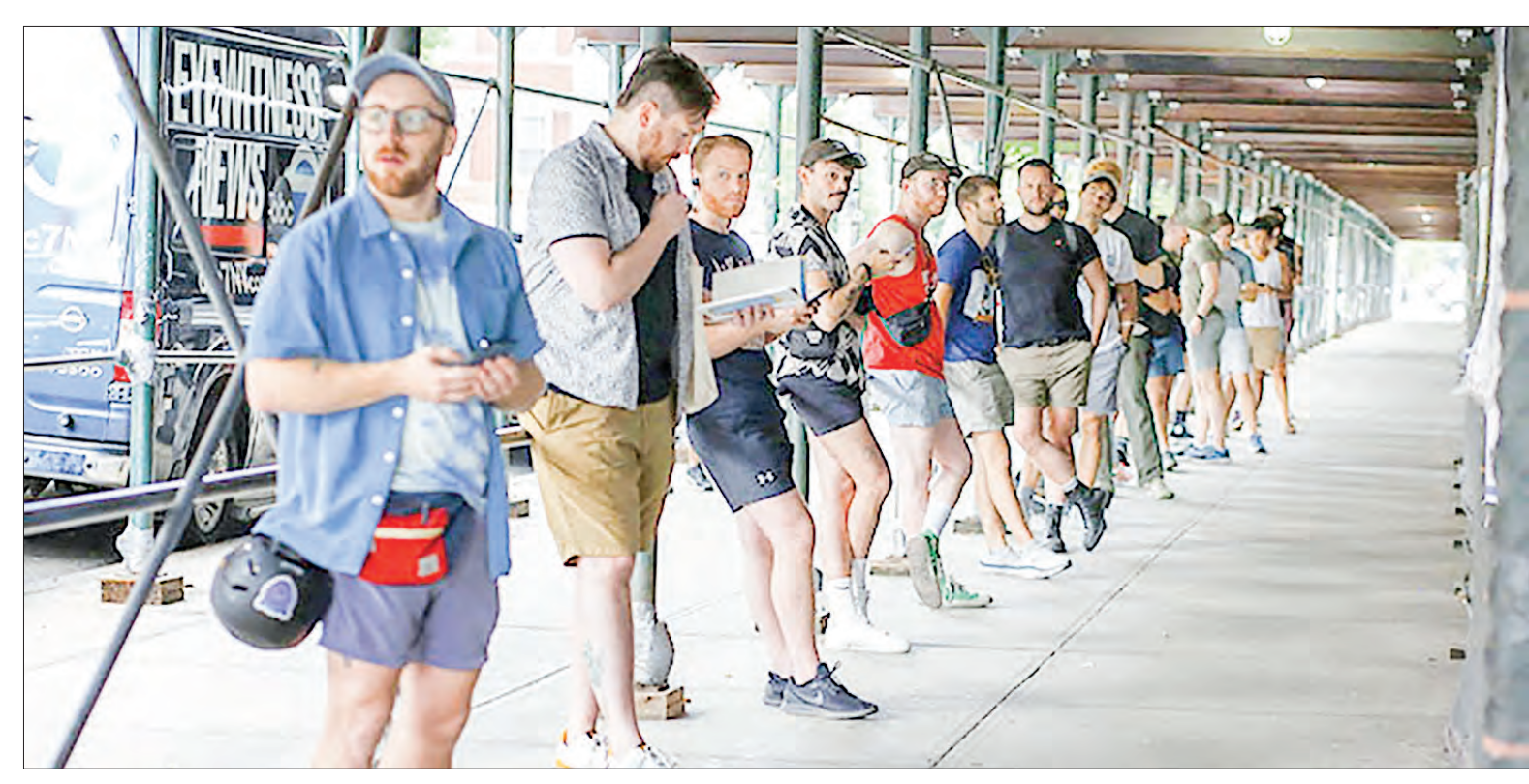
People line up to receive the monkeypox vaccine in New York City on Sunday.

s monkeypox infections prompting a scramble for vaccines, AFP looks at how the disease has spread since first appearing in Africa in the 1970s.