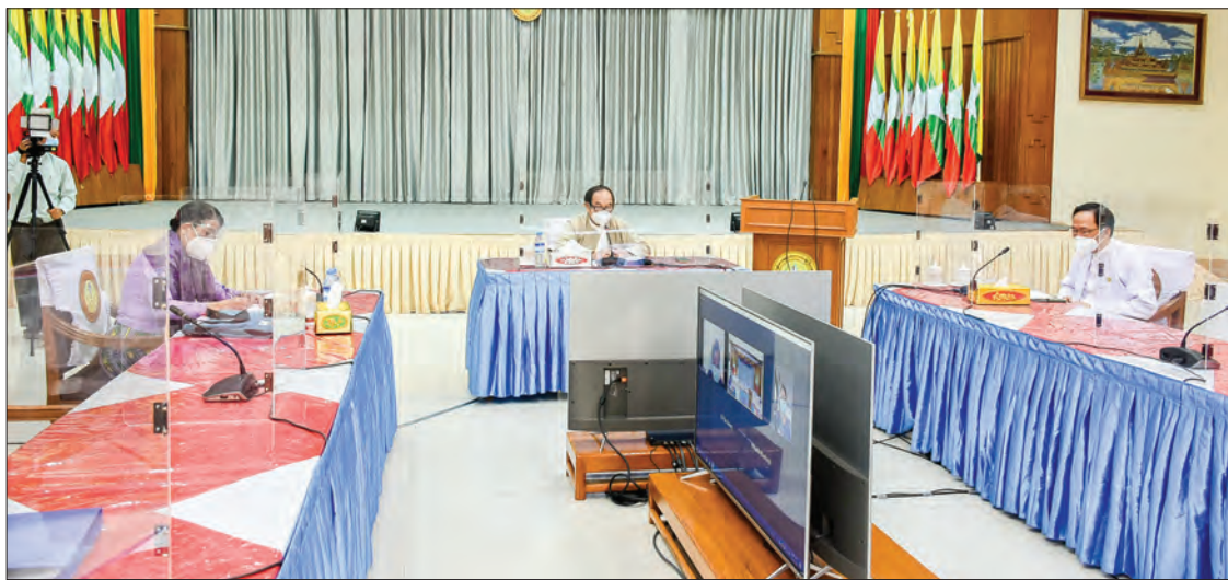
Union Minister Dr Myint Htwe presides over coordination meeting on control measures against COVID-19 on 18 September.

phasized early contact tracing to prevent further transmission