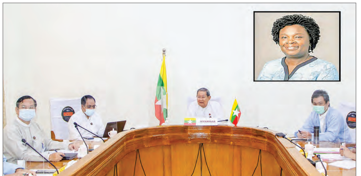
Union Minister for Planning, Finance and Industry U Soe Win holds discussions with World Bank Vice President for Asia-Pacific Region Ms Victoria Kwakwa via videoconference on 18 September 2020.