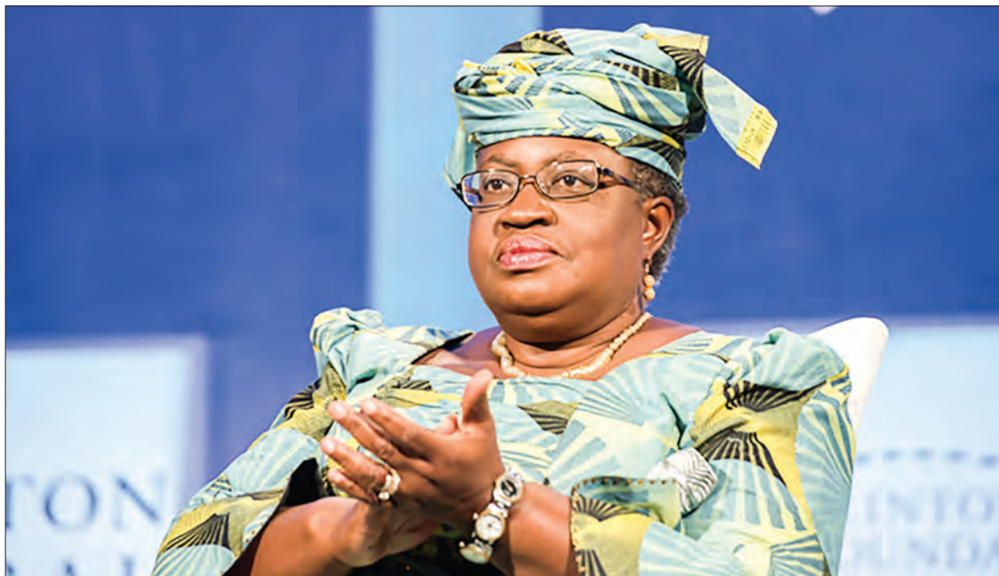
In this file photo taken on September 19, 2016 former Finance Minister of Nigeria Ngozi Okonjo-Iweala looks on during the Opening Plenary Session: “Partnering for Global Prosperity”, at the Clinton Global Initiative in New York.

Women candidates Amina Mohamed of Kenya, Ngozi Okonjo-Iweala of Nigeria, and Yoo Myung-hee of South Korea remain, alongside two men: Liam Fox of Britain and Mohammed