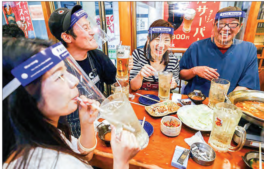
People wearing face shields eat together at a pub in Osaka on 25 May, 2020. Japan has lifted the coronavirus state of emergency in Osaka and the two neighbouring prefectures of Kyoto and Hyogo.

TOKYO — Asian finance chiefs on Friday pledged to promote regional financial cooperation to minimize the prolonged economic fallout from the coronavirus pandemic, while noting that they have seen some “green shoots of recovery”. “The importance of regional financial coopera-