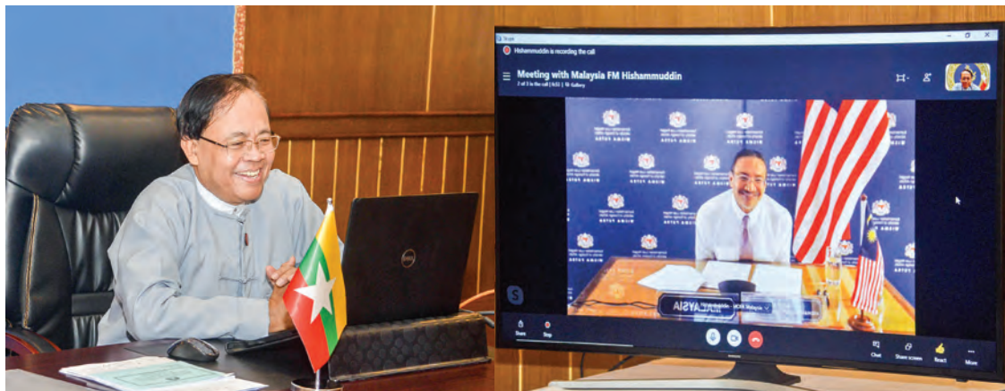
Union Minister U Kyaw Tin holds virtual meeting with Malaysian Foreign Minister Dato' Seri Hishammuddin Tun Hussein on 18 September 2020.

Dato' Seri Hishammuddin Tun Hussein had served in various capacities including Minister of Defence, Minister of Home Affairs and Minister of Education before assuming the current capacity as Minister of Foreign Affairs of Malaysia on 9 March 2020.—MNA