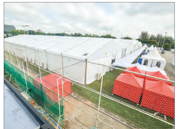
A 400-bed tent hospital opens in Yangon to treat coronavirus patients.

A building which had been used for facility quarantine in Hline University Campus will also be turned into a hospital with 500-bed capacity for giving treatment to serious patients.—GNLM