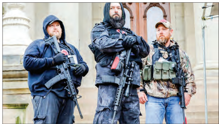
The FBI is increasingly worried about potential violent clashes between extremist groups on the right and the left ahead of the November election, Director Chris Wray said.