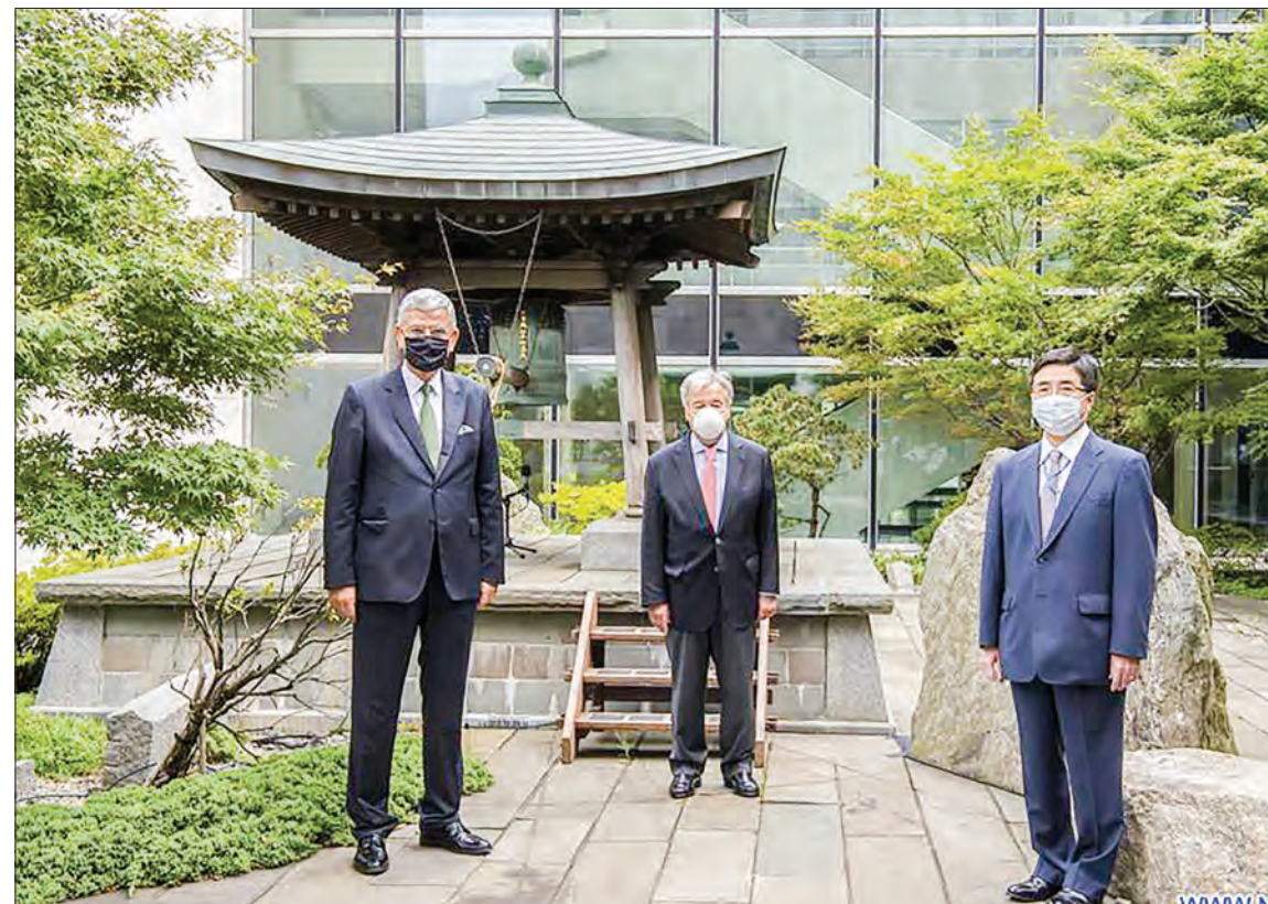
United Nations Secretary-General Antonio Guterres (C), Volkan Bozkir (L), president of the 75th session of the UN General Assembly, and Kimihiro Ishikane, permanent representative of Japan to the UN, pose for a photo in front of the peace bell at the UN headquarters in New York, on Sept. 17, 2020.

"Today we stand separated and masked. The pandemic has brought unexpected levels of misery and hardship to many. But it is the most vulnerable who