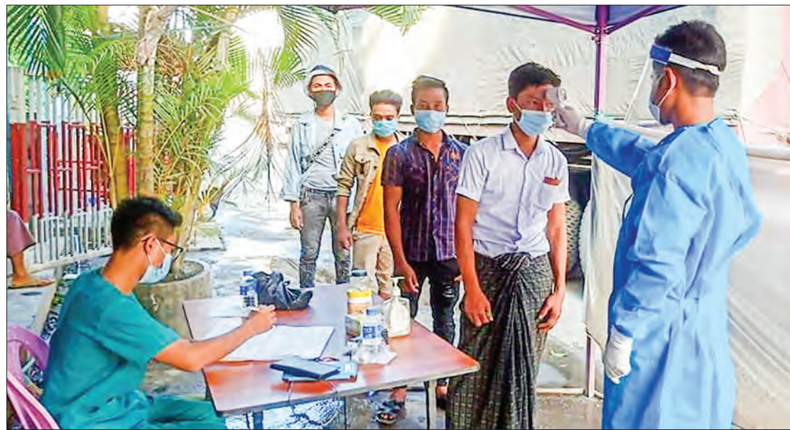
Health workers are testing body temperature of Myanmar returnees from China on 17 September.