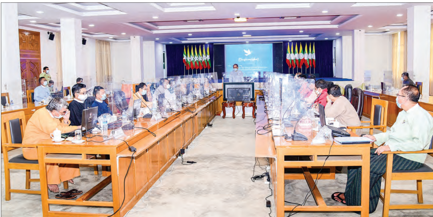
Union Minister U Kyaw Tint Swe explains development of peacemaking process at Shan State Government Office in Taunggyi, Shan State on 15 September 2020.

UNION Minister for the State Counsellor's Office U Kyaw Tint Swe, in his capacity as Vice-Chairman of the National Reconciliation and Peace Centre, explained