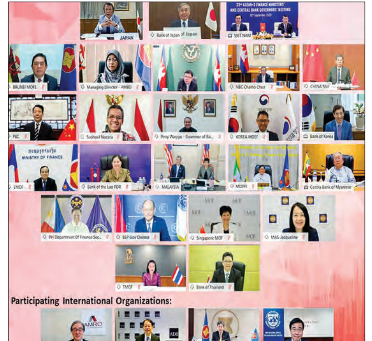
Central Bank of Myanmar Governor U Kyaw Kyaw Maung joins 23 rd ASEAN+3 Finance Ministers' and Central Bank Governors' Meeting online on 18 September 2020.

They also discussed to continue working together for ASEAN+3 Finance Processes – (1) Chiang Mai Initiative Multilateralization (CMIM), (2) ASEAN+3 Macroeconomic Research Office (AMRO), (3) Asian Bond Markets Initiative (ABMI) and (4) ASEAN+3 Finance Process.—MNA (Translated by Khine Thazin Han)