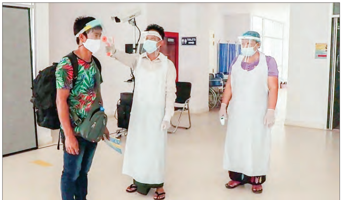
A Myanmar migrant worker returned home from Thailand via Myawady border is being tested for body temperature on 18 September.

From 1 May to 18 September, 78,057 migrant workers have returned home through the Thai-Myanmar Friendship Bridge-2.—Htein Lin Aung (IPRD) (Translated by Ei Phyu Phyu Aung)