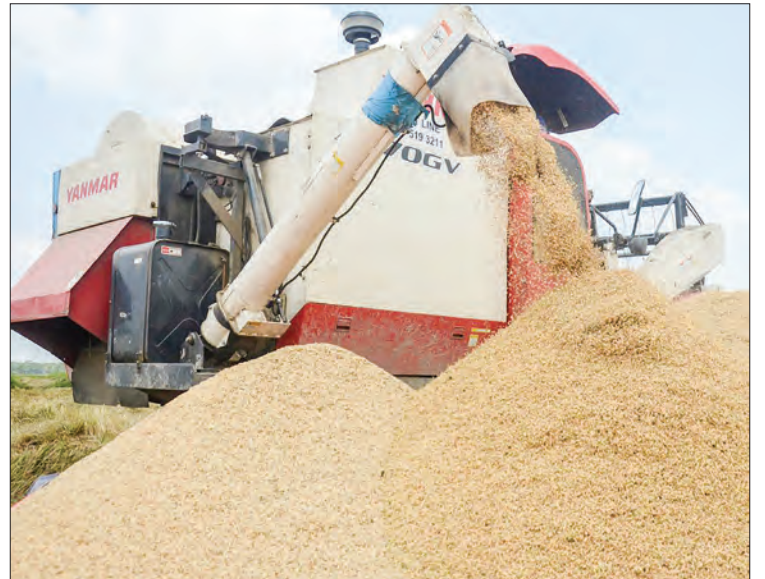
Myanmar exported over 2.5 million tonnes of rice and broken rice as of 4 September in this financial year.