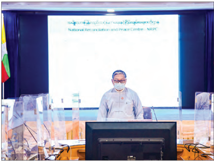
Union Minister U Kyaw Tint Swe reports on the ongoing peace development during his official visit to southern Shan State from 15 to 17 September.