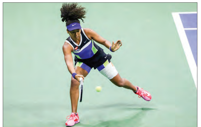
US Open champion Naomi Osaka of Japan has pulled out of the upcoming French Open with a left hamstring injury.

The withdrawal of third-ranked Osaka means Roland Garros will be missing two of the world's top three, after reigning champion Barty said earlier this month that she wouldn't return to defend her title.—AFP ■