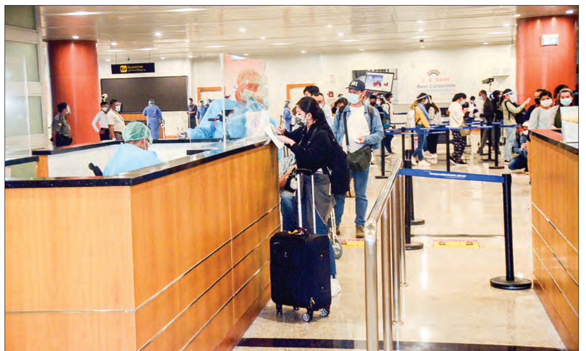
Myanmar returnees from Singapore line up for immigration process at the Yangon International Airport on 18 September 2020.

The Ministry of Foreign Affairs has been working with Myanmar embassies in foreign countries and local ministries concerned to bring back citizens stranded abroad due to the suspension of commercial flights, in accordance with the guidance of the National-Level Central Committee on Prevention, Control and Treatment of COVID-19. Until now, Myanmar has organized 18 relief flights to bring the citizens back home from Singapore every Friday.—MNA (Translated by Aung Khin)