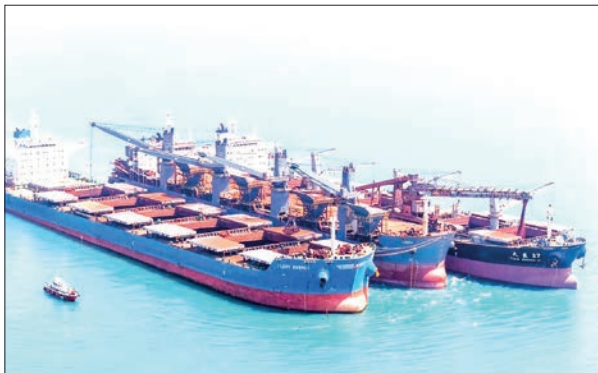
Strong pent-up seasonal demand and active inventory replenishment are keeping physical oil supplies constrained.

ICICI Bank Research said 2026 is likely to stay supply-deficient, with a net shortfall of 1.6 million barrels per day keeping Brent crude in the $75-85 range in the second half