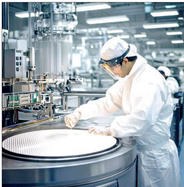
This image displays automated robotic equipment handling silicon wafers within a semiconductor manufacturing cleanroom.

"As a result, money markets are now expect-