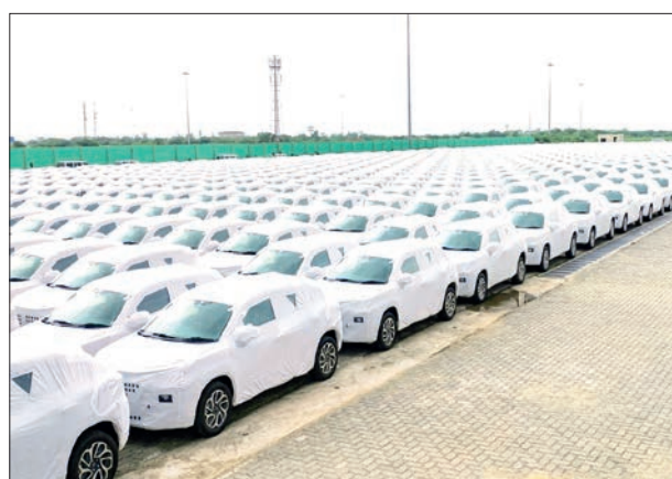
Commercial vehicle demand has historically taken longer to recover following periods of fuel-price inflation.

According to the brokerage, a below-normal start to the monsoon