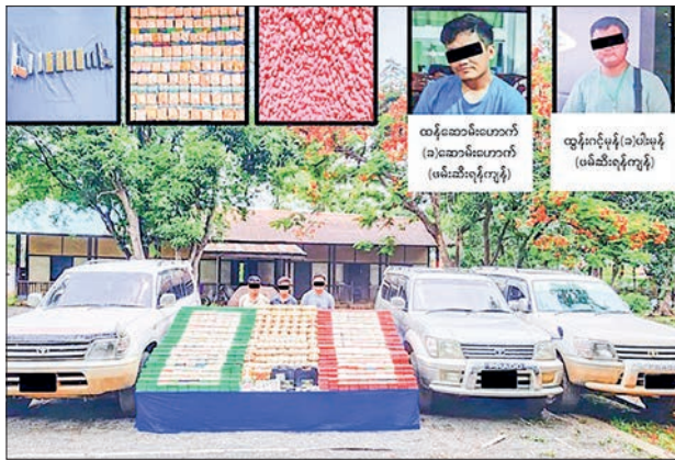
Drug traffickers are seen with seized narcotic drugs and munitions in Kalewa.

From the vehicles, police seized 5.5 kilogrammes of heroin from one vehicle, 4.4 kilogrammes of hero-