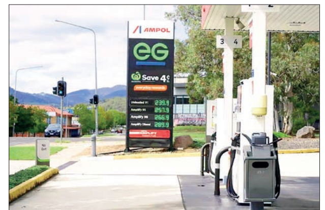
A petrol station in Canberra, Australia on 20 March 2026.

"Despite the welcome and substantial drop in the price of petrol recently, we recognize people are still under pressure." — Xinhua