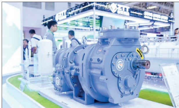
A helium compressor is pictured at the Innovation Chain area of the third China International Supply Chain Expo (CISCE) in Beijing, capital of China, 17 July 2025.

THE China International Supply Chain Expo (CISCE) plays an important role in strengthening global supply chains as resilient and efficient supply chains are critical to economic growth in an increasingly complex