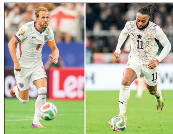
This combination of file pictures created on 21 June 2026 shows England's forward Harry Kane (L) in Dallas on 17 June 2026 and Ghana's forward Antoine Semenyo (R) in Stuttgart on 30 March 2026.

managed to win it," said Moriyasu, who was facing a Tunisia side led by new manager Herve Renard for the first time. — Kyodo