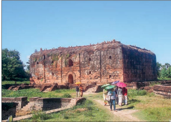
This photo shows an ancient monument in ancient Inwa city.