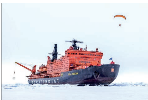
This image shows the Russian nuclear-powered icebreaker 50 Let Pobedy (50 Years of Victory).