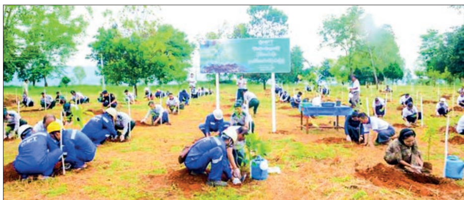
Employees of MPT are participating in tree-growing ceremony in all regions and states on 20 June.

The simultaneous tree-planting campaign was carried out in all regions and states, including Yadanabon new satellite town in PynOoLwin Township, Mandalay Region. The initiative seeks to create a greener environment, improve quality of life and reduce the impact of natural dis-