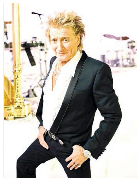
Veteran British singer Rod Stewart.

The health scare comes weeks after Stewart announced changes to several performances in his Las Vegas residency and One Last Time Tour.