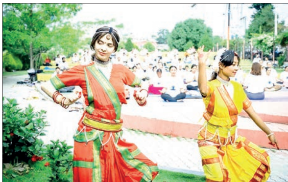
Artists perform a dance to celebrate International Day of Yoga in Kathmandu, Nepal, 21 June 2024. PHOTO: XINHUA/FILE

In 2014, the United Nations passed a resolution, announcing 21 June as the International Day of Yoga. — Xinhua