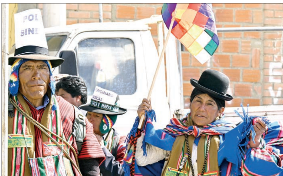
Indigenous woman holds Wiphala flag at Bolivia's six-week Ponchos Rojos protest meeting in La Paz.

BOLIVIA'S president declared a state of emergency on Saturday and deployed soldiers and bulldozers to raze anti-government roadblocks that have paralyzed the Andean nation.