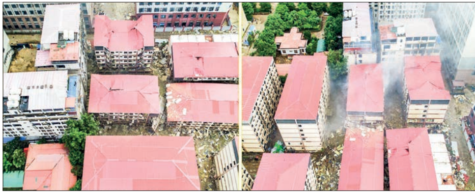
Images depict before and after exploding buildings used in online scams and gambling in Shwe Kokko of Myawady.

AUTHORITIES have demolished another illegal seven-storey residential building in the Shwe Kokko area, which was reportedly used in online fraud and illegal gambling activities. A coordinated team of relevant departments is continuing the systematic removal of illegal structures linked to online scam operations in the KK Park and Shwe Kokko areas of Myawady Township, Kayin State. Officials said the demolition forms part of ongoing efforts to clear 77 identified buildings used in such activities. Of these,