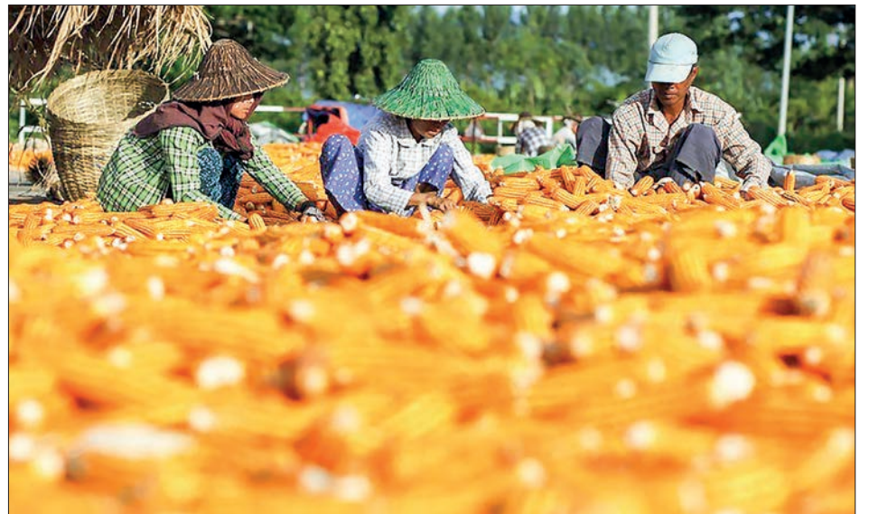
Female workers are sorting quality maize at their farm at harvest time so as to distribute them to domestic market and to export quality ones.

As the association has requested information on current maize prices in Myanmar, the Consulate-General has notified local maize growers and exporters that those interested in exporting maize meeting China's quality and standards requirements may contact the relevant officials for further arrangements.