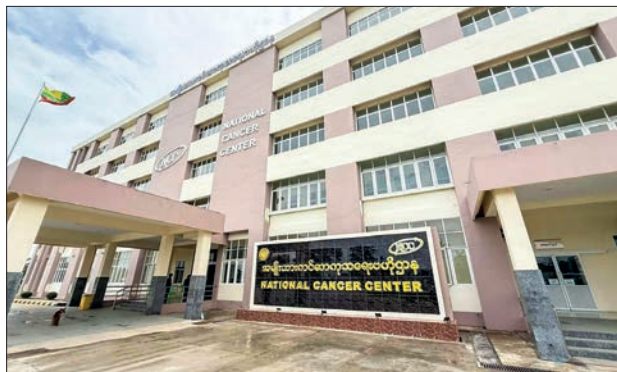
The National Cancer Centre (NCC).

The centre offers chemotherapy, targeted therapy, immunotherapy and radiotherapy, with treatment overseen by cancer specialists from Yangon General Hospital. Emergency cancer cases continue to be treated at