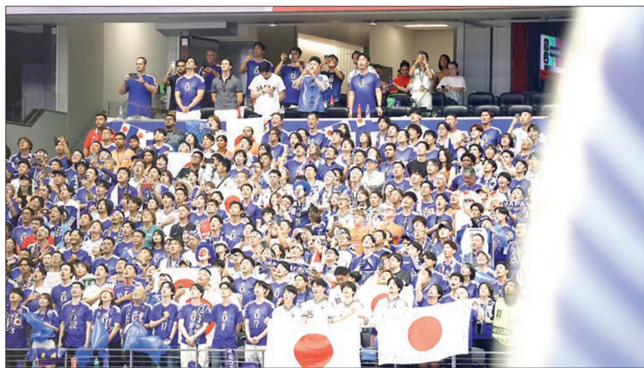
Japan supporters at the World Cup match against the Netherlands in Arlington, Texas.

Japanese men spend among the least time on housework internationally.