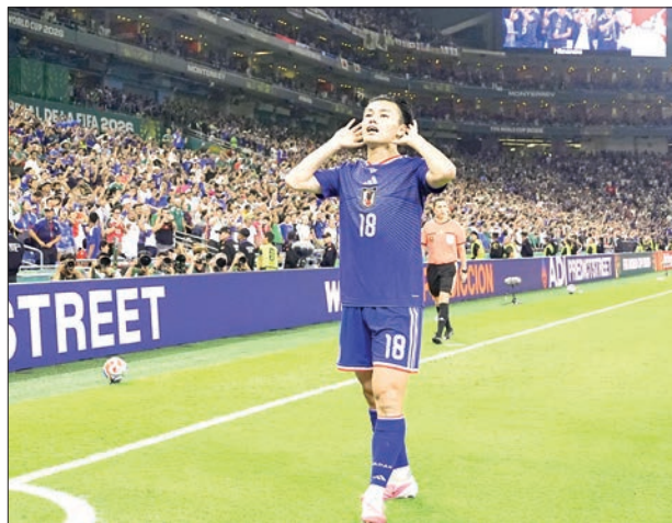
Ayase Ueda celebrates after scoring Japan's second goal in the first half of a World Cup Group F football match against Tunisia at Monterrey Stadium in Guadalupe, Mexico, on 20 June 2026.

The Samurai Blue also ended their long second-match hoodoo at overseas World Cups, having not won a single game in their past six attempts, with their only previous victory at this stage of the tournament arriving in 2002 when they were co-hosts.