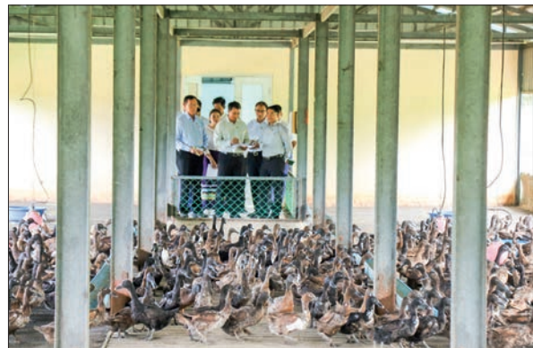
Union Minister U Min Naung views raising of layer ducks at the farm of Shwemyo Extension Livestock Zone yesterday.

While inspecting, the Union Minister gave instructions on further developing layer duck farming, ensuring the distribution of high-quality purebred ducklings, and making regionally suitable cattle breeds available to farmers. He emphasised the need to systematically carry out breed-by-breed measure-