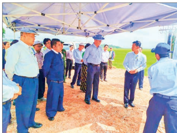
Officials inspect development undertakings in villages in Hopong Township on 18 June.