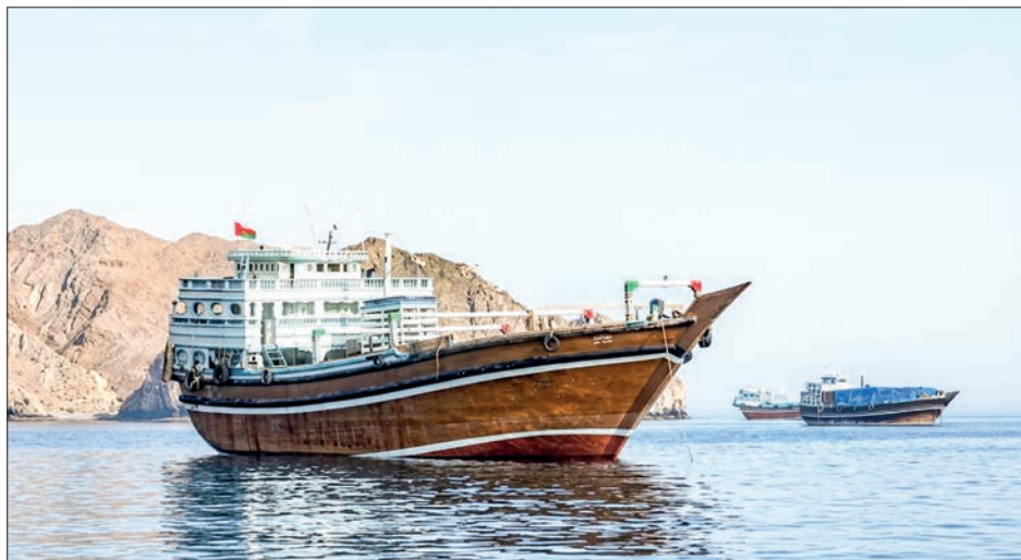
A fishing boat sits anchored off Muscat, Oman, near the Strait of Hormuz, on 20 June 2026.

Iran closed the Strait of Hormuz again, saying the United States broke the ceasefire deal and Israel kept violating the truce in southern Lebanon.