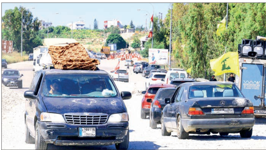
Lebanese people drive vehicles loaded with mattresses as they return to Beirut after Israeli airstrikes targeted villages near Qasmiyeh Bridge in southern Lebanon, 19 June 2026.

Iran has claimed control over the waterway in response to what they claim are repeat-