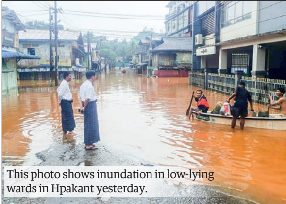
This photo shows inundation in low-lying wards in Hpakant yesterday.

CONTINUOUS rainfall in Hpakant Township, Kachin State, with recorded precipitation of 6.89 inches has caused the Uru Creek and local creeks to rise, leading to