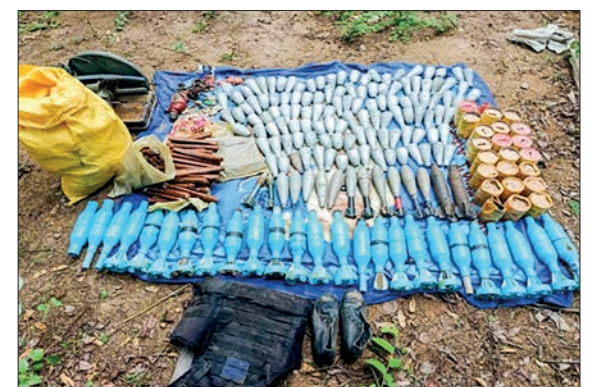
This photo shows arms and munitions seized from the terrorist camp near Kantha Village of Yenangyoung Township.

Authorities said such operations are part of ongoing efforts to counter armed groups accused of intimidation, violence, and disruption of local communities, and reaffirmed continued action to support peace and stability in the region. — MNA/ST