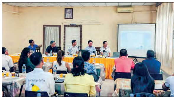
The software launching ceremony.

The launching ceremony was held at the Myanmar Golf Club located on Pyay Road in 9 th -Mile, Yangon yesterday yesterday. At the event, MGF vice president and the World