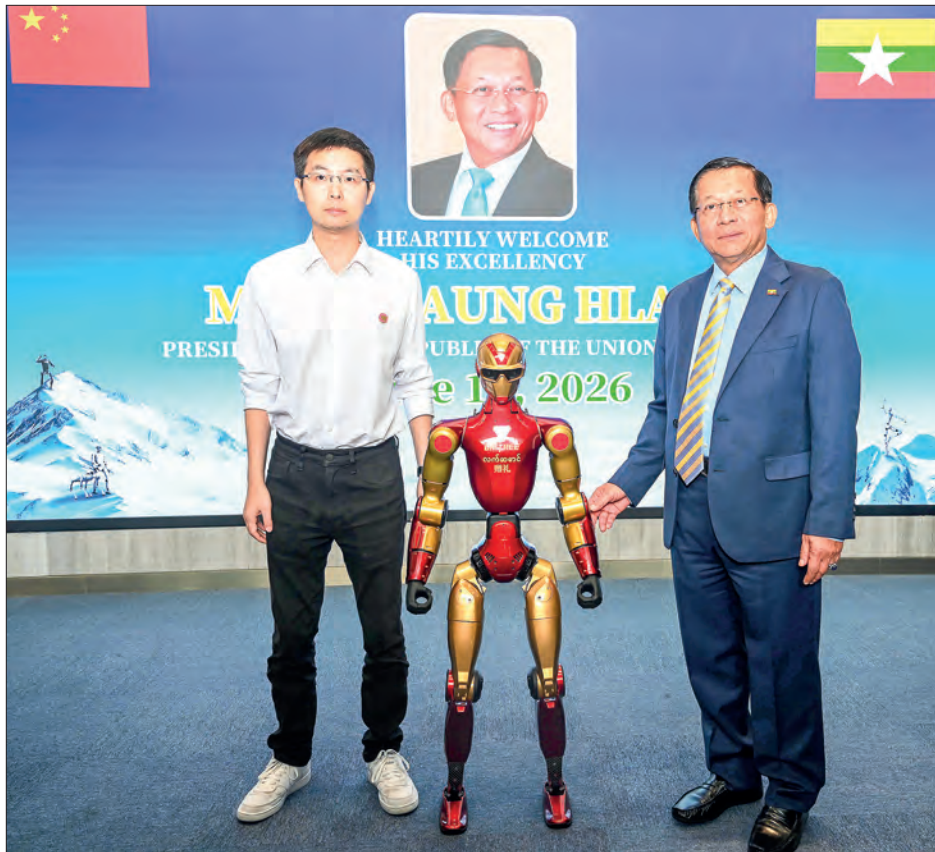
President U Min Aung Hlaing is pictured alongside a humanoid robot manufactured by China's Unitree Robotics, presented as an official commemorative gift.

The Myanmar delegation then visited Zhejiang Qingshi New Material Technology Co