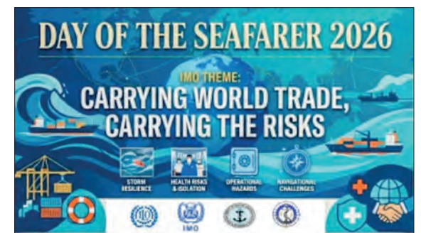
This photo features a postcard commemorating "Day of the Seafarer 2026".

If SRPS organizations require further information regarding the ceremony, they may contact the organizers for enquiries at 09 400066702 or 09 683053745. — TWA/TH