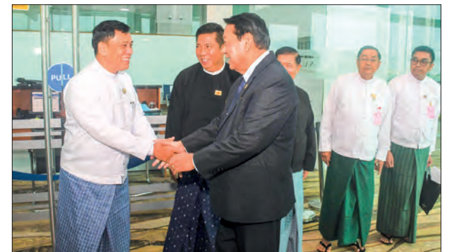
Pyithu Hluttaw Speaker U Khin Yi is pictured before departing for Belarus.

AT the invitation of Speaker Mr Igor Sergeyenko of the House of Representatives of Belarus and State Duma Chairman of the Russian Federation Mr Vyacheslav Volodin, the Myanmar Hluttaw delegation led by U Khin Yi departed for Belarus by air from Yangon International Airport yesterday morning to attend the 2 nd International Forum of the Union State "Great Heritage Common Future".