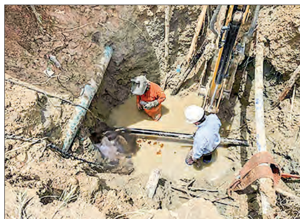
MOGE personnel repair a leaking natural gas pipeline beneath Ayeyawun Road in Thakayta Township.

Members of the public who notice similar gas leaks are urged to contact the Ywama Natural Gas Distribution Station of MOGE at 09 795503828. – MNA/KZL