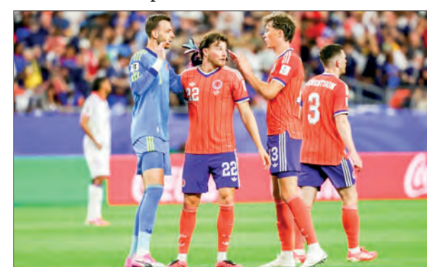
Scotland are off to a winning start at the World Cup.

"I think we've proven that over the years," added the 32-year-old, who has just signed for Tottenham Hotspur after almost a decade at Liverpool.