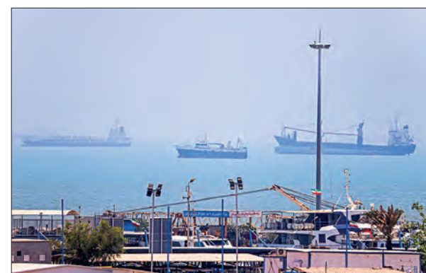
In this picture obtained from Iran's ISNA news agency on 18 June 2026, vessels are seen anchored in Bandar Abbas along the Strait of Hormuz.

served 25 verified commercial vessel crossings