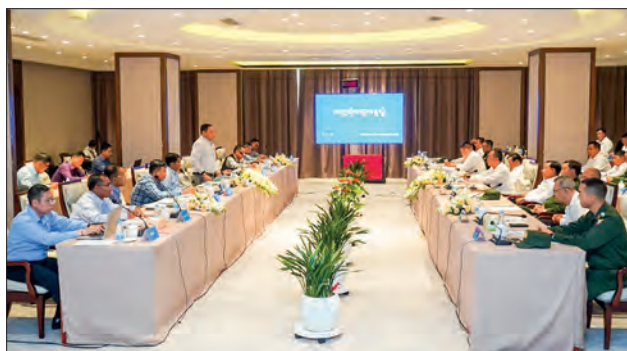
Images show the National Solidarity and Peacemaking Negotiation Committee (NSPNC) meets the National Democratic Alliance Army (NDAA) (L) and the United Wa State Party (UWSP) (R).