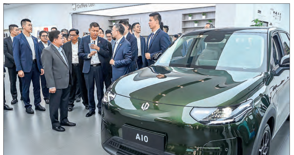
President U Min Aung Hlaing tours Zhejiang Leapmotor Technology Co Ltd in China.

At the conclusion of the visit, the chairman of Unitree Robotics presented the President with a specially designed robot as a commemorative gift, while President U Min Aung Hlaing presented return gifts before the two sides exchanged farewells.