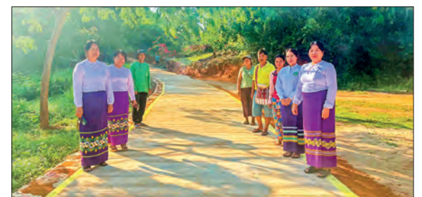
Officials and locals are pictured alongside the completed village concrete road in Tachilek Township.

The village concrete road project was implemented using K15 million from the 2026-2027 financial year Village Development Project fund together with public contributions. Construction was carried out by local villagers with technical assistance and close supervision from the department, beginning in the first week of May, and has now been completed in full. — Sein Lwin (Rural)