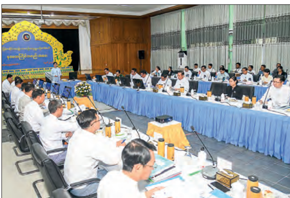
Vice-President Nan Ni Ni Aye addresses the ninth meeting of the Myanmar National Culture Central Committee yesterday.

Speaking at the meeting, the Vice-President said the national cultural heritage, which has endured for thousands of years, is a source of national pride and must be preserved and passed on to future generations to ensure its sustainability. The fossilized remains of some of humanity's earliest primates were discovered in Myanmar and that prehistoric periods such as the Stone Age, Bronze Age, and Iron Age developed continuously on Myanmar land. Moreover, there were emergence of recorded history, Pyu civilization and Pyu ancient