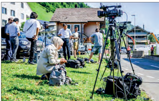
Talks that had been planned for Friday between the United States and Iran at the Burgenstock mountaintop resort in Switzerland have been postponed, according to a Swiss foreign ministry statement.

ISRAEL and Hezbollah agreed a ceasefire on Friday, a US official said, after deadly exchanges between the two sides in Lebanon put a deal to end the Middle East war under strain less than two days after it was signed.