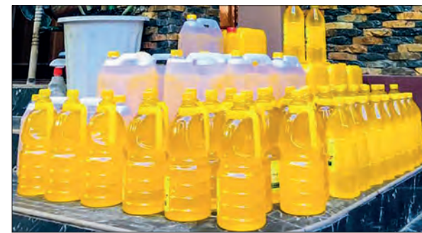
Cooking oil bottles are arranged for sale.

Despite the reference price, the market price is still high. To curb overcharging, the Consumer Affairs Department under the Ministry of Commerce informed consumers that they could lodge complaints about overcharging through the call centre hotline in late August. The