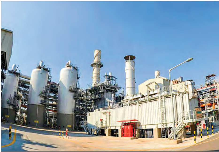
Kuwait's largest oil refinery at the Al-Ahmadi complex, about 40 kilometres south of the capital Kuwait City.

Kuwait has been seeking to gradually restore normal energy operations after the conflict disrupted maritime traffic through the Strait of Hormuz.