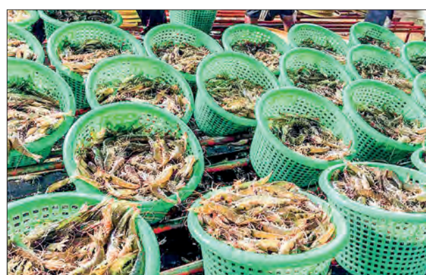
Shrimp sorted and ready for processing at a cold storage facility.

TANINTHAYI Region earned US$287.971 million in 2025-2026 financial year. The slight decline in export earnings during the 2025-2026 financial year was due to global economic conditions and difficulties related to fuel supplies in the transport sector.