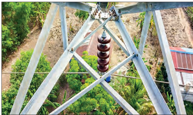
A view of the upper structures of a National Grid substation.

The offices and the public in the affected areas have been notified in advance. Similarly, the 33 kV Tatkon power line will be repaired and maintained from 8 am