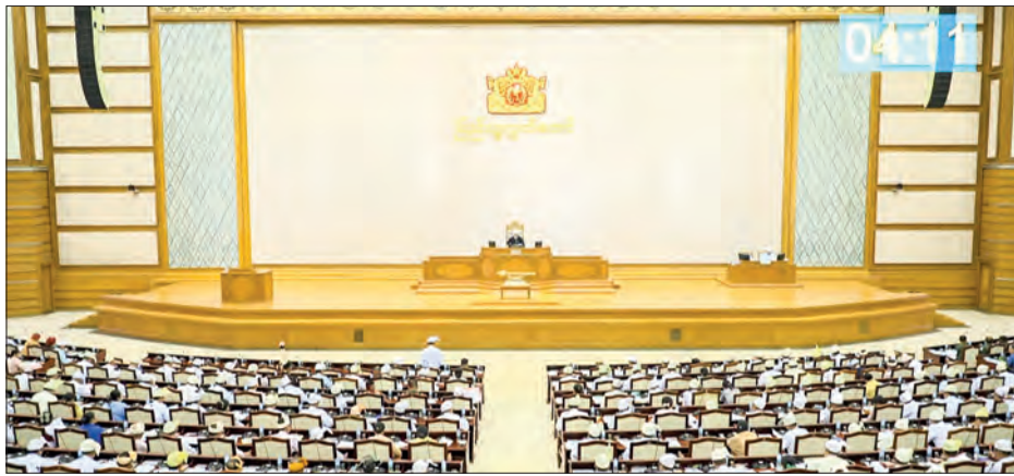
The 11 th -day meeting of the second regular session of the Third Pyithu Hluttaw is underway yesterday.