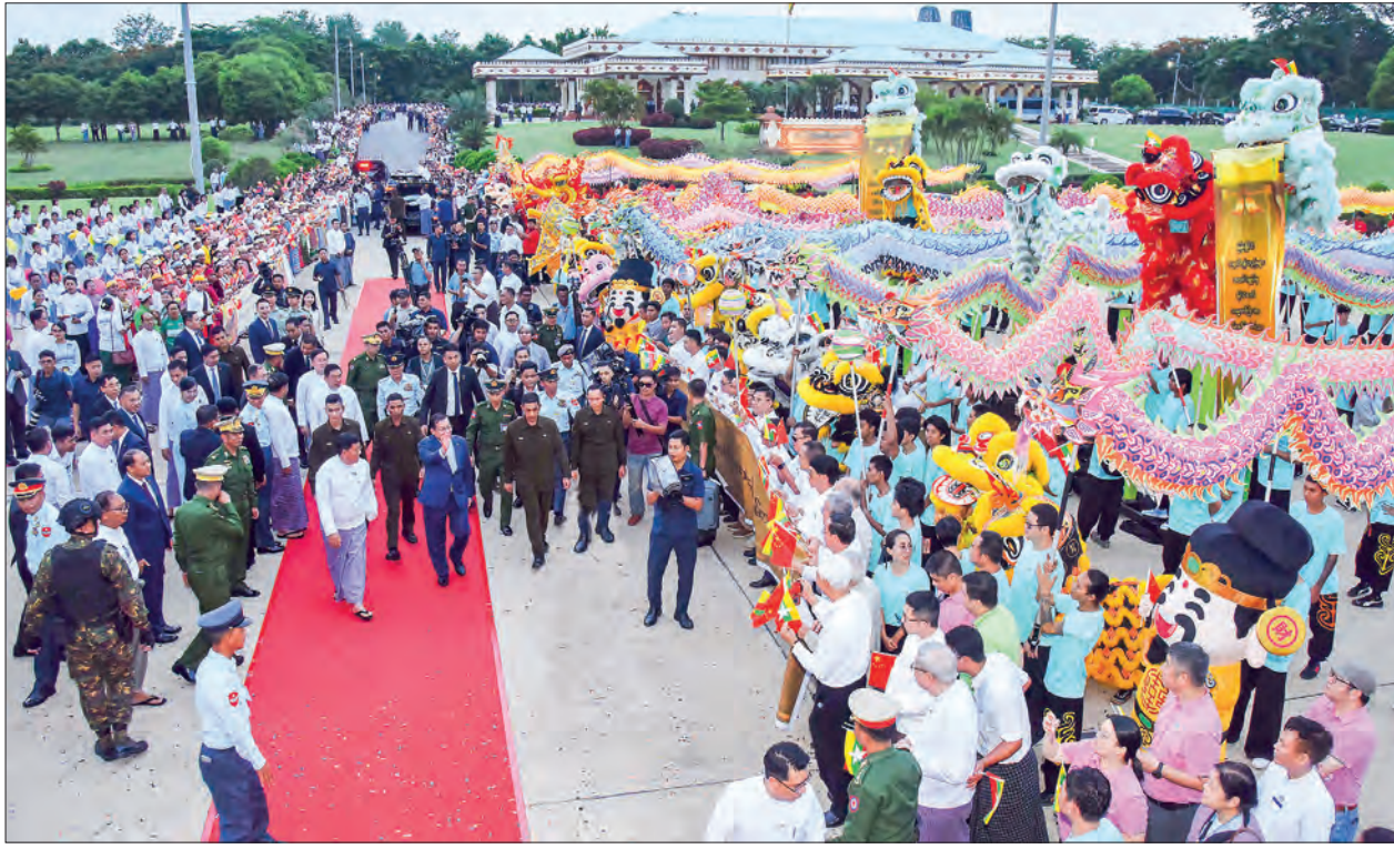
A massive crowd gathers to welcome President U Min Aung Hlaing back to Nay Pyi Taw yesterday following his State Visit to China.

The President-led high-level state visit to China further strengthened bilateral ties and cooperation between Myanmar and China.