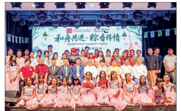
A group photo session at the festival.

The ceremony featured a diverse array of performances, including an introduction to the Dragon Boat Festival, a Q&A session, poetry recitations, and other interesting programmes. — TWA/ZN