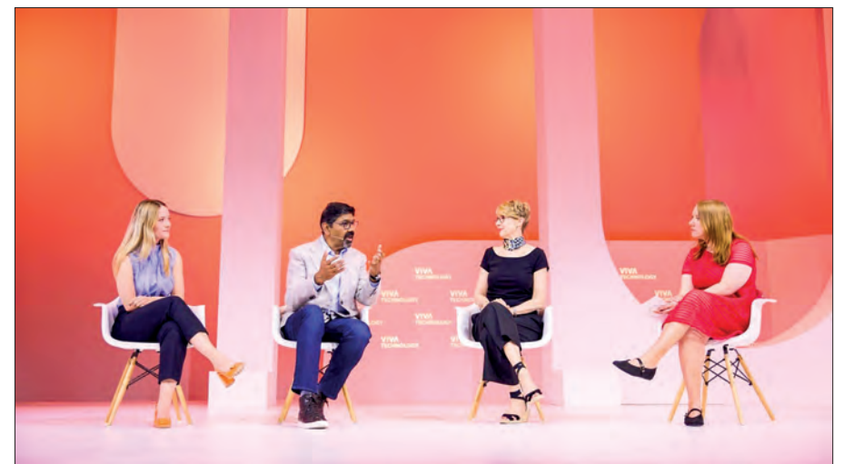
This image shows a panel discussion at the Viva Technology conference.

He said that the India pavilion shows the prowess of India's startup ecosystem. From world's first 3D printed rocket engine to advanced genetic en-