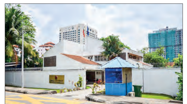
The Myanmar Embassy in Kuala Lumpur.

There are 350-450 people visiting the embassy on a daily basis and the embassy said it