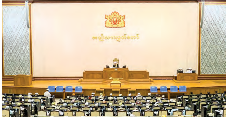
The eighth-day meeting of the second regular session of the Third Amyotha Hluttaw is in progress yesterday, presided over by Speaker U Aung Lin Dwe.

Deputy Minister for Transport U Aung Myaing answered the questions raised by U Khin Maung Htay from the Magway Region Constituency 7, stating that with regard to prevention of enforcement actions arising from expired vehicle and driver’s licences currently in use in Gangaw, Htilin, and Saw townships, instructions have already been issued on 18 May 2026 that the