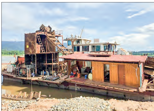
A barge used for illegal gold mining operations near Wanlang Village in Tachilek.

AUTHORITIES have arrested a total of 19 foreign nationals, including 17 Chinese men and two Lao men, in connection with illegal gold mining activities near Wanlang village, Kanglek, Tachilek