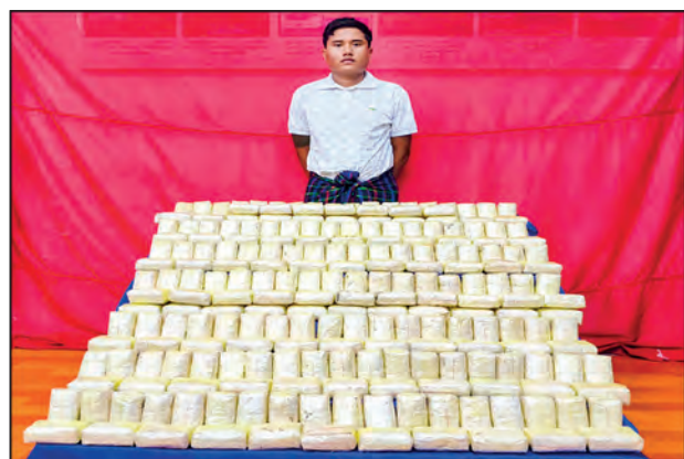
An arrestee is seen along with seized drugs.

The government is constantly implementing anti-drug activities that tarnish the prestige of the state and destroy all of humanity by partnering with public and international organizations. It is also reported that the public needs to report information about drugs to the authorities in time and that any organization that is involved in the seized drugs will be taken effective and severe action. — MNA/MKKS