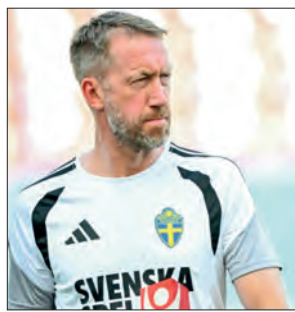
Sweden head coach Graham Potter oversees a World Cup training session.

GRAHAM Potter took charge of Sweden in October with both coach and team in need of a reset. Now they are one game from the World Cup knockouts.