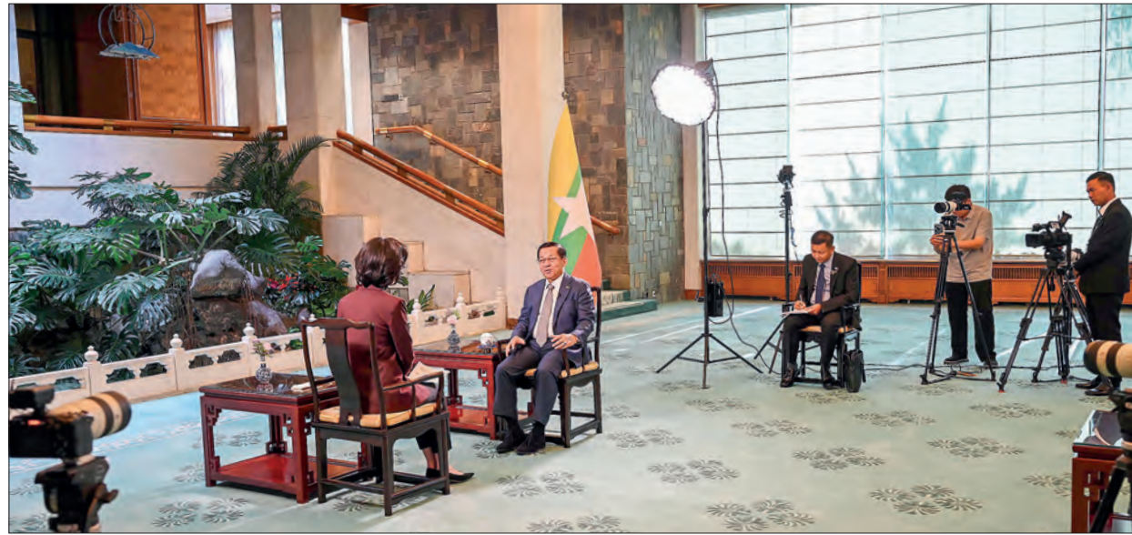
President U Min Aung Hlaing sits down for an interview with a senior China Central Television (CCTV) News presenter on 17 June 2026.

Interviewer: Hello, President U Min Aung Hlaing. This visit marks your first goodwill trip to China since assuming office as President in April. Accompanying you on this visit are six Union-level ministers and several senior military officials. So, I notice it is a high-level delegation. What outcomes do you hope to