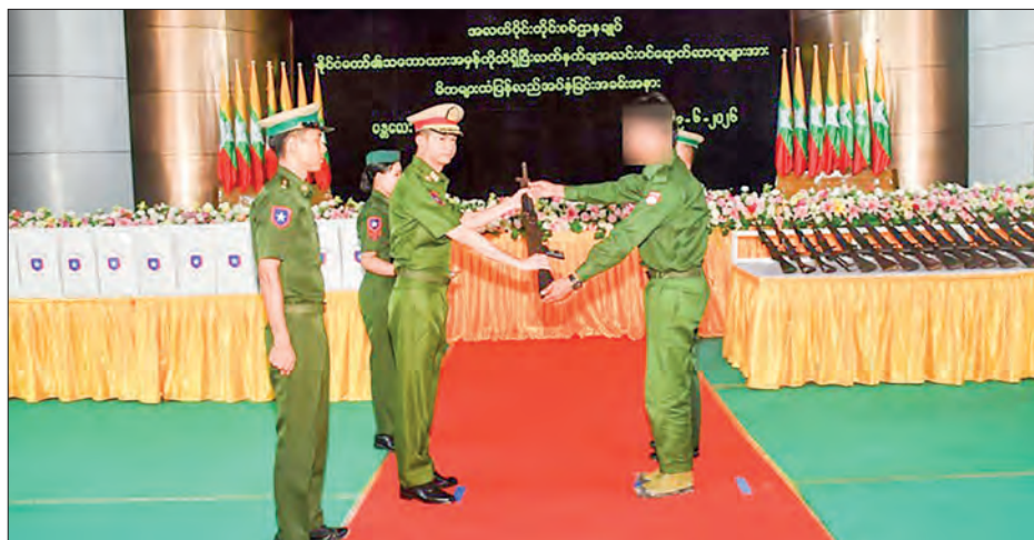
A handover ceremony for returnees is underway at the Central Command Headquarters.

The region chief minister presented K120 million for 24 rifles, K4 million for two pistols, K6 million for 12 homemade guns, K1.5 million for five grenades, K600,000 for three walkie talkies, K200,000 for one binocular, K31.4 million for 314 return-