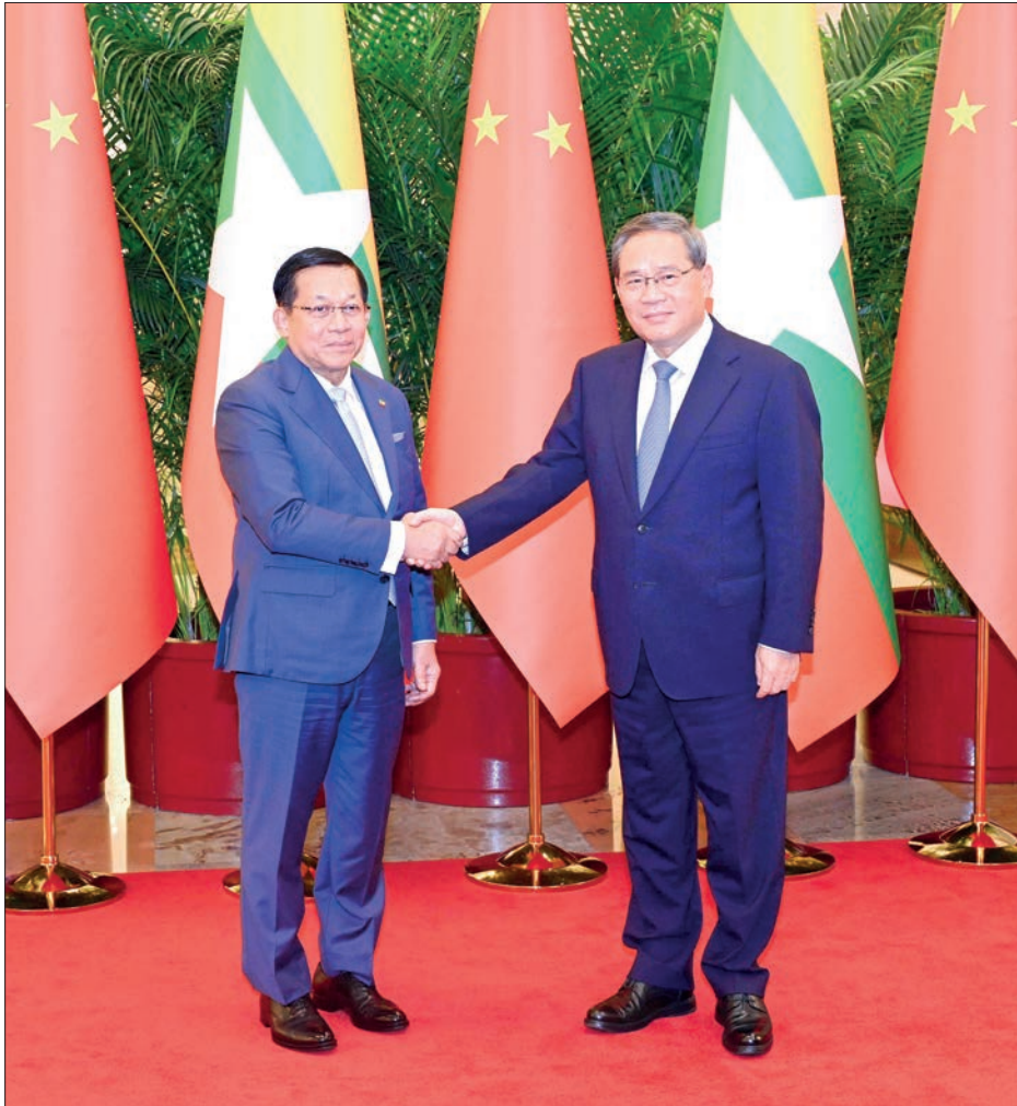
Myanmar President U Min Aung Hlaing exchanges handshakes with Chinese Premier Mr Li Qiang during their meeting yesterday.

President U Min Aung Hlaing described the visit as an important opportunity to further strengthen the traditional friendship and strategic partnership between the two countries.