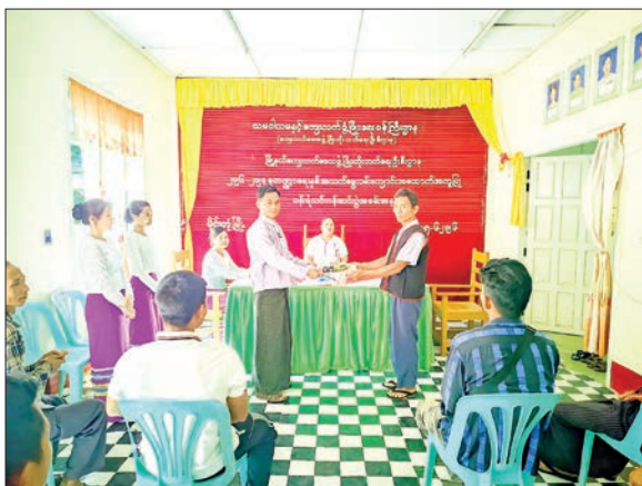
The closing ceremony of the masonry training course is underway yesterday in Mongton, Shan State (East).

THE Department of Rural Development under the Ministry of Cooperatives and Rural Development held a graduation ceremony for a masonry training course designed to support livelihood opportunities and produce skilled workers for rural residents at the department's meeting hall in Mongton Township yesterday.