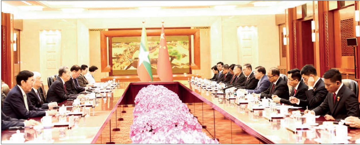
President of the Republic of the Union of Myanmar U Min Aung Hlaing holds talks with Chairman Mr Zhao Leji of the Standing Committee of the National People's Congress (NPC) yesterday.

P RESIDENT of the Republic of the Union of Myanmar U Min Aung Hlaing, who is in the People's Republic of China on his State Visit, held a meeting with Chairman Mr Zhao Leji of the Standing Committee of the National People's Congress (NPC) at the Great Hall of the People yesterday afternoon.