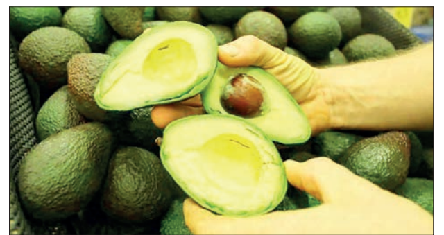
An interior view of locally grown Myanmar avocados.

Next, Chinese investors are also seeking to invest in packing house facilities designed to fulfil international criteria. Consequently, invitations were extended to them. The detailed discussions are ongoing.