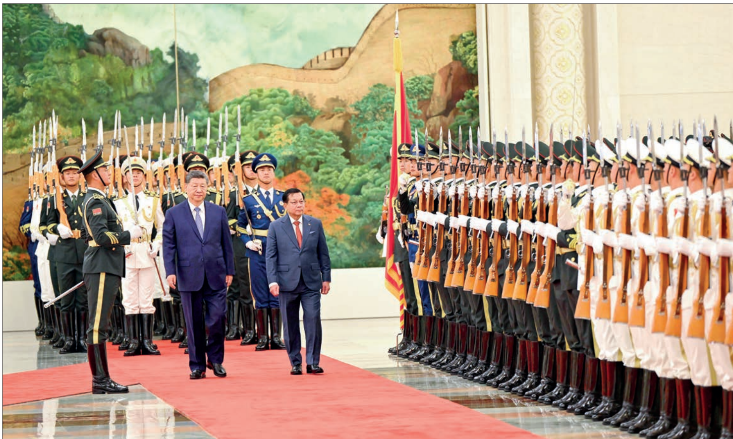
Myanmar President U Min Aung Hlaing and Chinese President Mr Xi Jinping inspect the Guard of Honour at the Great Hall of the People in Beijing, China.

The Myanmar government has initiated implementation of the Nationwide Ceasefire Agreement (NCA) while collaborating with China to combat cross-border telecom fraud, illegal gambling, and narcotics trafficking, alongside efforts to reopen vital border posts and trade routes.