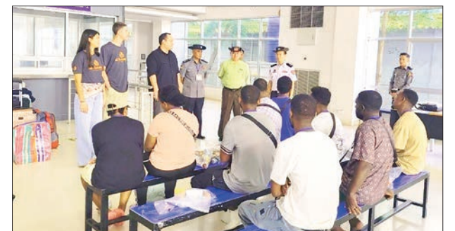
Immigration officials oversee the deportation of undocumented foreign immigrants.

Authorities also said Myanmar continues to cooperate with neighbouring countries and international organizations to combat online scam operations and ensure the repatriation of foreign nationals involved or trafficked. — MNA/KZL