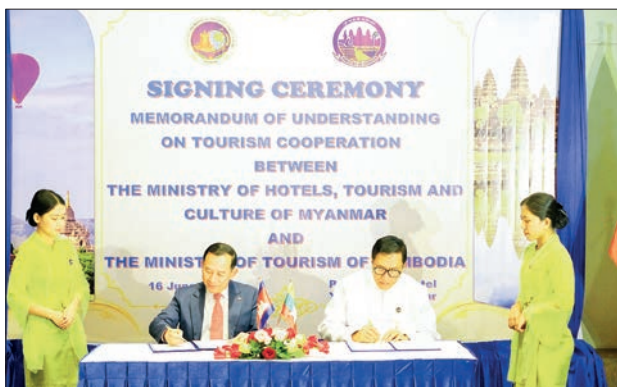
Union Minister U Maung Myint and Cambodian Tourism Minister Mr Huot Hak sign the tourism cooperation MoU in Yangon yesterday.

The signing ceremony of the Memorandum of Understanding (MoU) on tourism cooperation between Myanmar and Cambodia was held. The Union minister and the Cambodian Minister of Tourism signed the MoU on tourism cooperation between the two countries.