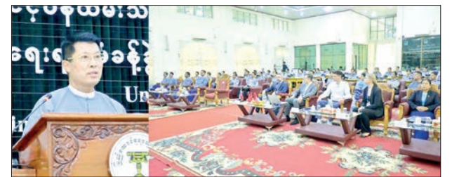
The opening ceremony for a training course on Digital Transformation in Public Administration is underway yesterday.

Following the ceremony, the chairman met trainees from the Mid-Level Officer Training Course No 15 and Clerical Staff Training Course No 116, inspected mushroom and seasonal crop cultivation projects at trainee dormitories, and later had lunch with trainees from Junior Officer Training Course No 106.