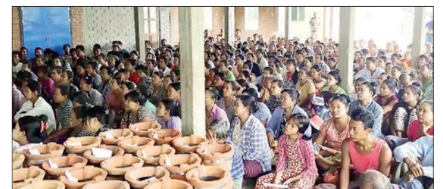
The distribution ceremony of energy-efficient A-One stoves in Yenangyoung Township.

Following the remarks, the relevant authorities formally and systematically handed over the 610 A-One stoves to 610 households and residents from Bukyun Village. — TWA/ZN