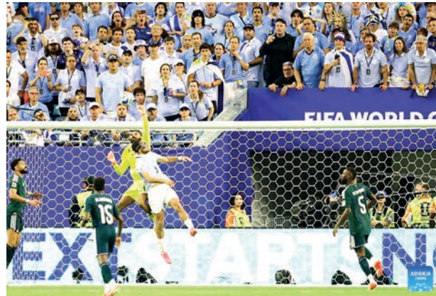
Saudi Arabia's goal keeper Mohammed Alowais fights to save a goal during the group H match between Saudi Arabia and Uruguay at the 2026 FIFA World Cup at Miami Stadium, Miami, the United States, 15 June 2026.

Uruguay was more aggressive in the second half but didn't break through until Maximiliano Araujo fired a rebound past goalkeeper Mohammed Alowais from close