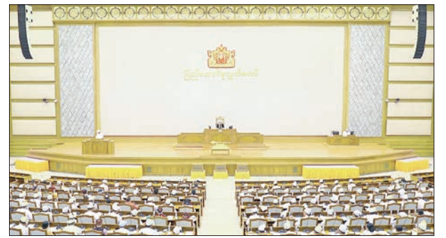
The third-day meeting of the second regular session of the Third Pyidaungsu Hluttaw is in progress yesterday, presided over by Speaker U Aung Lin Dwe.

Pyidaungsu Hluttaw Speaker U Aung Lin Dwe announced the plan to establish the Myanmar Parliamentary Union (MPU) with Pyidaungsu Hluttaw Speaker U Aung Lin Dwe as Chair, Pyithu Hluttaw Speaker U Khin Yi as Vice-Chair, Pyidaungsu Hluttaw Deputy Speaker Jang Phang Naw Taung (aka) U Naw Taung as Secretary, Pyithu Hluttaw Deputy Speaker U Maung Maung Ohn as member, together