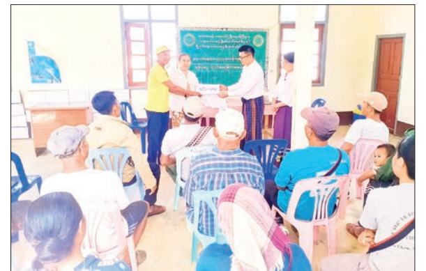
Village representatives receive the Rural Business Fund in Kengtung Township.