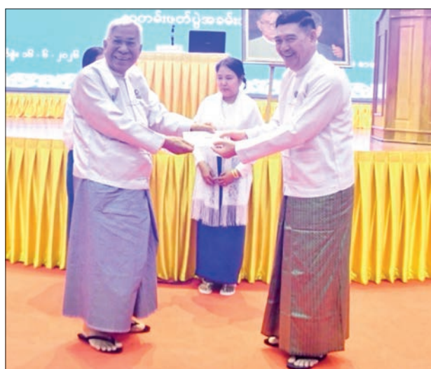
Union Minister U Htein Linn presents awards the MMPO chairperson at yesterday's event.

The paper-reading session was attended by Union Minister for Information U Htein Linn, the Yangon Region minister for Information, Relief and Religious Affairs, scholars from various fields of literature, film, theatre, music, invitees and interested parties. Union Minister U Htein Linn delivered the opening speech, stating that the paper-reading session is a very important record for the history