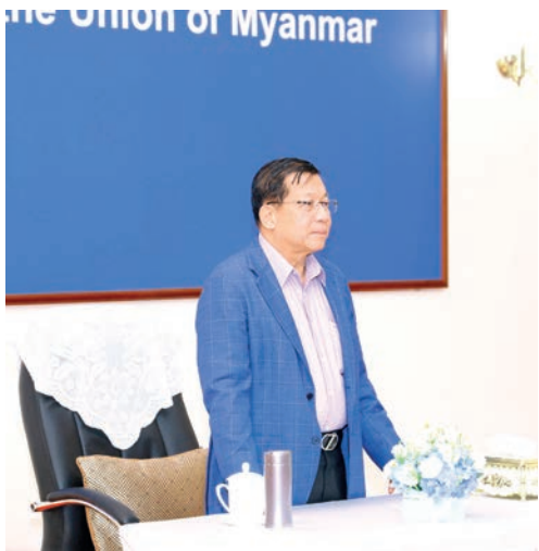
President U Min Aung Hlaing speaks at the meeting with the staff and family members of the Myanmar Embassy and Military Attaché Office, and Myanmar scholarship students in Beijing.

In his address, President U Min Aung Hlaing said the visit was his first State Visit to China since