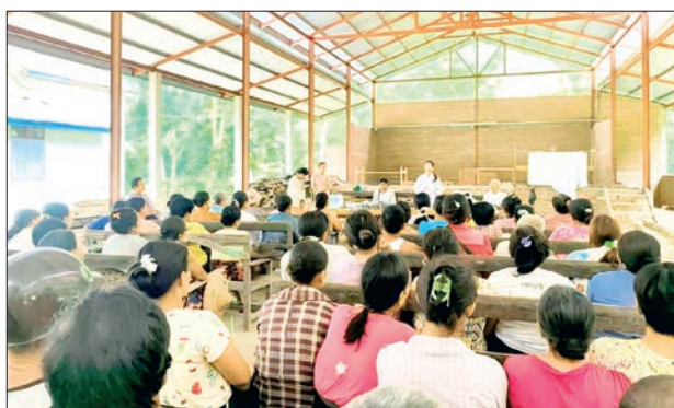
The disbursement ceremony of the Mya Sein Yaung Village Project funds is underway yesterday in Kangyidaunt Township.

THE Department of Rural Development held a ceremony to disburse revolving funds under the Mya Sein Yaung Village Project in Pyinkadoechaung Village, Kangyidaunt Township, yesterday. The funds were provided with the aim of increasing household incomes of rural residents in Maedwaychaung, Yaykyaw and Pyinkadoechaung