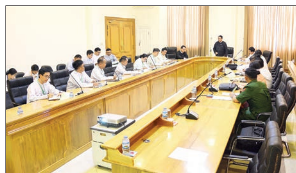
Pyithu Hluttaw Speaker U Khin Yi holds talks with members of the Hluttaw's International Relations Committee yesterday.

During the meeting, the Speaker said Hluttaw activities should be made more widely known to the public in line with the motto "Voice of the people – voice of the Hluttaw, will of the people – will of the Hluttaw, hopes of the people – implemented by the Hluttaw," and emphasized the use of