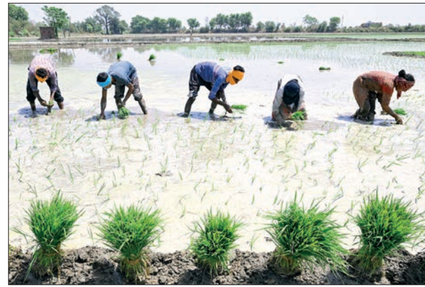
Farmers plant rice saplings in a waterlogged field on the outskirts of Amritsar on 8 June 2026.

"Such districts should be clearly identified and crop-wise contingency