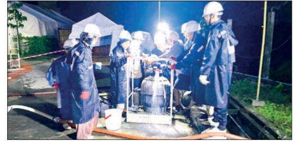
Participants attend the National Emergency WASH Training jointly organized by the Myanmar Red Cross Society and the Danish Red Cross.

THE Myanmar Red Cross Society's Health Department and the Danish Red Cross jointly conducted a National Emergency WASH Training at the society's headquarters in Nay Pyi Taw from 10 to 16 June.