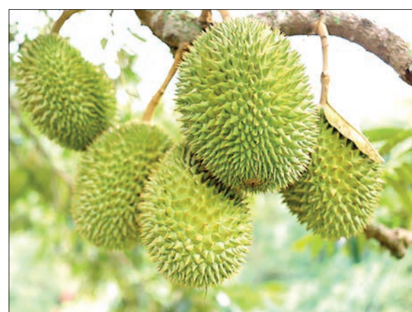
This image depicts Myanmar durians designated for export.

farms across the country, primarily in Yangon Region, Mon State, Kayah State and Taninthayi Region.