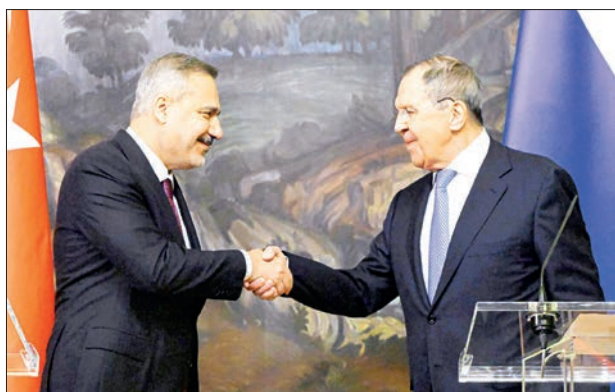
Turkish Foreign Minister Hakan Fidan and Russian Foreign Minister Sergey Lavrov shake hands during a joint news conference following a meeting in Moscow, Russia.

RUSSIA and Turkiye have agreed to ensure security in the Black Sea region amid Kiev's provocations, Russian Foreign Minister Sergey Lavrov said