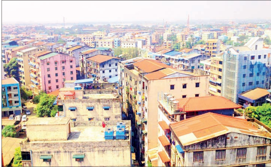
High-storey residential buildings in downtown Yangon.