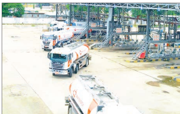
Fuel tankers are seen departing for distribution in regions states.

The price index set by Mean of Platts Singapore (MOPS), the pricing basis for many refined products in Southeast Asia, influences the domestic fuel