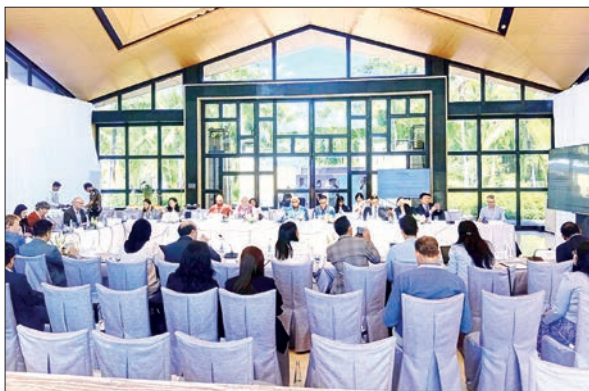
The Asia Video Industry Association (AVIA) Policy Round Table 2026 is underway in Bali, Indonesia.

THE Asia Video Industry Association – AVIA Policy Round Table 2026 was held on 16 June at the Mulia Resort in Bali,