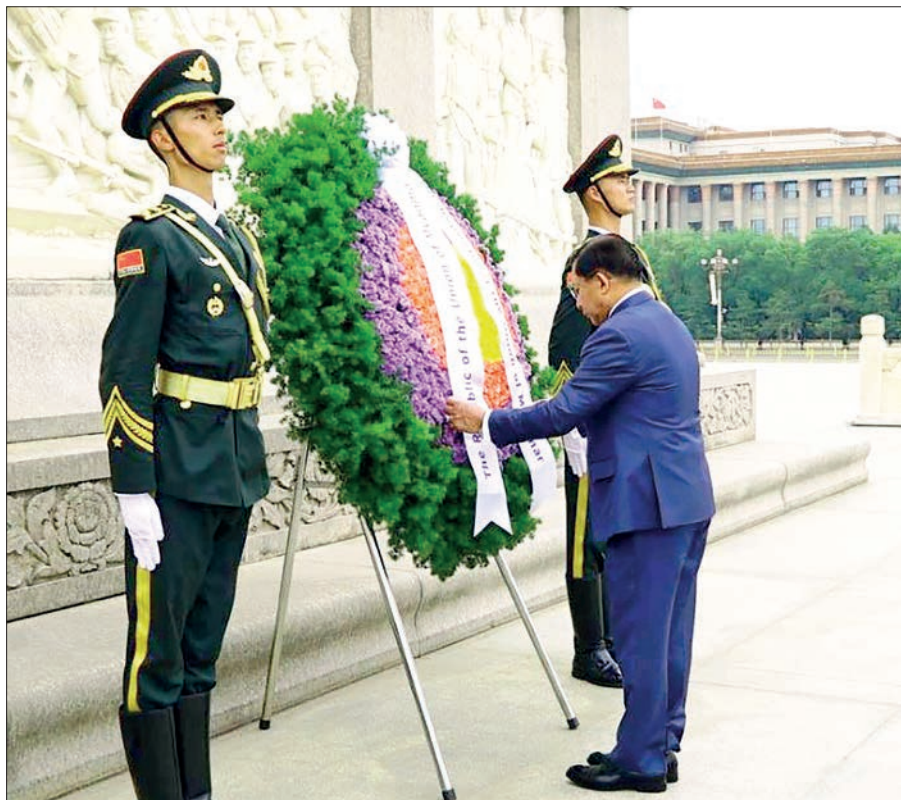
Myanmar President U Min Aung Hlaing lays a wreath at the Monument to the People's Heroes at Tiananmen Square in Beijing, China.

The President and his entourage arrived at the Monument to the People's Heroes, where they were welcomed by senior officers from China. The military band played the national anthems of the two countries. The President, who took position behind two officers conveying the wreath, followed by senior officers from the China and Myanmar delegations, marched to the