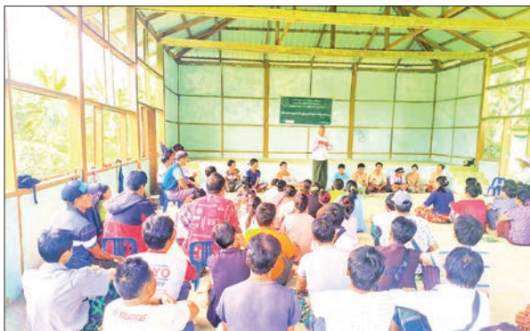
The fund disbursement ceremony of the Mya Sein Yaung Village Project is in progress yesterday in Tanai Township.

THE Department of Rural Development held a ceremony to disburse revolving funds under the Mya Sein Yaung Village Project in Yenangon Village, Monghkun Village-tract, Tanai Town-