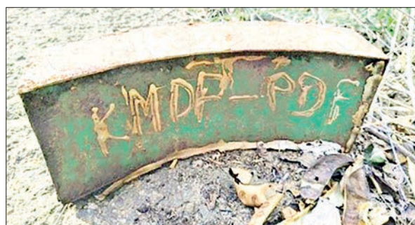
All explosives were safely deactivated and removed to prevent harm to civilians and travellers.

Acting on information provided by locals, security personnel carried out clearance and security operations on 15 June after detecting that roads used by the public had been targeted with explosive