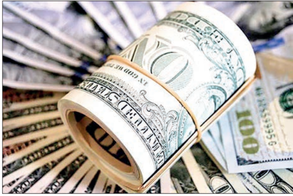
Greenbacks are seen at a money changer counter.

THE Central Bank of Myanmar (CBM) sold over US$3.37 million to edible oil-importing companies and over $6,300 to CMP companies on 15 June, along with over $10,200