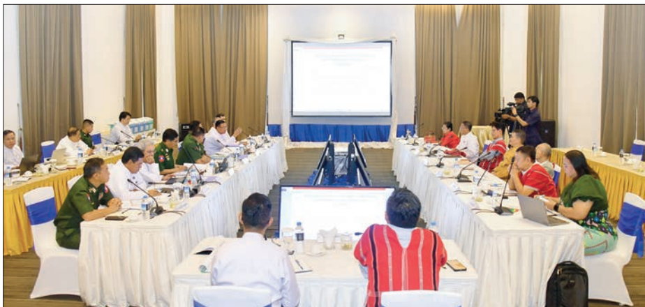
The second day of the informal meeting between the National Solidarity and Peacemaking Negotiation Committee and the negotiating team of the Nationwide Ceasefire Agreement-Signatory Ethnic Armed Organizations is underway in Nay Pyi Taw yesterday.

reviewed and recorded the outcomes of the two-day negotiations and discussions. They exchanged views and coordinated on matters relating to the objectives and approaches for implementing the peace process and working together step by step to ensure its success; cooperation in holding effective peace talks and jointly implementing the agreements stipulated in the NCA;