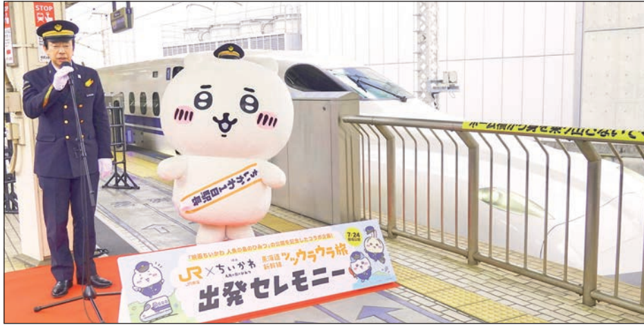
Manga character Chiikawa (R) becomes the station master of Tokyo Station for a day in the Japanese capital on 10 June 2026.

A Chiikawa mascot appeared on a platform at one of the capital’s busiest stations and gave the departure signal for a Tokaido shinkansen train