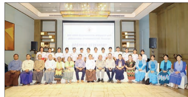
Participants attend the Red Cross awareness workshop and communications training course opening ceremony in Yangon.

A workshop on Red Cross awareness and the opening ceremony of a communications training course for field personnel were held at the Pan Pacific Hotel in Yangon on the morning of 8 June.