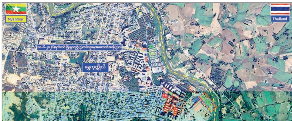
An aerial drone view of the ongoing demolition of the scam-related facilities in Shwe Kokko, Myawady.

Officials added that efforts to combat online scams and illegal gambling operations are carried out as a national priority in cooperation with neighbouring countries. — MNA/KZL