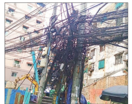
Wi-Fi cables are seen on poles in Yangon.

Relevant internet service providers and the Yangon Electricity Supply Corporation (YESC) are currently working together to organize the numerous cables suspended along major roads in