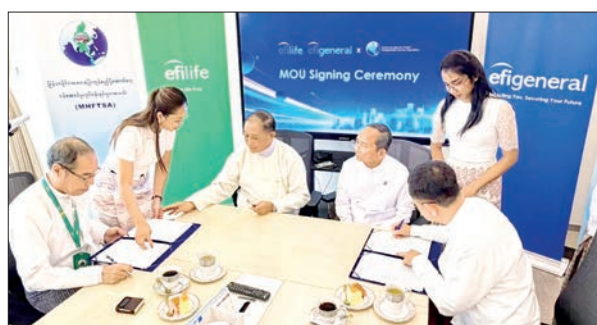
MHFTSA and EFIG Insurance are pictured during the signing of the MoU.

MHFTSA and EFIG Insurance will also organize regular "Insurance Knowledge Sharing Workshops" to help mem-