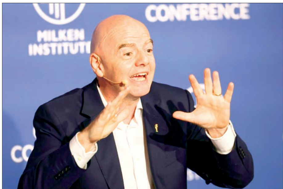
FIFA chief Gianni Infantino faces a potentially tough ride as he addresses the media on the eve of the World Cup.

FIFA President Gianni Infantino is set to face the media on the eve of the World Cup on Wednesday, as off-field distractions dogged the build-up to the tournament.