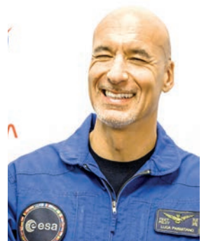
Italian astronaut Luca Parmitano will pilot Artemis III, part of a series of missions geared toward returning humans to the Moon.

"I feel honoured that I was chosen for this role," he said. "It was unexpected because I didn't know that it was in the run for that position." — AFP