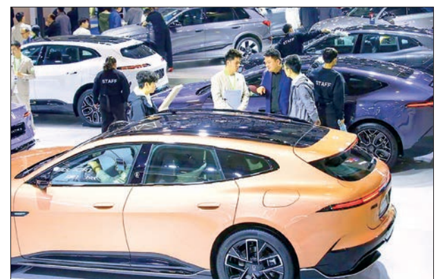
People visit an auto show in Jinan, east China’s Shandong Province, 10 April 2026.

Overall, automobile output and sales in May stood at 2.616 million and 2.629 million units, expanding on a monthly basis but falling slightly year on year, with the decline narrowing