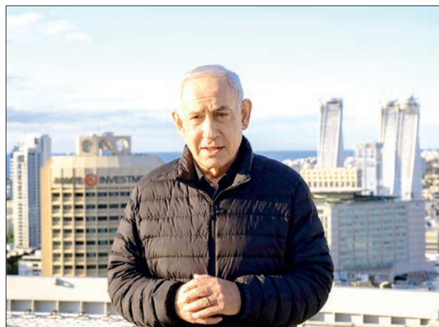
Israeli Prime Minister Benjamin Netanyahu speaks at the Kirya military headquarters in Tel Aviv, Israel, 1 March 2026.

ISRAELI Prime Minister Benjamin Netanyahu will run in Israel's next election, his right-wing Likud party said Wednesday.