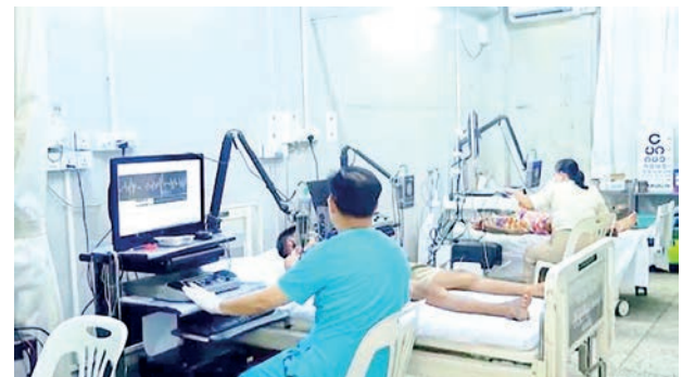
This photo features patients receiving medical treatment at the Neurology Department, Yangon General Hospital.