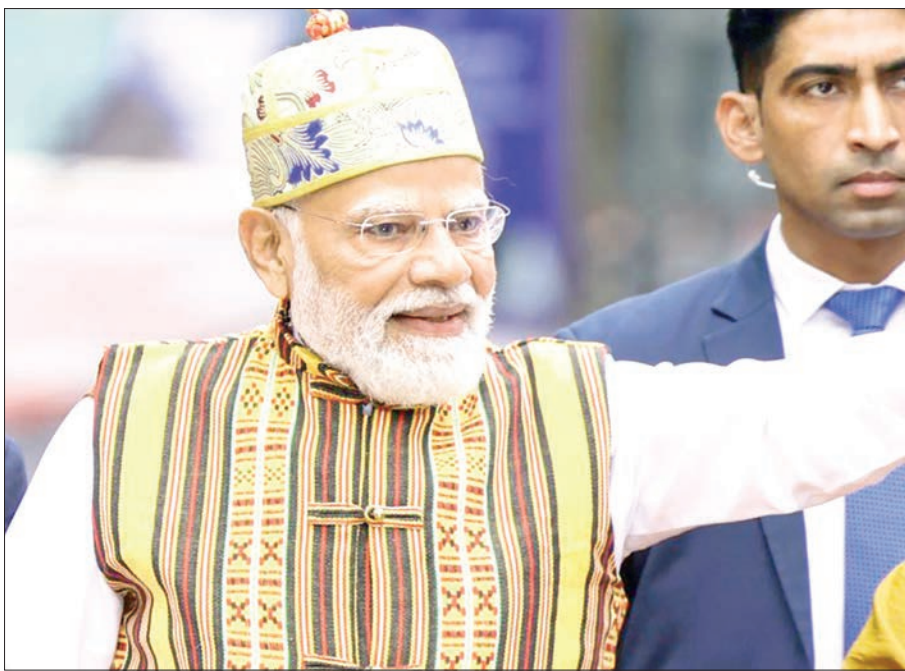
Prime Minister Narendra Modi received warm congratulations from world leaders on the eve of his becoming the longest-serving continuous elected Prime Minister of India.

World leaders specifically highlighted his transformative governance model and his strong advocacy for the nations of the Global South.