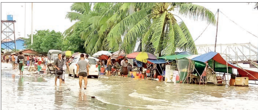
People waded through a flooded area near Sint Oh Tan jetty on the bank of the Yangon River during the high tides of the River.

“Due to changes in the monsoon wind patterns, strong monsoon rain is entering Myanmar from the south and southwest of the country. As a result, Taninthayi Region is expected to receive the highest rainfall, while Rakhine, Chin, Mon, Kayin, Ayeyawady and Yangon regions are at Level-7 for heavy rainfall potential. Yangon, being densely populated and situated along the Yangon River, needs to pay special attention from 13 to 15 June because of the exceptionally high tides. River water levels may rise more than 22 feet above the basic water level, and if this coincides with heavy rain, low-lying wards, riverside neighbourhoods and village roads throughout Yangon may be flooded. The risk period is from 10 to 15 June, especially the three days from the 14 th waxing day of Nayon