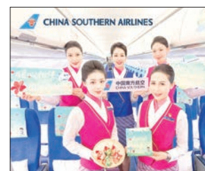
Cheerful, friendly cabin crew members from China Southern Airlines.

The travel industry notes that this expansion in flight schedules is expected to help improve travel and trade relations between Myanmar and China. — TWA/ZN