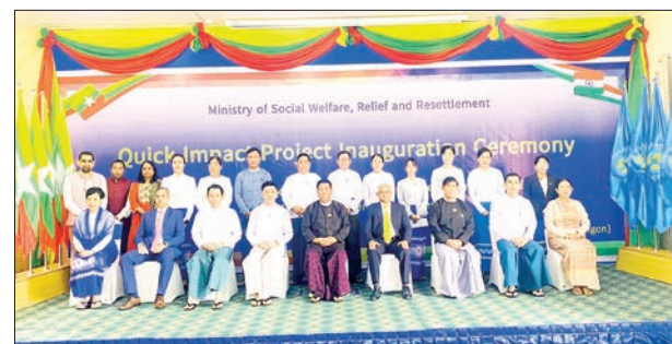
The completion ceremony for the installation of a large multi-display system at the Emergency Operations Centre (Yangon) in progress in Yangon yesterday.

During the ceremony, the deputy minister and the Indian ambassador jointly inaugurated the large multi-display system and delivered commemorative remarks. The deputy minister also presented a certificate of appreciation to the Indian Ambassador in recognition of the successful completion of the project. — MNA/KZL