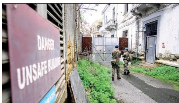
British members of the UN Peacekeeping Force in Cyprus patrol the buffer zone separating the internationally recognized Republic of Cyprus and the breakaway Turkish Republic of Northern Cyprus in the divided capital Nicosia on 17 February 2026.

that controls the island's majority Greek Cypriot south. — AFP