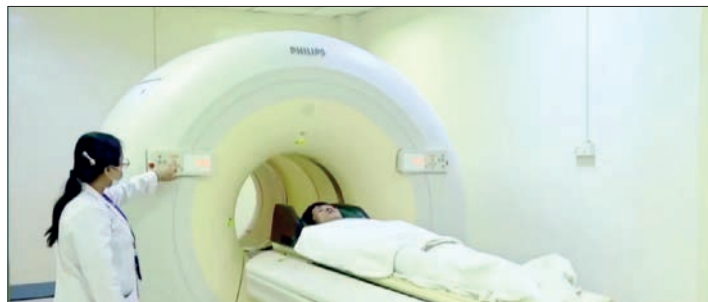
Diagnostic and treatment procedures using SPECT-CT and PET-CT scanners at the Yangon General Hospital.

YANGON General Hospital is set to enhance its medical services by installing a new SPECT-CT scanner this year, enabling more effective treatment capabilities for patients.