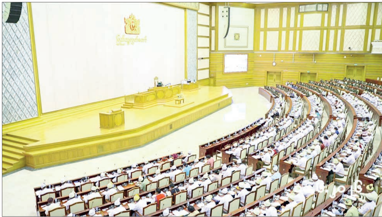
The Pyithu Hluttaw holds its fifth-day meeting of the second regular session of the Third Pyithu Hluttaw at the Hluttaw building in Nay Pyi Taw yesterday.

T HE second regular session of the Third Pyithu Hluttaw was held for the fifth day at its building in Nay Pyi Taw yesterday morning, attended by 349 out of 351 Pyithu Hluttaw representatives.