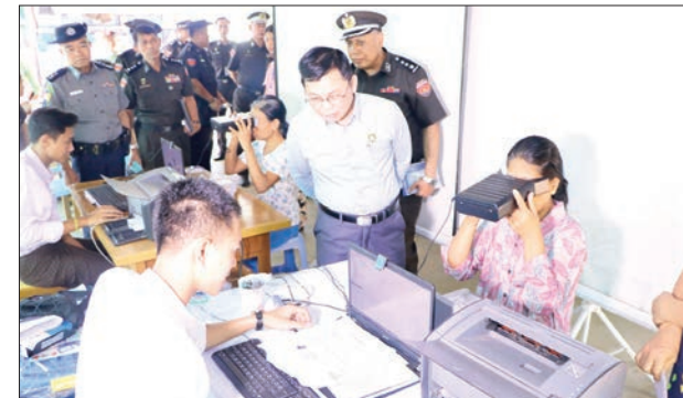
Union Minister U Myint Kyaing observes the office work at the Sagaing Township Immigration Office yesterday.

REPAIR work is underway at the Sagaing Township Immigration Office following damage caused by a timed explosive device. Financial assistance and food supplies were also provided to township office staff.