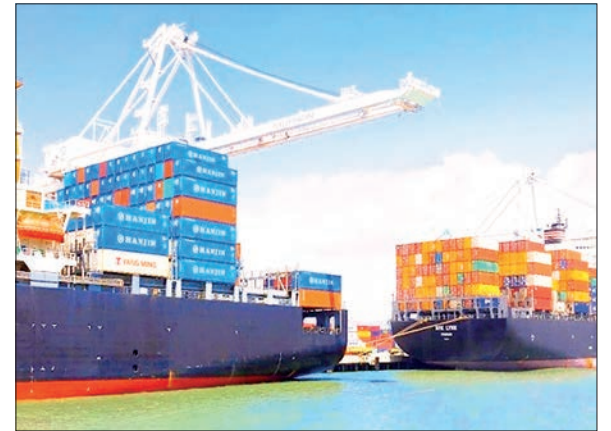
Container vessels are seen docking at Yangon Port.

The MGMA, on behalf of the CMP Import-Export Supervisory Sub-Committee, screens recommendations for CMP import licenses. Applications are processed through the Ministry of Commerce's Tradenet 2.0