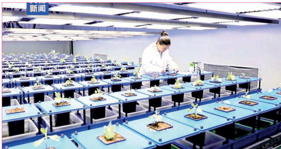
The Chinese Academy of Sciences launched the "Black Soil Granary" science and technology initiative, bringing together 98 institutions nationwide to tackle key challenges in black soil protection.

This region accounts for approximately 25 per cent of China's total grain production.