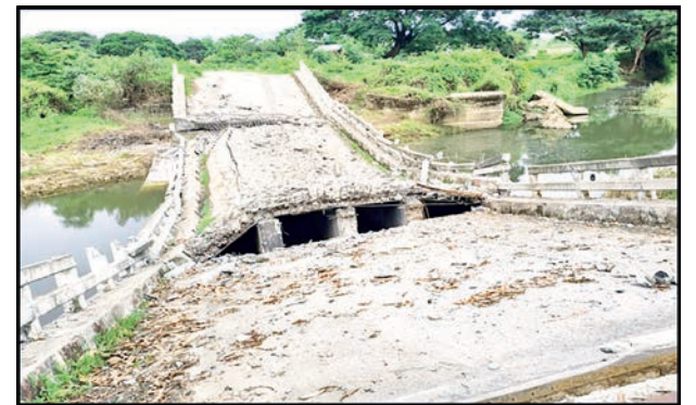
The photo depicts the 55-Mile Bridge exploded by terrorist groups.

destroyed by the terrorist groups. They also found that within villages along the route, houses, religious buildings and departmental offices had been fortified with trenches and sandbag bunkers and used as military bases.