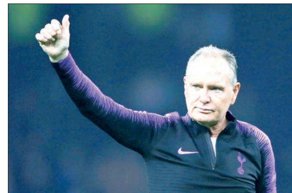
Paul Gascoigne won 57 caps for England.

Thomas Tuchel's men face Costa Rica in their final friendly on Wednesday before a Group L opener against Croatia in Dallas on June 17. — AFP