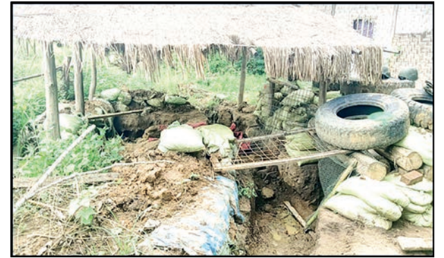
Defensive trenches and bunkers made by terrorists in 55-Mile Village.

During the operations along the route, Tatmadaw columns discovered damaged roads and bridges, including the Nanmut Tar Bridge and the 55-Mile Bridge, which had been