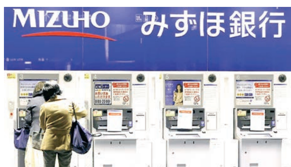
The three institutions officially agreed to establish a dedicated regulatory council.

yen. They plan to expand the number of financial institutions where customers can use the digi-