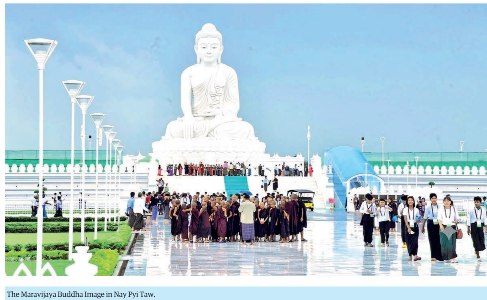
The Maravijaya Buddha Image in Nay Pyi Taw.