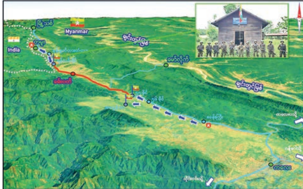
The map shows the reopening of the Kalay-Tamu route.

The combined PDF terrorist groups temporarily controlled and blocked the Kalay-Tamu road starting in 2024, and carried out acts of violence, including extorting tolls from cargo and passenger vehicles, threatening travellers with weapons, arresting and killing civilians, burning and destroying vehicles, and looting goods. Therefore, travellers and cargo trucks no longer dared to use the route, causing delays in transport, a decline in border trade, shortages of food and consumer goods, and rising commodity prices in the region. Moreover,