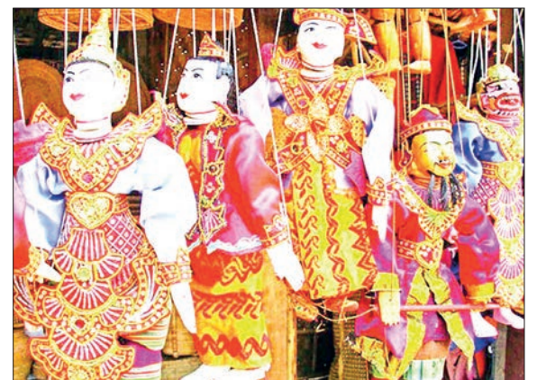
This photo shows Myanmar theatrical marionette.