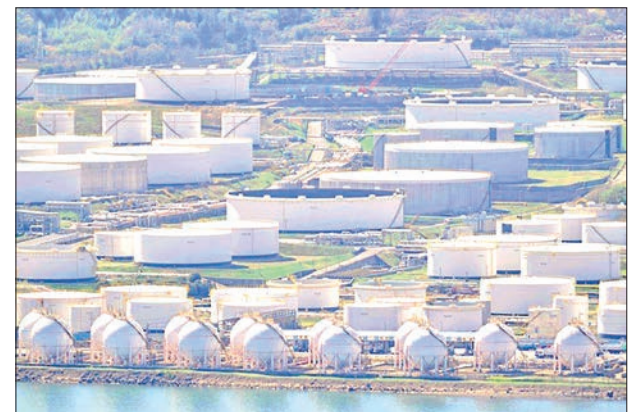
Oil tanks and facilities at Yeosu National Industrial Complex, the largest petrochemical industrial complex in South Korea.

Revenue among construction companies declined 9.6 per cent last year, while those in the oil refining, chemical and electrical equipment sectors reduced in single digits. Corporate profitability improved. The ratio of operating profit to revenue advanced to 6.2 per cent in 2025 from 5.4 per cent in the previous year. The ratio for manufacturers climbed from 5.5 per cent to 6.9 per cent in the cited period amid higher semiconductor price, while the reading for non-manufacturers mounted from 5.2 per cent to 5.4 per cent. — Xinhua