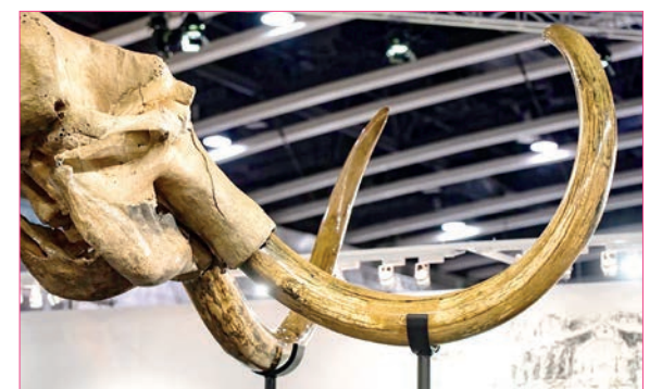
This image shows a woolly mammoth skeleton, specifically the head and tusks.