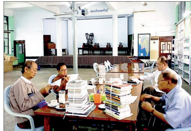
This photo features the subject-specific subcommittee coordination meeting (preliminary stage) for the selection and awarding of the 2025 National Literary Awards from among books published in 2025.

Committee comprises 20 members, including literary scholars, intellectuals, subject-matter experts, and experienced professionals from the printing and publishing industry. The selection process is conducted systematically in three stages—preliminary screening, shortlisting, and final approval—according to the respective subject categories. — TWA/TH