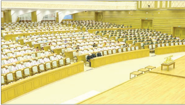
The second day meeting of the second regular session of the Third Pyidaungsu Hluttaw is underway yesterday, presided over by Pyidaungsu Hluttaw Speaker U Aung Lin Dwe.

The Speaker presented the appointment of ministers, advocates-general, auditors-general, chairmen of the leading bodies of self-administered zones