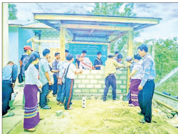
Trainees are seen in a practical training session in Mongton Township, eastern Shan State.

THE Department of Rural Development under the Ministry of Cooperatives and Rural Development, Mongton Township, Mongton District, Shan State (East), inspected the ongoing vocational masonry training