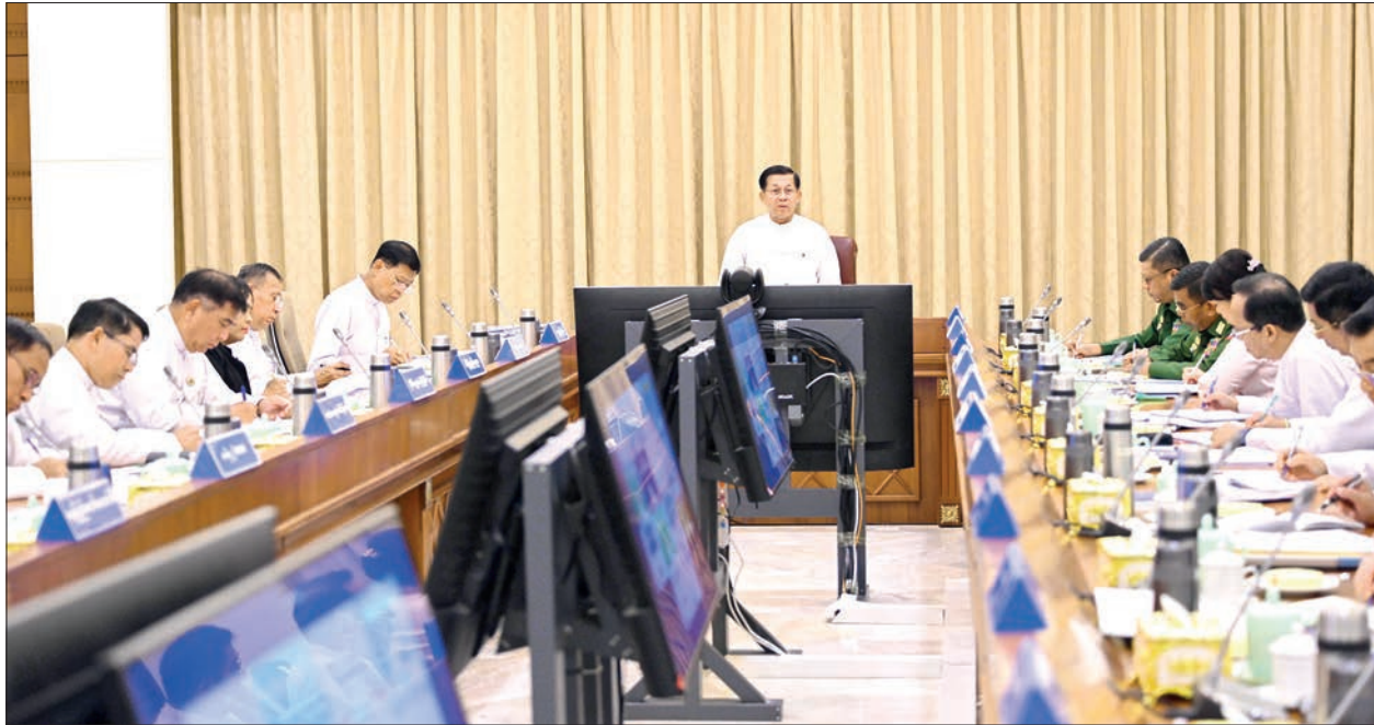
President U Min Aung Hlaing speaks at the meeting of the National Water Resources Committee in Nay Pyi Taw yesterday.

Stakeholders must explore freshwater resources to commercialize water-related products