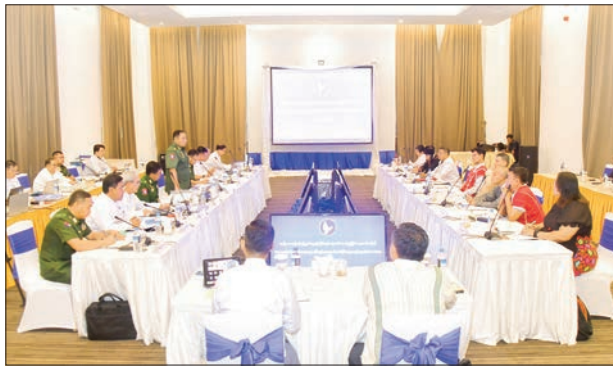
The National Solidarity and Peacemaking Central Committee and Nationwide Ceasefire Agreement-Signatories Ethnic Armed Organizations meet informally in Nay Pyi Taw yesterday.

During the meeting, NSPNC chair Lt-Gen Yar Pyae said that the National