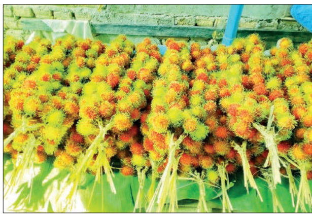
Mangosteen and rambutan are organized for sale.

SEASONAL fruits – mangosteen and rambutan – have enjoyed good prices this year, and consumer demand has also been high, according to fruit sellers.