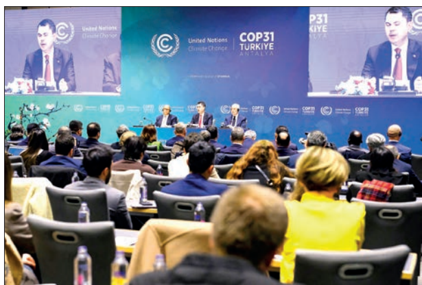
Türkiye's Minister of Environment, Urbanization and Climate Change Murat Kurum (C) speaks next to United Nations Climate Change Executive Secretary Simon Stiell (L) and COP30 President Andre Correa do Lago (R) during a new conference in Istanbul on 12 February 2026, ahead of United Nations's COP31 climate conference in November.

idemic. The World Health Organization declared on 17 May that the Ebola epidemic constituted a public health emergency of international concern. On 1 June, China's National Health Commission announced the dispatch of a high-level medical team to support the DRC in its fight against Ebola. — Xinhua