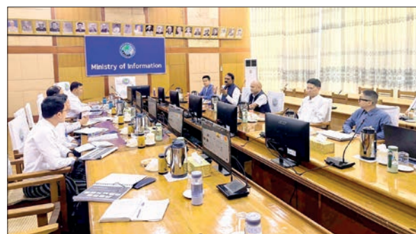
Indian representatives from Prasad Group hold talks with officials from the Ministry of Information.

The meeting was attended by officials from the Information and Public Relations Department