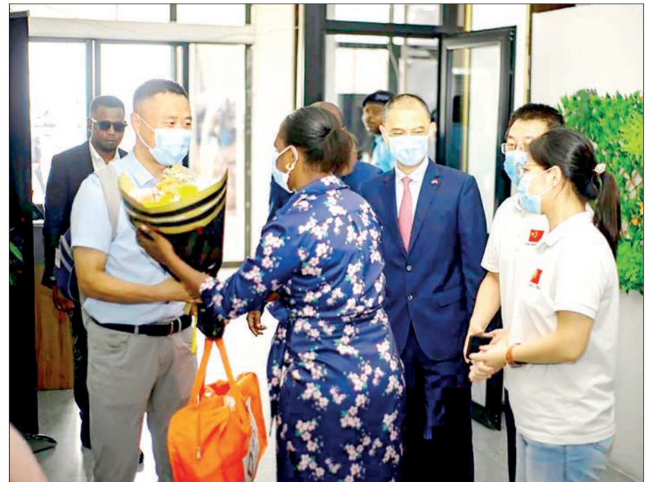
Members of a Chinese anti-epidemic medical expert team arrive in Kinshasa, capital of the Democratic Republic of the Congo (DRC), 2 June 2026.