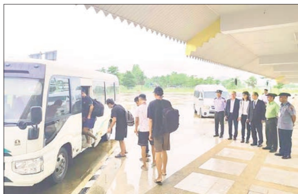
Officials oversee the deportation of undocumented foreign nationals.

Representatives from the immigration authorities of Myanmar and Thailand, officials from the Indonesian and Pakistani embassies to Thailand, and representa-