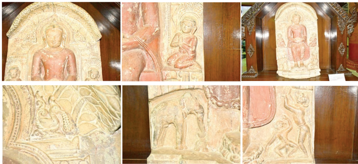
Images capture the historic artefacts and exhibits on display at the National Museum (Bagan) alongside the scenic, temple-dotted landscape of the Bagan Ancient Cultural Heritage Zone (top).

the Pārileyya Forest scene measures 116 centimetres in height, 66.1 centimetres in width and 29.5 centimetres in thickness, and was recovered from Myinkaba Gupyaung Temple. The Buddha image is depicted