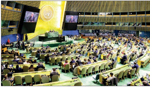
UN Secretary-General Antonio Guterres speaks during the 11 th Review Conference of the Treaty on the Non-Proliferation of Nuclear Weapons (NPT) at the United Nations Headquarters in New York on 27 April 2026.

THE world's nine nuclear-armed countries spent 19 per cent more on nuclear weapons in 2025 than the previous year, totaling a record $118.8 billion, with the United States, China and Britain leading the pack, according to a new report released Tuesday.