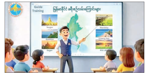
This image displays an advert for the tour guide training course.

The training course will be based at the Ministry of Hotels, Tourism and Culture training centre, Yathar Condo, beginning from 9 am to noon on 6 July, and the duration is three weeks. For more details about the training course, enquiries can be made to the DPTOA office located at the corner of Merchant Road and Sandaku Road, and through the following numbers: 09 267620551, 09 777459075, and 09 5155654. — MT/ZS