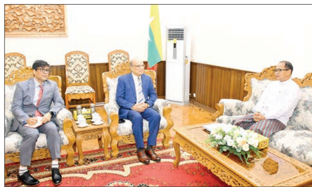
The Bangladeshi ambassador calls on Union Minister U Tin Maung Swe yesterday.

The Pyidaungsu Hluttaw will continue the third-day meeting on 16 June. — MNA/TTA