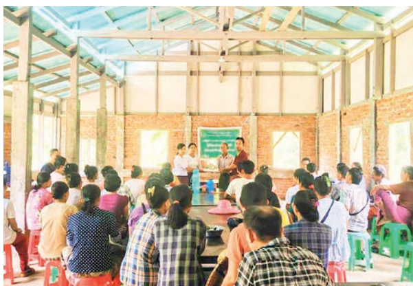
The disbursement ceremony of the Mya Sein Yaung Village Project funds is underway in Pathein Township, Ayeyawady Region.

THE Department of Cooperatives and Rural Development held a ceremony to disburse re-