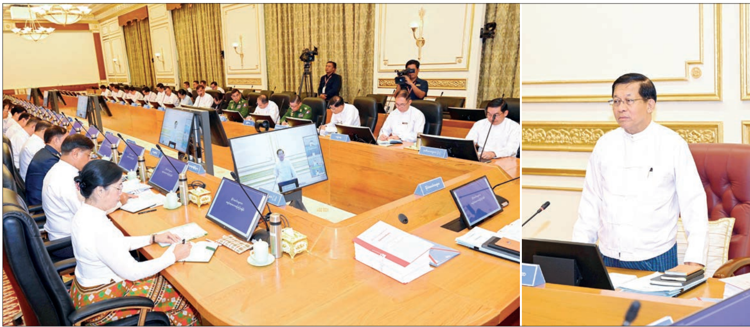
President U Min Aung Hlaing addresses the Union government meeting at the President's Office in Nay Pyi Taw yesterday.

As a democratically elected administration tasked with safeguarding the public interest and advancing national progress, the government must discharge its duties through seamless coordination and robust institutional cooperation.