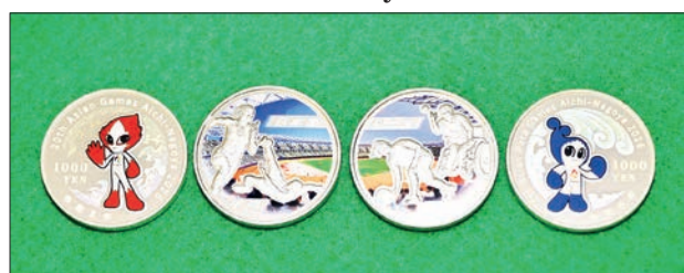
Photo taken in Osaka on 8 June 2026 shows the commemorative coins for the 20th Asian Games and 5th Asian Para Games featuring mascots Honohon (far L) and Uzumin (far R).

The coins, which have a diameter of 40 millimetres and weigh 31.1 grammes, are available for 34,800 yen ($220) each and are limited to one per person. Applications to purchase them will be accepted via mail or online through 23 June, according to the Japan Mint. — Kyodo