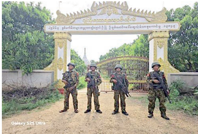
Images capture Tatmadaw troops celebrating after reclaiming Ngalontin Village in ChaungU Township, Sagaing Region.

Authorities said the insurgents had occupied residential buildings, religious