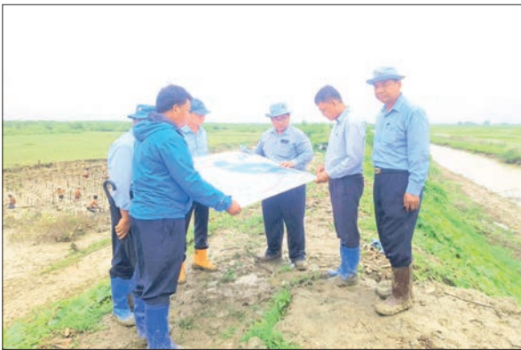
Officials preparing for the protection from potential flash floods in the Yangon River area.

Preparations are underway to protect townships, villages and dams along rivers, creeks and streams from the effects