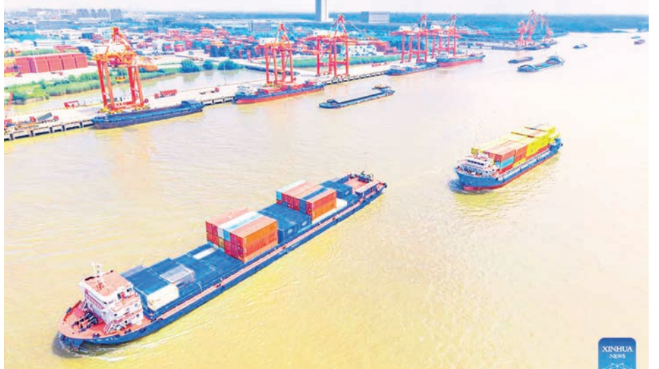
An aerial drone photo taken on 9 June 2026 shows a view of Yangzhou Port in Yangzhou, east China's Jiangsu Province.

the same period last year, while imports increased 21.5 per cent. In the first five months of the year, total foreign trade amounted to 20.68 trillion yuan, up 15.3 per cent year on year. — Xinhua