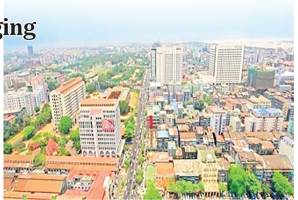
High-storey buildings in Yangon.

Apartment rental prices in Sangyoung, Kamayut, Hline, Thakayta, Thingangyun, South Okkalapa, North Okkalapa and Shwepaukkan townships rose to K450,000-K600,000. The rents range between