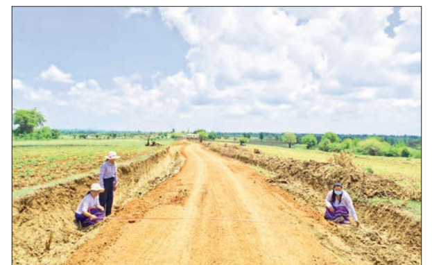
Officials inspect the ongoing construction of a rural production road and related work in Yamethin Township.

with a Union fund allocation of K26.86 million under the 2026-2027 financial year. Construction began in the second week of May this year and has now reached about 70 per cent completion. Upon completion, the road will benefit 260 households and 1,157 residents in the village. — Sein Lwin (Rural)