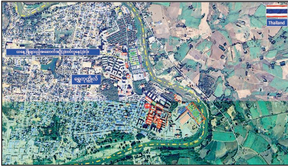
An aerial drone view of the demolition update following the three more scam-related structures destroyed.

Joint departmental teams are carrying out the systematic demolition of unlawful structures and the destruction of equipment used in online fraud operations based in the Shwe Kokko and KK Park