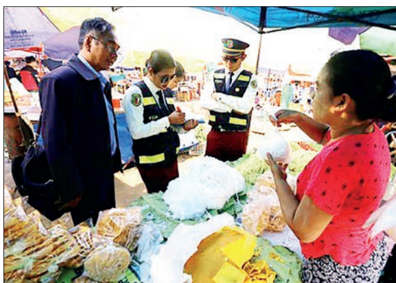
Food and Drug Administration (FDA) carrying out a field survey for food sampling.

licences. The food sampling procedure will be followed after the approval is issued. Through e-submission for local food manufacturers launched on 23 January 2026, the food sampling will be carried out in accordance with the risk-based inspection and certificate system SOP for local food manufacturing, starting from 15 June, the FDA said. — MT/ZS