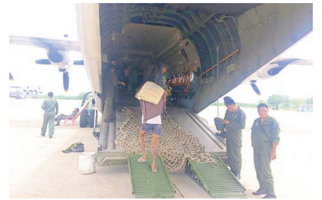
Supplies for rehabilitation are seen being unloaded from a Tatmadaw aircraft.

Military aircraft have been transporting roofing materials and other supplies to support the reconstruction effort. Yesterday, military aircraft transported 10 tonnes of CI sheets, 5.5 tonnes of cement, 123 visses of nails and one package of rubber washers from Mandalay to Kalay. Distribution to the respective townships is ongoing, and additional supplies are being provided according to local requirements. According to a press release issued by the National Disaster Management Committee, assistance delivered from the National Disaster Management Fund between 24 May and 9 June 2026 included K3 billion in financial support, 10 tonnes of edible oil, 50 tonnes of rice, 600 households and personal-use items, 20 tonnes of cement, 20 tonnes of CI sheets, 246 visses of Iron nails and related materials. — MNA/MKKS