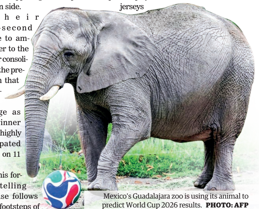
Mexico's Guadalajara zoo is using its animal to predict World Cup 2026 results. PHOTO: AFP

"It's clear who won!" one zookeeper exclaimed excitedly. — AFP