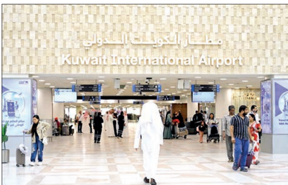
Kuwait resumed air traffic operations at 6:15 am local time (0315 GMT) on Saturday after a two-hour closure of its airspace as a precautionary measure. PHOTO: XINHUA

intelligent machinery and high-end industrial solutions. — Xinhua