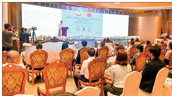
The opening ceremony of the new Red Cross branch office in progress in Thakayta Township, Yangon Region.

Yangon Region Chief Minister U Aung Naing Thu, the region Hluttaw Speaker, and officials first cut the ceremonial ribbon to unveil the new branch office. Members of the Thakayta Township Red Cross Brigade then performed a Red Cross song to mark the occasion. The chief minister delivered the opening address, and the MRCS President de-