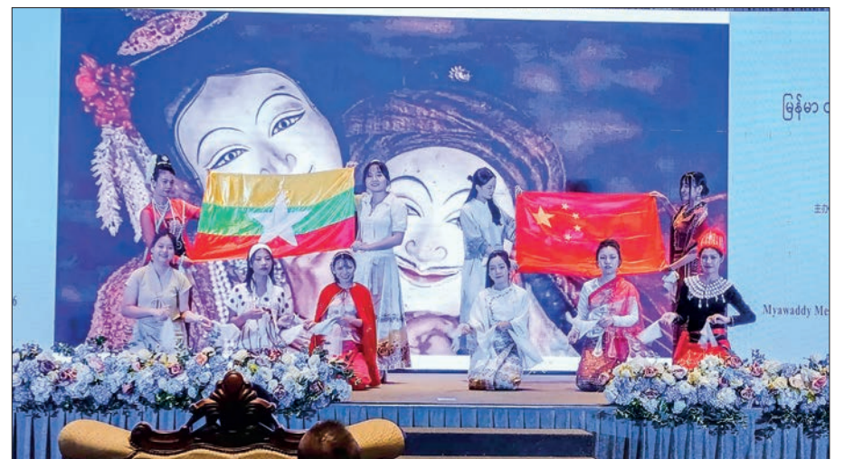
Participants in the Myanmar-China Ceremony on "A Community with a Shared Future".

Furthermore, on 3 April, Chinese President Mr Xi Jinping sent a congratulatory message to Myanmar President U Min Aung Hlaing, emphasizing close cooperation on promoting strategic exchanges and building a community with a shared future. Whenever Myanmar faced difficul-