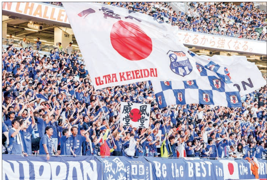
File photo shows Japan fans cheering their team on ahead of a World Cup send-off game against Iceland at MUFU Stadium in Tokyo on 31 May 2026.

JAPAN football fans are set to employ money-saving strategies such as bringing cup noodles from home and sharing accommodations to soften the financial blow of supporting the Samurai Blue at the upcoming World Cup in North America.