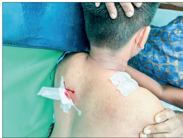
This photo shows an injured student hurt by the attack of PDF terrorists.

A Grade 11 student was injured after unidentified