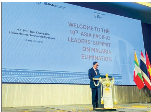
Union Minister for Health Dr Thet Khaing Win speaks at the 10 th Asia-Pacific Leaders' Summit on Malaria Elimination in Laos on 5 June.

At the opening ceremony, Lao Prime Minister Mr Sonexay Siphandone delivered the opening remarks. Lao Health Minister Madam Baykham Khattiya and the Union minister also delivered remarks on the achievements made towards malaria elimination by 2030, emerging challenges encountered in the process, and the need to further strengthen cooperation among Greater Mekong Subregion countries, particularly neighbouring countries sharing common borders. They also dis-