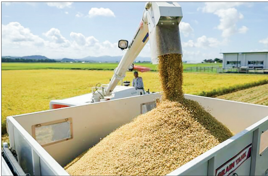
File photo taken in August 2025 shows harvested rice in Sanjo, Niigata Prefecture.

Japan is preparing to announce the start of negotiations with Mercosur on the sidelines of the Group of Seven summit in mid-June in France.