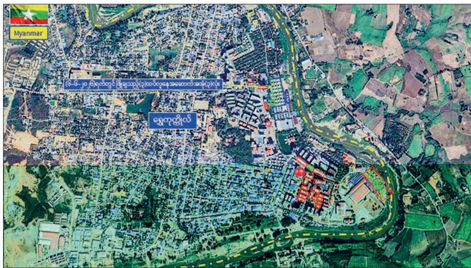
A location map displaying online scam-related facilities being demolished.

During the latest operation, three three-storey residential buildings used for online scam activities were demolished using