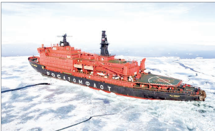
A famous Russian Arktika-class nuclear-powered icebreaker. PHOTO: SPUNTIK

to create bypass routes, but from the perspective of global trade needs, the Arctic has a special role. Under these circumstances, not only its importance as a resource base becomes strategic, but above all, its role as a reliable logistics route," Sechin said at the St. Petersburg International Economic Forum (SPIEF). He noted that the Hormuz crisis and sanctions have significantly accelerated the diversification of payment instruments in favour of the Chinese payment system. — SPUNTIK