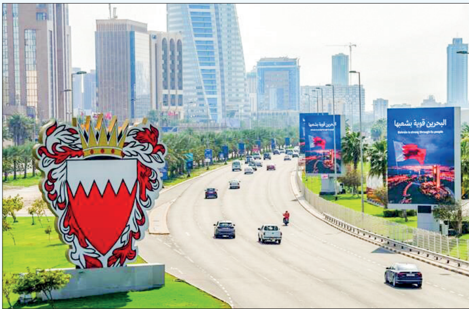
Vehicles move on a road in Bahrain's capital Manama.