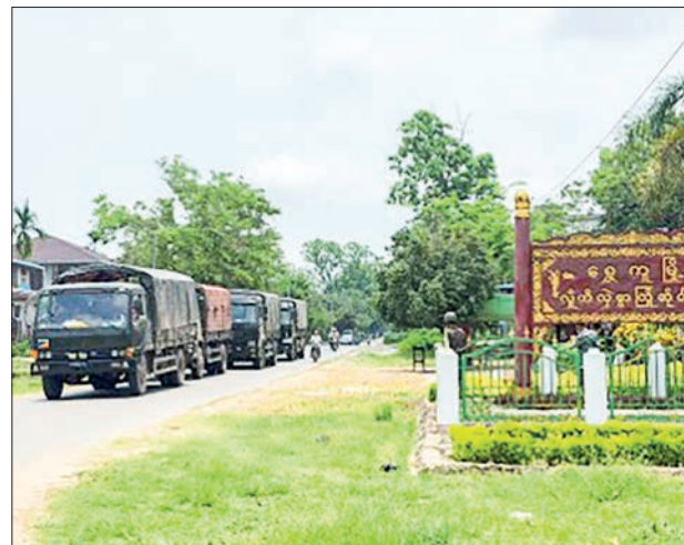
Vehicles carrying relief items and medicines and medical equipment arrive in Shwegu, Kachin State.

Tatmadaw, in cooperation with departmental officials and residents, has