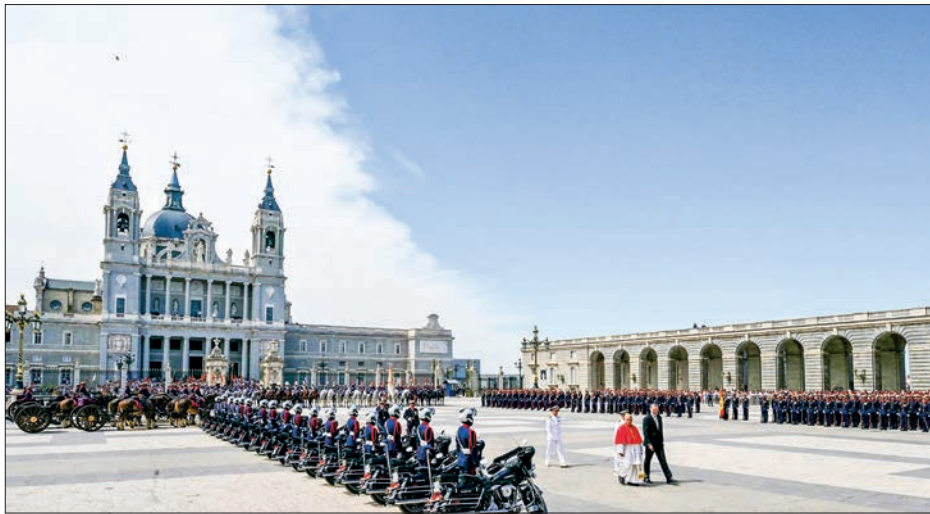
Spain's Felipe VI and Pope Leo XIV review the troops during a welcome ceremony at the Royal Palace in Madrid on 6 June 2026.

He is due to meet some victims of sexual abuse by Catholic clergy, the Vatican said, with Leo telling reporters on the papal plane upon arrival that the issue was "still an open