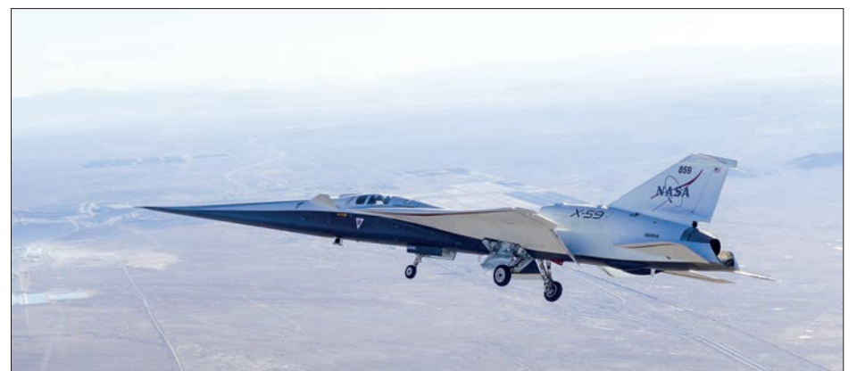
NASA's X-59 quiet supersonic research aircraft.

"X-59 is getting ready for its quiet supersonic debut. Since the aircraft's first flight on 28 October 2025, the team has made tremendous progress, flying 16 times in the last 90 days and getting into a steady test rhythm. In the coming days, we expect to take the next step and push to Mach 1.4," NASA Administrator Jared Isaacman said. — Xinhua