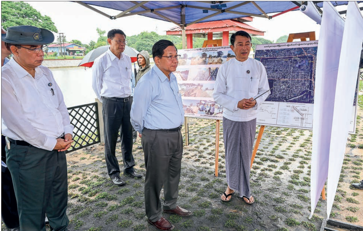
President U Min Aung Hlaing hears the report of the renovation of the cultural heritage of ancient Ketumati City by an official in Toungoo Township yesterday.

He continued that since the Toungoo region has already achieved rice self-sufficiency, it is possible to utilize rice bran