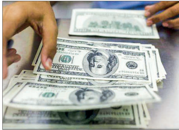
US dollars being counted at a money changer in Yangon.

CBM injected over $35 million, 34 million baht and over three million yuan in the foreign exchange market in February and over $43 million, 65 million baht and over four million yuan in January 2026. CBM has injected foreign currencies into the foreign exchange market and the edible oil and fuel