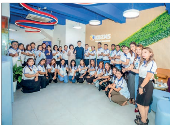
Staff members assigned to be serving at the KBZMS Mandalay branch.

KBZMS employees worked tirelessly from a temporary office to continue providing insurance claim services amidst the impacts of the disaster. Their resilience, team-