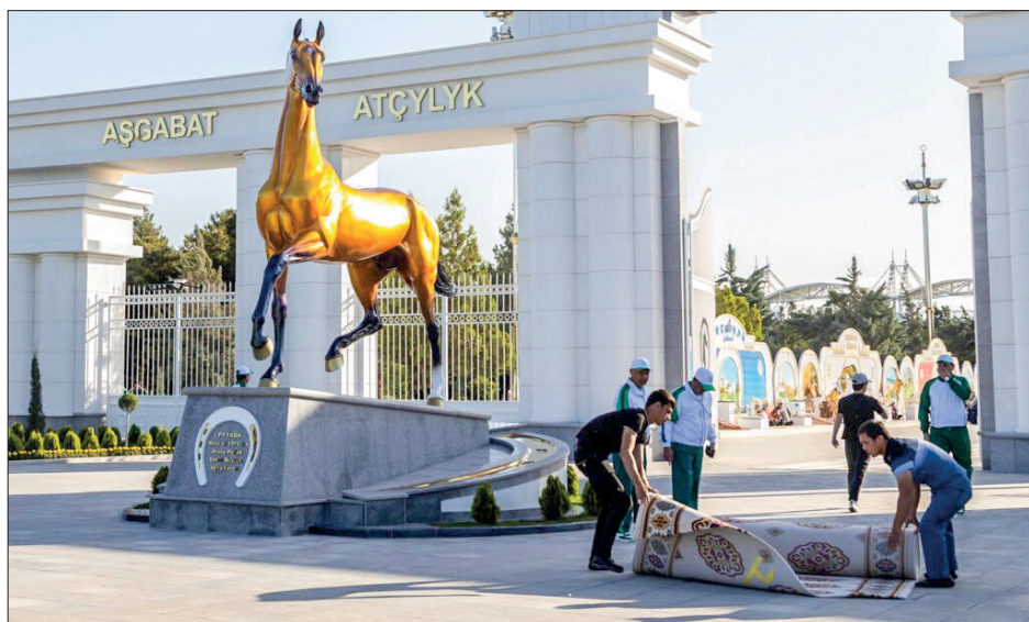
Golden monuments to the horses have been erected across the country