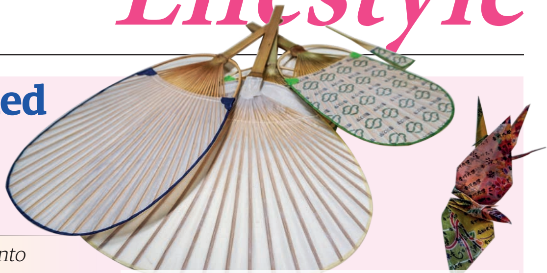
This photo shows fans created from paper derived from discarded udon noodles in Takamatsu, Kagawa Prefecture on 8 January 2026. PHOTO:

This process, which creates water-resistant paper, has been adopted by a local welfare facility to provide jobs. — Kyodo