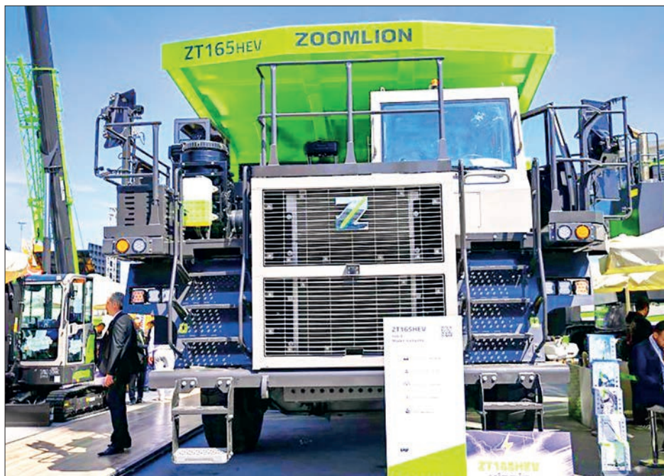
A Chinese new energy construction vehicle is on display at the Istanbul Expo Centre in Istanbul, Türkiye, on 3 June 2026.

The 18 th International Construction Machinery, Technology and Equipment Trade Exhibition (KOMATEK 2026) opened on Wednesday at the Istanbul Expo Centre. As Türkiye's largest and most influential trade exhibition for the industry, the event has attracted exhibitors from across the world, ranging from construction machinery and mining equipment to aerial work platforms, green energy technologies and intelligent construc-