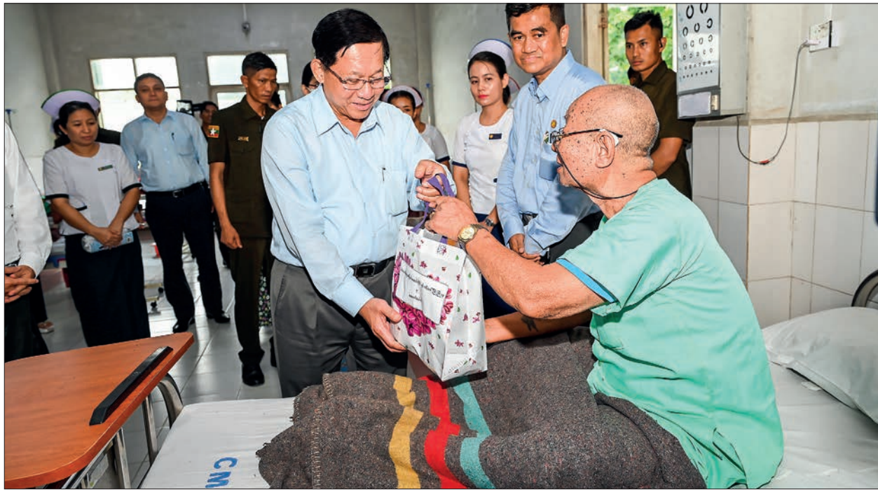
President of the Republic of the Union of Myanmar U Min Aung Hlaing provides foodstuffs to a patient at the Toungoo People's Hospital in Toungoo yesterday.

After asking about the needs of the hospital, the President gave necessary guidance and fulfilled the needs.