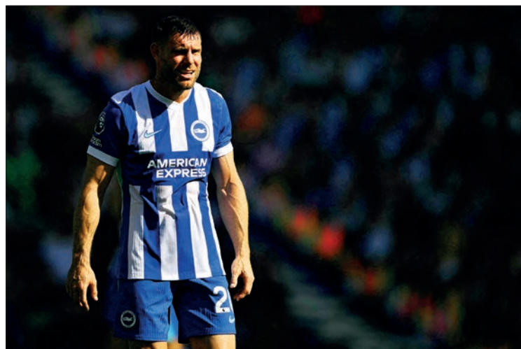
Brighton's English midfielder (20) James Milner during the English Premier League football match between Brighton and Hove Albion and Manchester United at the American Express Community Stadium in Brighton, southern England on 24 May 2026.

gan his career at boyhood club Leeds and went on to win three Premier League titles — two with Manchester City and one with Liverpool, where he also won the Champions League.