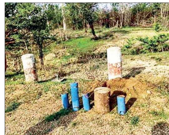
Security forces conduct clearance operations for homemade mines in Natogyi Township, Mandalay Region.

Investigations are underway to take action against the offenders, and security forces accelerate the security measures. — MNA/KTZH