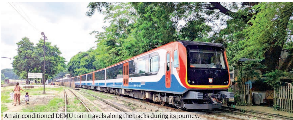
An air-conditioned DEMU train travels along the tracks during its journey.

The new 9Up/10Down trains will stop at Toegyaungkalay, Bago, Pyu, Toungoo, Nay Pyi Taw, Tatkon, Pyawbye and Thazi stations along the Yangon-Mandalay-Yangon railway. Ticket prices remain unchanged at K48,000 for upper class and K34,000 for first class for the whole journey.