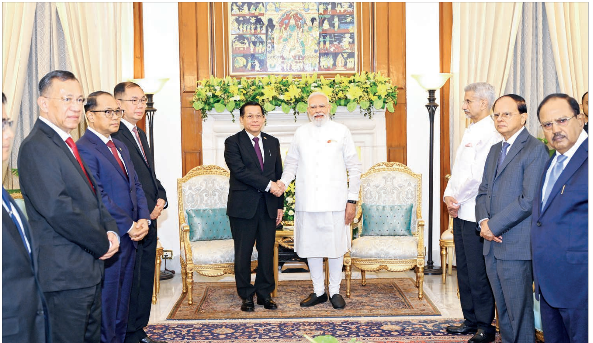
President of the Republic of the Union of Myanmar U Min Aung Hlaing and Prime Minister of India Shri Narendra Modi exchange handshakes during their meeting at Hyderabad House in New Delhi, India, yesterday.

Myanmar and India pledged to strengthen bilateral cooperation across key sectors, including education, healthcare, defence, trade, investment, tourism, and cultural exchange.