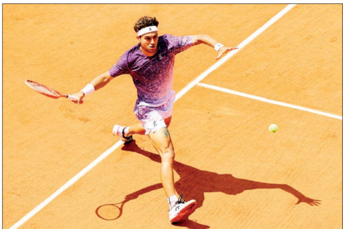
Italy's Flavio Cobolli plays a forehand return to US Zachary Svajda during their men's singles match on day 9 of the French Open tennis tournament on Court Philippe-Chatrier at the Roland-Garros Complex in Paris on 1 June 2026.

"The match is never done and today I almost shit in my pants," said Cobolli. "I'm happy but I'm still nervous." American world number 85 Svajda had only won two Grand Slam matches before his surprising run to the fourth round at Roland Garros. — AFP