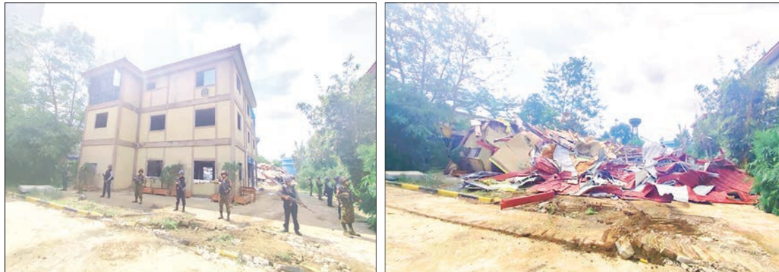
Authorities continue the demolition of illicit scam-related facilities in Shwe Kokko, Myawady Township.

THE government continues to conduct joint operations in the Shwe Kokko and KK Park areas, where suspects commit telecom fraud and online gambling activities. The combined