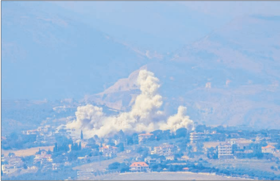
Smoke rises following Israeli bombardment in southern Lebanon as seen from a position across the border in the Upper Galilee, in northern Israel on 1 June 2026.

IRAN'S Tasnim news agency said Tehran was suspending all exchanges with mediators in peace talks with the United States on Monday, blaming Israel's ongoing invasion of Lebanon.