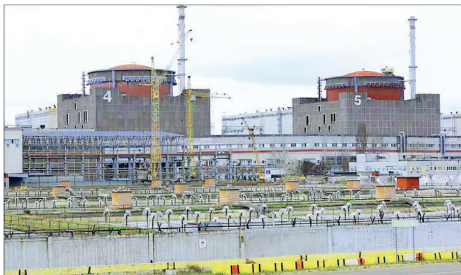
This photo taken on 29 March 2023 shows the Zaporizhzhia nuclear power plant in southern Ukraine.

THE head of the International Atomic Energy Agency (IAEA) on Sunday emphasized that attacks on nuclear facilities