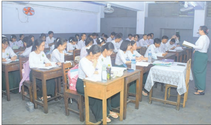
Students attend class inside a Yangon school.

"During this academic year, 3,326 schools, including basic education, monastic and private schools, have opened. More than 900,000 students who enrolled during the school enrolment period began attending classes.