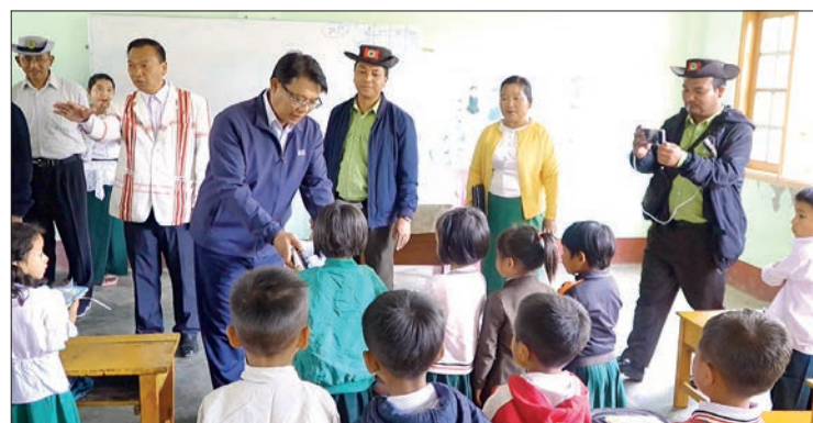
Deputy Minister Dr Than Soe and officials encourage schoolchildren in Tiddim, Chin State.

According to the Tiddim District Education Office, a total of 10,457 students from KG to Grade 12 are currently attending schools in Tiddim Township, and 1,706 students in Tonzang Township. — District IPRD/KNN