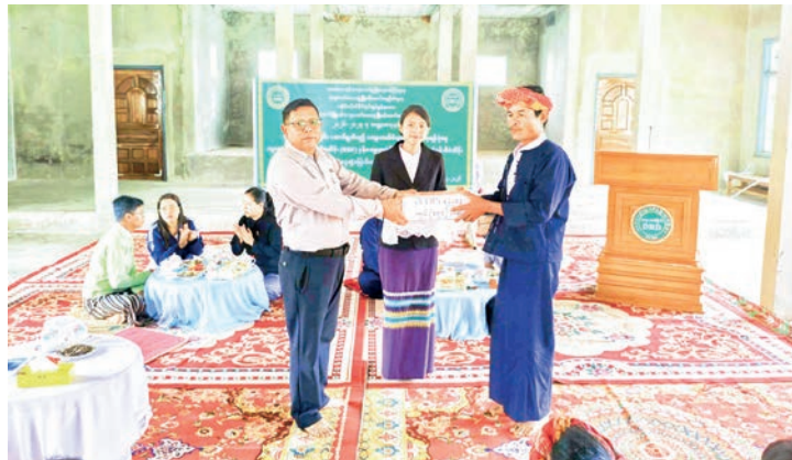
A fund recipient receives the funds.

THE Department of Rural Development under the Ministry of Cooperatives and Rural Development, Pa-O Self-Administered Zone, Shan State (South), held a ceremony to transfer funds for the Village Development Project (VDP) and Rural Business Fund (RBF) Project, which will be