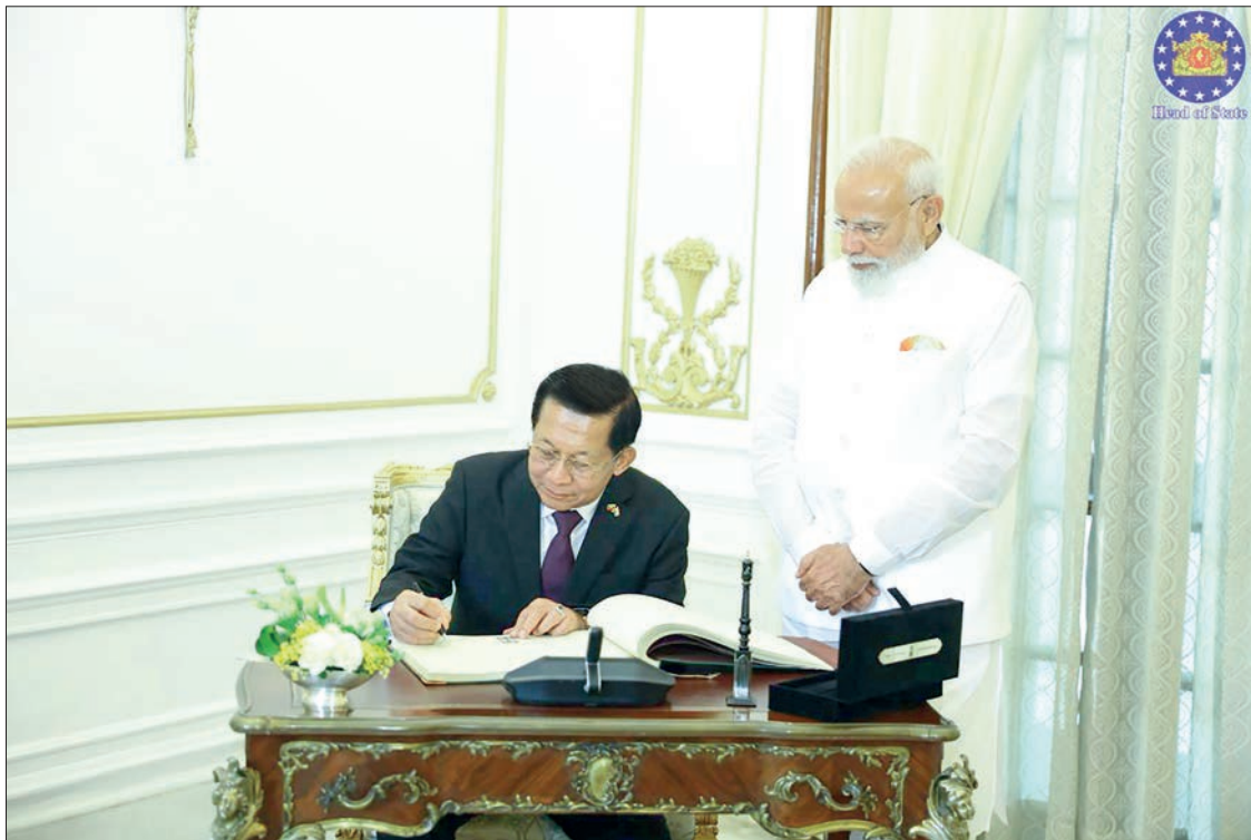
President U Min Aung Hlaing signs the guests' book at Hyderabad House.

In response, President U Min Aung Hlaing expressed his gratitude and appreciation to the Prime Minister for the opportunity to work together in further strengthening the long-standing friendly relations and cooperation between Myanmar and India. There are many arenas in which the two countries can cooperate for the benefit of the people. The President also expressed his gratitude for the assistance provided by India during the period when