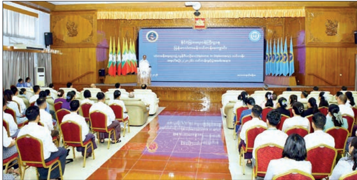
Deputy Minister U Naing Min Kyi unveils the Diploma in Diplomacy Course 2/2026 yesterday.

cy (DID) 2/2026 Course will be held for eight months, comprising two semesters and lasting four months each. It will cover diplomacy, International Relations, foreign policies, international & regional organizations, International Law, current issues and trends