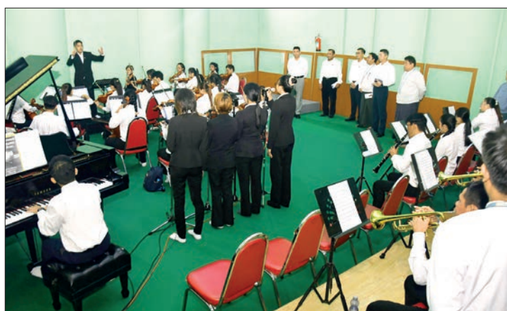
Union Minister U Htein Linn views the MRTV's Myanmar Orchestra during his inspection tour of MRTV in Yangon.

UNION Minister for Information U Htein Linn, accompanied by the Yangon Region Minister for Information, Relief and Religious Affairs, inspected the state-owned newspaper houses and MRTV in Yangon yesterday.