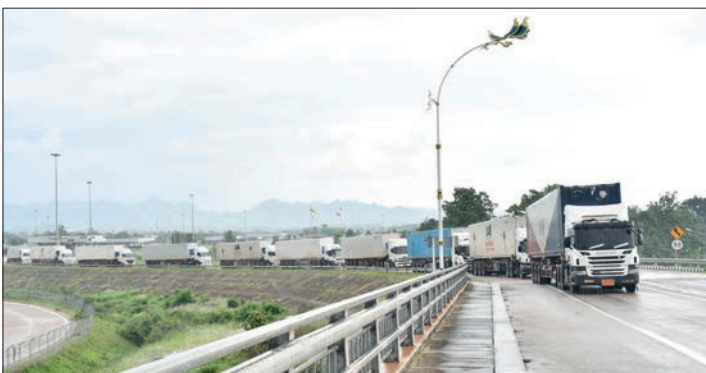
Cargo lorries queue at the Myanmar-Thai border.

CURRENTLY, export and import licences from the Myawady border to Thailand are being issued. Most of the exports are agricultural products such as corn, avocado, betel nut, turmeric and onions. Import licences worth 620 million Thai baht have been issued. Most of the goods imported from Thailand are foodstuffs, consumer goods and industrial raw materials. — MNA