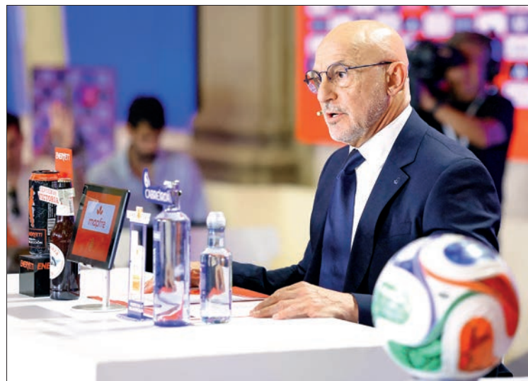
Spain's head coach Luis de la Fuente addresses a press conference after the unveiling of the Spain squad for the 2026 FIFA World Cup, in Madrid, on 25 May 2026.

"We know they are going to arrive in perfect conditions and I will stick my neck out and say they will be fit for the opening game, (against Cape Verde on