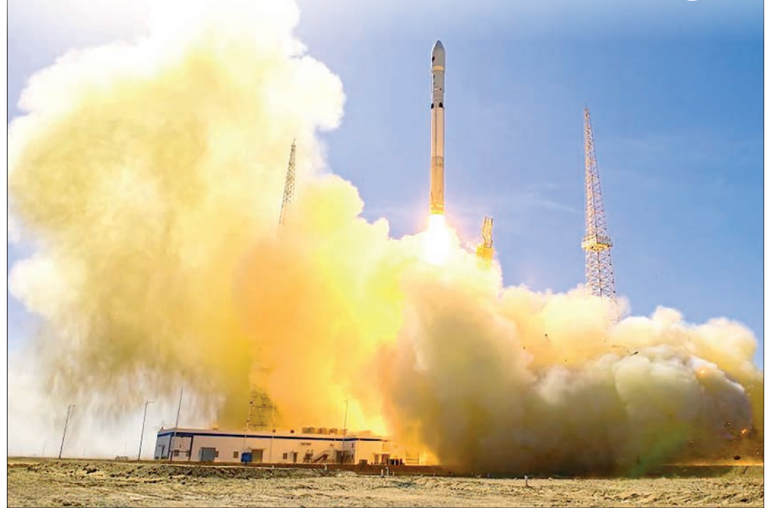
A Long March-12B Y1 carrier rocket blasts off from the Dongfeng commercial space innovation pilot zone in northwest China on 1 June 2026.

CHINA on Monday successfully launched the Long March-12B Y1 carrier rocket into space from the Dongfeng commercial space innovation pilot zone in northwest China.