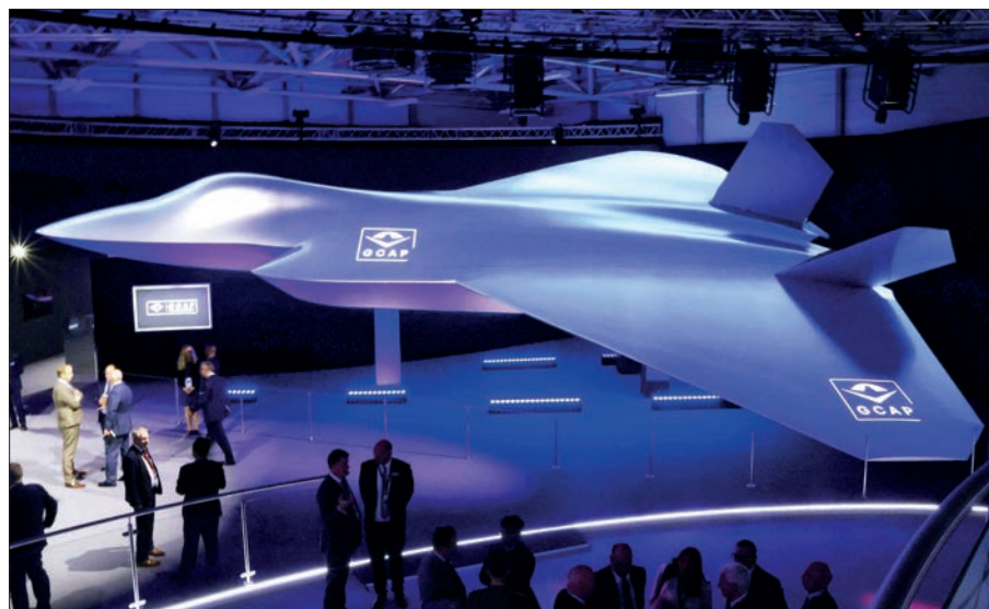
File photo taken in July 2024 in Britain shows a mock-up of the next-generation fighter jet that Japan, Britain and Italy have been jointly developing.

Japanese Defence Minister Shinjiro Koizumi is set to meet British De-