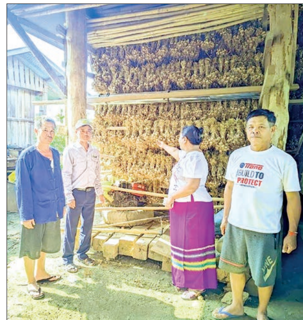
Officials inspect project activities.