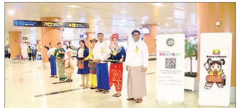
The Myanmar tourism promotion event is handing out souvenir gifts at YIA.

Yangon Region Government's Rakhine Ethnic Affairs Minister and officials of the ministry warmly welcomed the tourists arriving at Yangon International Airport and Mandalay International Airport, and souvenir keychains were distributed to visitors, hoping the gifts would serve as a tangible reminder of the visitors' experience in Myanmar and inspire future visits. — ASH/KK