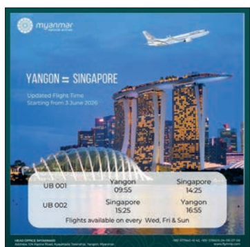
The Myanmar National Airlines (MNA) announces new flight schedules for Yangon-Singapore.

and overseas destinations can be bought on the MNA mobile app. — MT/ZS