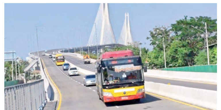
A YBS bus running the Dala-Twantay route.

Enquiries about YPS services can be made via the YPS page messenger or by dialling the call centre (hotline) 09 772666699, between 8 am and 6 pm from Monday to Friday. — MT/ZS