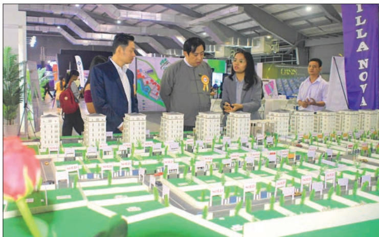
The 20 th Myanmar's largest realty & car expo held on 29 May-1 June 2026.

The exhibition featured famous construction companies, under-construction buildings, condos, luxury condos, solid land for those looking to buy land, houses, various car models and many famous car brands, all sold with special discounts, cash payment systems, long-term in-