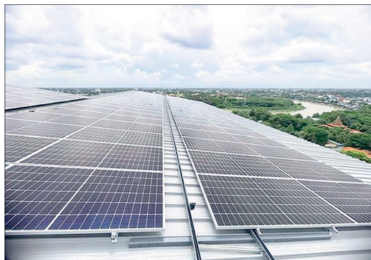
An array of solar panels generates renewable energy.