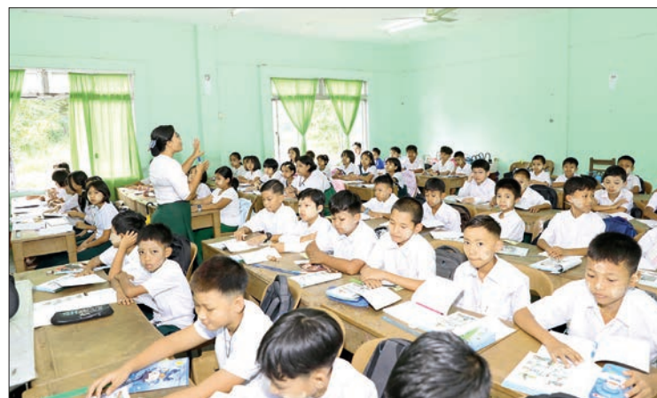
Schoolchildren learn peacefully inside their classroom.

He noted that if students leave school after Grade 9, these skills could help them manage their livelihoods more easily. For Grades 11 and 12, one period of law has been added because students are approaching the age of 18 and should understand the Constitution. The critical thinking skills of the children who read and those who do not read are very different. Therefore, we add a library session as we want the children to read. I also urge them to read a lot. I also want to urge the parents to enrol the children who are not enrolled, as it is a free education system.