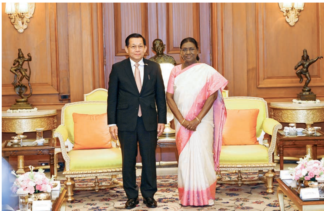
Myanmar President U Min Aung Hlaing and Indian President Shrimati Droupadi Murmu pose for a documentary photo during their meeting yesterday.

Myanmar and India agreed to further strengthen their longstanding bilateral relations and expand strategic cooperation across mutual areas of interest.