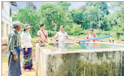
Officials oversee the completion of the water pipeline installation project.

The 3,800-foot-long water pipeline installation project was implemented with Union-approved funding of K22.31 million through cooperation between engineering staff from the Township Department of Rural Development and village residents. The project has now been completed in full.