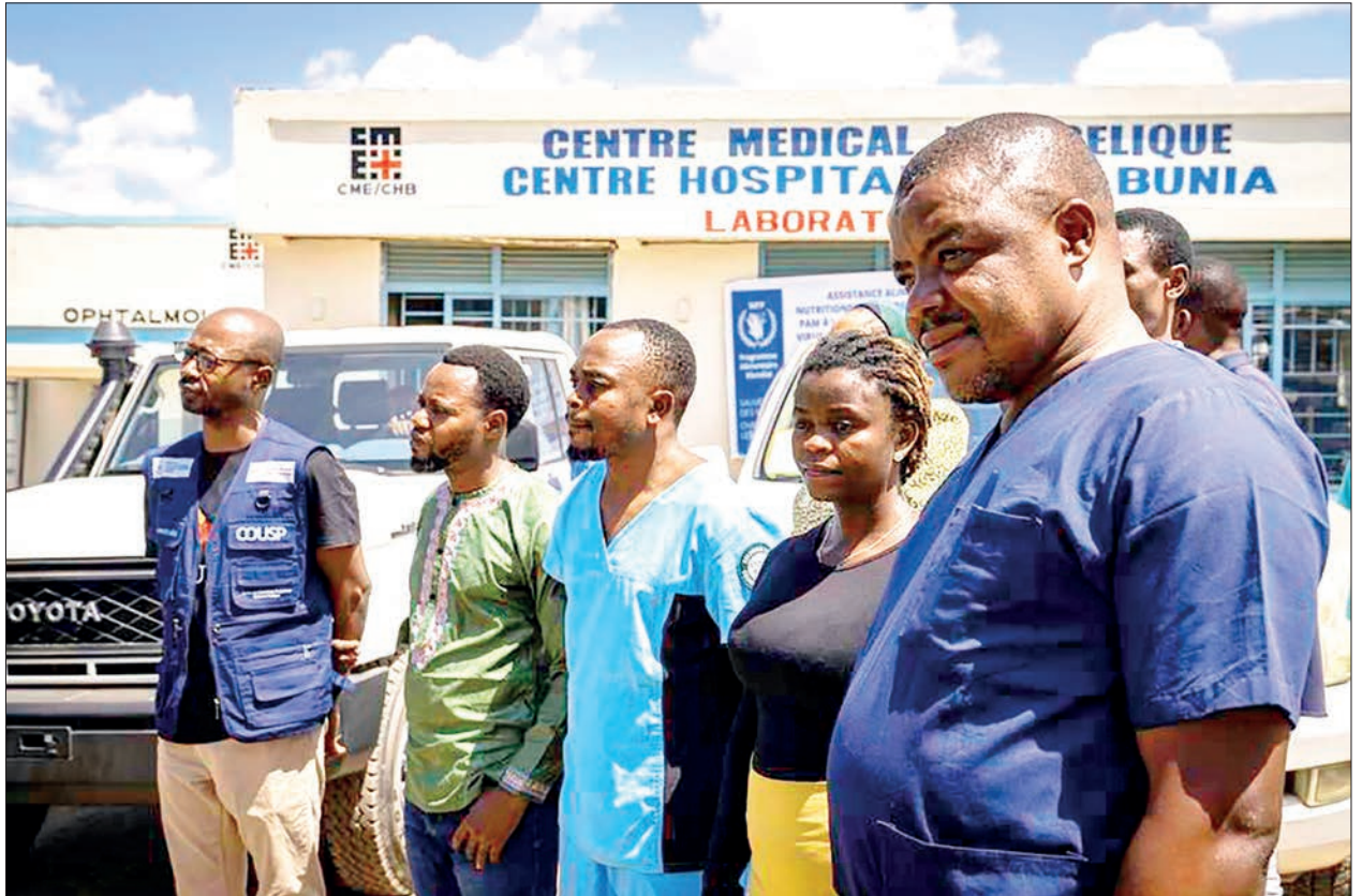
Four recovered Ebola patients (1 st to 4 th R, front) are interviewed in Bunia, the capital of Ituri Province in northeastern Democratic Republic of the Congo (DRC), 31 May 2026.

“The outbreak is also placing significant pressure on frontline health workers. Nineteen health workers have been infected and six have died. Protecting health workers remains a top priority,” Kaseya said.