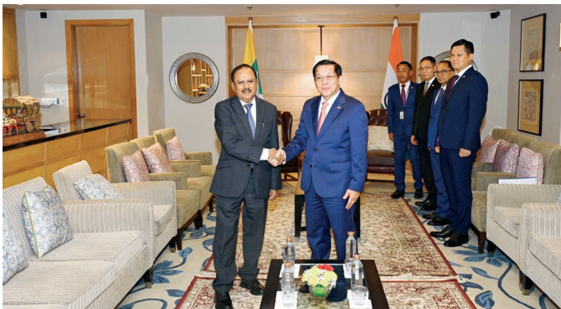
President U Min Aung Hlaing shakes hands with India's National Security Adviser Mr Ajit Doval during the latter's courtesy call on the former.