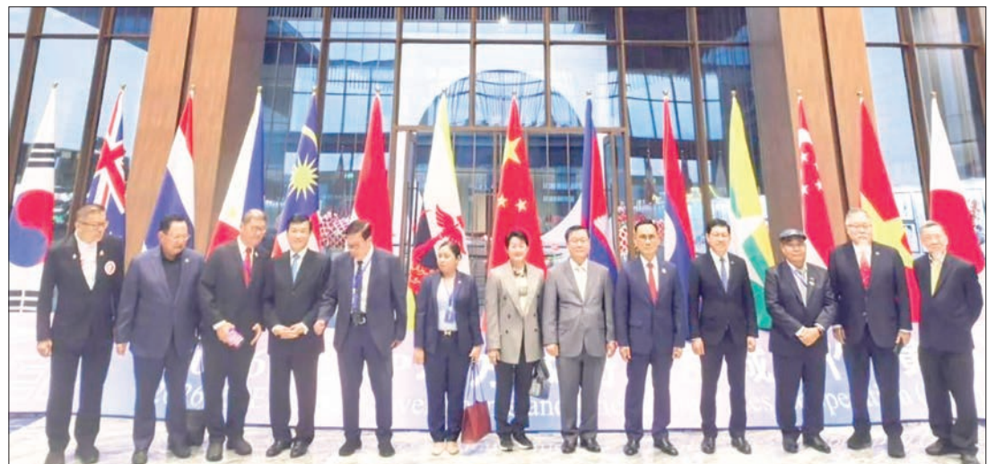
This photo shows Chairman of the Myanmar-China Friendship Association (Central), together with the chairpersons of ASEAN-China friendship associations from other ASEAN member countries.

Discussions also focused on advancing from a strategic partnership towards building a community with a shared future, as well as formulating work plans for 2026-2028 aimed at further strengthening friendship ties and expanding cooperation initiatives.—ASH/TH