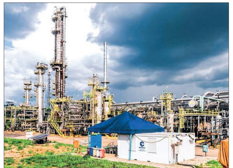
This photo taken on 16 October 2025 shows the production facilities of the Urucu Oil and Gas Production Field in the state of Amazonas, Brazil. PHOTO: XINHUA/FILE

Mines and Energy Minister Alexandre Silveira said the measures are aimed at preventing the impact of the war from being passed on to Brazilian consumers. — Xinhua