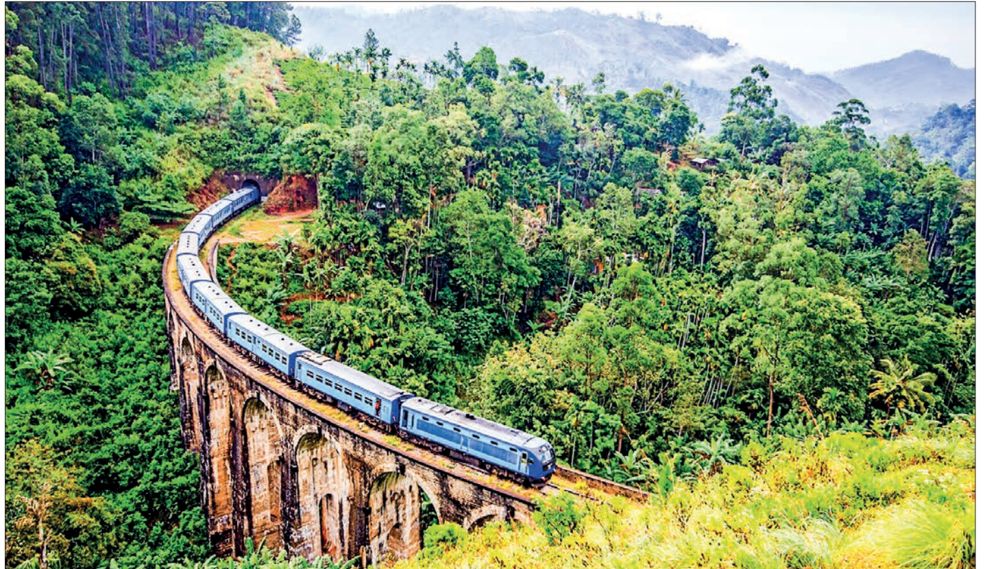
Sri Lanka crossed the 1 million tourist arrival milestone by late May 2026, driven by a record-breaking start to the year.

Sri Lanka recorded 5.0 per cent economic growth in 2024 and 2025 after its