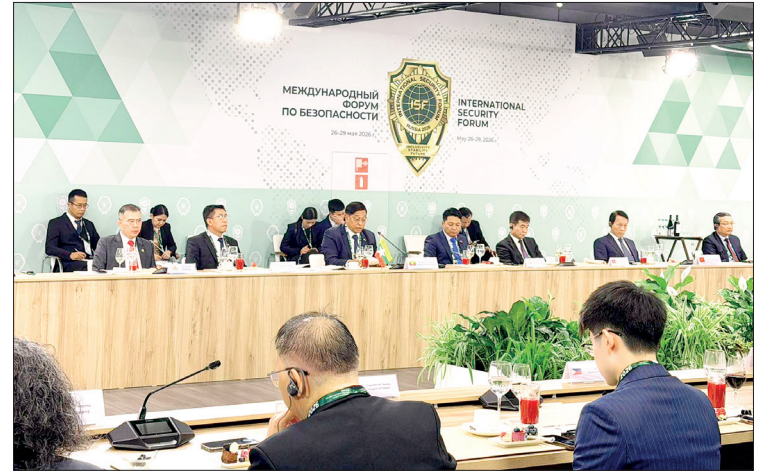
Union Minister at the President's Office U Tin Aung San participates in the 1 st International Security Forum in Moscow, Russian Federation.

During the visit, as part of cooperation between Myanmar and Russia, the "Memorandum of Understanding on the Establishment of a Joint