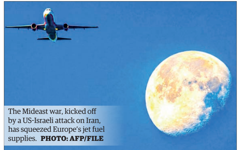
The Mideast war, kicked off by a US-Israeli attack on Iran, has squeezed Europe's jet fuel supplies.

The European Commission is considering an EU financing mechanism to support e-SAF development as supporters hope government backing will attract investors and scale up production. — AFP