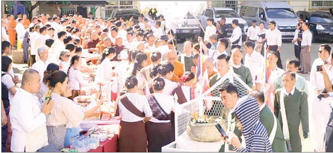
The Myanmar-Thailand bilateral friendship ceremony, featuring the offering of rice and provisions alongside the setting up of donation structures, in progress.

A Myanmar-Thailand friendship alms-giving ceremony, featuring the offering of rice and provisions to monks and the setting up of donation structures, was held on 30 May at the Naga Hnakaung Monastery in Tachileik, Shan State (East).