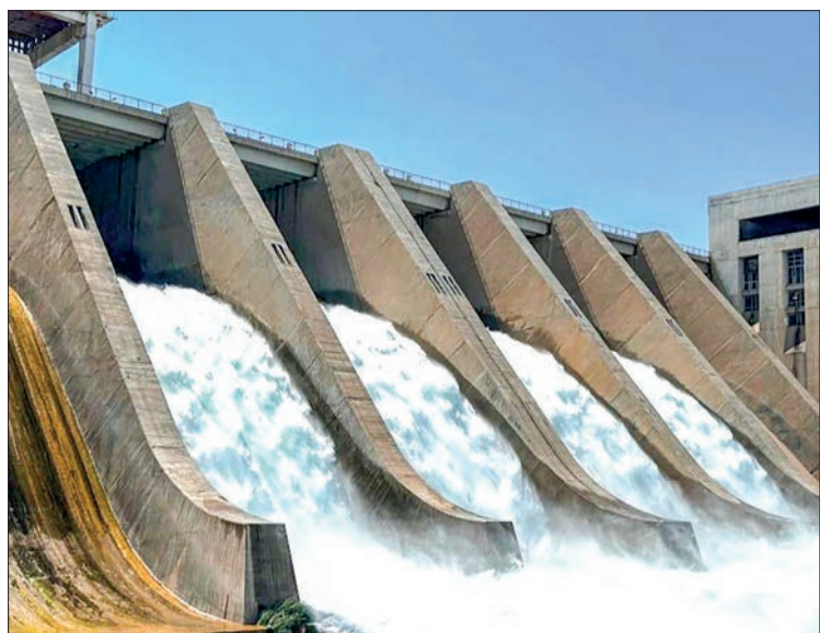
Water is discharged through a spillway gate at the Euphrates Dam in Raqqa province, Syria, 28 May 2026. PHOTO: XINHUA

Inside emergency operations rooms at the dam, engineers and technicians worked around the clock, monitoring water levels and adjusting discharge rates to prevent sudden flooding downstream. — Xinhua