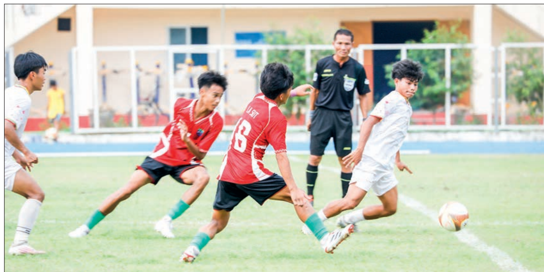
Players of U18 men's football teams seen in action at semi final match of 2026 ISR U18 Men's Football Tournament yesterday.

THE 2026 Inter-State and Region U18 Men's Football Tournament semifinals were held at Padonma Stadium in Sangyoung Township and Padetha Stadium in South Okkalapa Township, Yangon, at 3 pm yesterday, organized by the Ministry of Sports and coordinated with regional gov-