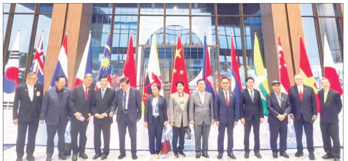
This photo shows Chairman of the Myanmar-China Friendship Association (Central), together with the chairpersons of ASEAN-China friendship associations from other ASEAN member countries.

Discussions also focused on advancing from a strategic partnership towards building a community with a shared future, as well as formulating work plans for 2026-2028 aimed at further strengthening friendship ties and expanding cooperation initiatives.—ASH/TH