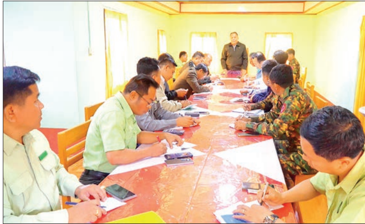
A coordination meeting on rehabilitation and reconstruction works for Falam, Tiddim and Tonzang towns in Chin State in progress in Tiddim yesterday.

At the meeting, the deputy minister delivered an opening address, saying that participants discussed in detail arrangements for timely supply of rice rations for government staff and residents returning to Falam, Tiddim and Tonzang towns, provision of construction materials and relief supplies to the respective areas, replenishment of fuel and machinery for field operations,