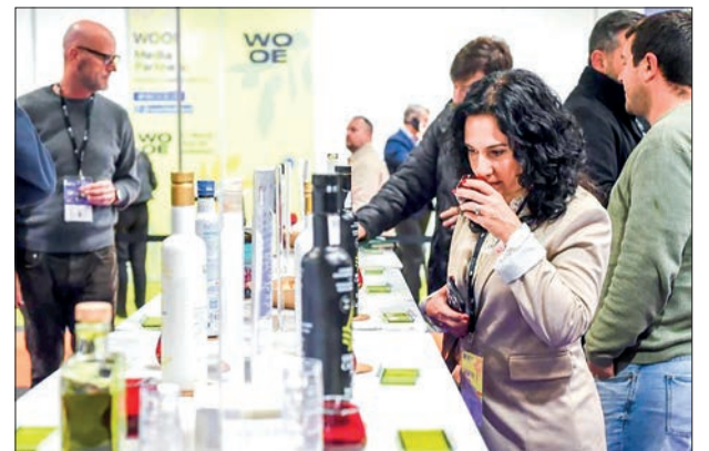
People visit the 2025 World Olive Oil Exhibition in Madrid, Spain, 11 March 2025.

In addition, Olive Oils from Spain participated in SIAL Shanghai, one of