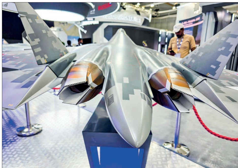
The fighter was unveiled at the Dubai Airshow in November 2025.