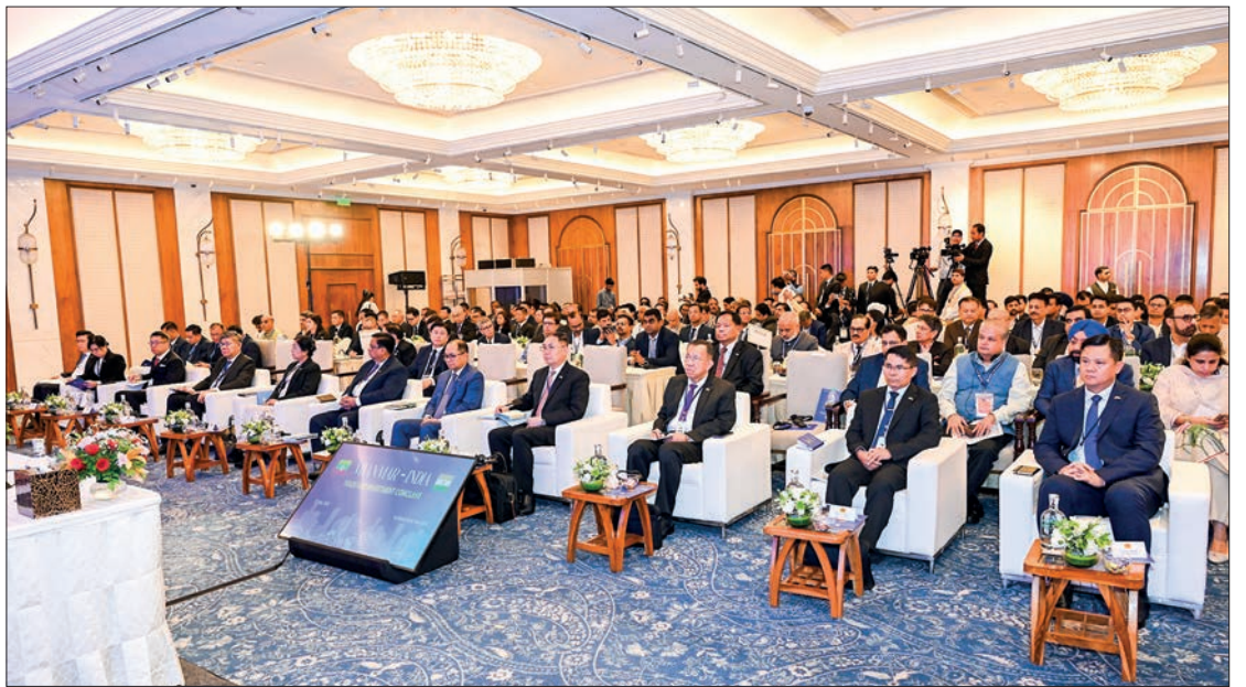
President of the Republic of the Union of Myanmar U Min Aung Hlaing delivers a speech at the Myanmar-India Trade and Investment Conclave at the Taj Mahal Hotel in New Delhi, India, yesterday.

P resident of the Republic of the Union of Myanmar U Min Aung Hlaing, currently in India on an official visit, delivered a keynote speech at the Myanmar-India Trade and Investment Conclave at the Taj Mahal Hotel in New Delhi, India, yesterday morning.