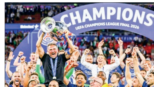
Luis Enrique lifted the Champions League trophy for a third time his career and helped PSG retain it for a second consecutive season.

One police officer was injured, a kiosk near the avenue was set on fire, and at least six vehicles were damaged, Le Monde reported, adding that the fire was later extinguished. — Xinhua