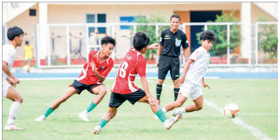
Players of U18 men's football teams seen in action at semifinal match of 2026 ISR U18 Men's Football Tournament yesterday.

THE 2026 Inter-State and Region U18 Men's Football Tournament semifinals were held at Padonma Stadium in Sangyoung Township and Padetha Stadium in South Okkalapa Township, Yangon, at 3 pm yesterday, organized by the Ministry of Sports and coordinated with regional gov-