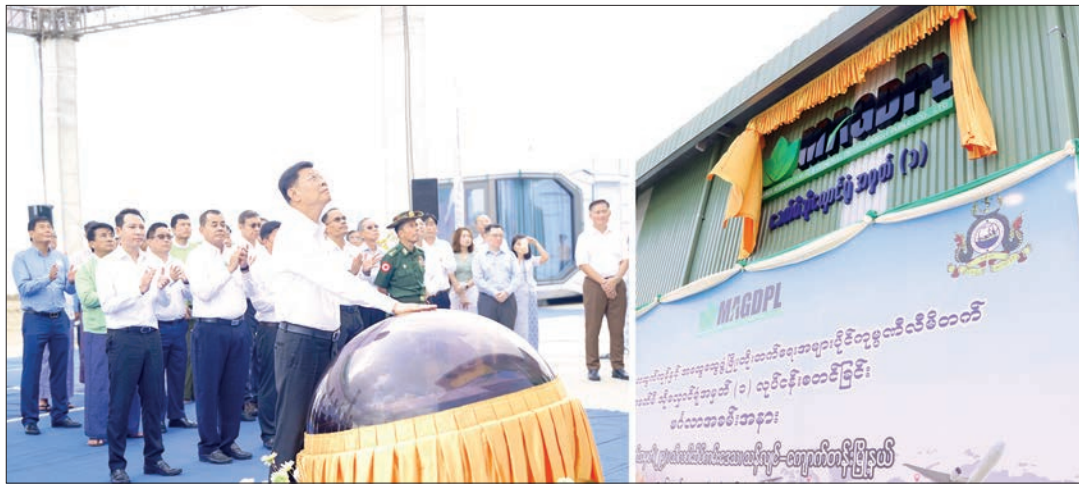
Union Minister U Mya Tun Oo presses the button to open the Modern Warehouse No 1 building of Myanmar Agribusiness and General Development Public Company Limited at the Thilawa Port area yesterday.

UNION Minister for Transport and for Digital Development and Communications U Mya Tun Oo attended the opening ceremony of Modern Warehouse No 1 operated by Myanmar Agribusiness and General Development Public Company Limited at Plot No 29 of the Thilawa Port area.