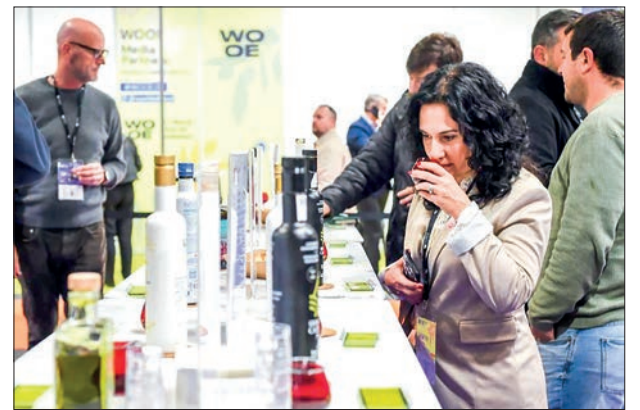
People visit the 2025 World Olive Oil Exhibition in Madrid, Spain, 11 March 2025.

In addition, Olive Oils from Spain participated in SIAL Shanghai, one of