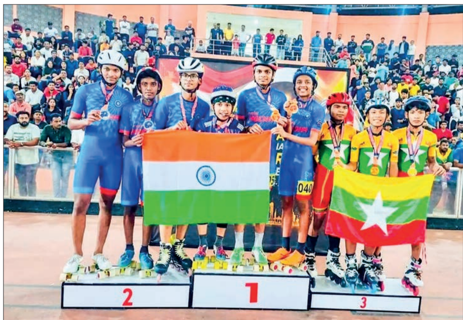
Myanmar players are standing in third position of International Roller Skating Championships 2026 in Indonesia.