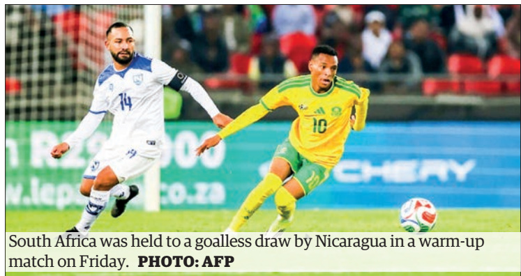
South Africa was held to a goalless draw by Nicaragua in a warm-up match on Friday.

According to state broadcaster SABC, visas for at least 20 members of the squad were still being processed at the United States embassy in Johannesburg. — AFP