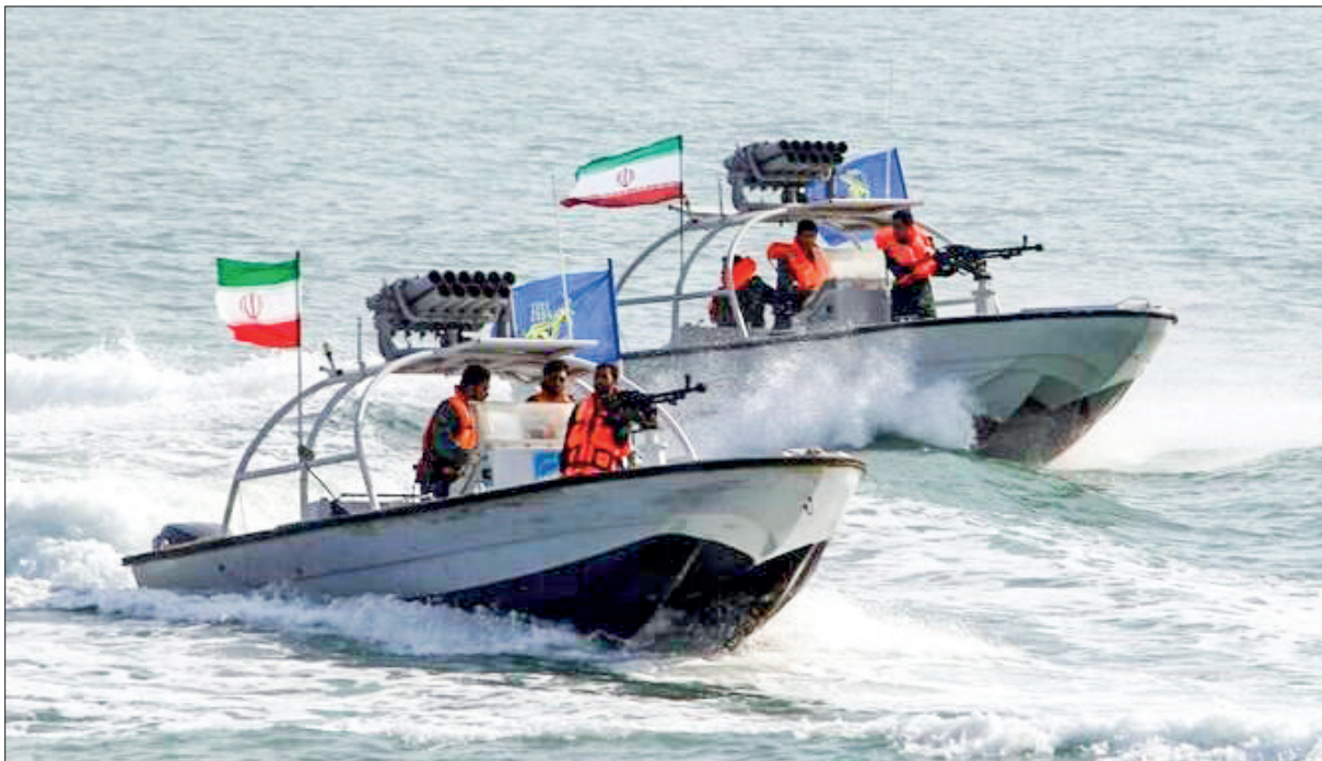
The vessels were granted permission to pass through the strait owing to their countries' needs for commodities such as chemical fertilizers.

The IRGC's Navy said Saturday that 20 vessels crossed the strait within the past 24 hours in coordination with its forces and Iran's maritime authorities.