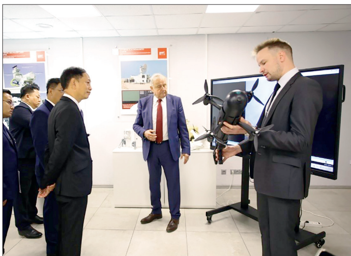
Union Minister for Defence General Tun Aung visits military technology factories in Belarus.

military technology factories, workshops and textile industries in Belarus. In addition, they met with a delegation led by Mr Dmitry Pantus, chairman of the Belarus State Authority for Military Industry, to discuss