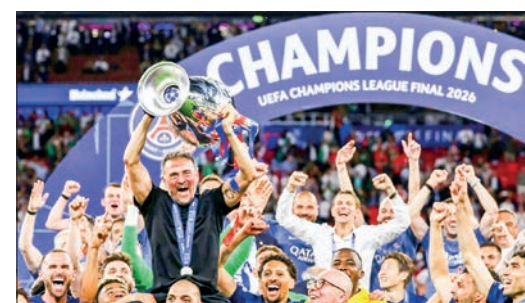
Luis Enrique lifted the Champions League trophy for a third time his career and helped PSG retain it for a second consecutive season.

One police officer was injured, a kiosk near the avenue was set on fire, and at least six vehicles were damaged, Le Monde reported, adding that the fire was later extinguished. — Xinhua