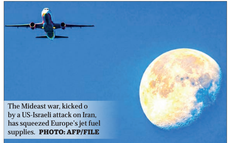
The Mideast war, kicked off by a US-Israeli attack on Iran, has squeezed Europe's jet fuel supplies. PHOTO: AFP/FILE

The European Commission is considering an EU financing mechanism to support e-SAF development as supporters hope government backing will attract investors and scale up production. — AFP