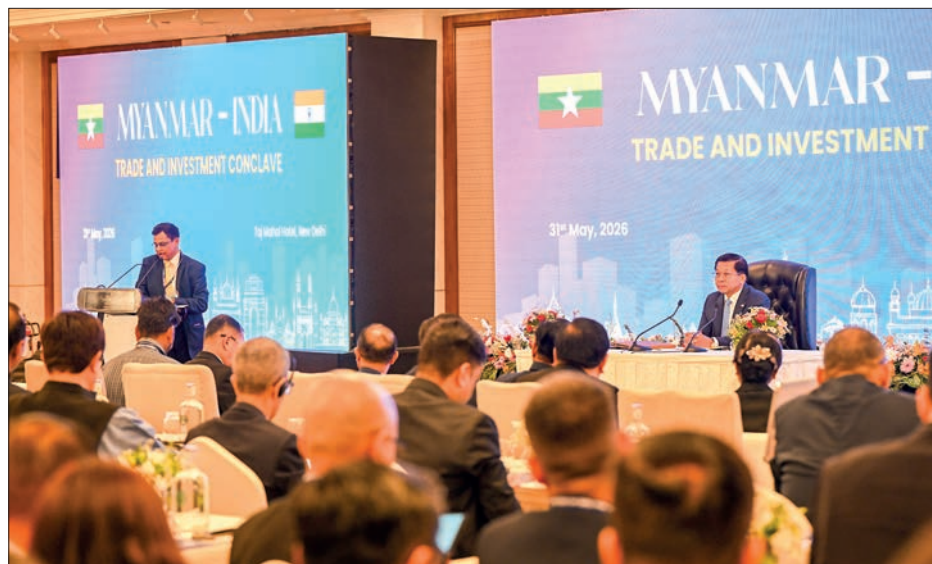
The Myanmar-India Trade and Investment Conclave in progress, attended by President U Min Aung Hlaing.

strengthening cooperation in highly promising sectors. Such engagements and dialogues are seen as effective ways to translate strategic objectives into practical outcomes. It is believed that today's conclave will lead to stronger economic linkages, tangible results, and new opportunities for cooperation.