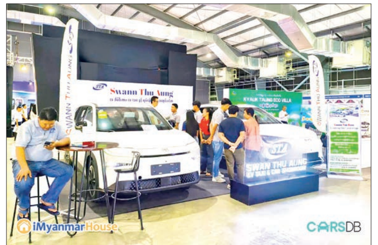
EVs were displayed at the 20th Myanmar biggest property and automobile expo.

EV prices range from a minimum of K50-K100 million to a maximum of K600-K700 million. The worldwide market has also rapidly developed and it is still fine if people are not interested in EV for now, but it will be a challenge for urban population if they still neglect EVs in next three to four years, he added. — MT/ZS