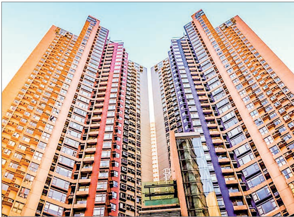
The sustained volume of registrations reflects the depth of end-user demand and confidence in the city's housing market.