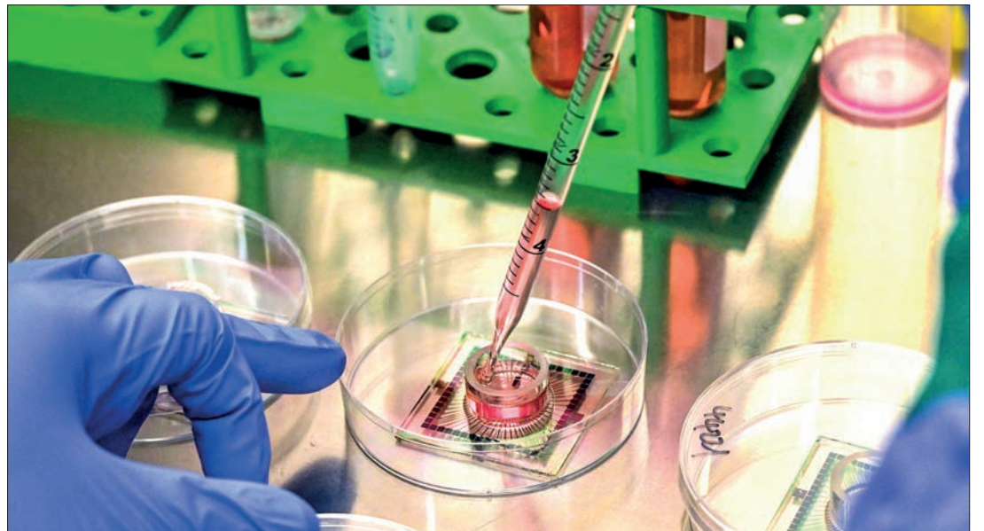
This photo taken on 5 May 2026, senior scientific specialist Kwaku Dad Abu Bonsrah pipettes nutrients onto neurons on Micro Electrode Array (MEA) chips at Cortical Labs' Physical Containment Level 2 (PC2) laboratory in Melbourne.

Each so-called "biological computer" contains around 200,000 living human brain cells, grown from stem cells that were harvested from blood donations.