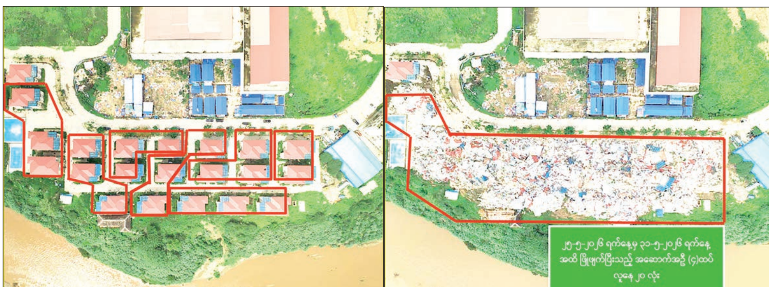
Photos show before and after destroying scam hubs in Shwe Kokko and KK park, Myawady, Kayin State.

THE government continues to conduct joint operations in the Shwe Kokko and the KK Park areas, where suspects commit