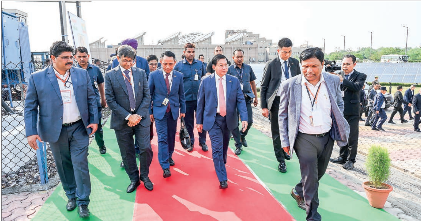
President of the Republic of the Union of Myanmar U Min Aung Hlaing observes the generating electricity from solar power of NTPC Energy Technology Research Alliance in Greater Noida, India, on 31 May 2026.

orative tree to mark his visit to the company.