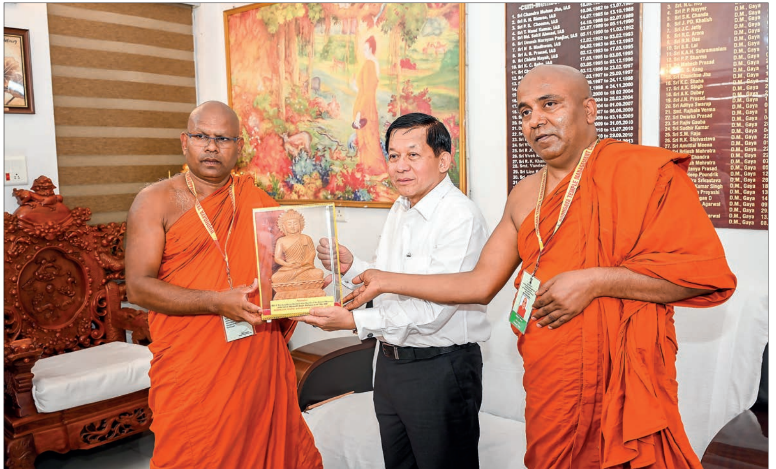
President of the Republic of the Union of Myanmar U Min Aung Hlaing accepts the Dhamma gift from the Mahabodhi Monastery Sayadaw at the Mahabodhi Mahavihara Temple in the Bodh Gaya Cultural Region, India, yesterday.

At Sujata Temple, the President and party offered flowers, water, oil lights and milk meal to the Buddha image and donated