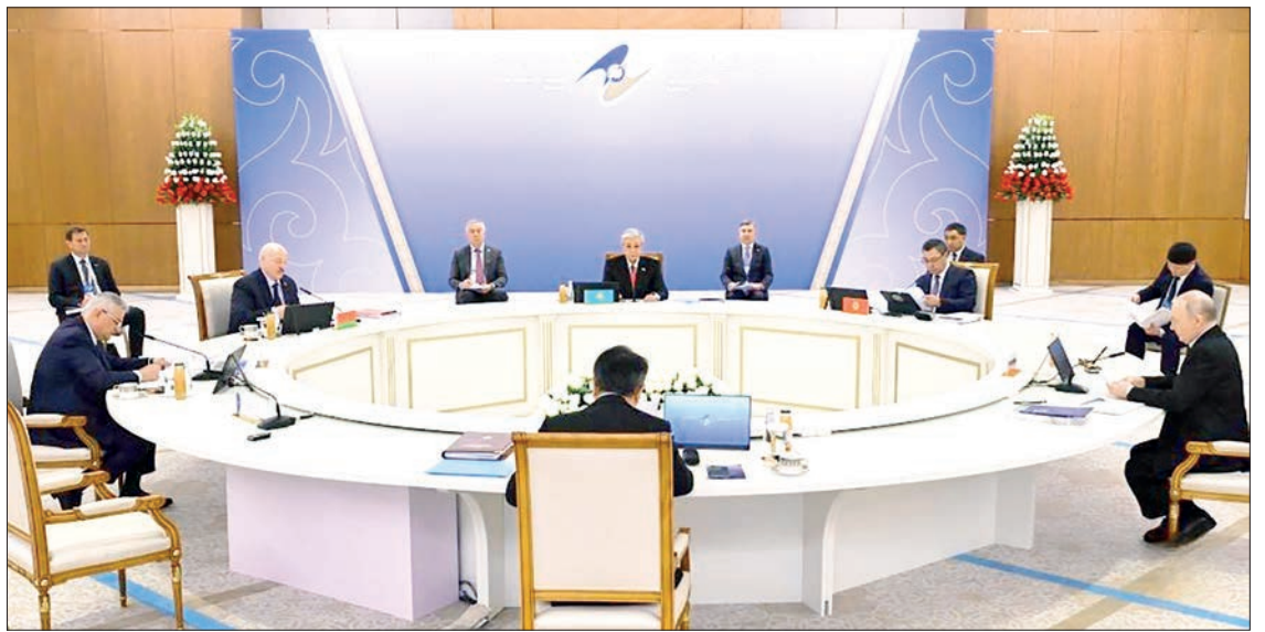
This photo taken on 29 May 2026 shows a scene of a meeting of the Supreme Eurasian Economic Council in Astana, Kazakhstan.

Industrial output across the EAEU increased by 18.9 per cent in 2021-2025, reaching $1.69 trillion, while agricultural production rose by 12.4 per cent to $167.5 billion, according to data presented at a plenary session of the fifth Eurasian Economic Forum, held Thursday through Friday in Astana. — Xinhua