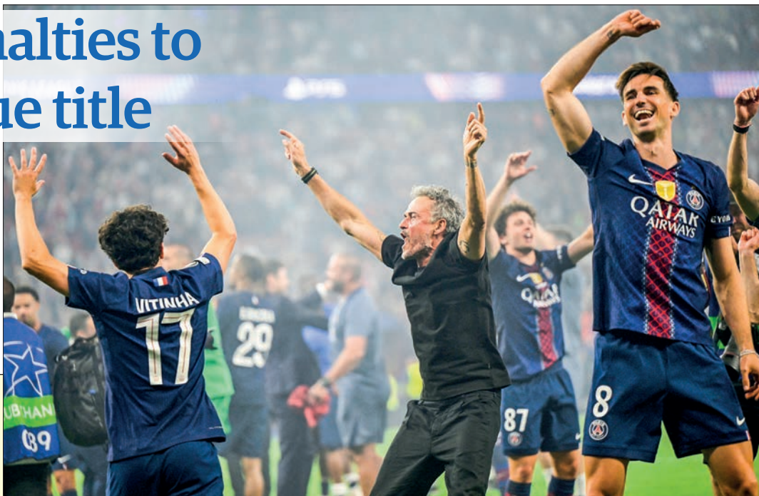
Paris Saint-Germain's Spanish head coach Luis Enrique (C), Paris Saint-Germain's Spanish midfielder (8) Fabian Ruiz (R) and team members celebrate their team's win of the UEFA Champions League final football match between Paris Saint-Germain (PSG) and Arsenal FC at the Puskas Arena in Budapest on 30 May 2026.

Eberechi Eze and Gabriel Magalhaes both missed for the Gunners in the shoot-out as PSG became just the second club to retain the title in the Champions League era. — AFP