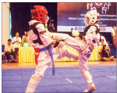
Male youth athletes compete in the tournament.