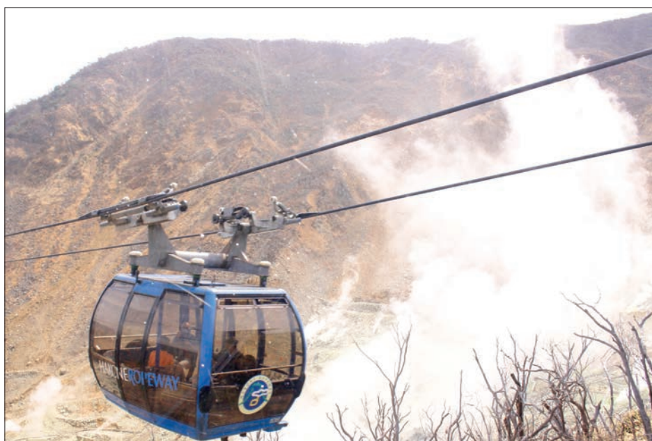
A gondola on Hakone Ropeway is pictured in Hakone, Kanagawa Prefecture, in April 2026.

It is the first time in the world for a gondola to be equipped with a Dolby Atmos surround sound system, with the music for that day tailored to the