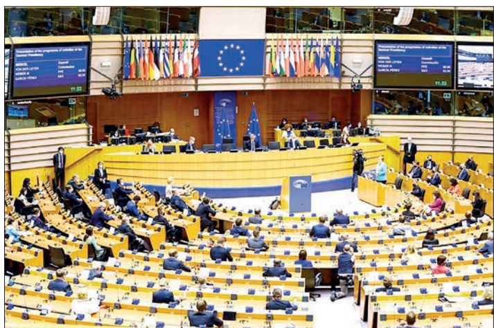
Focus on Tech Impact: Foreign technology suppliers are closely monitoring the European Parliament, where far-reaching cybersecurity reforms are currently being debated.

Chinese companies are important partners for Europe in its digital transformation, green transition and industrial upgrading, Wang said, adding that the Chinese business community is willing to work with the European side to promote cybersecurity governance and digital economy development, uphold an open, fair and non-discriminatory market environment, and jointly ensure the stability and smooth operation of global industrial and supply chains. — Xinhua