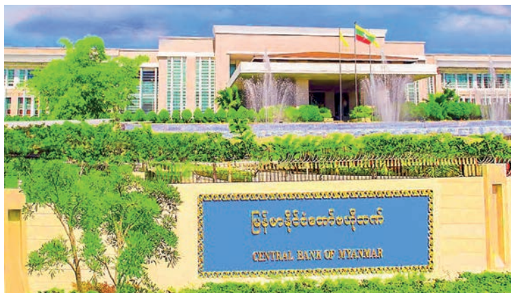
The Central Bank of Myanmar (CBM) in Nay Pyi Taw.

CBM injected foreign currencies into the market, with a view to curbing the instability in the foreign exchange market and currency devaluation. According to CBM's notification on 15 March 2024, it has been collaborating with law enforcement agencies to combat and prosecute those who attempt to manipulate the currency market under the existing laws. CBM allowed authorized dealers (private banks) to operate online foreign exchange trading freely as per the market rate, depending on supply and demand, starting from 5 December 2023. — NN/KK