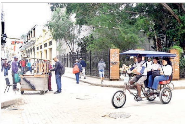
Photo taken on 23 February 2026 shows a street view in Havana, capital of Cuba.

Despite not holding an official government position, the colonel and head of his grandfather's personal security has been identified by US media as playing a key role in ongoing talks between Cuba and the United States. — AFP