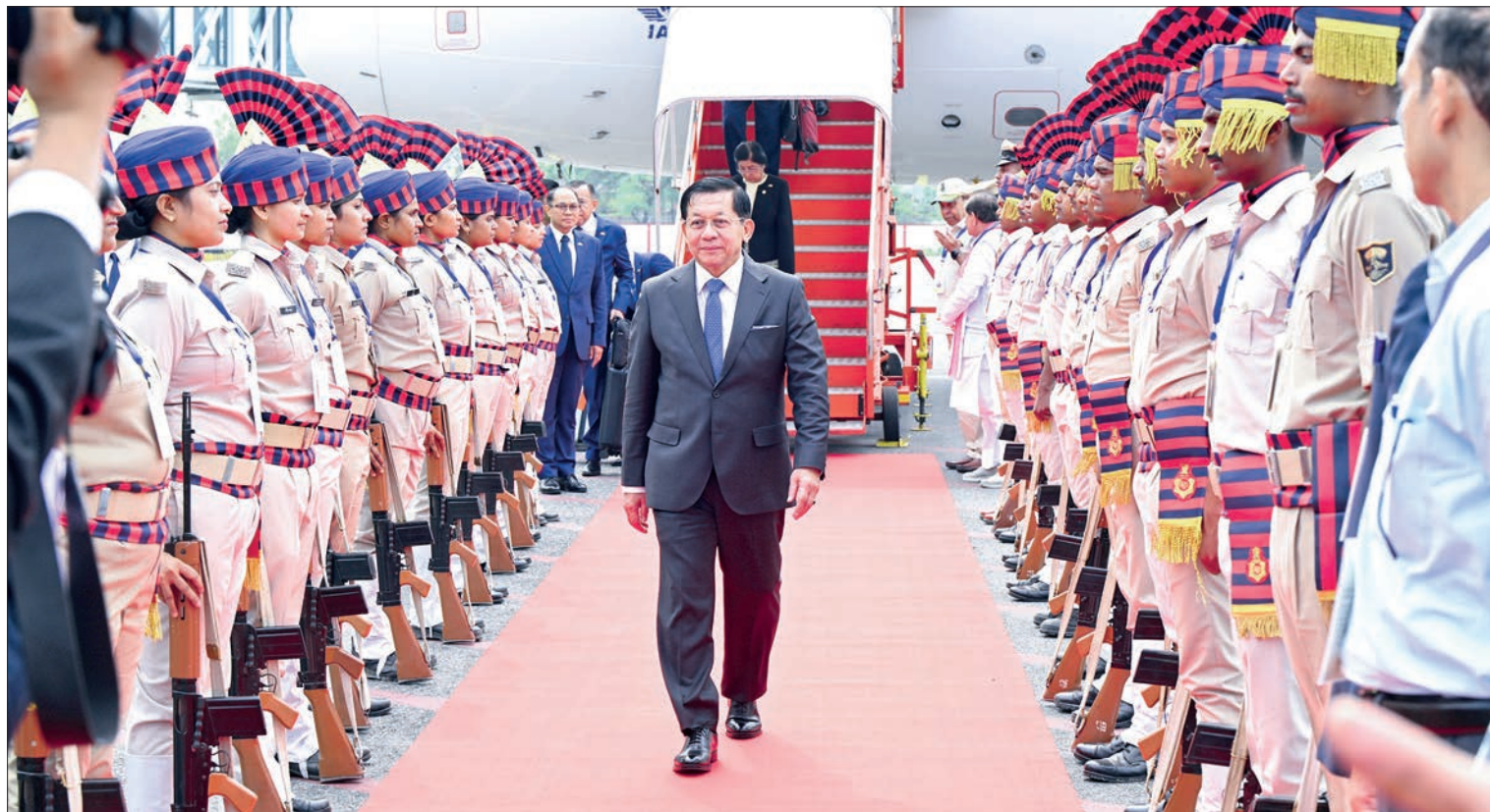
President of the Republic of the Union of Myanmar U Min Aung Hlaing warmly welcomed by officials with the Guard of Honour after arriving at the Gaya Airport in India yesterday.

During the visit, the President of Myanmar will meet with the President of India and hold bilateral talks with the Prime Minister. Moreover, the President will receive Cabinet Ministers of India, Governors of the states and representatives from business organizations. Furthermore, the President will tour the projects of prominent infrastructure facilities. During the visit, the President will