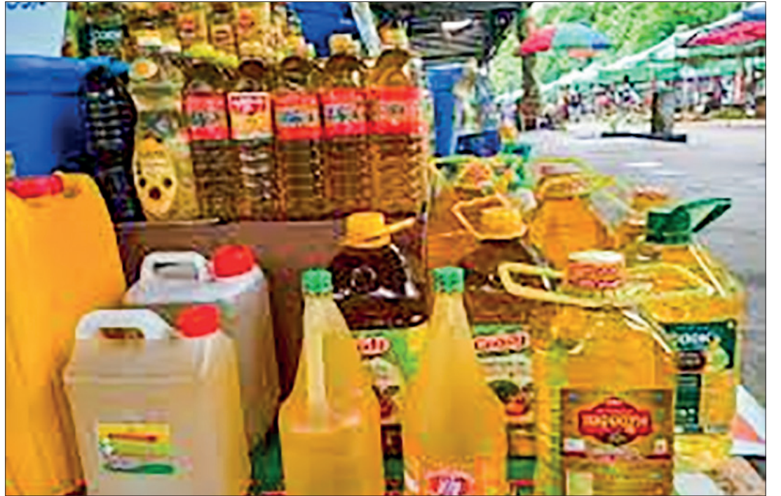
This photo shows edible oil bottles displayed in the market.

THE Myanmar Edible Oil Dealers' Association (MEODA)'s coordination meeting emphasized structural analysis data and seismic hazard assessments for critical storage depots.