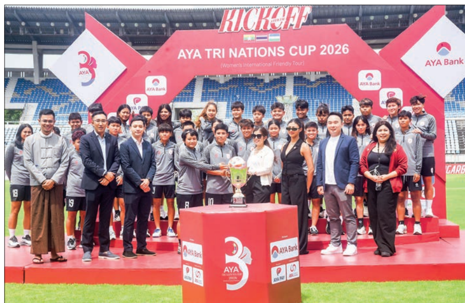
The official launch ceremony for the 2026 AYA Tri-Nations Cup is underway yesterday in Yangon.

will be available through AYA Pay. Fans purchasing tickets worth more than K5,000 via AYA Pay will also receive a digital lucky draw ticket with prizes worth up to K30 million.