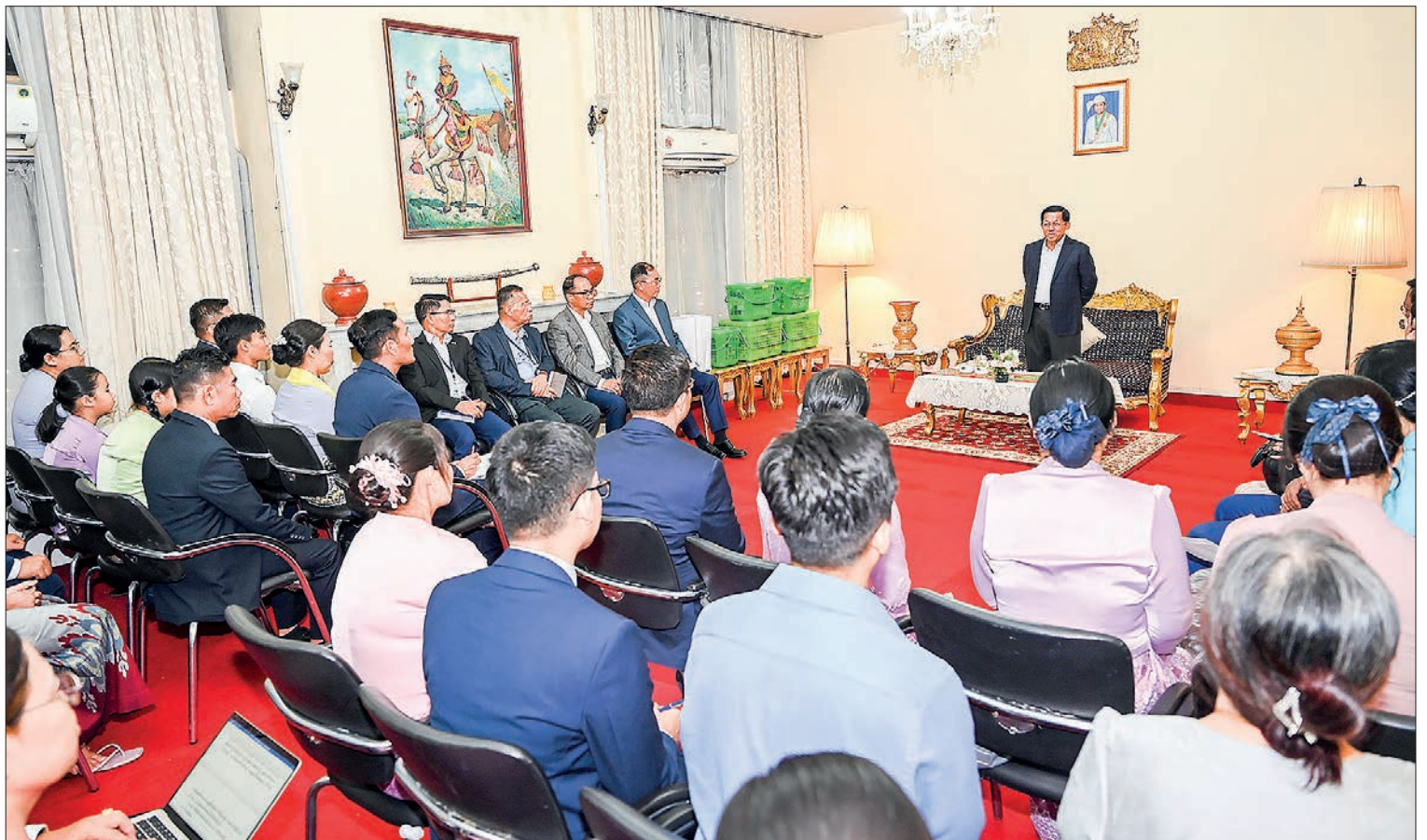
President of the Republic of the Union of Myanmar U Min Aung Hlaing meets families of the Myanmar Embassy, the Military Attaché office, and scholarship trainees in New Delhi, India, yesterday.

The President retold that efforts were made from all perspectives to ensure that a free and fair election could be held and successfully conducted. The elected representatives chosen by the people are now convening the Hluttaw, and the elected government is currently carrying