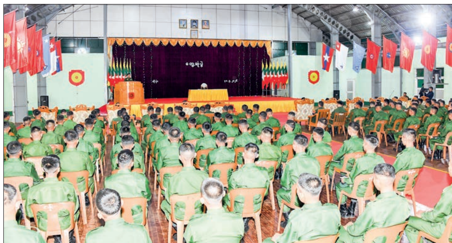
Defence Services Deputy Commander-in-Chief and Commander-in-Chief (Army) General Kyaw Swa Lin addresses the meeting with instructors and trainees at the hall of the Military Computer and Technological Institute in Hopong Station yesterday.

At Bayintnaung Hall of the institute, the General met with officer instructors and trainees. On the occasion, the General said that instructors need to train trainees to become more capable