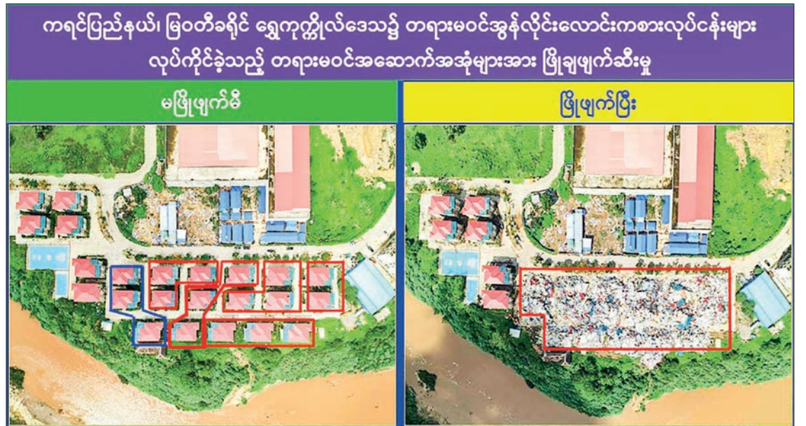
New images reveal the update before and after demolishing of scam-related structures, buildings, and facilities in the Shwe Kokko area, Myawady, Kayin State.

The government considers the eradication of telecom fraud and online gambling crimes as a national responsibility and, to ensure that such activities can no longer operate within Myanmar, will continue its efforts in coordination not only with domestic forces but also with the governments of neighbouring countries. — MNA/KTZH