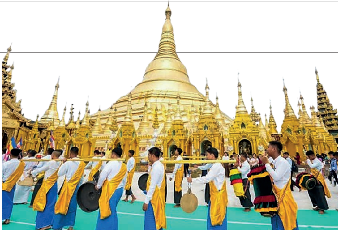
This image displays the Maha Samaya Day ceremony held at Shwedagon Pagoda.

The M-15 block, which is believed to contain natural gas reserves of up to one trillion cubic metres, is located in Myeik District in southern Taninthayi Region. It covers an area of more than 13,000 square kilometres west of Kadan Island, the largest island in Myanmar. A Production Sharing Contract (PSC) was signed between Singapore-based Canadian Foresight Group (CFG) and Myanmar Oil and Gas Enterprise (MOGE) in March 2015. — Htun Htun/MKKS