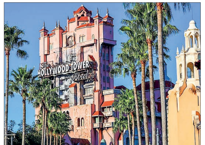
The Twilight Zone Tower of Terror at Disney's Hollywood Studios in Walt Disney World.