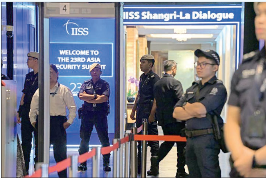
Policemen are on duty at the Shangri-La Hotel, the venue for the Shangri-La Dialogue 2026 in Singapore, 29 May 2026.