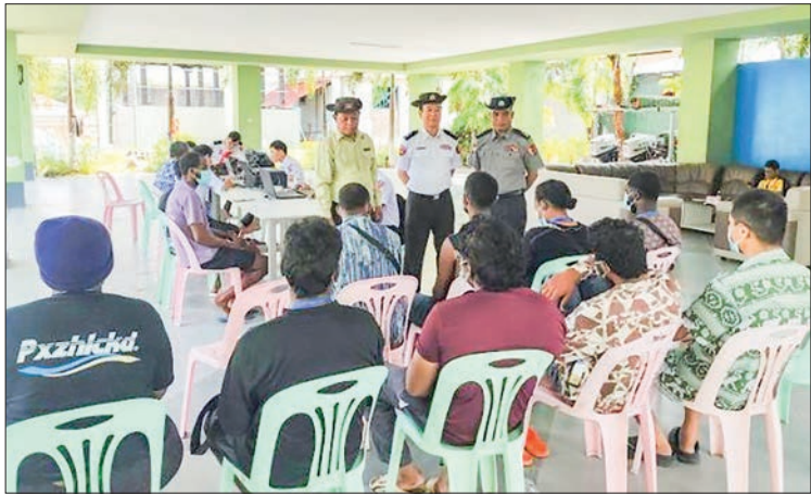
Immigration processes are underway for the deportation of undocumented foreign entrants.

AUTHORITIES have detained 12 foreign nationals involved in telecom fraud and other criminal activities.