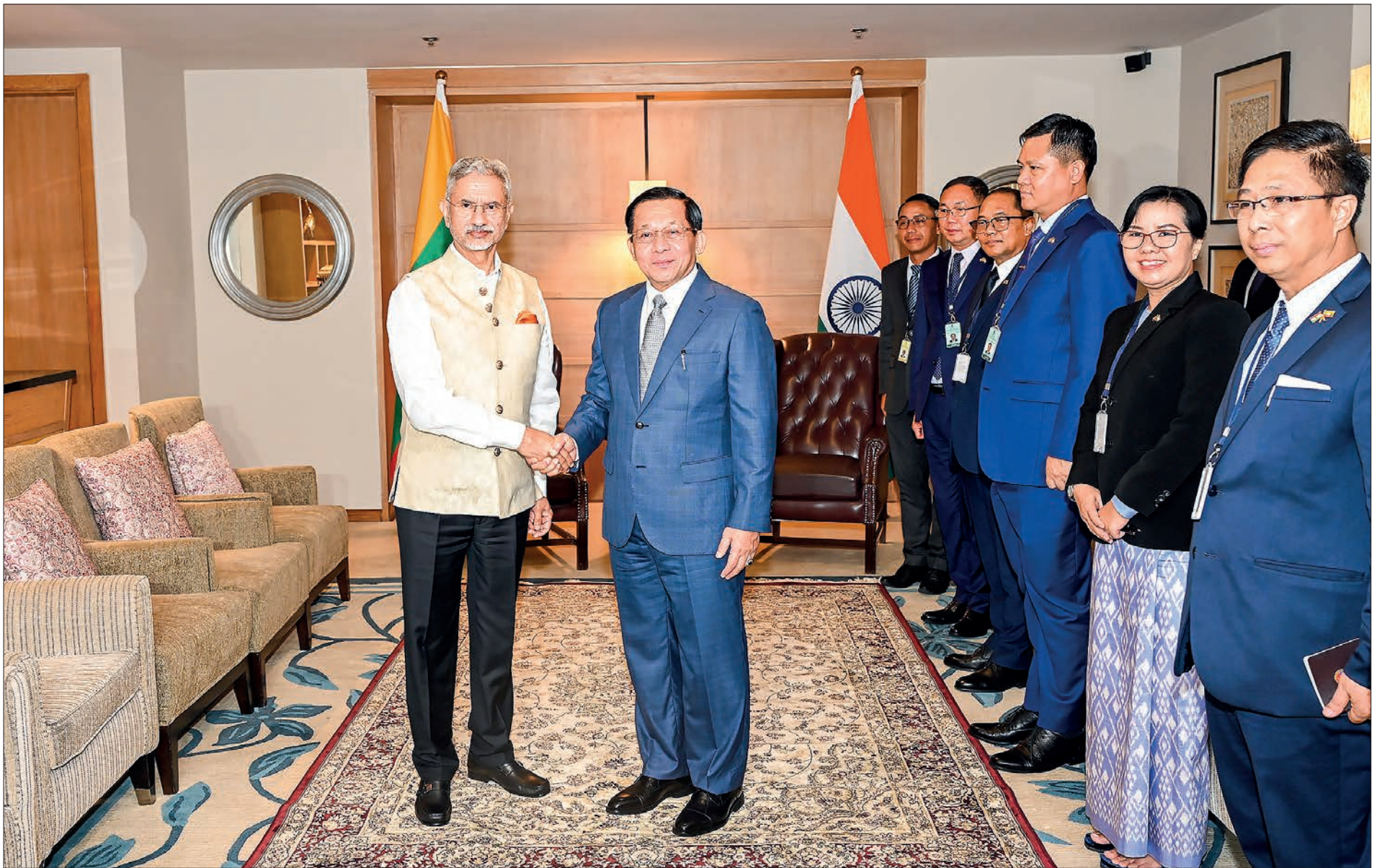
President of the Republic of the Union of Myanmar U Min Aung Hlaing and Indian Minister of External Affairs Dr Subrahmanyam Jaishankar shake hands at the meeting in New Delhi, India, on 30 May 2026.

M inister of External Affairs of India Dr Subrahmanyam Jaishankar paid a courtesy call on President of the Republic of the Union of Myanmar, U Min Aung Hlaing, currently in New Delhi, India,