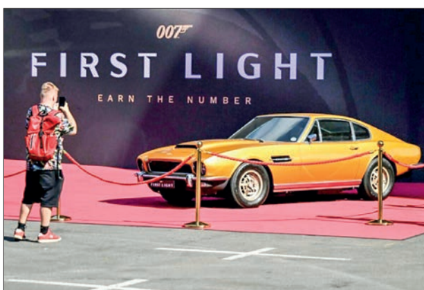
James Bond game "First Light" is released this week.

MILLENNIAL gamers who grew up on 1980s and 1990s blockbusters are being courted by the gaming industry, with new James Bond, Indiana Jones, and upcoming Jurassic Park video games.