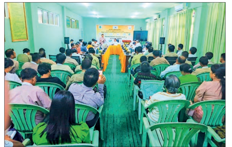
A Bio Fertilizer Seminar jointly organized by the MNFA-MIED and the Agri Institute of Asia (AIA) in progress in Yangon yesterday.

The seminar focused on the role of beneficial microorganisms and bacteria in biofertilizers and on the production and utilization of biofertilizers in accordance with the standards. — Thitsa (MNA)/KTZH