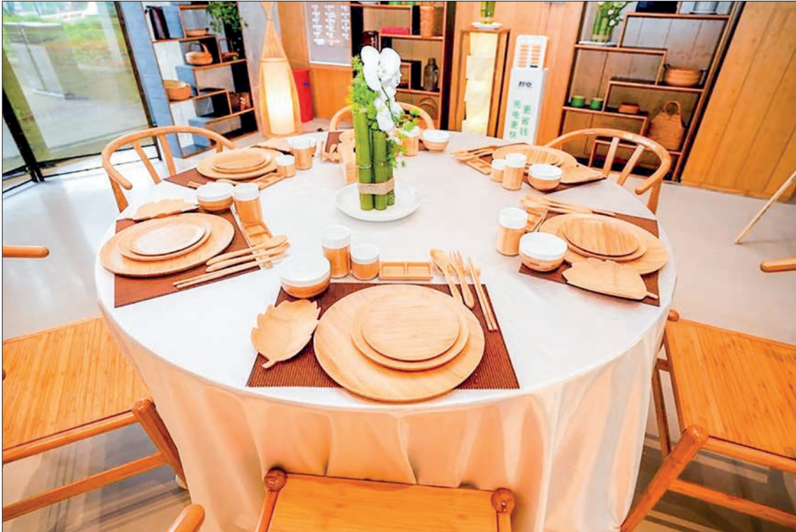
This photo shows bamboo tableware at a homestay in Anji County of Huzhou City, east China's Zhejiang Province.