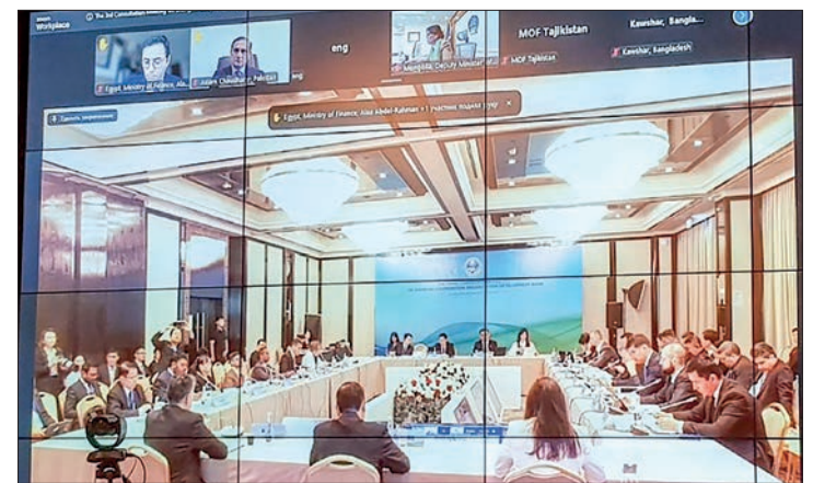
A Myanmar delegation participates in the 3 rd Deputy Ministerial Consultation on the Establishment of the Shanghai Cooperation Organization Development Bank (SCOB) held in Bishkek, Kyrgyzstan, on 28 May.

The consultation reviewed the draft Memorandum of Understanding (MoU) on the establishment of the Shanghai Cooperation Organization Development Bank and discussed its policy objectives, capital contributions, membership, voting rights, operational and adminis-