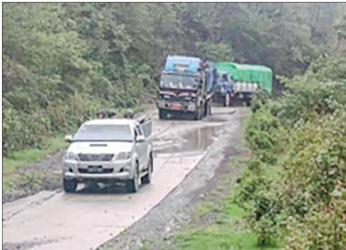
Supply convoy arrives in Tonzang, Chin State, with industrial and personal goods.

The rehabilitation items and commodities provided by the government were transported from Nay Pyi Taw to Kalay by military aircraft on