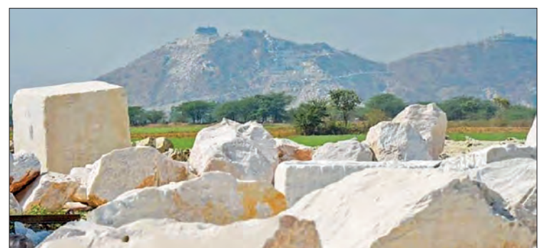
This photo captures marble blocks found in Madaya Township, Mandalay Region.

Sagyin Village is famous for its marble production and the art of carving in Madaya Township, Mandalay Region.