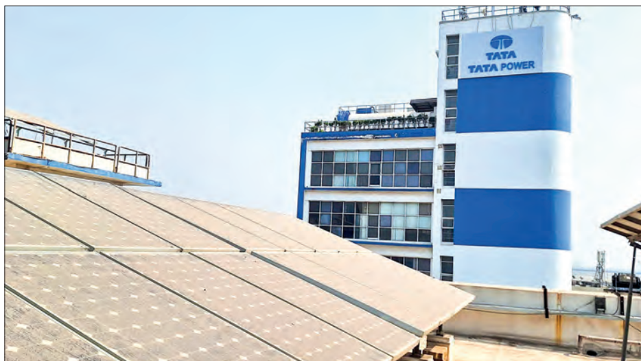
Commercial and industrial consumers accounted for 2,015 installations, while more than 50 Cooperative Group Housing Societies (CGHS) also adopted rooftop solar systems.

The company said residential consumers accounted for the majority of installations, with 8,451 households adopting rooftop solar systems. It added that consumers are benefiting through reduced electricity bills and the ability to supply surplus power back to the grid. The pace