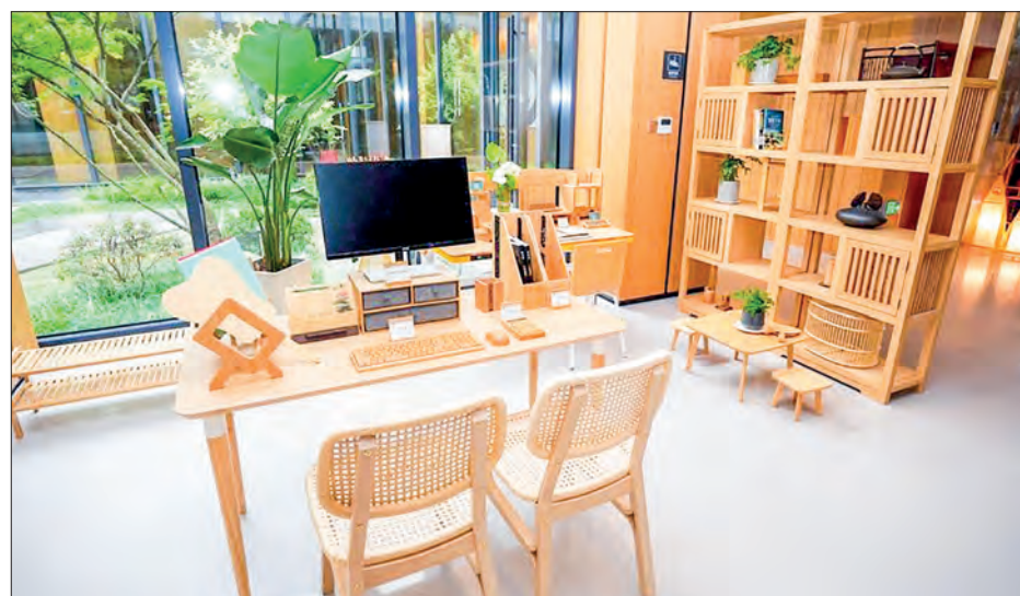
This photo shows furniture and office supplies made from bamboo.

Themed “Fostering an Intelligent Manufacturing Ecosystem to Accelerate the New Industrial Revolution,” the BRICS New Industrial Revolution Partnership Forum attracted representatives from BRICS member states, partner countries, and other developing nations, as well as relevant international organizations from Wednesday to Thursday.