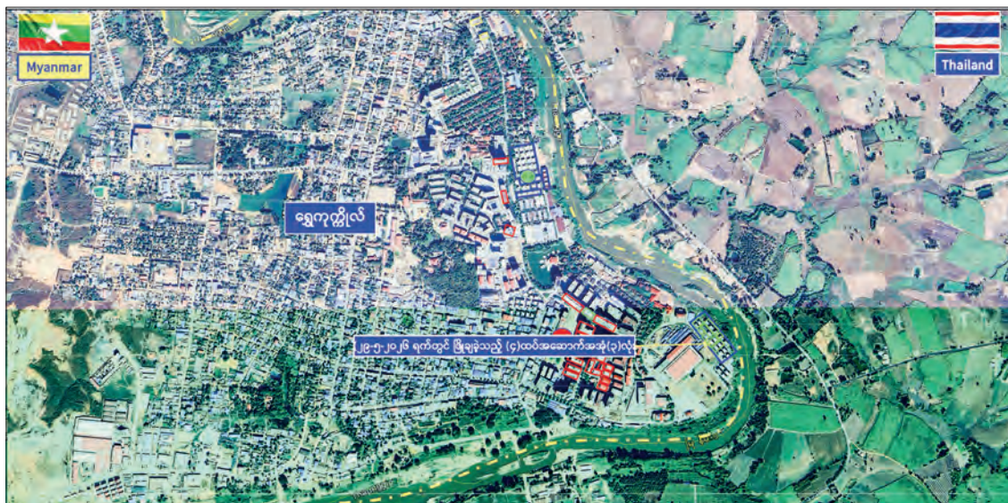
An aerial drone view of scam-related facilities in the Shwe Kokko area, Myawady, Kayin State.

Officials confirmed that a total of 15 buildings have now been demolished so far. The remaining