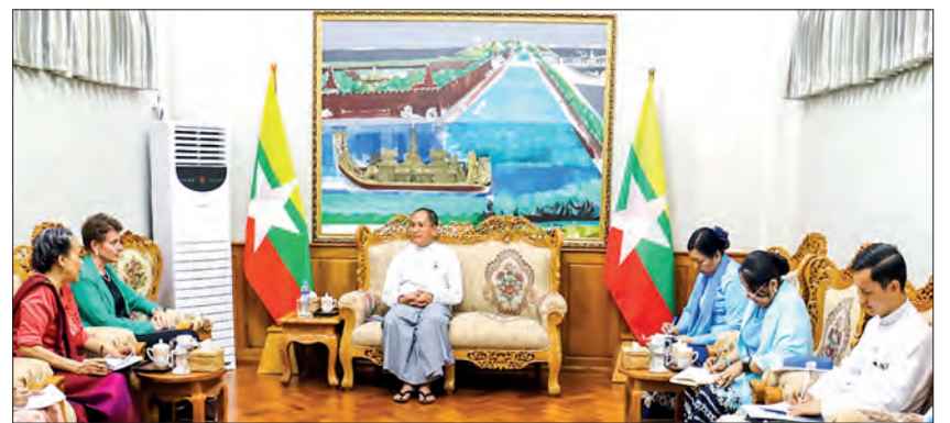
UN Resident and Humanitarian Coordinator ad interim for Myanmar Ms Gwyn Lewis calls on Union Minister U Aung Kyaw Hoe.

operation between the government entities and UN agencies for more effective and efficient implementation of the UN's projects in Myanmar and future cooperation programmes. — MNPIFER