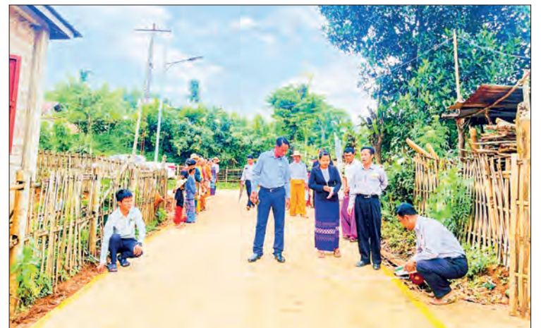
Officials inspect the completion of a village concrete road construction project yesterday.

The projects have now been fully completed and are expected to improve year-round transport and socioeconomic conditions for 116 households with a population of 562 people in the two villages. — Maung Khaing (Rural)