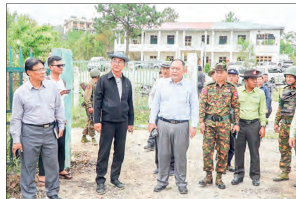
Deputy Minister Dr Than Soe and officials inspect rehabilitation and reconstruction efforts in Tonzang, Chin State.

They later attended a donation ceremony for the rehabilitation and reconstruction of Tonzang Township held at the Basic Education High School in the township.