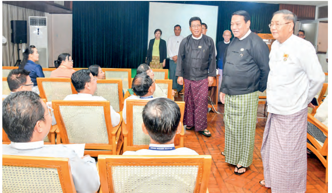
Pyithu Hluttaw Speaker U Khin Yi meets the Speaker and Deputy Speaker of the Yangon Region Hluttaw and legal experts yesterday.

He noted that it is necessary to enact laws that are required to safeguard the national interests of the country in regional and