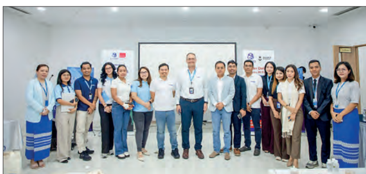
This photo captures some of the young applicants for the 'Talent Accelerator Programme 2026' together with officials from ATOM.

More than 400 applicants reportedly applied for the 'Talent