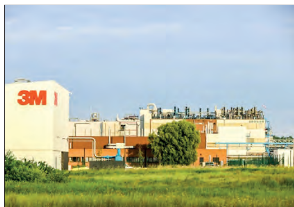
The US multinational maker of Post-it and Scotch tape is also being sued in the United States over its use of PFAS.