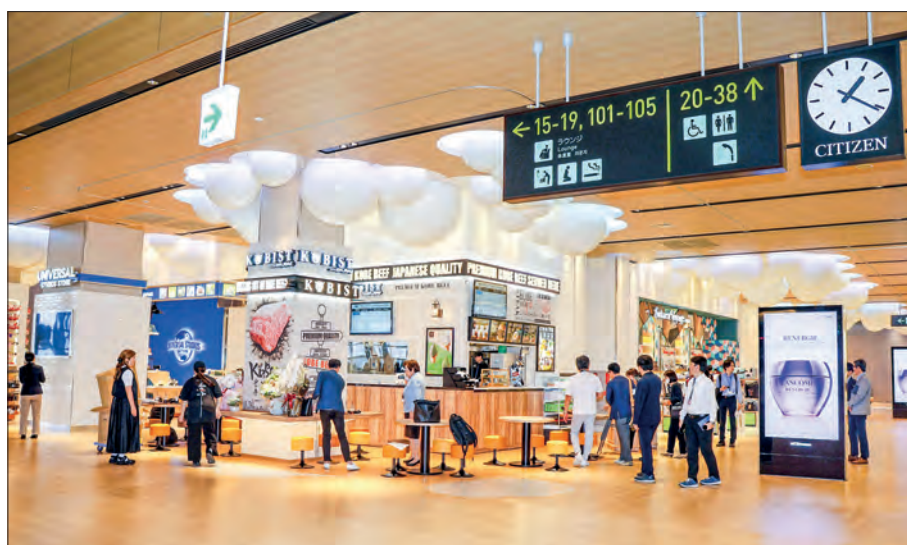
Kansai airport international commercial area is unveiled to the media on 29 May 2026, after a major renewal.

KANSAI International Airport in western Japan unveiled its expanded international area to the media Friday after five years of construction work, as its