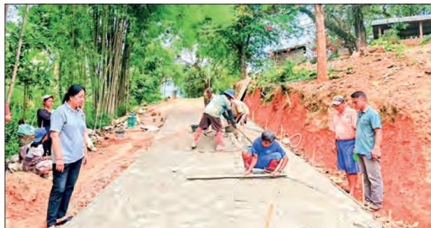
Officials oversee the ongoing concrete road construction work in Tachilek Township.

THE Department of Rural Development under the Ministry of Cooperatives and Rural Development, Tachilek District, Shan State (East), inspected the ongoing concrete road construction work in old Panau Village, Tachilek Township, on the morning of 29 May.