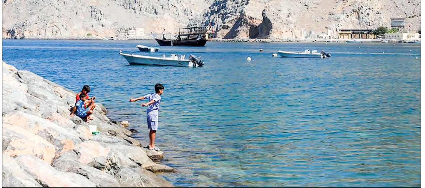
Children play by the shore at Kumzar Village in Oman, 19 February 2025. Kumzar, a remote fishing village in the Musandam Peninsula in northern Oman, located in a sheltered harbor near the strategic shipping lane of the Strait of Hormuz.

According to the report, the proposed 60-day MoU would state that shipping through the Strait of Hormuz would be "unrestricted". A US official was quoted as saying this would entail no tolls or harassment, and that Iran would be