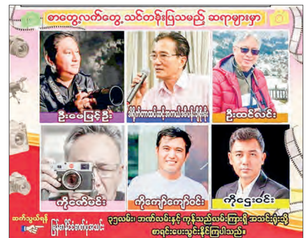
Professional photographers who will lead the basic photography training course.

It is the 51 st batch conducted by the Myanmar Photographic Society