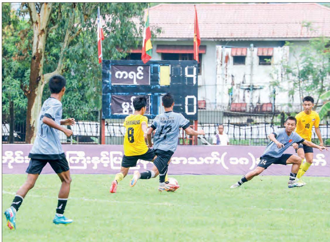
Players from the Kayin State and Mon State teams is seen actively vying for the ball in their match.

With these results, the Kayin State, Ayeyawady Region, Shan State and Kachin State teams advanced to the semifinals of the tournament.