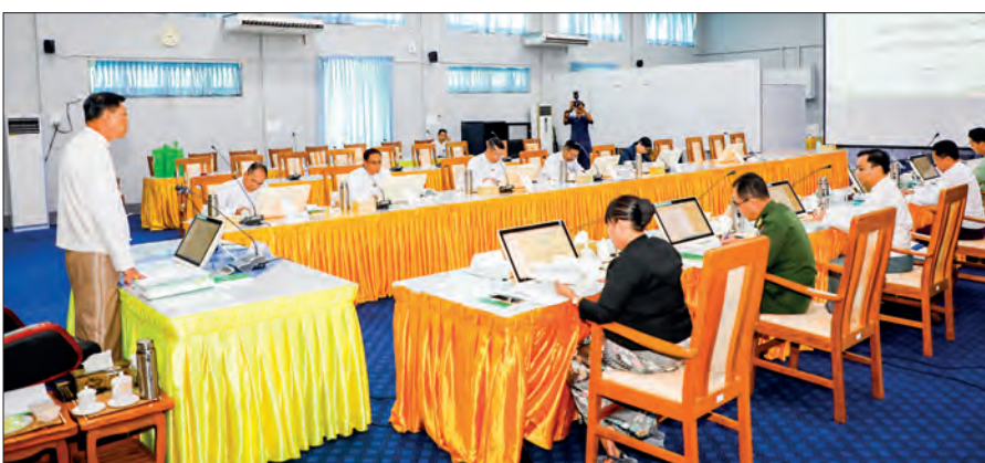
Union Minister U Mya Tun Oo presides over the fourth meeting of the Myanmar Investment Commission yesterday.

to the monks who passed the examination. They also viewed around the booths on religious affairs from the first to the sixth Buddhist Synod in commemoration of the 70 th Anniversary of the Sixth Buddhist Synod in the cave. The Tipitakadhara Tipitakakovida Selection Examination aims to honour the Pariyatti Sasana and produce the distinguished monks who have memorized the Tipitaka Canon. From 1948 to 2026, the examinations have produced 18 distinguished monks, and the 78 th examination produced Ashin Vicittasara as the 18 th distinguished monk who memorizes the Tipitaka Canon. — MNA/TTA