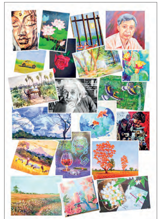
This image displays a catalogue for the “IT IS 2” Group Art Exhibition.

A gallery official said the exhibition will be open daily from 10 am to 5 pm throughout the event period and invited art enthusiasts and the public to attend and support the exhibition. — ASH/KZL