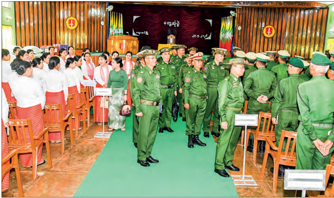
Defence Services Deputy Commander-in-Chief and Commander-in-Chief (Army) General Kyaw Swa Lin warmly greets Tatmadaw members and their families from the Bahtoo Station yesterday.

Speaking on the occasion, the General underscored that Tatmadaw must strive to fulfill the essential requirement of ensuring peace and stability in the State to firmly pursue the path of a genuine and disciplined multiparty democratic system and to build a Union based on democracy and a federal system, adding that all Tatmadaw members need to make strenuous efforts to build a capable and combat-ready Tatmadaw that the people can rely on and trust.