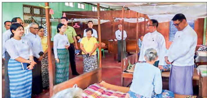
Members of the Myanmar National Human Rights Commission are pictured during their inspection tour.

AN inspection team led by members of the Myanmar National Human Rights Commission conducted an inspection visit to the Daydanaw Home for the Aged in Kungyangon Township, Yangon Region, on 29 May 2026. During the vis-