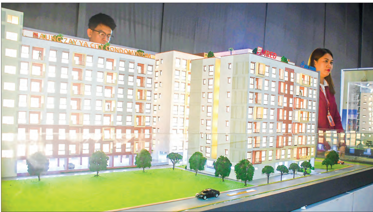
A 3D scale model of the upcoming Aung Zay Ya City Condominium project.

T he implementation of condominium projects is underway in Yangon, Mandalay and Nay Pyi Taw for public housing, and these projects are creating job opportunities, according to the Real Estate and Car Expo held at the Yangon Convention Centre yesterday.