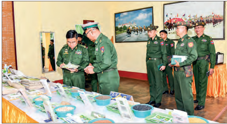
Defence Services Deputy Commander-in-Chief and Commander-in-Chief (Army) General Kyaw Swa Lin looks into the quality seeds of crops on display at yesterday's event.

At the trainee mess hall of the Tatmadaw (Army) Warrant Officer and Non-Commissioned Training School in Bahtoo Cantonment, the General inspected the storage of rations, meat, fish and vegetables at the stores, the cooking process, and meal preparations. He gave instructions on spraying for the prevention of mosquitoes and flies in order to ensure the healthy