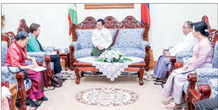
Union Minister U Myint Kyaing meets the UN Resident and Humanitarian Coordinator ad interim for Myanmar yesterday.