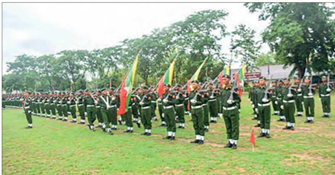
The graduation ceremony of the People's Military Service Training (Batch 23) is in progress yesterday in Taikkyi Township, Yangon Region.

After the ceremony, the Nay Pyi Taw Council chairman, the region and state chief ministers, commanders and relevant officials cordially greeted the graduates.