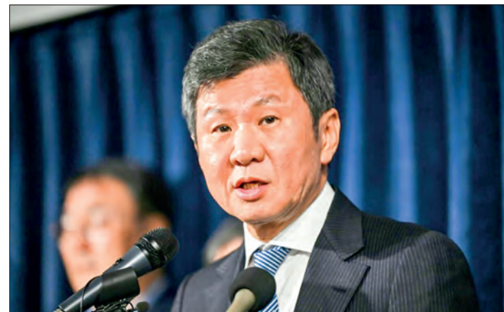
Chung Mong-gyu said he would quit as president of the Korea Football Association after the World Cup.

THE president of South Korea's football association said Friday that he will quit after the World Cup, blaming his "lack of virtue" following fierce criticism of his 13-year tenure.