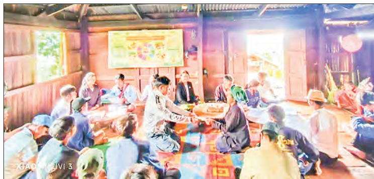
The disbursement ceremony of the Green Village Project fund is underway yesterday.

During the current pilot phase, over 80,000 farmers are receiving loans allocated at K300,000 per acre, with a maximum of K3 million. — Htun Htun/ZN