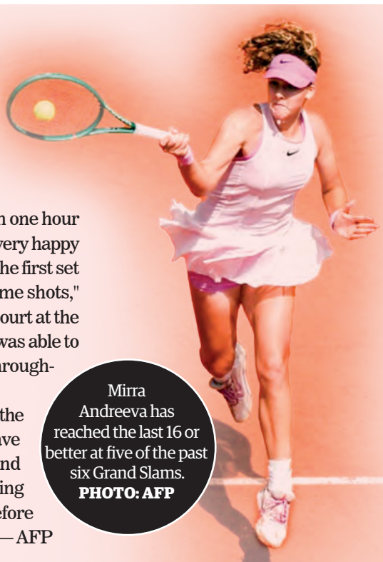
Mirra Andreeva has reached the last 16 or better at five of the past six Grand Slams.

Andreeva said the first-week heat wave suited her game and she preferred playing in the afternoon before the courts cooled. — AFP