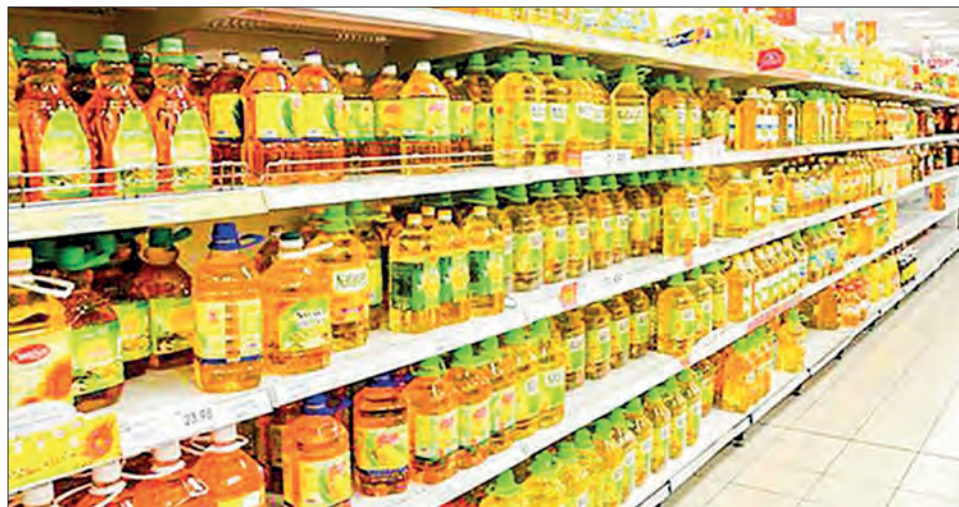
Bottles of cooking oil are arranged for sales inside the supercentre.

THE wholesale reference prices of palm oil set for the Yangon market continued to decrease at K7,387 per viss this week, ending 4 June from K7,423 per viss recorded last week, according to the Supervisory Committee on Edible Oil Import and Distribution.