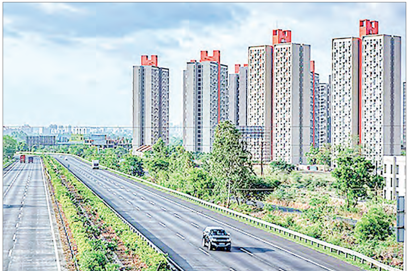
India raised its upcoming financial year infrastructure spending to historic, record-breaking levels.

The report highlights India's strong growth prospects, with 52 per cent of chief economists expecting robust economic performance over the next year.