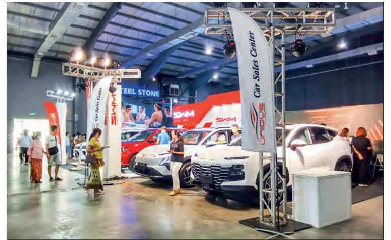
The opening ceremony of the 20 th edition of Myanmar's largest real estate and car expo in Yangon.

It is also learned that the expo will feature seminar sessions where experts from diverse fields will attend and give presentations. — MT/ZN