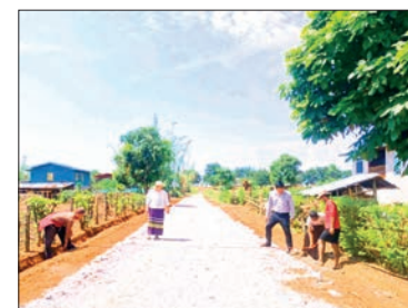
This image show a section of the completed inner-village sandy road project in Hsihseng, Shan State (South).

The infrastructure project was implemented by local villagers with technical assistance and close supervision from township department officials. Funded with K15 million under the VDP programme, along with public contributions, the project has now been fully completed at 100 per cent. — Sein Lwin (Rural)