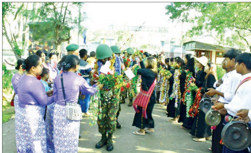
Images show triumphant Tatmadaw troops receiving warm welcome at the Eastern Command Headquarters yesterday.