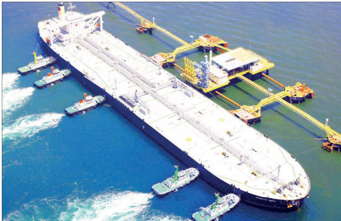
This photo taken from a Kyodo News helicopter shows the Idemitsu Maru in the sea off Chita, Aichi Prefecture, central Japan, on 25 May 2026.

But many investors are betting Trump is eager to declare an accord that would see Gulf tanker traffic resume through the