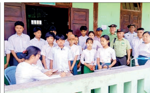
Mohnyin, Kachin State.