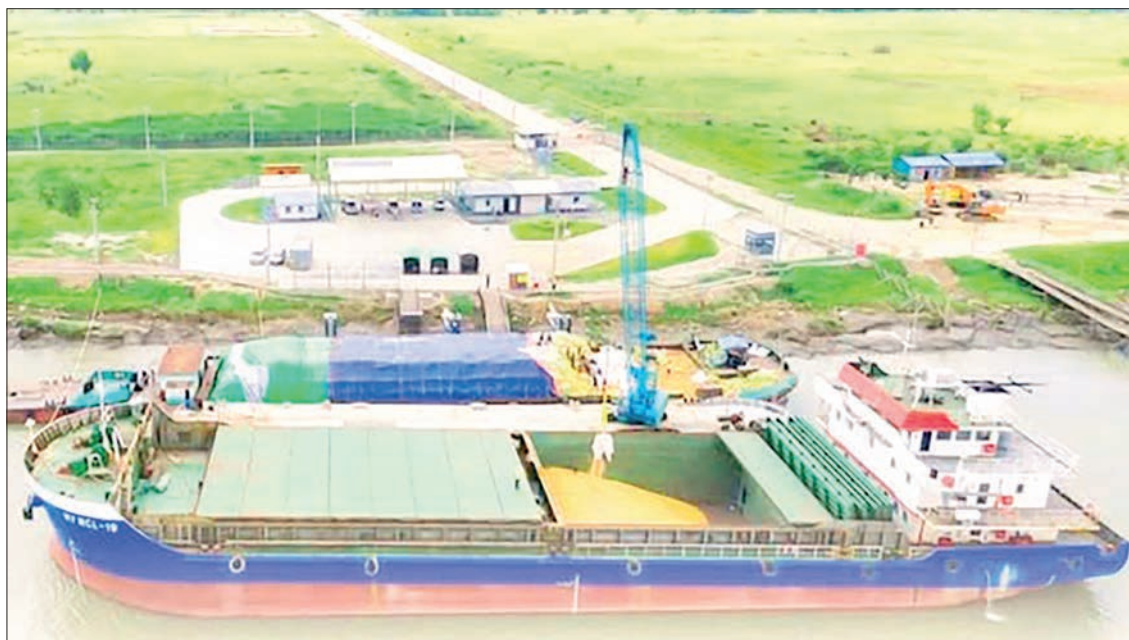
The Pathein Industrial Port in Ayeyawady Region is seen handling export cargo operations.

THE Ayeyawady Region government has announced that maize produced within Ayeyawady Region will be directly exported to Ranong Port in Thailand via the Pathein Industrial Port.