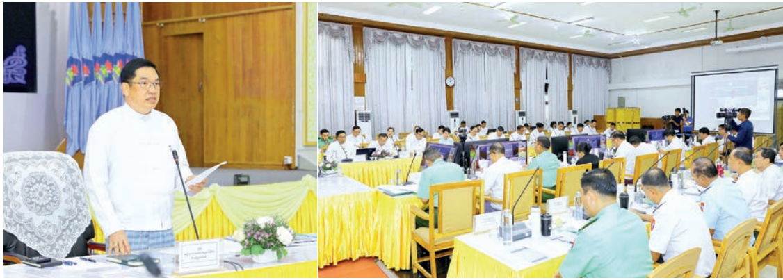
The coordination meeting of the National Disaster Management Committee is underway yesterday, chaired by Vice-President U Nyo Saw.

T HE National Disaster Management Committee held its coordination meeting at the Ministry of Social Welfare, Relief and Resettlement in Nay Pyi Taw yesterday afternoon, attended by Committee Chairman and Vice-President of the Republic of the Union of Myanmar U Nyo Saw.