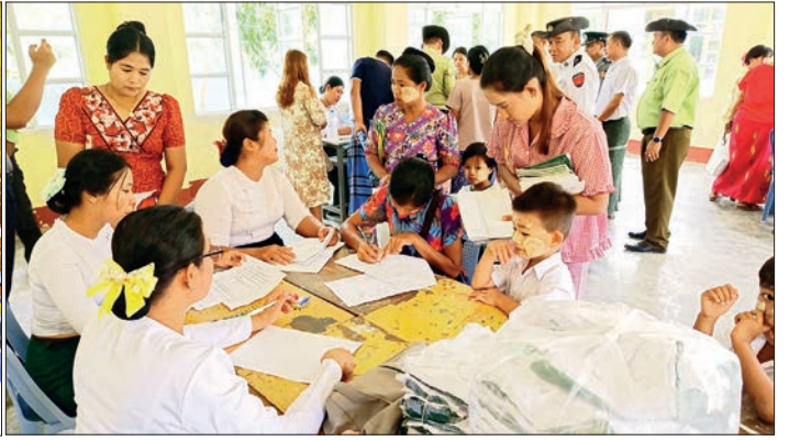
Bokpyin, Taninthayi Region.