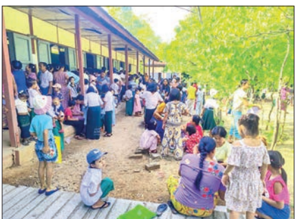
Pakokku, Magway Region.