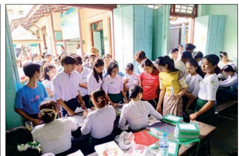
Myeik, Taninthayi Region.