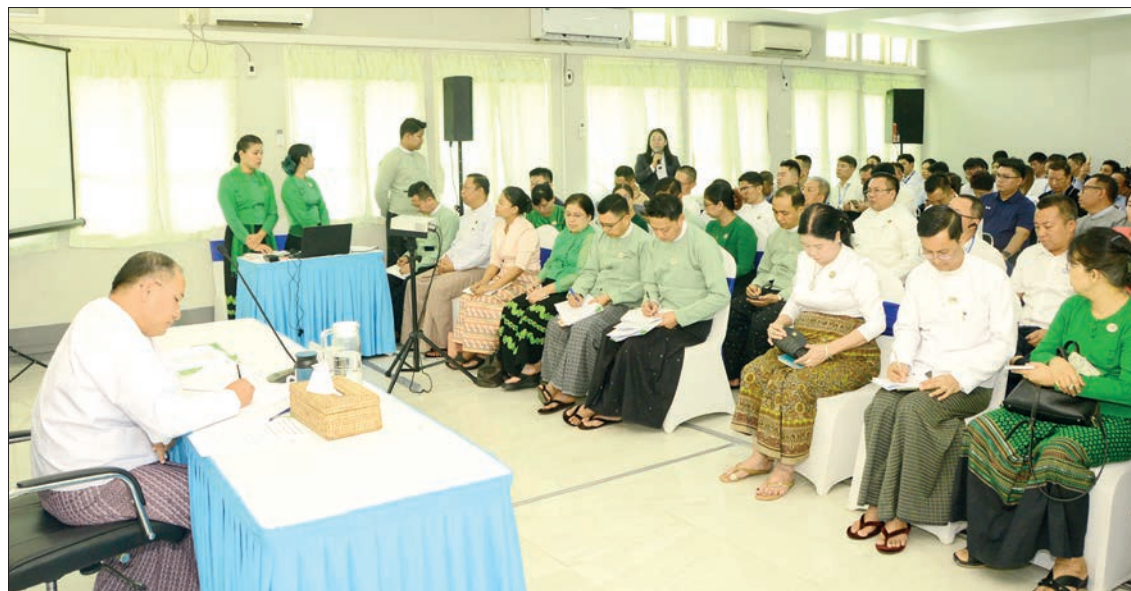
Union Minister U Aung Kyaw Hoe leads the discussions on investment opportunities using the yuan in Yangon yesterday.

The Union minister also inspected the operations of the One-Stop Service (OSS) of the DICA after the meeting.