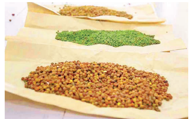
Sample of various pulses displayed at the domestic depot.

Myanmar is one of the world's largest bean producers. Myanmar's agriculture sector is the backbone of the country's economy, and it contributes to over 30 per cent of the Gross Domestic Product. There are over 17 million acres of paddy and 10 million acres of pulses and beans in the country. The country's second-largest production is pulses and beans, accounting for 33 per cent of agricultural produce and covering over 20 per cent of growing acres. — ASH/KK