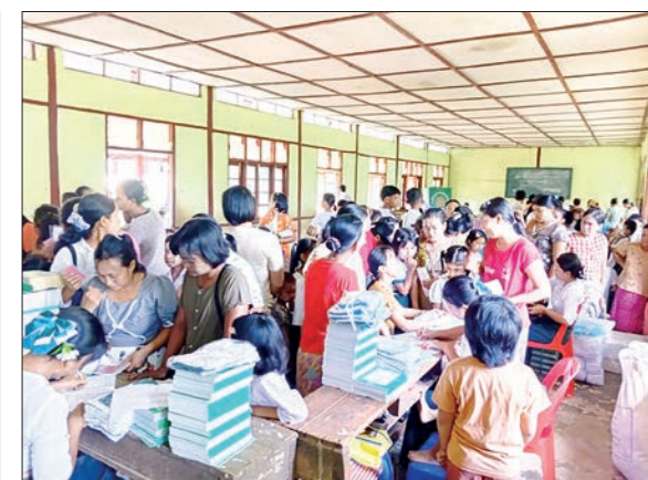
Pyigyimandaing, Taninthayi Region.