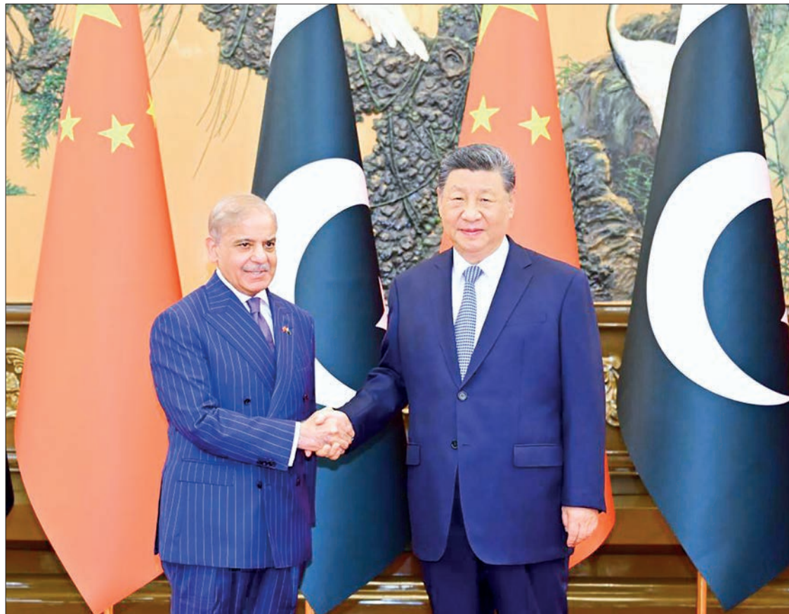
Chinese President Xi Jinping meets with Pakistani Prime Minister Shehbaz Sharif, who is on an official visit to China, at the Great Hall of the People in Beijing, capital of China, 25 May 2026.

China has always prioritized the development of China-Pakistan relations in its neighbourhood diplomacy no matter how the international situation changes, Xi said.