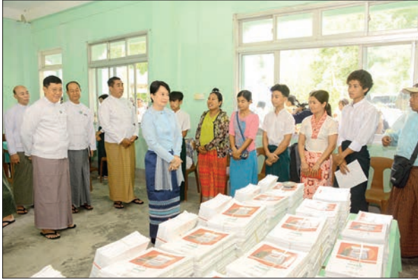
Nay Pyi Taw.