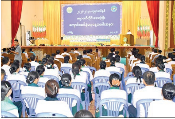
Pathein, Ayeyawady Region.