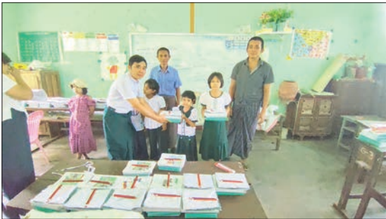
Gyobingauk, Bago Region.