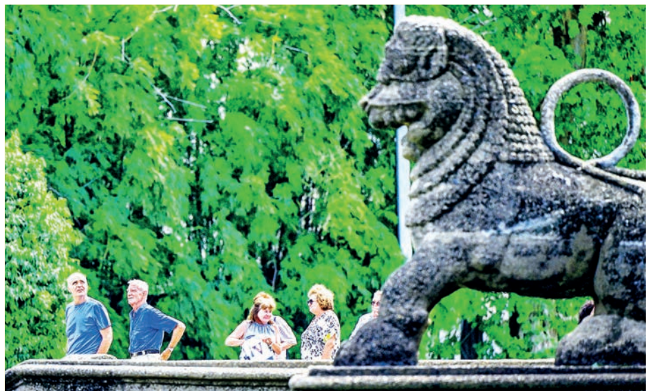
Tourists walk past a stone lion at the Independence Memorial Hall, built to commemorate Sri Lanka's independence from British rule, in Colombo on 1 July 2025.

SRI Lanka began offering a free Electronic Travel Authorization (ETA) for tourist purposes to nationals of 40 countries on Monday.