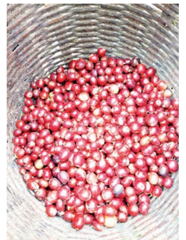
This photo captures green gold coffee cherries and green coffee beans.

Efforts are being made to continue exporting Green Gold green coffee beans to the United States as well. — ASH/KNN