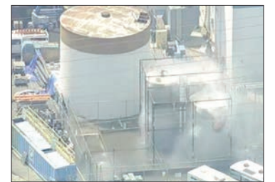
The chemical facility in Orange City, Garden Grove.

Evacuation Centres are the Garden Grove Sports and Recreation Centre, Address: 13641 Deodara Dr Garden Grove, CA 92844, the Cypress Recreation and Community Centre, Address: 5700 Orange Avenue, Cypress, CA 90630, Public Information Hotline: 714 6287085, and 24-Hour Call Centre: 714 7415444. — MT/ZS