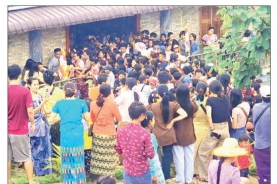
Pilgrims gather at the Taungpula Durian Charity Feast in PyinOoLwin.

The charity event also featured musical performances by artists as well as the distribution of fried potatoes. Taungpula Hill is located near Wetwun Village and Peik Chin Myaung Cave in PyinOoLwin, Mandalay Region. It is a prominent landmark that attracts tourists and pilgrims from all over Myanmar.