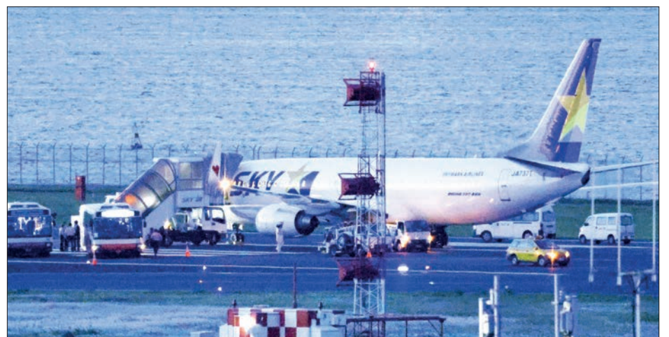
This photo taken on 25 May 2026 shows a Skymark Airlines passenger jet on a runway of Tokyo's Haneda airport after it made an emergency landing.

Haneda's Runway C was temporarily closed for checks following the emergency landing, reopening at around 7:40 pm. — Kyodo