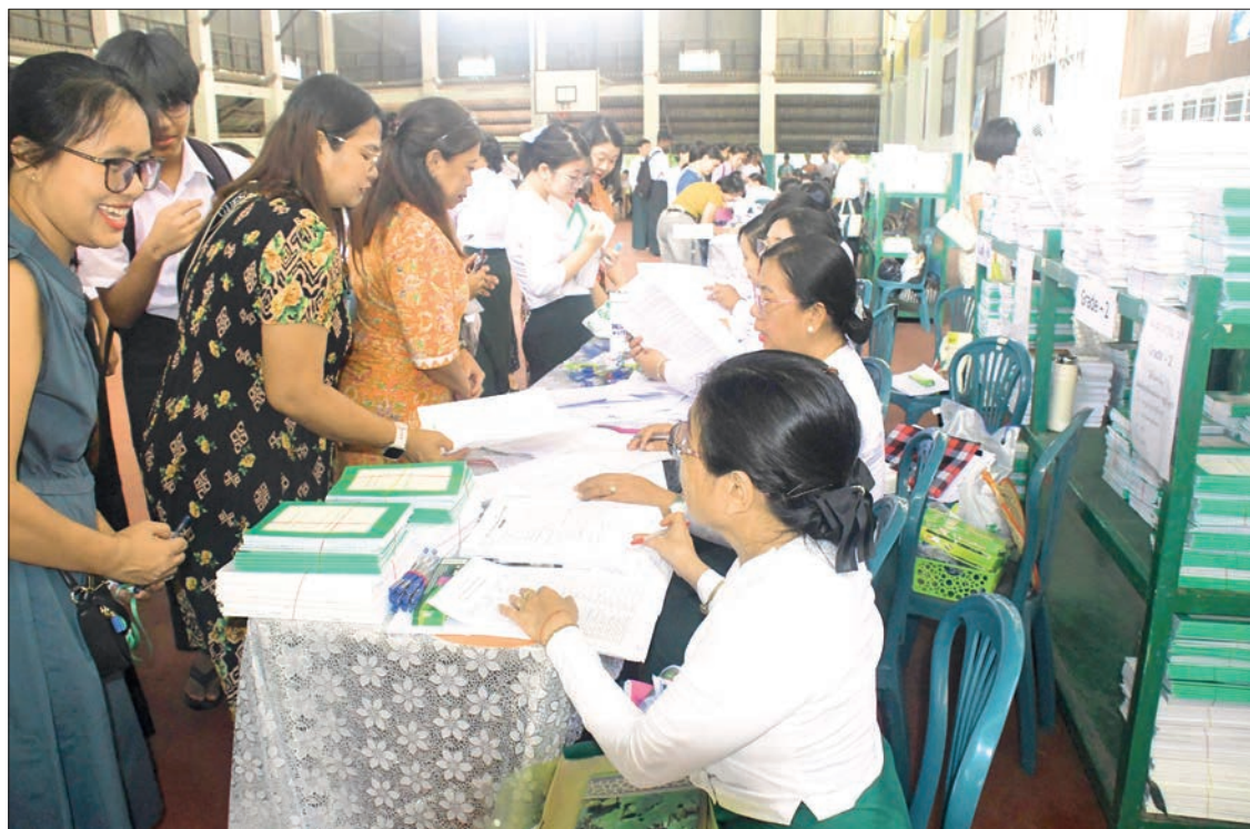
Students flock to No 1 Dagon BEHS for school enrolment.

“The free education system is being implemented to ensure that every school-age child can attend school, in line with the educational objective. During school enrolment, students are