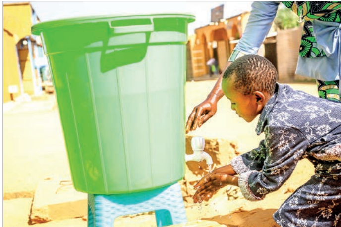
A young girl washes her hands before entering the church following local authorities' instructions to limit the spread of the Ebola outbreak in eastern Democratic Republic of the Congo ahead of a mass at Bunia Cathedral in Bunia on 24 May 2026.

There is no vaccine or treatment for the Bundibugyo strain responsible for the current Ebola outbreak, the 17 th to plague the vast central African country of more than 100 million people.