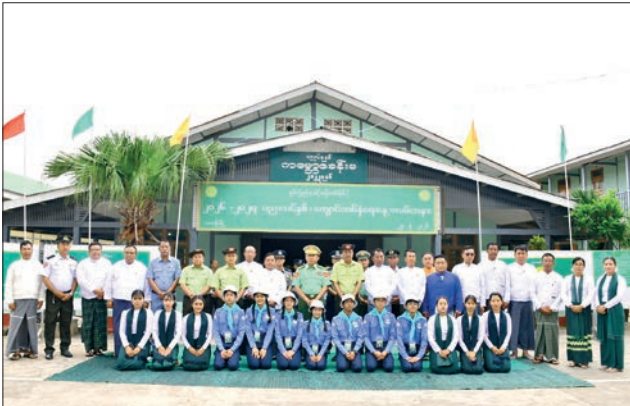
Lashio, Shan State (North).