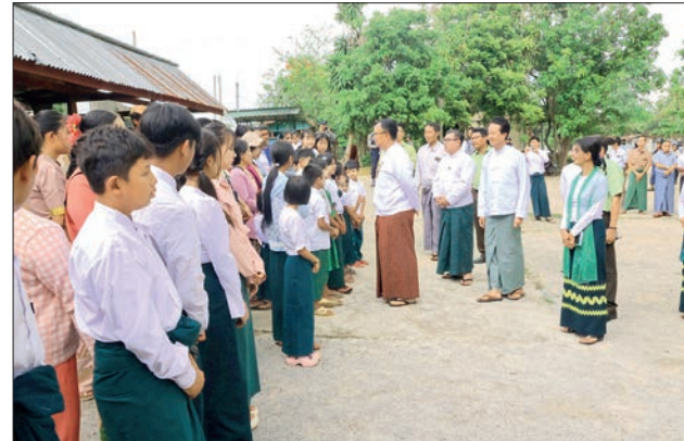
Loikaw, Kayah State.