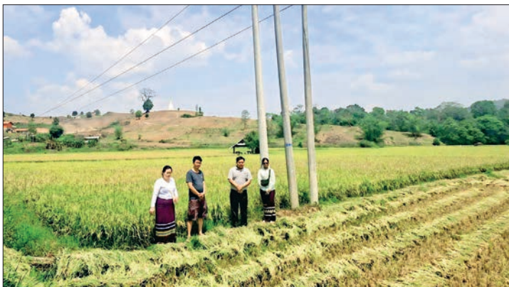
Officials oversee the successful implementation of the green village project in Shan State (East).

OFFICIALS from the Department of Rural Development under the Ministry of Cooperatives and Rural Development, Shan State (East), Mongyan District, conducted a field inspection yesterday in Wanawei Village and Mongloi (Lower) Village, Mongyan Township, to assess the successful implementation of income-generating activities supported