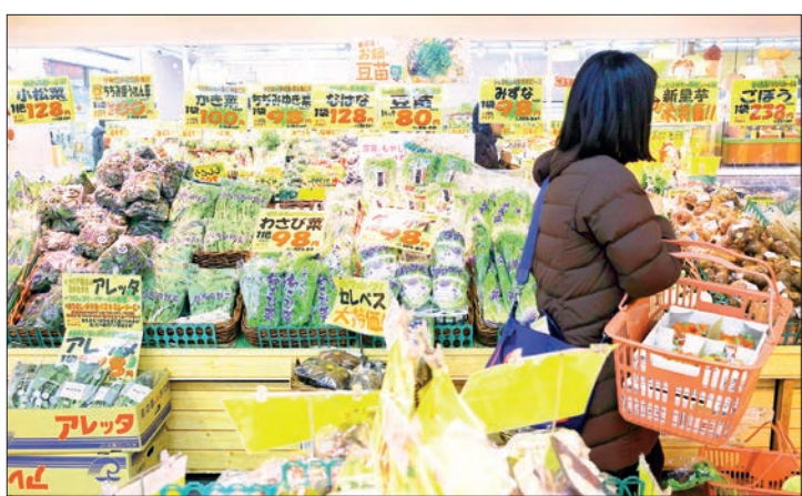
File photo shows a customer visiting a supermarket in Tokyo on 19 January 2026.

THE Japanese government is leaning towards the idea of cutting the current eight per cent consumption tax on food to one per cent, rather than zero as pledged earlier, for faster introduction to tackle the rising cost of living, sources close to the matter said Monday.