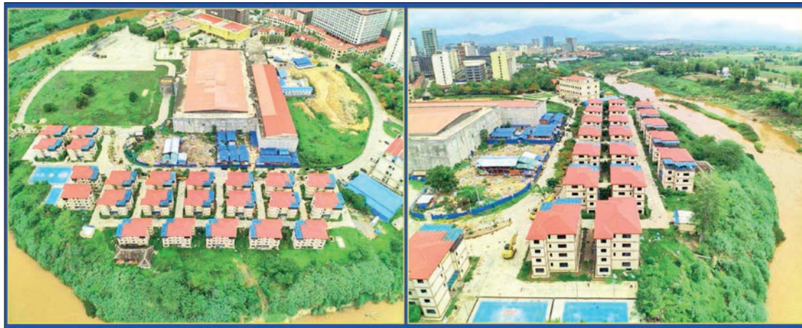
Aerial views reveal 21 four-storey buildings slated for demolition in Shwe Kokko, Myawady.

The government considers the eradication of telecom fraud and online gambling crimes as a national responsibility and, to ensure that such activities can no longer operate within Myanmar, will continue its efforts in coordination not only with domestic forces but also with the governments of neighbouring countries. — MNA/KTZH