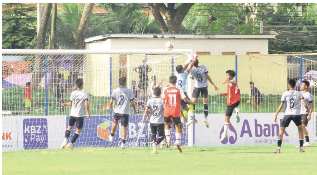
Players clash in the goal area during a high-stakes group match.

GROUP-STAGE matches of the 2026 Inter-State and Region Under-18 Men's Football Tournament continued on 23 May at four venues across Myanmar, with strong support from football fans and departmental officials.