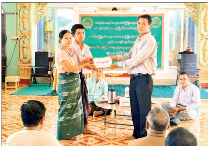
The disbursement ceremony for rural business funds is in progress yesterday in the Nay Pyi Taw Union Territory.

Following this, township officials formally transferred