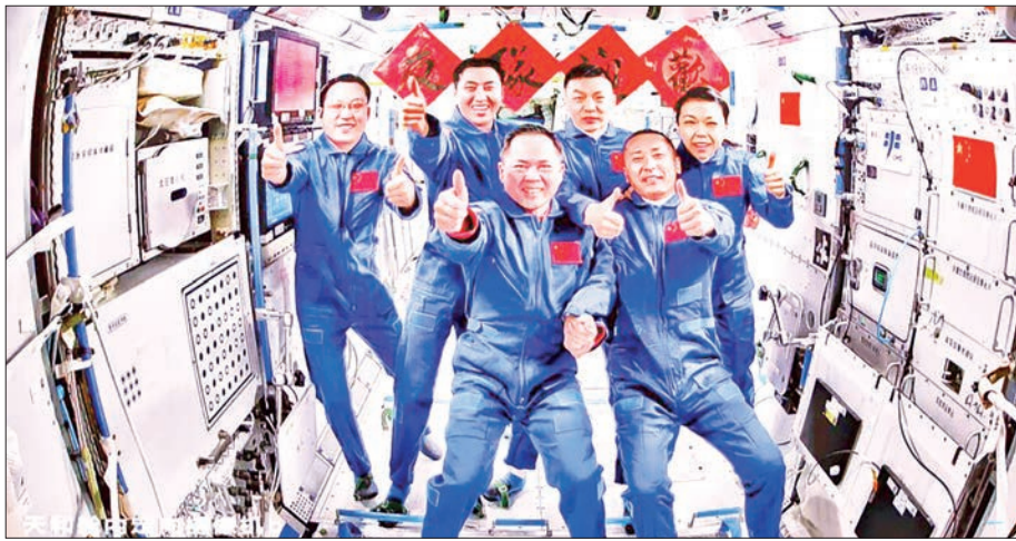
This image captured at Beijing Aerospace Control Centre on 25 May 2026 shows a group picture of the crew of Shenzhou-21 and Shenzhou-23 spaceships.

THE three astronauts aboard China's Shenzhou-23 spaceship have entered the Tiangong space station and met with another astronaut trio on Monday, starting a new round of in-orbit crew handover.