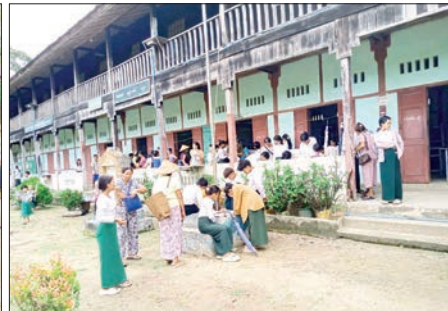
Kamaing, Phakant, Kachin State.