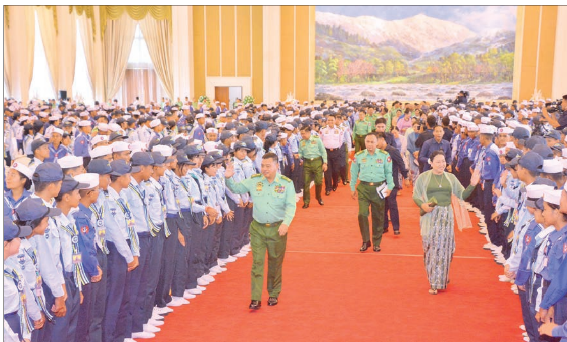
Defence Services Commander-in-Chief General Ye Win Oo warmly greets trainees, supervisors and instructors of the basic and advanced maritime and aviation youth courses in Nay Pyi Taw yesterday.

He underscored that all youth have to know that their strength is the best for sustainability of the State and efforts to