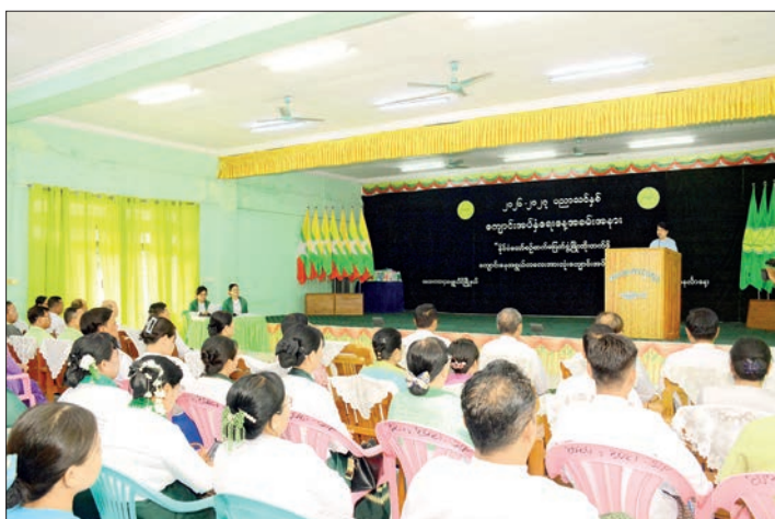
The School Enrolment Day Ceremony is underway yesterday in Nay Pyi Taw.

The Union minister spoke on the occasion that education in the 21 st century is the most important need for the future of children, so special atten-