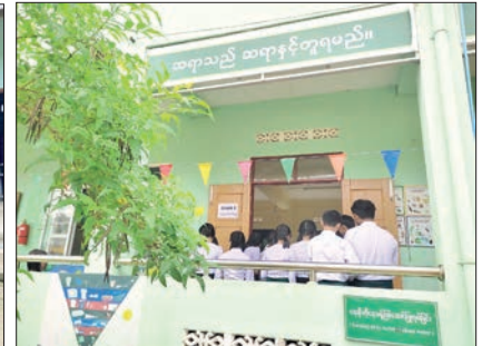
Kawthoung, Taninthayi Region.