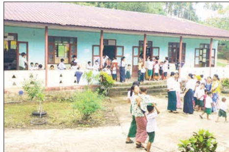
Karathuri, Taninthayi Region.