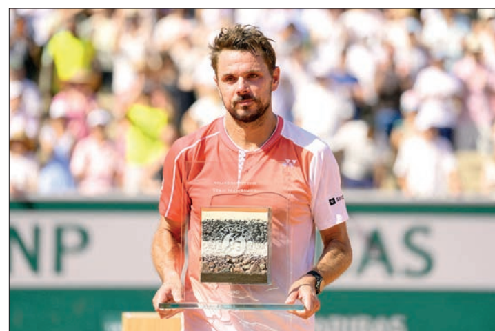
Switzerland's Stan Wawrinka poses with a trophy during a ceremony honouring his career on day 2 of the French Open tennis tournament on Court Simonne-Mathieu at the Roland-Garros Complex in Paris on 25 May 2026.

After the match, Wawrinka was presented with a glass case containing a section of a clay court and two video tributes to his career were displayed on big screens around the stadium — the latter featuring messages directed to Wawrinka from former champions Roger Federer, Rafael Nadal and Novak Djokovic, among other luminaries