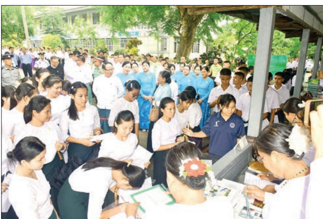
Hpa-an Township, Kayin State.