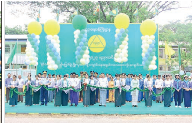
The Magway Region Chief Minister unveils the school enrolment drive.