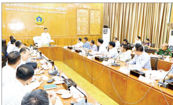
The coordination meeting of the Chin State Rehabilitation and Reconstruction Committee is underway yesterday, attended by Union Minister Dr Soe Win.

The Union Minister instructed officials to conduct