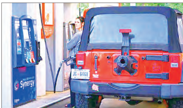
A woman fuels a vehicle at a petrol station in Arlington, Virginia, the United States, 30 April 2026.

portionately hurt low-income people in the middle states — in other words, people other than (those living on) the East and West Coasts of America." While lower-income households have sharply reduced their gas consumption by about seven per cent, they are still spending 12 per cent more on fuel due to the price hikes, according to research from the Federal Reserve Bank of New York. — Xinhua