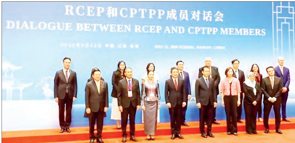
Union Minister U Aung Kyaw Hoe joins a commemorative group photo session for the dialogue between member countries of the Regional Comprehensive Economic Partnership (RCEP) and the Comprehensive and Progressive Agreement for Trans-Pacific Partnership (CPTPP).

The dialogue was held with the aims of supporting multilateralism and free trade among the member states of the agreements, maintaining a transparent, inclusive and rules-based multilateral trading system, and ensuring the stability of industrial and supply chains. The meeting was attended by Trade and Economic Ministers from RCEP and CPTPP mem-