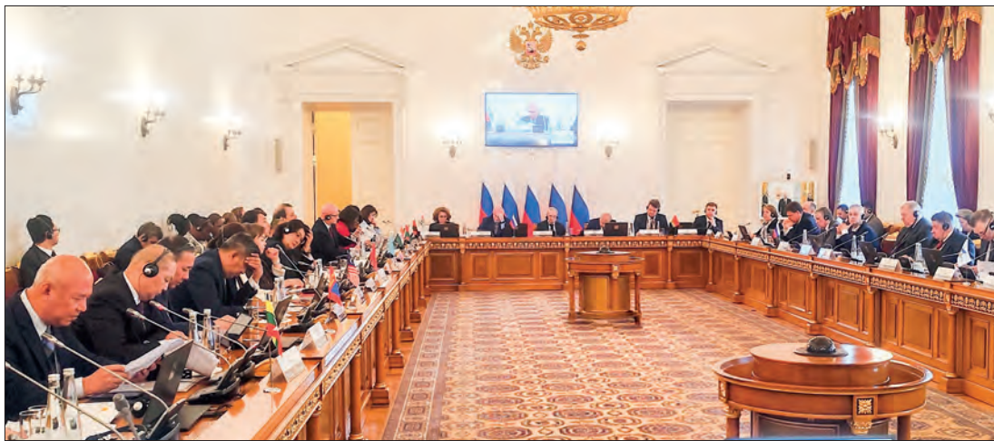
The Constitutional Review and Contemporary Global Challenges International Conference is in progress from 19 to 21 May in the Russian Federation, attended by Union Constitutional Tribunal Chairperson U Aung Zaw Thein.

At Ayemyint Thaya Bridge (Hsinthe Creek Bridge), the President gave guidance on the systematic control of the watercourse in Hsinthe Creek to have resilience to natural disasters and prevent flash floods, and maintenance of the bridges. — MNA/TTA