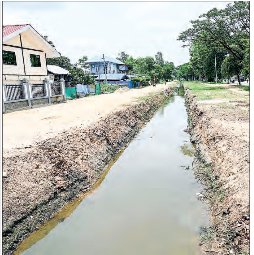
President U Min Aung Hlaing inspects ongoing upgrade of drainage facilities near Aingsauk Village and Pinlaung Junction in the Union Territory of Nay Pyi Taw yesterday.

Developing a comprehensive master plan remains essential to sustain continuous road upgrades in response to future population growth and rising vehicle traffic.