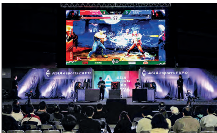
File photo shows Japan's Asian Games esports qualifying event in Tokoname, Aichi Prefecture, on 22 March 2026.

Esports made its Asian Games debut as a medal event at the 2022 Asian Games in Hangzhou, China, which were postponed until 2023 because of the COVID-19 pandemic. It was previously featured as a demonstration event at the 2018 Asian