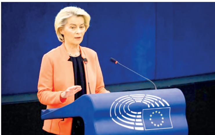
EU chief Ursula von der Leyen will sign an expanded trade deal with Mexico.

THE European Union and Mexico on Friday signed a deal reducing tariffs on each other's goods as both seek to lessen their dependence on trade with the United States. The expansion of an accord dating to 2000 comes as Mexico fights hard to preserve a three-way free trade agreement with the United States and Canada, which is crucial to all three economies. The EU is Mexico's third-largest trading partner, lagging far behind the US and China.