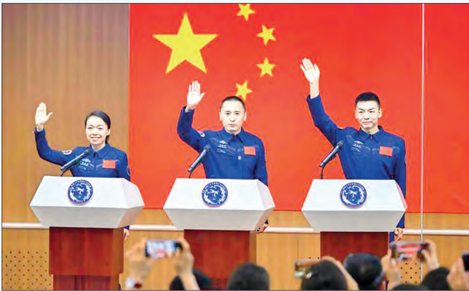
Chinese astronauts Zhu Yangzhu (C), Zhang Zhiyuan (R) and Li Jiaying, or Lai Ka-ying in Cantonese, for the upcoming Shenzhou-23 crewed spaceflight mission, meet the press at the Jiuquan Satellite Launch Center in northwest China, 23 May 2026.