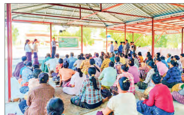
The disbursement ceremony of Mya Sein Yaung funds is in progress in Aunglan, Magway Region.

Under the field supervision of the Aunglan District Department officials, the village project committee systematically distributed the first batch of low-interest loans directly to 82 project members. The disbursement totalled K29.4 million, which included funds for 44 individuals in agricultural businesses, 34 in livestock breeding, two in trading businesses, and two in micro-enterprises. — Karan (Rural)