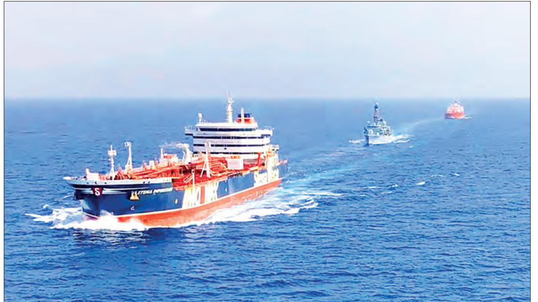
Maritime Security: Guarantees absolute freedom of navigation across critical waterways, explicitly covering the Gulf, the Strait of Hormuz, and the Gulf of Oman.

US President Donald Trump on Friday met with top US national security officials over a path forward on the war with Iran, but the meeting ended without a decision on what will happen next, a source familiar with the meeting told CNN. Trump is seriously considering launching new strikes against Iran, barring a last-minute breakthrough in negotiations, Axios reported on Friday, citing sources who have spoken directly with the president. — Xinhua