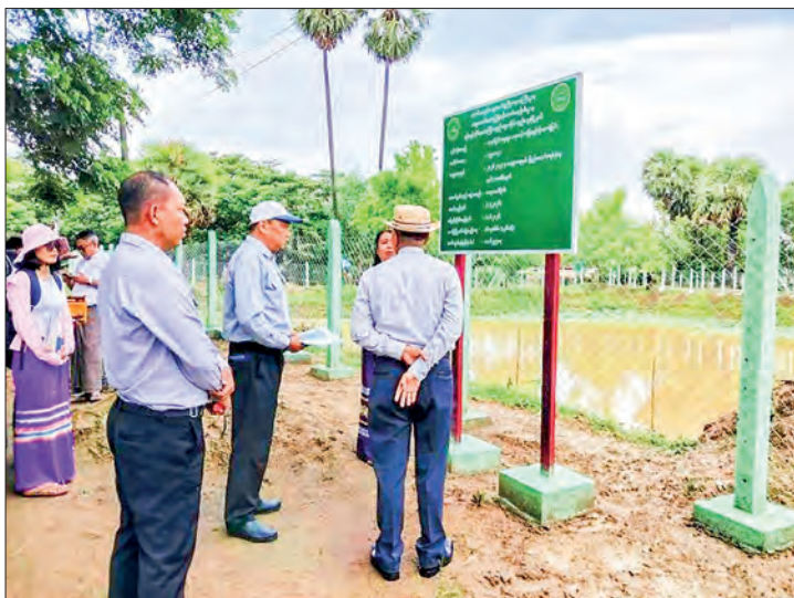
Officials oversee the rural development initiatives in Hlegu Township, Yangon Region.

OFFICIALS conducted field inspections yesterday to monitor the progress of rural development initiatives in Thanatpyin and Alangapo villages, implemented by the Hlegu Township Department of Rural Development under the Ministry of Cooperatives and Rural