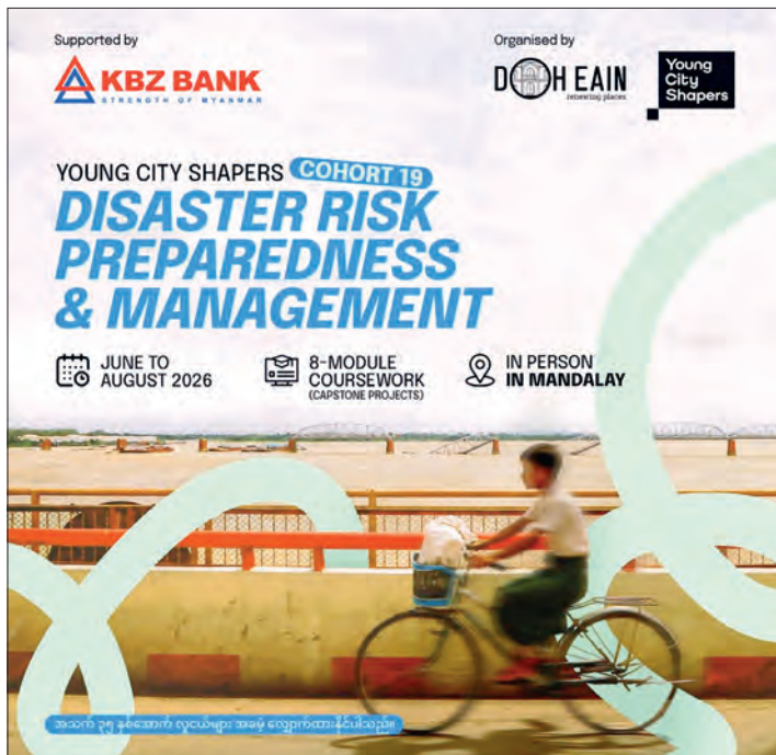
The image displays an announcement poster for “YCS Cohort 19”.

a hybrid model, a blend of in-person and online learning. Only 30 participants will be selected, and it is open to youth under the age of 35. Interested individuals can fill out the application form via the link: Young City Shapers Application by 2 June. Applicants will undergo an online