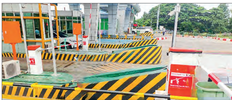
An ETC (Electronic Toll Collection) system is in action.

THE Ministry of Construction is planning to soon re-launch the previously implemented ETC (Electronic Toll Collection) system on the Yangon-Mandalay Expressway.