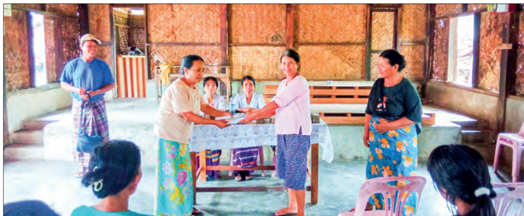
A handover ceremony of project funds is underway yesterday in Myitkyina Township, Kachin State.

Under the directive of the committee members, the 11 th batch of low-interest loans was systematically distributed directly to 86 project members in Nankway Village, who will utilize the funds for livestock breeding businesses.