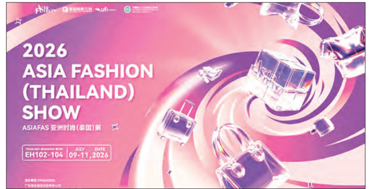
This image advertises the 2026 Asia Fashion (Thailand) Show.

AN invitation has been received for the 2026 Asia Fashion (Thailand) Show, which is scheduled to be held at the Bangkok International Trade and Exhibition Centre (BITEC) in Thailand from 9 to 11 July, according to the Myanmar Garment Manufacturers Association (MGMA).