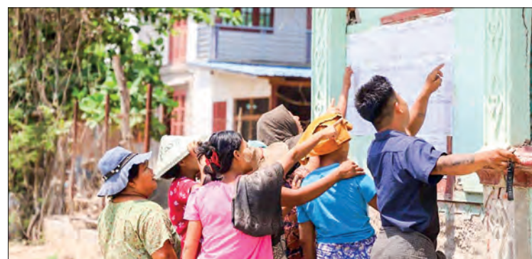
Residents viewing the list of households selected to receive assistance.

THE Myanmar Red Cross Society said it will provide livelihood assistance grants to families whose socioeconomic conditions were affected by the Mandalay earthquake.