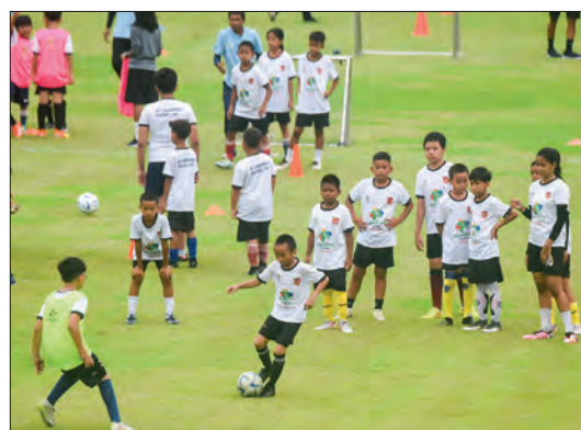
Children are pictured participating in the AFC Grassroots Football Day event.

THE Myanmar Football Federation held the AFC Grassroots Football Day ceremony at the