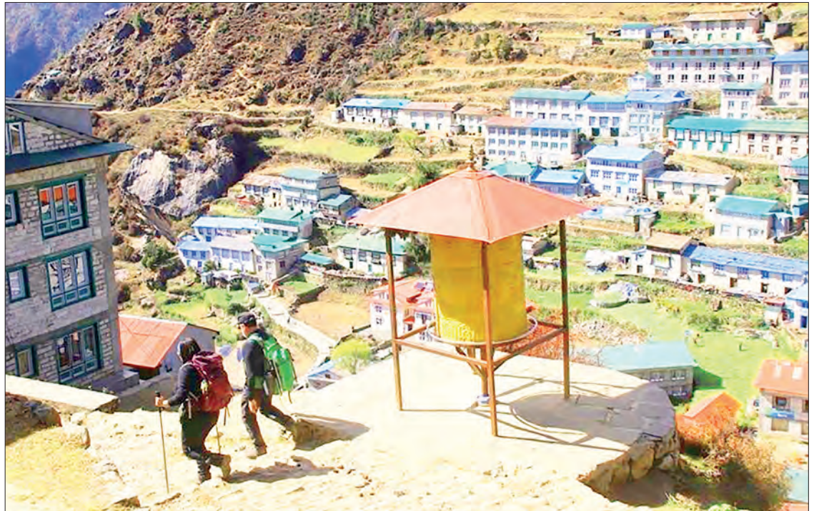
Nepal is a premier global destination renowned for its dramatic Himalayan landscapes, ancient cultural heritage, and world-class adventure tourism.

He said Nepal's post-COVID-19 economic recovery has yet to fully stabilize, while geopolitical tensions and the impacts of climate change have created additional challenges for the economy. The ongoing conflict in the Middle East, which has contributed to rising fuel and food prices, has also affected the country's economy, he said. — Xinhua