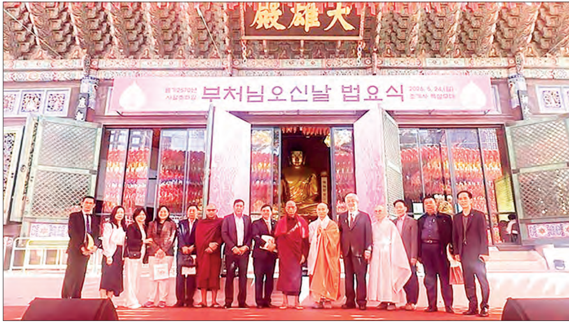
A group documentary photo of the State Sangha Maha Nayaka Committee Chair and the delegation in the Republic of Korea.