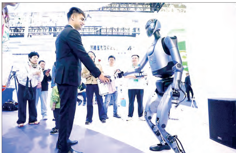
A participant shakes hands with a robot during the 10 th China-Russia Expo in Harbin, northeast China's Heilongjiang Province, 18 May 2026.

The expo has offered a glimpse into the deepening business cooperation between the two countries. Over 500 new technologies and products made their debuts at the expo, spanning areas including intelligent equipment, digital security, green building materials and advanced energy storage. — Xinhua