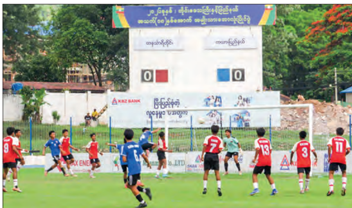
U18 football players battle for possession in a dynamic group-stage match.

In the day's fixtures, Yangon Region defeated Rakhine State 9-0 at Zwegabin Stadium, while the Nay Pyi Taw Union