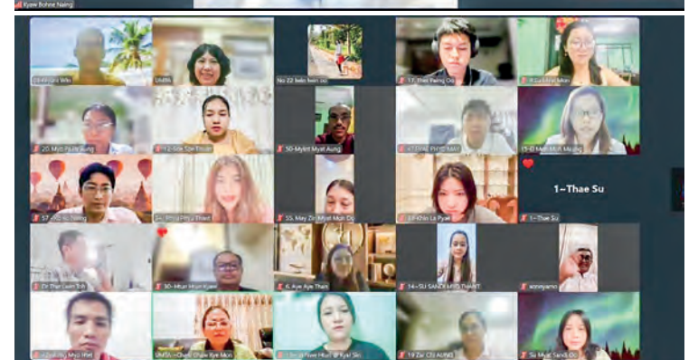
The online tourism digital marketing course.