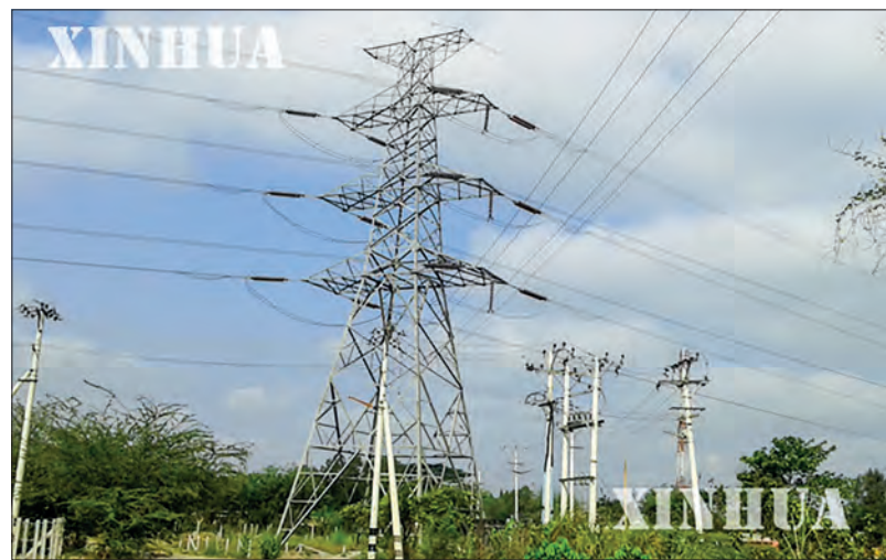
A partial view of electricity distribution operations.

According to the ministry, because electricity consumption increases significantly during hot weather, power is being managed through scheduled load reductions on a rotating regional basis. As a result, when power is restored, simultaneous usage by the public causes starting loads to surge, leading to blackouts. Additionally, temporary power outages are also caused by strong winds and