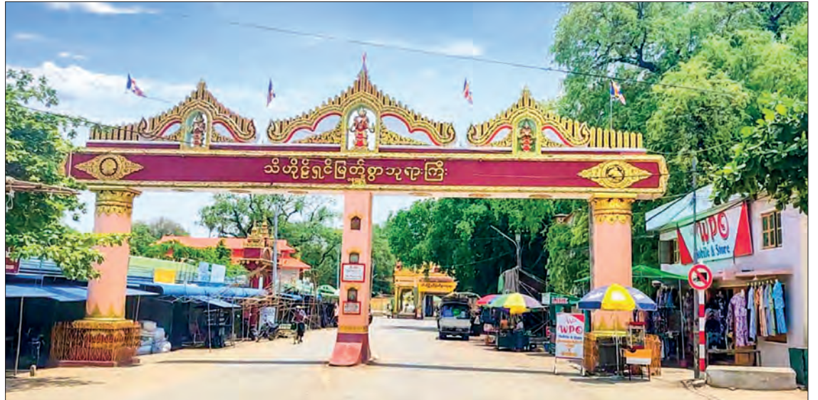
The entrance to the ancient historical pagoda and vendors starting to build their stalls.

ancient and historical Pakokku Thihoshin, which is held without absence, the festival will be held in a bustling environment with twelve shops' collective fairs, various performances and entertainment programmes. Some stalls in the fair have already opened for business since 1 May. In addition, children's play areas and amusement rides, including pirates, will be arranged to keep