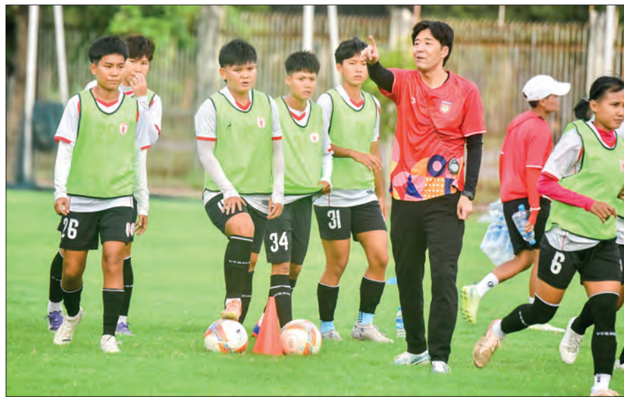
A new coach instructs Myanmar players.

is aimed at strengthening the national women's team ahead of upcoming international fixtures and supporting