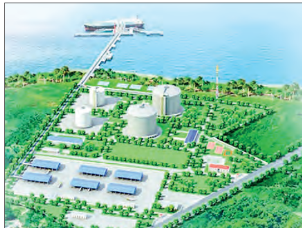
This photo reveals the map showing the LNG project, which will generate 1,390 megawatts of electricity upon its completion.

A new LNG pipeline is to be built for a 1,390-megawatt LNG project, scheduled for completion in 2029, the Ayeyawady Regional government stated.