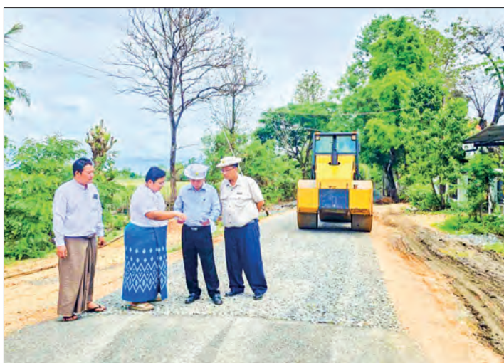
Officials inspect the progress of asphalt overlay work on the Padaung-Daungmyatna Road.

The asphalt overlay project on the Padaung-Daung-