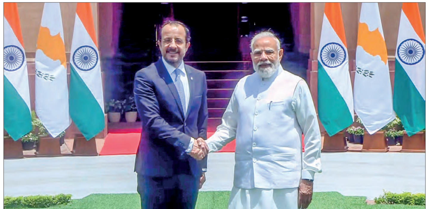
On 22 May 2026, Prime Minister Narendra Modi and Cyprus President Nikos Christodoulides officially elevated India-Cyprus relations to a Strategic Partnership during delegation-level bilateral talks at the Hyderabad House in New Delhi.

Christodoulides urged stronger India-EU cooperation to navigate rising geopolitical uncertainty during their expanding partnership.