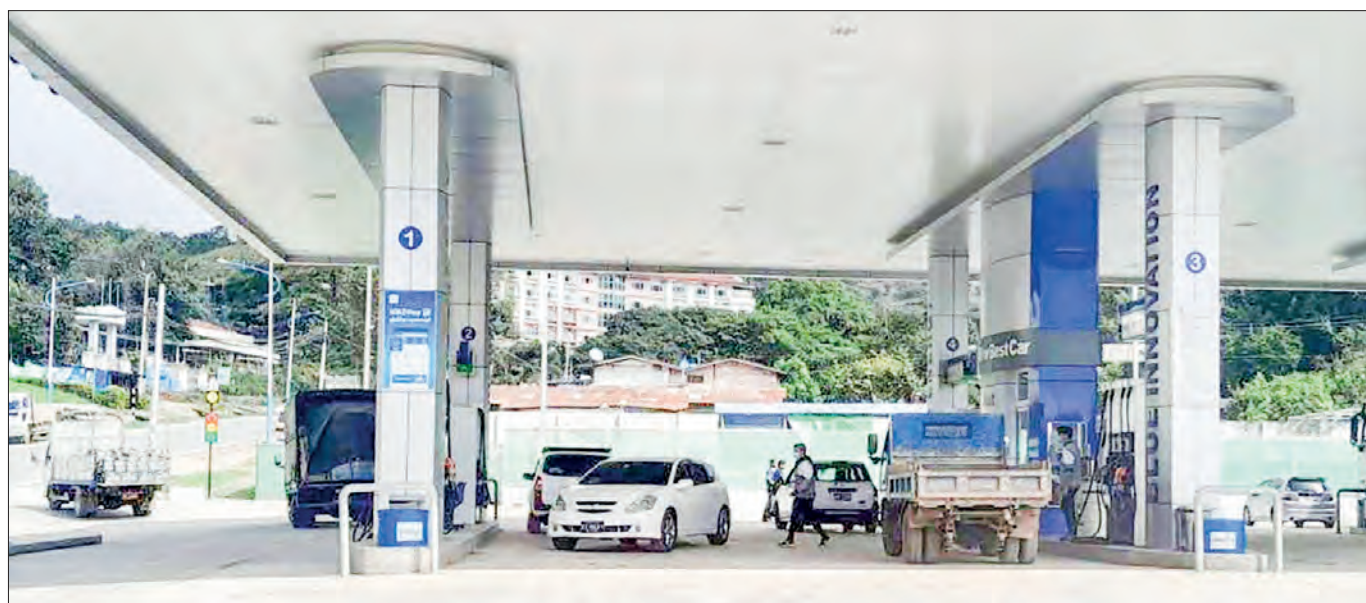
Vehicles are seen refuelling at the petrol station.

THE Central Bank of Myanmar (CBM) sold over US$2.33 million to edible oil-importing companies, US$1.5 million to LNG companies and US$16,603 to CMP companies on 21 May. Furthermore, CBM also made over $353,000 worth of non-trade transactions on the same day.