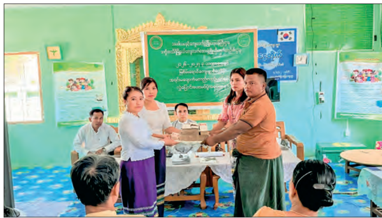
The disbursement ceremony of Mya Sein Young project funds is underway in Nay Pyi Taw.

THE Dekkhinathiri Township Rural Development Department, under the Ministry of Cooperatives and Rural Development, organized a ceremony to disburse the Mya Sein Young revolving project funds at Gwaytaukyoe Village in Dekkhinathiri Township, Nay Pyi Taw, yesterday.