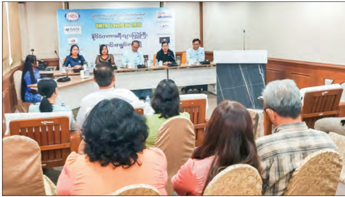
The press conference is underway yesterday to announce the holding of the 2026 International Travel Expo in June.

Hotels, domestic and international airlines, travel