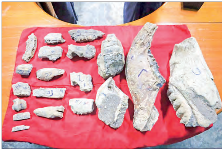
This image features the fossilized lower jawbone and molars of a primitive Stegolophodon, an elephant ancestor estimated to be eight million years old, displayed alongside other prehistoric remains.

Antiquities and fossils are part of the nation's cultural heritage; therefore, transport-