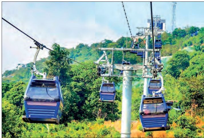
This photo captures cable cars operating at the Kyaiktiyo Pagoda.

THE operating company has announced that cable car services at the sacred Kyaiktiyo Pagoda in Kyaikto Township, Mon State, will be temporarily suspended during the rainy