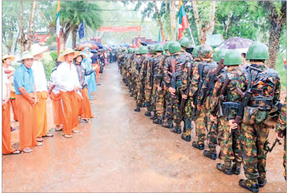
Loikaw residents warmly welcome back frontline Tatmadaw members.

The commander and party welcomed back the returning Tatmadaw members with sprigs of Eugenia. The event also featured traditional dance and music performances. — MNA/MKKS