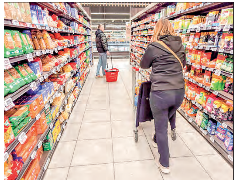
Eurozone inflation is projected at 3.0 per cent in 2026 and 2.3 per cent in 2027.

For 2026, employment growth is forecast to slow to 0.3 per cent, then rise to 0.4 per cent in 2027, while the long-term decline in the unemployment rate is set to end, stabilizing at around six per cent in 2027. — Xinhua