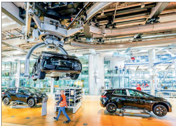
German businesses were more optimistic in May despite the Iran war energy shock.