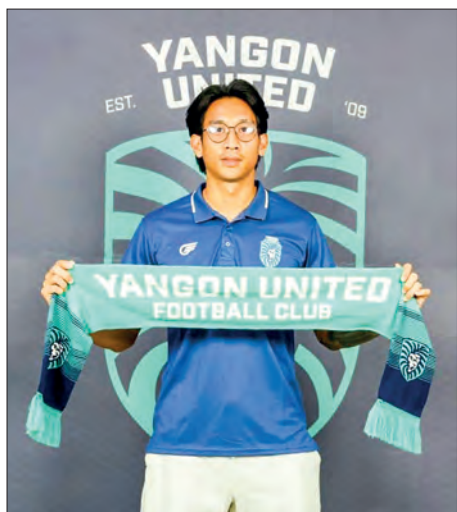
A new Yangon United signing poses with a club scarf following his official contract presentation.