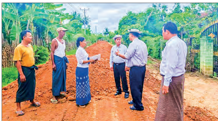
Officials oversee the progress of the inter-village road construction project.

DEPARTMENTAL officials conducted a field inspection yesterday to monitor the progress of the Aungsigon-Gway-