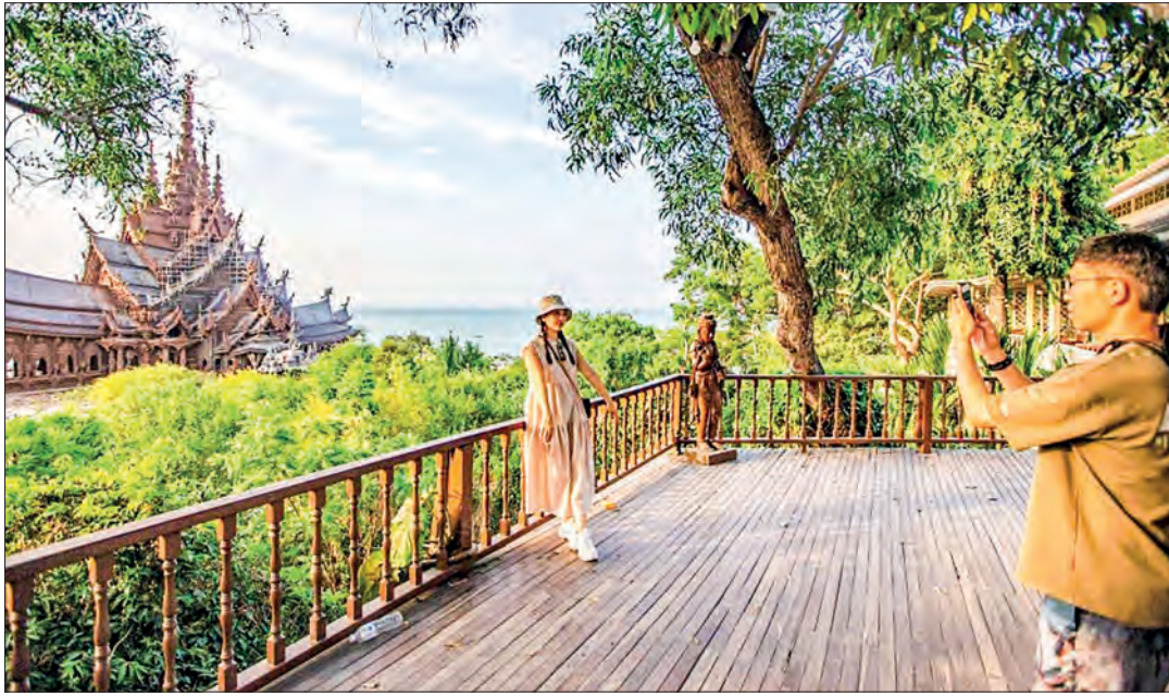
Tourists take photos at the Sanctuary of Truth Museum in Pattaya, Thailand.