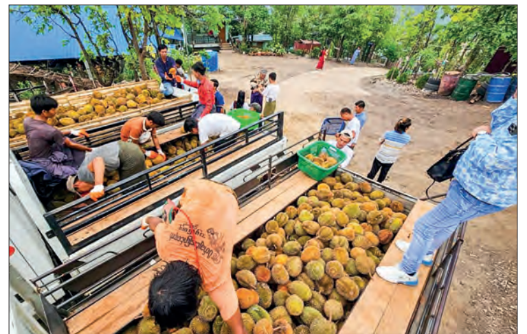
Durians are on donations at the second Taungpula's durian free feast.

with overnight accommodation arranged for pilgrims arriving on 23 May. Any products are allowed to be sold at the third durian donation. Taungpula Hill is a well-known tourist attraction in PyinOoLwin, and it receives pilgrims from all regions and states. The number of visitors arriving is usually larger on weekends and significant religious days. Satuditha (food charity) meals are served from morning to evening for pilgrims at the Taungpula, which gives a beautiful scenery of natural landscapes and the sea of clouds. — MT/ZS