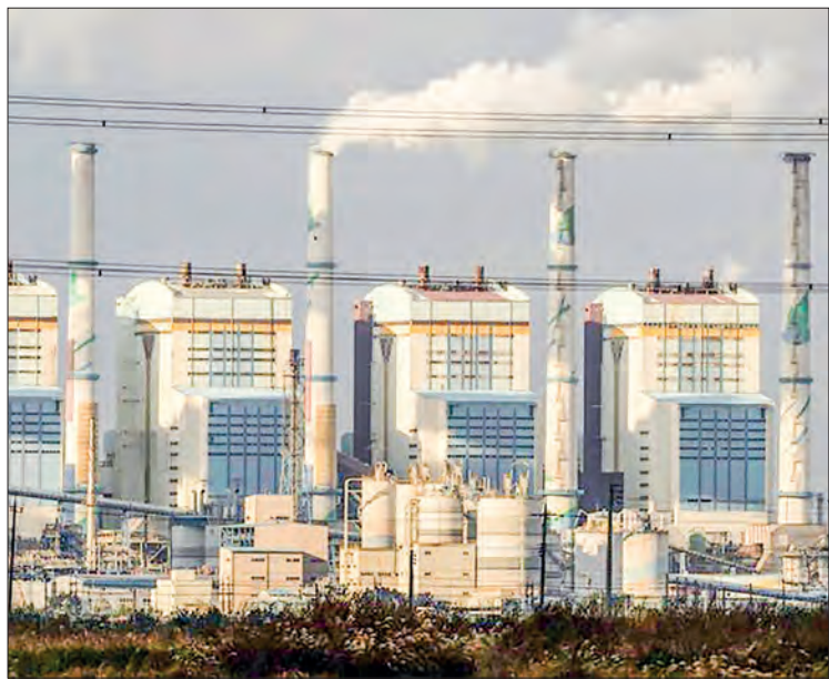
A general view shows exhaust gases billowing from the chimneys of the Tae'an Thermal Power Station, a large coal-fired power station owned by Korean Western Power Co, part of Korea Electric Power Corporation, in Tae'an County, South Chungcheong Province.

THE world built and commissioned more coal power in 2025, but used the polluting fuel less, with the United States the only major economy to substantially increase generation, analysis showed Thursday.