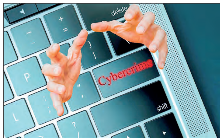
France and the Netherlands have dismantled a VPN used by cybercriminals to conceal their identities during ransomware attacks and data theft.

tigators, after France opened an investigation in 2021 over its users targeting French victims. — AFP