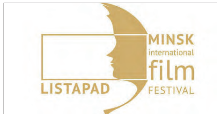
This image showcases a promotional poster for the 32 nd Minsk International Film Festival "Listapad".

MYANMAR films will be screened at the 32 nd Minsk International Film Festival "Listapad", to be held in Belarus, according to the Myanmar Motion Pictures Organization (MMPO).