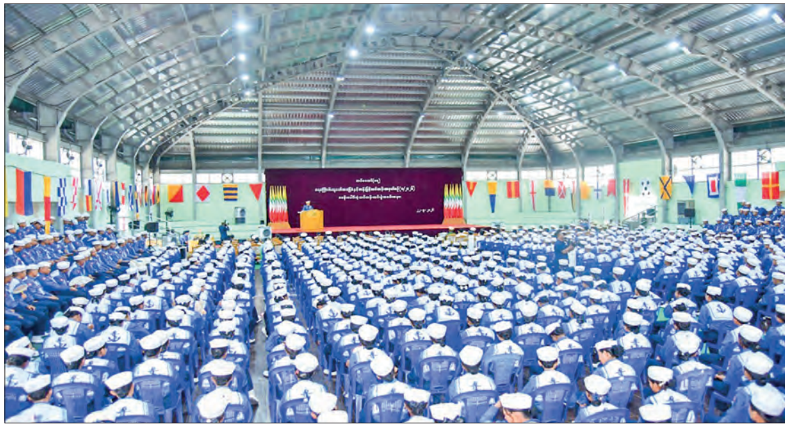
The closing ceremony for the Basic and Advanced Youth Maritime and Aviation Courses (Batch 1/2026) takes place in Nay Pyi Taw.

The basic aviation youth course 10 was conducted at 18