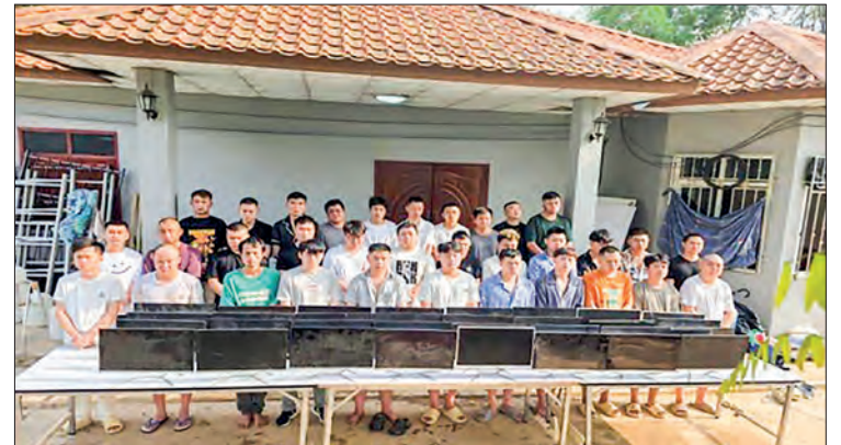
Detained Chinese nationals linked to online scams and gambling are displayed alongside confiscated operational materials in Tachilek, eastern Shan State.

MYANMAR authorities detained 33 Chinese nationals involved in online scam and gambling operations, and seized 32 all-in-one computers, 20 tables and 35 chairs in Pansali village, Loisetone village-tract, located about 7,800 metres northwest of Tachilek in Shan State (East) yesterday.