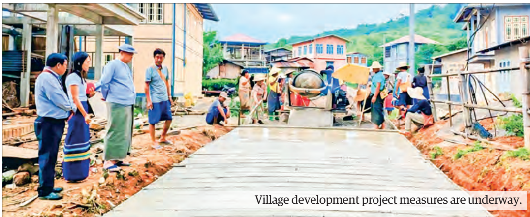
Village development project measures are underway.

OFFICIALS from the Pinlaung Township Rural Development Department under the Ministry of Cooperatives and Rural Development conducted a field inspection yesterday of Village Development Project (VDP) activities being implemented in Nampa and Pauke villages in Pinlaung Township, the Pa-O Self-Administered Zone, Shan State (South).