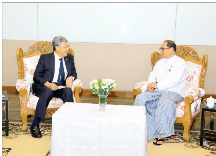
Union Foreign Affairs Minister U Tin Maung Swe meets Malaysian Foreign Minister Dato' Seri Utama Haji Mohamad Bin Haji Hasan in Nay Pyi Tw yesterday.

U Tin Maung Swe, Union Minister for Foreign Affairs of the Republic of the Union of Myanmar, met Dato' Seri Utama Haji Mohamad Bin Haji Hasan, Minister of