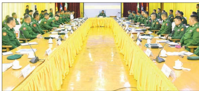
Defence Services Commander-in-Chief General Ye Win Oo is pictured during the meeting at the Eastern Command Headquarters yesterday.

earn the trust and reliance of the people, and since the Tatmadaw is the country's last line of defence, it must be built into a firm institution.