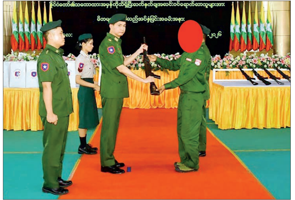
The handover ceremony for PDF members returning to legal framework is underway in the Central Command Headquarters yesterday.

There are still individuals who wish to re-enter the legal framework. Those who intend to do so are urged to promptly contact and report to the nearest district