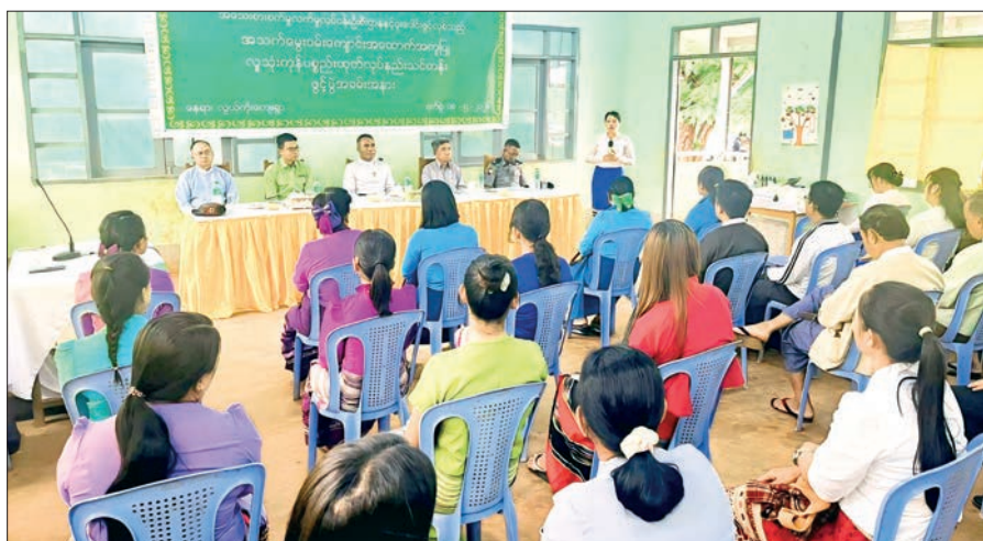
The opening event for the vocational training on consumer goods production is in progress on 18 May.

The five-day free training course, running from 18 to 22 May, is being attended by 20 female trainees from Loikoe Village. Skilled instructors are providing systematic training on consumer goods production technologies to help participants establish their own businesses. Furthermore, outstanding trainees who genuinely intend to start enterprises will be eligible to access loans from the department's Mya Sein Yaung project funds.— Cho Than Nyunt (Rural)