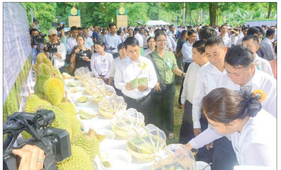
The Myanmar Durian Festival 2026 is underway on 19 May at Myaypadethakyun.

THE Myanmar Durian Festival 2026 ceremony was held at Myaypadethakyun in Yangon Region's Bahan Township on 19 May.