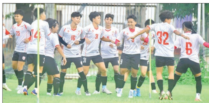
Players of the Myanmar women's national football team.

Organized by the Myanmar Football Federation for the preparation of the Myanmar women's national team, the tournament will follow a round-robin format, with the team earning the most points crowned champion. According to the fixture schedule, Myanmar will face Uzbekistan on 3 June, Uzbekistan will play Thailand on 6 June, and Myanmar will take on Thailand on 9 June. All matches will kick