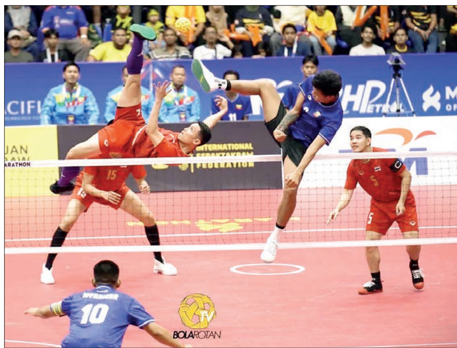
Players are seen actively contesting the semifinal and final matches in the 2026 ISTAF Sepak Takraw World Cup yesterday.