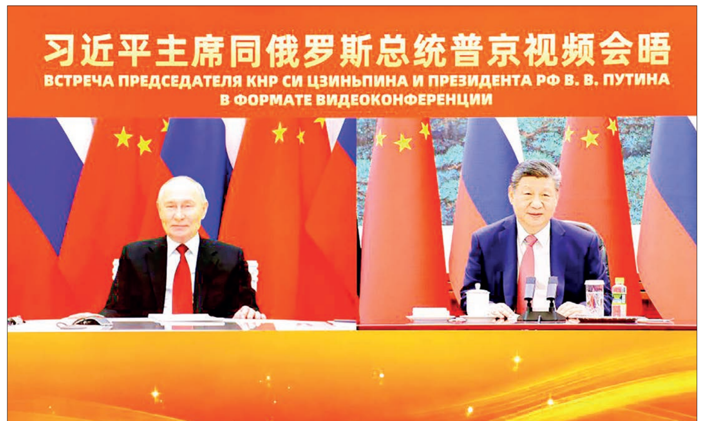
Chinese President Xi Jinping holds a virtual meeting with Russian President Vladimir Putin at the Great Hall of the People in Beijing, capital of China, 4 February 2026.