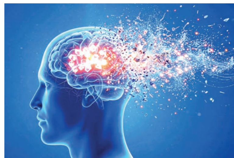
If brain cell energy failure contributes to memory loss, then restoring mitochondrial function may one day become a strategy for slowing or reducing symptoms.

In a study published in Nature Neuroscience , researchers