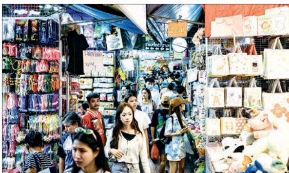
Visitors walk through an alley at Sampheng Market in Bangkok on 28 February 2026.

The Southeast Asian nation's economy is projected to expand between 1.5 per cent and 2.5 per cent in 2026, unchanged from the previous estimation, Danucha told a news conference. — Xinhua