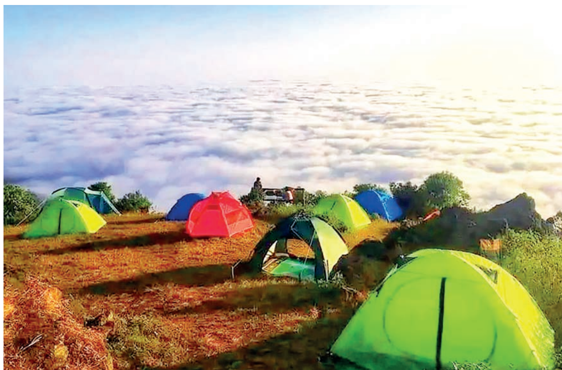
This image showcases one of Myanmar's most enchanting tourist destinations.

AN International Travel Expo will be grandly held during the second week of June to help attract more foreign tourists from overseas during Myanmar's upcoming open-season travel period and to support the revival of the country's tourism industry, according to the Myanmar Tourism Entrepreneurs Association.