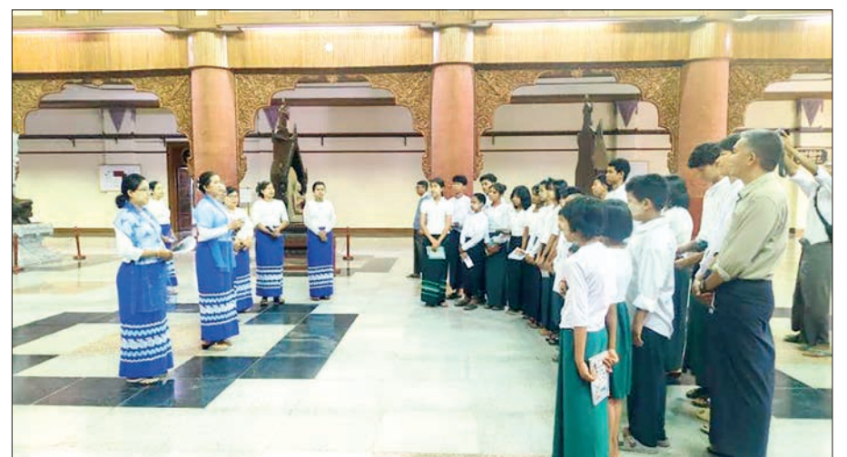
This photo displays one of the activities to commemorate International Museum Day at the Bagan Archaeological Museum.

Quiz competitions on the history of the exhibits displayed at the Bagan Archaeological Museum were also held, and souvenir prizes were presented to the winning students by the deputy director. — ASH/MKKS