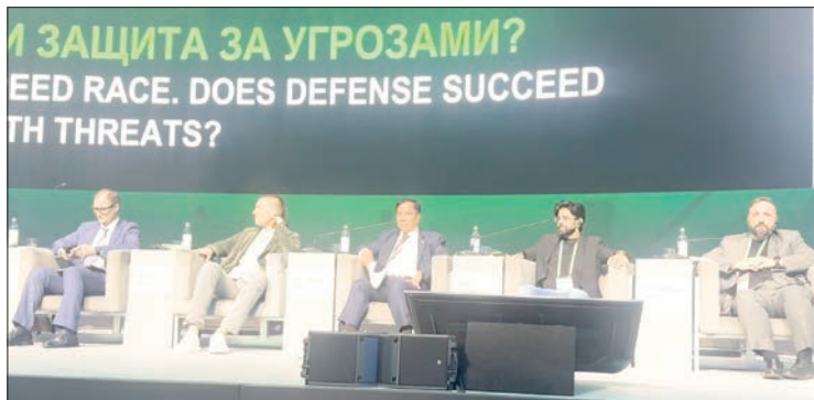
The 11 th Digitalization of Industrial Russia (2026) Forum is underway on 18-22 May in the Russian Federation, attended by Union Minister Dr Myo Thein Kyaw.

At the ceremony, Prime Minister of the Russian Federation Mr Mikhail Mishustin delivered the opening remarks, while officials and experts from major Russian industries discussed the application of digital technologies in their respective industrial sectors and presented