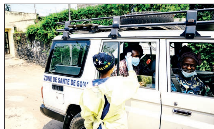
A visitor has their temperature checked by a health worker using a thermoflash before entering Kyeshero Hospital at a checkpoint for temperature screening for all visitors and patients entering Kyeshero Hospital, as part of Ebola prevention measures in Goma on 18 May 2026.

WHO Director-General Tedros Adhanom Ghebreyesus on Tuesday expressed deep concern over the “scale and speed” of the Ebola outbreak in the Democratic Republic