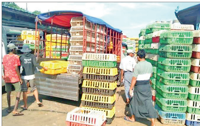
This image shows baskets of poultry arriving at the poultry market in Mingala Taungnyunt Township.

APPROXIMATELY 80,000 visses of chicken are entering the poultry market in Mingala Taungnyunt Township daily, according to the mar-