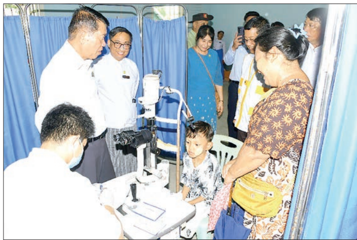
A child is seen receiving treatment.