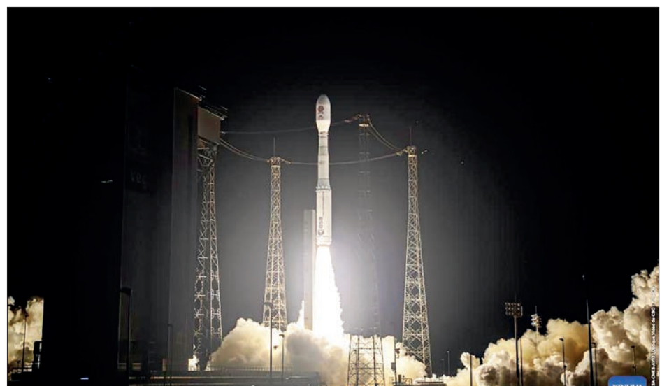
A Vega-C rocket carrying the Solar wind Magnetosphere Ionosphere Link Explorer (SMILE) blasts off at the Kourou launch centre in French Guiana, 19 May 2026.