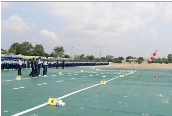
Youth trainees are seen in the RC aircraft and helicopter flying competitions.

TRAINEES of the Basic Aviation Youth Training Course 10 and Advanced Aviation Youth Training Course 9 continued