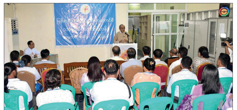
An opening ceremony of the Media Training Course 7/2026 is in progress at the Myanmar Press Council office.

The committee said that similar media training courses would continue to be conducted, with lectures delivered by council members and external experts. — ASH/KZL