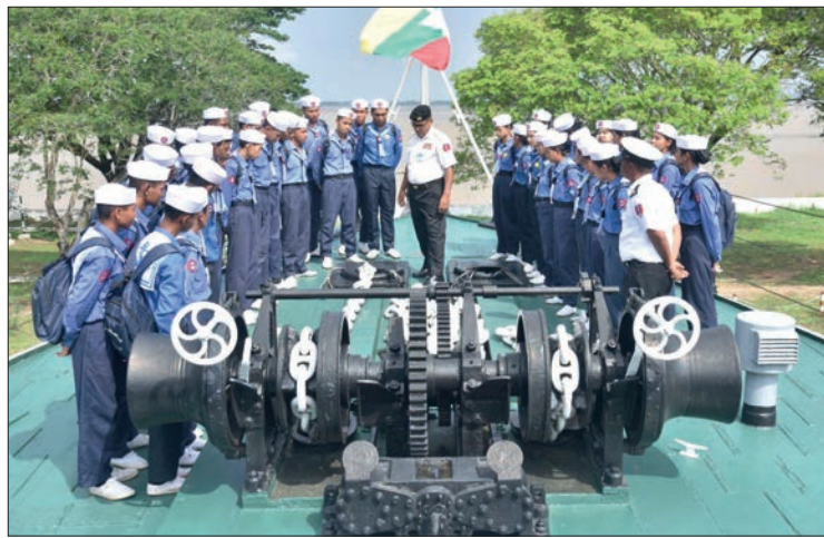
Youth trainees are seen during their observation tours.

At noon, they visited the Nuclear Technology Information Centre in Hline Township.