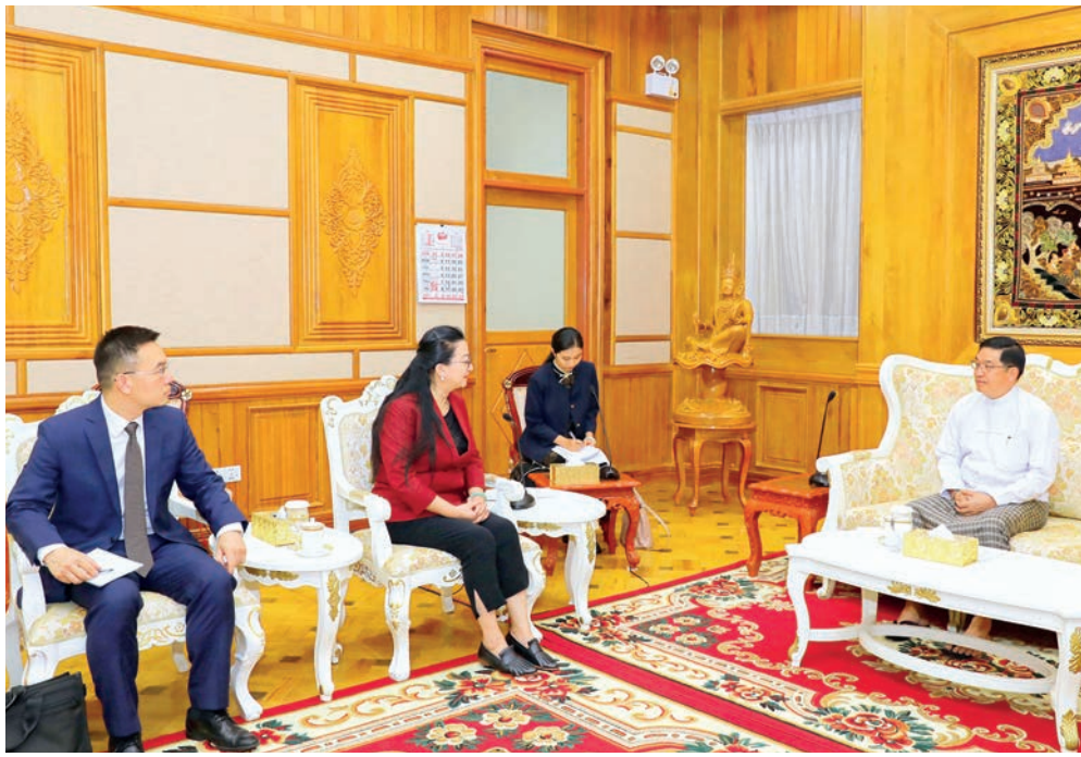
Chinese Ambassador Ms Ma Jia pays a courtesy call on Vice-President U Nyo Saw at the Presidential Palace Reception Hall in Nay Pyi Taw yesterday.

Moreover, they frankly exchanged views on the peace and stability in border regions, the implementation of the China-Myanmar Economic Corridor plan, and the efforts to combat online fraud and eradicate