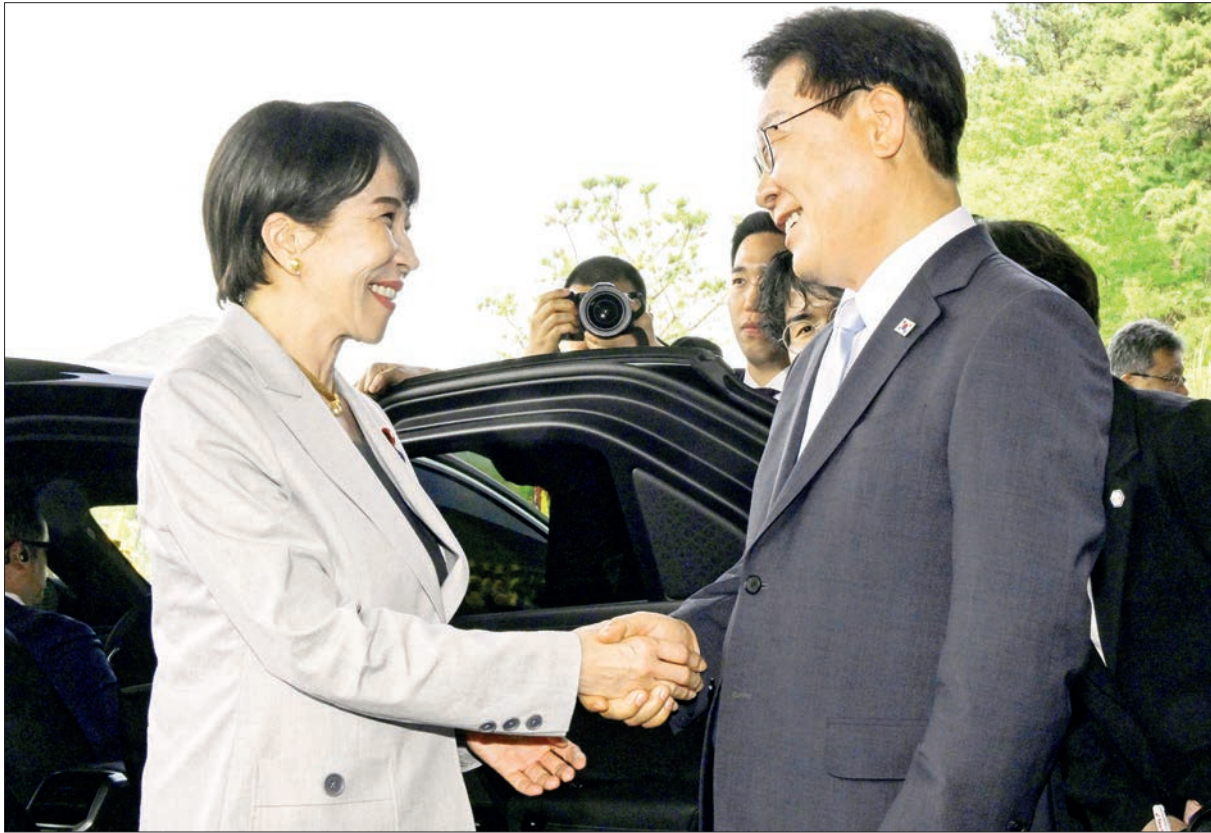
South Korean President Lee Jae Myung (R) welcomes Japanese Prime Minister Sanae Takaichi ahead of their summit meeting in Andong, South Korea, on 19 May 2026.