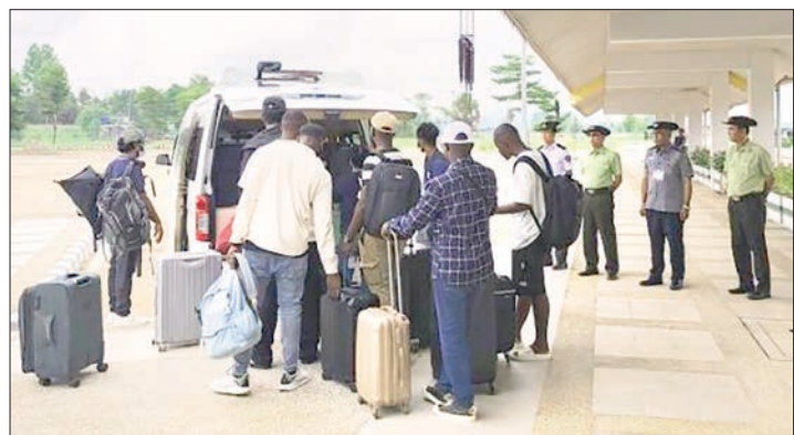
Officials oversee the deportation of undocumented foreign immigrants.

AUTHORITIES transferred 21 foreign nationals linked to online scams, online gambling and other criminal activities in the Myawady-Shwe Kokko area through the Myanmar-Thai Friendship Bridge No 2 to their respective countries in line with legal procedures and humanitarian con-