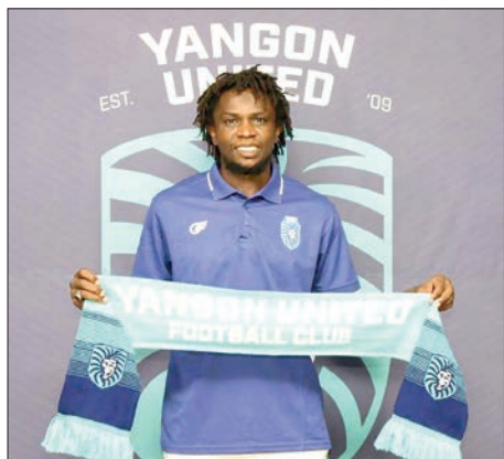
Cameronian Striker Mustapha.

YANGON United FC have completed their first foreign signing for the upcoming season after recruiting Cameroonian striker Mustapha.