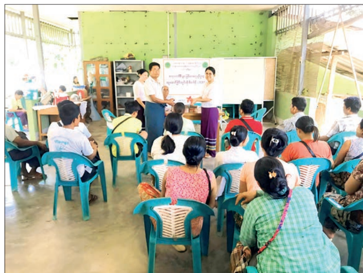
The ceremony for the second round disbursement of funds is in progress yesterday in Tatkon.