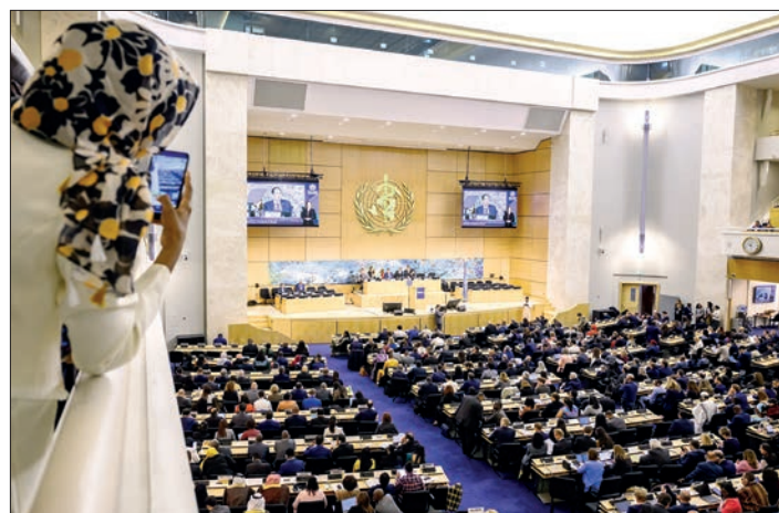
This general view shows delegates at the opening of the 79th World Health Assembly in Geneva on 18 May 2026.

The meeting, which runs through Saturday, comes after a difficult year for an organization weakened by the announced US withdrawal and deep funding cuts.