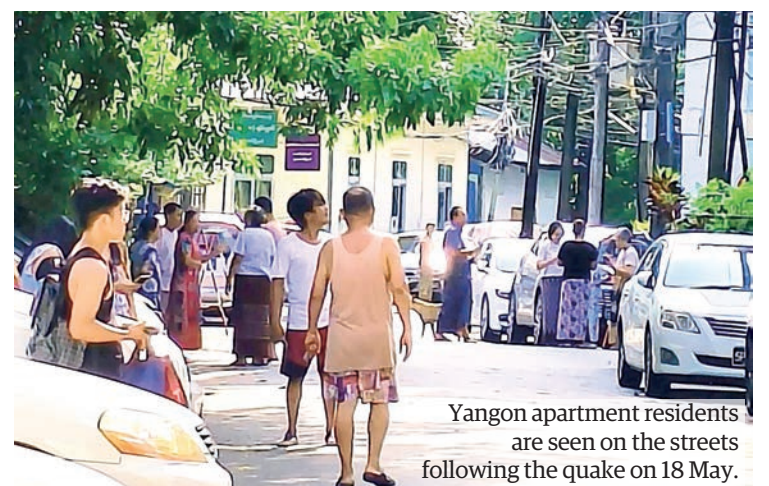
Yangon apartment residents are seen on the streets following the quake on 18 May.

Additionally, the DMH has announced that at 12:31 pm on the same day, a minor earthquake of magnitude 3.5 was recorded, centring approximately 57 miles southeast of the Haka station. — Htun Htun/ZN