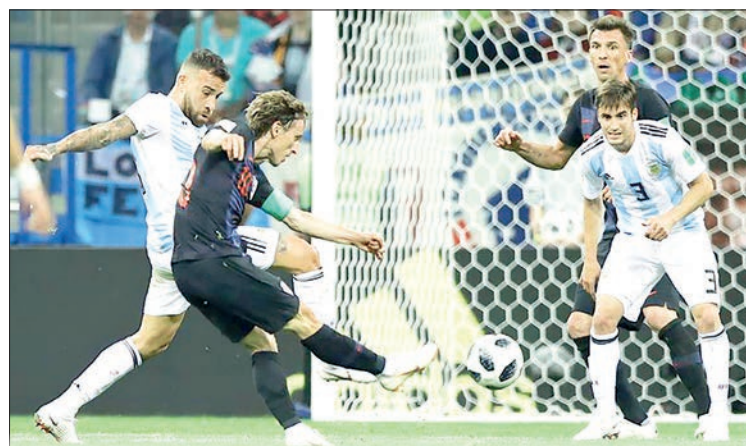
Luka Modric (2 nd L) of Croatia shoots to score during the 2018 FIFA World Cup Group D match between Argentina and Croatia in Nizhny Novgorod, Russia, 21 June 2018.

The former Ballon d'Or winner was expected to be out of action for between six to eight weeks but should be free to play in the upcoming World Cup, a source told AFP at the time. — AFP