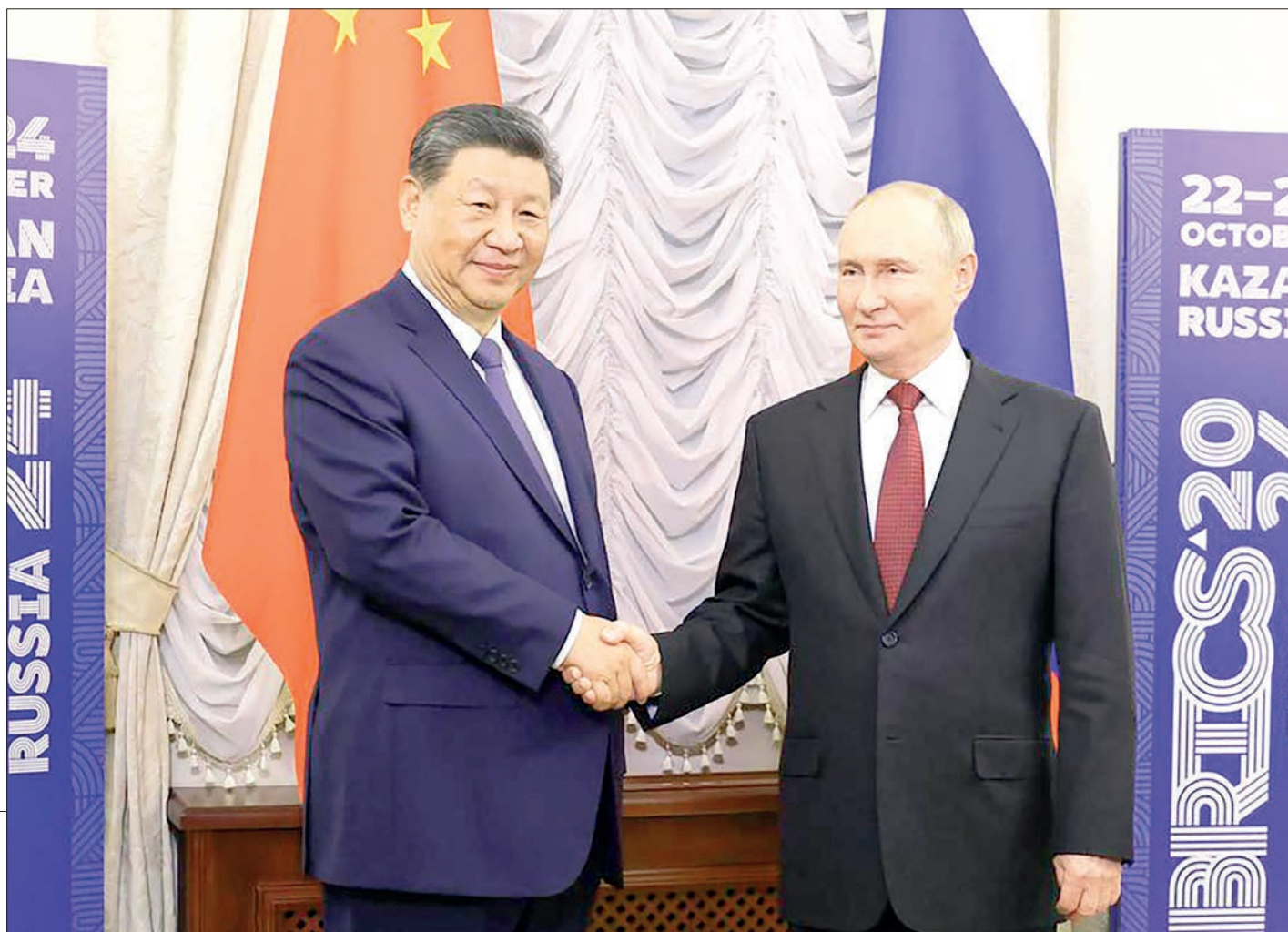
Chinese President Xi Jinping meets with Russian President Vladimir Putin in Kazan, Russia, 22 October 2024.