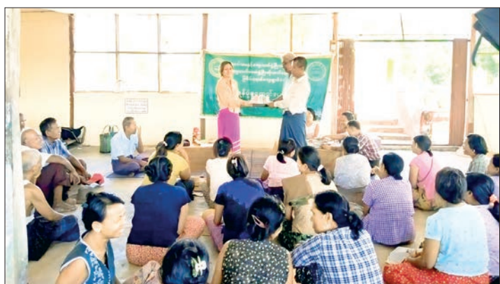
A ceremony to disburse funds is underway yesterday.

THE Shwedaung Township Rural Development Department, under the Ministry of Cooperatives and Rural Development, disbursed Mya Sein Yaung project revolving funds totalling K44.3 million to residents at Inpingon Village in Shwedaung Township, Bago Region, yesterday morning.