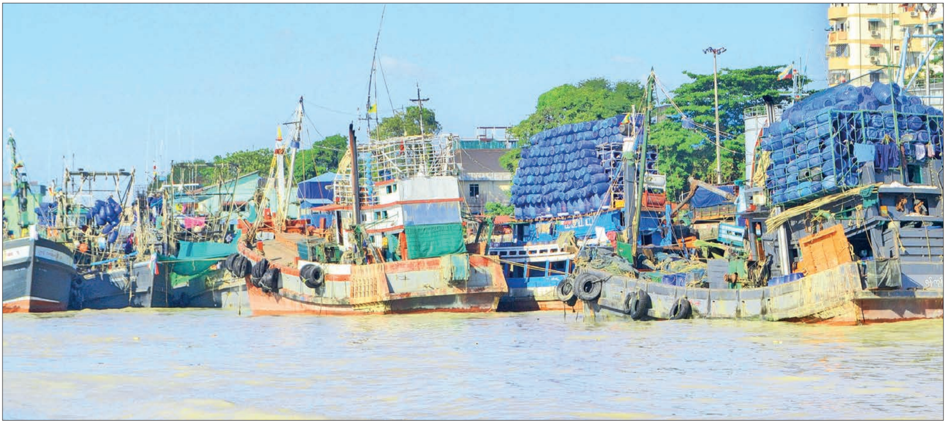
This image shows fishing vessels docked at Yangon Fishing Port, preparing supplies for domestic consumption and export.

T HE cold storage factories in Yangon Region continues distributing saltwater products for local consumption and exports during the no-fishing season, according to MMA Marine Products Company of the Central Sanpya Fish Market.