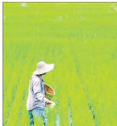
A farmer is seen applying fertilizer to the field.

The prices may vary a bit depending on transport charges in other regions and states, as the aforementioned