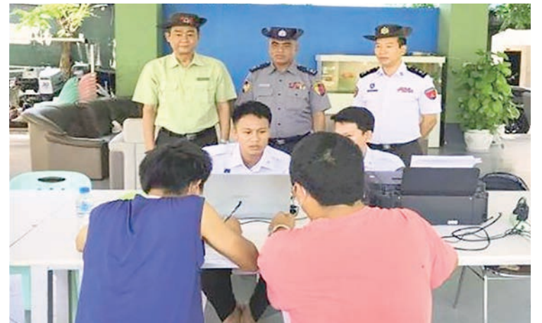
Immigration procedures are underway for the deportation of undocumented foreign immigrants.

The Government is actively cooperating with neighbouring and regional countries as well as international organizations to identify, arrest and take effective legal action against those involved in online scam centre operations, including foreign masterminds behind such activities. In addition, effective coordination is being carried out to