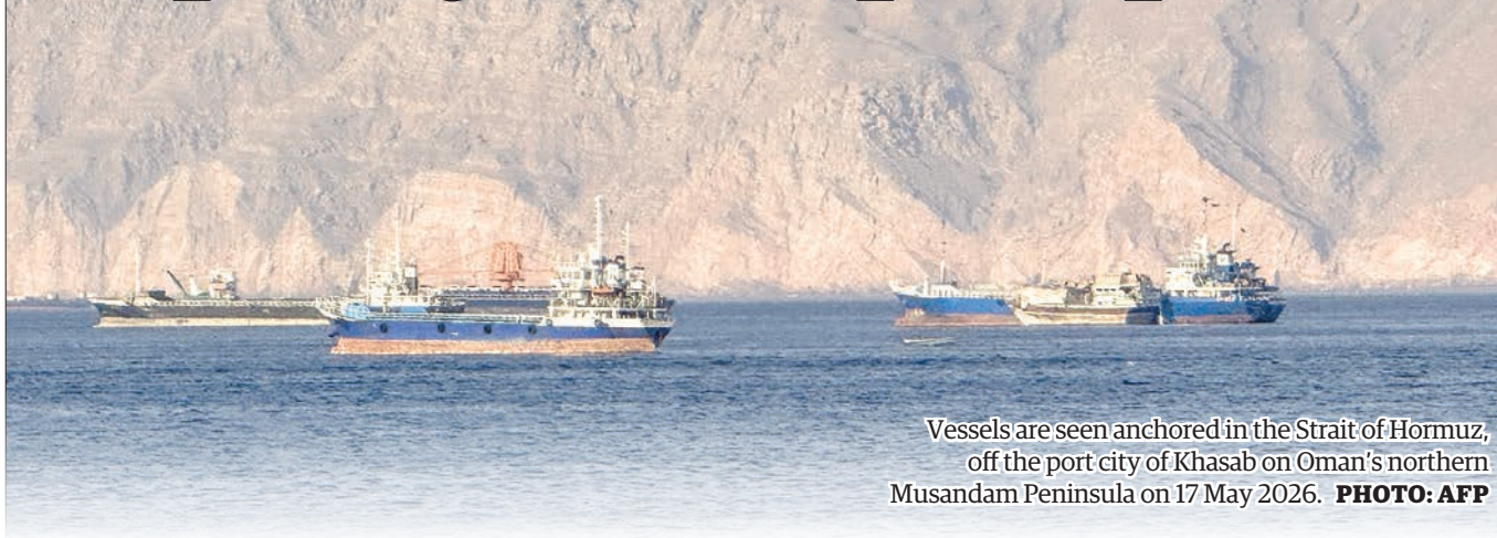
Vessels are seen anchored in the Strait of Hormuz, off the port city of Khasab on Oman's northern Musandam Peninsula on 17 May 2026.