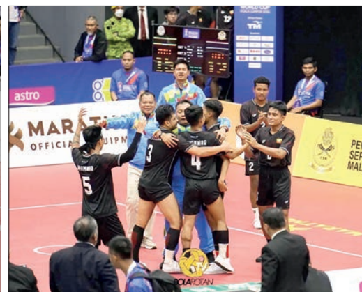
Images show players, including the Myanmar team, in intense action during the quarterfinal matches of the 2026 ISTAF Sepak Takraw World Cup.