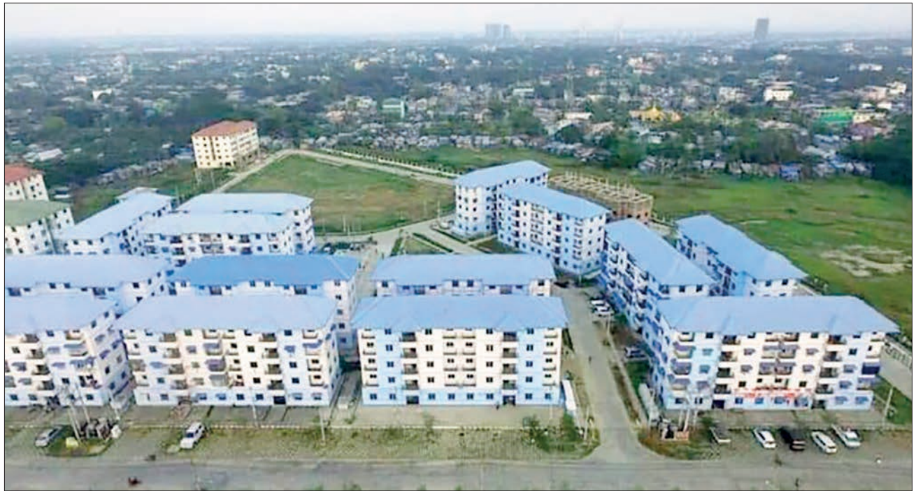
This photo shows an aerial drone view of the DUHD housing units.

THE Department of Urban and Housing Department (DUHD) under the Ministry of Construction invited interested domestic entrepreneurs to carry out infrastructure development at public rental housing in Yangon Region, under the fund of regional