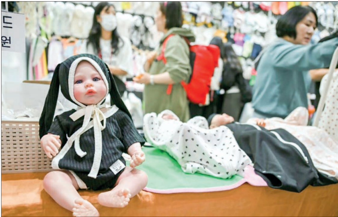
Baby clothes are displayed at a booth during a baby fair in Seoul.