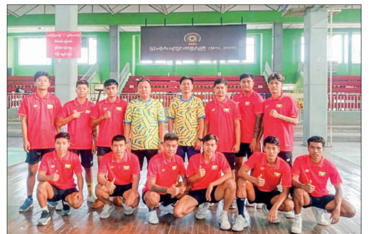
The Myanmar Sepak Takraw team.