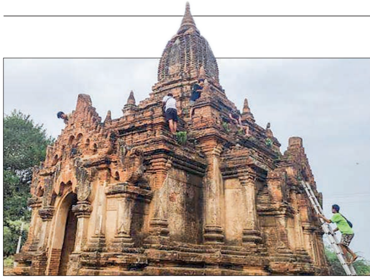
This photo features a cleaning work of the ancient temple buildings in the Bagan World Heritage Zone.