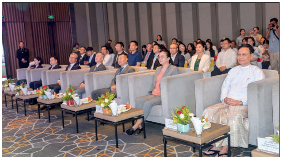
The 4 th anniversary ceremony of the Bank of China Scholarship Programme is underway at the Wyndham Grand Hotel in Yangon yesterday.

nese ambassador, the deputy minister, and the CBM deputy governor, while the vice-president of Bank of China (Hong Kong SAR) extended words of appreciation. A memorandum of understanding on Chinese language training was also signed by the chairperson of the ELBC Language Centre and the director of the China Foundation for Rural Development (CFRD) Myanmar Office. — MNA/MKKS