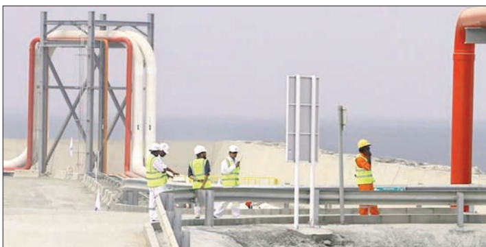
The oil terminal at the Fujairah port, where pipelines, including the Abu Dhabi Crude Oil Pipeline, terminate.

The West-East Pipeline will double state oil giant ADNOC's capacity through Fujairah port and is expected to become operational next year, the Abu Dhabi Media Office said. Abu Dhabi Crown Prince Sheikh Khalid bin Mohamed bin Zayed Al Nahyan "directed ADNOC to accelerate delivery of the project", the report said. — AFP