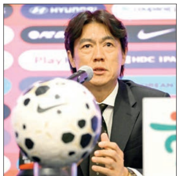
South Korea head coach Hong Myung-bo announcing his World Cup squad.

SOUTH Korea's coach backed Son Heung-min to get back to goalscoring ways at his fourth World Cup after on Saturday naming the striker in his squad for the tournament.