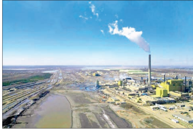
The Syncrude refinery in the oil sands region of Alberta in western Canada.

Carney and Smith cleared a key hurdle toward a new pipeline on Friday by signing a deal on industrial carbon pricing, a system that extracts a fee from large scale CO2 emitters. Oil companies have been critical of the system, but Smith said Friday that the prohibitive rates set under Trudeau's government had been "rolled back". — AFP