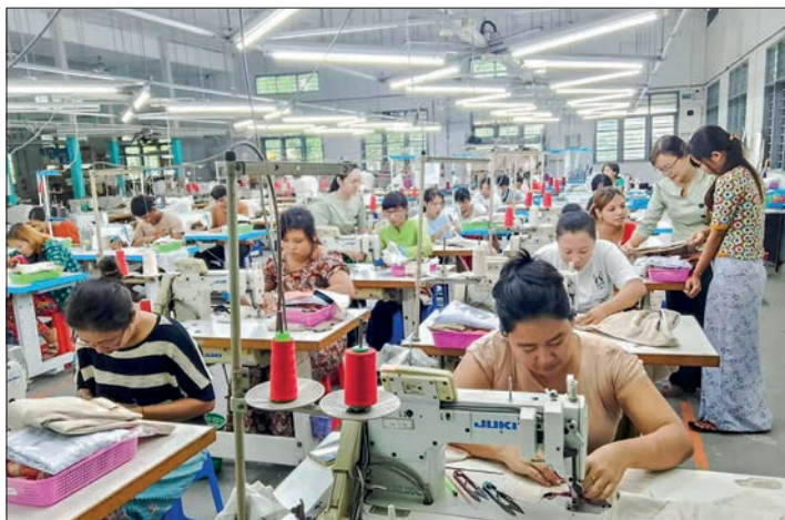
Workers are seen operating sewing machines at a garment workplace.

CBM also sold $2.17 million to edible oil-importing companies and over $150 to CMP companies on 11 May. Additionally, CBM sold $1.3 million to edible oil-importing