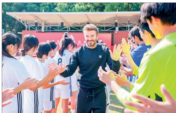
David Beckham interacts with football-loving youth during a Football Campus Day activity in Shanghai.

Beckham and his wife Victoria's collective wealth reached an estimated £1.185 billion ($1.583 billion) this year.