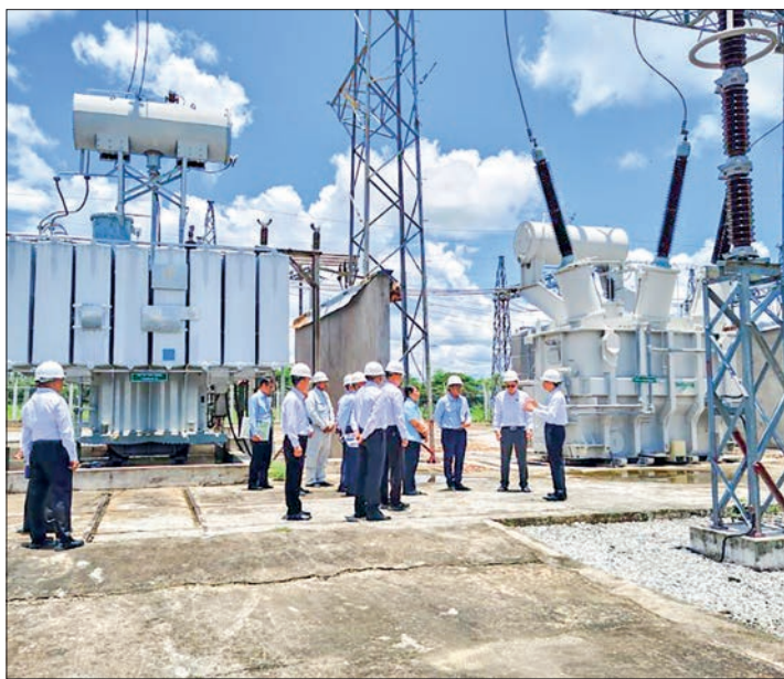
Union Minister U Ko Ko Lwin inspects the electricity and energy sector operations in Nay Pyi Taw yesterday.

During the inspection of the 230 KV Nay Pyi Taw main power station, he stated that potential difficulties in power distribution during the rainy season should be anticipated in advance and that clearing and maintenance work along power transmission lines