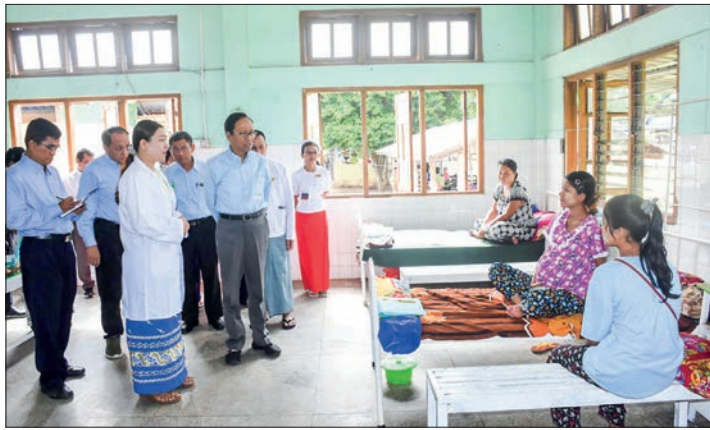
Union Minister Dr Thet Khaing Win comforts patients at the Station Hospital in Toungoo Township.

The Union minister also inspected the Kyungon Rural Health Centre in Toungoo