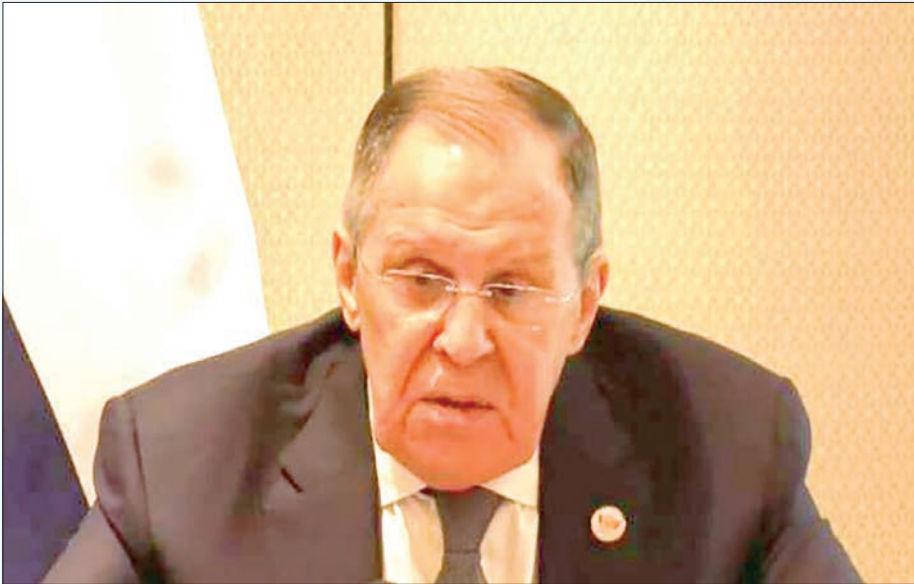
Russian Foreign Minister Sergey Lavrov on Friday said India could serve as a potential mediator in the conflict involving Iran and the US, emphasizing on New Delhi's "vast diplomatic experience and international standing".