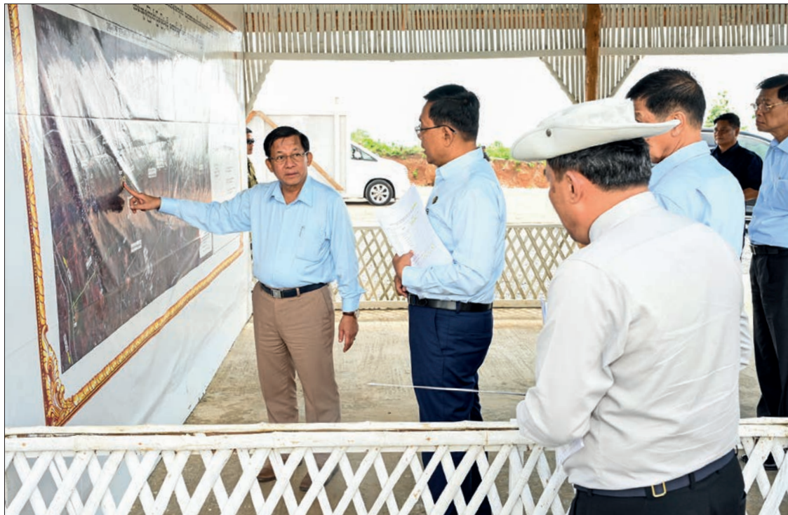
President U Min Aung Hlaing gives guidance over the construction of a new road leading to the Central Fire Services Training School from the Mandalay-Lashio Road.

President highlighted that PyinOoLwin is a city with a strong educational tradition. It has around 25 per cent private schools, and efforts are being made to further improve the education sector. He underlined that State-run schools are encouraged to promote higher educational standards, and all schools should be properly organized, comply with established regulations, and be strictly supervised to ensure order and discipline.