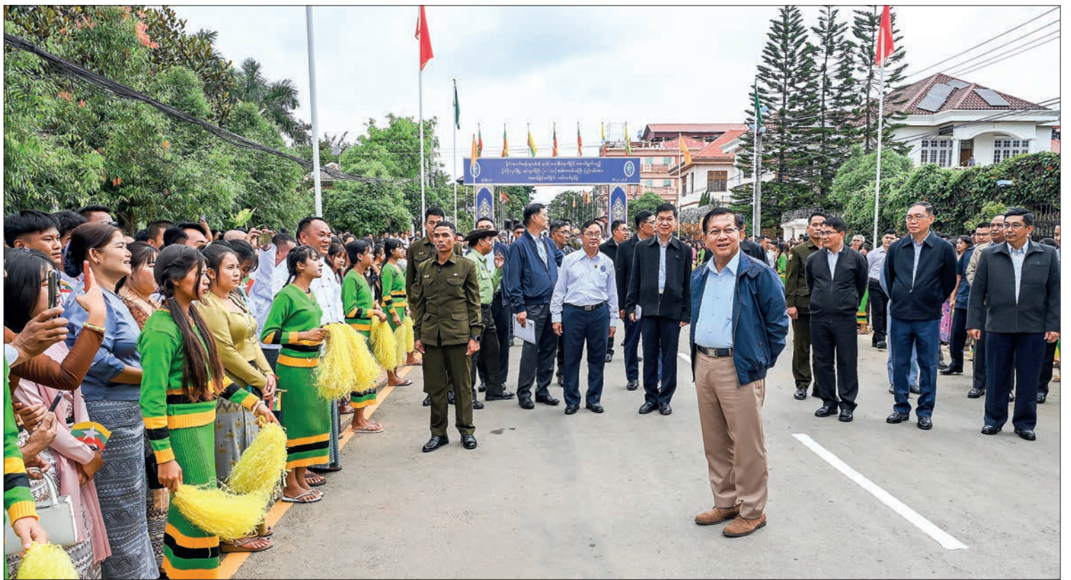
President of the Republic of the Union of Myanmar U Min Aung Hlaing warmly greets locals at the ceremony to inaugurate five major upgraded roads in PyinOoLwin, Mandalay Region, yesterday.

The PyinOoLwin Development Committee upgraded 16 asphalt roads in 12 miles and four furlongs in total length from 2021 to 2026.