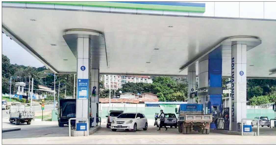
Vehicles are seen refuelling at the petrol station in downtown Yangon.

The committee is governing the market to ensure a stable price and secure supply. Fur-