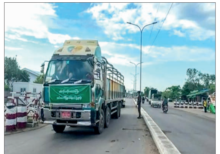
Vehicles returning from Myitkyina to Mandalay after transporting government staff and essential supplies are seen in transit.

The convoy had carried government personnel, basic food supplies, consumer goods, construction materials, medicines, school textbooks, stationery, and fuel from Mandalay to Myitkyina to support regional rehabilitation efforts, healthcare services,