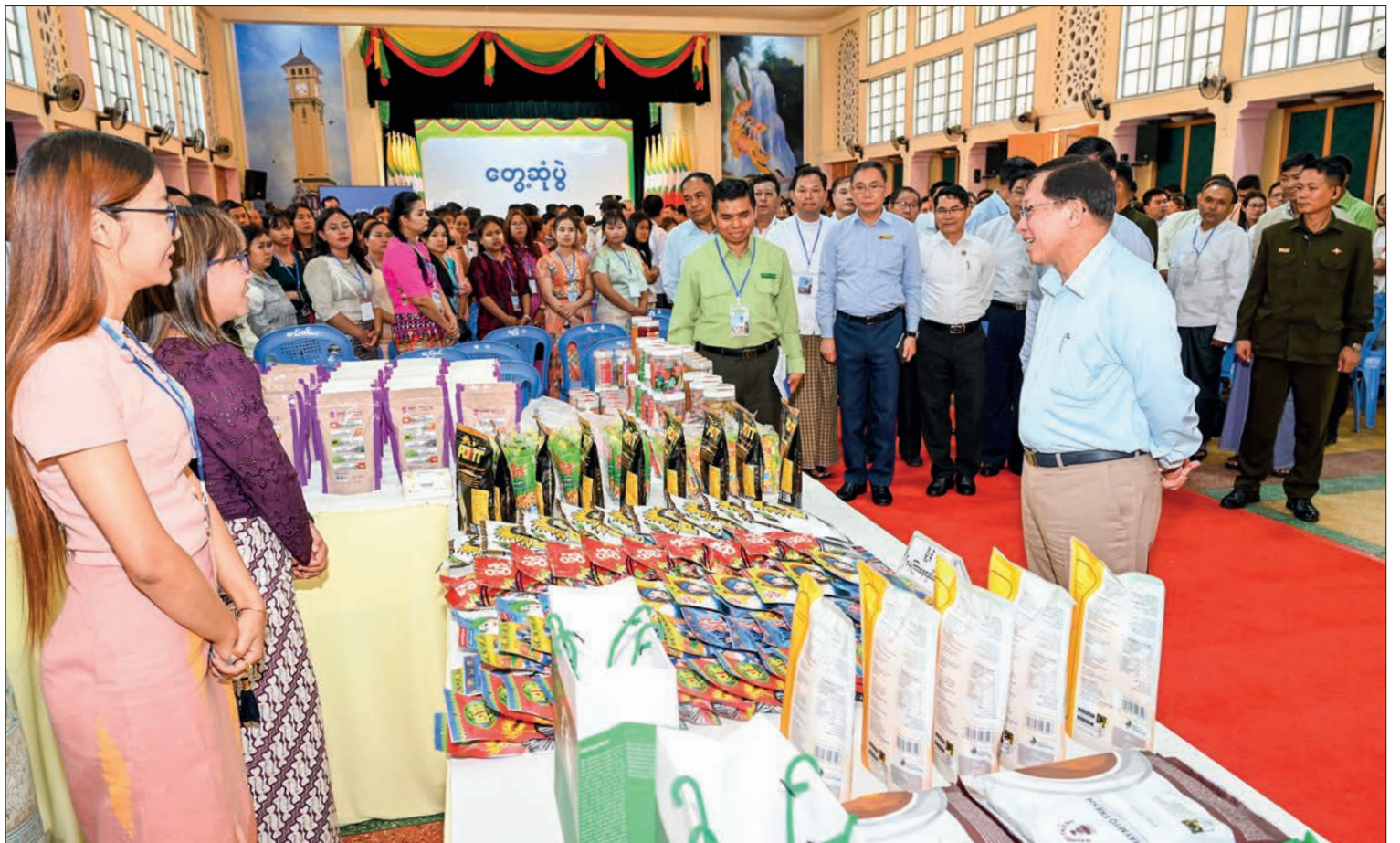
President of the Republic of the Union of Myanmar U Min Aung Hlaing views around the MSME products and domestic foodstuffs displayed at the city hall in PyinOoLwin of Mandalay Region yesterday.