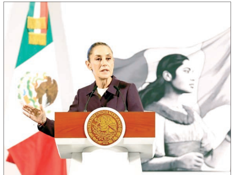
As of May 2026, the European Union (EU) and Mexico have finalized a modernization of their 26-year-old trade partnership to strengthen economic ties, with a formal signing expected during an EU-Mexico summit on 22 May 2026.

The EU has rushed to finalise a string of trade deals with the likes of India, Australia and South American bloc Mercosur since Trump unveiled a barrage of tariffs since his return to power last year. — AFP