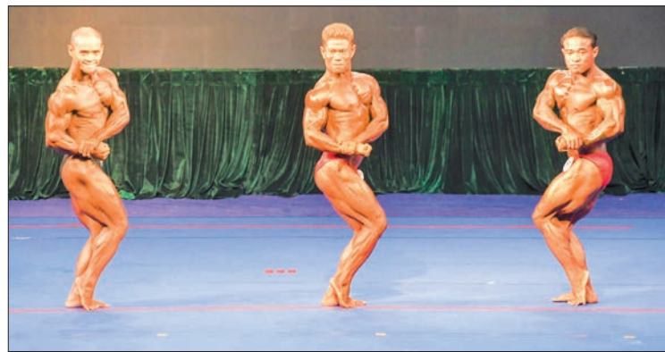
Competition at the Men's Senior Bodybuilding 60-kilogramme event.

In the Men's Master Bodybuilding Over-45 event, Myanmar won gold and bronze, while the Philippines took silver. In