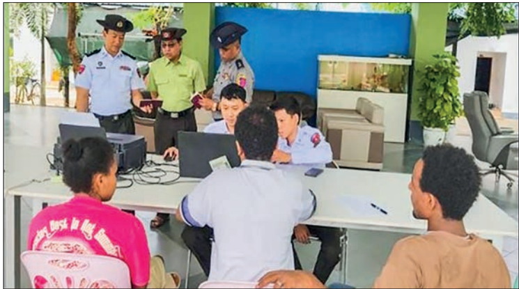
Immigration procedures are underway for the deportation of three Ethiopian nationals linked to telecom fraud and online gambling activities.

AUTHORITIES investigating online scam and telecom fraud operations have detained three more Ethiopian nationals who allegedly entered scam compounds near Myawady via illegal routes through neighbouring countries, including Thailand.