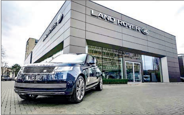
US import tariffs and a debilitating cyberattack pushed Jaguar Land Rover into an annual loss, figures published Thursday showed.