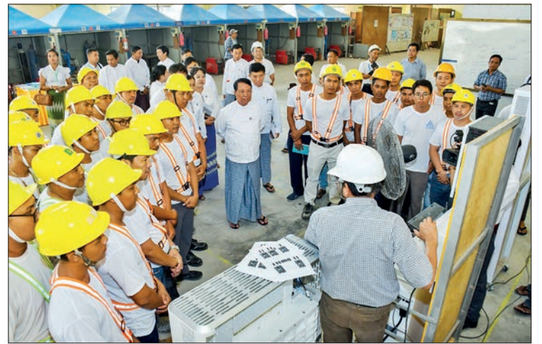
Union Minister U Khin Maung Soe observes the solar panel installation training course in Mandalay yesterday.

UNION Minister for Labour U Khin Maung Soe visited the Worker's Hospital (Mandalay) in Aungmyaythazan Township, Mandalay Region, yesterday afternoon, where he met insured workers in the outpatient department and hospital, provided cash assistance, and inspected healthcare services, including kidney