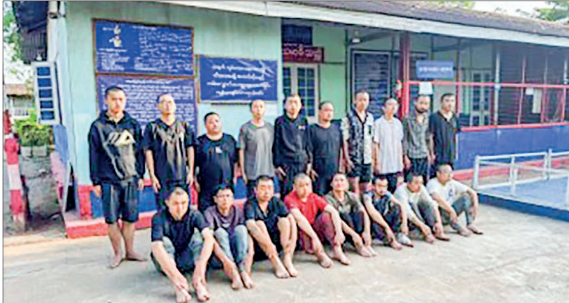
This photo reveals 18 Chinese nationals arrested for online scams and gambling near the Thanlwin River in the vicinity of Lwesaunghtauk Village, Mongshu Township, on 15 May.

The combined force investigated to eliminate online gambling along the west of Thanlwin River in Mongshu-Mongsan, Loilem District, Shan State (South), and arrested 18 male Chinese nationals who were illegally residing near the Thanlwin River, about 26 kilometres southeast of Mongshu and