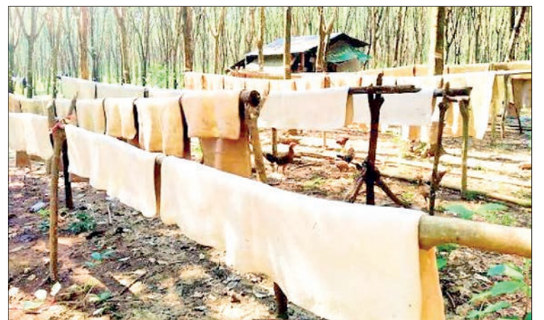
This image shows the rubber processing site in Taninthayi Region.

MYANMAR exported 333,367 tonnes of rubber in the past financial year 2025-2026 (1 April-31 March), bagging over $519.8 million, according to the Ministry of Commerce.