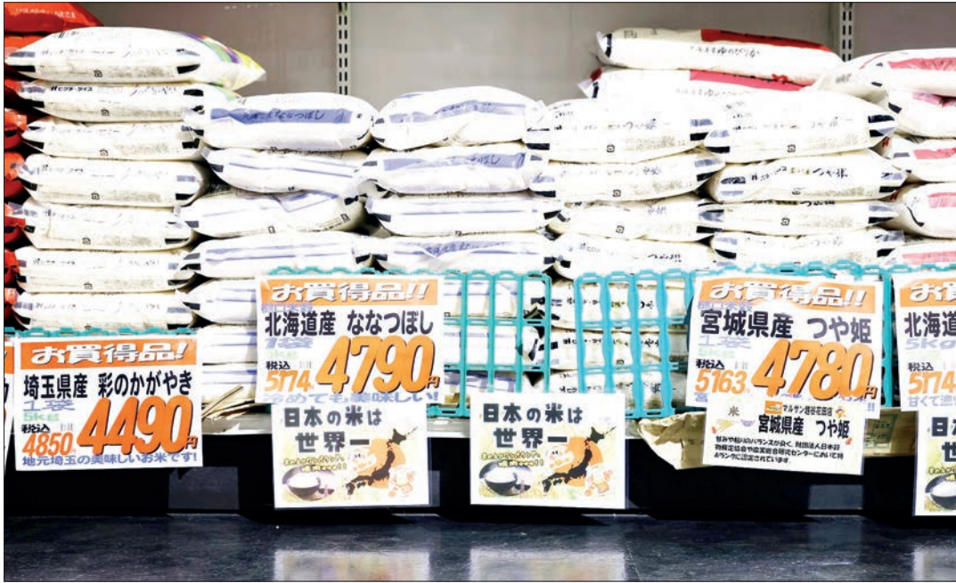
Rice prices began surging around summer in 2024 after extreme summer heat reduced the previous season's harvest.