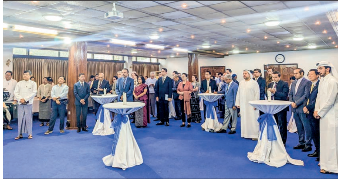
Ambassadors, Chargés d'Affaires, and diplomats from foreign embassies based in Yangon are seen at the Diplomatic Coffee Morning in Yangon yesterday.

ON the morning of 16 May 2026, the Ministry of Foreign Affairs organized a Diplomatic Coffee Morning at its premises in Yangon, which brought together Ambassadors, Chargés d'Affaires, and diplomats from foreign embassies based in Yangon, as well as representatives from the United Nations agencies.