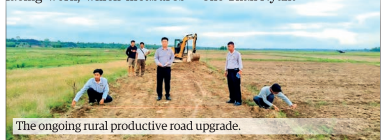
The ongoing rural productive road upgrade.

The infrastructure project is being executed with an allocated fund of K26 million, through a collaborative effort between engineers from the Township Rural Development Department and local villagers. To date, approximately 30 per cent of the overall project has been completed. — Cho Than Nyunt