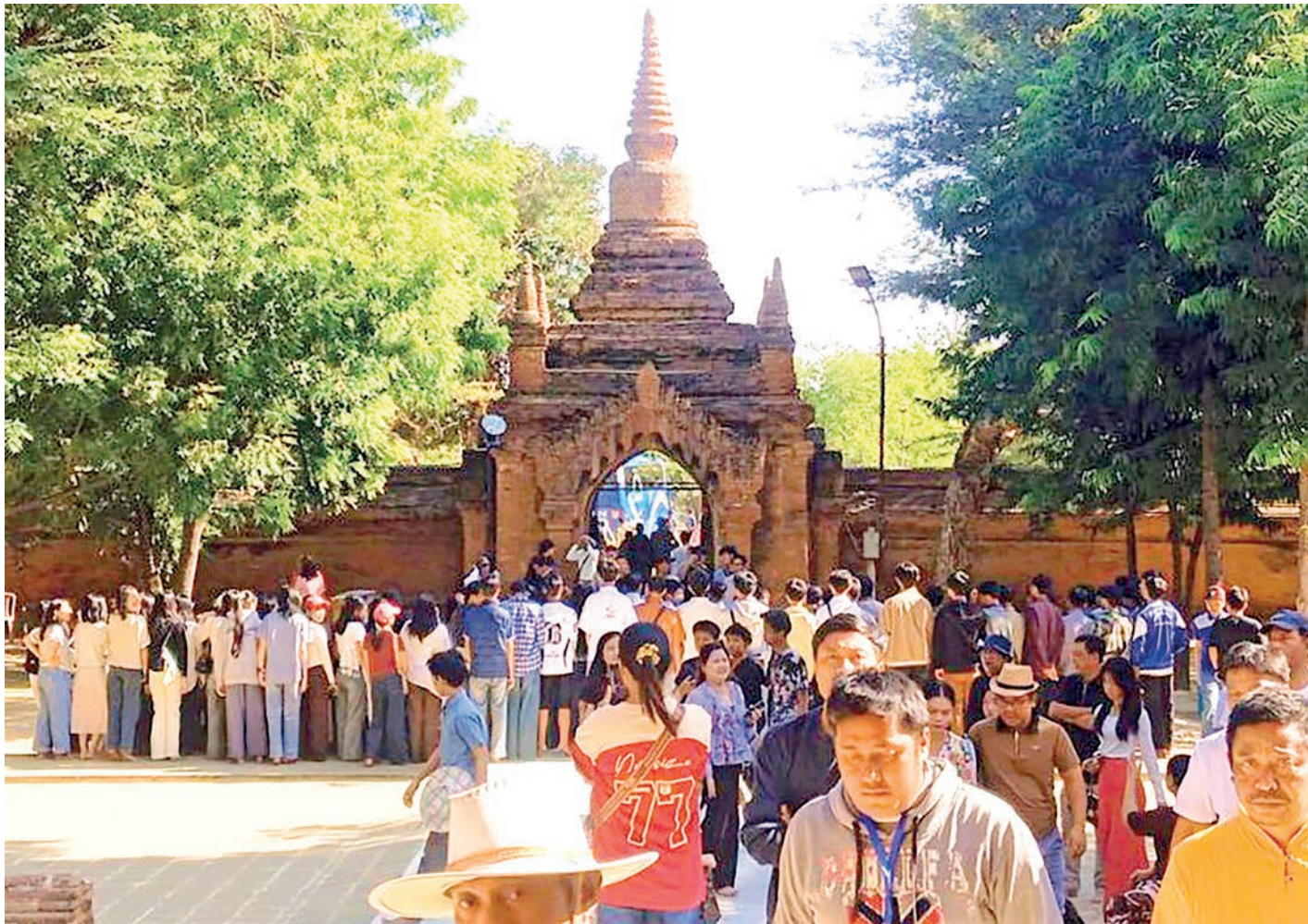
This image captures domestic travellers visiting the Bagan Ancient Cultural Heritage Zone.