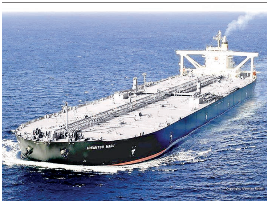
Supplied photo shows the oil tanker Idemitsu Maru.

A tanker operated by a subsidiary of Japanese oil refiner Idemitsu Kosan Co transited the Strait of Hormuz without paying any toll, a government source said Wednesday.