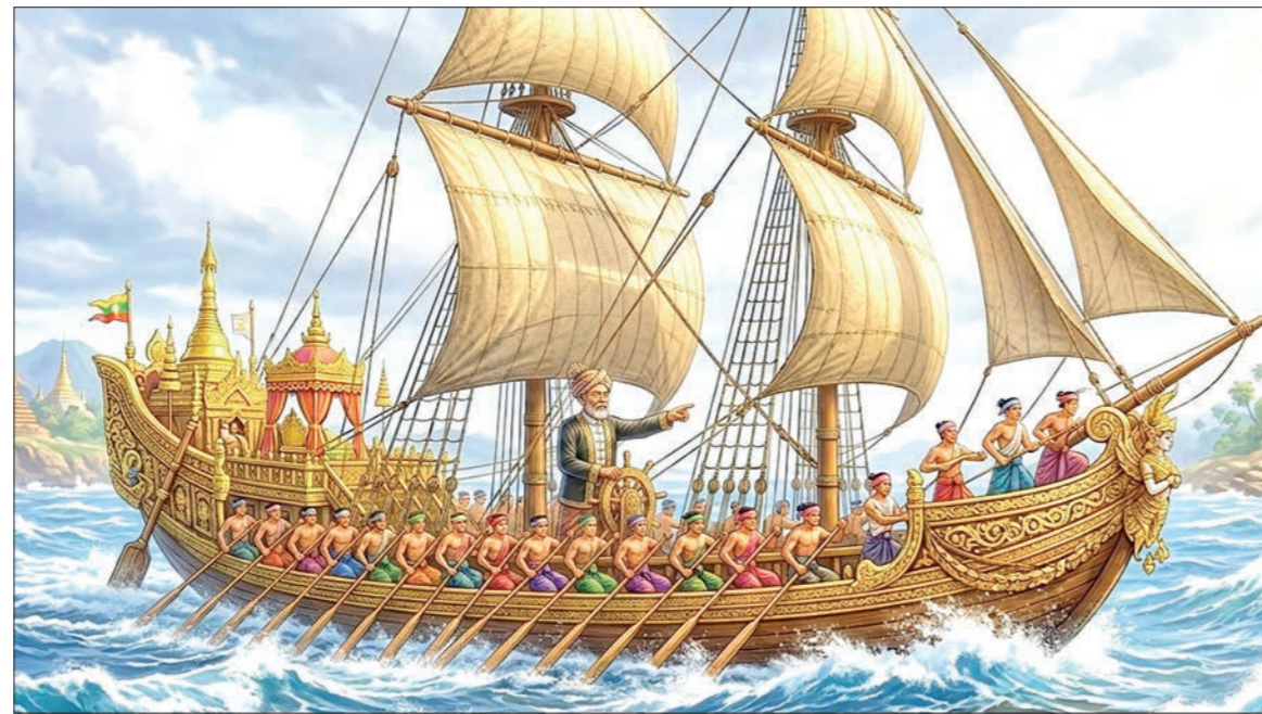
“တစ်လှေတည်းစီး တစ်ခရီးတည်းသွား” “We ride in the same boat, we go on the same journey”

IN THIS interconnected world, choosing unity over division defines true success. Your stance determines whether you thrive by working together or fail by straddling two separate, uncertain, and risky paths. Here are two insightful Myanmar proverbs that perfectly reflect this concept, offering timeless wisdom for navigating the complexities of our shared modern life and fostering stronger connections in everything we do.