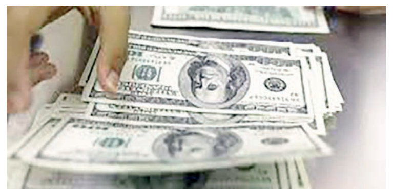
US dollars being counted at a money changer in Yangon.

CBM injected foreign currencies into the market, with a view to curbing the instability in the foreign exchange market and currency devaluation. According to CBM's notification on 15 March 2024, it has been collaborating with law enforcement agencies to combat and prosecute those who attempt to manipulate the currency market under the existing laws. CBM allowed authorized dealers (private banks) to operate online foreign exchange trading freely as per the market rate, depending on supply and demand, starting from 5 December 2023. — NN/KK