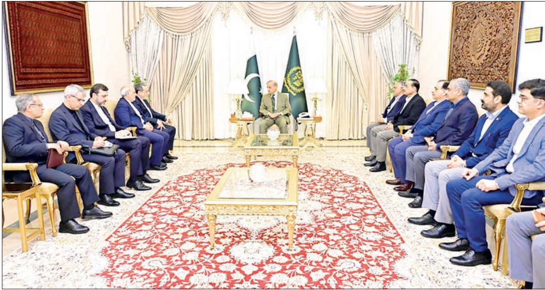
This handout photograph taken on 25 April 2026 and released by Pakistan's Prime Minister Office shows Pakistan's Prime Minister Shehbaz Sharif (C) addressing a meeting with Iran's Foreign Minister Abbas Araghchi (5L) amid the Middle East war, at the Prime Minister House in Islamabad.