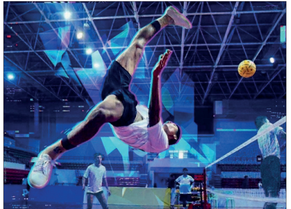
A Sepak Takraw player in dynamic action in this picture.