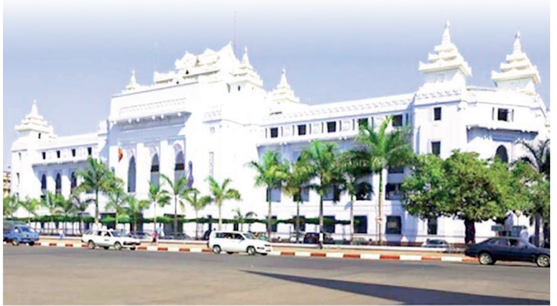
The City Hall – Yangon's prominent landmark – which accommodates the offices of the Yangon City Development Committee (YCDC).

Interested suppliers need to submit tender applications by 12 May 2026. The tender form is available at the Procurement Division of the Finance and Account Department at the City Hall, 1 st floor. Individuals can enquire about details at the Procurement Tender Committee during office hours by dialling 01 388732. — NN/KK