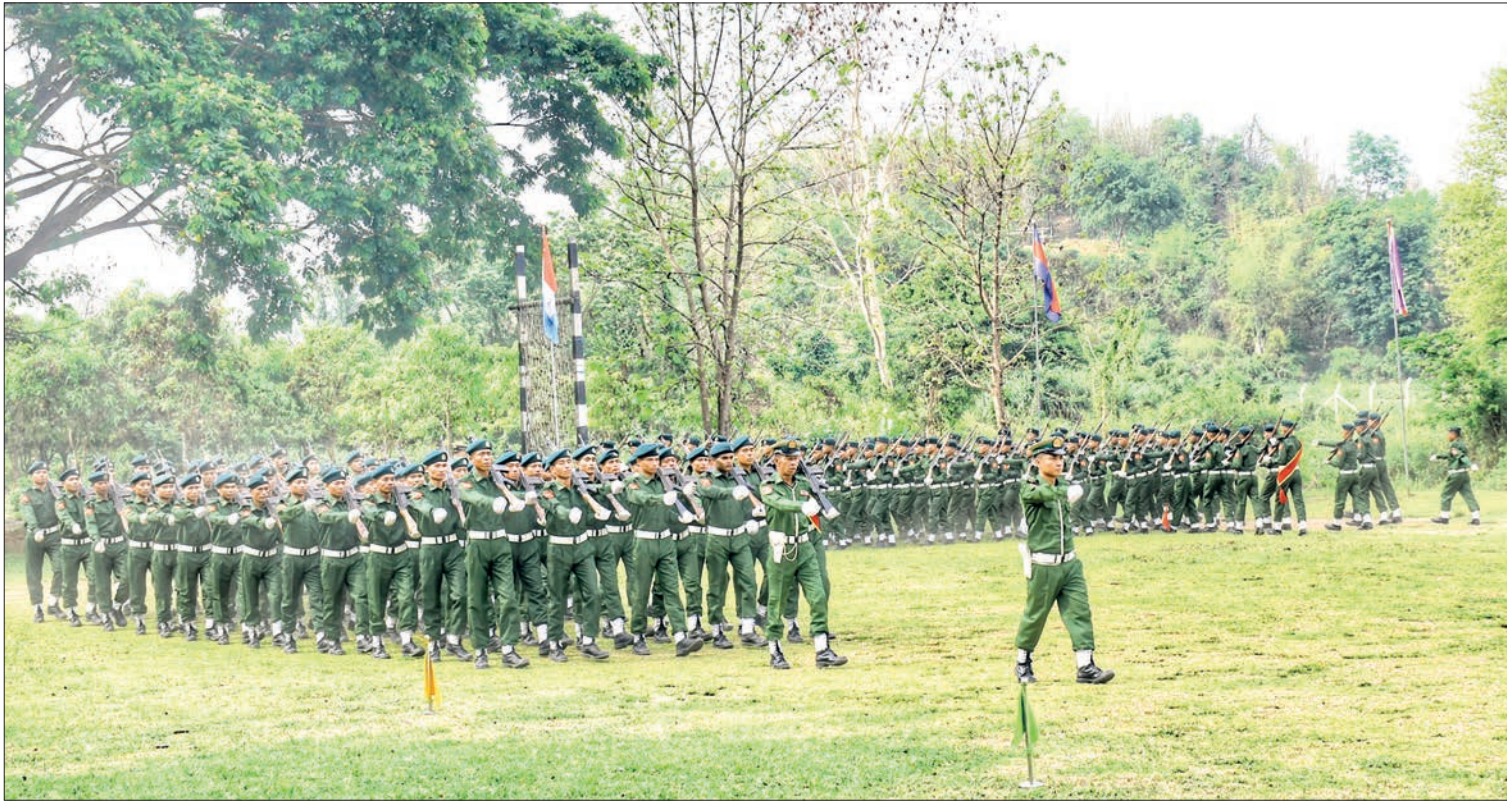
The graduation parade for the People's Military Service Training 22 in action yesterday.

ees who demonstrated outstanding performance throughout the course.