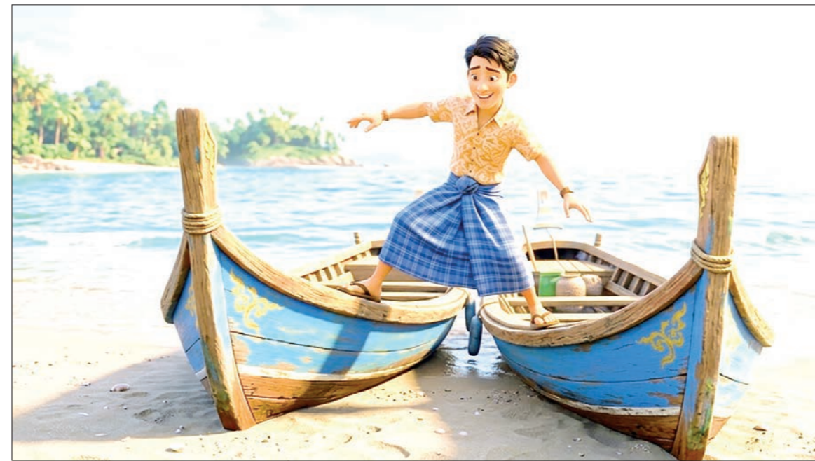
“လှေနှံနှစ်ဖက်နှင်း” “Straddling two boats”

ဒီစကားပုံရဲ့ တန်ဖိုးက “ညီညွတ်လာ ကံကြမ္မာချင်း ဆက်နွယ်နေကြတယ်” ဆိုတာကို သတိပေးနေတာပါ။ အားလုံးဟာ ပန်းတိုင်တစ်ခုတည်းကို တွေ့ရတာပဲလို့ အားလုံးမြုပ်မယ်၊ လှေပန်းတိုင်ရောက်ရင် အားလုံးအတူရောက်မယ်ဆိုတဲ့ သဘောပေါ့။ ဒီ