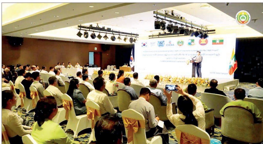
This photo depicts the handover ceremony for the two Air Quality Monitoring Stations (AQMS) in progress.