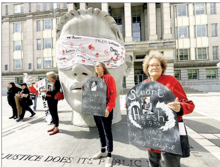
Family members of opioid overdose victims protest outside the US District Court for the District of New Jersey in Newark, New Jersey, on 28 April 2026.

The criminal sentencing caps off years of legal battles and paves the way for Purdue and its former owners, the Sackler family, to pay more than $8 billion as part of a settlement. Between 1999 and 2023, around 806,000 people died from opioid overdoses in the United States, according to the Centres for Disease Control and Prevention. — AFP