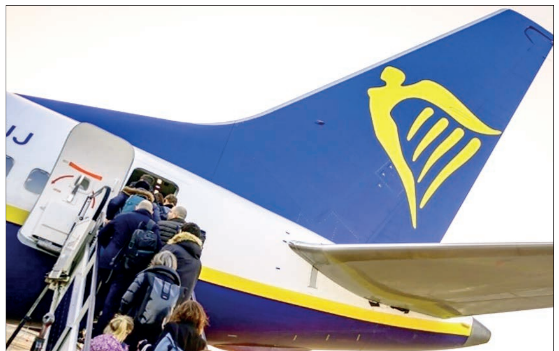
Low-cost airlines are cutting flights and raising fares as soaring jet fuel prices. PHOTO: AFP/FILE

With cheaper tickets, they have less capacity to absorb the rise in fuel costs. — AFP