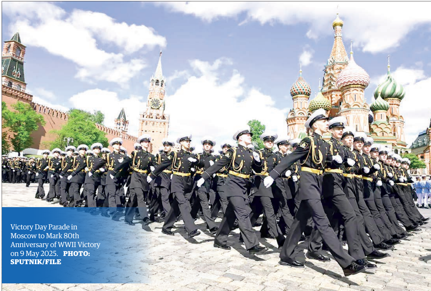
Victory Day Parade in Moscow to Mark 80th Anniversary of WWII Victory on 9 May 2025.