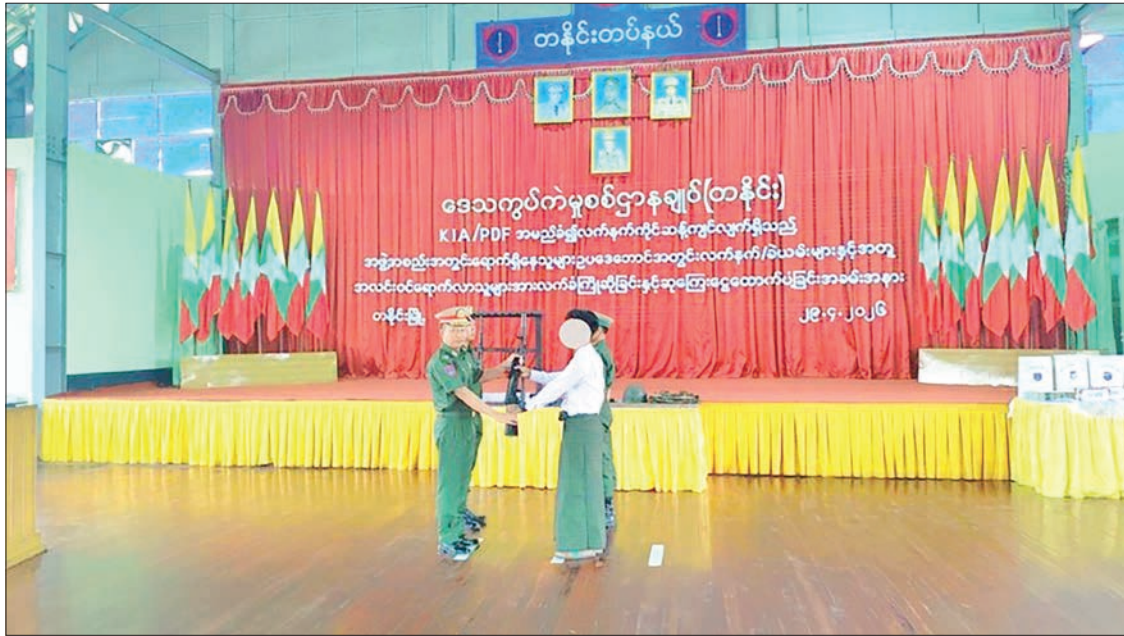
A ceremony welcoming KIA/KPDF members who returned to the legal fold, along with the provision of cash assistance, is underway in Tanai, Kachin State, yesterday.

A total of four members of KIA and KPDF entered the legal fold yesterday. These returning members stated that they could no longer accept the terrorist acts committed by the armed groups and PDF, such as forced conscription, threatening, arresting, and killing innocent civilians and civil servants for the benefit of terrorist organizations, planting mines and destroying non-military infrastructure like roads and bridges. They also cited discrimination, internal hierarchical oppression, torture, killings, violence, poor living conditions, and demoralization due to an inability to resist Tatmadaw operations