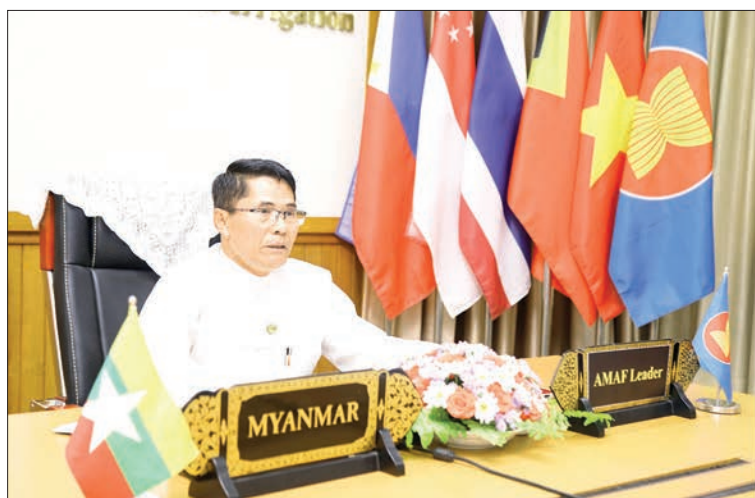
Union Minister U Min Naung virtually participates in the AMAF Special Ministers' Meeting on the Latest Situation in the Middle East, hosted by the Philippines, yesterday.

During the meeting, the Union Minister highlighted the need for close cooperation among ASEAN member states to address potential challenges related to food security and energy security arising from ongoing conflicts in the Middle East. He noted that while Myanmar's current summer agricultural production has not yet been significantly affected due to the use of remaining fuel supplies and fertilizers, the difficulties in fuel and fertilizer availability may arise in the upcoming monsoon season.