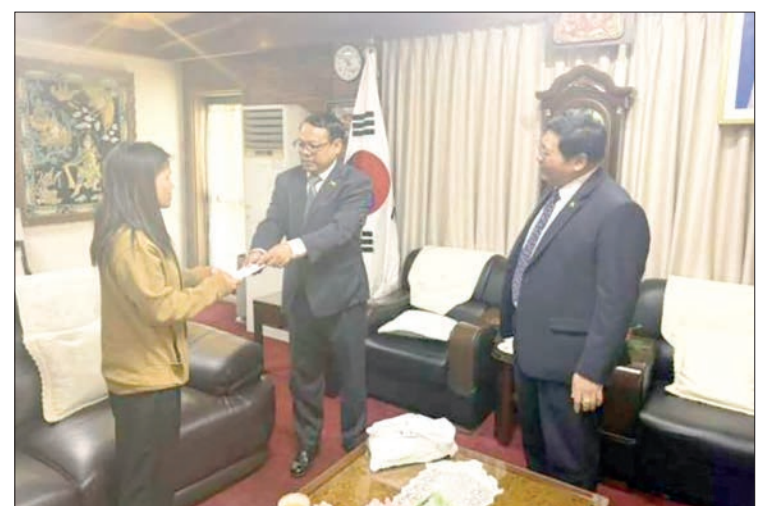
A family member receives the compensation through the Labour attaché at the Myanmar Embassy in Seoul, South Korea.

As a result of these efforts, the deceased’s wife was able to fully receive all due entitlements, including service pay, unpaid wages, overtime pay, leave compensation, workplace injury insurance, funeral support funds, and employer-provided compensation, and arrangements were made to ensure legal fees were kept at