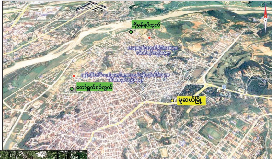
Images reveal crackdown sites in Muse, northern Shan State, where online scammers and gambling suspects were arrested (above), and 26 Chinese nationals detained in Homon Ward, Muse (left).

The seized equipment used in online fraud and gambling operations will be handled in accordance with established pro-