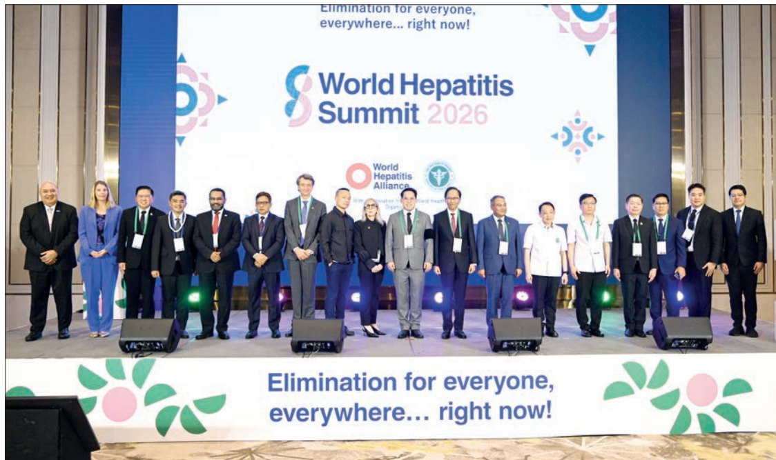
Union Minister Dr Thet Khaing Win joins the documentary group photo session during the opening ceremony of the World Hepatitis Summit 2026, held in Thailand.

The Union minister said that Myanmar’s progress in hepatitis prevention and treatment has led to the expansion of free hepatitis C treatment to 36 public hospitals nationwide by 2025, bringing emergency healthcare services closer to the people. He added that the hepatitis B vaccine has been included in the national immunization programme and is administered to all newborns immediately after