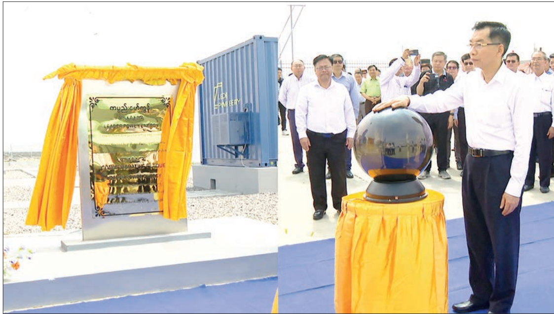
Union Minister U Ko Ko Lwin presses the button at the opening ceremony of Solar Power Plants in Mandalay Region yesterday.

going power generation projects are facing delays for various reasons. Some operating plants have suffered destruction, leading to reduced electricity gener-