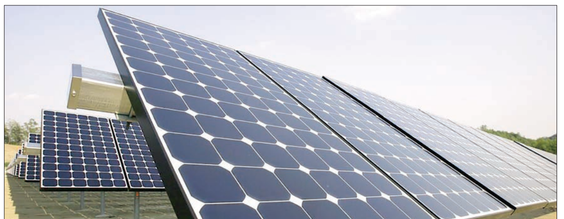
The Republic of Korea (South Korea) officially joined the International Solar Alliance (ISA) on 20 April, 2026.

"You know, just in last one month, Canada, the Republic of South Korea and Jordan are joining. Why are they joining? They're joining because doing solar made a lot of sense just for the climate. Then it made