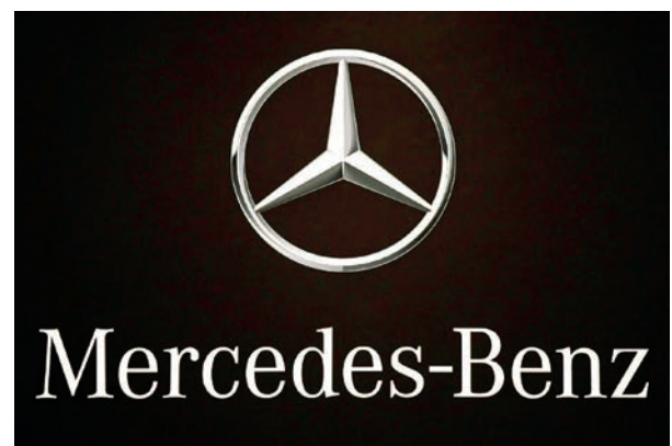
Mercedes said net profit for January to March fell 17 per cent from the previous year to 1.43 billion euros ($1.67 billion). PHOTO: AFP

Mercedes said net profit for January to March fell 17 per cent from the previous year to 1.43 billion euros ($1.67 billion). — AFP