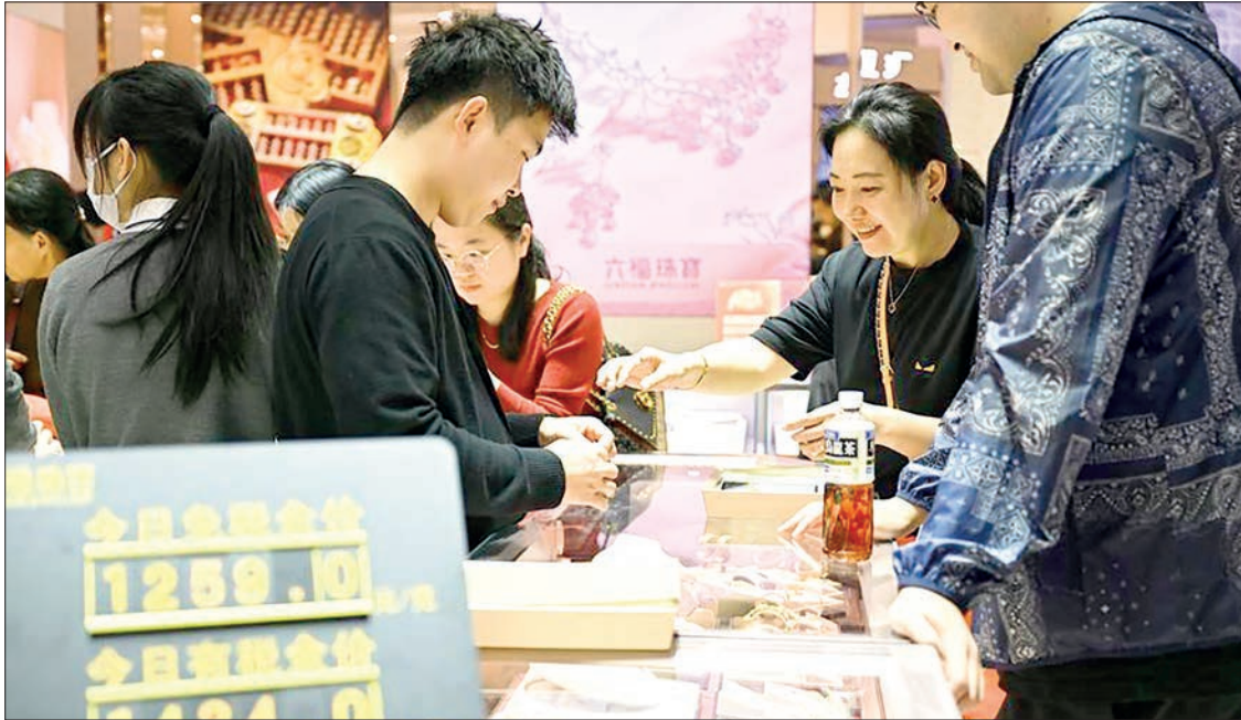
Customers select gold jewellery at a duty-free store in Haikou, south China's Hainan Province, on 17 January 2026.

Jewellery consumption stood at 300 tonnes, down 23 per cent, but the levels of spending increased 31 per cent, signalling continued positive sentiment towards gold jewellery.