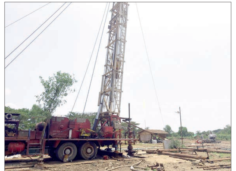
This photo shows Well 14 of Maubin (South) Oil and Gas Field.

Since the end of 2023, the Ministry of Electricity and Energy has been conducting research and analysis of thin sandstone formations in the Aphyauk and