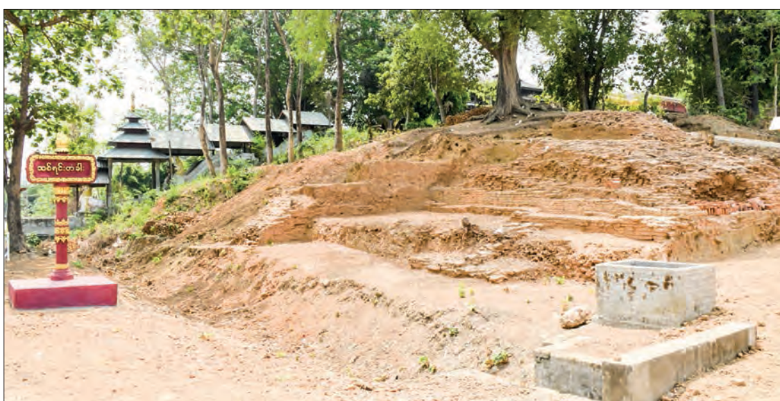
This photo shows Thityin Gate on the western wall of the ancient Ketumati city.

The Deputy Minister inspected archaeological excavation findings, such as brick structures, flooring, roof tiles, and iron artefacts, and instructed officials to ensure their systematic preservation. He continued his inspection of the Sin Gate and Thityin Gate on the