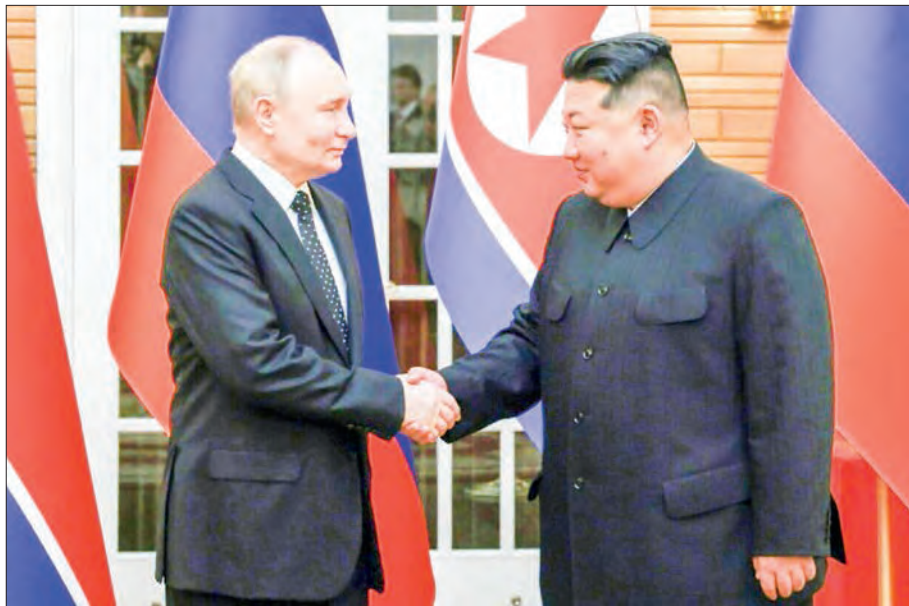
The "Comprehensive Strategic Partnership Treaty" between Russia and North Korea, signed by Vladimir Putin and Kim Jong Un in June 2024, officially went into force on 4 December 2024, after ratification documents were exchanged.

RUSSIAN President Vladimir Putin on Sunday highlighted the combat brotherhood between Russia and North Korea, emphasizing the countries' glorious his-