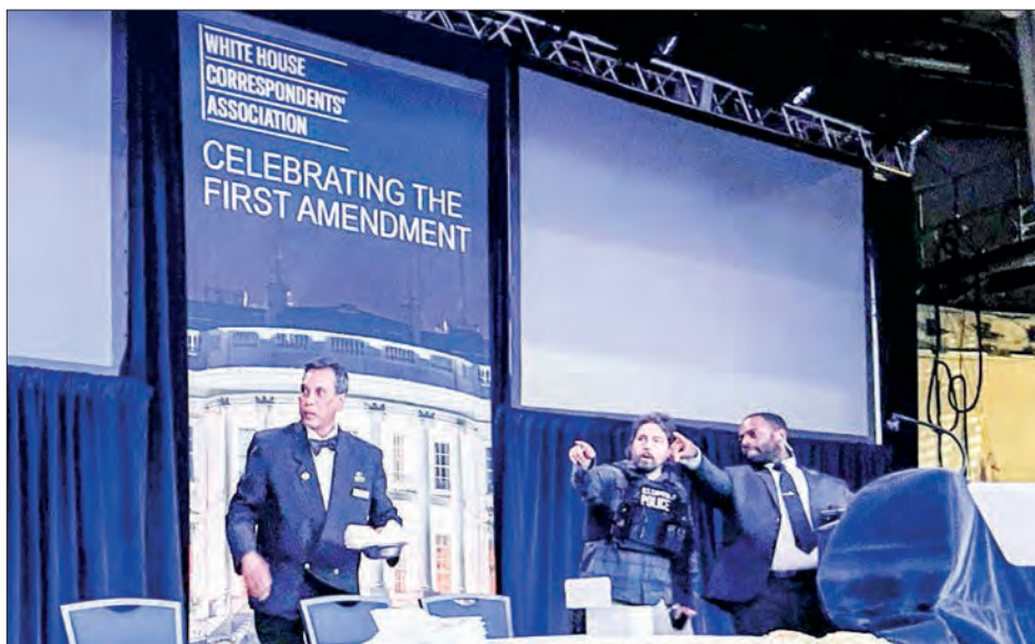
Law enforcement and others respond to a shooting incident at the White House correspondents' dinner on 25 April 2026, in Washington.

US President Donald Trump and high-ranking officials of his administration were safely rushed out of an annual dinner of White House correspondents