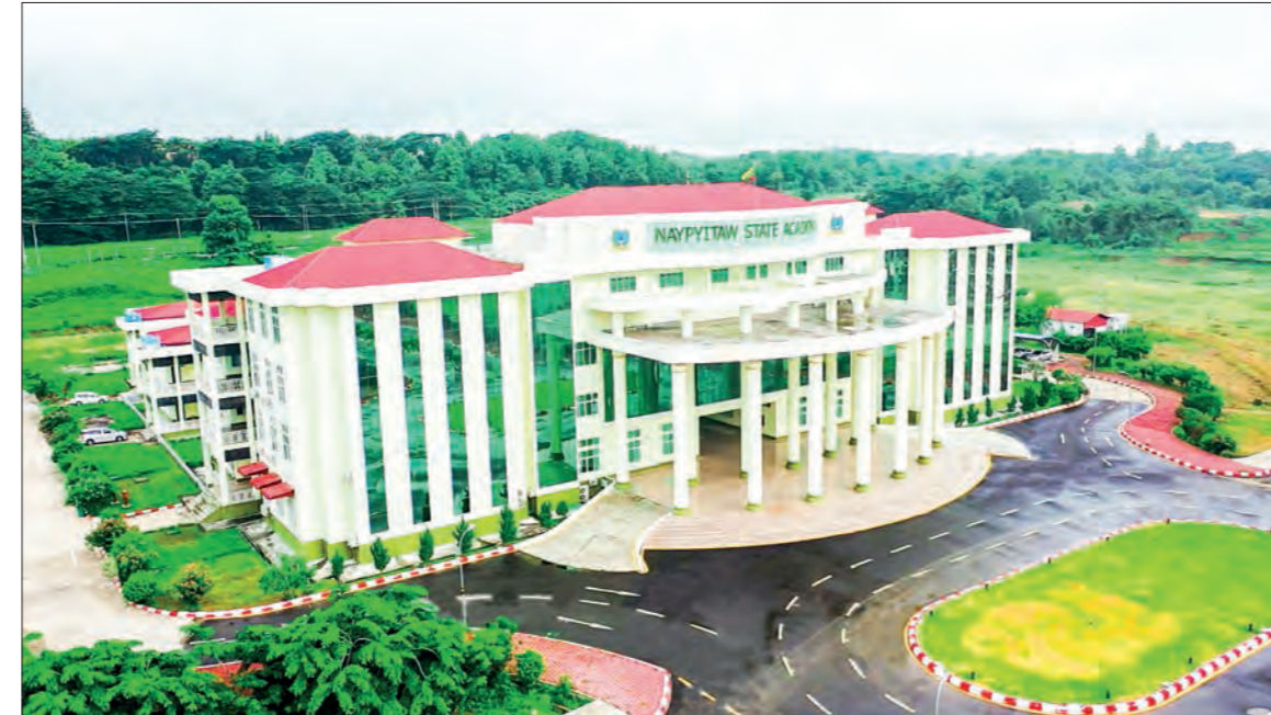
The establishment of Centres for Research and Innovation (CRI) at Nanyipitaw State Academy (NSA), Yangon University, and Mandalay University is a central component of Myanmar's plan to transition from a technology consumer to a contributor. The photo shows the facade of the Nanyipitaw State Academy.

If peace is the soil, education is the seed. The President's fiscal commitment to the education sector stands as perhaps the most revolutionary aspect of this