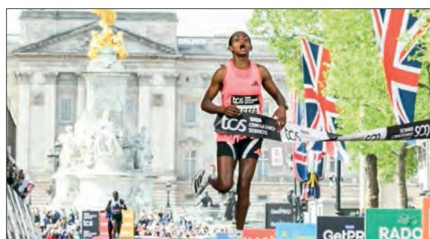
Ethiopia's Tigst Assefa crosses the line to win the women's London marathon in a new women's only world record.

Joyciline Jepkosgei, but pulled away in the closing stages to cross the line in a time of 2hr 15min 41sec. That time beat by