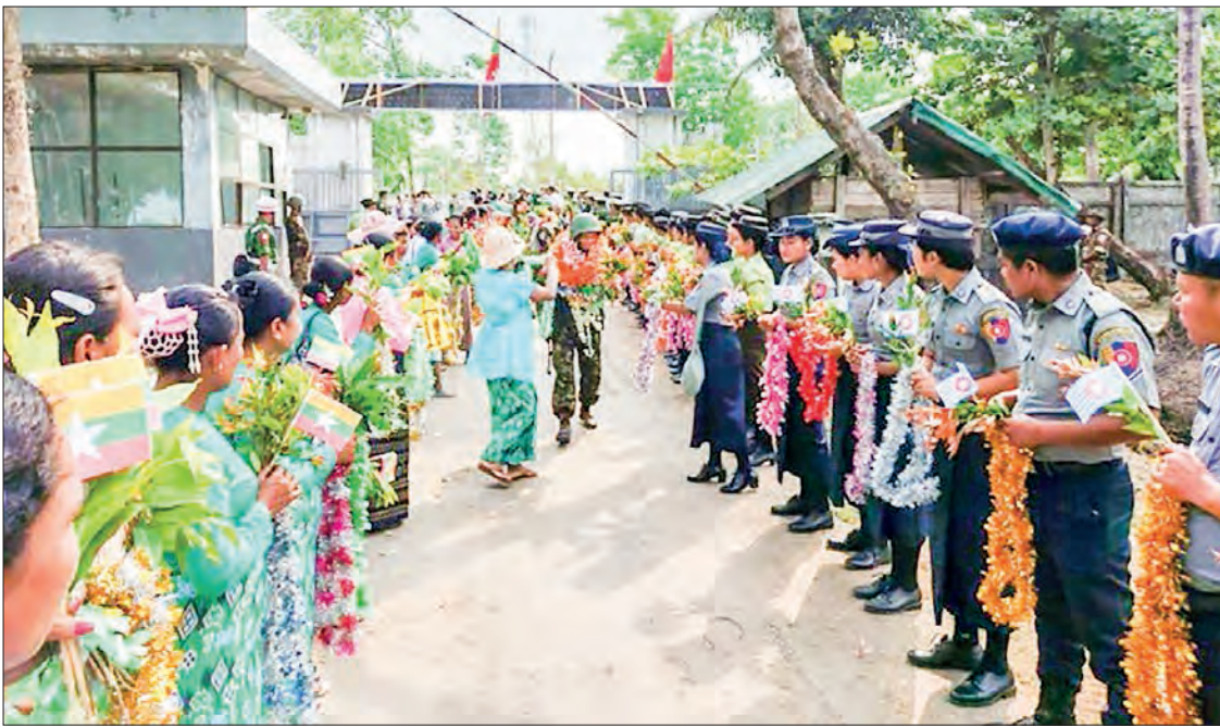
Triumphant Tatmadaw troops are seen being warmly welcomed back in the Western Command.