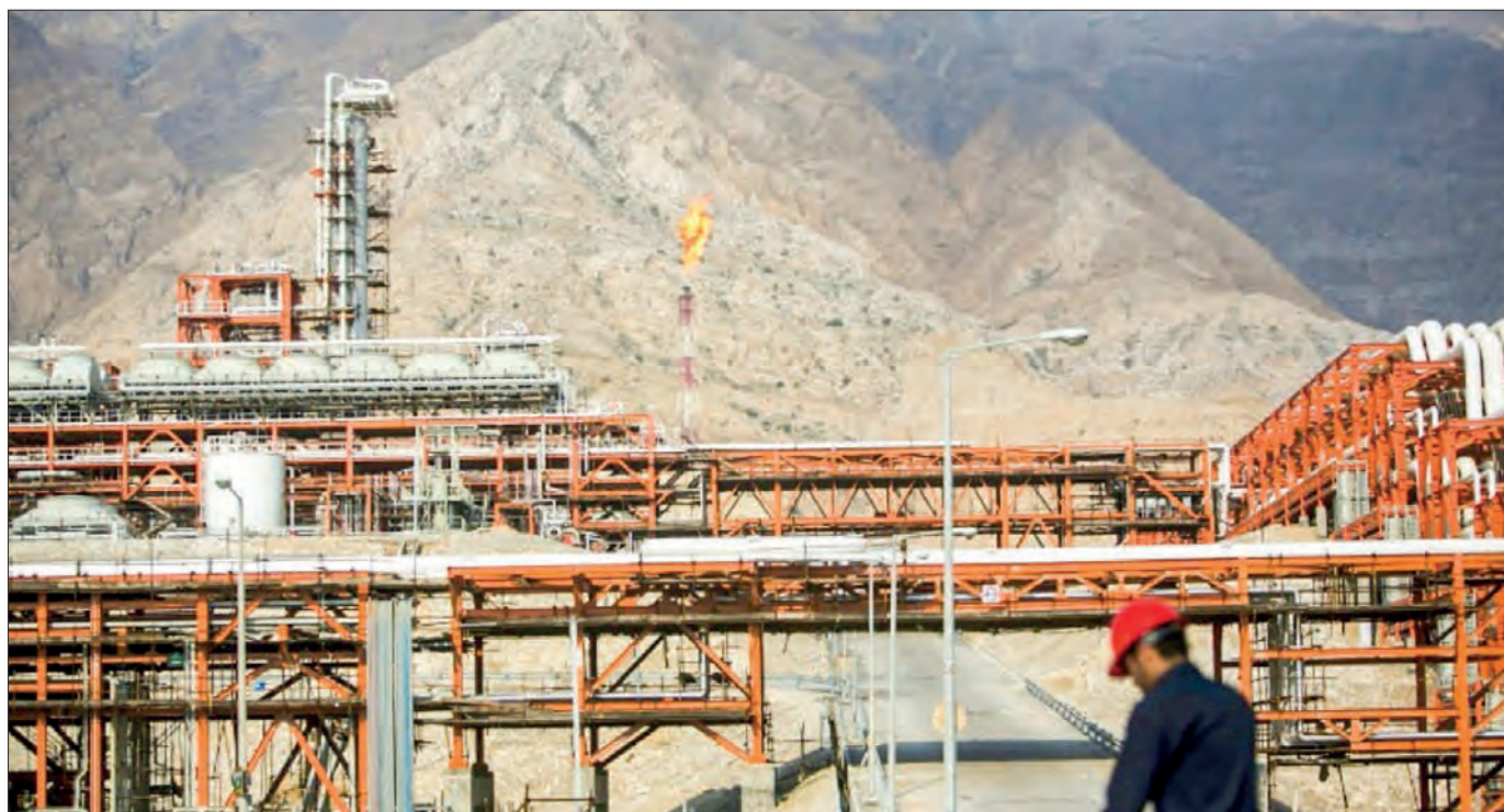
Israeli Defence Minister Israel Katz announced on Monday, 6 April 2026, that Israel carried out a powerful strike on Iran's largest petrochemical facility in Assaluyeh. This site, located in the southern Bushehr province, is a critical energy hub responsible for roughly 50 per cent of Iran's total petrochemical production.

THE Philippines, this year's chair of the Association of Southeast Asian Nations (ASEAN), convened senior officials to assess the impact of the evolving Middle East situation on global and regional energy markets, focusing on oil and gas supply stability, price volatility