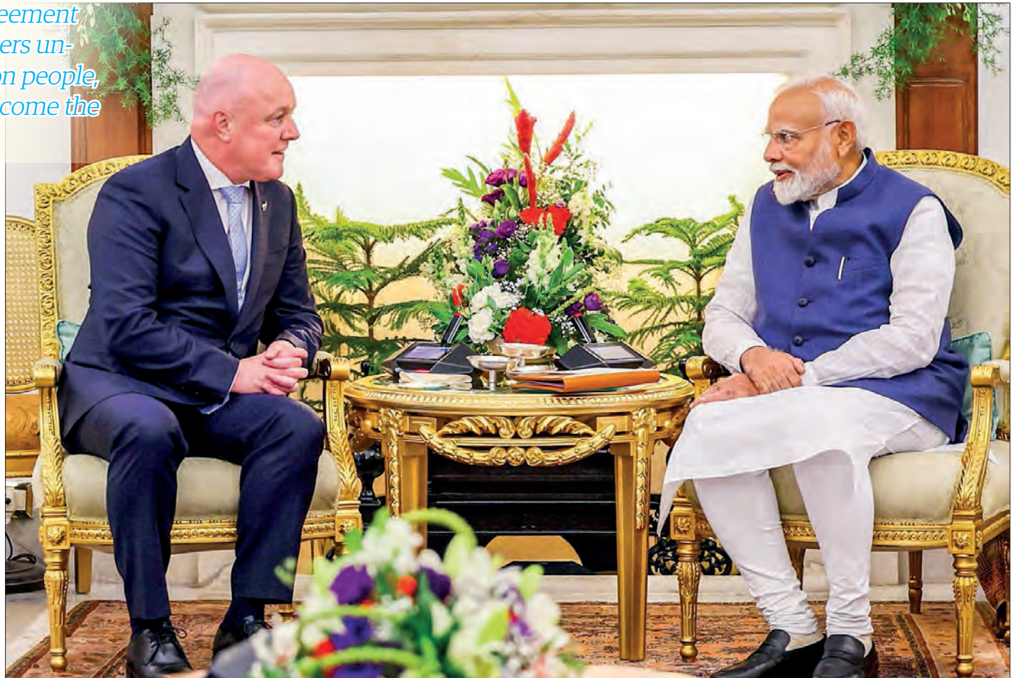
Prime Minister Narendra Modi and New Zealand Prime Minister Christopher Luxon met at Hyderabad House on Monday, 17 March 2025, to discuss deepening bilateral ties.

"It's a once-in-a-generation agreement that gives New Zealand exporters