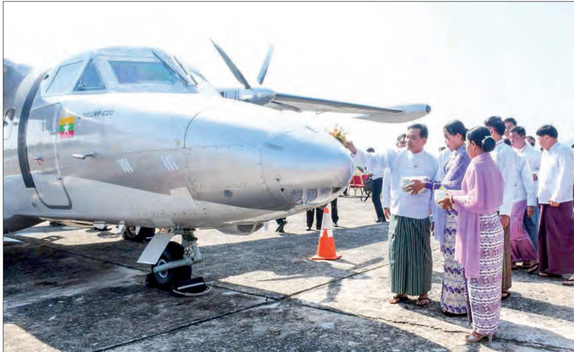
Officials sprinkle scented water on the passenger airplane of Myanmar National Airlines in Dawei Airport yesterday.

At the ceremony, the Chief Minister said the expansion of air routes in the Taninthayi