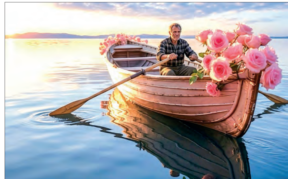
To cultivate inner peace, it is important to reduce negative tendencies such as greed, anger, and ignorance. ILLUSTRATION: GRAPHIC ART

The future is not guaranteed, but it is now undeniably plausible. And for Myanmar, that is a brilliant and promising place from which to commence the work ahead.