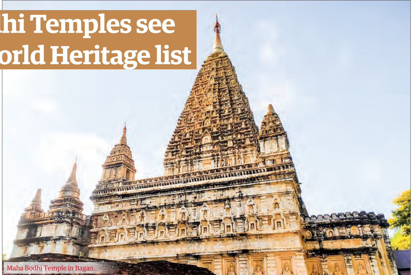
Maha Bodhi Temple in Bagan.

Archaeological experts from Myanmar, India, and Thailand collaborate on transnational UNESCO World Heritage nomination for Maha Bodhi temples.