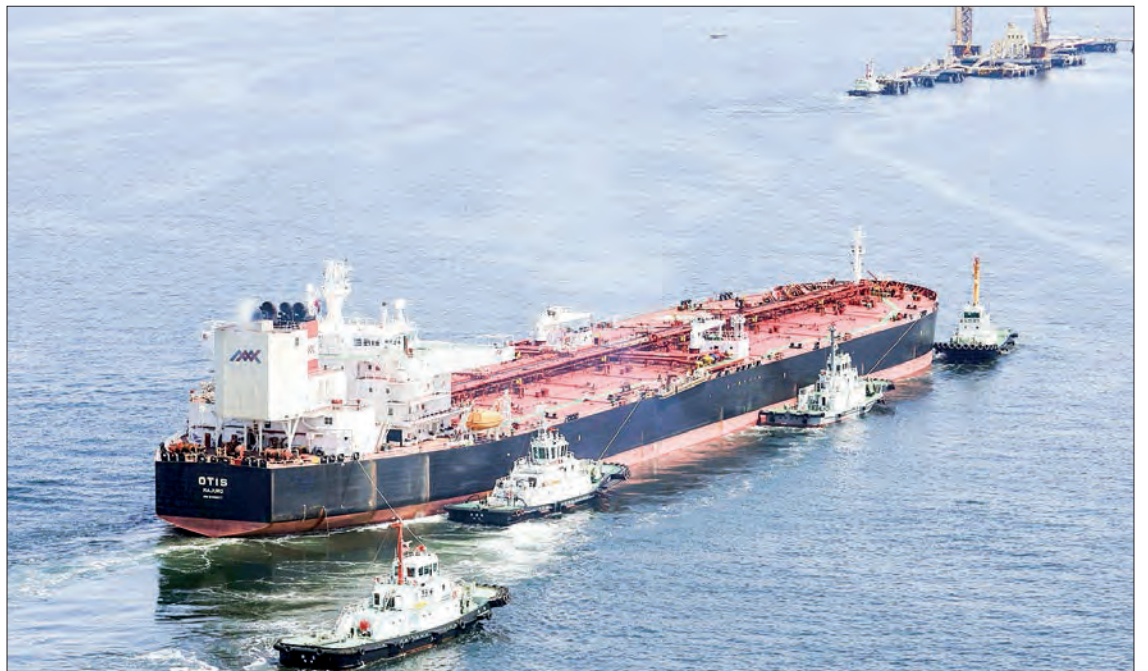
Photo taken from a Kyodo News helicopter shows a tanker carrying US oil as it arrives in Tokyo Bay, Japan, on 26 April 2026.

In addition to the United States, the government will also be procuring oil from other sources such as South America and Central Asia. — Kyodo