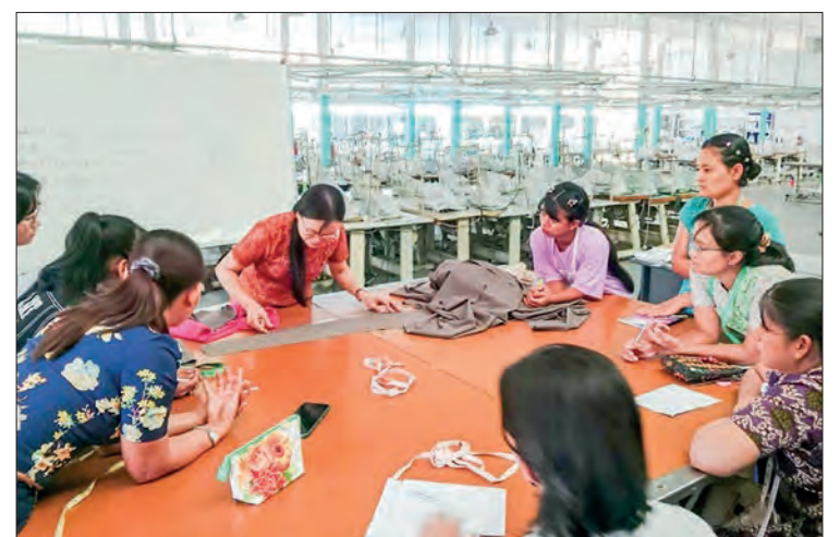
Advanced Sewing Machine Operator Training (Batch - 13).

Interested persons can register at the Myanmar Garment Human Resources Development Centre (MGHRDC) located in Insein Township or can dial 09 940858350 and 09 403912570. — MT/ZS