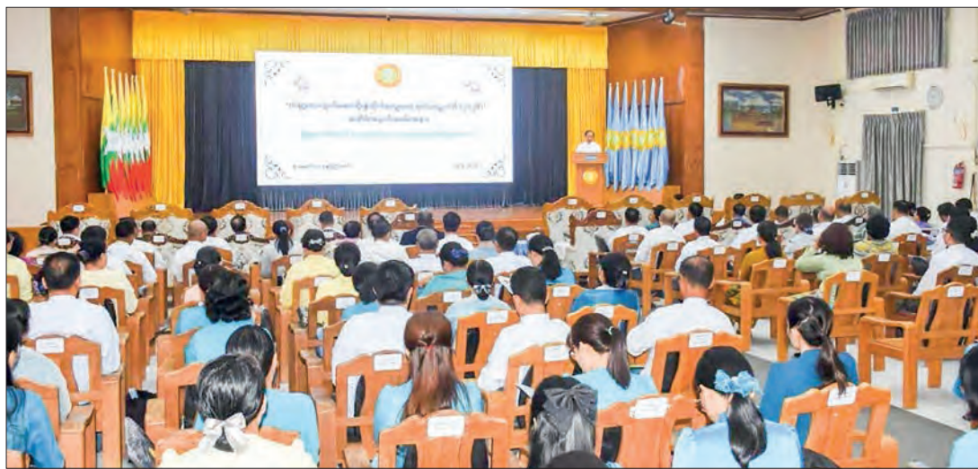
The commemorative ceremony for World Immunization Week 2026 in progress.

ACCORDING to the Ministry of Health, Myanmar is currently administering vaccines for 13 diseases, matching international standards, and has no major outbreaks of vaccine-preventable diseases.