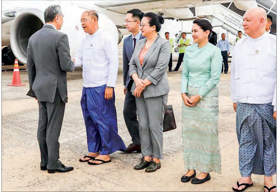
Chinese Foreign Minister Mr Wang Yi shakes hands with Deputy Minister for Foreign Affairs U Naing Min Kyaw before departure for China at Nay Pyi Taw International Airport yesterday.

The delegation was seen off at Nay Pyi Taw International Airport by Deputy Minister for Foreign Affairs U Naing Min Kyaw, Chinese Ambassador to Myanmar Ms Ma Jia, departmental officials, and members of the Myanmar-China Investment and Trade Promotion Association. — MNA