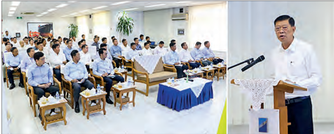
Union Minister U Mya Tun Oo meets officials from jetties being implemented under the Build-Operate-Transfer (BOT) system in the Thilawa port area, Kyauktan, Yangon Region, yesterday.

At the construction site of a modern warehouse project to be implemented by the Myanmar Port Authority and Myanmar Agricultural & General Development Public Limited (MAG-DPL) at the plot 29 in Thilawa Port Area, the Union minister inspected the Myanmar International Terminal Thilawa (MITT) port facilities, including ongoing port service operations