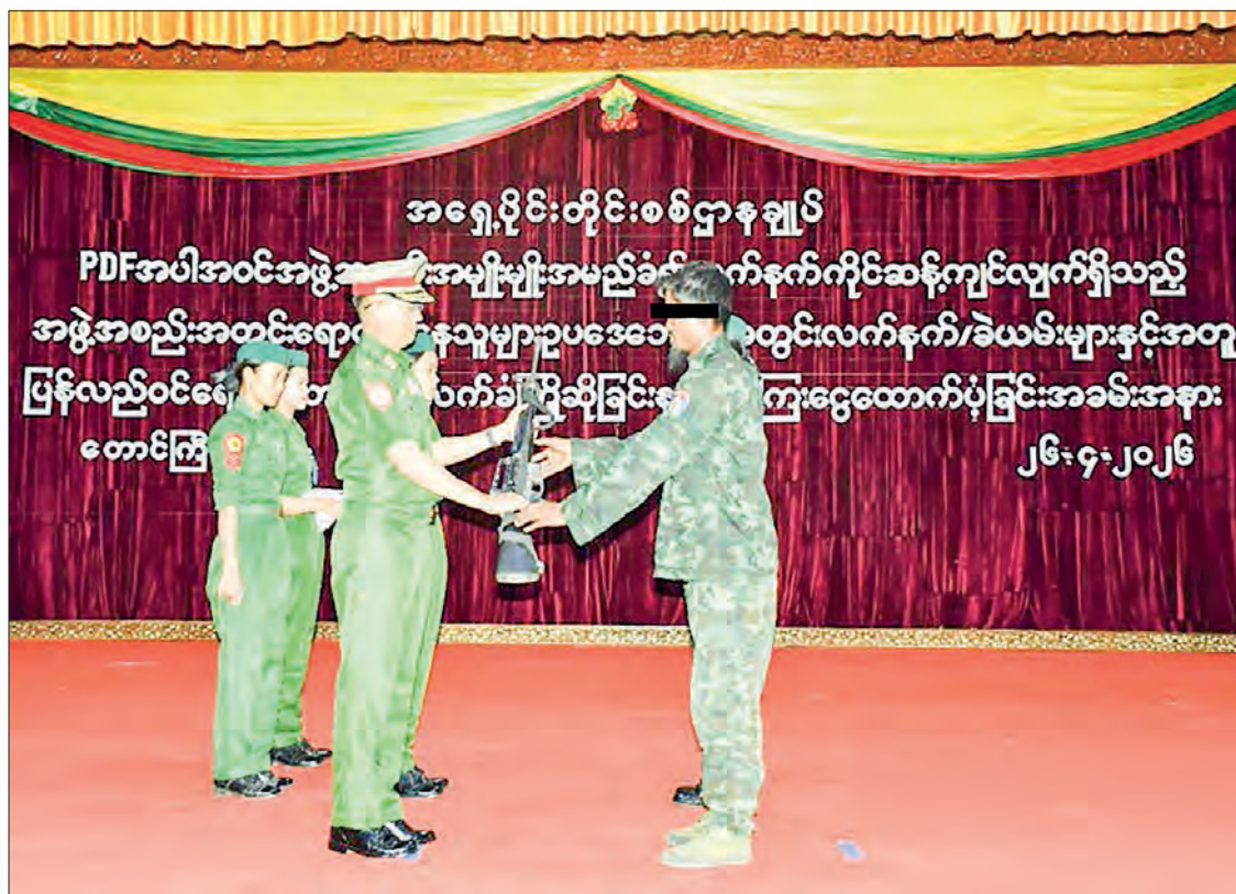
A ceremony welcoming 61 PNLO members who returned to the legal fold, along with the provision of cash assistance, is underway in Taunggyi, Shan State, yesterday.

As a result of these efforts, members of PDF groups have been re-entering the legal fold one group after another. At the same time, Tatmadaw columns have been able to systematically retake and control areas across regions and states that had been temporarily occupied by armed terrorist groups and PDF groups. Consequently, local people, in support of stability and peace in their areas, have warmly welcomed and backed Tatmadaw members who are carrying out their duties at great personal risk. With strong public encouragement, support, trust, and cooperation alongside the Tatmadaw, members of terrorist groups have become demoralized and no longer willing to continue resistance. As a result, PDF members who wish to abandon the armed struggle, gain a correct understanding, and live peacefully have been reporting to officials at nearby military camps and re-entering the legal fold group by group, where