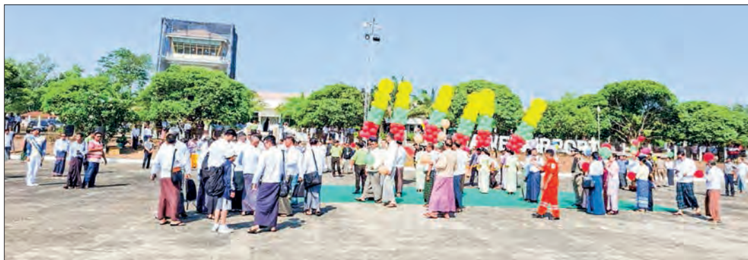
Myanmar National Airlines celebrates Myeik-Dawei-Myeik flight launching service event.

The aircraft then departed Dawei at 10 am with 16 passengers and arrived back in Myeik at 10:52 am, according to the Ministry of Transport. — MNA/KZL