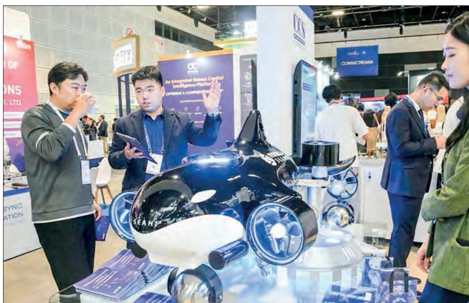
A marine robot is on display during the Singapore Maritime Week (SMW) 2026 in Singapore on 21 April 2026.