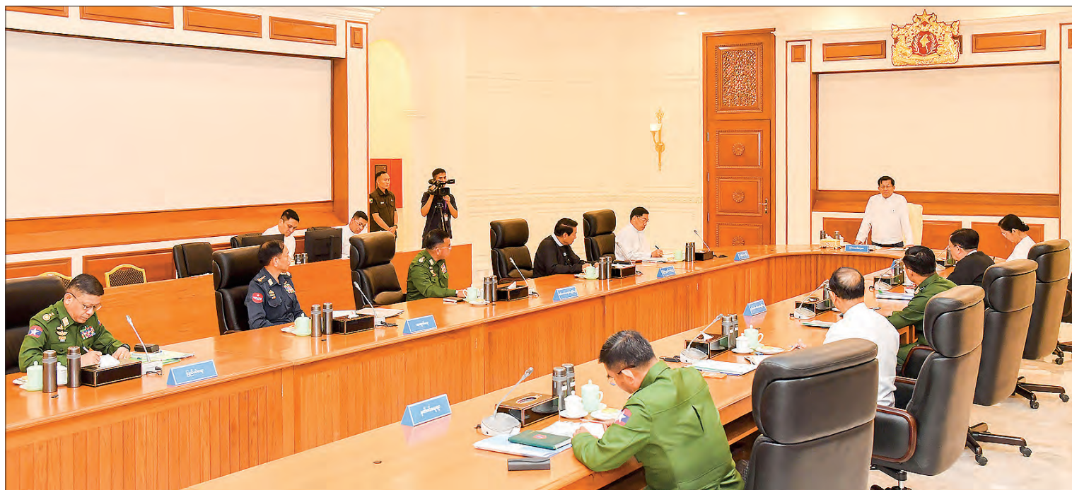
President U Min Aung Hlaing presides over the first meeting of the National Defence and Security Council in Nay Pyi Taw yesterday.

The President underscored the security sector with the plans to enhance the capabilities of the Tatmadaw and the Myanmar Police Force. He stressed that although the Myanmar Police Force is primarily responsible for internal security, the current situation in the country has necessitated Tatmadaw's involvement in