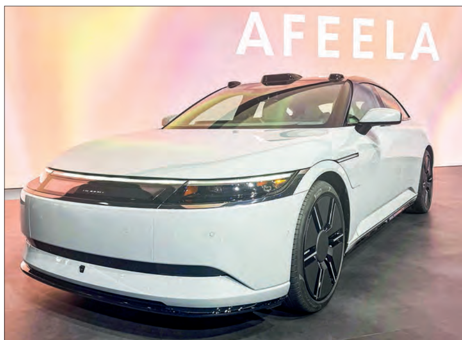
File photo shows Sony Honda Mobility Inc's Afeela 1 electric vehicle model displayed in Las Vegas in January 2026.

Automakers are facing headwinds in the EV market after US President Donald Trump abolished tax incentives for EV purchases last year, while the European Union has also revised its planned 2035 ban on the sale of gasoline and diesel cars. — Kyodo