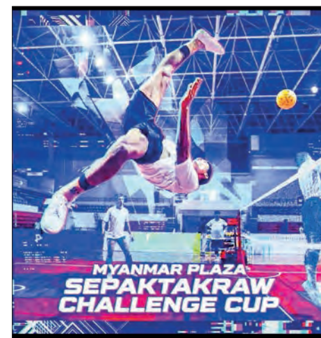
This image features a poster for the Sepak Takraw Challenge Cup.

Cash prizes will be awarded: K5 million for first prize, K3 million for second prize, and two joint third prizes of K1.5 million each.