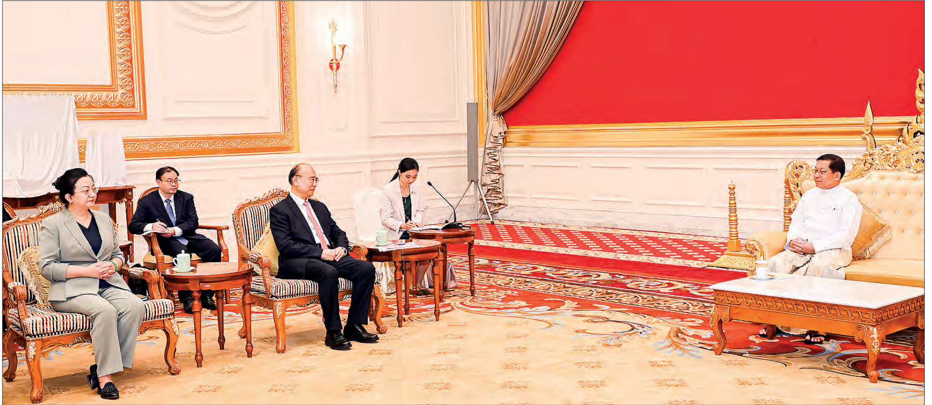
President U Min Aung Hlaing receives the delegation led by Mr Xu Qin, Chairman of the Standing Committee of the Heilongjiang Provincial People's Congress and Secretary of the CPC Heilongjiang Provincial Committee of the People's Republic of China.