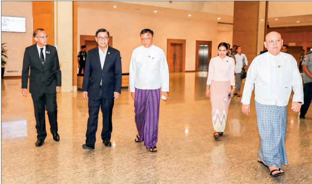
Deputy Prime Minister and Minister of Foreign Affairs of Thailand Mr Sihasak Phuanketkeow is seen upon his arrival in Nay Pyi Taw yesterday.

MR Sihasak Phuanketkeow, Deputy Prime Minister and Minister of Foreign Affairs of Thailand, accompanied by his delegation, arrived in Nay Pyi