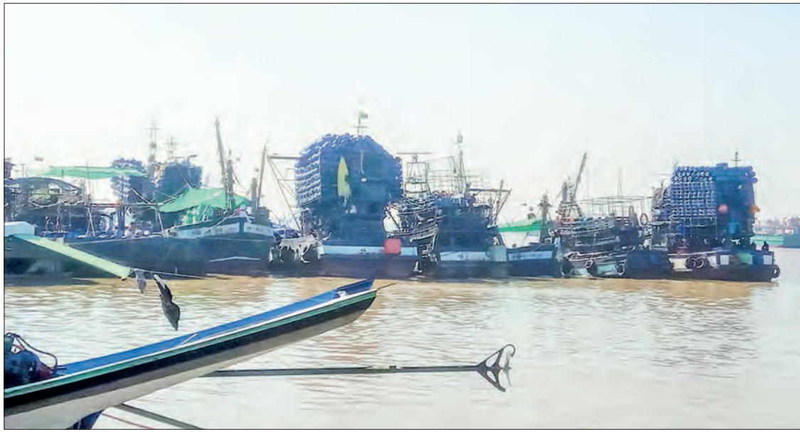
This photo shows fishing vessels docking at the port.

About 80 per cent of marine pollution originates from land-based and coastal activities, including waste disposal such