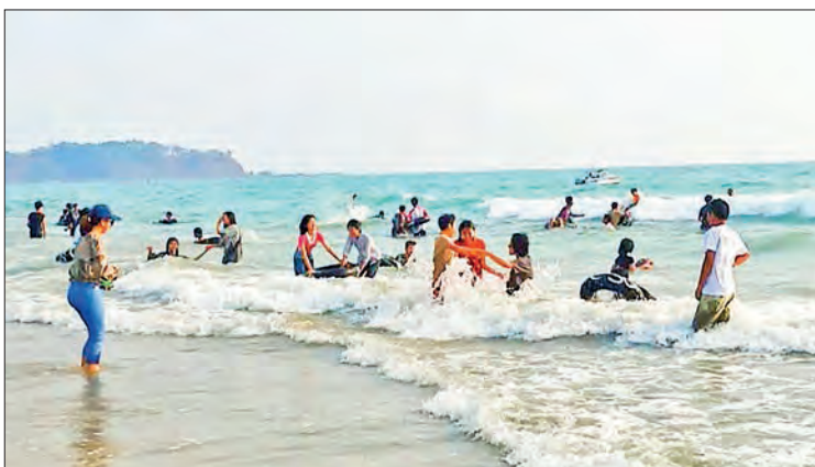
Beachgoers enjoy their time joyfully.

AYEYAWADY Region recorded nearly 700,000 domestic and international visitors during the first three months of 2026, according to the Directorate of Hotels and Tourism.