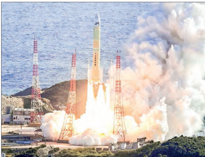
File photo taken on 22 December 2025 shows the eighth H3 rocket lifting off from the Tanegashima Space Centre in Kagoshima Prefecture.

Japan aims to create the seven-orbiter geolocation system to provide highly accurate positioning services vital for smartphones and vehicle navigation without relying on satellites from other countries. — Kyodo