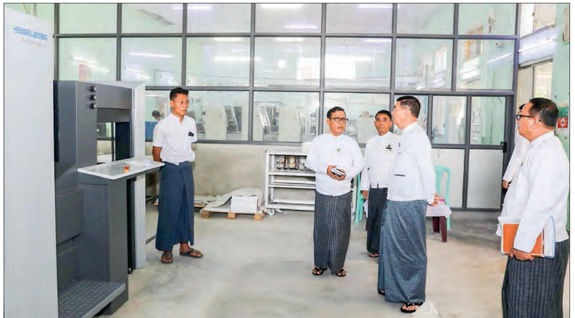
Union Minister U Htein Lin (2R) is pictured during his inspection tours of the Printing and Publishing Department and the News and Periodicals Enterprise.

Deputy Minister U Ye Tint explained the operations of the