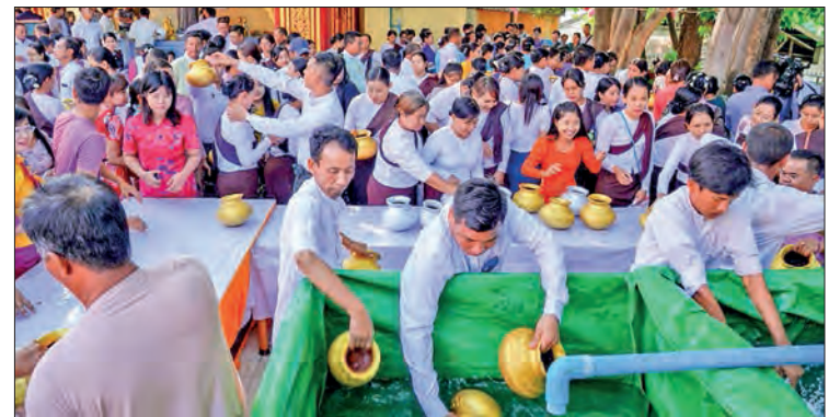
Devotees are seen taking part in a banyan tree watering ceremony last year.