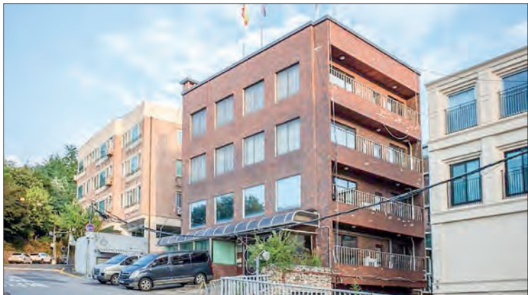
The Myanmar Embassy in Seoul, the Republic of Korea.

Additionally, the embassy noted that it continues to provide necessary assistance and coordination for Myanmar citizens residing in South Korea, including legal migrant workers, scholars, and those visiting for various other reasons, based on reported issues and needs. — MT/ZN