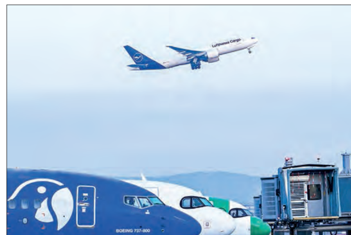
Aircraft by German airline Lufthansa Cargo takes off at Frankfurt Airport (FRA) as a Boeing 737-800 is parked at Frankfurt Airport (FRA) in Frankfurt am Main, western Germany on 16 December 2025.

Guidance on passenger rights and public service obligations are also planned. — AFP