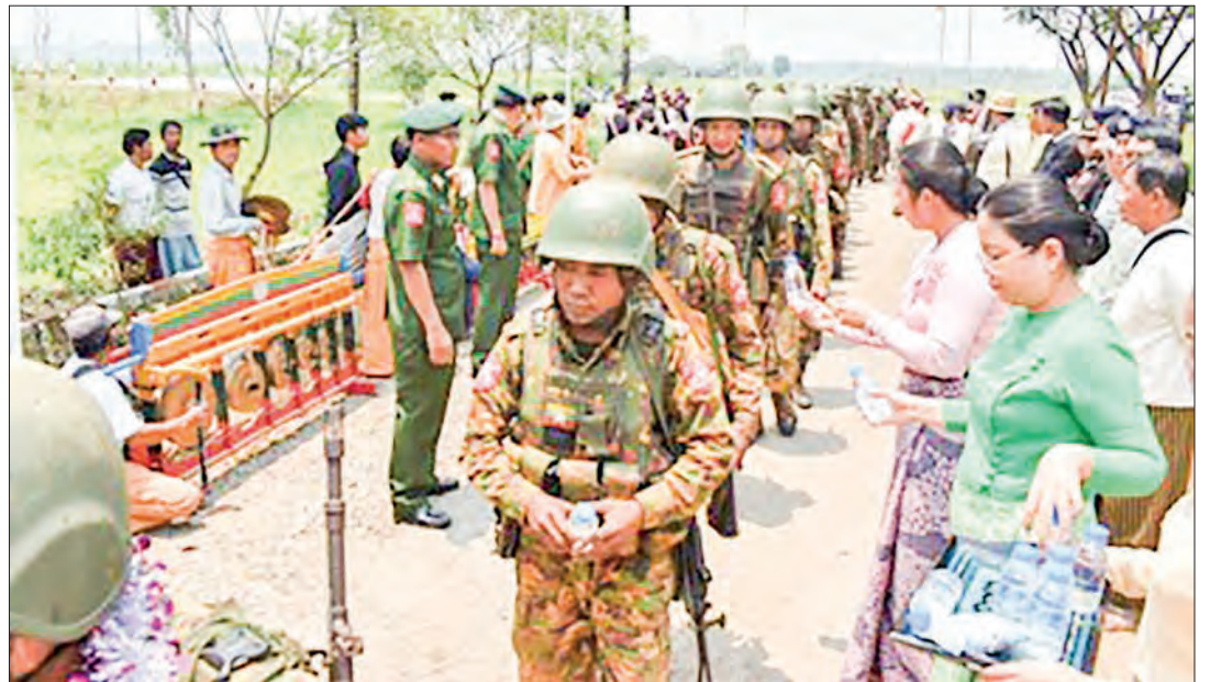
Tatmadaw's triumphant troops are pictured being warmly welcomed in Monghsat, eastern Shan State.

During the ceremony, the deputy commander delivered a congratulatory speech and presented honorary cash awards to the returning personnel. Then, the Deputy Commander and officials had lunch together with victorious troops.