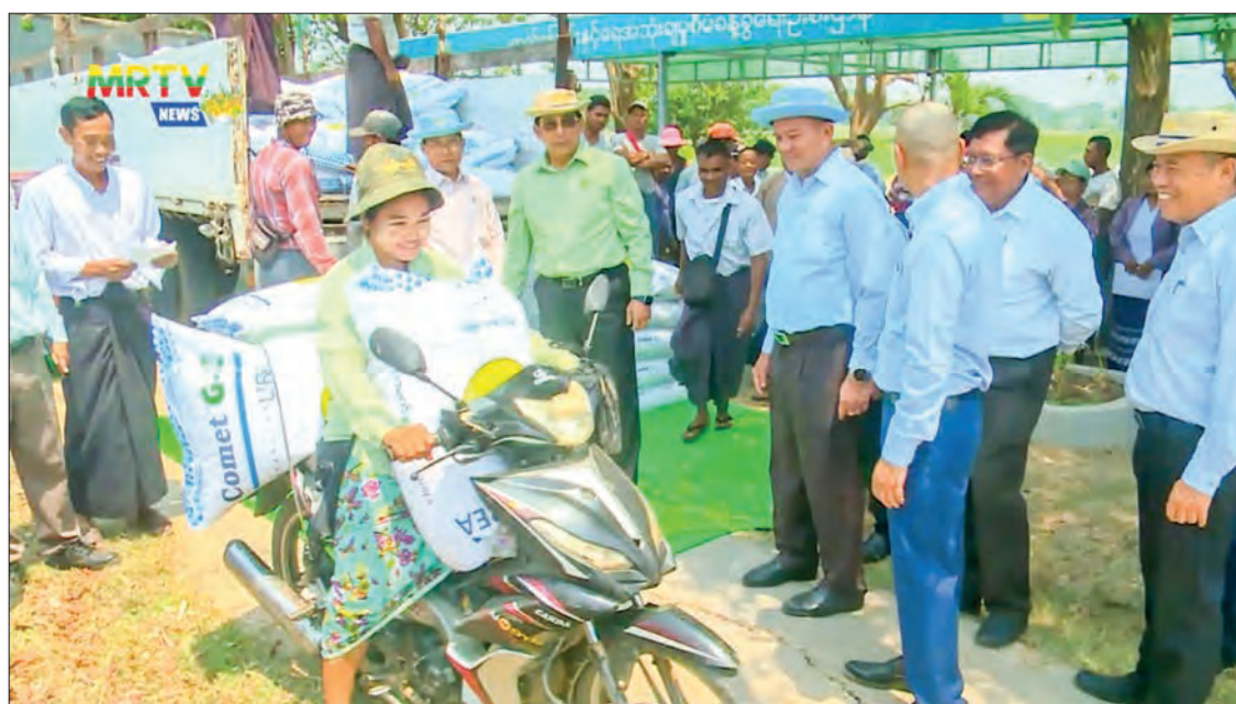
Officials oversee the distribution of fertilizers.

Currently, the first batch of fertilizers covering 30 per cent of the remaining summer paddy cultivation areas in the regions and states has been sold at a special discounted price, based on the recommendations of the respective region and state governments following field inspections. It is also reported that efforts are underway to supply the fertilizers required for the remaining