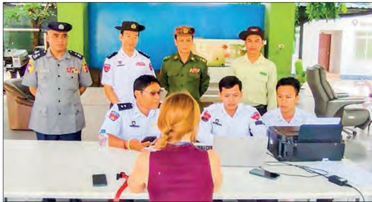
Immigration process is underway for the deportation of foreign immigrants.

AUTHORITIES have detained a Russian national linked to online scam operations near Myawady and are processing his deportation, while five foreign nationals face legal action, according to reports.