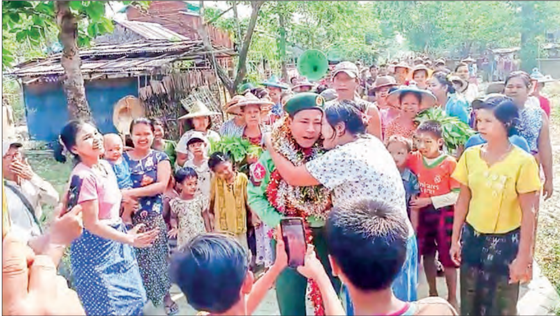
Images show the first batch of People's Military Service graduates receiving a warm welcome from families and residents.

ACCORDING to the 2008 Constitution of the Republic of the Union of Myanmar, it stipulates that every citizen has the duty to safeguard independence, sovereignty and territorial integrity of the Republic of the Union of Myanmar, and the individuals who voluntarily and enthusiastically enlisted for military service have been recruited and trained in batches, and are now serving in various battalions and units.