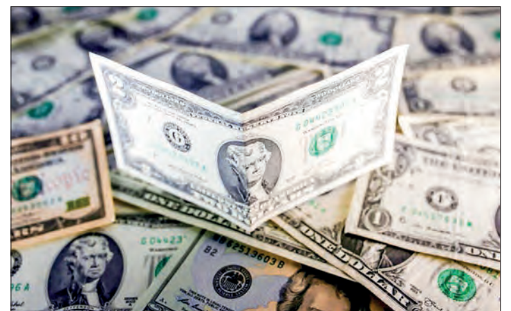
Greenbacks are seen at the money changer counter.

lion to edible oil-importing companies on 7 April.