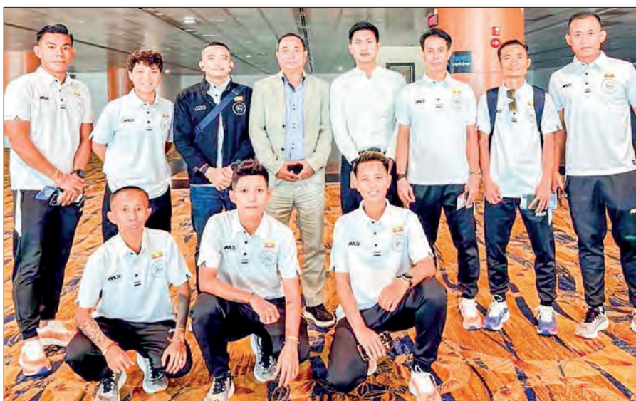
Members and officials of the Myanmar national tagball team are seen before departing for China.

The current squad has been formed by combining experienced players who won two silver and