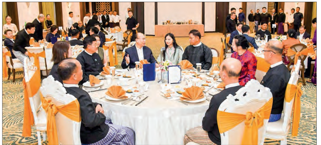
The dinner hosted by the Nay Pyi Taw Council chairman for the Heilongjiang delegation is underway yesterday.