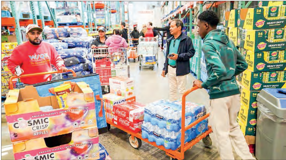
People shop at a supermarket in New York, the United States, on 10 April 2026.

RETAIL sales in the United States soared past expectations in March, government data showed Tuesday, as gasoline prices surged on fallout from war in the Middle East.