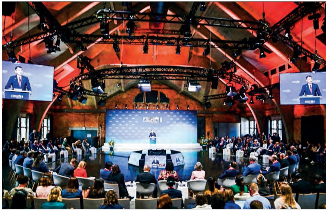
Türkiye's Minister of Environment, Urbanization and Climate Change Murat Kurum addresses delegates at the start of the Petersberg Climate Dialogue (PCD) conference, on 21 April 2026 at the Westhafen Convention Centre (WECC) in Berlin.

Türkiye's climate minister and COP31 president Murat Kurum said the crisis "has shown us, once again, that fossil fuels