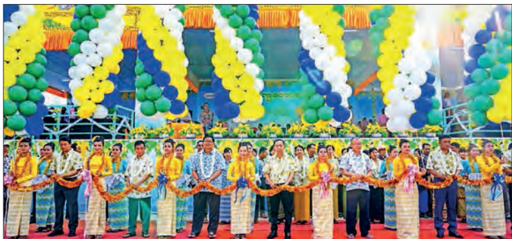
Magway, Magway Region.