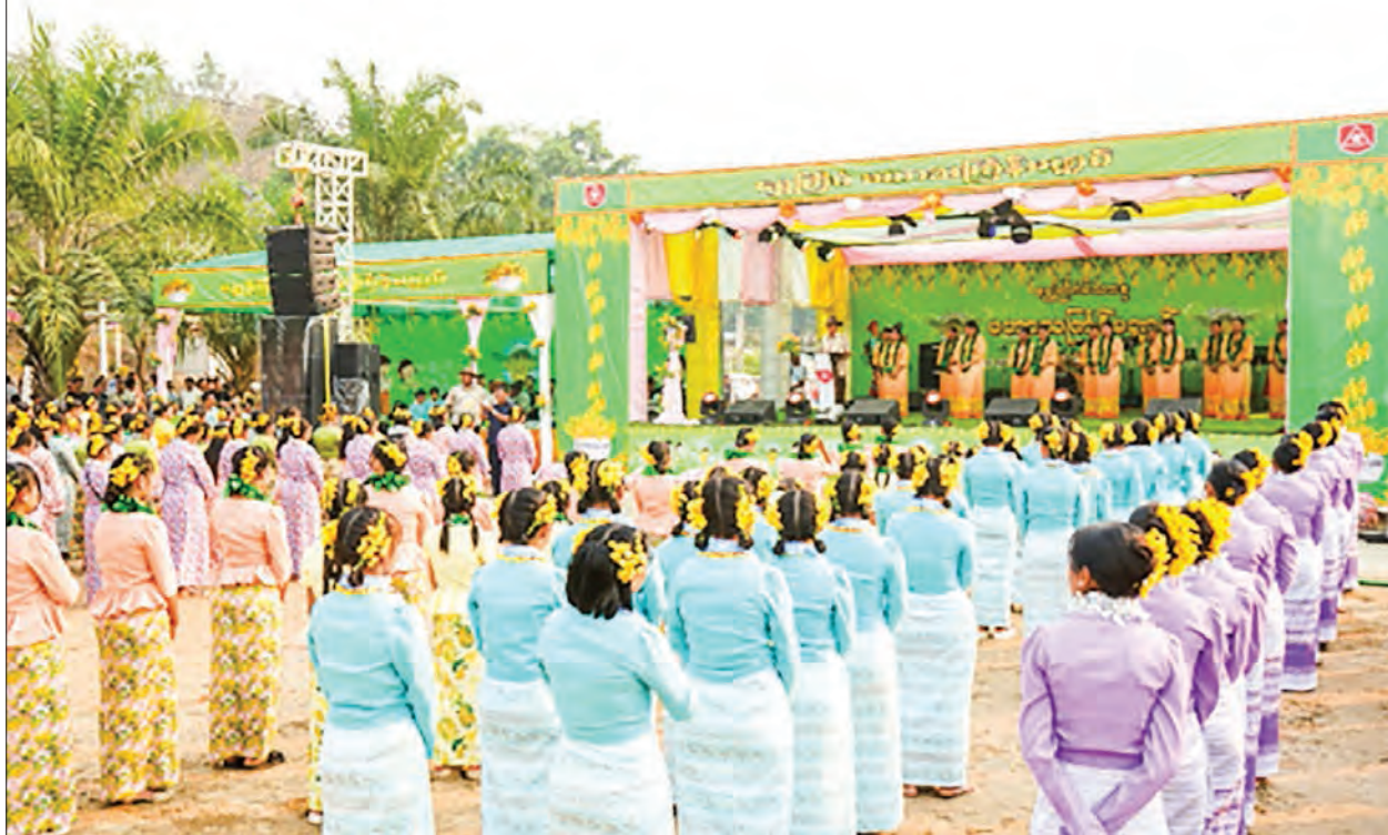
The unveiling ceremony of the Maha Thingyan Pavilion takes place yesterday at the Triangle Region Command.

To mark the transition from the Myanmar calendar year 1387 to 1388, this year's festival is being celebrated as a peaceful and civilized event in keeping with Myanmar's unique style and cultural traditions.