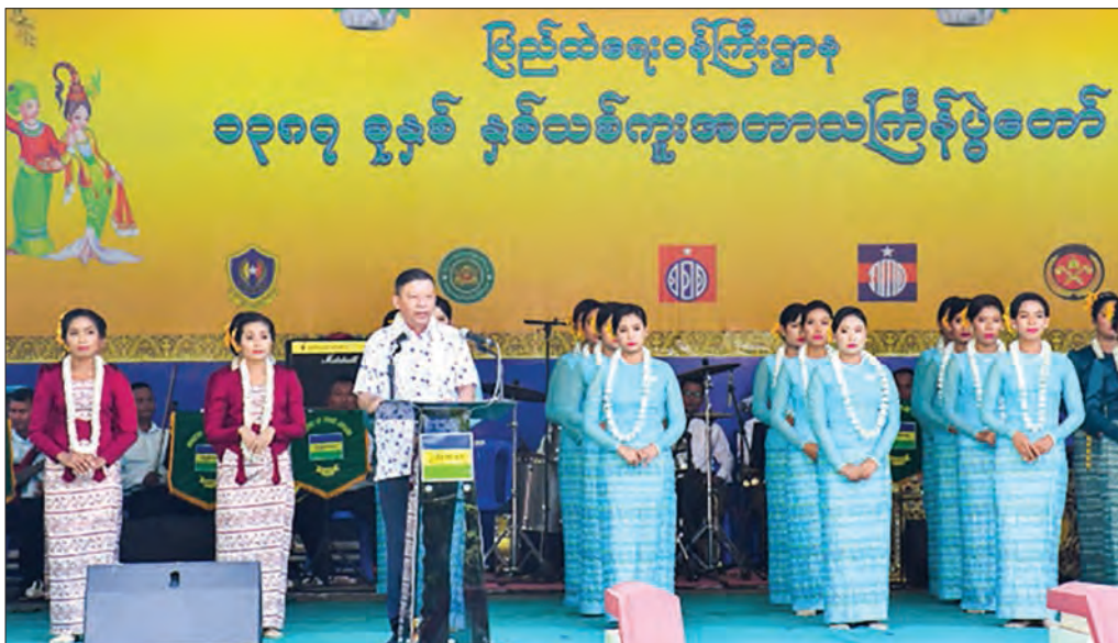
Union Home Affairs Minister Lt-Gen Nyunt Win Swe delivers the opening address at the Ministry's pavilion for the Traditional Myanmar Maha Thingyan Festival.

THE Ministry of Home Affairs celebrated the Maha Thingyan Festival following with Myanmar culture and tradition to mark the transition from the Myanmar calendar year 1387 to 1388.