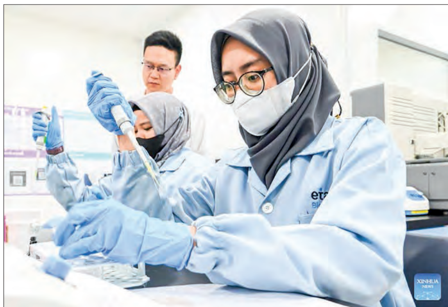
Laboratory staff members of Indonesian biopharmaceutical company Etana work in Jakarta, Indonesia, 10 April 2026.

“Indonesia has nearly 300 million people and more than 17,000 islands, which creates unique challenges in delivering healthcare and vaccines,”