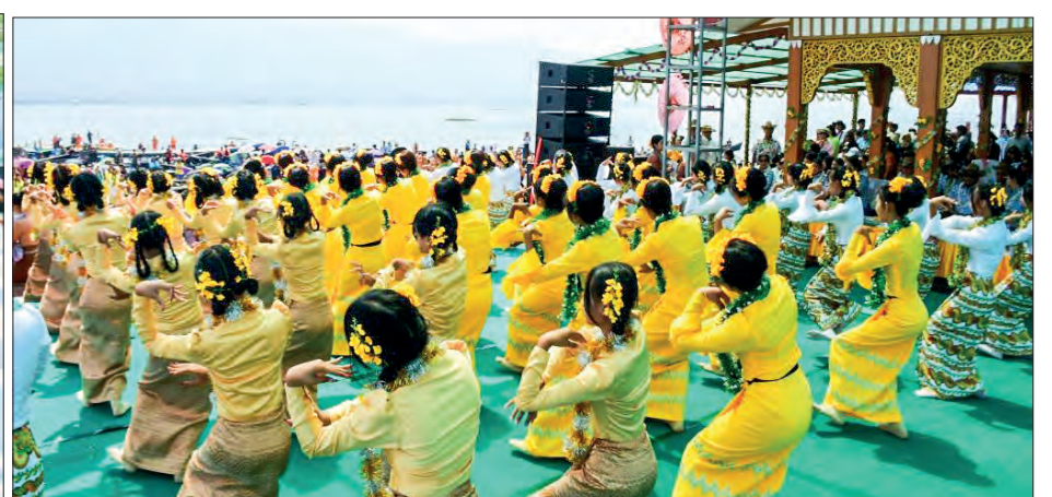
Inlay Lake, Nyaungshwe Township, Shan State.