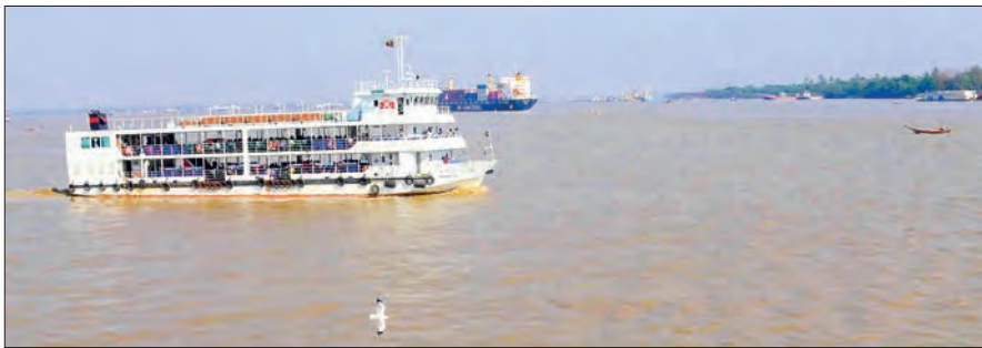
One of the Cherry ferries operating the Yangon (Pansodan-Dala) route on the Yangon River.

well as various parts of the Ayeyawady Region. Additionally, the Yangon (Wartan-Dala) Z-craft ferries transport goods and various motor vehicles, while ferry services are also provided on the Yangon-Khanaungto, Shwelaung-Myaynu, and Wakema-Htawkanwet routes. These services traditionally operate with reduced trips during the annual New Year Thingyan holiday period. — ASH/KNN