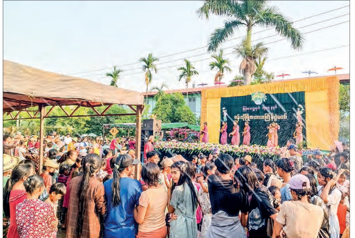
Wuntho, Kawlin District, Sagang Region.