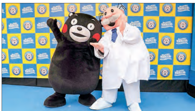
Kumamon (L), the black bear-like mascot of southwestern Japan's Kumamoto Prefecture, and Mexican pharmacy chain's mascot Dr Simi are seen together at a launch event for a pop-up store in Tokyo on 13 April 2026.

Kumamon, the popular black bear-like mascot of southwestern Japan's Ku-