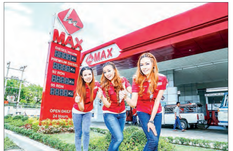
This image highlights a petrol station of Max Energy.

tinue to rise, the Ministry of Health has also made preparations in four major hospitals across the Yangon Region to provide necessary healthcare for patients suffering from heat-related illnesses. — ASH/MKKS