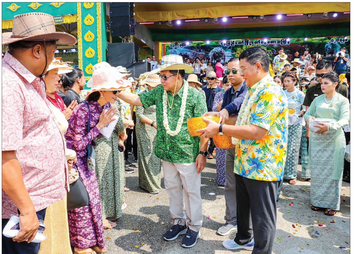
President U Min Aung Hlaing is seen pouring traditional Thingyan water at yesterday's Maha Thingyan celebration in Nay Pyi Taw.

The President and First Lady, alongside attendees, watched the Yain dance performances and then toured and encouraged the Satuditha (charity food) pavilions serving traditional Myanmar foods such as tea leaf (Laphet) and Htamane (glutinous rice delicacy).