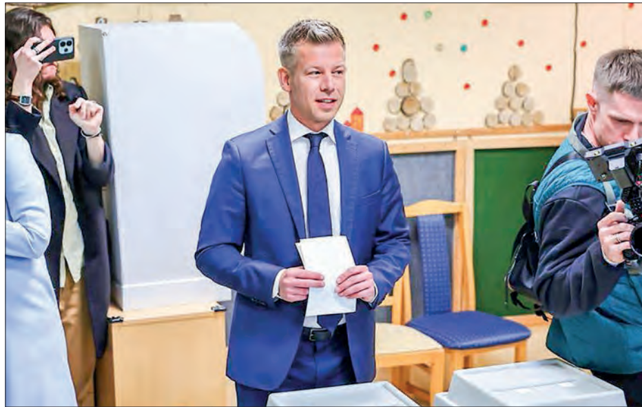
Peter Magyar, leader of Hungary's opposition party Tisza, casts his ballot at a polling station in Budapest, Hungary, 12 April 2026.

On social media, Hungarian President Tamas Sulyok expressed his congratulations to "the winning party of the