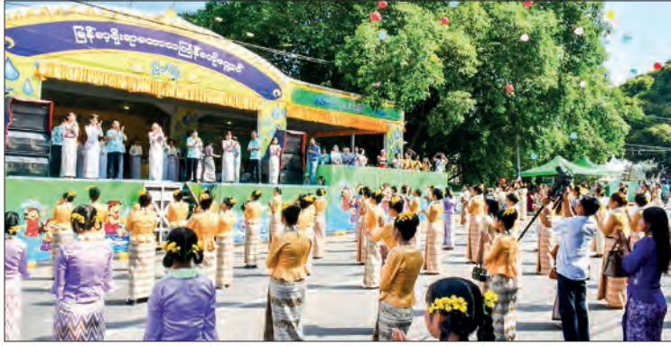
Myeik, Taninthayi Region.