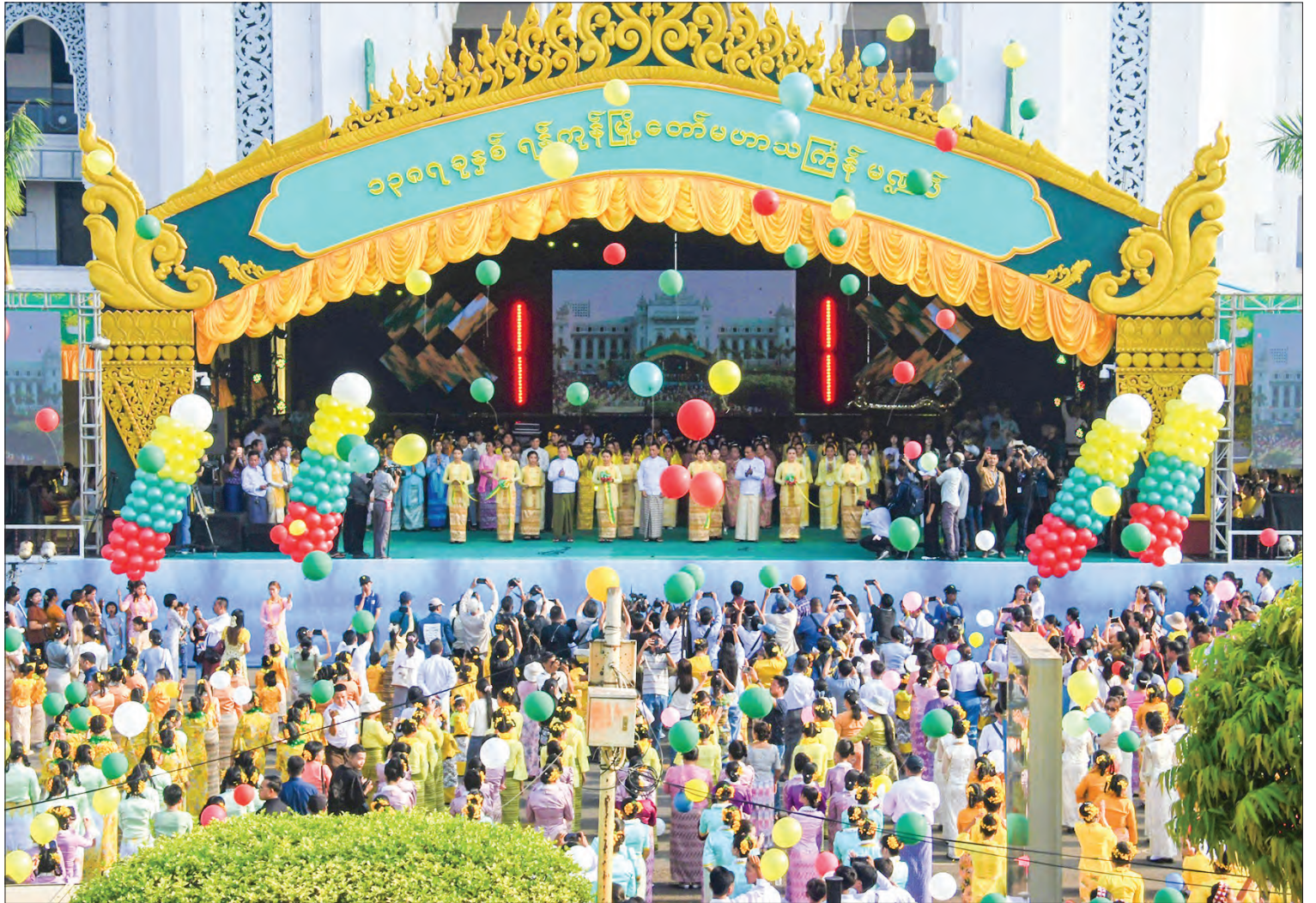
This photo features the launch of the Yangon City Maha Thingyan Pavilion yesterday.

The chief minister and his wife, and the party also attended the opening ceremony of the Walking Thingyan Festival at People's Square in Dagon Township on the same morning.