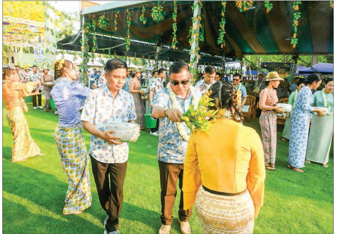
Defence Services Commander-in-Chief General Ye Win Oo sprinkles Thingyan water using Thabyay sprigs (Eugenia) at yesterday's event.

officers from the Office of the Commander-in-Chief (Army) enjoyed the water-throwing festivals at Seinpan, Makyiyeik and Nay Pyi Taw pavilions near