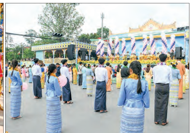
Taunggyi, Shan State (South).