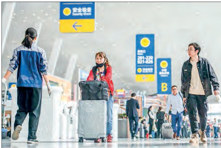
Passengers walk at the Terminal 2 of Wuhan Tianhe International Airport in Wuhan, central China's Hubei Province, 15 April 2024.

he International Airport, the launch filled a gap in direct passenger capacity between Wuhan and Indonesia's core city,