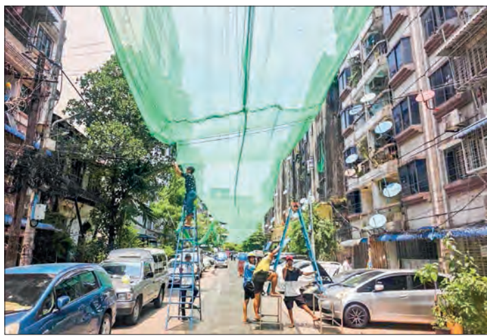
Green shade net canopies are under installation alongside a street in Yangon Region to help reduce the heat.

During the first ten days of April 2026, daytime temperatures in the Yangon Region were about one to two degrees