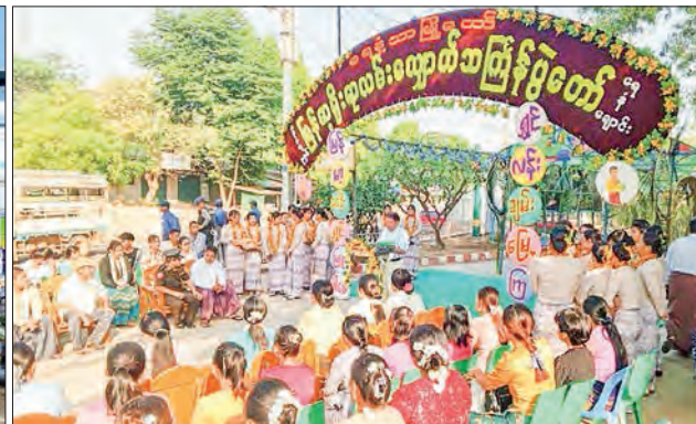
Yenangyoung, Magway Region.