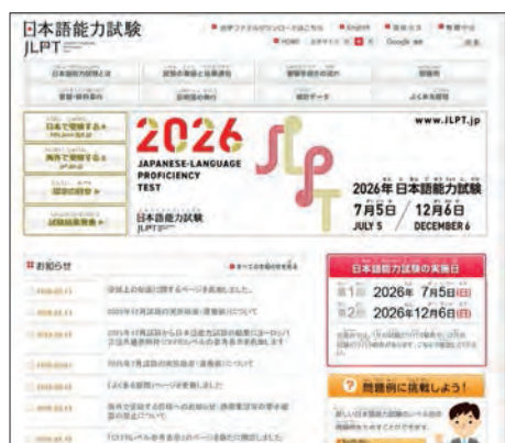
Supplied photo shows notice of the Japanese-Language Proficiency Test. (Screenshot from official website of JLPT) PHOTO: KYODO

With N1 the most advanced and N5 the most basic, N4 measures the ability to follow conversations spoken slowly and read simple Japanese, while N3 reflects practical everyday Japanese, including the ability to follow conversations at near-natural speed and understand common written materials. — Kyodo