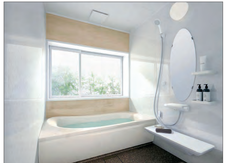
Supplied photo shows a modular bathroom made by Toto Ltd. PHOTO: KYODO

As for major housing equipment manufacturer, Lixil Corp, it noted last Friday about possible "restrictions in production, shipments or orders," due to the potential price hike of petroleum-based materials and aluminium. — Kyodo