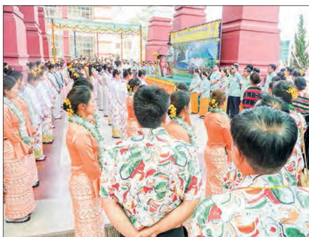
Haka, Chin State.