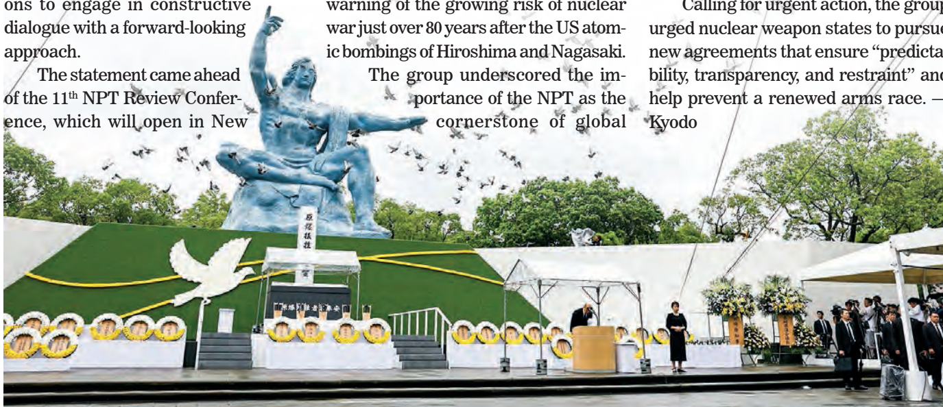
Doves are released during a memorial ceremony held at Peace Park in Nagasaki on 9 August 2025 to mark the 80 th anniversary of the US atomic bombing of the southwestern Japan city in World War II.

Fico affirmed that the bilateral political ties are strong and mutually beneficial, noting Vietnam is Slovakia's largest trading partner in Southeast Asia, while calling for stronger economic and trade collaboration, the report added. — Xinhua