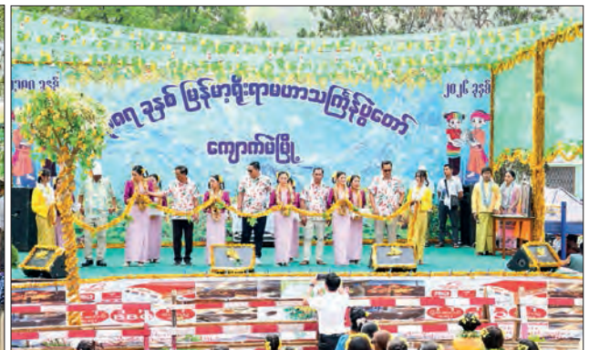
Kyaukme, Shan State (North).