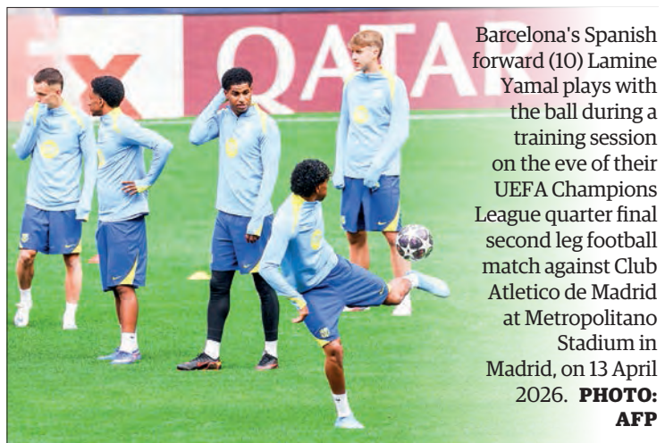
Barcelona's Spanish forward (10) Lamine Yamal plays with the ball during a training session on the eve of their UEFA Champions League quarter final second leg football match against Club Atletico de Madrid at Metropolitan Stadium in Madrid, on 13 April 2026.

Closer to home, winger Neymar shone as Barcelona made the biggest comeback in Champions League history in 2017 against Paris Saint-Germain in the last 16. — AFP