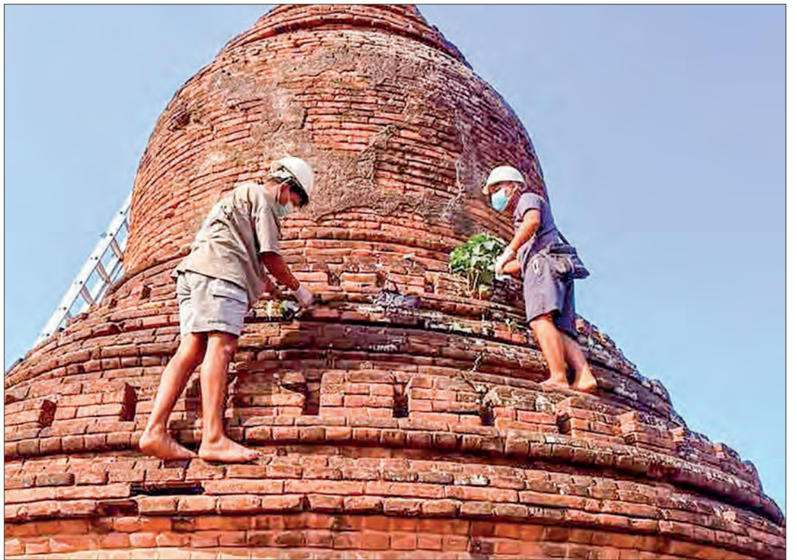
Herbicide treatment is in progress at the four Pyu pagodas north of Thiripyitsaya Ward.

The Bagan Heritage Trust previously conducted similar operations from 26 July to 11 August 2025, during which they successfully treated over 290 plants, including the above-mentioned trees, growing on monuments such as the Taungbi Pitaka