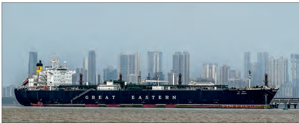
Jag Vasant, an Indian-flagged tanker carrying liquefied petroleum gas (LPG) that transited through the Strait of Hormuz amid the Middle East war, remains docked at an offloading terminal along the coast in Mumbai on 1 April 2026.

ASEAN encouraged the United States and Iran on Monday to press ahead with talks to end the Middle East war and ensure safe passage through the Strait of Hormuz.