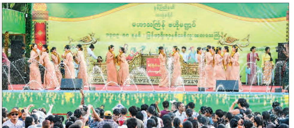
Thaton, Mon State.