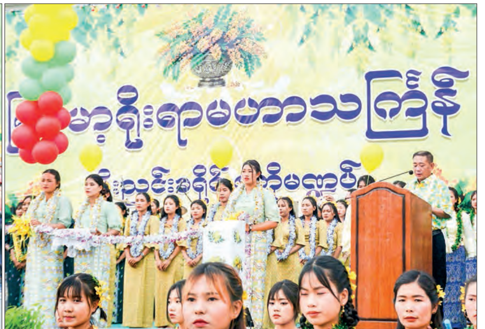
Mohnyin, Kachin State.