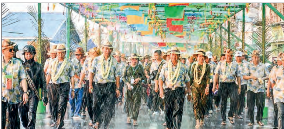
Pathein, Ayeyawady Region.