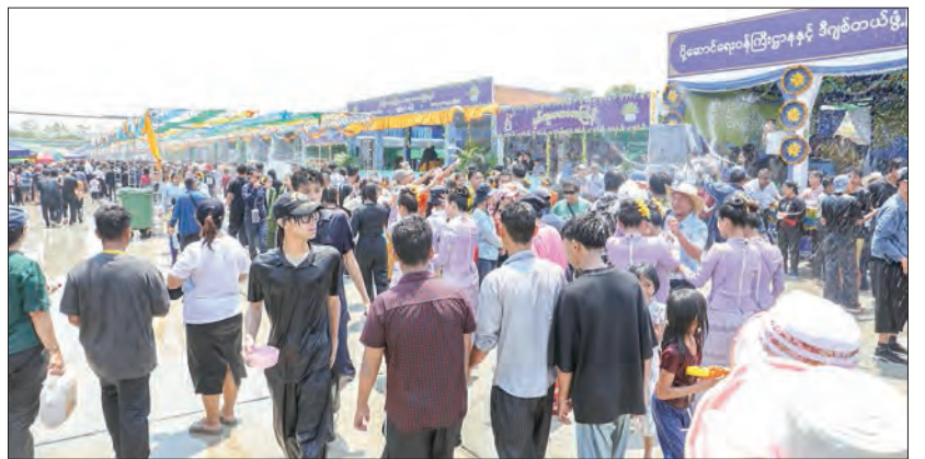
The images show crowds of revellers taking part in the Akyo Day of the Nay Pyi Taw Walking Thingyan celebration yesterday.