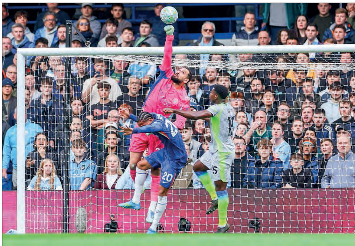
Manchester City's Italian goalkeeper (25) Gianluigi Donnarumma makes a save during the English Premier League football match between Chelsea and Manchester City at Stamford Bridge in London on 12 April 2026.

Nottingham Forest took another point in its battle to avoid relegation with a 1-1 home draw against Aston Villa.