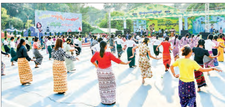
Lashio, Shan State (North).