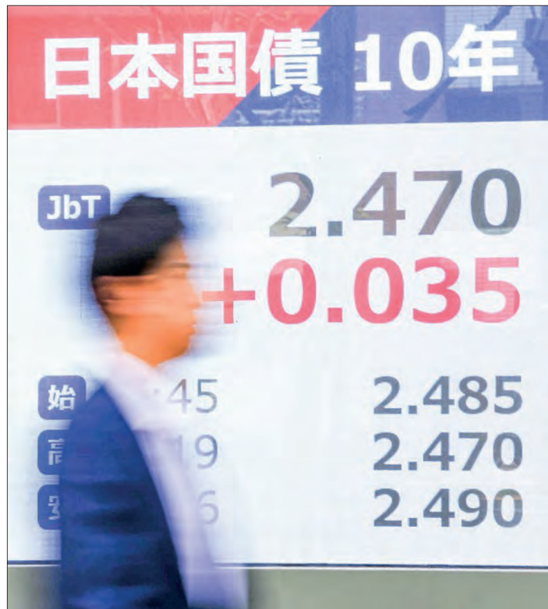
A monitor in Tokyo shows the yield on the benchmark 10-year Japanese government bond briefly rising to 2.490 per cent on 13 April 2026.

TOKYO stocks fell Monday, while the benchmark 10-year Japanese government bond briefly rose to the highest level in over 27 years on Monday, as sentiment was dampened by a surge in crude oil futures after weekend peace talks between the United States and Iran ended without a deal.