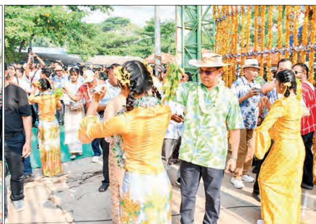
Myawady, Kayin State.