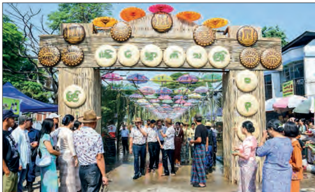
Pyi, Bago Region.