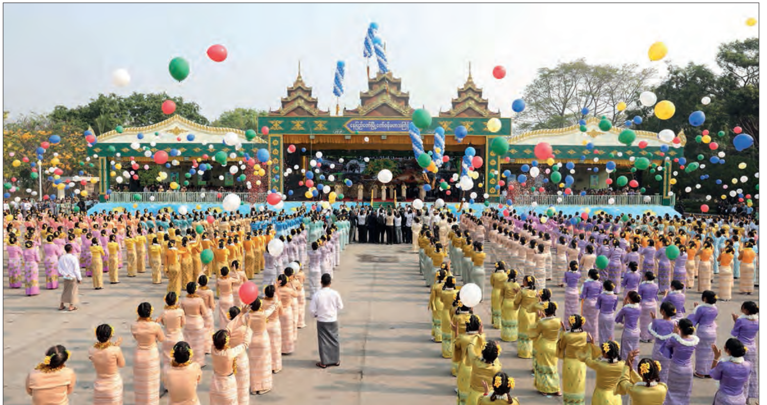
The inauguration ceremony of the Nay Pyi Taw Mayor's Maha Thingyan Festival is underway in a vibrant and cheerful atmosphere.