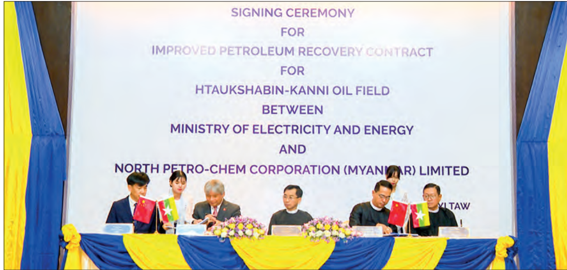
A signing ceremony for the contract between the Ministry of Electricity and Energy and North Petro-Chem Corporation (Myanmar) Limited of China for increased oil production at the Htaukshapin-Kanni oil field in progress in Nay Pyi Taw on 10 April.

In his remarks, the Union Minister stated that it is a matter of great pride for the new government to be able to sign a contract aimed at increasing crude oil production, which is urgently needed for the country and its people at the beginning of a new chapter. He added that increased crude oil production