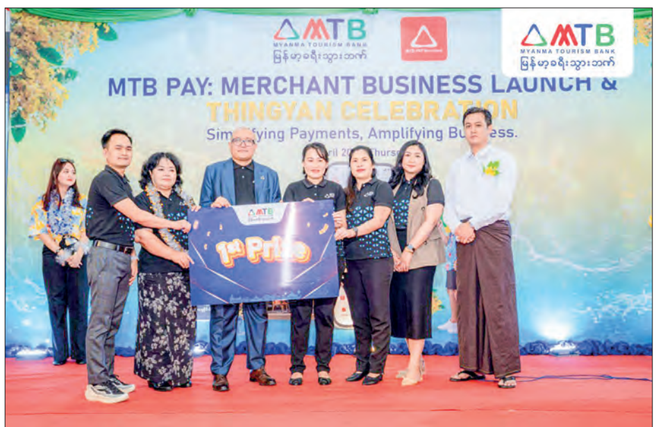
The Myanmar Tourism Bank (MTB) introduces MTB Pay Merchant Solutions.

Users can also conveniently withdraw cash not only at MTB Bank branches but also through nearby super agents, according to MTB. — ASH/KZL