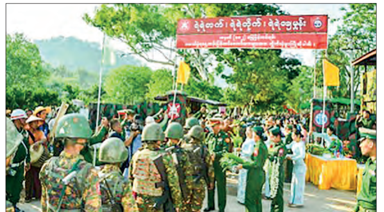
This photo shows victorious troops receiving a warm welcome at the local battalion in Kalaw, Shan State (South).