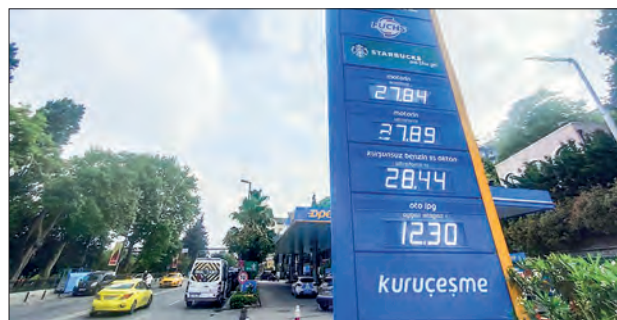
Photo taken on 11 June 2022 shows a price board at a gas station in Istanbul.

JR group companies last revised prices for its Japan Rail Pass in October 2023, when they were hiked by around 70 per cent. The companies said the latest revision reflects fare adjustments made by some of its member companies since then. — Kyodo