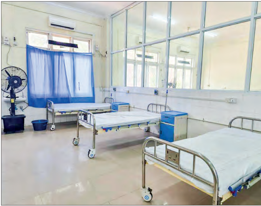
The Yangon General Hospital is seen preparing for heatstroke and fever patients.

THE Yangon General Hospital has made preparations to treat patients with minor fevers during the Thingyan period in Yangon Region, according to its Emergency Department.