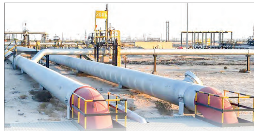
A partial view of Saudi Arabia's Abqaiq oil processing plant on 20 September 2019.

SAUDI Arabia's energy ministry said on Sunday that its key east-west oil pipeline and other facilities had been restored following attacks by Iran on targets across the Gulf.