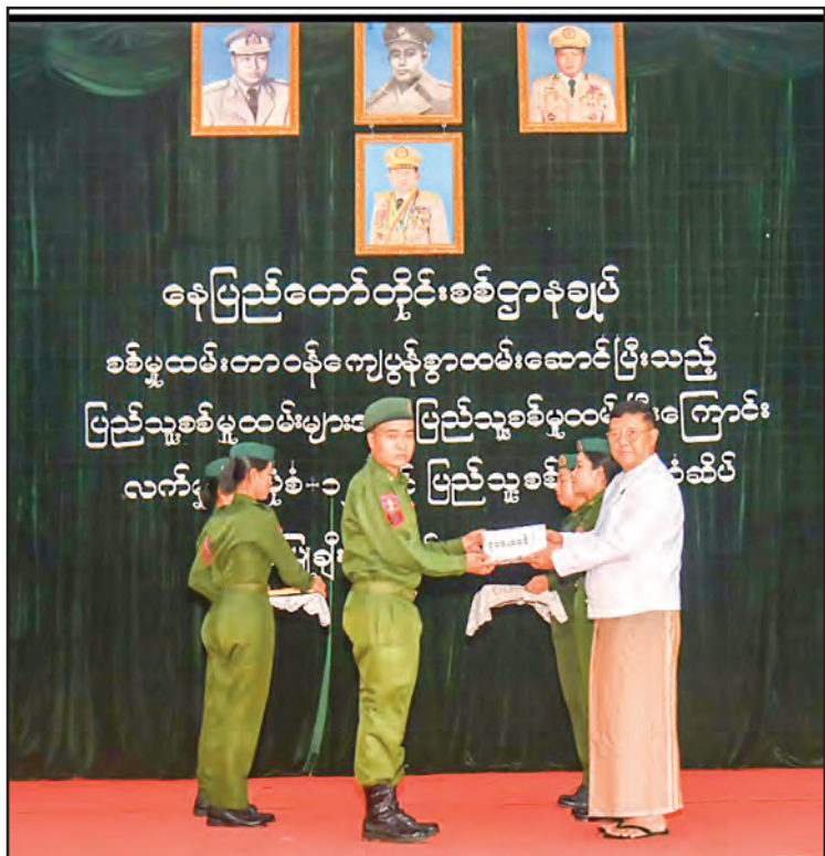
Nay Pyi Taw Council Chairman U Kan Myint Than presents servicemen with certificates of completion, insignia of people's military service, and certificates of honour.

SECTION 385 of the 2008 Constitution of the Republic of the Union of Myanmar stipulates that every citizen has the duty to safeguard independence, sovereignty and territorial integrity of the Republic of the Union of Myanmar.