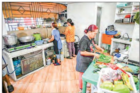
Women cook at a curbside canteen in Manila on 7 April 2026. The rising price of LPG has hit the import-dependent archipelago’s humble street food vendors hard.

Garcia, who begins cooking at 3 am every morning before hauling his stew to a middle-class neighbourhood on a converted motorbike, said an 11 kilo tank of fuel, which typically lasts four days, that once cost 870 pesos (about $14.50) now costs 1,600 pesos. — AFP