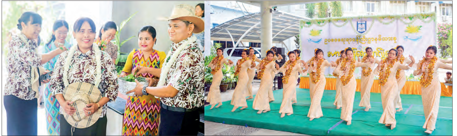
Ministry of Legal Affairs celebrates charity feast and pre Maha Thingyan Festival at the ministry office in Nay Pyi Taw yesterday.

First, Union Minister and Union Attorney-General Dr Thida Oo delivered a New Year message. She stated that the tradition of splashing water symbolizes the cleansing of impurities from the old year, bringing clarity, freshness and coolness to the mind. She expressed her wishes for happiness and good health in the New Year and encouraged all to fulfil their national and family responsibilities with renewed spirit and