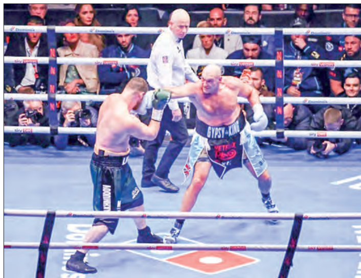
Britain's Tyson Fury (R) throws a jab during his heavyweight bout against Russia's Arslanbek Makhmudov at the Tottenham Hotspur Stadium.

Fury, who had walked out to the tune Blue Moon in honour of the late Ricky Hatton, who died in September, leaned over the ropes and invited Joshua into the ring after the bout. — AFP