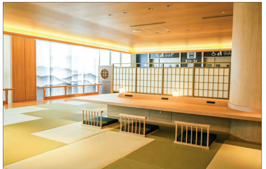
Photo taken on 9 April 2026, shows a tatami mat area where travellers can relax at Narita airport’s Terminal 1 building in Chiba Prefecture.

The tatami space makes up part of the relaxation area, which also offers various types of seating including sofas