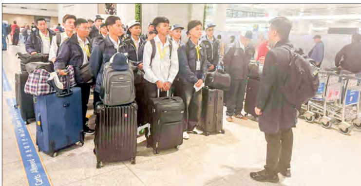
New Myanmar workers arriving at Incheon International Airport on 8 April.

Furthermore, the embassy reported on a Myanmar worker who sustained a hand injury while on the job. The chargé d’affaires connected with the worker via video call to inquire about his medical treatment, encourage and assure him to request assistance whenever needed. The Labour Attaché is currently coordinating efforts to ensure that the injured worker receives all entitled benefits. — MT/ZN