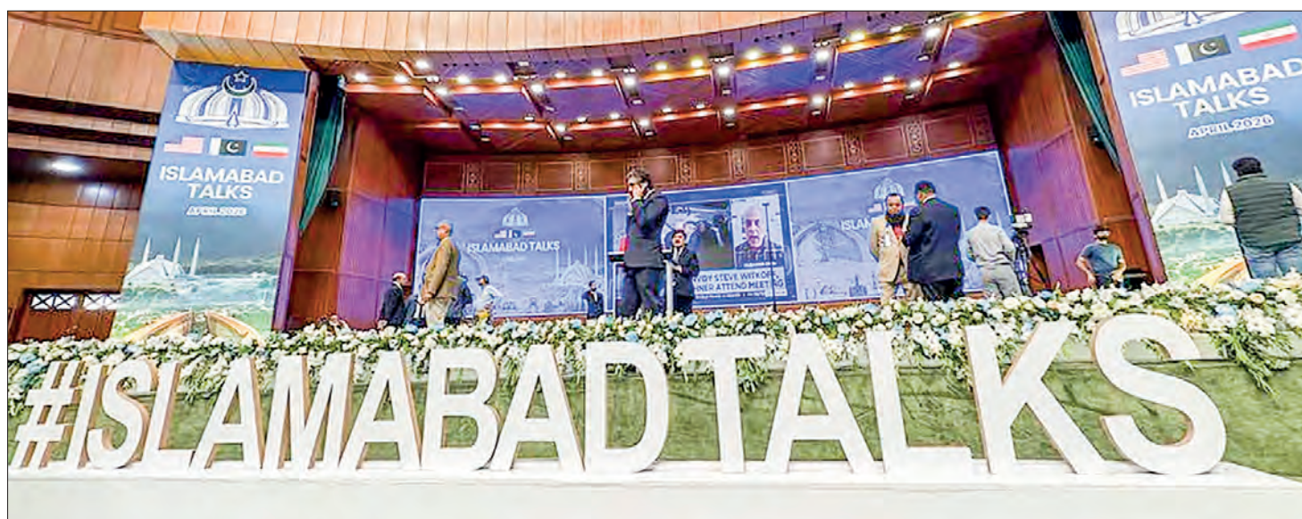
While no deal was agreed, Pakistan remains hopeful that the two sides will continue negotiating.

With a total investment of around 147.37 trillion Vietnamese dong (about US$5.87 billion), the project is slated for completion in 2028, helping cut travel time between Hanoi and Quang Ninh from between 2 and 2.5 hours to between 25 and 30 minutes, while boosting regional connectivity and economic growth, the report added. — Xinhua