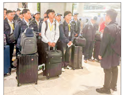
25 Myanmar EPS workers arrive in Seoul in Apr; embassy assists injured workers

More than 350,000 viss of freshwater fish enter Shwe Padauk Fish Market daily, including over 30 varieties such as rohu, carp, butter fish, pomfret, snakehead, catfish, small catfish and seabass. — ASH/KNN