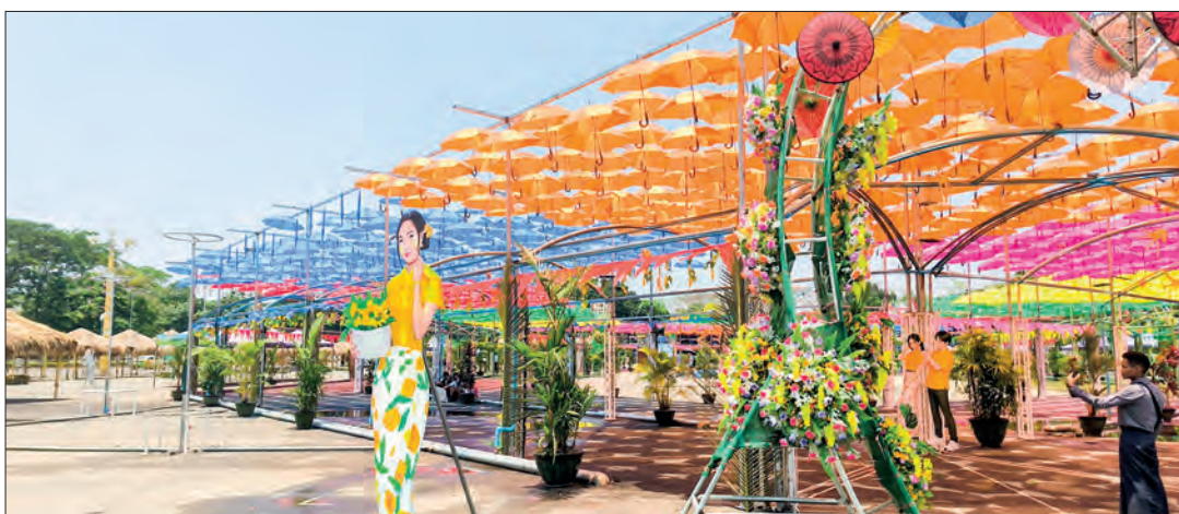
These photos show the pavilions being prepared for walking Thingyan water festival in People's Square.