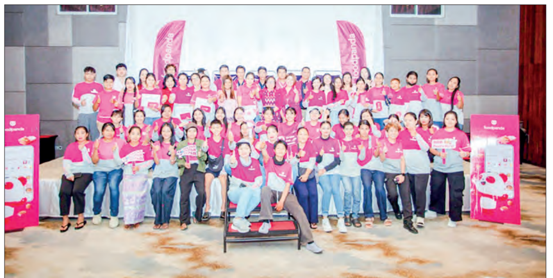
This photo features foodpanda staff and officials at Foodpanda Myanmar’s sixth anniversary celebration.

IN honour of foodpanda Myanmar’s sixth anniversary, a series of events was held to recognize delivery riders, partner businesses, and customers.