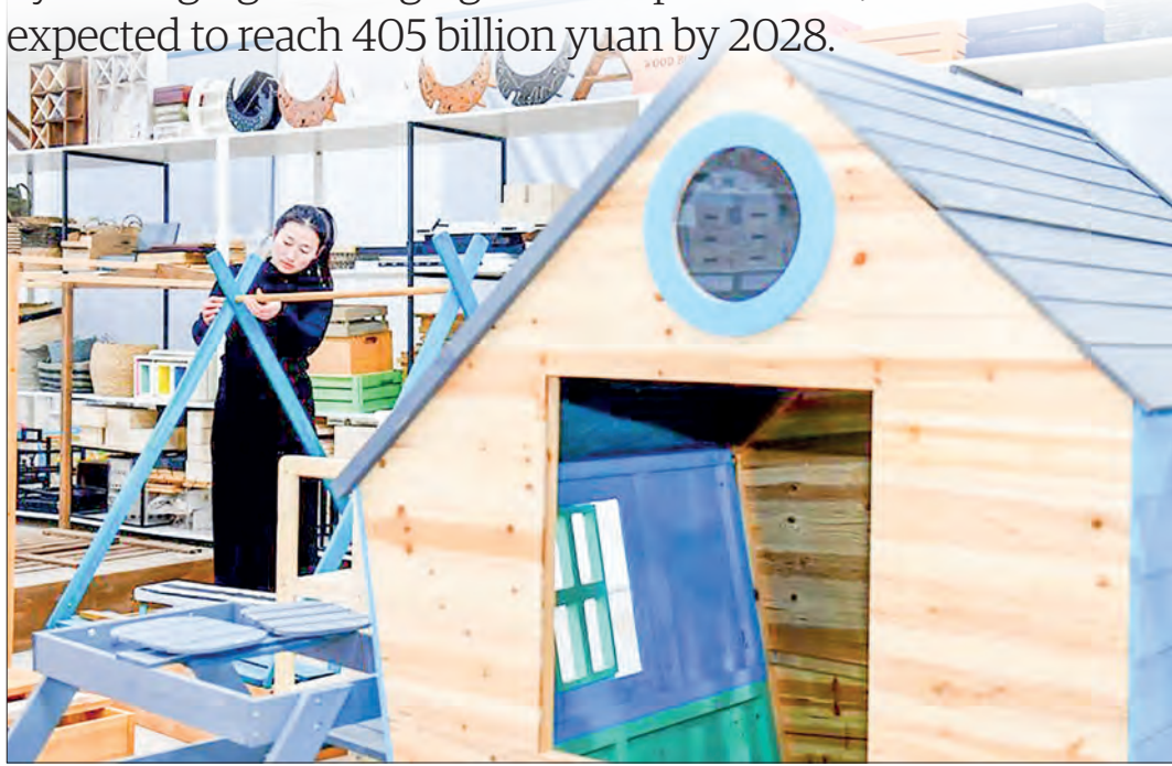
A staff member assembles a pet home at the Caoxian Penghui Crafts Co, Ltd in Caoxian County, east China's Shandong Province, 28 November 2025.

Shuxin Town in Shanghai is transforming its rural economy by leveraging the surging Chinese pet market, which is expected to reach 405 billion yuan by 2028.