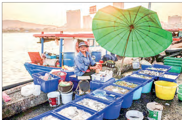
The measures include discounted products and lowered prices on key consumer goods.