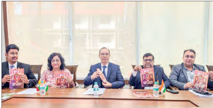
This photo features the MoU signing ceremony between the Indo-Myanmar Chamber of Commerce (IMCC) and the Indian Chamber of International Business (ICIB).

The MoU between IMCC and ICIB was signed with the aim of helping Kolkata-based business associations and entrepreneurs interested in investing in and doing business in Myanmar gain a better understanding of the country's ease of doing business.