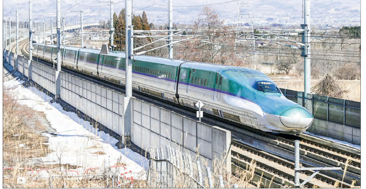
File photo shows Hokkaido shinkansen travelling in Hokuto, Hokkaido, in March 2026.

JR group companies will raise prices for its Japan Rail Pass, a ticket aimed at foreign tourists that allows unlimited travel on trains across Japan, including most shinkansen bullet train services.