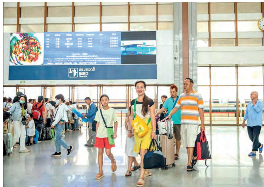
Passengers are seen at the Vientiane Station of the China-Laos Railway in Vientiane, Laos, 13 April 2024. The Lao New Year is the most important festival in the Lao calendar.

The measures aim to lower accident risks during the Lao New Year holiday.