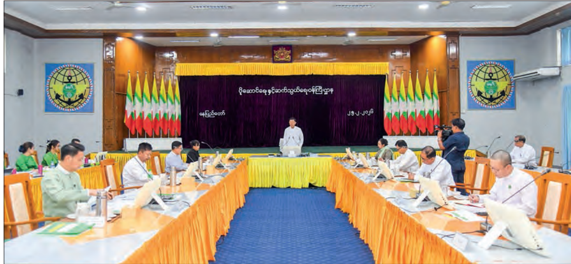
Union Minister U Mya Tun Oo chairs the second meeting of the Myanmar Investment Commission yesterday.

The total investments amounted to US$7.644 million and K557,907.069 million, creating 2,449 job opportunities.