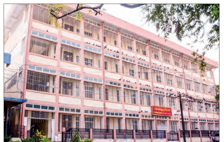
The National Management Degree College of the Ministry of Education.

8 pm on Sundays. Interested individuals can apply for it at the NMDC on the 6 th floor of the main building on Merchant Street, Botahtaung Township, Yangon, by 25 March, along with three licence-sized photos, a copy of a bachelor's, and the citizenship scrutiny card. For enquiries, they can be contacted with the following numbers: 01 8292566, 09 5047519, and 09 5026972, according to the Academic Affairs Department of the NMDC. — NN/KK