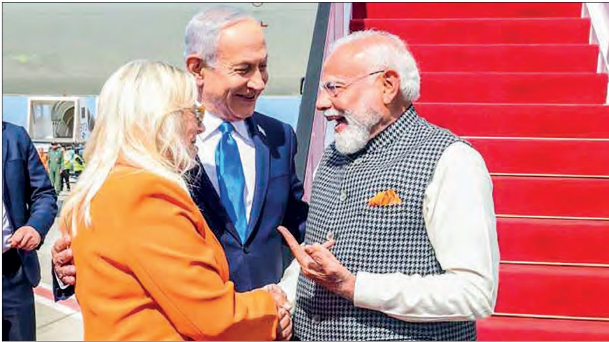
Prime Minister Narendra Modi on Wednesday arrived in Israel for a two-day state visit.

India values Israel as a strategic partner in defence, technology, innovation, agriculture, and science.