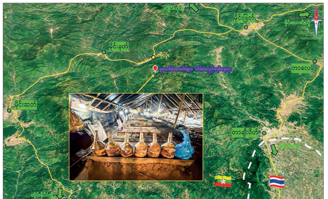
This image illustrates the crackdown location and seized drug production-related

SECURITY forces seized a large quantity of drugs and narcotics-related production materials near Wanlone Village, Monghsat Township, Monghsat District, Eastern Shan State, on 24 February.