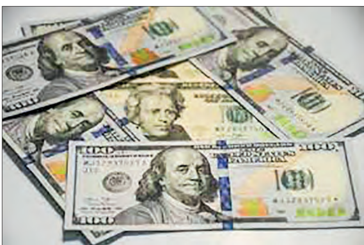
Greenbacks are seen at the money changer counter.

THE Central Bank of Myanmar (CBM) injected 2.1 million baht and US$180,000 into the market on 24 February, in addition to selling over $2.5 million to edible oil-importing companies.