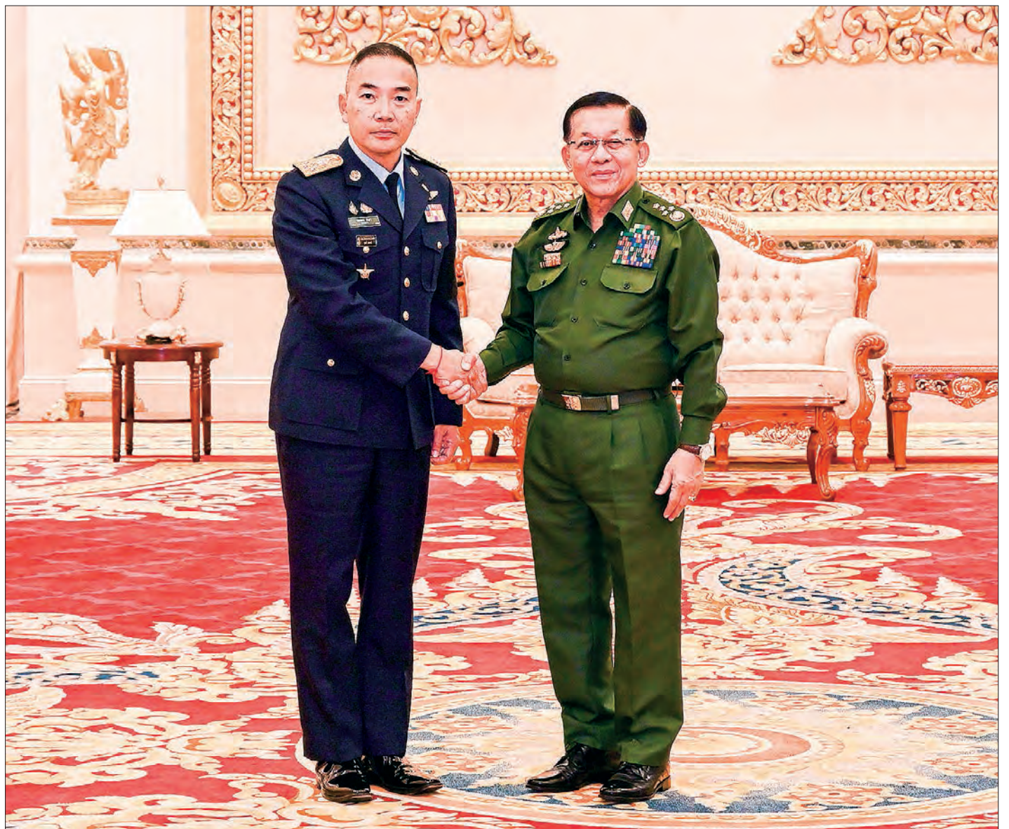
Acting President and State Security and Peace Commission Chairman Senior General Min Aung Hlaing and Royal Thai Air Force Commander-in-Chief Air Chief Marshal Sakesan Kantha exchange handshakes during their meeting in Nay Pyi Taw.

They also exchanged views on the successful holding of the multiparty democratic general election in Myanmar, in which people enthusiastically cast ballots without objection, and on plans to convene the Hluttaw in the near future.