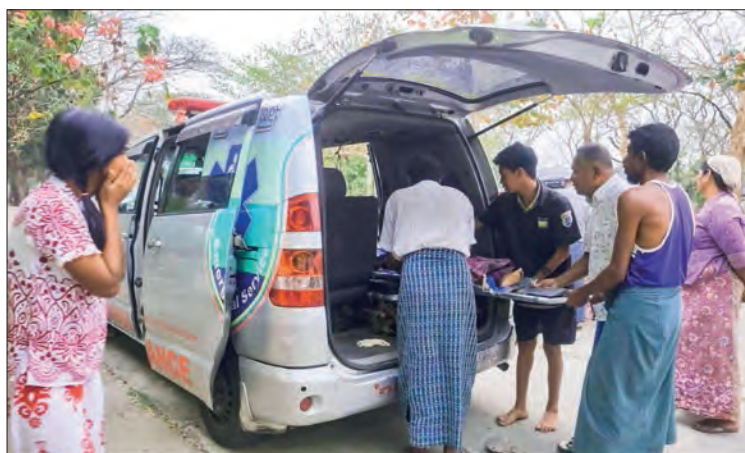
This image shows a social and rescue association carrying the body of the child.

The Kyi Lay Kyi Social and Rescue Association carried the body of the child to the cemetery from the Dala Township Hospital. — MT/ZS