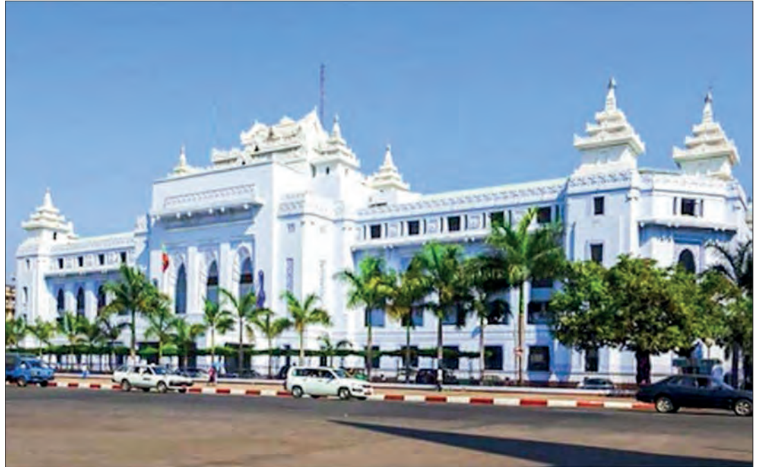
The City Hall – Yangon's prominent landmark – which accommodates the offices of the Yangon City Development Committee (YCDC).

THE Yangon City Development Committee (YCDC) invited interested business entities to compete in bidding for the supply of 50,000 gallons of diesel.