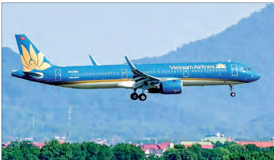
A Vietnam Airlines jet lands at Noi Bai International Airport in Hanoi.