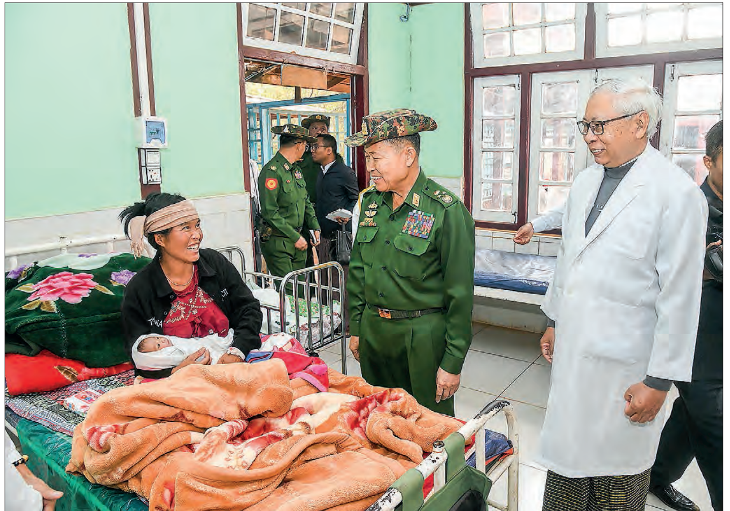
SSPC Vice-Chair, Defence Services Deputy C-in-C, and C-in-C (Army) Vice-Senior General Soe Win offers comfort to patients during his inspection tour of the People's Hospital in Yaksawk.

He observed teaching the students who will sit for the Grade-12 examination to be held in March 2026 at the BEHS 1 in Bahtoo. In a meeting with the school in charge and teachers, the Vice-Senior General heard reports by officials on teaching the students to raise the pass rate, and