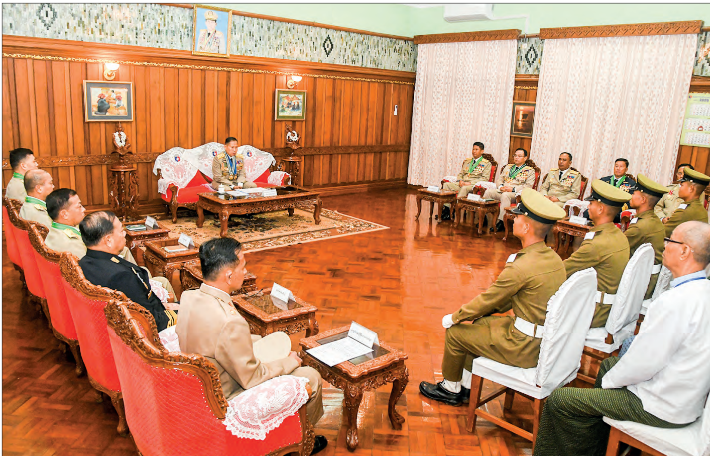
SSPC Vice-Chair, Defence Services Deputy C-in-C and C-in-C (Army) Vice-Senior General Soe Win meets the outstanding award-winning cadets alongside senior Tatmadaw officers at yesterday's passing out ceremony.