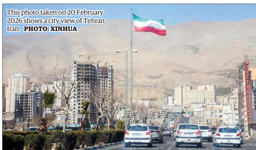
This photo taken on 20 February 2026 shows a city view of Tehran, Iran.

SENIOR Iranian officials on Tuesday stressed Iran's willingness to reach a nuclear deal with the United States, while Washington continues to escalate its military posture in the Middle East, deploying advanced fighter jets.