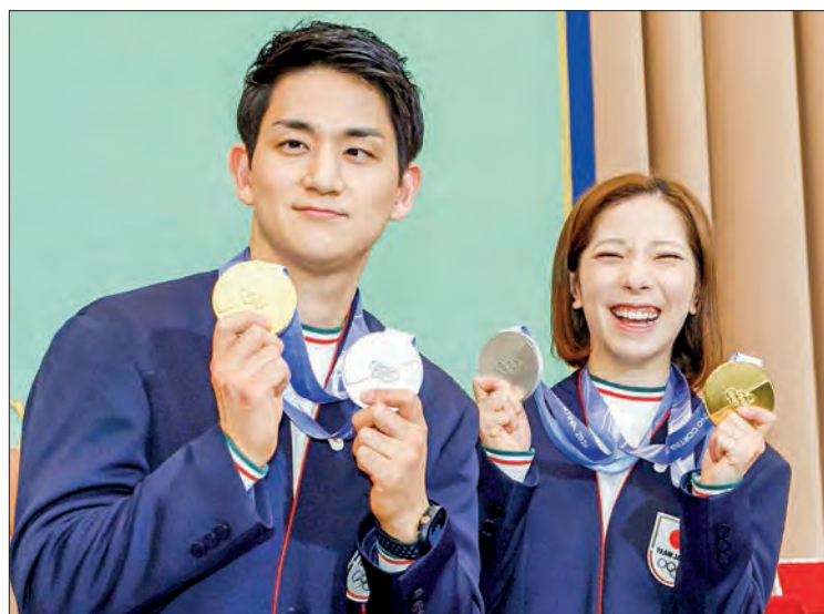
Miura and Kihara embraced resilience, proving perseverance after setbacks led to Olympic gold triumph.

Miura, 24, and Kihara, 33, teamed up in 2019 and are based in Canada. — Kyodo