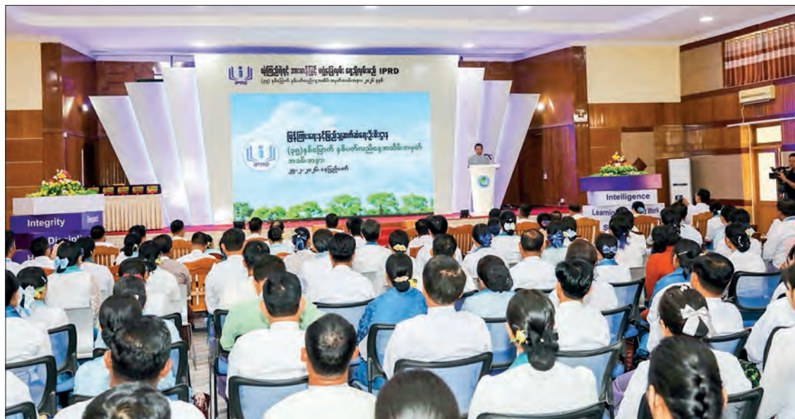
Union Minister U Maung Maung Ohn addresses the 35 th anniversary of the Information and Public Relations Department yesterday.