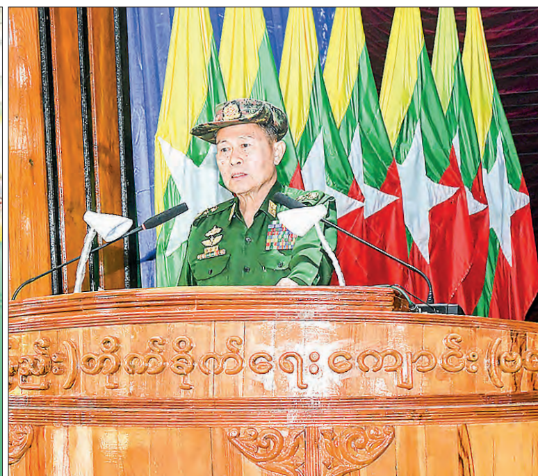
State Security and Peace Commission Vice-Chairman, Defence Services Deputy Commander-in-Chief, and Commander-in-Chief (Army) Vice-Senior General Soe Win meets officers, other ranks, family members, and course instructors in Bahtoo station.