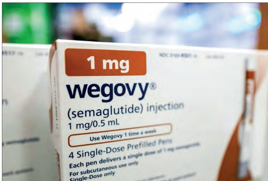
Novo Nordisk said the price reduction is meant to make it possible to reach more patients.

Ozempic and Rybelsus, treatments that each currently come to about $1,000, will also be priced $675. — AFP