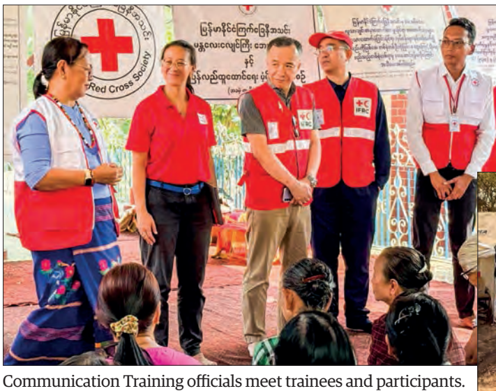
Communication Training officials meet trainees and participants.

and the International Federation of Red Cross and Red Crescent Societies, together with Red Cross volunteers from Mandalay Region, visited the Myanmar Red Cross Society's multi-purpose cash assistance distribution programme for earthquake-affected communities in TadaU and Amarapura Townships, Mandalay Region, on 28 March 2025. They inspected the prepared houses and temporary shelters and assessed the needs of the affected communities. — ASH/MKKS