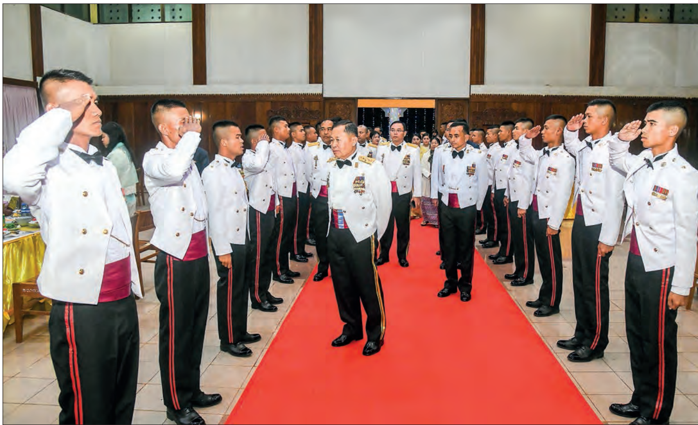
State Security and Peace Commission Vice-Chair, Defence Services Deputy Commander-in-Chief, and Commander-in-Chief (Army) Vice-Senior General Soe Win warmly greets the graduating officers before dinner.

with his team, first warmly greeted the graduating officers before having dinner together.