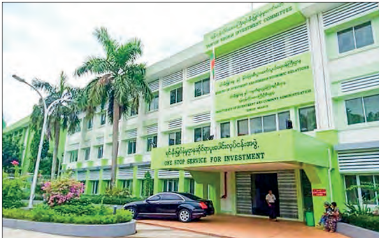
The office building of the One-Stop Service for Investment.

The meeting also delivered capital expansion of two existing businesses and general reports of 13 companies. The regional investment committee has been endorsing investment projects in accordance with rules and regulations under the Myanmar Investment Law to spur investments and create more job opportunities. — NN/KK