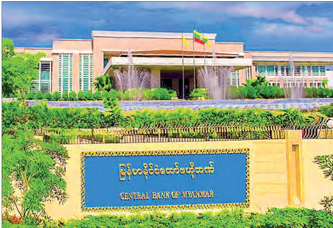
The facade of the Central Bank of Myanmar in Nay Pyi Taw.

CBM announced on 3 February that it would inject $28 million into the fuel import sector. Furthermore, CBM sold over $691,600 to edible oil-importing companies on that day after selling 500,000 baht in the market.