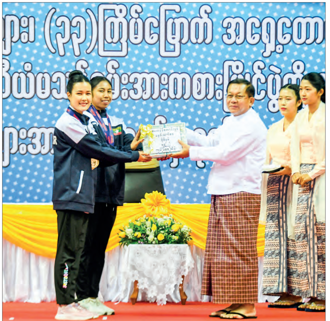
Acting President of the Republic of the Union of Myanmar and State Security and Peace Commission Chairman Senior General Min Aung Hlaing presents cash awards to the winners in the VIII World Vovinam Championships 2025 at the Wunna Theikdi Gymnasium 1 in Nay Pyi Taw yesterday.

In line with the present era of science and artificial intelligence, the Senior General noted that it is necessary to make concerted efforts to emphasize the emergence of sports researchers, including specialists such as sports scientists, sports nutritionists, and sports psychologists. Sports federations have to continue facilitating opportunities for domestic coaches to attend sports training programmes in partner countries, as well as to promote reciprocal participation in bilateral friendship sporting events between the two countries.