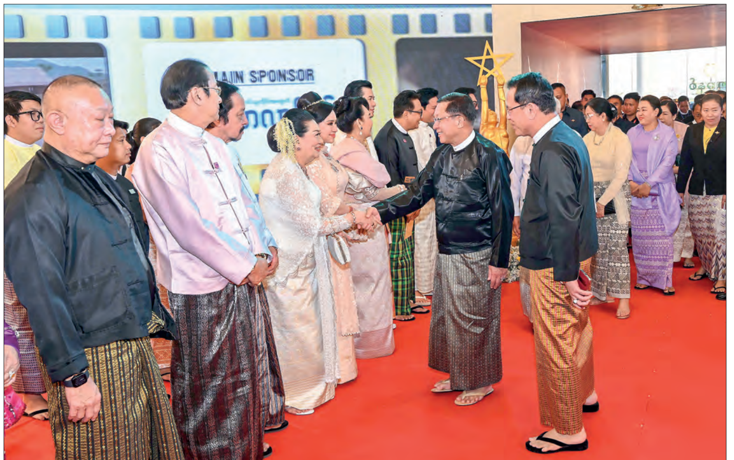
Acting President of the Republic of the Union of Myanmar and State Security and Peace Commission Chairman Senior General Min Aung Hlaing warmly greets attendees to the 2025 Myanmar Academy Awards Ceremony at the Myanmar International Convention Centre I (MICC I) in Nay Pyi Taw yesterday.

Filmmakers and artistes are responsible not only for entertaining the public but also for using their works to promote national spirit, ethnic and national pride, the advancement of public knowledge, and the realization of the State's objectives.