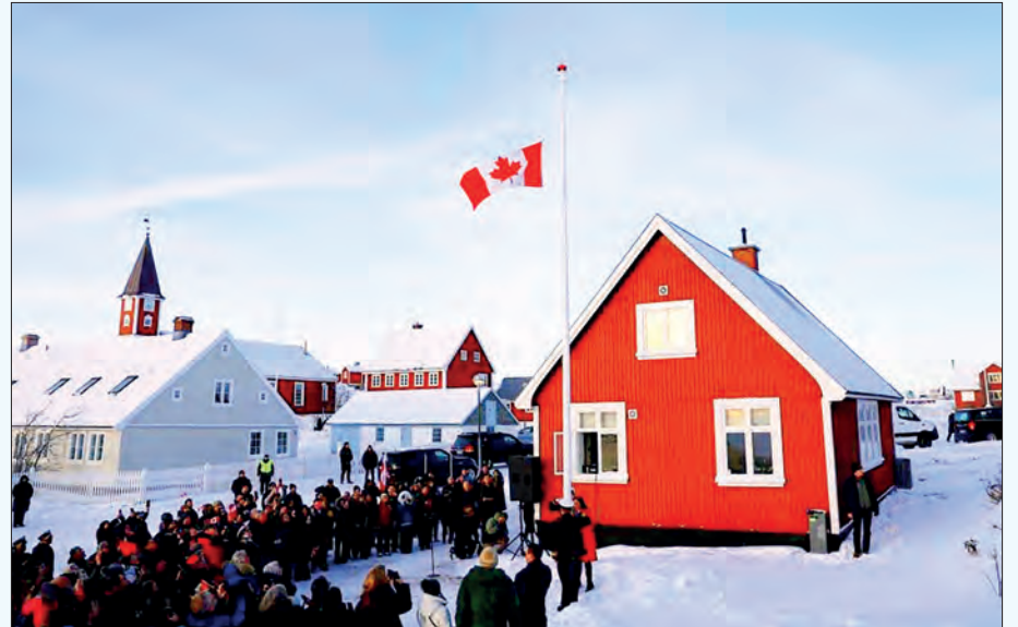
People raise Canadian flag during the opening ceremony of Canada's new consulate in Nuuk, the capital of Greenland, Denmark, 6 February 2026.

It's a victory for Greenlanders to see two allies opening diplomatic representations in Nuuk. — AFP