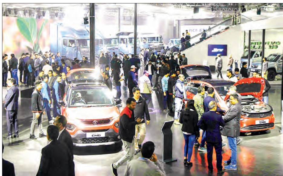
The new India-US Interim Trade Agreement will significantly boost export competitiveness for Indian auto part makers. PHOTO: REPRESENTATIVE IMAGE/ANI

As per the data shared by the ACMA, trade in auto components between India and the United States has continued to expand over the past five financial years, reflecting strengthening industrial ties between the two countries. — ANI