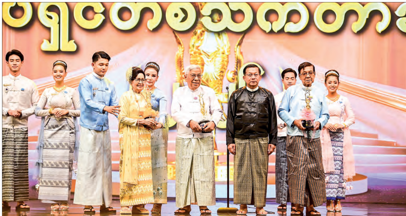
Acting President of the Republic of the Union of Myanmar and State Security and Peace Commission Chairman Senior General Min Aung Hlaing poses for the documentary photo with the winners of the Lifetime Awards for Motion Pictures Achievement for 2025 in Nay Pyi Taw yesterday.

At present, the Government is implementing political, economic, and social policies based on these three core