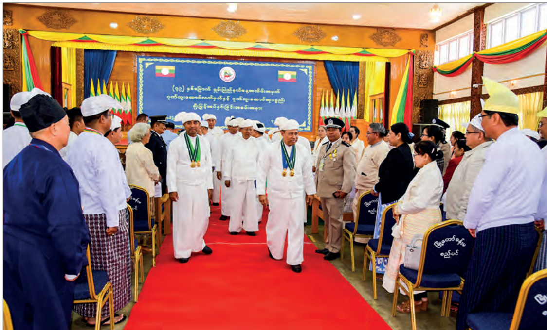
Member of the State Security and Peace Commission and Union Minister Lt-Gen Yar Pyae warmly greets the attendees of the 79 th Shan State Day Ceremony Field in Taunggyi yesterday.

At the ceremony, a message sent by Senior General Thadoe Maha Thray Sithu Thadoe Thiri Thudamma Min Aung Hlaing, Acting President of the Republic of the Union of Myanmar and Chairman of the State Security and Peace Commission, on the 79 th Anniversary of Shan State Day was read out by Member of the State Security and Peace Commission and Union Minister for Border Affairs and for Ethnic Affairs Lt-Gen Thiri Pyanchi Sithu Yar Pyae. The Shan State chief minister, Zeya Kyaw Htin Sithu U Aung Aung, also deliv-