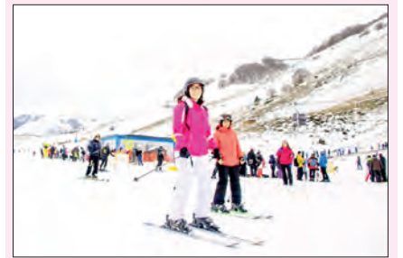
Many Italians experience winter sports in more modest resorts such as Roccaraso.