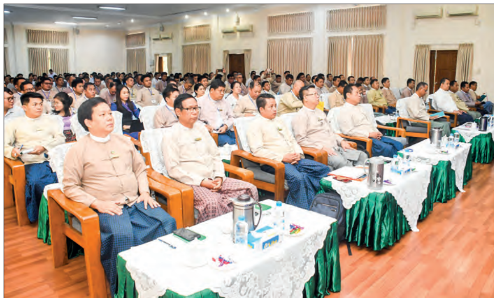
The workshop on upgrading the FDM and DDMS software systems and providing technical support in progress at the meeting hall of the Department of Irrigation and Water Utilization Management in Yankin Township, Yangon, yesterday.

He added that offices now record deed registration and farmland-related data digitally and maintain online data backups from township offices to the