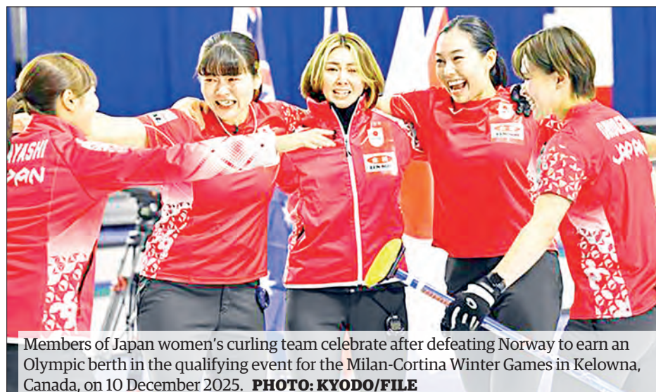
Members of Japan women's curling team celebrate after defeating Norway to earn an Olympic berth in the qualifying event for the Milan-Cortina Winter Games in Kelowna, Canada, on 10 December 2025.

project also applies AI to studying ice conditions, further enhancing strategic preparation and performance. — Kyodo