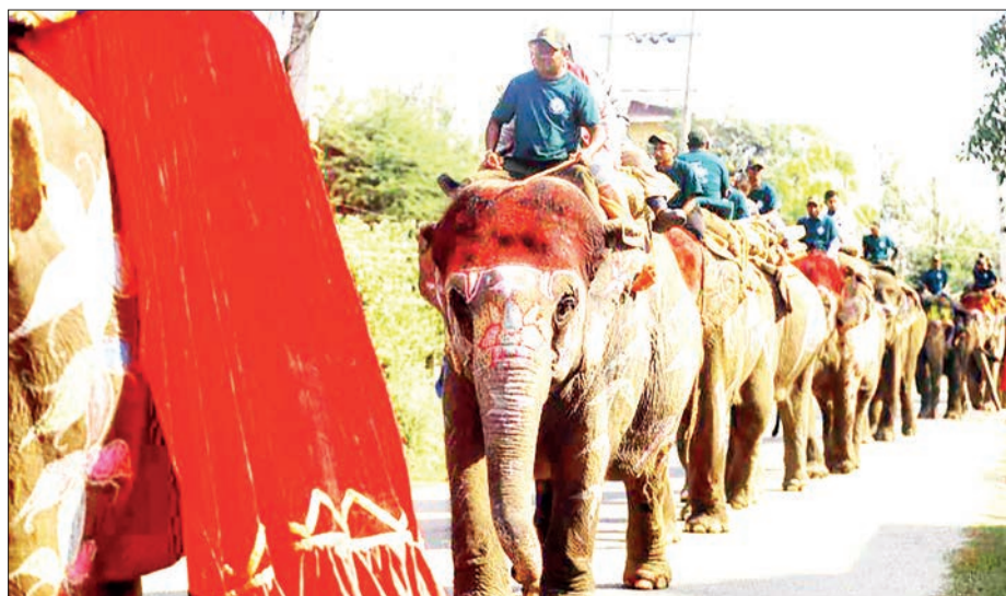
People participate in a rally during the 19th Elephant and Tourism Festival in Chitwan, Nepal, 26 December 2025. The event aims to bring human closer with elephants, encourage wildlife protection and conservation, and promote tourism in the region.

In September, foreign tourist arrivals declined by 18.3 per cent, but the sector recovered over the