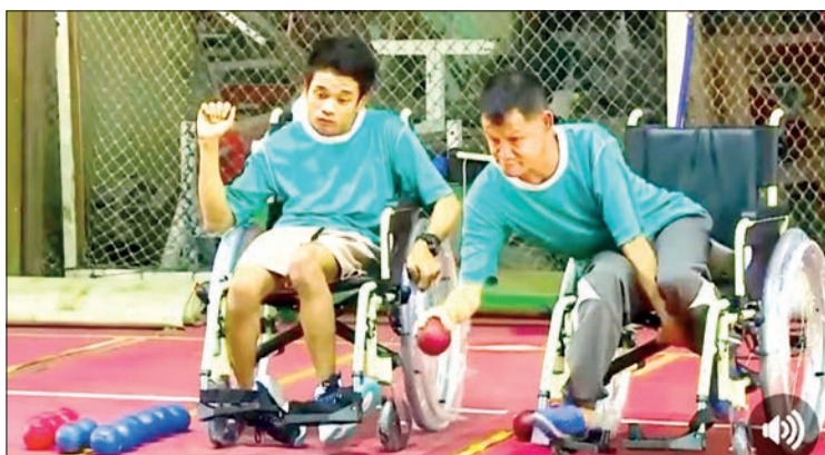
This photo displays para athletes training in boccia.

“We began our training programme on 1 January 2024. We searched for and trained a new generation of athletes. In identifying new athletes, we visited places where people with disabilities could be found. We assessed their physical proportions, age and type of disability