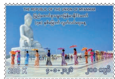
The images illustrate special postage stamps valued at K200.