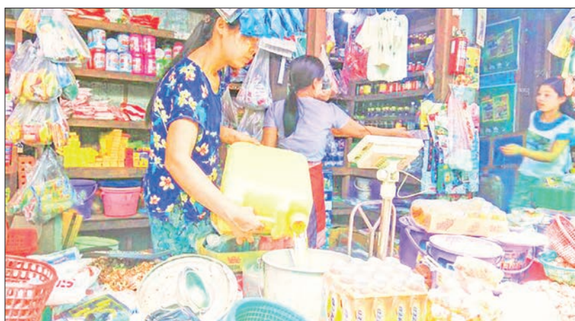
Palm oil is prepared to sell at one grocery shop.

The Committee notified that any person who is involved in price gouging and oil storage to attempt