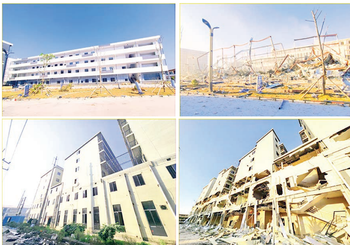
These photos show the illegally constructed six-storey flats (above) and four-storey flats (top) before and after demolition.

buildings in the KK Park area began on 14 December 2025, using machinery and explosive devices. As of today, five additional two-storey buildings have been destroyed, bringing the total number of completely demolished buildings to 91.