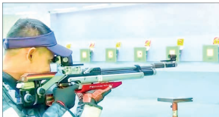
This image captures a para athlete practising shooting.

searching for new candidates. Through this step-by-step process, only about 30 per cent of those initially selected remained from every 100 trainees. From this group, we provided continuous training, combining them with experienced athletes, and conducted intensive training camps. Eventually, the selected athletes underwent approximately eight months of central-