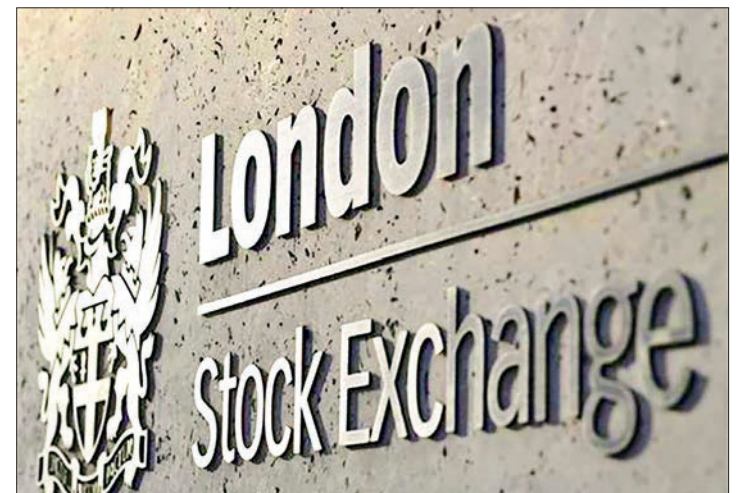
London's benchmark FTSE 100 index reaching 10,000 points for the first time.

"The FTSE 100 hit the 10,000 jackpot level immediately