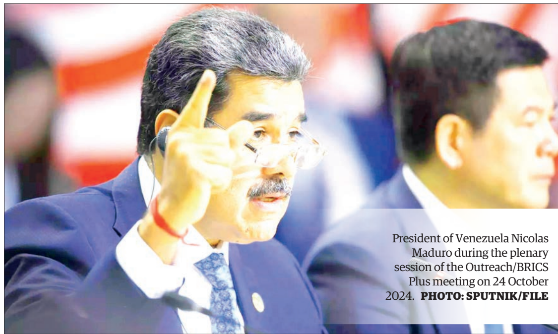
President of Venezuela Nicolas Maduro during the plenary session of the Outreach/BRICS Plus meeting on 24 October 2024.

Since September, President Donald Trump authorized strikes on vessels allegedly linked to drug trafficking off Venezuela’s coasts.