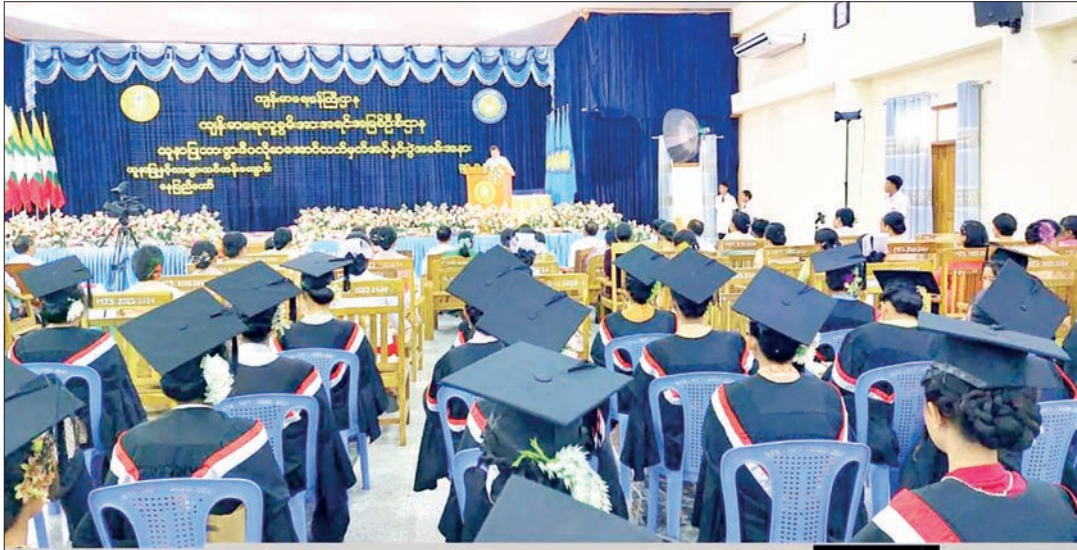
The certificate presentation ceremony for the Nursing and Midwifery Diploma.

ACCORDING to the Ministry of Health, a total of 43,778 Nursing and Midwifery Diploma holders and 42,524 Integrated Midwifery Diploma holders have been produced from 1962 to 2025 academic years.