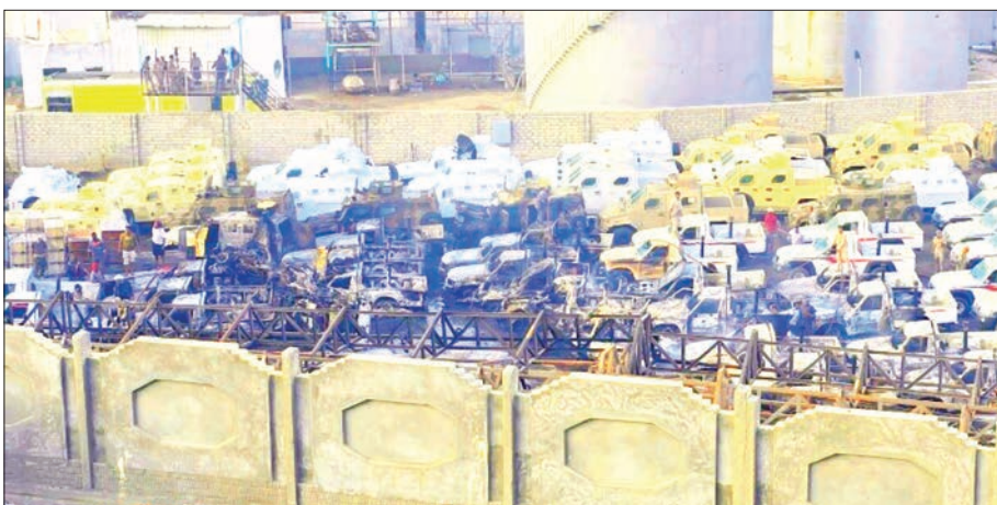
The Saudi strike targeted what Riyadh said were Emirati deliveries of supplies to Yemen’s STC separatists.

opposing factions. The UAE supports the separatist Southern Transitional Council, which recently seized resource-rich provinces, while Saudi Arabia backs the internationally recognized government. Tensions escalated when Saudi forces bombed an alleged Emirati weapons shipment. Analysts argue their approaches are irreconcilable, with Riyadh preferring to preserve state authority and Abu Dhabi more willing to empower non-state actors. In Sudan, the UAE has been accused of arming the Rapid Support Forces, while Saudi Arabia supports the regular army. — AFP