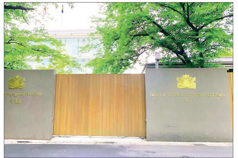
The Myanmar Embassy in Tokyo.

With these documents, parents can come to continue with the passport issuing process at the embassy during office hours, it said. — MT/ZS