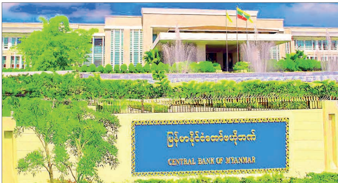
The facade of the Central Bank of Myanmar in Nay Pyi Taw.

CBM sold over $2.3 million to edible oil-importing companies and over $464,000 to fuel oil-importing companies on 29 December.