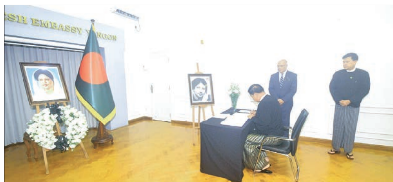
Union Minister U Tin Aung San signs condolence book on the passing of former Bangladeshi Prime Minister Begum Khaleda Zia.

Bangladesh's first female Prime Minister, Begum Khaleda Zia, paid a goodwill visit to Myanmar from 19 to 21 March 2003. She was 80 years old at the time of her death. — MNA/TH