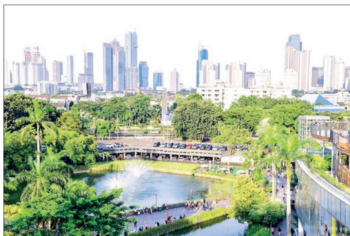
Photo taken on 23 January 2022 shows the cityscape in Jakarta, Indonesia.

Tokyo urban area's population is expected to shrink from 33.4 million in 2025 to 30.7 million in 2050, dropping to seventh in rank as Dhaka takes the top spot with 52.1 million people, followed by