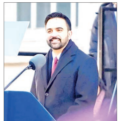
Zohran Mamdani speaks during his inauguration ceremony in New York City, the United States, 1 January 2026.

Zohran Mamdani, a 34 year old Ugandan born Democrat, was sworn in as New York City’s first Muslim mayor.