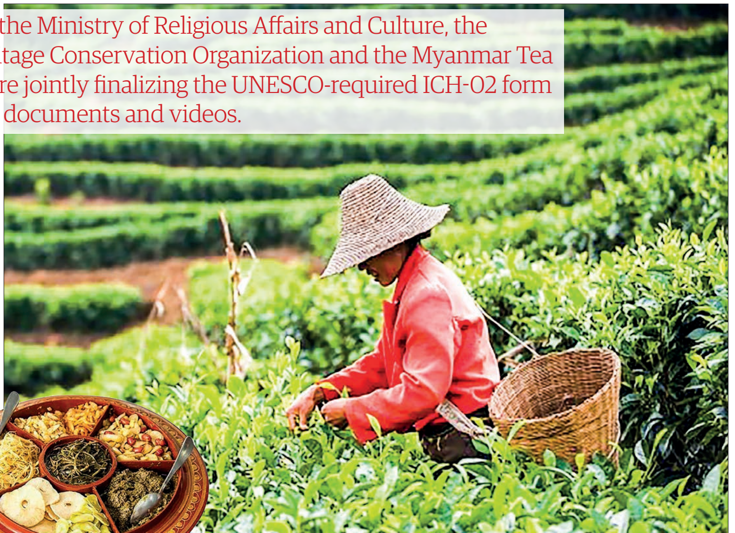
A local farmer is seen picking tea in the plantation. Tea leaf salad (inset) is a traditional Myanmar dish that is both distinctive and widely cherished. It is found nowhere else in the world but Myanmar.

To be nominated for inscription on the Representative List of the Intangible Cultural Heritage of Humanity, an ele-