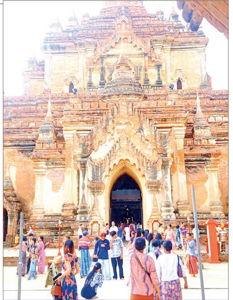
The above images show travellers visiting the Bagan Ancient Cultural Heritage Area.

"We can see that there are more travellers than last year because families, private schools, and travel companies are visiting Bagan continuously. We provide hand-painting and sand-painting lessons to students from private