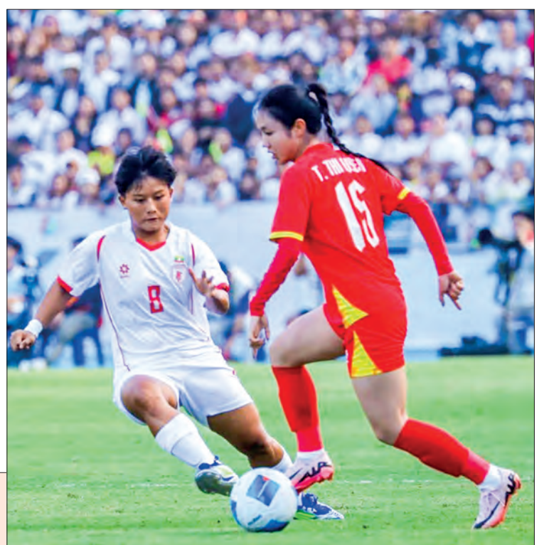
Myanmar faces Vietnam in their final Group B match.

The semifinals are scheduled for 14 December, featuring Vietnam versus Indonesia and host Thailand versus the Philippines. — Shine Htet Zaw/KZL