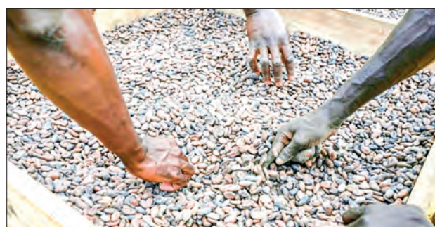
Ivory Coast and Ghana are the world's biggest suppliers of pods. PHOTO: AFP

Cocoa harvests between 2021 and 2024 failed to meet demand, which sent prices soaring. — AFP