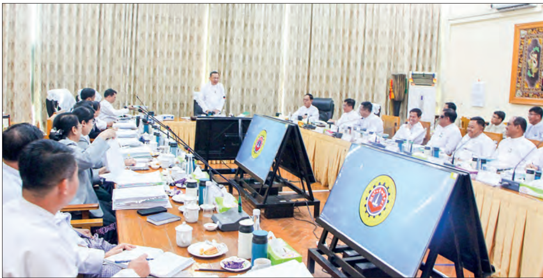
Union Minister Dr Kan Zaw presides over the State Economic Development Fund Management Committee Coordination Meeting 3/2025 yesterday.