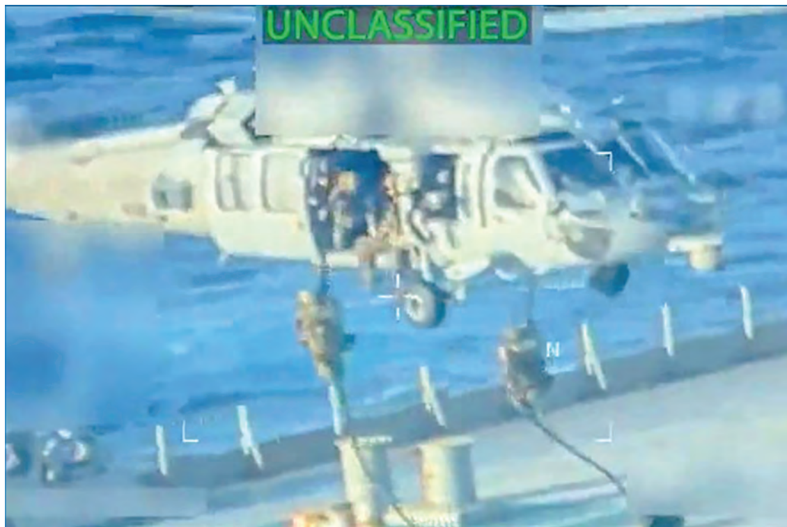
This screen grab from a video posted by US Attorney General Pam Bondi on her X account shows what Bondi says is the execution of "a seizure warrant for a crude oil tanker used to transport sanctioned oil from Venezuela and Iran" off the coast of Venezuela.

The Venezuelan government stated that the US President publicly acknowledged the seizure of a Venezuelan oil tanker in the Caribbean Sea.