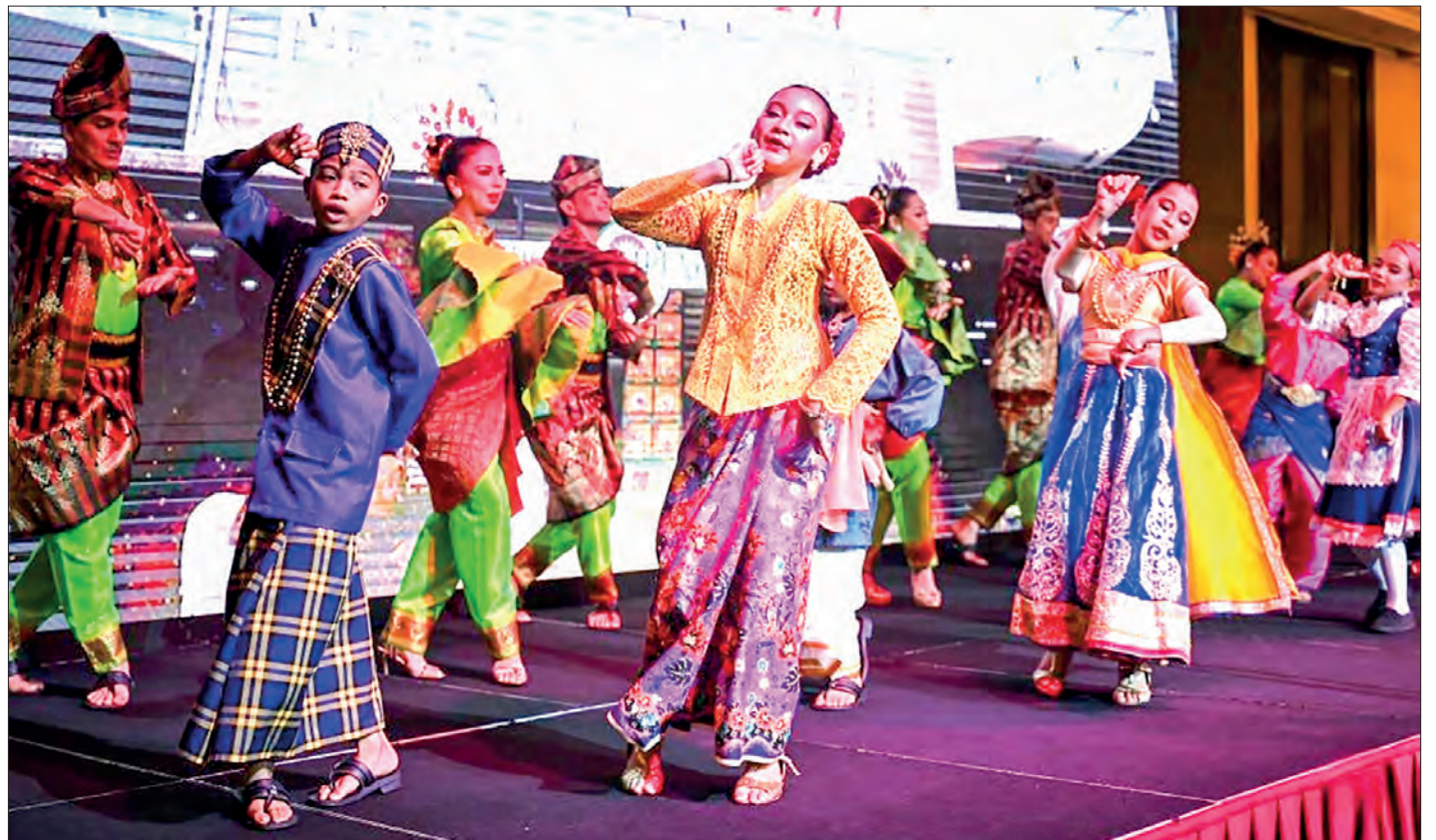
About 300 participants from the Chinese Embassy to Malaysia, Chinese ministries, 11 Chinese provincial-level regions, as well as the ASEAN-China Centre, ASEAN Secretariat and some friendship organizations in ASEAN countries attended the event.

best-organized programs for the year. A China-ASEAN people-to-people exchange roundtable was also held. — Xinhua