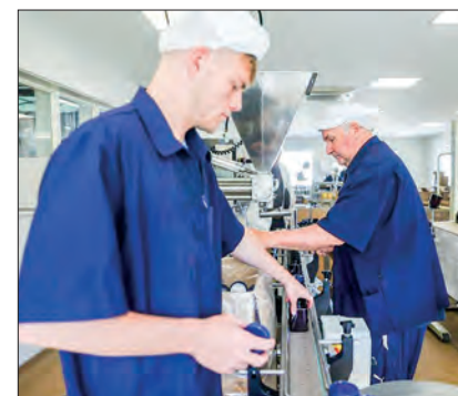
Staff members work on an assembly line at a honey producing enterprise in North Island, New Zealand, on 29 October 2025.

By analyzing insect DNA from flowers and trapping flying insects, they identified more than 36,000 specimens across 14 insect orders, and 137 separate species among