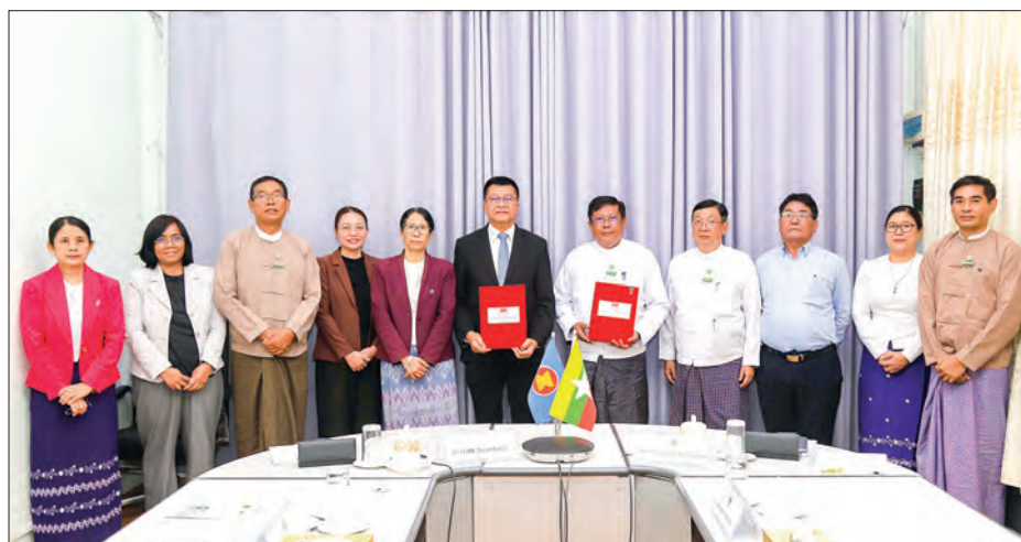
The MoA signing ceremony in progress yesterday in Nay Pyi Taw.