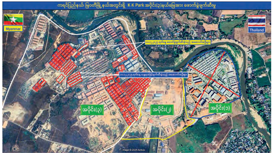
The map showing the demolition measures taken in KK Park Section 3, Myawady Township, Kayin State.

The government considers the eradication of telecom fraud and online gambling crimes as a national responsibility and, to ensure that such activities can