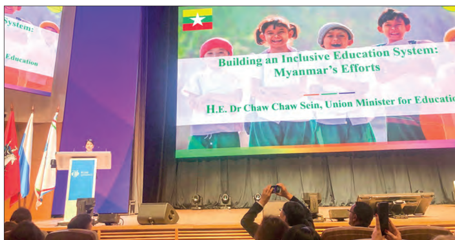
Union Minister Dr Chaw Chaw Sein puts forward the presentation at the UNESCO-organized International High-Level Officials' Conference on “Current Trends in Inclusive Education” in Moscow.

During the subsequent plenary session, the Union minister delivered a presentation titled “Building an Inclusive Education System: Myanmar’s Efforts”. She explained that Myanmar is actively implementing inclusive education, noting that the 2008 Constitution and national education laws guarantee free basic education and non-discriminatory access to school-