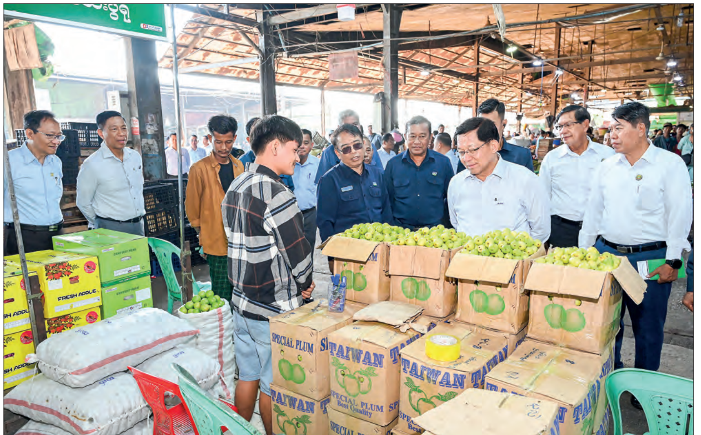
Acting President and State Security and Peace Commission Chairman Senior General Min Aung Hlaing is pictured during his inspection tours on the Thiri Mingala Market and Shwe Padauk Fish Market in Hline Township, Yangon Region.

The Senior General gave guidance that it is necessary to apply modern technology to inspect and assess the creeks and drains flowing through Yangon, including the Thamine Creek, to ensure