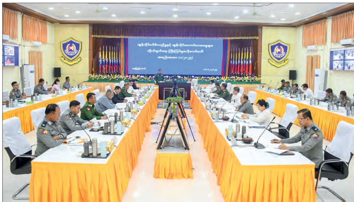
The first meeting of the Central Supervisory Committee on Combatting Telecom Fraud and Online Gambling underway yesterday, attended by Union Ministers Lt-Gen Tun Tun Naung and U Than Swe.

The Central Supervisory Committee on Combatting Telecom Fraud and Online Gambling 1/2025 meeting was held yesterday afternoon at the Areindama Hall of the Myanmar Police Force Headquarters in Nay Pyi Taw and was attended by Central Committee Chairman and Union Minister for Home Affairs Lt-Gen Tun Tun Naung, First Vice-Chairman and Union Minister for Foreign Affairs U Than Swe, central committee members, and the secretary and joint secretaries, while the chief ministers of the regions and states, as well as the commanders of the military commands, who are also members of the central committee, attended online.