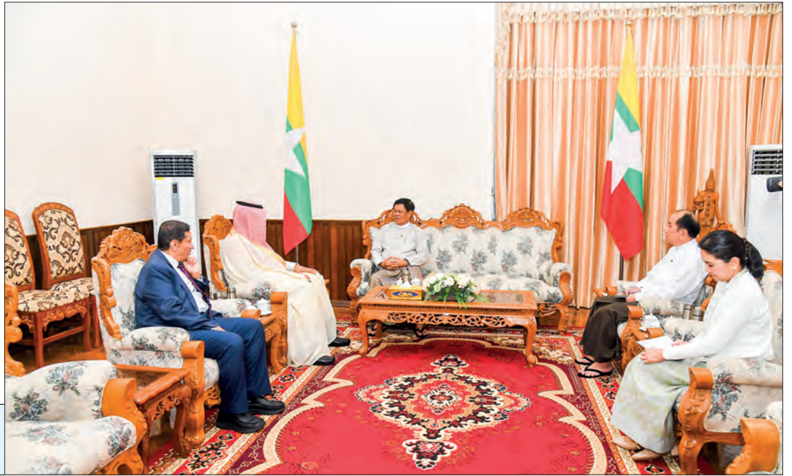
The Saudi Arabian ambassador calls on Union Minister U Than Swe yesterday.

friendly relations between Myanmar and Saudi Arabia, discussed ways to enhance cooperation between the two foreign ministries, and possible areas and opportunities for economic and investment cooperation between the two countries. — MNA