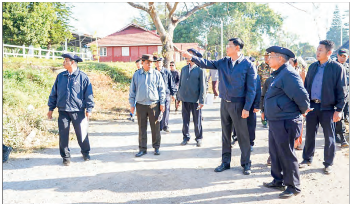
Union Minister U Mya Tun Oo is seen giving instructions during his inspection tours in PyinOoLwin.

He also inspected the fencing and painting processes along the entrance to the National Kandawgyi Gardens in Ward 6, and implementation