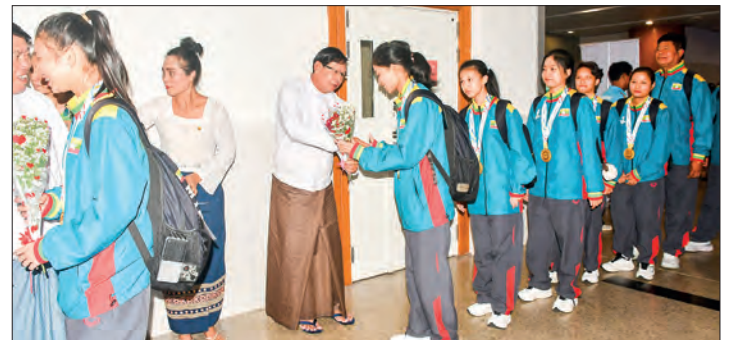
Gold, silver, and bronze medallists are seen being welcomed at Yangon International Airport.

A total of 38 team members, including national athletes, managers, and coaches, returned to Yangon by air yesterday evening. They were welcomed at Yangon International Airport by Yangon Region Chief Minister U Soe Thein, regional ministers, officials from the Department