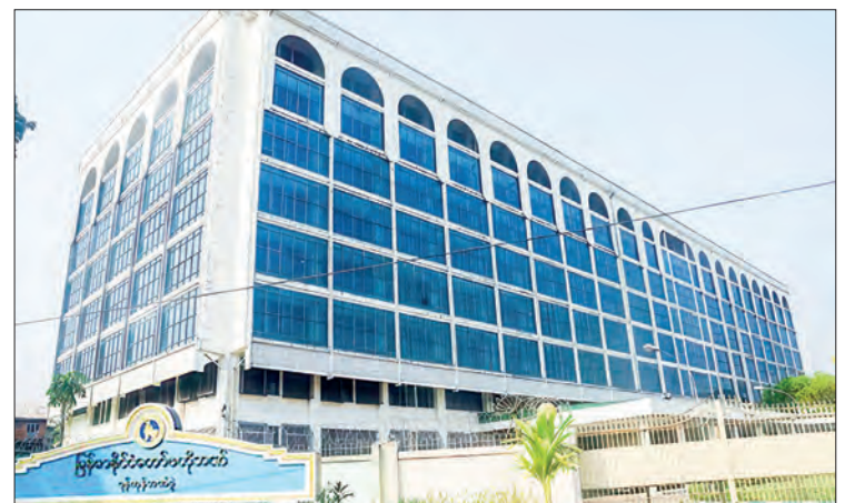
This photo captures the facade of the Central Bank of Myanmar (CBM) in Yangon.

THE Central Bank of Myanmar (CBM) sold over US$152,700 to edible oil-importing companies on 10 December.