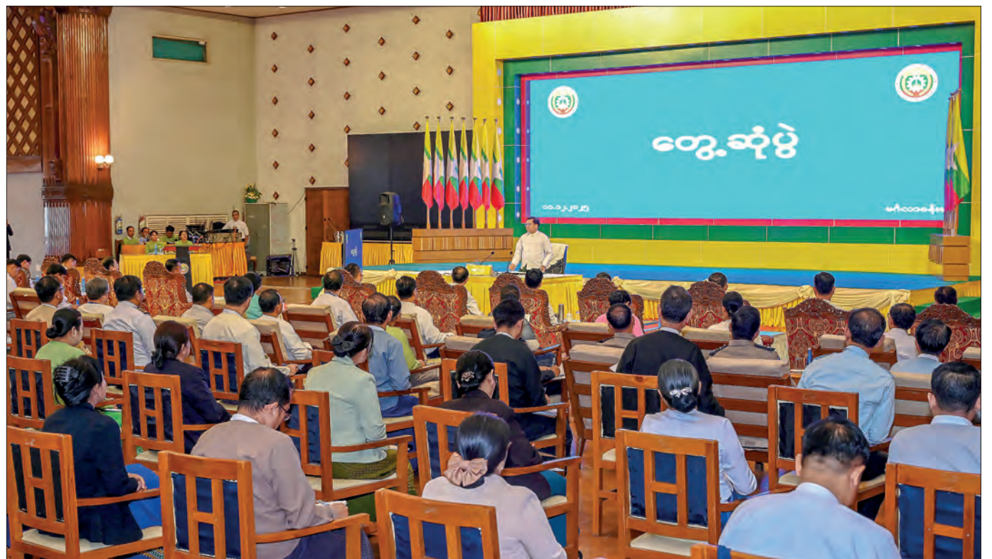
Acting President and State Security and Peace Commission Chairman Senior General Min Aung Hlaing holds the meeting with the Yangon Region cabinet members and departmental officials yesterday.

After hearing the reports, the Senior General urged officials to ensure an uninterrupted electricity supply for medicine storage, including the use of solar systems as a backup power source, and to maintain proper temperature control inside the storage rooms. — MNA/TTA