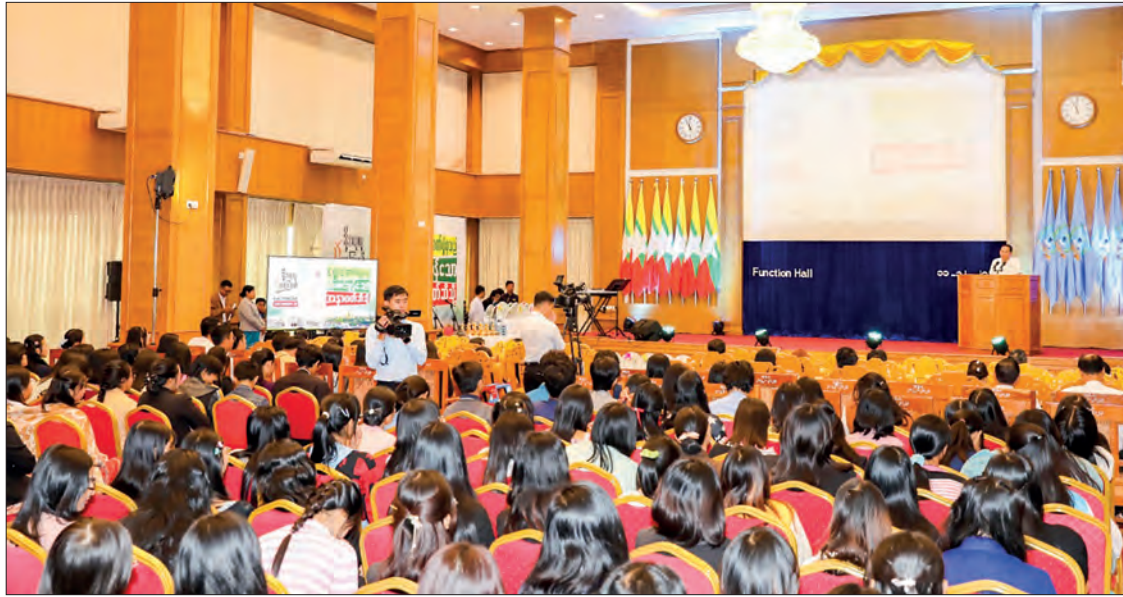
Union Minister U Maung Maung Ohn speaks on the occasion of public awareness campaigns for general elections at the Naypyitaw State Academy yesterday.

Speaking at the event, the Union minister stated the intention of the campaign and stated that the 2025 multiparty democratic election, which will be held soon, is also relevant to students. Every citizen who has reached 18 years of age should vote in the upcoming election and has the responsibility to do