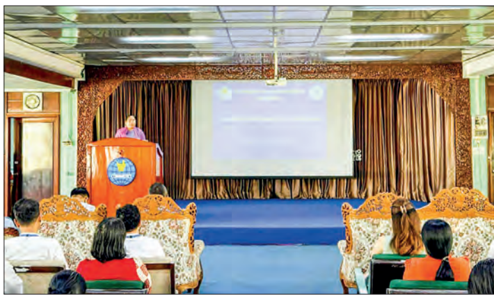
This image shows the discussion with representatives related to trademark registration.

Myanmar passed IP laws in 2019. Subsequently, the Industrial Design Law, Trademark Law, and Copyright Law came into effect in 2023 and Patent Law, in 2024. — ASH/KK