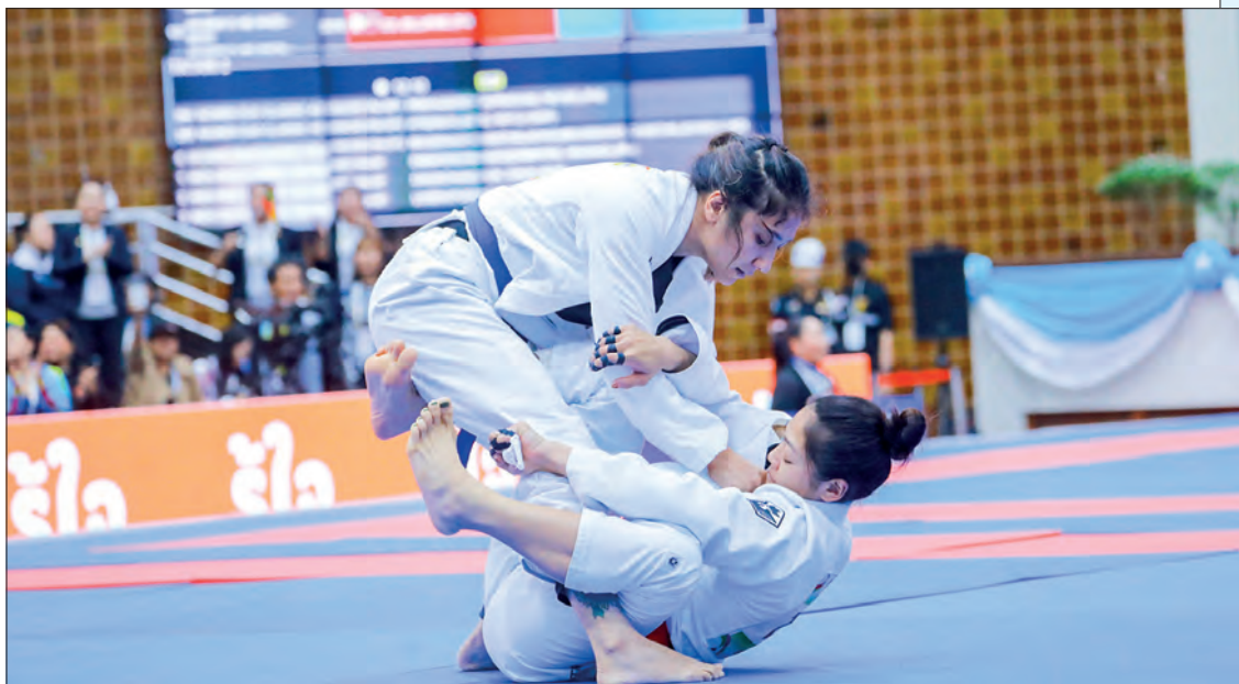
The above and left photos highlight the Myanmar's contingent's sporting prowess, particularly in taekwondo and canoeing.

Navaminda Kasatriyadhiraj Air Force Academy, Myanmar competed in men's and women's weight categories (-48, -57, -69, -85 kilogrammes) and in team events. In the women's -67-kilogramme taekwondo