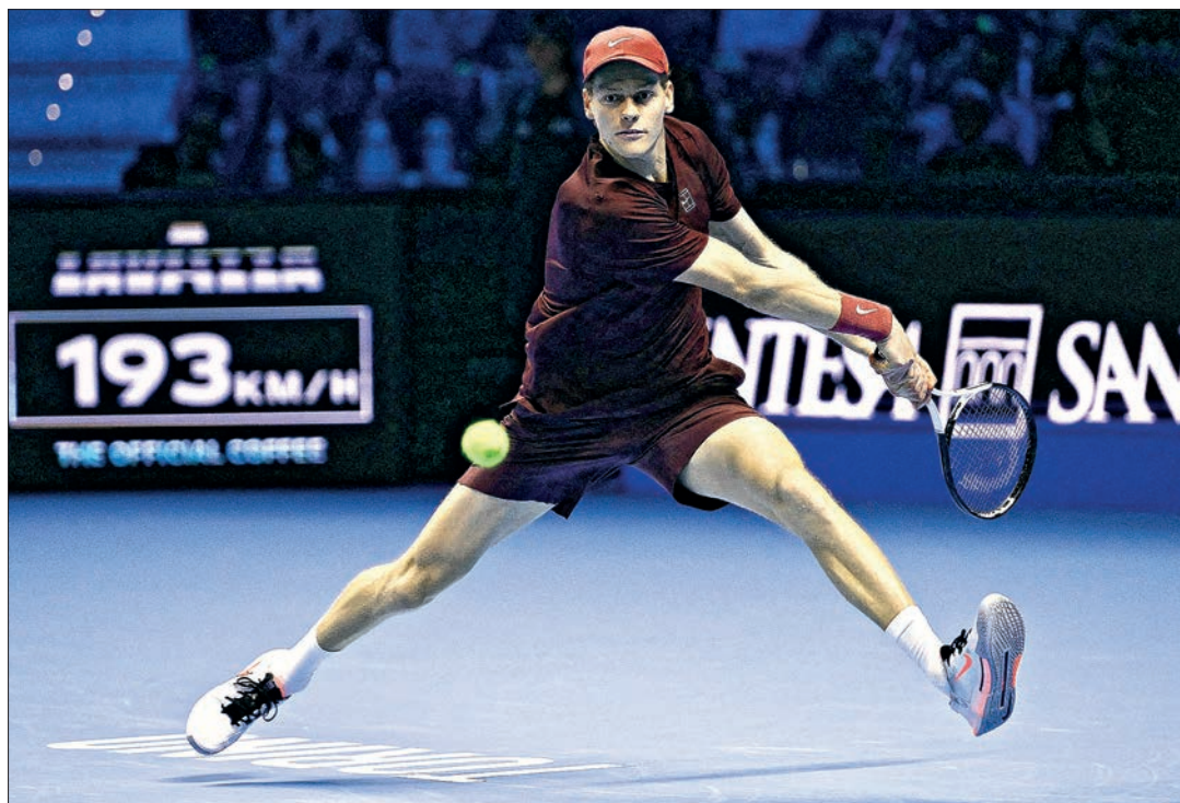
Italy's Jannik Sinner hits the ball during his match against Canada's Felix Auger-Aliassime at the ATP Finals tennis tournament in Turin on 10 November 2025.