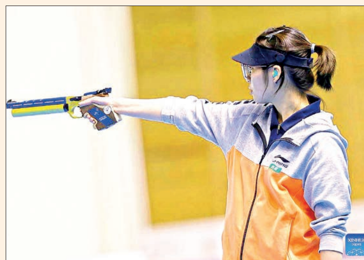
Yao Qianxun of China competes during the 10-metre air pistol women's final of shooting at the 2025 ISSF World Championship Rifle/Pistol in Cairo, Egypt, on 10 November 2025.

The result marked a landmark for Indian shooting, with Samrat becoming the first Indian pistol shooter in an Olympic discipline to win a world title. — Xinhua