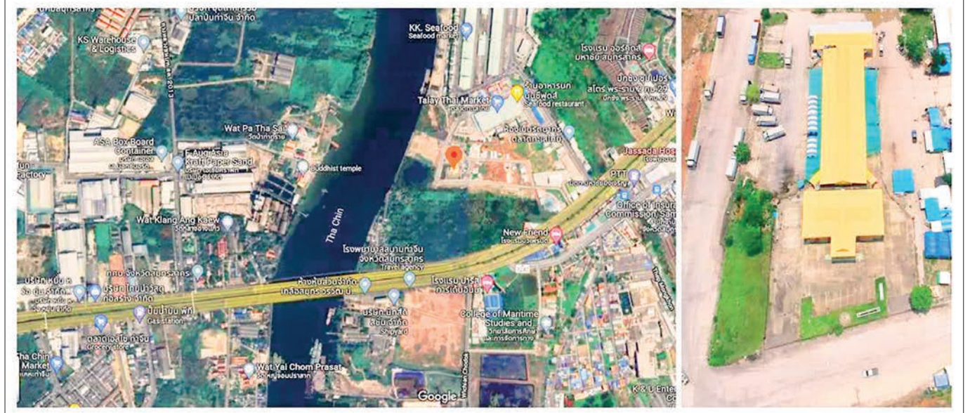
Images capture the aerial view of the location of the Temporary Data Collection Centre (TDCC).

For more information, inquiries can be made to the Yangon Payment Services Facebook page or call centre phone number (hotline number) 09 77266699, between 9 am and 5 pm from Monday to Friday. — MT/ZS