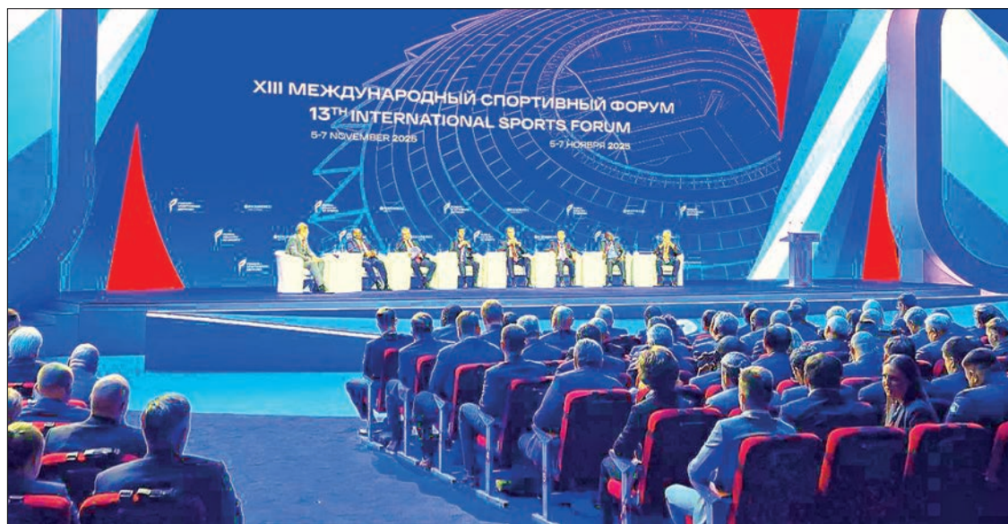
The 13 th International Sports Forum in progress on 5-7 November 2025 in the Russian Federation, attended by Union Minister Jeng Phang Naw Taung.

On the morning of 5 November, the Union minister met Russian Deputy Minister for Sports Mr Alexander Nikitian and discussed matters relating to the Memorandum of Understanding