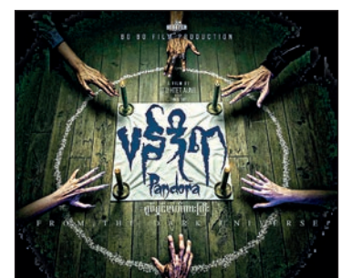
This image shows a poster for the Myanmar film ‘Pandora’.