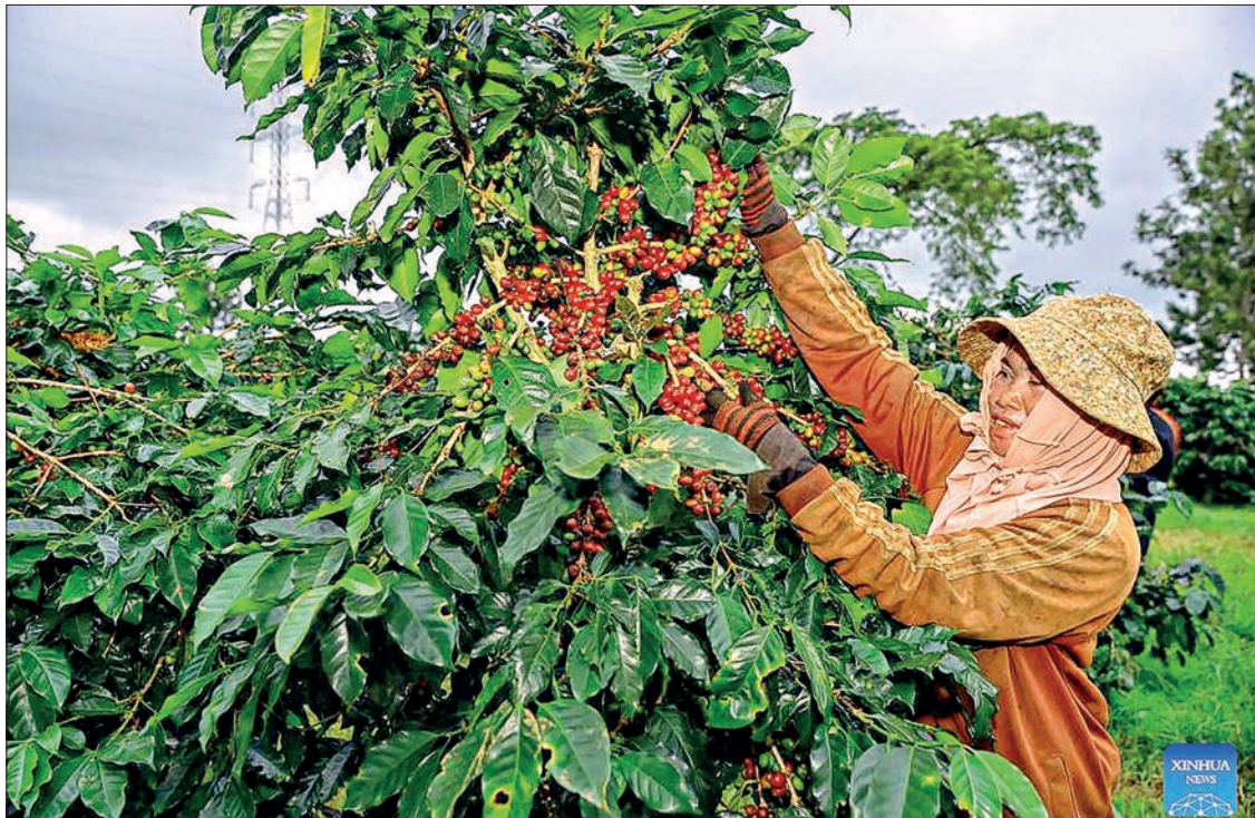
A farmer picks up coffee beans at a coffee plantation in Champasak Province, Laos, 9 November 2025.

LAOS is promoting coffee growing to improve rural livelihoods and boost the country's agricultural production.