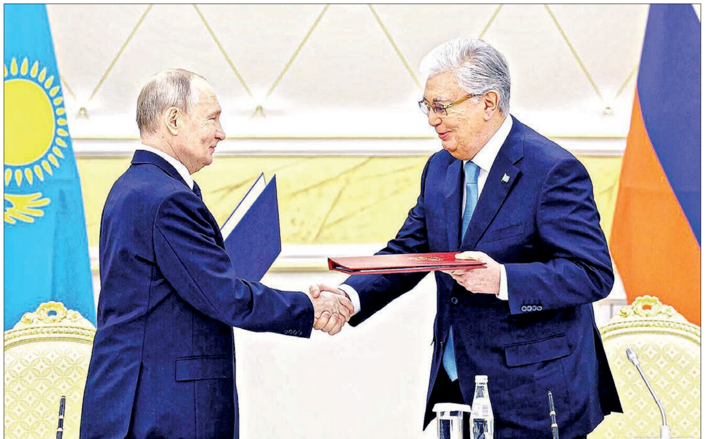
Russian President Vladimir Putin and Kazakh President Kassym-Jomart Tokayev attend a signing ceremony following a meeting at the Akorda presidential residence in Astana, Kazakhstan, on 27 November 2024.

Tokayev stated that the key event of his visit to Russia would be the signing of a declaration on the transition of re-