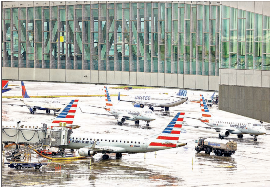
Passenger aircrafts taxi at LaGuardia airport in the Queens borough of New York City on day 41 of the government shutdown, on 10 November 2025.

full-year funding for the Supplemental Nutrition Assistance Programme, known as SNAP, whose funding was put in jeopardy amid the prolonged government shutdown.