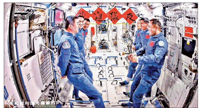
This image captured at Beijing Aerospace Control Centre on 1 November 2025 shows the crew of Shenzhou-20 and Shenzhou-21 spaceships talking with each other.

WORK on the return mission of China's Shenzhou-20 astronaut crew is proceeding in an orderly manner as planned, the China Manned Space Agency (CMSA) announced on Tuesday.