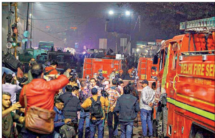
Indian policemen, firefighters and media journalists gather at the site of a car blast near the Red Fort in New Delhi, India, 10 November 2025.

Morocco's Embassy in India expressed condolences and support for the injured, while Australia's High Commissioner to India sent sympathies to all affected and wished the injured a speedy recovery. — Xinhua