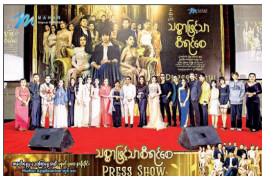
Artistes are seen at the press show of the TV series.

The 25-episode series began airing on 7 November on Mahar Application and Mahar Channel, broadcast at 6 pm every evening from Monday to Friday. — ASH/MKKS