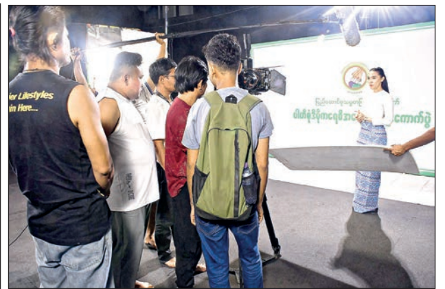
Photos top & above show artistes performing in awareness video production aimed at ensuring the successful conduct of the 2025 Multiparty Democratic General Election.