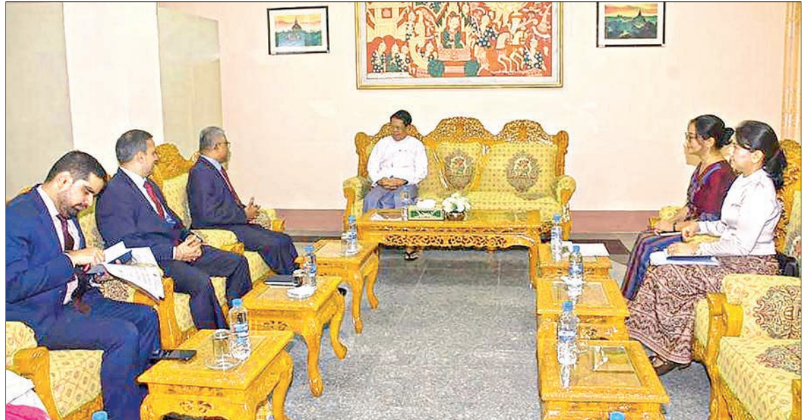
Indian Ambassador Mr Abhay Thakur calls on Union Foreign Affairs Minister U Than Swe in Yangon yesterday.

Also, present at the meeting were senior officials from the Ministry of Foreign Affairs of Myanmar and representatives of the Indian Embassy. — MNA