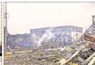
Photos on the left and above reveal the demolition of buildings and facilities, including a club, workstations, and accommodation flats, among others.

THE government investigated and deported the illegal foreign entrants who entered Kayin State via border routes of some neighbouring countries, including Thailand, and were involved in online scams, gambling and criminal activities. Moreover, the government demolishes the buildings in the respective zones of the KK Park area.