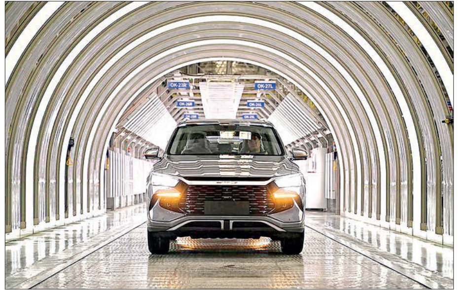
This photo taken on 3 November 2025 shows a new energy vehicle (NEV) assembly line of BYD, China's leading NEV manufacturer, at the plant of BYD in Zhengzhou, central China's Henan Province.

SoftBank Group said last month that it will acquire the robotics business of Swiss industrial automation company ABB Ltd. by 2026 to beef up its robotics business utilizing AI technology. — Kyodo