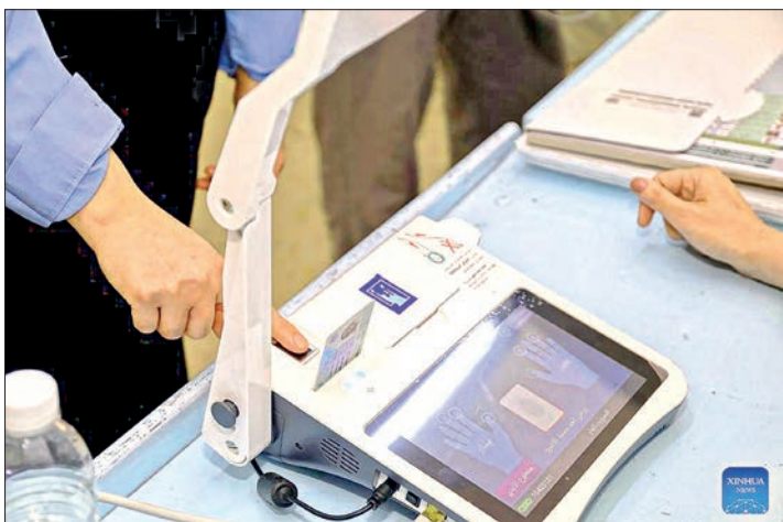
A man has his fingerprint scanned before casting his vote at a polling station in Baghdad, Iraq, on 11 November 2025.

Al-Sudani cast his ballot at a polling centre in the Karrada district of central Baghdad. — Xinhua