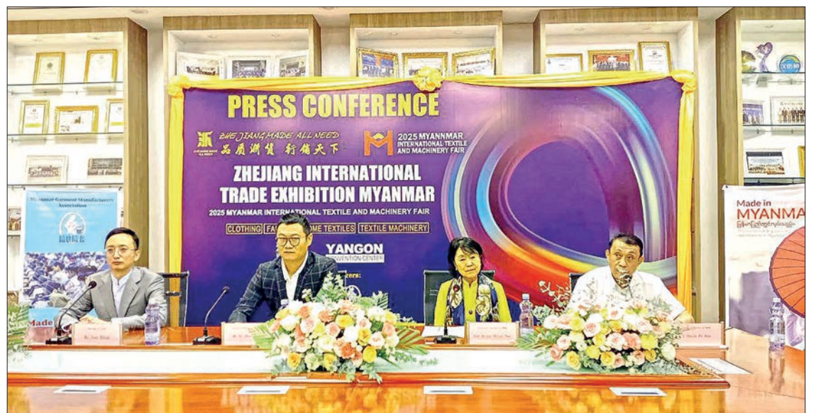
This photo shows the press conference of the Zhejiang International Trade Exhibition in Myanmar.

“Advanced machinery, latest advances in garment manufacturing, connection with trade partner countries and improvement of manufacturing productivity play a key role in gaining a competitive edge with Made-in-Myanmar products in the international market. MGMA has been endeavouring to explore new markets for