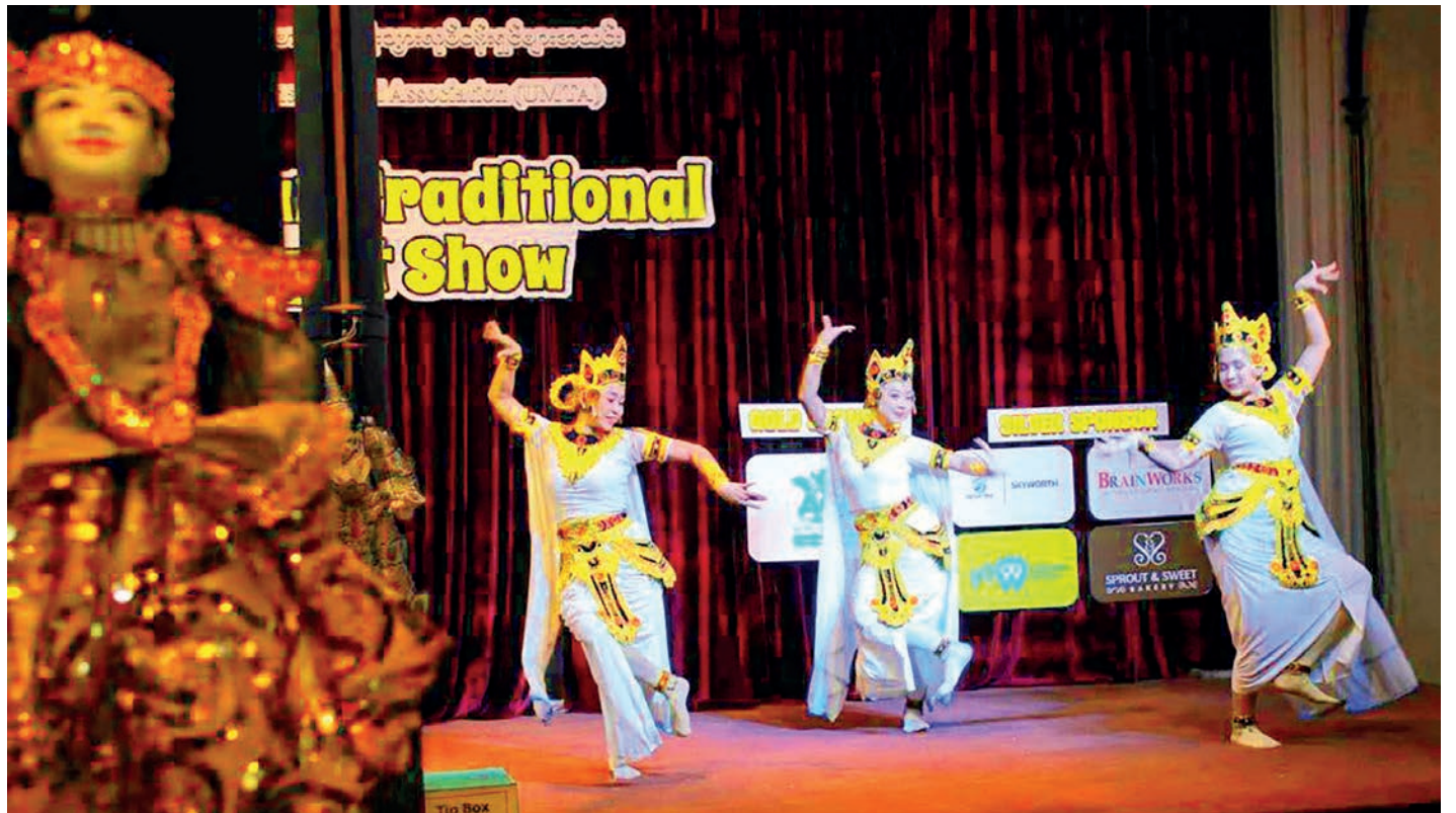
This image displays the Myanmar Puppet Show, organized by the Union of Myanmar Travel Association.

The show treated audiences to a rich variety of performances, including collaborative acts between humans and puppets, puppet-only programmes, presentations by the Shwe Pyi Theinga Art Troupe, and traditional Myanmar musical renditions featuring instruments such as the Pattala (xylophone) and Saung (traditional Myanmar harp).