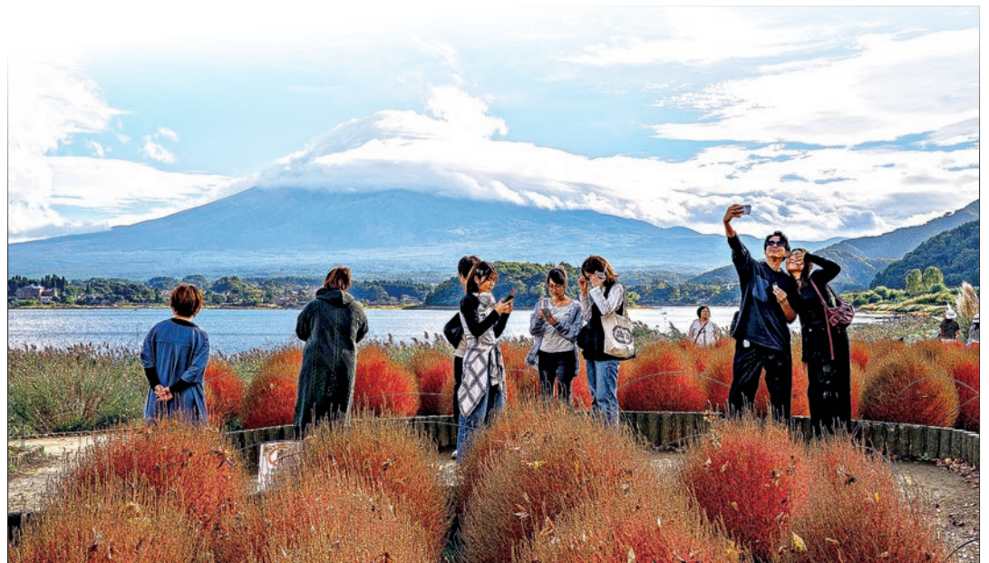
Tourists take pictures as cloud-clad Mount Fuji is seen in the background from Oishi park in the town of Fujikawaguchiko, Yamanashi prefecture on 18 October 2025

It also recommends creating rules of use, when needed, in consultation with local residents and tourism operators. — Kyodo