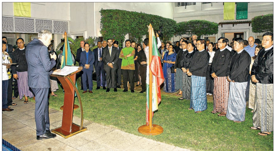
The 203 rd Anniversary of Brazilian Independence Day in progress yesterday in Yangon, attended by Union Minister U Than Swe, Yangon Region Chief Minister U Soe Thein, and dignitaries.

The event was also attended by Yangon Mayor U Bo Htay, ambassadors and chargés d'affaires ad iterim of foreign embassies in Yangon and resident representatives of the UN and invitees. — MNA/KTZH