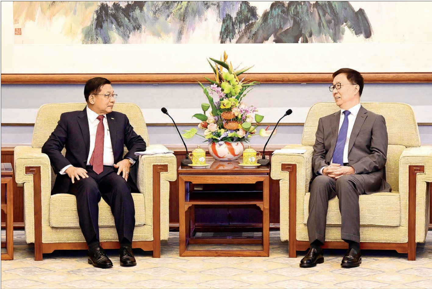
Acting President and State Security and Peace Commission Chairman of the Republic of the Union of Myanmar Senior General Min Aung Hlaing holds talks with Vice-President of the People’s Republic of China Mr Han Zheng in Beijing yesterday.

Myanmar and China reaffirm their commitment to strengthening cooperation in maintaining peace and stability along the border region.