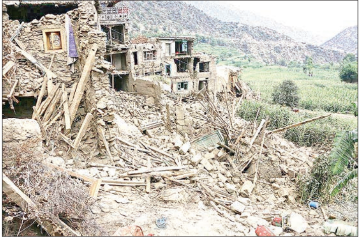
This photo taken on 1 September 2025 shows a view of the earthquake-hit area in Nurgal district of Kunar province, Afghanistan.

"It's a low (population) density, but since this happened in the night, everybody was sleeping so I think (the casualty figure) is going to be much higher." — AFP