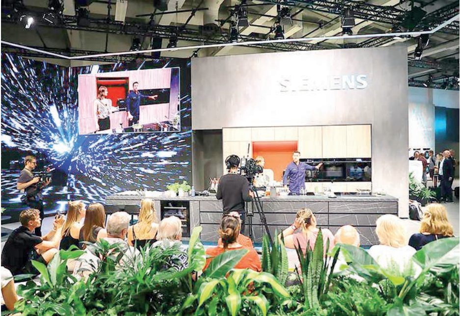
Staff members introduce new products at the booth of Siemens at IFA Berlin 2024 in Berlin, Germany, 6 September 2024.

“The ability to expand production despite mounting challenges is a testament to the sector’s resilience,” said Cyrus de la Rubia, chief economist at Hamburg Commercial Bank. But he warned that the industry faces risks from possible disruptions in trade with key non-EU partners and pressure on competitiveness from a stronger euro. Germany’s economy contracted by 0.3 per cent in the second quarter, as weak exports and sluggish investment continued to weigh on growth. — Xinhua