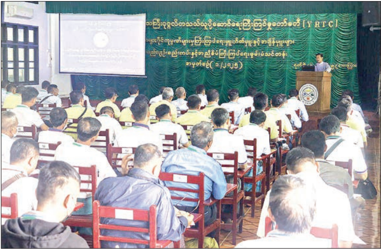
The opening ceremony of the Refreshment Management Course 1/2025 for YBS supervisors from public companies is in progress.