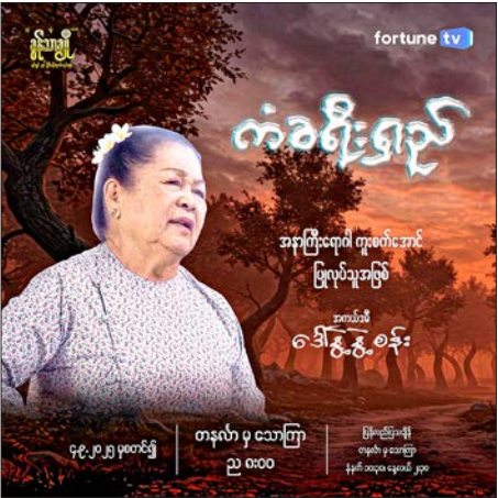
This image displays the poster for the Myanmar TV series ‘Kan Khyeshae’.