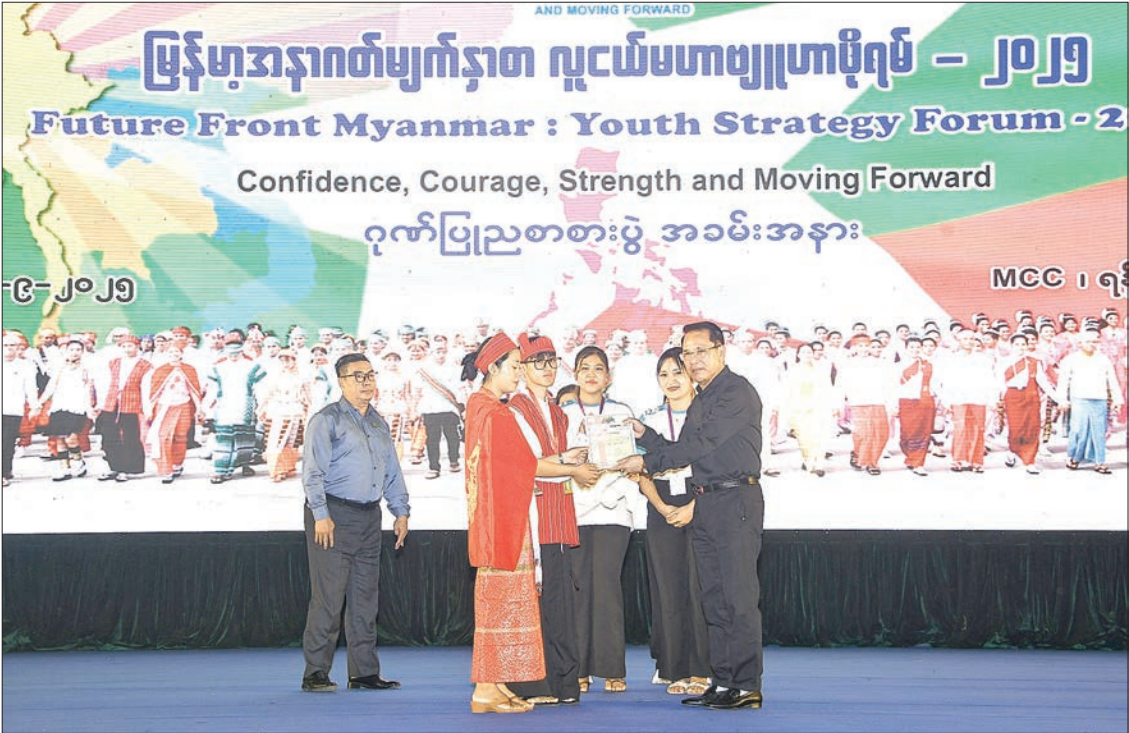
Union Minister U Maung Maung Ohn presents the certificate of honour to youth delegates.

THE dinner reception for Future Front Myanmar: Youth Strategy Forum 2025 was held at the Myanmar Convention Centre (MCC) in Yangon yesterday. In his speech, Union Minister for Information U Maung Maung Ohn expressed gratitude to all the officials and young delegates for attending the event. He added that four national-level forums were held in the country, and the Youth Strategy Forum 2025 is the most significant and powerful forum for the country. The young ethnic people will all come together to support a way to a future country and shape a prosperous country, regardless of their different opinions.