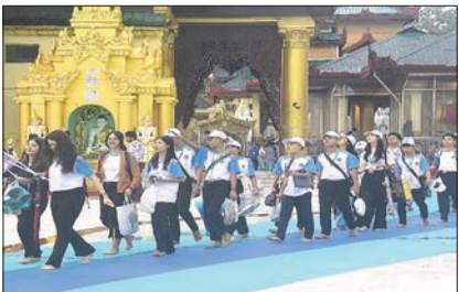
Future Front Myanmar youth tour Yangon landmarks