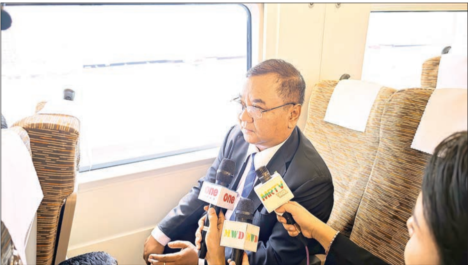
National Defence and Security Council Information Team Leader Maj-General Zaw Min Tun.

“FIRSTLY, there are three sections during the visit of the Acting President and State Security and Peace Commission Chairman of the Republic of the Union of Myanmar to China. The first one is Tianjin, the second one is Beijing, and the third one is Harbin and Chengdu. “The first section is attending the SCO Summit 2025 Plus, whereas the second section is attending the 80 th Anniversary of the Victory in the World Anti-Fascist War in Beijing, and the third one is study tours to Harbin and Chengdu. Now, we are leaving for Beijing by express train after attending the SCO summit and meetings. The entourage of the Acting President and the State Security and Peace Commission Chairman takes this express train. I want to talk about Tianjin first. Tianjin is located adjacent to Beijing. Tianjin is a historically significant city. The First Opium War took place in Tianjin, the first Opium War of China. It is also the nearest port city to Beijing. Tianjin is one of the most important port cities in northern China. I believe it was very meaningful that the Shanghai Cooperation Organization (SCO) Summit and other related meetings were held in Tianjin. Out of the 26 participating countries, more than 20 attended this SCO Summit. Yesterday, the summit and all related meetings concluded. The significant fact is that during the summit, Chinese President Mr Xi Jinping