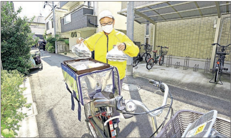
A man delivers bento lunch boxes in Tokyo's Shinagawa Ward on 21 August 2025.

people. Osaka logged the highest Engel coefficient at 31.2 per cent, followed by Aomori at 29.6 per cent and Kobe at 29.2 per cent. The national average stood at 26.1 per cent in 1985-1989 and fluctuated in the ranges of 23 to 24 per cent for 25 years through 2014. It edged up to 25.6 per cent in 2015-2019 before climbing to 27.5 per cent in the most recent period. The increase in the figure around 2020 reflected a drop in spending on outing-related spending amid the coronavirus pandemic. It further climbed later as food prices surged on the back of a weaker yen and higher material prices. — Kyodo