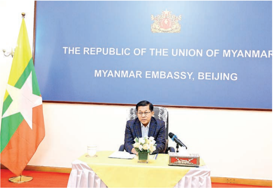
Acting President and SSPC Chairman Senior General Min Aung Hlaing meets staff and family members of the Myanmar Embassy and the Office of the Military attaché to China, and scholarship students in Beijing yesterday.

ACTING President of the Republic of the Union of Myanmar and Chairman of the State Security and Peace Commission of the Republic of the Union of Myanmar Senior General Min Aung Hlaing, who is currently in Beijing of the People’s Republic of China on his working visit, met staff and families of the Myanmar Embassy and the Office of the Military Attache to China, and scholarship students at the Myanmar Embassy at 5 pm Chinese standard time yesterday. The Myanmar Ambassador and the Military Attache introduced staff families to the Acting President and Chairman of State Security and Peace Commission of the Republic of the Union of Myanmar individually. Speaking on the occasion, the Acting President and SSPC Chairman of the Republic of