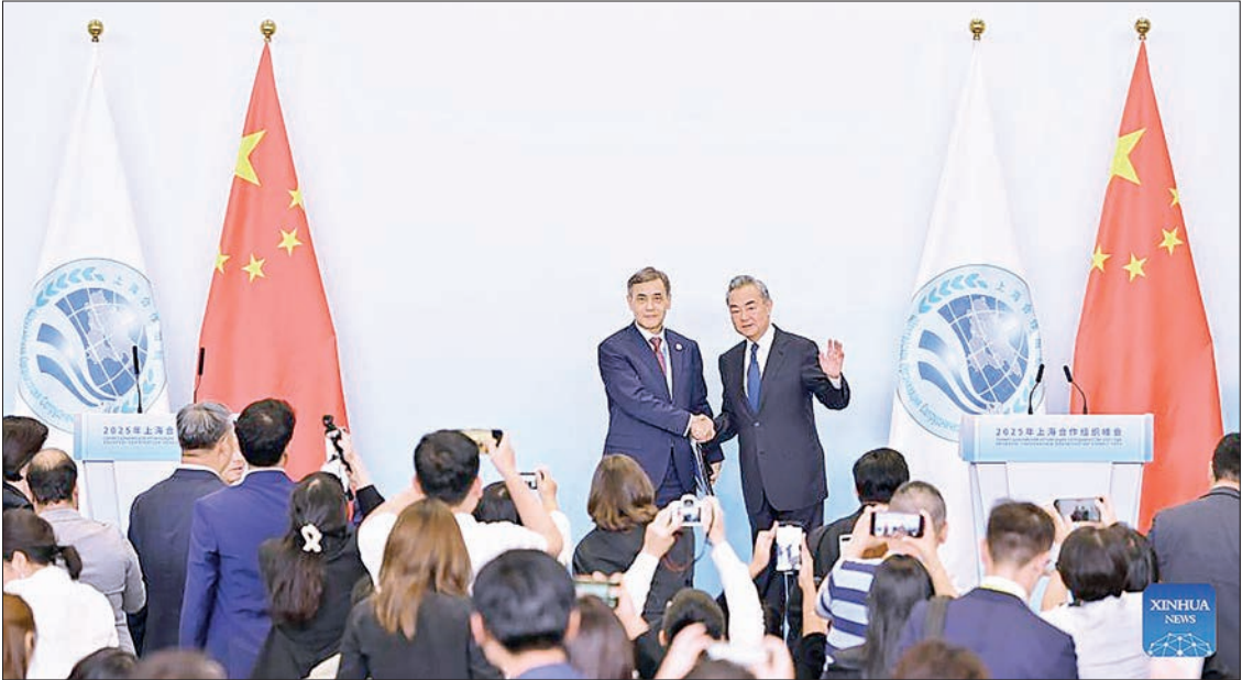
Chinese Foreign Minister Wang Yi, also a member of the Political Bureau of the Communist Party of China Central Committee, and Secretary-General of the Shanghai Cooperation Organization (SCO) Nurlan Yermekbayev meet the press in Tianjin, north China, 1 September 2025.

The summit issued a statement defending the victorious outcomes of World War II. In a separate statement, the SCO expressed firm support for the