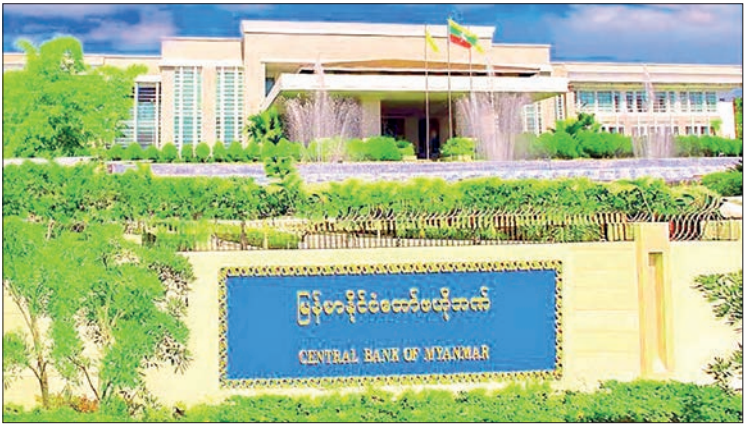
This photo showcases the facade of the Central Bank of Myanmar (CBM) in Nay Pyi Taw.

CBM sold $36.5 million purchased from CMP companies, in addition to the injection of $8.8 million, 13.3 million baht, 10.5 million yuan and 500,000 rupees in July. Furthermore, CBM sold over $2.3 million to other commodities-importing companies as per its initial announcement of selling $10 million. CBM sold $8.4 million, 13.9 million baht and 5.2 million yuan