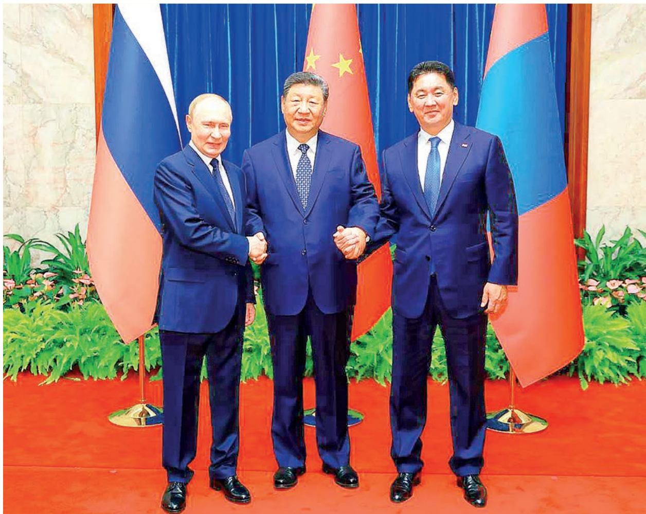
Chinese President Xi Jinping, Russian President Vladimir Putin and Mongolian President Ukhnaa Khurelsukh hold a trilateral meeting at the Great Hall of the People in Beijing, capital of China, 2 September 2025.

Putin said that enhancing political mutual trust is very important, which is conducive to consolidating the foundation of the trilateral relations. The three sides need to align their development strategies closely, enhance connectivity, expand the scale of trade and investment, and deepen cooperation and exchanges in finance, energy, digital economy, education, environmental protection, tourism and other fields, so as to boost economic development, promote regional economic integration, and enhance the bonds among the peoples, Putin said. — Xinhua