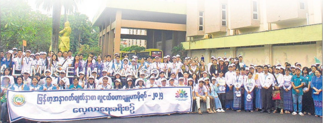
Photos (top & above) show ethnic youth from the Nay Pyi Taw Council Area, regions and states are pictured during their tours in Yangon.