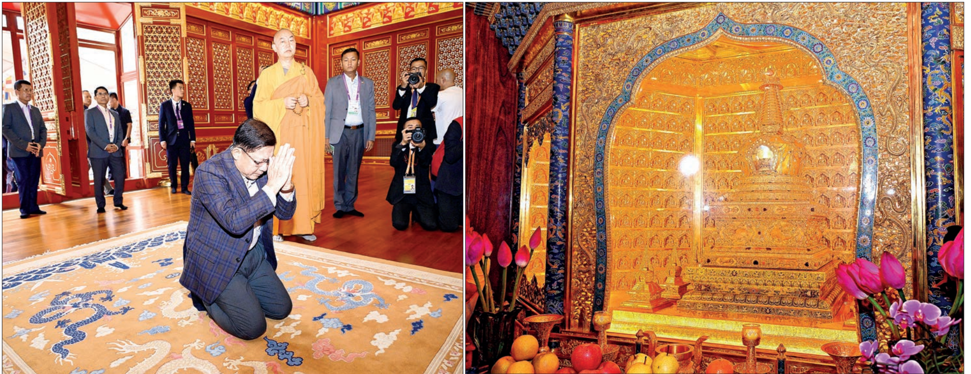
The Acting President and SSPC Chairman performs a ceremonial kowtow to the sacred tooth relic of the Lord Buddha at Lingguang Temple in Beijing yesterday.

A CTING President of the Republic of the Union of Myanmar and Chairman of the State Security and Peace Commission of the Republic of the Union of Myanmar Senior General Min Aung Hlaing, who is currently in the People's Republic of China on his working visit, and delegation members paid homage to the sacred tooth relic of the Lord Buddha at Lingguang Temple in Beijing at 3 pm Chinese standard time yesterday.