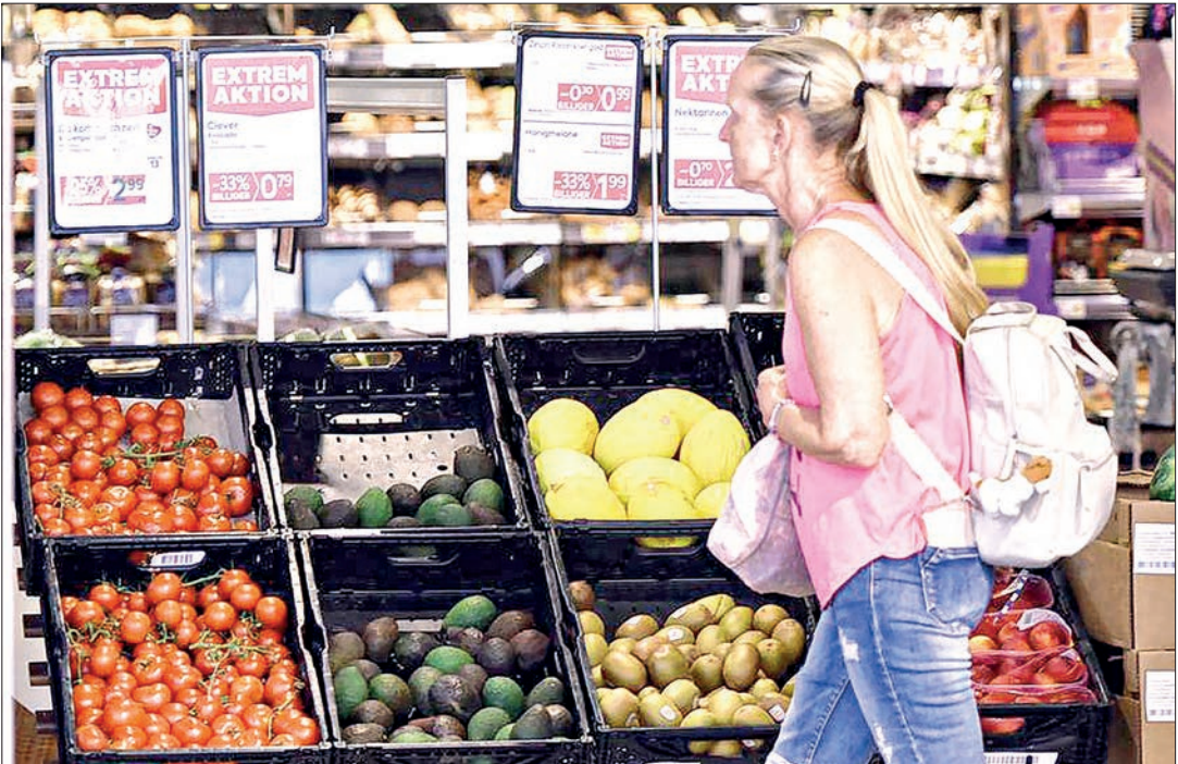
A customer shops at a supermarket in Vienna, Austria, 2 July 2025.

EUROZONE inflation was up slightly in August, official data showed Tuesday, fuelling expectations that the European Central Bank will keep interest rates unchanged next week. Inflation in the single currency area rose to 2.1 per cent last month from two per cent in July, the EU's statistics agency said. This was largely down to