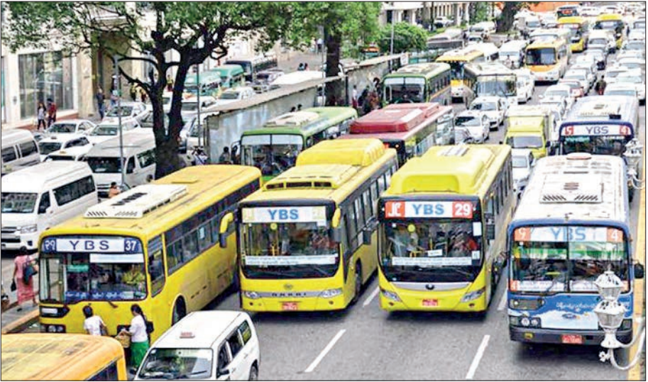
This photo shows YBS buses using CNG are running in the commercial hub, Yangon.

The use of this environment-friendly alternative automotive fuel contributes to lower air pollutants, improved well-to-wheel efficiency, cost effectiveness compared to gasoline and diesel, and reduced carbon emissions. This way, the cleaner alternative has been increasingly used in public