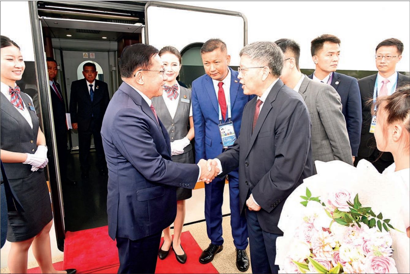
Acting President and SSPC Chairman Senior General Min Aung Hlaing is pictured being welcomed upon the arrival in Beijing yesterday.

A CTING President of the Republic of the Union of Myanmar and Chairman of the State Security and Peace Commission of the Republic of the Union of Myanmar Senior General Min Aung Hlaing, who is currently in the People's Republic of China on his working visit, together with delegation members, left Tianjin Station at 10:30 am Chinese standard time yesterday for Beijing by the special high-speed train.