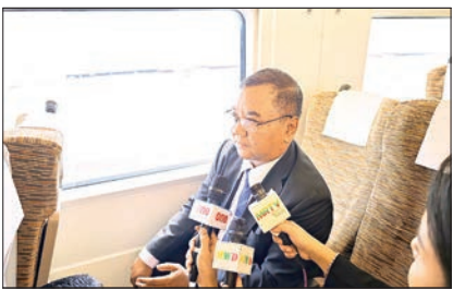
NDSC Information Team Leader Maj-Gen Zaw Min Tun responds to media