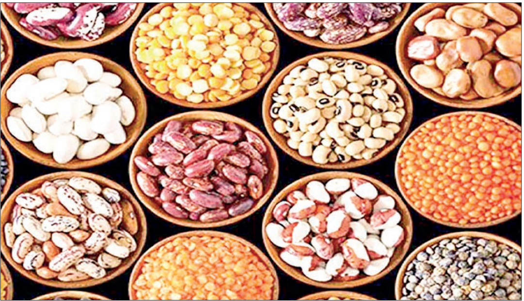
Samples of Myanmar beans and pulses on display.

Those interested individuals, MCEF members and business people can register through MCEF's contact numbers 09 893217109, 09 422721757, 09 266823226, and email mcef1996@gmail.com and address: No 3 in the corner of Thanthuma Road and Waizayanta Street. — NN/KK