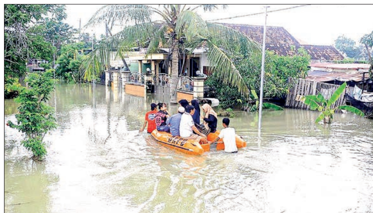
People take a rubber boat through flood water after heavy rains hit Kedungrukem village in Gresik Regency, East Java, Indonesia, 2 March 2025.

"There is a 55 per cent chance for sea surface temperatures in the equatorial Pacific to cool to La Nina levels" in the September to November period, it said. — AFP