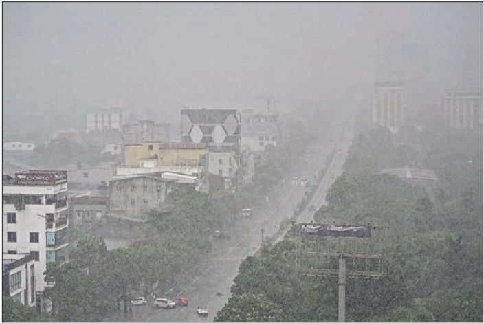
Rain falls above the buildings and a street in Vinh city, Nghe An province on 25 August 2025, before Typhoon Kajiki makes landfall in Vietnam.