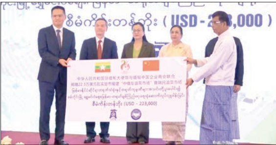
Donation for the Shwe Minwun Market, which will be built as a Myanmar-China friendship shopping centre.

A Myanmar-China friendship shopping mall is reportedly going to be built in Sagaing, Sagaing Region. The Chinese Embassy to Myanmar and the China Enterprises Chamber of Commerce in Myanmar (CECCM) jointly donated US$223,000 for the Shwe Minwun Market, which will be built as a bilateral friendship market in Sagaing, during the launch of the Corporate Social Responsibility (CSR) 2025 report at the M Gallery Hotel in Nay Pyi Taw on 24 August, according to a statement by the CECCM. Chinese businesses in Myanmar implemented more than 160 CSR projects in the past eight years, benefiting a total population of more than 420,000 in