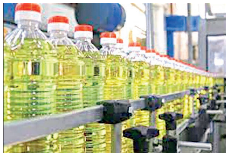
Cooking oil bottles are arranged for sale in the supermarket.

The complaints for overcharging can be lodged over hotline 1535 of the call centre of the Consumers Affairs Department or sent to the Facebook page of the department and the region and state departments