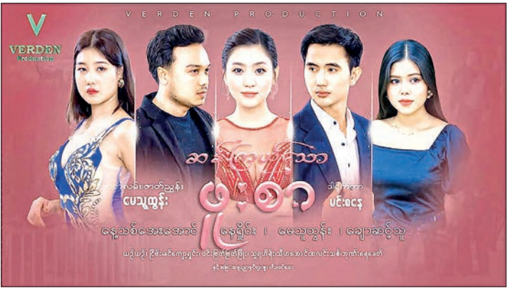
This image showcases a poster for the drama ‘Hsankyelthaw Phuuza’.

emy in Dagon Myothit (North) and cityscapes. Additionally, at the Ministry of Science and Technology's Department of Research and Innovation, the crew documented activities related to food innovation under the 2020 Lancang-Mekong Cooperation Programme. They also filmed at the Solar Energy Exhibition Centre and the National Laboratory, capturing MSME development work, testing of raw materials and product quality, and the use of large-scale dryers for processing pennywort leaves into dried and powdered form. — ASH/KNN