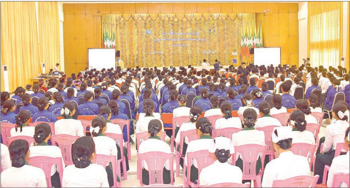
Union Minister U Maung Maung Ohn participates in the discussion to set up a resilient and strong community in Loikaw yesterday.