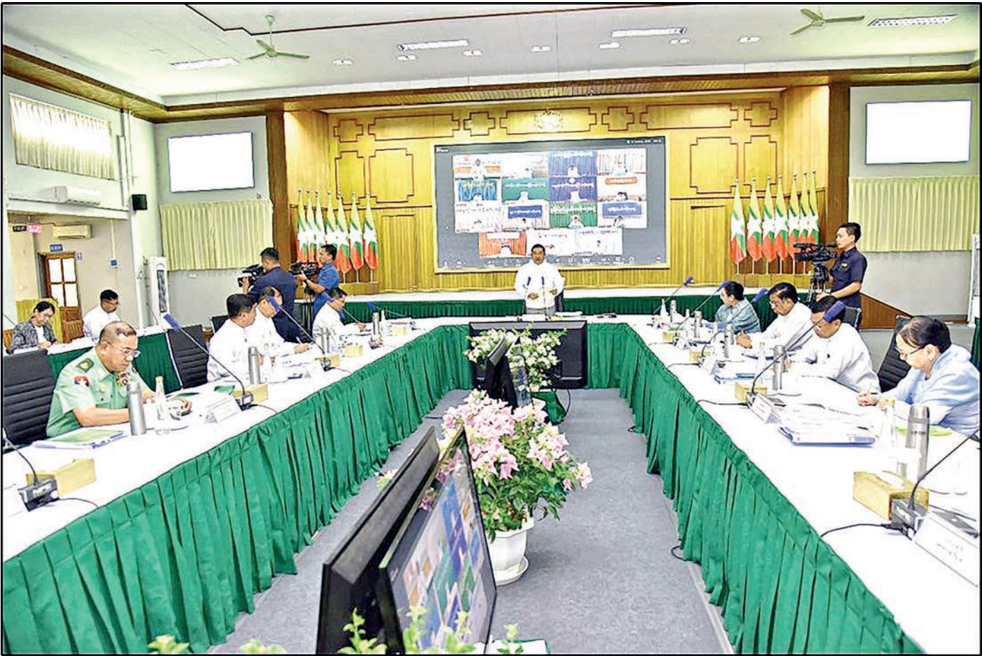
Prime Minister U Nyo Saw addresses the fourth meeting of the Agriculture and Livestock Development Commission yesterday.

Efforts must be made to increase per capita consumption of meat and eggs, thereby improving public health standards.