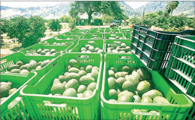
This image shows avocados designated for cosmetics manufacturing.