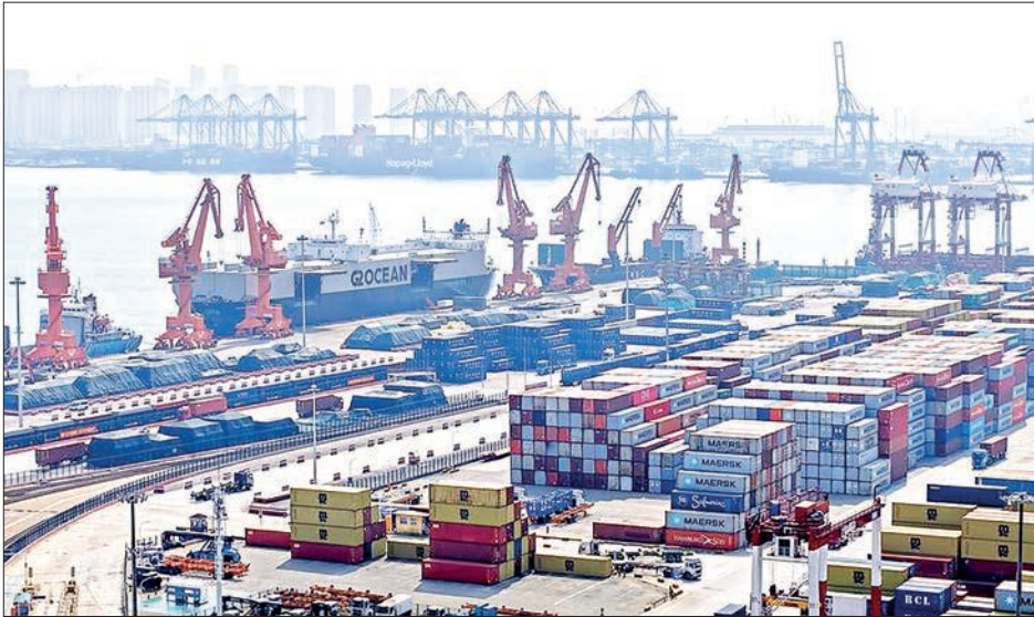
An aerial drone photo taken on 19 August 2025 shows a view of Qingdao Port in Qingdao, east China's Shandong Province.

ing a more convenient, secure and predictable business environment, which has been widely welcomed by enterprises. Simplified clearance procedures and optimized supervision models have ensured faster cross-border logistics and smoother economic and trade exchanges, while institutional innovations have supported the growth of new forms of foreign trade, Sun said. Data showed that China has added or expanded 40 ports of entry since the beginning of the 14 th Five-Year Plan period (2021-2025), bringing the total to 311 nationwide, and 271 types of agricultural