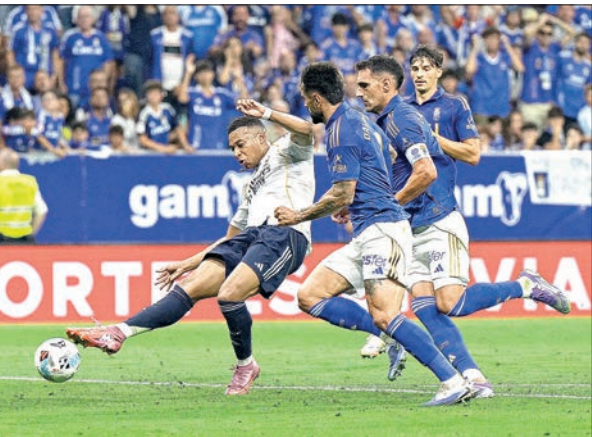
Real Madrid's French forward Kylian Mbappe scores his team's first goal during the Spanish league football match between Real Oviedo and Real Madrid CF at Carlos Tartiere Stadium in Oviedo on 24 August 2025.

Mbappe opened the scoring in 38 minutes after a pass from Aurelien Tchouameni, although Oviedo players protested that the referee had failed to call a foul in the buildup.