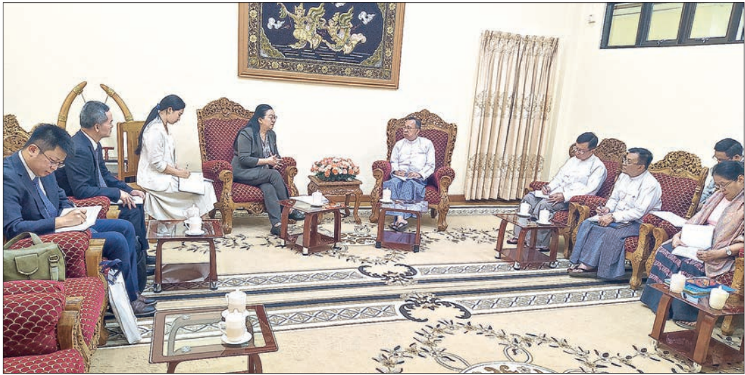
Union Minister Dr Kan Zaw meets Chinese Ambassador Ms Ma Jia yesterday.

ducted by China and further mutually beneficial cooperation between the two countries. Also, present at the meeting were the deputy minister and departmental officials. — MNA