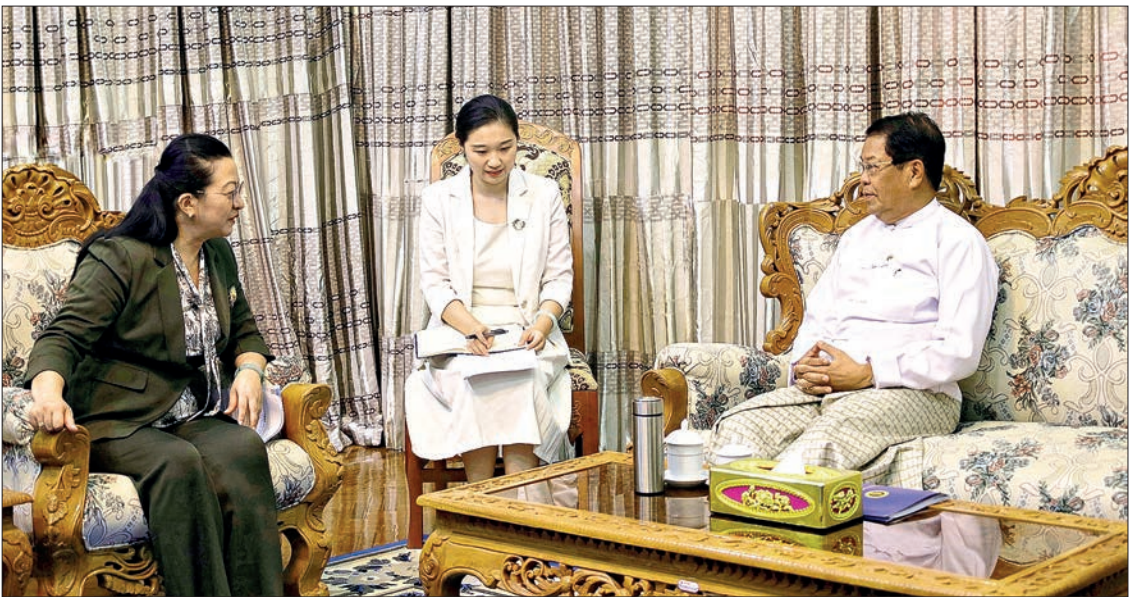
Union Foreign Affairs Minister U Than Swe receives Ms Ma Jia, Ambassador of the People's Republic of China to Myanmar, yesterday.

isting Pauk-Phaw relations and expansion of cooperation between Myanmar and China, continued implementation of Myanmar-China bilateral projects, as well as China's continued support for Myanmar's development and post-earthquake rehabilitation and reconstruction efforts. — MNA