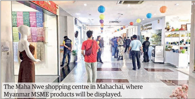
The Maha Nwe shopping centre in Mahachai, where Myanmar MSME products will be displayed.

SOME Myanmar MSME products have been planned to penetrate the Thai market through official exports, said Mya Pon-nama wholesale trading centre owner U Hein Htike Aung. This plan will be introduced at Mahar Nwe shopping centre in Mahachai, Thailand, in September and October with about 30 booths. “As a trading company, we