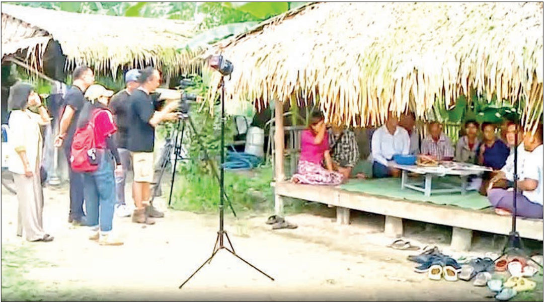
Filming of the “Prosperous Lancang-Mekong Home” documentary programme in progress.

do oil, frozen pulp, beverages) are required to be registered through the CIPHER system of the General Administration of Customs of the People's Republic of China (GACC). Avocado has been grown in Myanmar for the last 75 years, mainly in Shan State, Chin State, Sagaing Region and PyinOoLwin, of Mandalay Region. Avocados are rich in vitamins and 20 minerals. Avocado has become popular due to its health benefits so stakeholders in the supply chain are making efforts to boost avocado exports. — ASH/KK