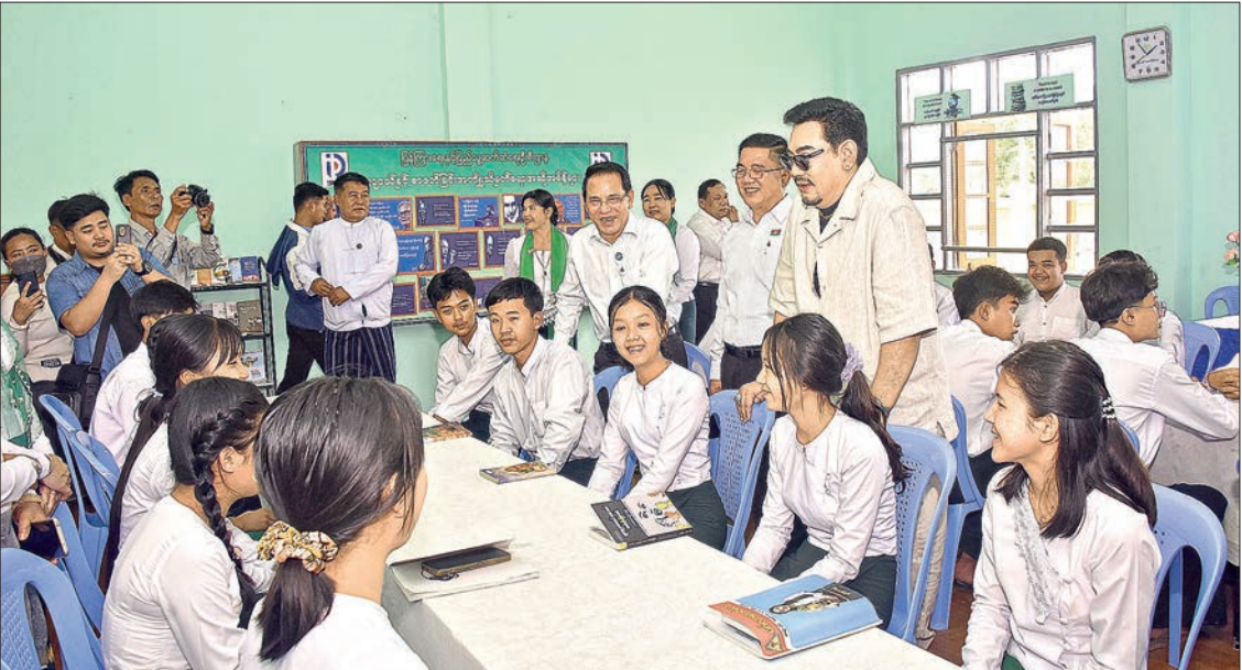
Union Minister U Maung Maung Ohn joins the campaign on developing libraries and raising reading habits in Loikaw yesterday.

nate fine literature. The youths should also read. All should participate in rebuilding a more peaceful and prosperous future. The state chief minister reported on efforts to promote reading habits despite the challenges, and expressed gratitude to the officials of the Ministry of Information and artistes for coming to provide moral support to departmental officials and locals. The Union minister donated 50 MRTV DTH receivers and 120 MRTV T-2 settop boxes for the state government and regional military station. The Union minister and party also presented cash prizes to the winners in competitions. In the evening, the Union minister and party arrived at