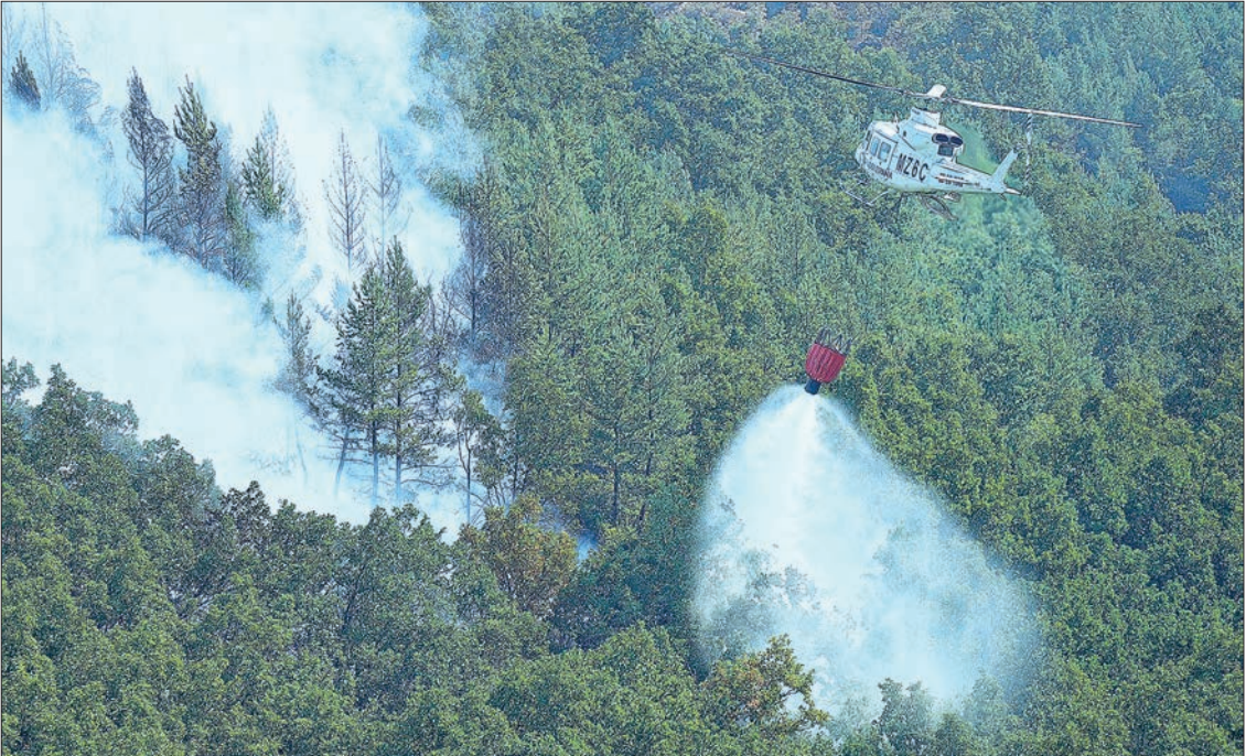
A firefighter helicopter drops water above a wildfire in Garano, near Leon, northwestern Spain, on 25 August 2025.

put on warning or alert. This area of Europe in July and August experienced heat-waves which led to numerous wildfires, which left one dead in Montenegro, and one in Albania. Spain, Portugal and Italy, also battered by strong wildfires this month, are currently only affected at a local level. In Britain, however, 69.5 per cent and France 63 per cent of their territory are affected, according to the EDO. Central Europe saw the only improvement, with soil humidity and the state of vegetation returning to normal in Germany, Switzerland, Austria, and the Czech Republic, which had been heavily affected over previous months. — AFP