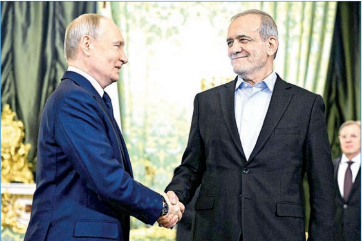
Russian President Vladimir Putin and Iranian President Masoud Pezeshkian shake hands before a meeting at the Kremlin in Moscow, Russia.

also addressed. Iranian President Masoud Pezeshkian and Russian President Vladimir Putin in a telephone conversation discussed the construction of the Bushehr nuclear power plant (NPP), as well as Russia's replacement of fuel at an operating reactor, the presidential office said on Monday. — SPUTNIK