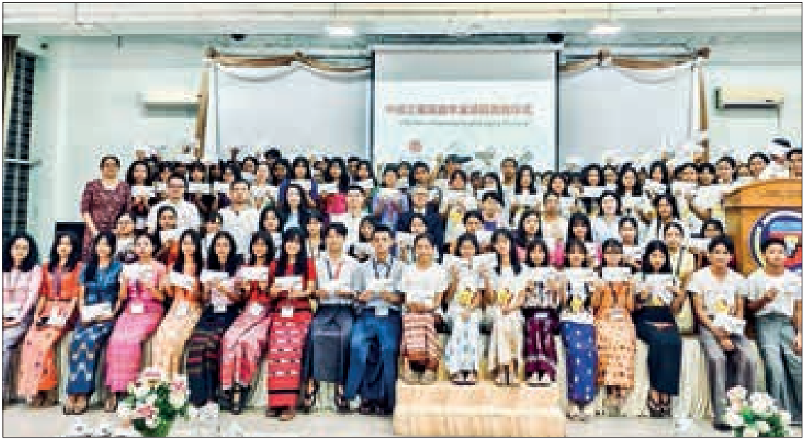
Prize-winning students from YUFL have documentary photos taken with distinguished guests.

In fact, CITIC Star Scholarship Programme is a platform created for students to have improvement together with CITIC