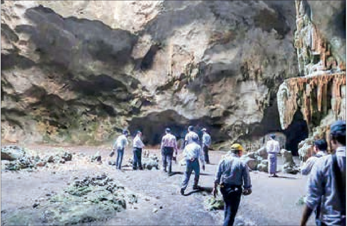
This photo captures a fieldwork at Pyadalin Caves in Shan State, aiming to complete the Stone Age history of Myanmar.

THE Ministry of Religious Affairs and Culture is reportedly working to publish books on a unified chronology of Myanmar’s history. In this regard, the following draft history books have been edited and prepared with the recommendations and guidance of leading historians: “The Formation of Myanmar’s Soil and the Discovery of Myanmar’s Primitive Fossils”, “The Myanmar Stone Age”, “The Myanmar Bronze and Iron Ages”, and “The Early Urban Culture of the Pyu Period”. The ministry is working to collect, compile, and prepare necessary information, documentary photographs, and maps for printing, to ensure that the draft history books are free from errors and misconceptions. In addition, discussions are underway regarding the publication of the books, including approval of book sizes and cover designs, as well as the preparation and submission of the necessary procedures and requirements by the end of August. — ASH/TH