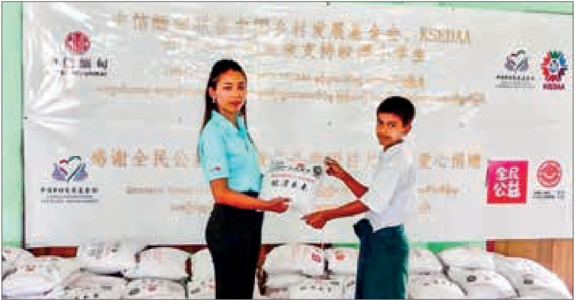
Foodstuff being distributed to a student at the distribution centre-1 in Kyaukpyu.

These rice sacks started their journey from Yangon,