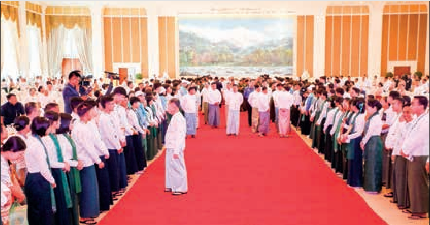
Vice-Senior General Soe Win warmly greets the outstanding students who secured the highest marks in the 2025 matriculation exam at the yesterday's ceremony in Nay Pyi Taw.

He stressed that for the success of the election, which is crucial to building a