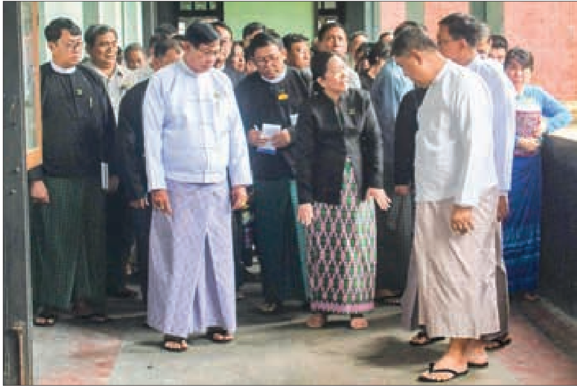
Union Chief Justice U Tha Htay and officials inspect the ancient Yangon Region High Court building on Pansodan Street, Kyauktada Township, Yangon Region, yesterday.

At the Yangon Region High Court building, officials explained the building's current condition, the restoration and maintenance plan, and plans for further work. The Chief Justice of the Union and the Union minister stated that, as a cultural heritage building, it must be systematically renovated and maintained to high standards without altering the original structure, while the responsible groups coordinate with the Department of Archaeology and National Museum and conduct