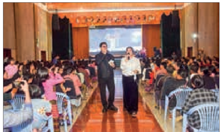
Artistes entertain departmental staff and local residents with musical performances in Loikaw, Kayah State yesterday.

After the performance, the Union minister and the state chief minister presented honorary cash awards to the artistes. — MNA/KZL