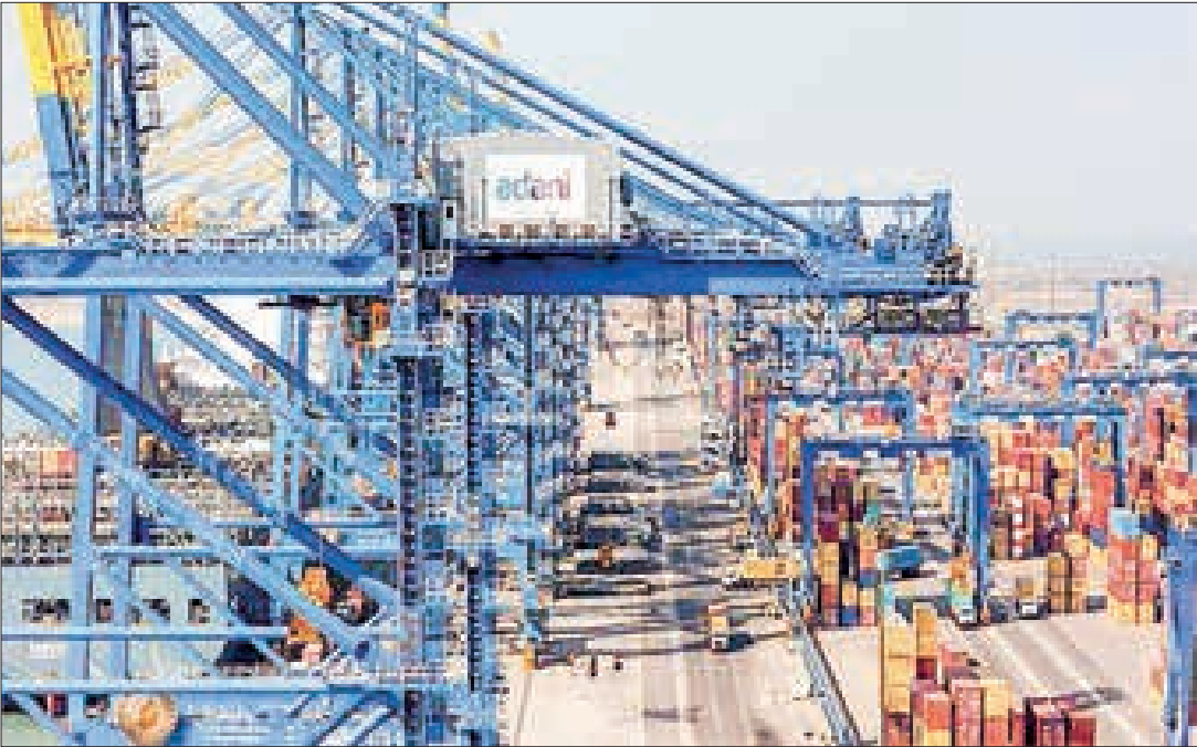
An Adani Port.