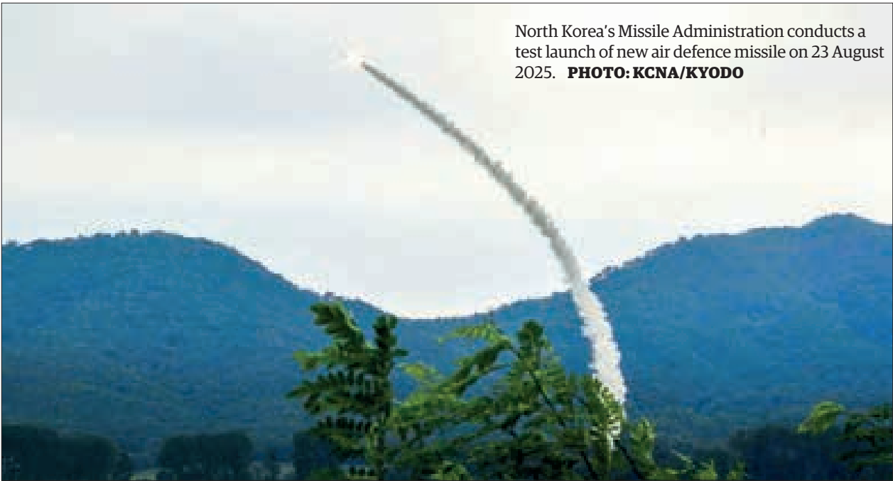
North Korea's Missile Administration conducts a test launch of new air defence missile on 23 August 2025.

A test of modified advanced surface-to-air missiles to assess their combat capabilities has been conducted in North Korea, with the country's leader Kim Jong-un observing the event, according to the news agency KCNA. “The General Directorate of