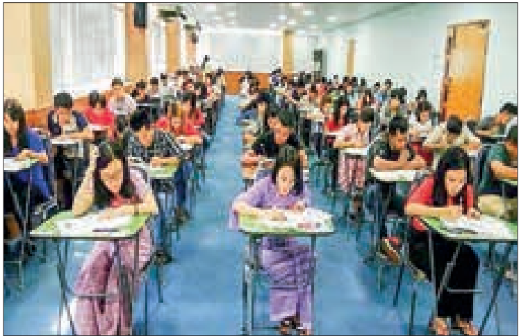
This image shows the JLPT exam being held in the previous year.

21 August, and the extension of online application for these levels has stopped, said MAJA. However, applications for N3 and N4 for both Yangon and Mandalay will continue to be accepted and will be closed when seats run out, it said. — MT/ZS