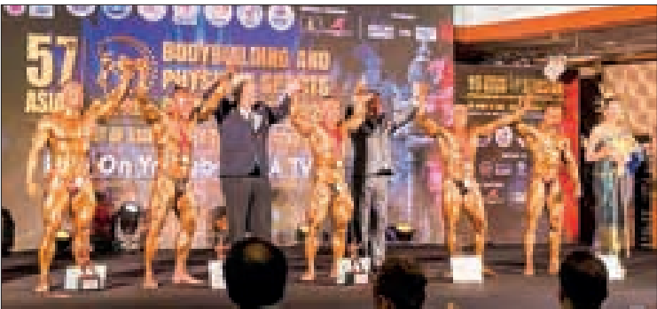
Officials and winners pose for documentary group photo during 57 th Asian Bodybuilding and Physique Sports Championship in Bangkok, Thailand.

ATHLETES of the Myanmar Bodybuilding and Physique Sports Federation competed in the LVII Asian Bodybuilding and Physique Sports Championship,