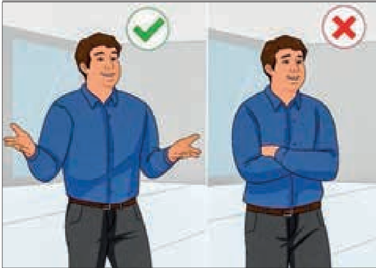
Our words and actions shape reality, and cultivating truthfulness is essential for fostering genuine connections and reducing suffering.

(Views expressed in the article belong solely to the author.)