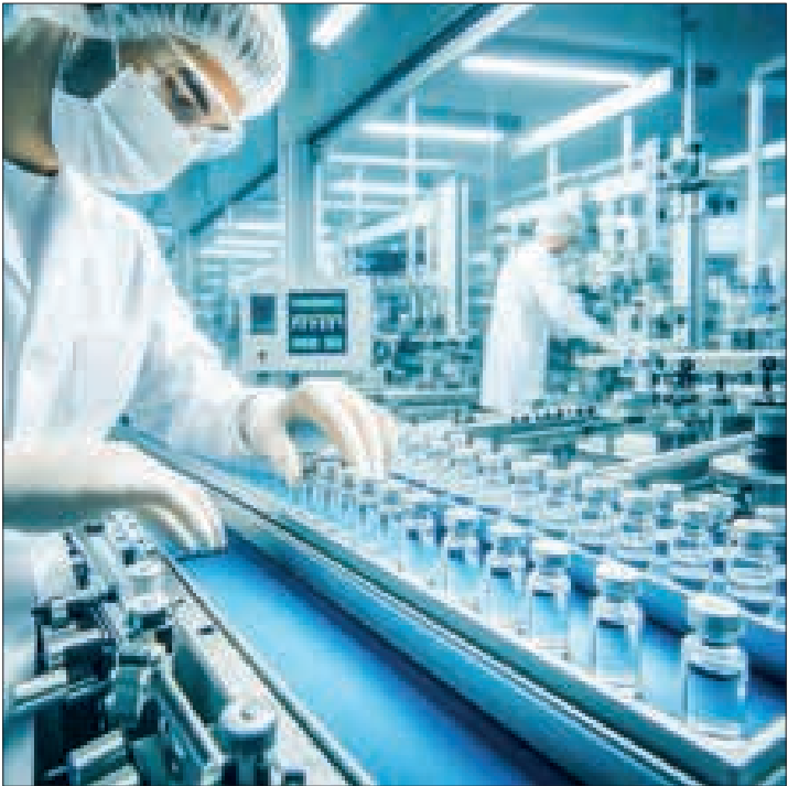
The EY report highlights sectoral impacts across IT, energy, pharma, automotive, and hospitality.

INDIA’S outbound investments has jumped by 67.74 per cent to US$41.6 billion in FY2024-25 from US$24.8 billion in FY2023-24, as per a new EY report. The number of transactions also rose by 15 per cent, signalling a sharp uptick in global confidence, states the report titled