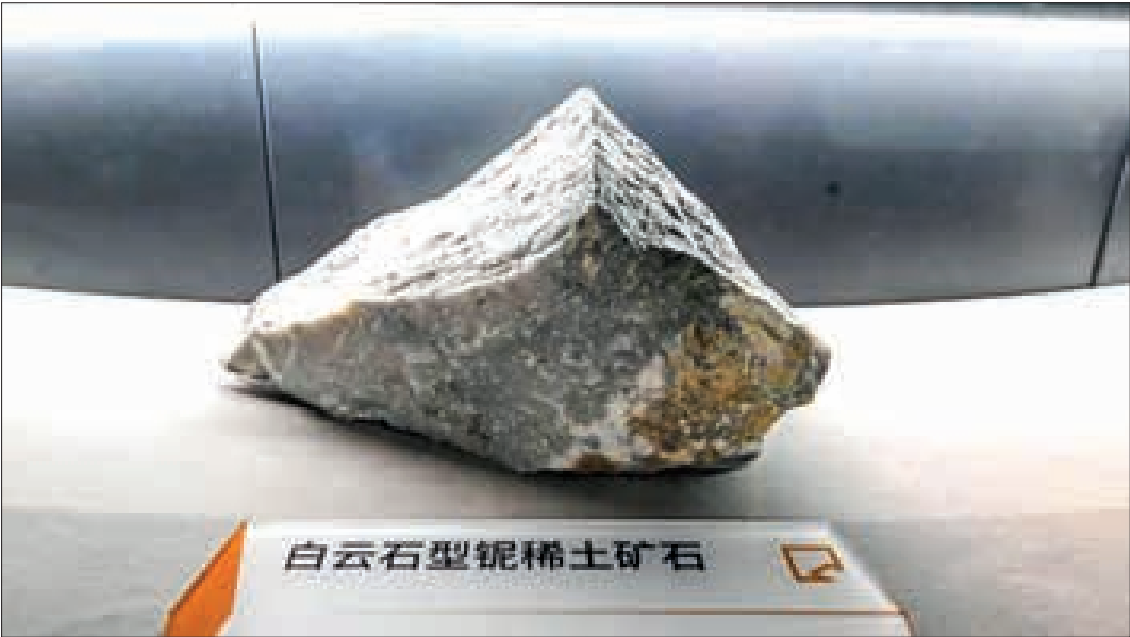
This photo taken on 10 May 2024 shows a piece of rare earth ore at a rare earth museum in Baotou, North China's Inner Mongolia autonomous region.

Local authorities have been urged to step up supervision and inspection of quota implementation and address violations in accordance with the law. — Xinhua