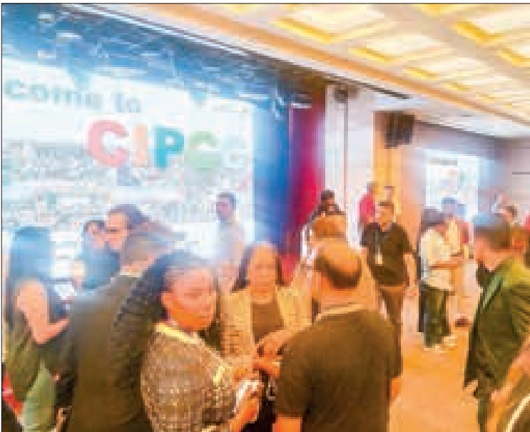
Foreign journalists are seen at the media exchange and training programme in Beijing, China.

“The CIPCC programme will allow participants to study China’s development, learn about the media’s transformation process, and explore aspects of the country’s cultural heritage. Participants will also have the chance to interact with people from all walks of life in and outside Beijing, attend important