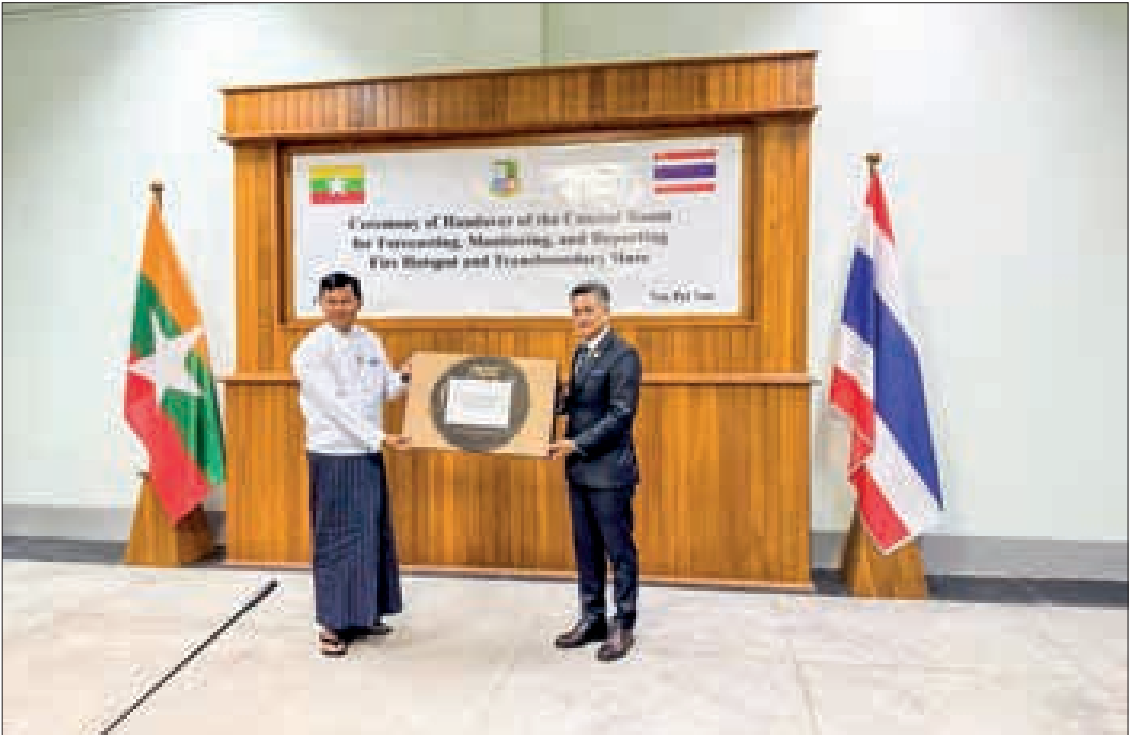
This photo showcases the Thai government official handing over the air pollution observatory Surveillance War Room to the Myanmar official.