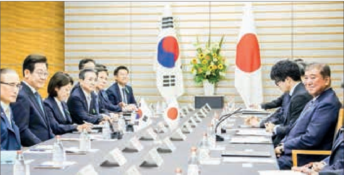
Japanese Prime Minister Shigeru Ishiba (far R) and South Korean President Lee Jae Myung (2 nd from L) hold talks in Tokyo on 23 August 2025.

JAPAN and South Korea agreed Saturday to develop bilateral relations steadily and in a “future-oriented” manner based on the “foundation” laid since their ties were normalized six decades ago, as they face common security and economic challenges.