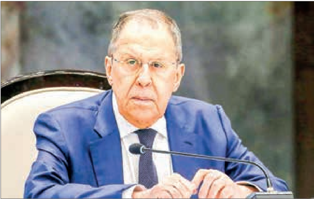
Russian Foreign Minister Sergey Lavrov.

Lavrov emphasized focusing on outcomes from the 2022 Istanbul negotiations and stated that Moscow will offer its own guarantees for Ukraine.