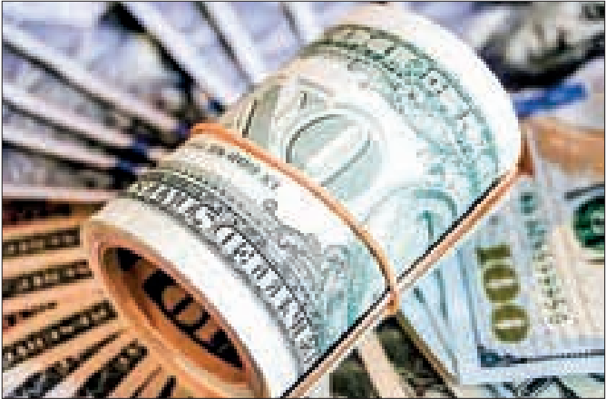
Greenbacks are seen at one of money changers in Yangon.

THE Central Bank of Myanmar (CBM) announced on 19 August that it would sell US$32 million to fuel oil importers. Additionally, CBM sold $314,375 to edible oil-importing companies and $36,550 to those who made non-trade payments, in addition to an injection of $337,500 into the financial market on that day. CBM sold $700,800 to edible oil-importing companies and over $429,200 to fuel oil-importing companies on 18 August, in addition to an injection of 579,910 yuan into the financial market. Additionally, CBM sold over $429,260 to CMP companies and those who made non-trade payments on that day. CBM sold $1.16 million to edible oil-importing companies and over $76,600 to CMP companies and those who made non-trade payments on 15 August, in addition to an injection of $244,000 into the financial market. CBM pumped $1 million and over 1.27 million yuan into the financial market on 14 August. Furthermore, CBM sold over $1.88 million to edible oil-importing companies and over $220,900 to CMP com-