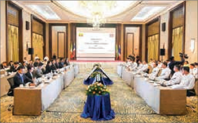
Myanmar's Ministry of Natural Resources and Environmental Conservation and Thailand's Ministry of Digital Economy and Society hold the bilateral meeting on water quality management in Nay Pyi Taw yesterday.