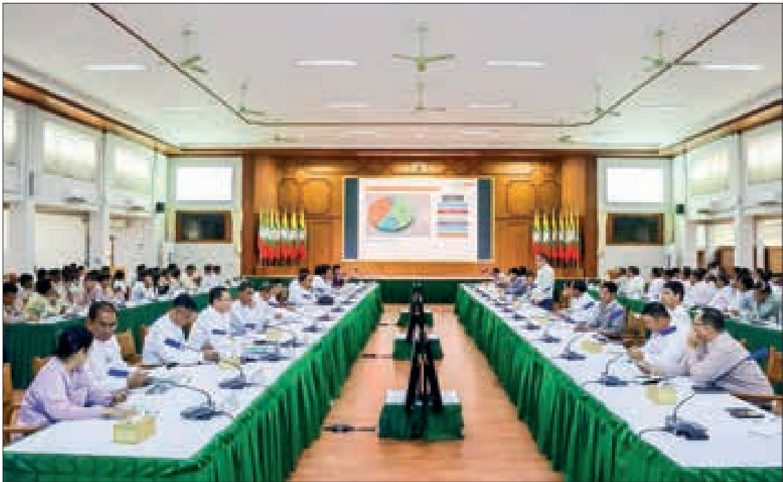
A Public-Private Dialogue on developing paddy and export zones implementation and seed in progress between the Ministry of Agriculture, Livestock and Irrigation and the Myanmar Rice Federation in Nay Pyi Taw on 18 August.

MINISTRY of Agriculture, Livestock and Irrigation and Myanmar Rice Federation jointly organized a Public-Private Dialogue on export zones implementation and developing paddy seed production businesses was held on 18 August at the meeting hall of the ministry in Nay Pyi Taw. Deputy Minister of the ministry and officials concerned, President of MRF and representatives, regional committee chairmen, exporters, fertilizer companies, seed production companies, and farmers participated in the dialogue. The meeting also highlighted setting agricultural export zone on contracted farmland areas in collaboration with farmers and export companies, cultivating only paddy seed designated