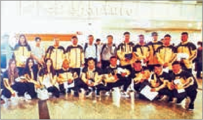
The Myanmar national bodybuilding and fitness team pose for the documentary photo before departing for Thailand yesterday. Fitness Championships.