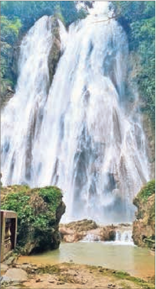
This photo features the naturally beautiful Dattawgyaik Waterfall.

by motorbike or with a porter, you'll need to be brave enough for the ride. Recently, during the dry season, I've seen groups of tourists cycling, and the fitter ones even manage to cycle back. The descent to the waterfall isn't too tiring, but the hike back up is very exhausting, so I wouldn't recommend it for the elderly or young children," said a local travel service operator. Most tourists visiting the waterfall are from Mandalay, arriving in groups by bicycle, motorbike, or car, with hundreds coming on weekends and public holidays. — ASH/TH