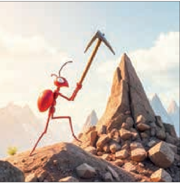
ခါချဉ်ကောင် မာန်ကြီးလို့ တောင်ကြီးဖြူမည့်ကြံ ခါးကမသန်