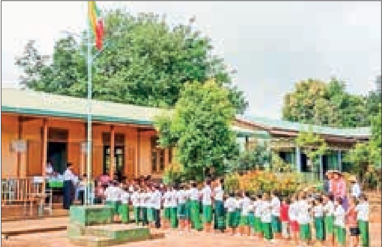
This photo shows schoolchildren and teachers lining up in unison for a morning assembly in Nawnghkio. BASIC education schools in Nawnghkio Township, which had been closed for nearly a year due to terrorist attacks, reopened on 25 July 2025. Students have resumed classes, and school enrolment activities continue. Today, three further basic education schools reopened, bringing the total number of operational schools in the township to 78. An additional 455 students were enrolled, raising the total number of students attending classes peacefully to 9,672. Also, the township's general hospital, which had been

damaged by terrorist acts, has been repaired and reopened on 2 August to provide healthcare services to local ethnic communities. Today, the hospital provided necessary medical examinations and treatments to 38 outpatients for illnesses such as influenza, measles, and general diseases. Blood type testing was conducted for 36 residents, and malaria testing was carried out for three residents. Meanwhile, 34 residents received inpatient medical care. Medical teams continue to deliver essential healthcare services to the community. — MNA/KZL