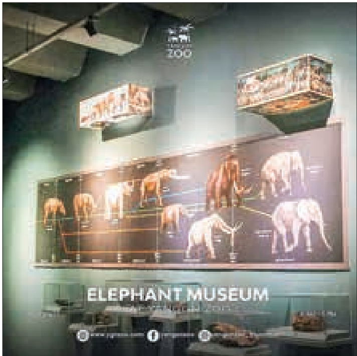
This photo shows the interior display of the Elephant Museum at Yangon Zoo.

THE Yangon Zoo has invited the public to explore Myanmar’s first international natural heritage sanctuary, the Elephant Museum inside the zoo, as one of the must-visit destinations.