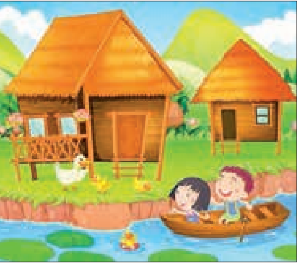
ဝါဆို ဝါခေါင် ရေဖောင်ဖောင်