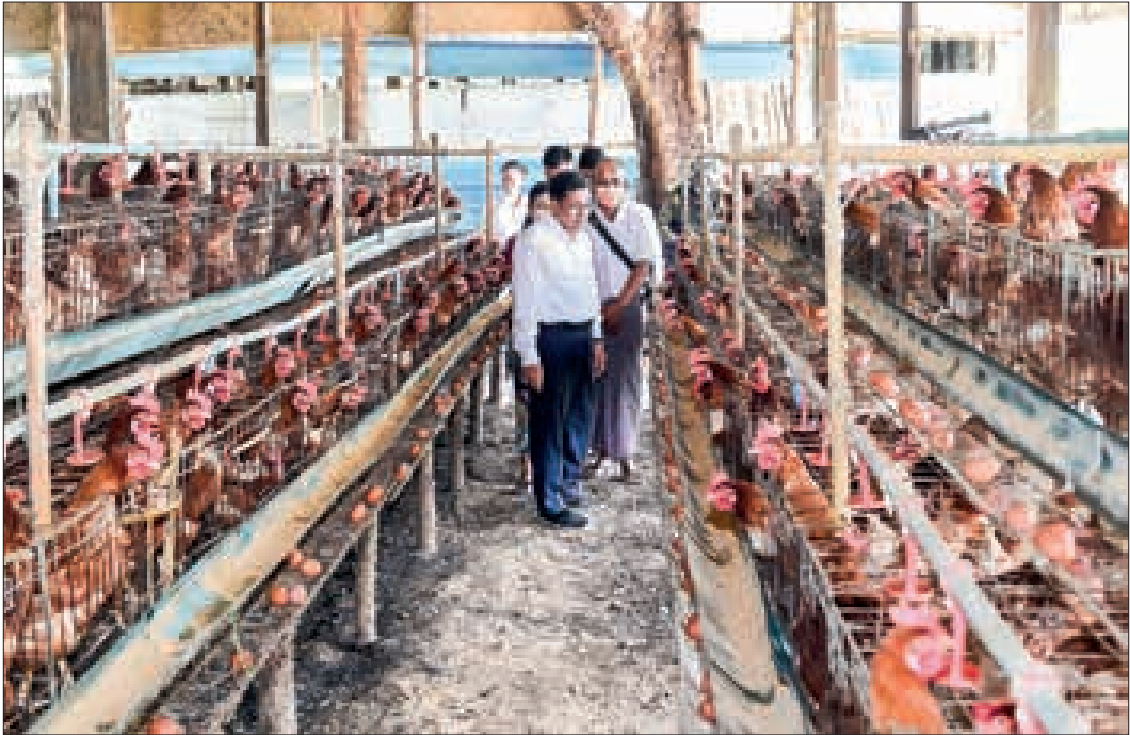
Senior General Min Aung Hlaing inspects layer hens at the Shwe Tint Wan livestock zone in Aunglan.

He gave guidance to systematically operate livestock activities, grow windbreaks in the livestock zone and carry out