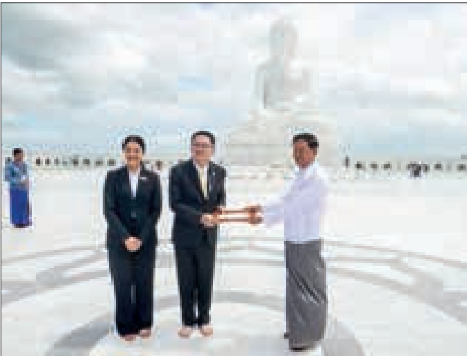
Thailand's Deputy Prime Minister and Minister of Digital Economy and Society Mr Prasert Jantararungtong presents donations to an official from the Maravijaya Buddha Image.

A Myanmar-Thailand bilateral meeting on water quality management, aiming at enhancing bilateral cooperation in water quality management and monitoring, and preventing and controlling water pollution between the two countries, was organized at the Jasmine Hotel in Nay Pyi