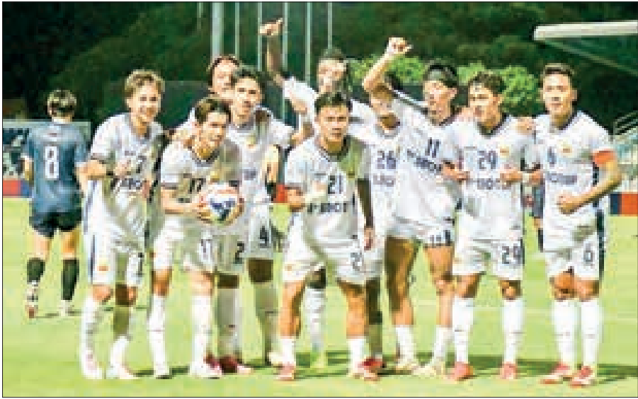
Photo shows Myanmar's Shan United Football Club ahead of their participation the 2025-2026 ASEAN Club Championship.

THE 2025-2026 ASEAN Club Championship resumes today with the opening match of Group B, where Myanmar's Shan United will take on Cambodia's Preah Khan Reach Svay Rieng. For the final stage of the tournament, Group A features reigning champions Buriram United (Thailand), Pathum United (Thailand), Selangor (Malaysia), Công An Hà Nội (Vietnam), Tampines Rovers (Singapore), and CEBU (Philippines).