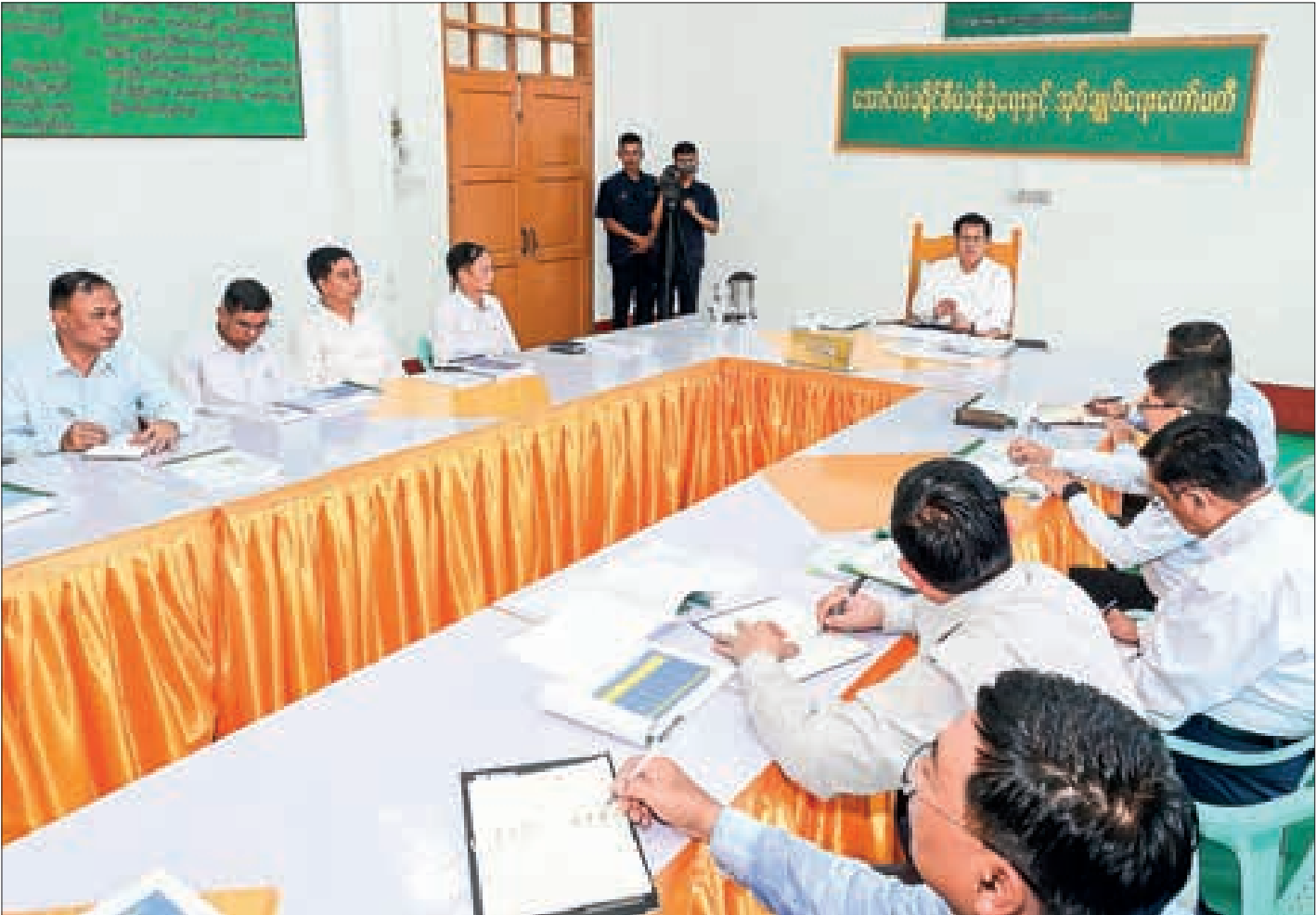
Chairman of the State Security and Peace Commission of the Republic of the Union of Myanmar Senior General Min Aung Hlaing meets departmental officials in Aunglan for regional development yesterday.