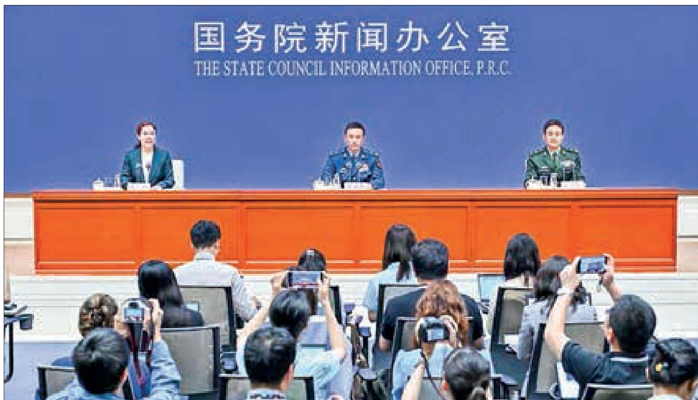
A press conference on V-Day military parade preparations is held by the State Council Information Office in Beijing, capital of China, 20 August 2025.

The event marks the 80 th anniversary of victory in the Chinese People's War of Resistance Against Japanese Aggression and the World Anti-Fascist War.