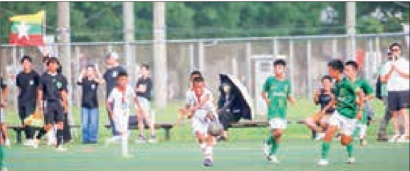
The Myanmar U12 team in action against the Tokyo Verdy youth team.

THE second day of the U12 Junior Soccer World Challenge 2025 took place on 20 August in Chiba, Japan. The Myanmar U12 team played two group-stage matches on the second day but suffered defeats in both games. Myanmar lost 0-2 to Japan's Tokyo Verdy youth team and 0-3 to Japan's Econos youth team. Overall, Myanmar's U12 squad finished the group stage with one draw and three losses. The final day of the group stage is scheduled for today, after which Myanmar will proceed to the placement matches. — Chit Ko Ko/KZL