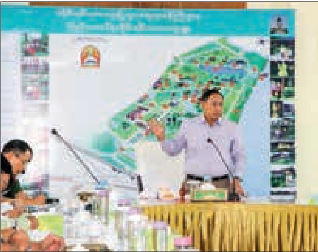
Union Minister Lt-Gen Yar Pyae discusses with staff of the Ministry of Border Affairs and of Ethnic Affairs at the Union National Races Village (Yangon) yesterday.

establish a small forest around the terminal to contribute to the greening of the environment. — MNA/TTA