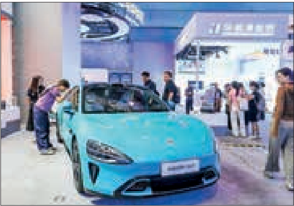
Visitors view a car of Xiaomi SU7 series at the Zhongguancun Exhibition Center in Beijing, capital of China, 20 June 2025.

Xiaomi’s auto super factory in the Beijing Economic-Technological Development Area, where round-the-clock shifts and robotic arms hum with activity. An official from the bureau said surging orders of popular models such as Xiaomi’s SU7 and YU7 led companies to optimize production through smart tech upgrades, so as to boost equipment utilization and efficiency to accelerate deliveries. — Xinhua