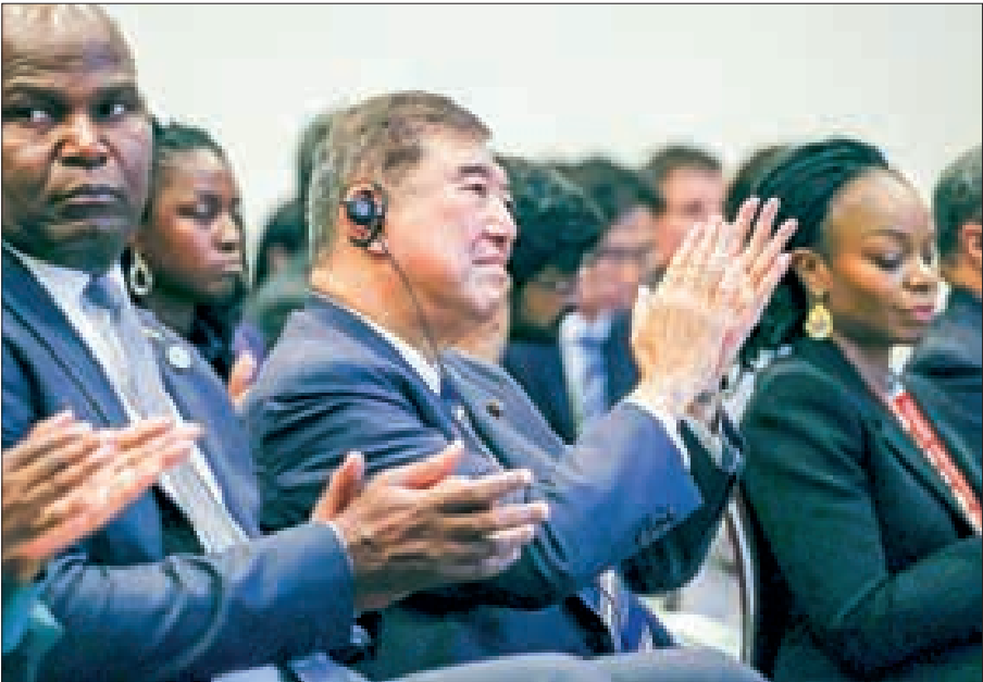
Japanese Prime Minister Shigeru Ishiba (C) attends an event ahead of the opening ceremony of the Tokyo International Conference on African Development on 20 August 2025 in Yokohama.

JAPANESE Prime Minister Shigeru Ishiba proposed an “economic zone” encompassing the Indian Ocean region and Africa during a major aid conference for African nations on Wednesday. In a speech to open the three-day Tokyo International Conference on African Development, the ninth of its kind, Ishiba pledged to cultivate 30,000 artificial intelligence experts in Africa over the next three years and announced the launch of a framework to be joined by governments, industries and academia to promote free trade in the region. — Kyodo