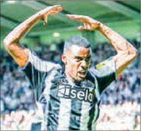
Alexander Isak wants to force his way out of Newcastle.

Liverpool have reportedly had a £110 million bid ($149 million) rejected for the 25-year-old, with Newcastle holding out for a British transfer record fee of up to £150 million. Isak released a statement on Tuesday after deciding not to appear at the Professional Footballers' Association awards event despite being selected in the Premier League 2024/25 team of the year. "I've kept quiet for a long time while others have spoken. That silence has allowed people to push their own version of events, even though they know it doesn't reflect what was really said and agreed behind closed doors," Isak posted on Instagram. "The reality is that promises were made and the club has known my position for a long time. To now act as if these issues are only emerging is misleading. — AFP