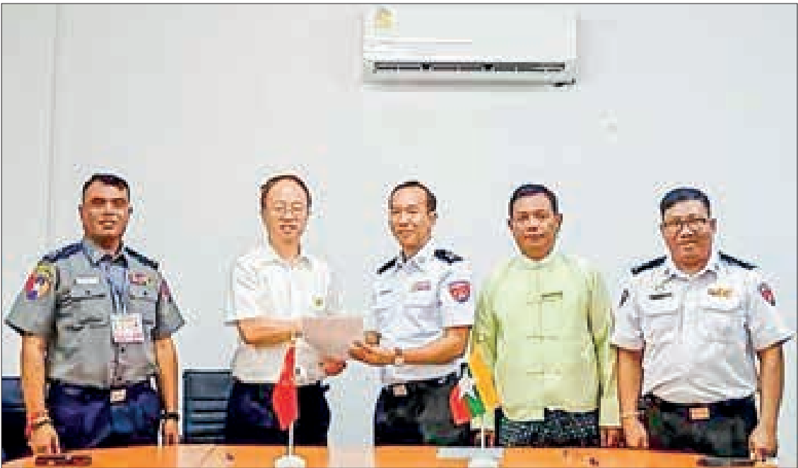
Myanmar officials hand over repatriation documents of 94 Chinese nationals to official of Chinese Ministry of Public Security yesterday. ment, the Law Enforcement as well as officials from the Thai Immigration Bureau. Myanmar authorities formally handed over