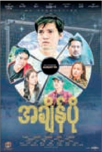
This image reveals the main characters in the film 'Extra Time'.

THE Myanmar movie 'Extra Time' will be screened in major cinemas nationwide on 22 August, according to a media conference held at San Tea Shop in Thakayta Township, Yangon Region, on 19 August.