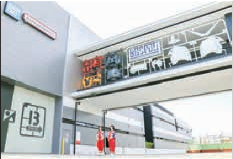
This photo shows a monument modelled after life-sized parts from a Gundam plastic model kit at Bandai Spirits Co.'s museum in Shizuoka on 20 August 2025.

BANDAI Spirits Co on Wednesday unveiled a hands-on museum set to open 2 September inside its plastic model production plant in Shizuoka, central Japan, showcasing the latest manufacturing technologies. At the entrance, visitors will be greeted by a monument modelled after life-sized parts from a plastic model kit of Gundam, a world-famous giant robot from the long-running Japanese anime franchise and a symbol of the country’s pop culture. By establishing the new facility in Shizuoka, which aims to promote local revitalization through the city’s model industry, Bandai Spirits will try to draw plastic kit fans from Japan and abroad, encouraging them to experience the region’s craftsmanship. Shizuoka has long been known as the nation’s hub for model making, building on its tradition of woodworking fostered by rich natural surroundings, and later becoming home to leading plastic model makers, according to the local government. Admission will be by reservation only, with tickets priced at 2,860 yen ($19) for visitors aged 13 and older, 1,100 yen for those 12 and under, and free for pre-school children. — Kyodo