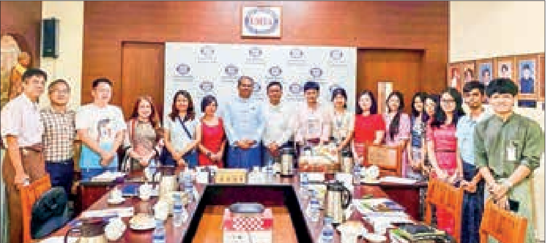
An internship programme for the National Management Degree College students in June.