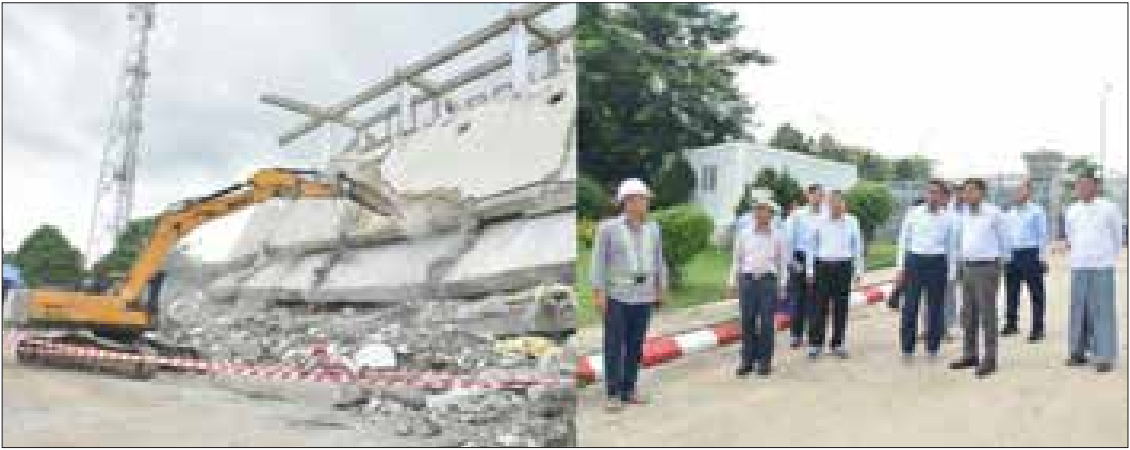
SAC Member Deputy PM MoD Union Minister General Maung Maung Aye reviews the dismantling of quake-hit buildings in Nay Pyi Taw.

Pyi Taw Council Chairman U Than Tun Oo, oversaw the extension of a four-storey building at the Ministry of Foreign Affairs and the communication building of the Ministry of Transport and Communications. They proceeded to Bala Theikdhi and Nyana Theikdhi wards to inspect the staff housing, reuse of excavated materials and waste disposal systematically. The level 1 task force ex-