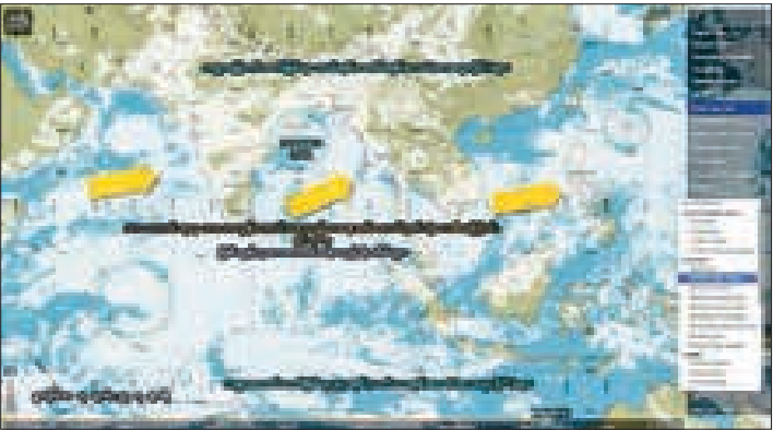
This graph shows whirlwinds in the northern and southern hemispheres.

IN the north-eastern part of the Bay of Bengal, whirlwinds and low-pressure zones are possible, but no major storms are likely to develop until the end of the monsoon, said meteorologist U Win Naing. Clockwise whirlwinds in the southern hemisphere near the equator and counter-clockwise whirlwinds in eastern Philippines, northern Indian Ocean, Arabian Sea and Bay of Bengal are increasing the strength of the southwest monsoon current. Started in the early monsoon of 2025, the situation may continue until the end of August. In the northern Bay of