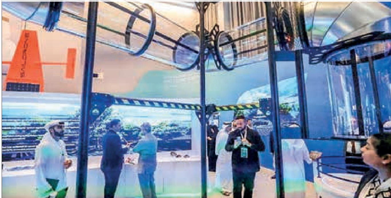
The UAE Climate Tech forum in Abu Dhabi, held in 2023, highlighted advancements in carbon capture technology, emphasizing innovation and collaboration to combat climate change.

THE Organization of the Petroleum Exporting Countries (OPEC) is set to hold its 9 th OPEC International Seminar from 9 to 10 July, bringing global energy leaders to Vienna to discuss key industry issues and build up cooperation.