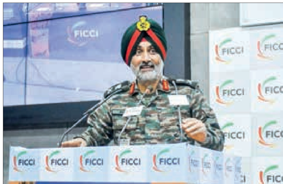
The announcement was made by Lt-Gen Amardeep Singh Aujla at a defence industry conference.

“We want to change the deterrence equation by ultra-fast and highly manoeuvrable weapon systems,” Lt-Gen Aujla stated, emphasising the need to transition from conventional “dump category” ammunition to smart, precision-guided munitions. According to Aujla, the modernization plan focuses on loitering ammunition and precision-guided munitions that will reduce collateral damage while enhancing the Army’s surgical strike capabilities.