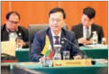
Deputy Minister Dr Zaw Myint attends the 53 rd SEAMEO Council Conference in Brunei.

A Myanmar delegation led by Deputy Minister for Education Dr Zaw Myint attended the Plenary Session of the 53 rd Southeast Asian Ministers of Education Organization (SEAMEO) Council Conference, held on 2 July in Bandar Seri Begawan, Brunei Darussalam.