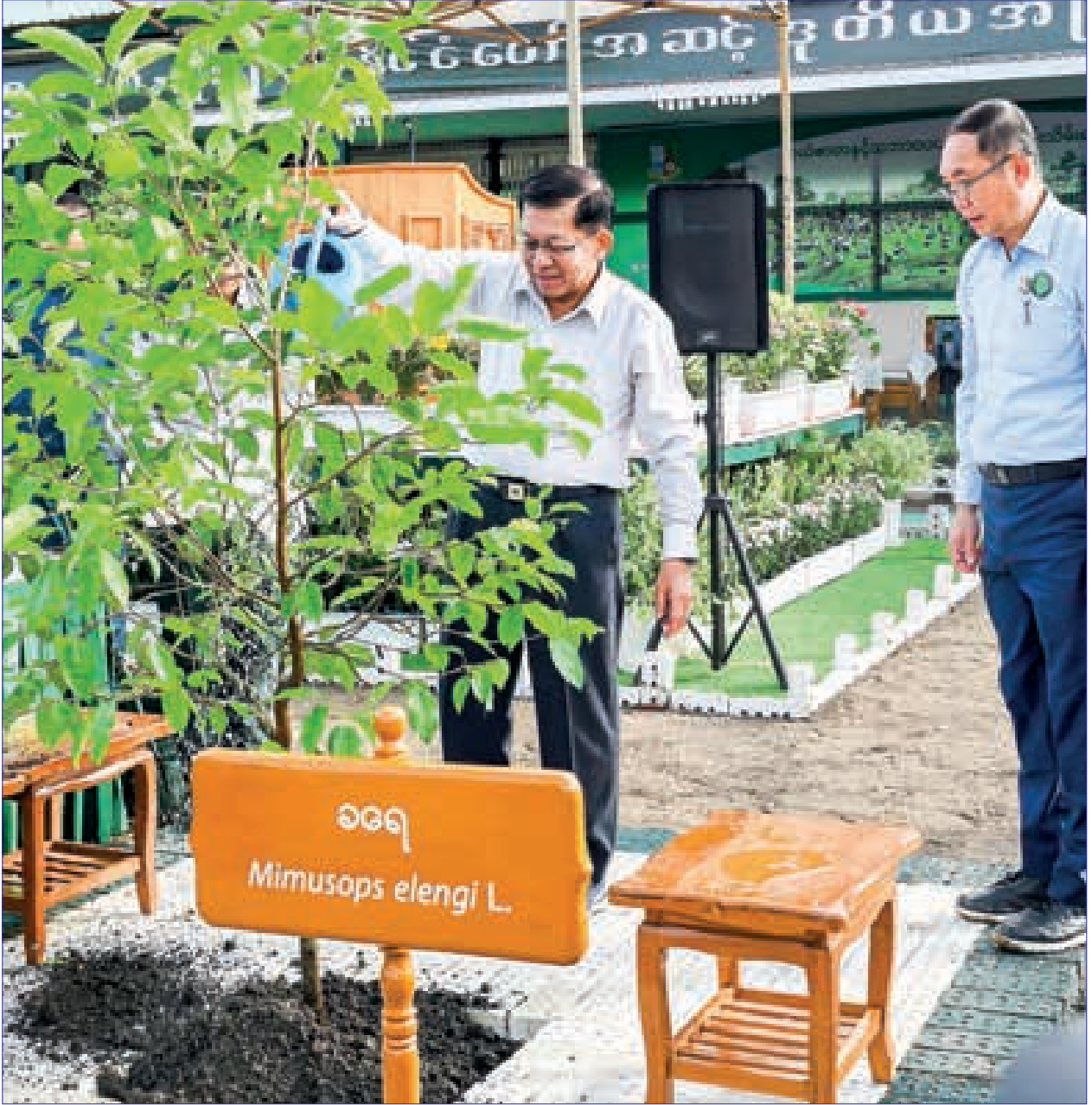
State Administration Council Chairman, Prime Minister Senior General Min Aung Hlaing water a neem sapling after planting it at the second monsoon tree-planting event for 2025 yesterday.

Senior General Min Aung Hlaing underscored that the government is expediting its efforts in growing trees along both sides of roads and the establishment of a two-acre firewood plantation per village, in addition to greening 13 districts in order to increase forest coverage areas and prevent loss of water and fertile soil. Chairman of the State Administration Council, Prime Minister Senior General Min Aung Hlaing, planted a neem sapling at the second monsoon tree-growing ceremony for 2025 held in Yanaungmyin forest reserve in Dekkhinathiri Township of Nay Pyi Taw yesterday morning. Speaking on the occasion, the Senior General unveiled that the government plans to establish forest reserves and protected public forests for 30 per cent of the country in order to increase the forest coverage area of the nation and protect wildlife and significant geophysical areas, while arranging to set up natural conservation areas for 10 per cent. During its tenure, he recounted that the government has formed more than 660,000 acres of 61 forest reserves and protected public forests and more than 610,000 acres of 16 natural conservation areas. As the Senior General stressed that the government has established 1,324 forest reserves and protected public forests on 25.94 per cent of land areas