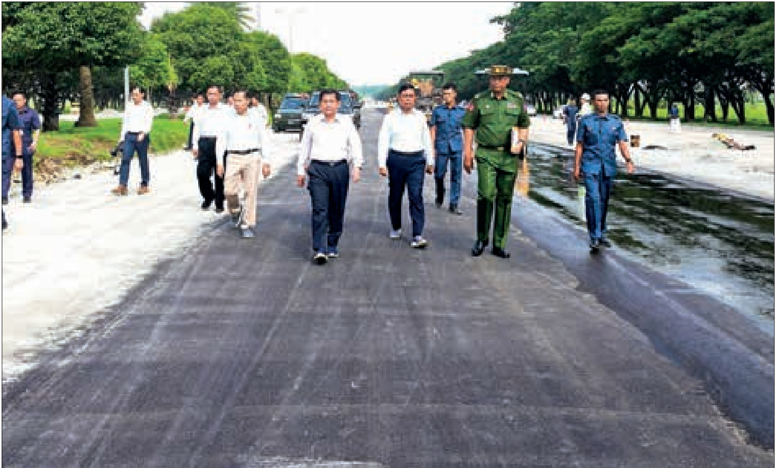
State Administration Council Chairman Prime Minister Senior General Min Aung Hlaing is pictured during his inspection of the repair and upgrading of roads in Nay Pyi Taw.

He stressed that at curved sections of the median strip, road evenness must also be ensured, and road paving works must be carried out promptly and efficiently to ensure their