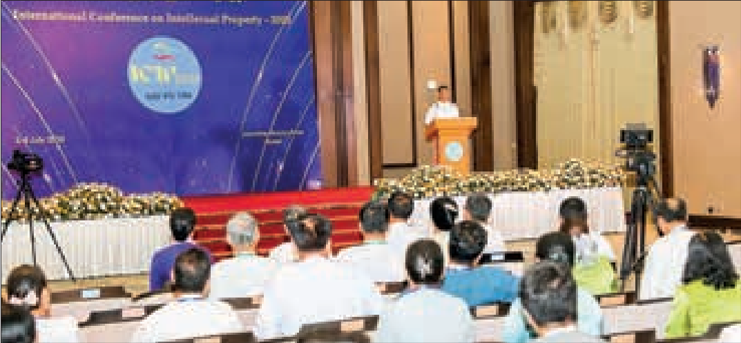
Union Minister U Tun Ohn speaks at the second day of the 2025 International Intellectual Property Conference yesterday.

heart of Mandalay, also reaches its 100 th anniversary. Therefore, Mandalay Myoma Band proudly played for “Mandalay University Centenary Music Concert”, and the event was broadcast live on Friday Night Live Show of MRTV. — MNA/KTZH