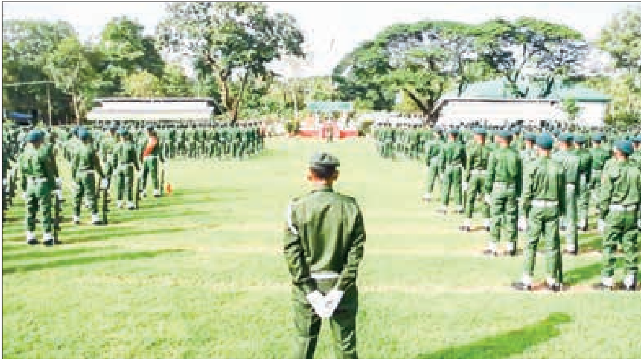
This photo captures the graduation parade of the People's Military Service Training 12 yesterday.

Officials awarded top-performing trainees with distinctions in categories such as Best Trainee, Best Training, Code of Conduct, Best Marksmanship, Best Mine Handling, and so on.