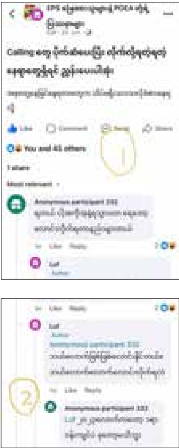
Screenshots of chat brokers made in the EPS applicants' group.

THE Employment Permit System (EPS) Centre in Myanmar has issued a special warning not to be deceived, as its system cannot be accessed by brokers. As incidents of cheating by agents, problems among EPS applicants and complaints on POEA were found in an online group, it issued the alert on 3 July to all EPS applicants who are waiting for a call to enter the Korean labour market. In the group of EPS applicants and POEA Issues, one person asked if they could pay for calls, some brokers replied that it was possible, but they need to pay a lot. Amidst such cheating, candidates should be careful not to be deceived by agents, and the EPS system is not accessible to the brokers, while it cannot be facilitated by money, the centre warned, in the best interests of anyone not to suffer losses. The EPS application process for recruitment and permit issuance, which is done by the computer system, includes recruitment requests by Korean employers, introducing three random candidates who meet requirements to employees by the EPS system, and selecting one candidate by the employee. After the selection, it is followed by various steps such as signing an employment contract with employees, visa application and leaving for Korea, it said. — MT/ZN