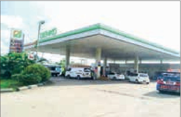
Vehicles are seen refuelling at the petrol station in downtown Yangon.

IN recent weeks, the prices of fuel and palm oil have increased due to the increase in local prices, which has led to an increase in prices at the Yangon port. Currently, fuel price has fallen from about K100 to K125 per litre and palm oil to about K125 per viss, and the price of soybean oil has also declined. Ships carrying both fuel oil and palm oil are constantly entering the ports, so they can be purchased at lower prices without any shortage. — MNA/MKKS