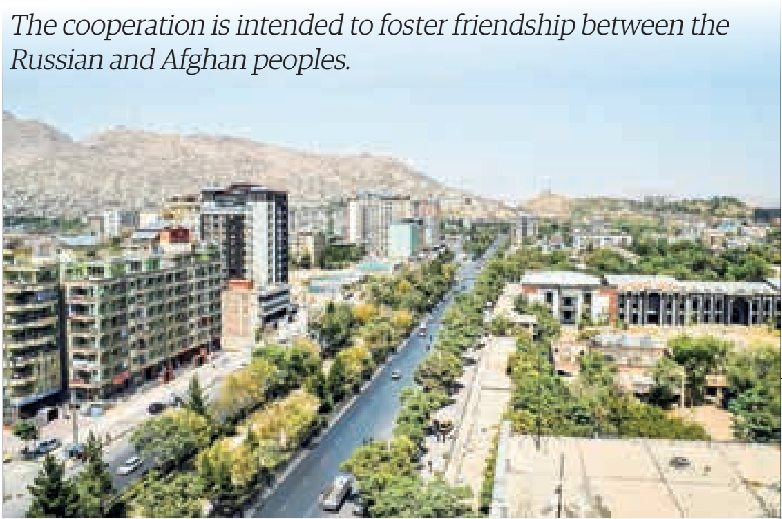
The cooperation is intended to foster friendship between the Russian and Afghan peoples.

RUSSIA will continue providing assistance to Afghanistan in strengthening regional security and combatting terrorism and drug trafficking threats, the Russian Foreign Ministry said in a statement on Thursday.