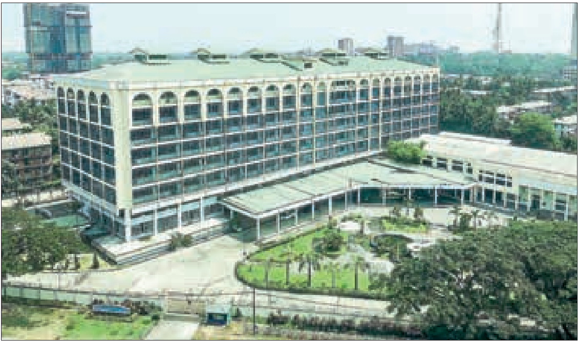
An aerial drone view of the Central Bank of Myanmar (CBM) office in Yangon.

CBM sold $1 million to commodities-importing companies