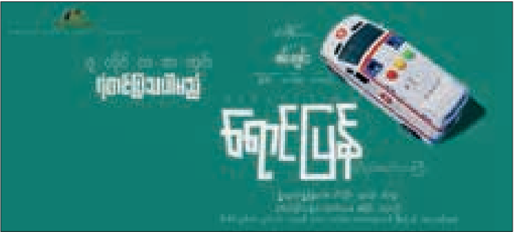
This photo features the poster for the film Reflection.

The film’s cast includes Academy Nay Win, Academy Chuu Lay, Than Tha Nyi, Khin Hlaing, Nay San, Min Thu, and many others. — ASH/MKKS