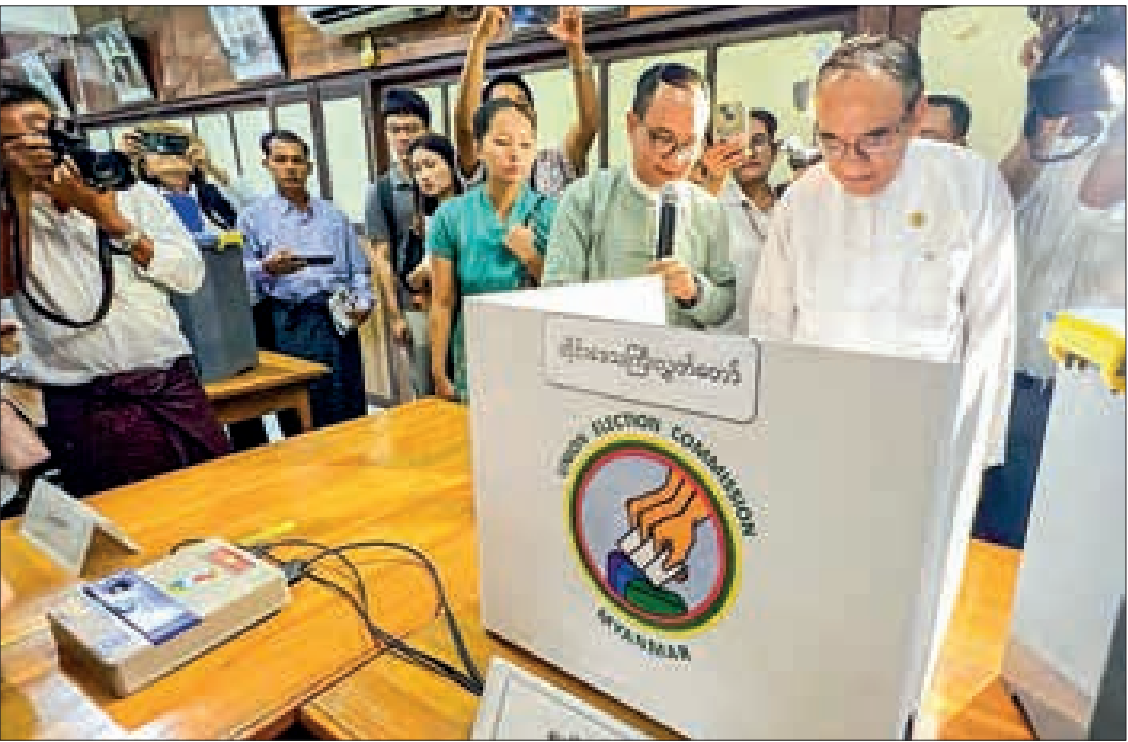
This photo captures officials explaining the Myanmar Electronic Voting Machine to journalists.

By using the MEVM, issues such as rejected votes and problems associated with paper ballots, like wax markings or the insertion of duplicate ballots, will reportedly be eliminated.