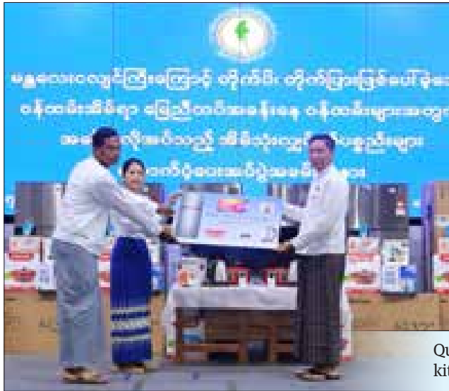
Quake-impacted staff receives electronic kitchen utensils and devices.

amined the quake-affected government office buildings, staff housing and dormitories systematically, and the blue-coloured buildings were prioritized for repair. The orange-coloured buildings were examined by the Level 2 task force and repaired per the Standard Operating Procedure (SOP). Similarly, the buildings with huge damage in structure are being demolished, and plans are underway to draft designs, which can withstand earthquakes up to magnitude 8 on the Richter scale, soil test and layout plan. — MNA/KTZH