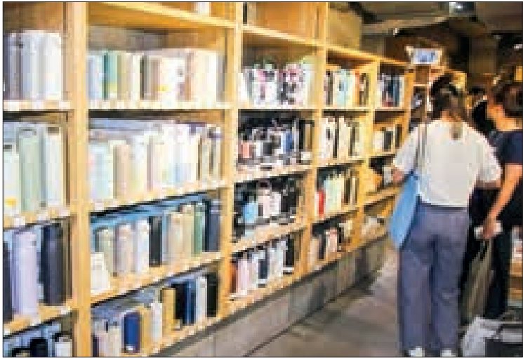
This photo shows a section dedicated to water bottles at a variety store in Tokyo on 2 July 2025.

Tiger Corp, an insulated bottle maker, noted that more consumers are opting for reusable bottles to save money, highlighting a shift in purchasing behaviour amid the ongoing heatwave. — Kyodo