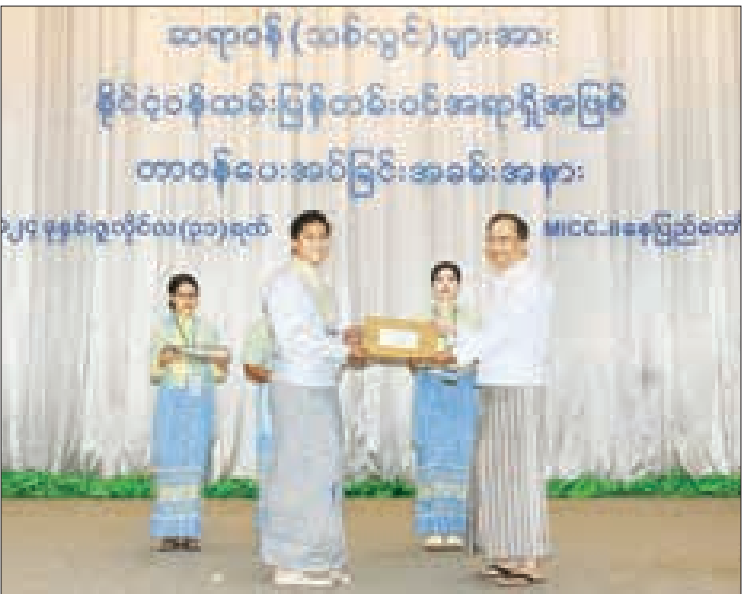
This photo showcases the ceremony for civil servants for fresher doctors in July 2024.

healthcare for the public, so they will need to work as per their ethics and treat their patients politely, he said. He also urged the respective medical institutions to carefully pay attention to the assurance of practising licences under MOH's policies and directives, to be systematic and not to make it delay. — Htun Htun/ZS