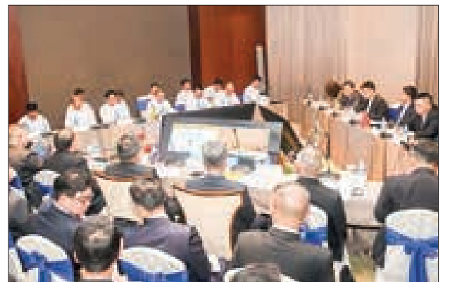
The 2 nd China-Myanmar-Thailand Ministerial Meeting on Combatting Transnational Crime in progress yesterday in Nay Pyi Taw.

THE second China-Myanmar-Thailand Ministerial Meeting on Combatting Transnational Crime was held at the Jasmine Nayspyitaw Hotel in Nay Pyi Taw from 9 am to 11:30 am on 4 July.