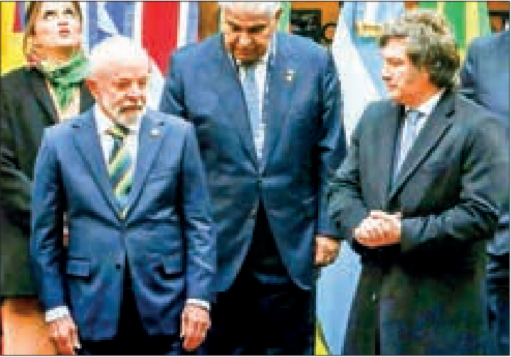
Brazil’s President Luiz Inacio Lula da Silva and Argentina’s President Javier Milei pose for a photo at a Mercosur summit in Buenos Aires.

Lula said that under his leadership, Mercosur would aim to “strengthen inter-bloc trade with external partners” and to