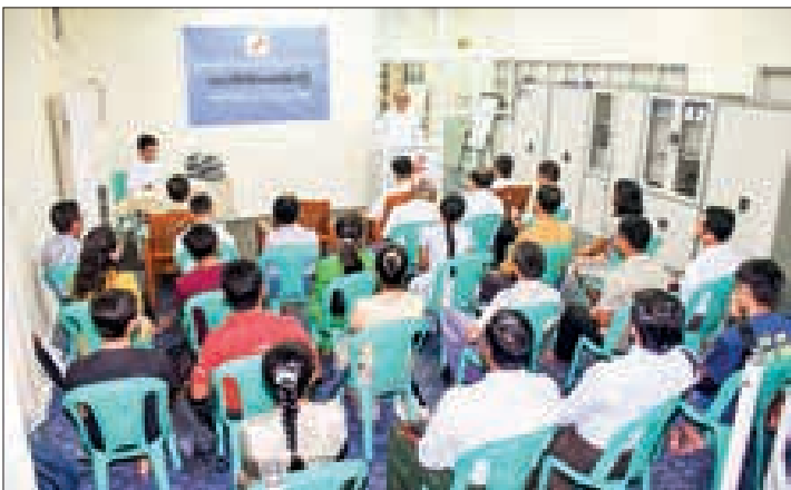
This photo shows the graduation ceremony of News Media Training Course 3/2025 in progress yesterday.

Council executives, trainers and instructors presented course completion certificates to the trainees. According to sources, the training covered subjects such as International Relations by U Khin Maung Zaw, Broadcasting Media by U