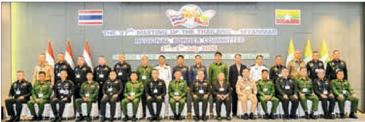
This photo shows the documentary group photo of the 37 th Thailand-Myanmar Regional Border Committee held in Chiang Mai, Thailand.

THE 37 th Thailand-Myanmar Regional Border Committee Meeting, hosted by Thailand, was held on the morning of 3 July at Green Lake Resort in Chiang Mai.