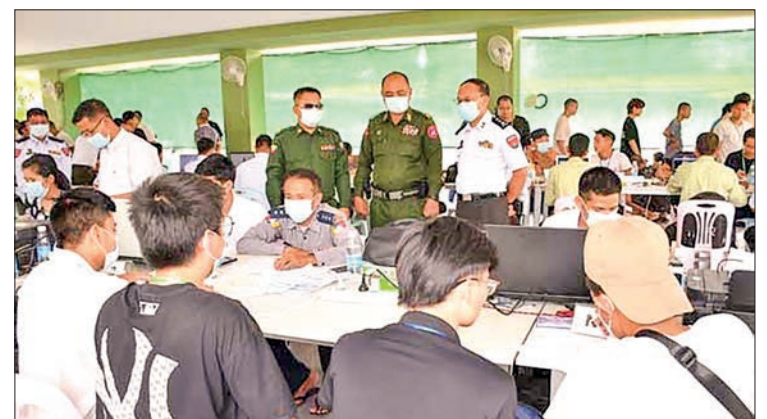
Myanmar Immigration and officials processing undocumented foreign entrants.

The Myanmar government takes strict action against illegal online fraud and scam operations, particularly in border areas. Authorities are collaborating with neighbouring countries and international organizations to crack down on illegal online gambling networks and financial fraud, ensuring effective investigations and legal actions against those involved. — MNA/KZL