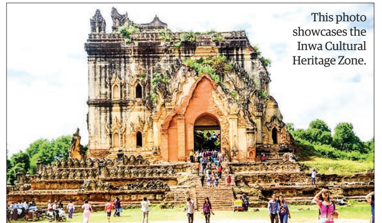
This photo showcases the Inwa Cultural Heritage Zone.

Mandalay Region’s cultural zones will remain open, but the Myanansankyaw Golden Palace will be closed. The cultural heritage buildings in the Mandalay Cultural Heritage Zone, including the Myanansankyaw Golden Palace and the Shwenandaw Kyaung, were renovated and maintained at a cost of millions of kyats last year, ensuring that tourists can visit them safely. — ASH/TH