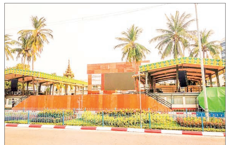
Mandalay Maha Thingyan Pavilion.

THE Yangon Region government will give the green light to operate Thingyan pavilions under rules and regulations.