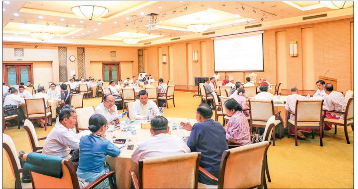
The second-day of Peace Talk 2025 in progress at the National Solidarity and Peacemaking Centre in Nay Pyi Taw yesterday.