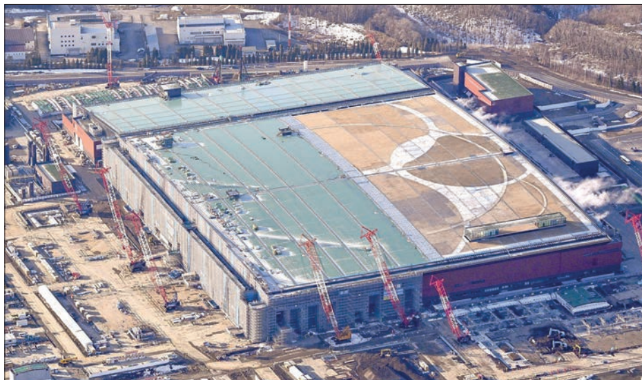
Photo taken from a Kyodo News helicopter on 24 March 2025 shows a Rapidus Corp plant under construction in Chitose, Hokkaido.

The tie-up will provide Rapidus "access to Quest Global's extensive global client chip base" and allow the two companies to deliver new chips