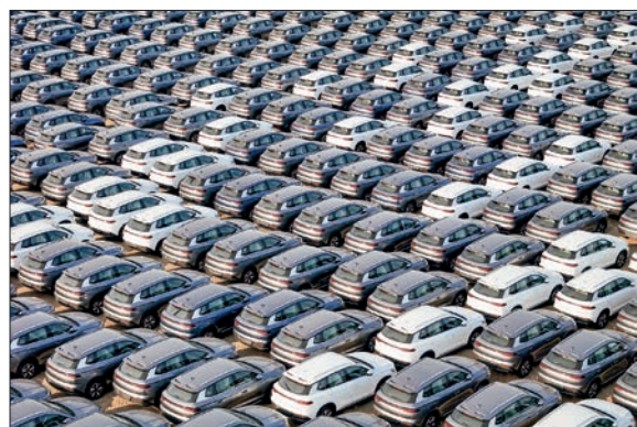
(FILES) This photo taken on 18 April 2024 shows BYD electric cars for export waiting to be loaded onto a ship at a port in Yantai, in eastern China's Shandong province.