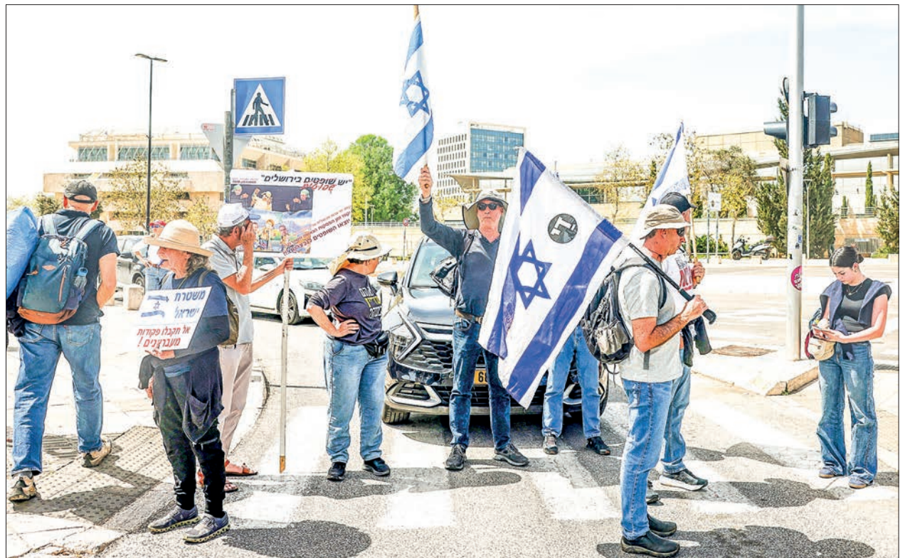
Anti-government demonstrators gather with banners and flags to block Yitzhak Rabin Boulevard during a protest near the Foreign Ministry headquarters in the centre of Jerusalem on 25 March 2025.

Herzog's comment followed a statement on Thursday in which he said he was "deeply troubled" by the policies of the government led by Prime Minister Benjamin Netanyahu.