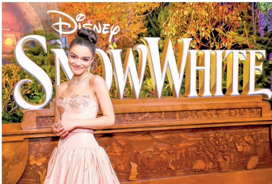
Rachel Zegler attends the World Premiere of Disney’s Snow White at El Capitan Theatre in Hollywood, California on 15 March 2025.