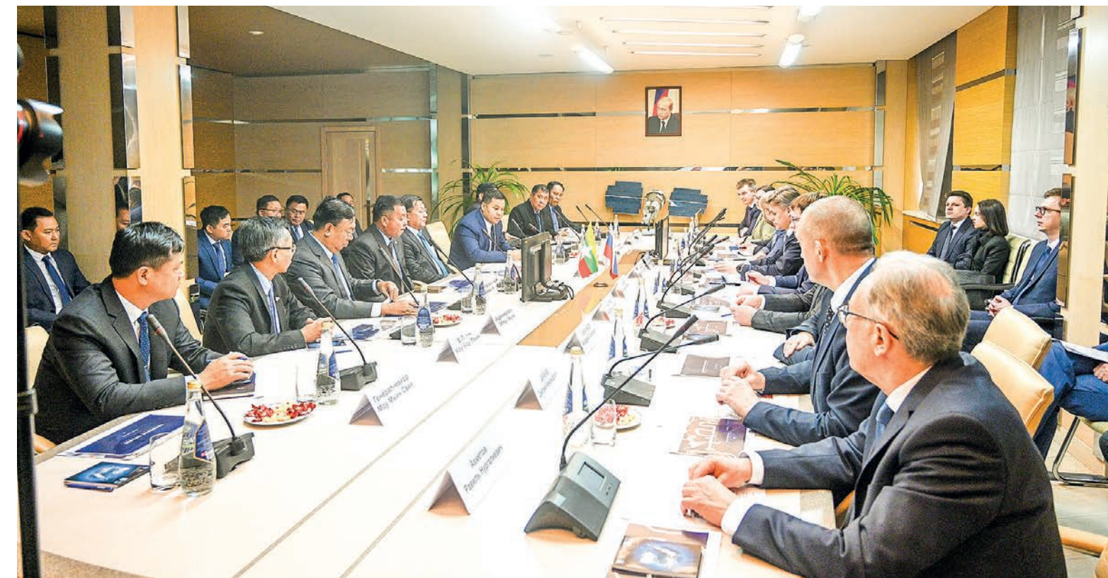
Chairman of the State Administration Council Prime Minister Senior General Min Aung Hlaing and Director-General Mr Dmitry Bakanov of the State Space Corporation "Roscosmos" discuss on cooperation in the peaceful utilization of space technology.

all countries and prohibits the placement of weapons of mass destruction in orbit.