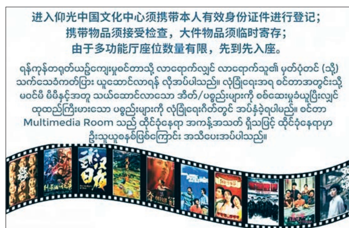
Free screenings of Chinese films at the China Cultural Centre (Yangon).

CHINA Cultural Centre located in Ahlon Township, Yangon Region, will play Chinese movies every Saturday for free.