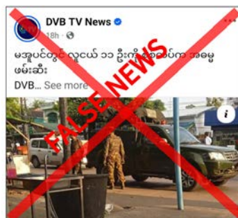
Screenshot of DVB TV News validates misinformation.

Authorities claim these false reports aim to create fear. The public should trust only