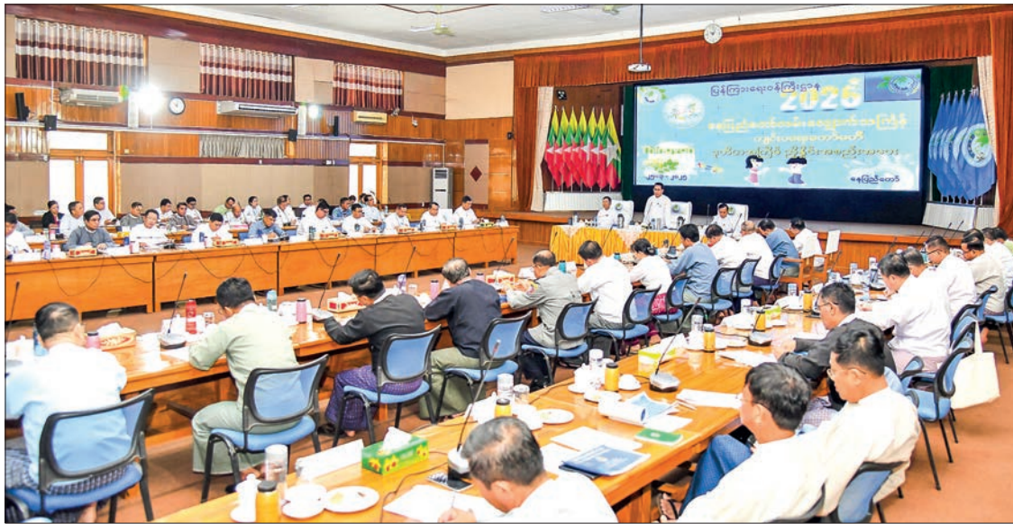
A coordination meeting on the holding of Nay Pyi Taw Walking Thingyan in progress at the Ministry of Information in Nay Pyi Taw yesterday.

This year marks the third time that the Walking Thingyan Festival has been organized in Nay Pyi Taw as part of Myanmar's traditional Thingyan Festival. This year is the very first cel-