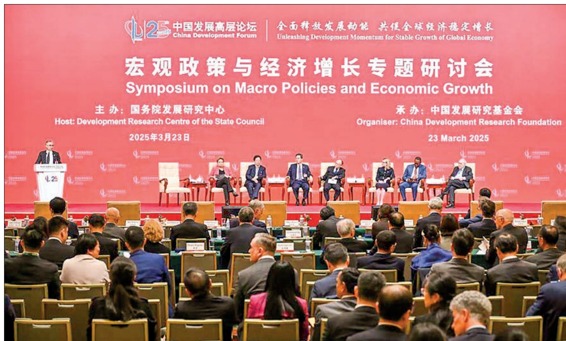
This photo taken on 23 March 2025 shows the Symposium on Macro Policies and Economic Growth of the China Development Forum 2025 in Beijing, capital of China. The China Development Forum 2025 is scheduled from 23 to 24 March. The theme of this year's forum is "Unleashing Development Momentum for Stable Growth of Global Economy."

HEADS of some 80 multinationals including Siemens, Apple, Samsung and Pfizer have flocked to China to seek new cooperation opportunities with the world's second-largest economy.