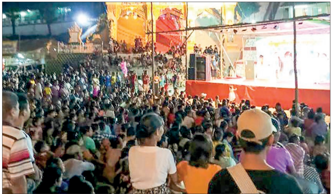
Music performances in progress at Mann Shwesettaw.