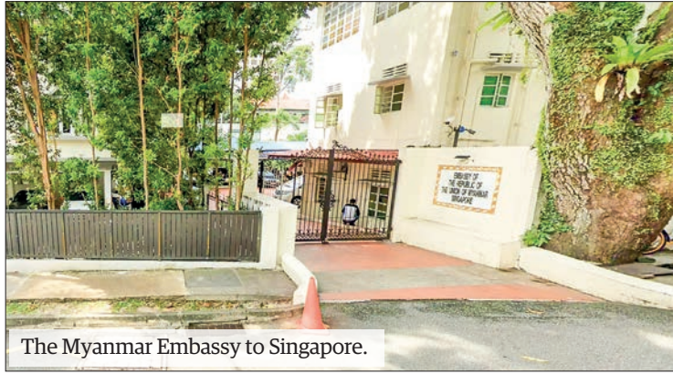
The Myanmar Embassy to Singapore.

The statement said the embassy already warned that no individual or organization is allowed to provide this service. It added that it has received complaints from some Myanmar nationals that there are people who ask them to send personal information to the embassy's WhatsApp numbers