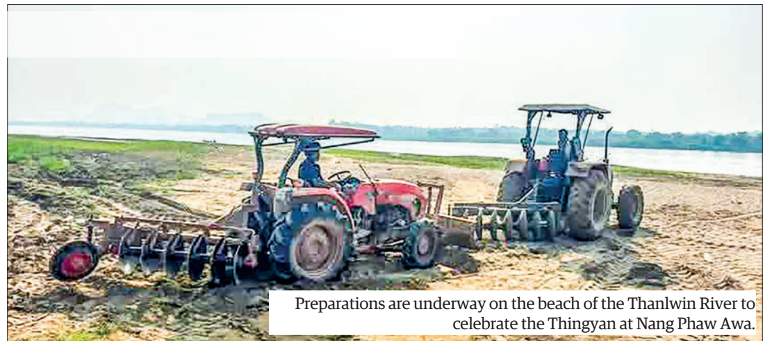
Preparations are underway on the beach of the Thanlwin River to celebrate the Thingyan at Nang Phaw Awa.

Currently, Hpa-an sees continuous domestic tourism, with many visitors on weekends and public holidays. Guesthouses and hotels are full on busy days, and it is expected that there will be a lot of visitors during Thingyan, said locals. — MT/ZN