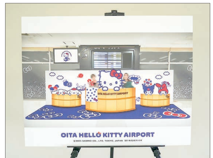
Undated photo shows a panel displaying the image of a photo booth which will be set up at an arrival gate in Oita Hello Kitty Airport. (Copyright 2025 Sanrio Co Ltd Tokyo, Japan.) (Photo courtesy of Sanrio Entertainment Co) PHOTO: KYODO

"We will make efforts so that Harmonyland can contribute to attracting tourists in and outside the country as one of Oita Prefecture's attractions," she said. — Kyodo