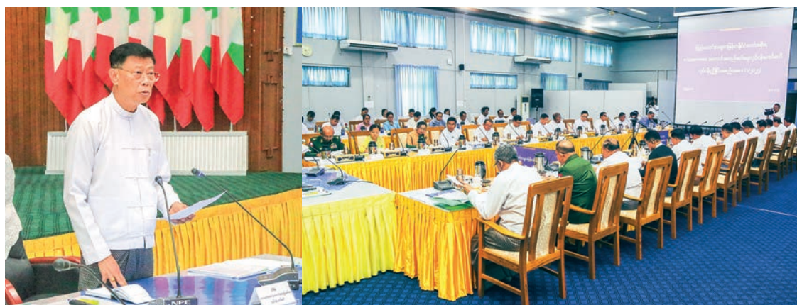
Deputy Prime Minister, MoTC Union Minister General Mya Tun Oo addresses the E-government Working Committee meeting yesterday.

Deputy Prime Minister Union Minister for Transport and Communications General Mya Tun Oo, in his capacity as Chairman of the Working Committee, said concerted efforts must be made to successfully gain the achievements in e-government development programmes set out in the Myanmar e-government