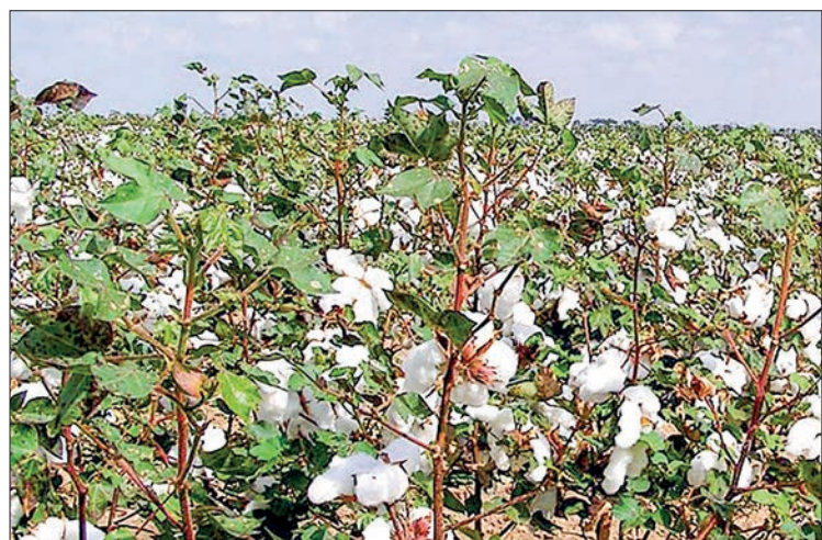
This picture shows a thriving cotton plantation.

Moreover, the department informed them of adequate irrigation into the two-foot depth of cultivation land, use of drip irrigation, avoiding excess application of water, irrigation for six to 12 hours, and having drainage for efficient agriculture operation. — NN/KK