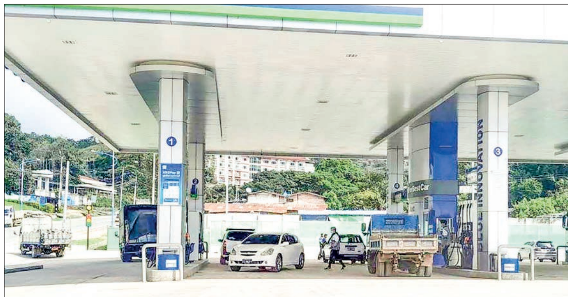
Vehicles are seen refuelling at the petrol station in Yangon.

CBM announced the sale of $23 million and 150 million baht on 3 March for fuel oil importers. It injected that amount of foreign currencies into the fuel oil sector on 4 March. It sold $550,000, 400,000 yuan and 638,550 baht on