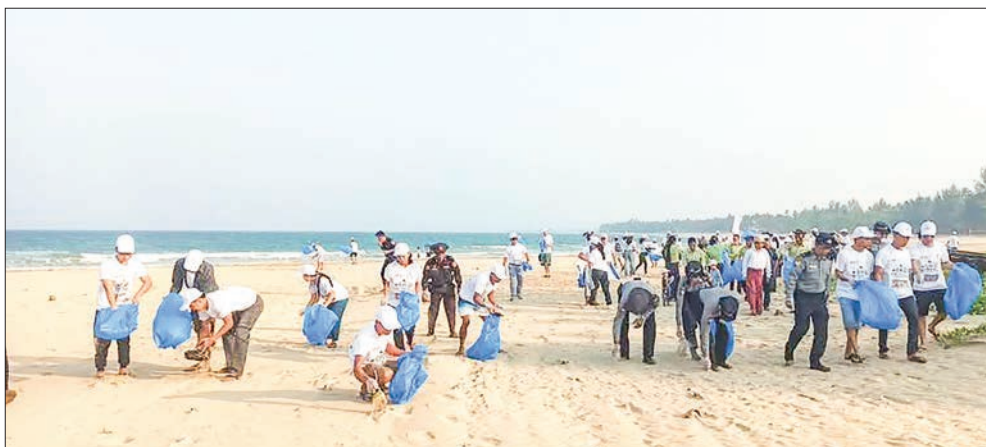
Around 120 volunteers from departmental staff, Myanmar Underwater Federation and Myanmar Dive centre help remove plastic waste and garbage at the Ngwehsaung beach on 25 March 2025.

A beach clean-up campaign took place from 7 am to 9 am yesterday in Ngwehsaung, Patheingyi District, Ayeyawady Region. The campaign was a joint effort between local departments, the Myanmar Underwater Federation and the Myanmar Dive Centre. The clean-up covered the stretch of beach in Ward 3, near Chithumya Island.