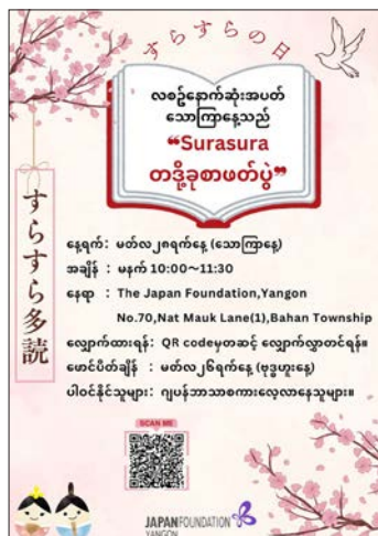
An advert for the Surasura Tadoku.

Free registration is available at https://forms.office.com/Pages/ResponsePage.aspx?id=oy_HkJxhhky73GK1b_fZOeCGB-qQ4Rh-