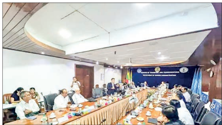
A meeting of the Myanmar Seafarers Federation (MSF).

THE Myanmar Seafarers Federation (MSF) is preparing to form a working committee on the pension system for Myanmar seafarers.