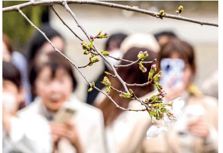
A Somei Yoshino cherry tree, which the Japan Meteorological Agency uses as a benchmark tree to declare the official start of the spring cherry blossom season, comes into bloom at Yasukuni shrine in Tokyo on 24 March 2025.