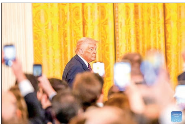
US President Donald Trump leaves after an event celebrating the Greek Independence Day at the White House in Washington, DC, the United States, on 24 March 2025.

US President Donald Trump on Monday said that he may "give a lot of countries breaks" on tariffs, as his 2 April deadline to impose "reciprocal tariffs" on US trading partners draws closer.