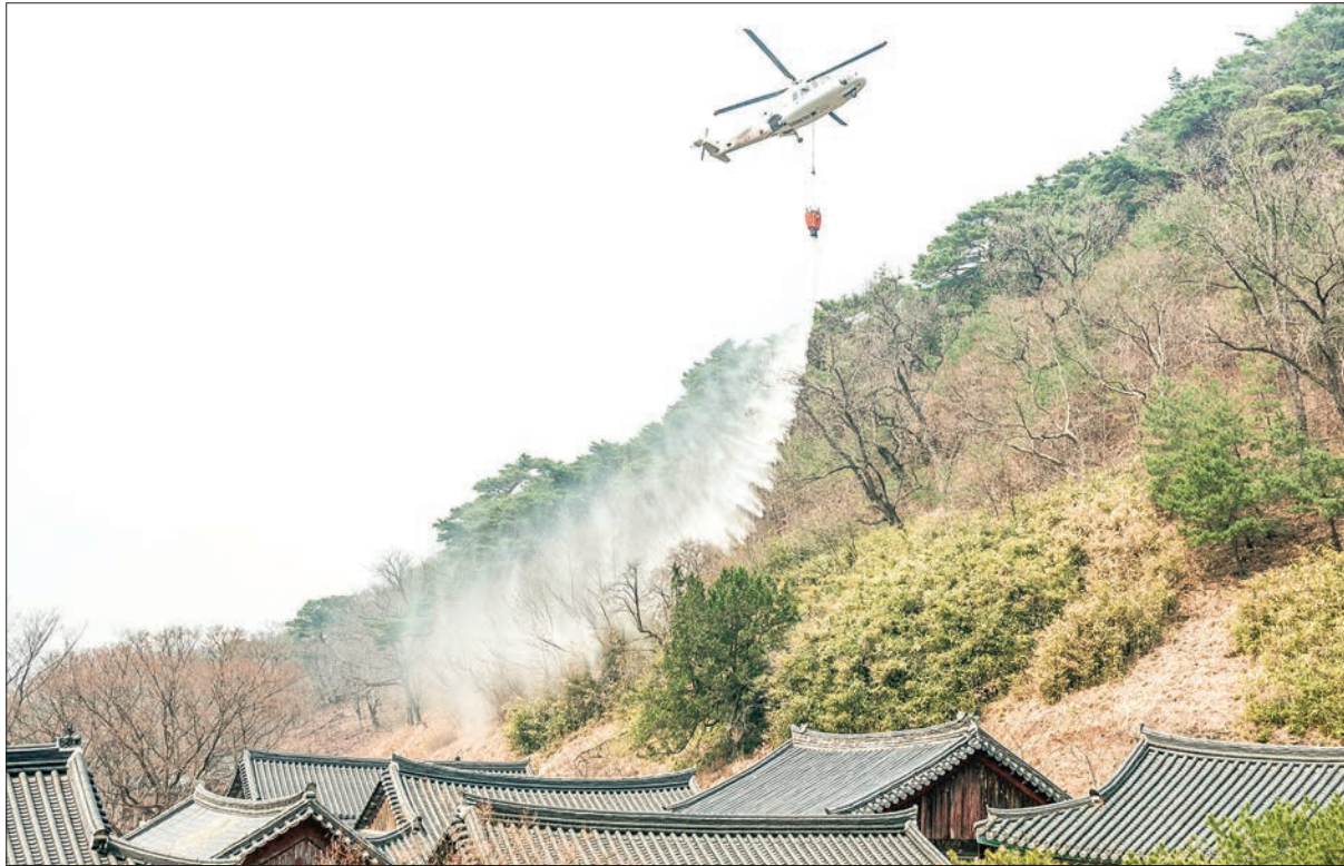
A helicopter drops water as they prepare for the possibility of a wildfire advancing towards Gounsa Temple in Uiseong on 25 March 2025