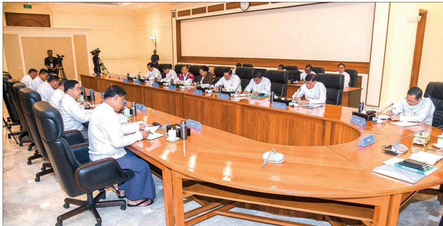
Photos (top and above) show State Administration Council (SAC) Chairman, Prime Minister Senior General Min Aung Hlaing, addressing the SAC meeting, while the SAC Vice-Chairman and Deputy Prime Minister led attendees during yesterday's session in Nay Pyi Taw.