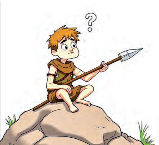
ကံထမ်းလာတာမမြင်ရ၊ လုံ့ထမ်းလာတာသမမြင်ရ / kun htan la da ma-myin ya, hlun htan la da dtha myin ya /

USAGES: “Take the bull by the horns.” • Definition: To confront a difficult situation with courage and determination. • Example Sentence: “He decided to take the bull by the horns and address the company's financial problems directly.” “Row your own boat.” • Definition: To be independent and take responsibility for your own actions and progress. • Example Sentence: “If you want to succeed, you need to learn to row your own boat and not rely on others to do it for you.” “Forge your own path.” • Definition: To create your own opportunities and follow a course of action that is unique to you. • Example Sentence: “She didn't want to follow the traditional career path; she wanted to forge her own path in the art world.” “A rolling stone gathers no moss.” • Definition: A person who is always moving and changing will not stagnate. (In this context, it promotes action over passivity) • Example Sentence: “By constantly learning new skills and embracing new challenges, he proved that a rolling stone gathers no moss.”