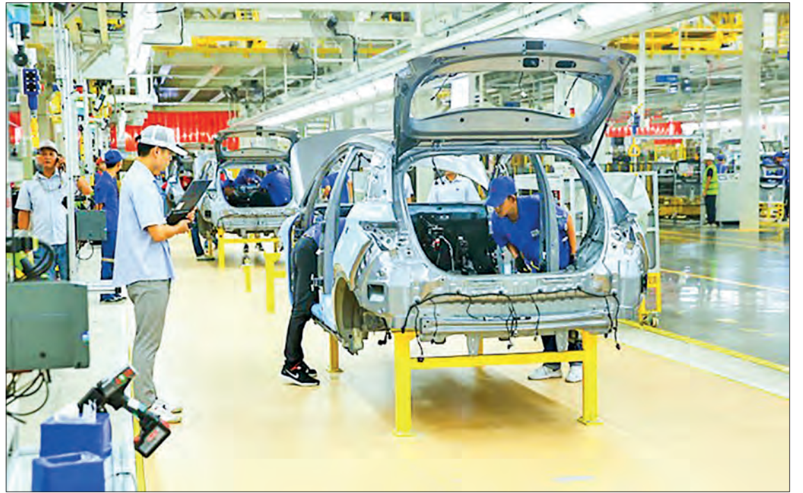
Workers operate at an assembly line in Rayong province, Thailand.