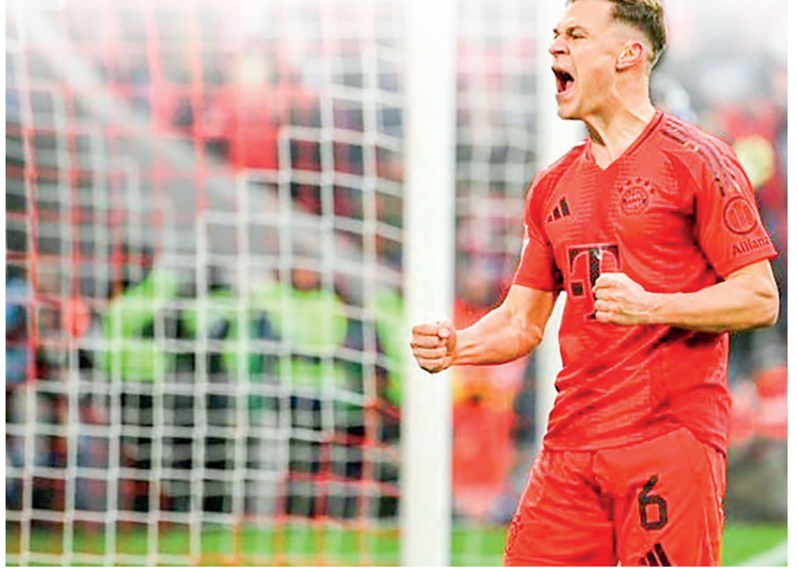
Bayern Munich midfielder Joshua Kimmich has extended his deal with the club until 2029.

Kimmich's new contract is the latest in several extended deals in 2025 as Bayern seek to shore up their future, with Neuer, Jamal Musiala and Alphonso Davies all recently extending their contracts. — AFP