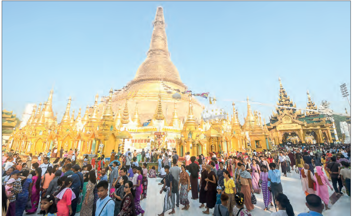
Images show devotees on pilgrimage to Shwedagon and other pagodas in Yangon yesterday.