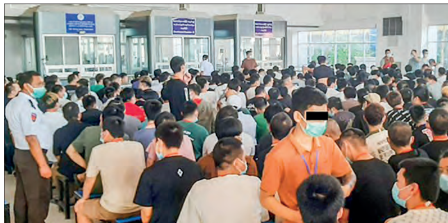
Immigration and officials processing deportation for foreign undocumented migrants.

THE government is actively cracking down on telecom fraud and online gambling, in addition to destructive elements, especially in border areas, by cooperating with international organizations, including neighbouring countries.