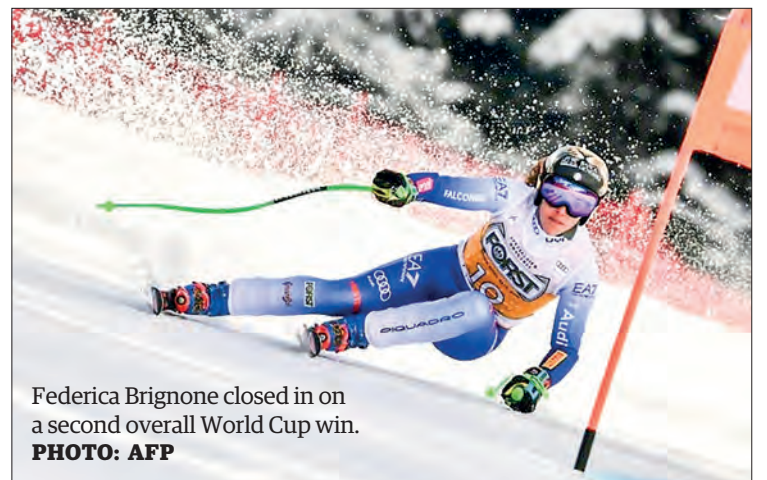
Federica Brignone closed in on a second overall World Cup win.

champion Brignone was 0.39 seconds behind 21-year-old Aicher, who picked up her first ever super-G win and second in the World Cup overall. But Brignone was fortunate to even finish her run after smashing through a gate on her way to her 82 nd podium finish in the World Cup, as snow conditions caused the athletes huge problems. "It was not easy, the snow is not, it doesn't make you confident... I felt like I was stuck right before the flat and I had no speed and I knew it," said Brignone. — AFP