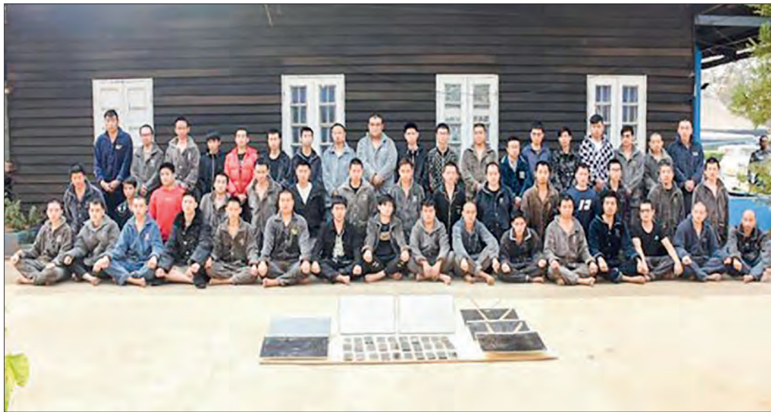
This photo captures foreigners arrested for telecom fraud and online scams in Shan State (North).

On 12 March, the security forces inspected the Narhote village-tract in Tangyan Township, Shan State (North), and arrested 165 illegal foreigners and one Myanmar national who operate on-