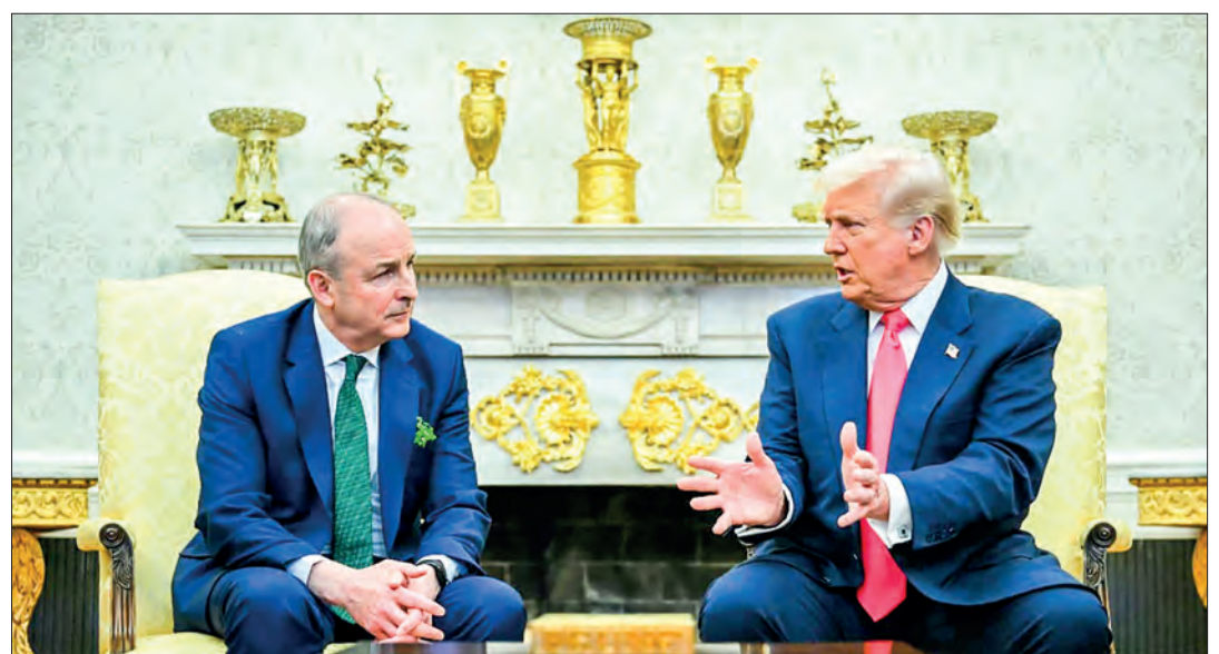
US President Donald Trump meets with Irish Prime Minister Micheal Martin in the Oval Office of the White House in Washington, DC, on 12 March 2025.

In his remarks, Martin said aid needed to be increased into Gaza and called for a ceasefire as well as the release of hostages held by Hamas since the 7 October 2023 attacks on Israel, according to The Jerusalem Post report. — ANI