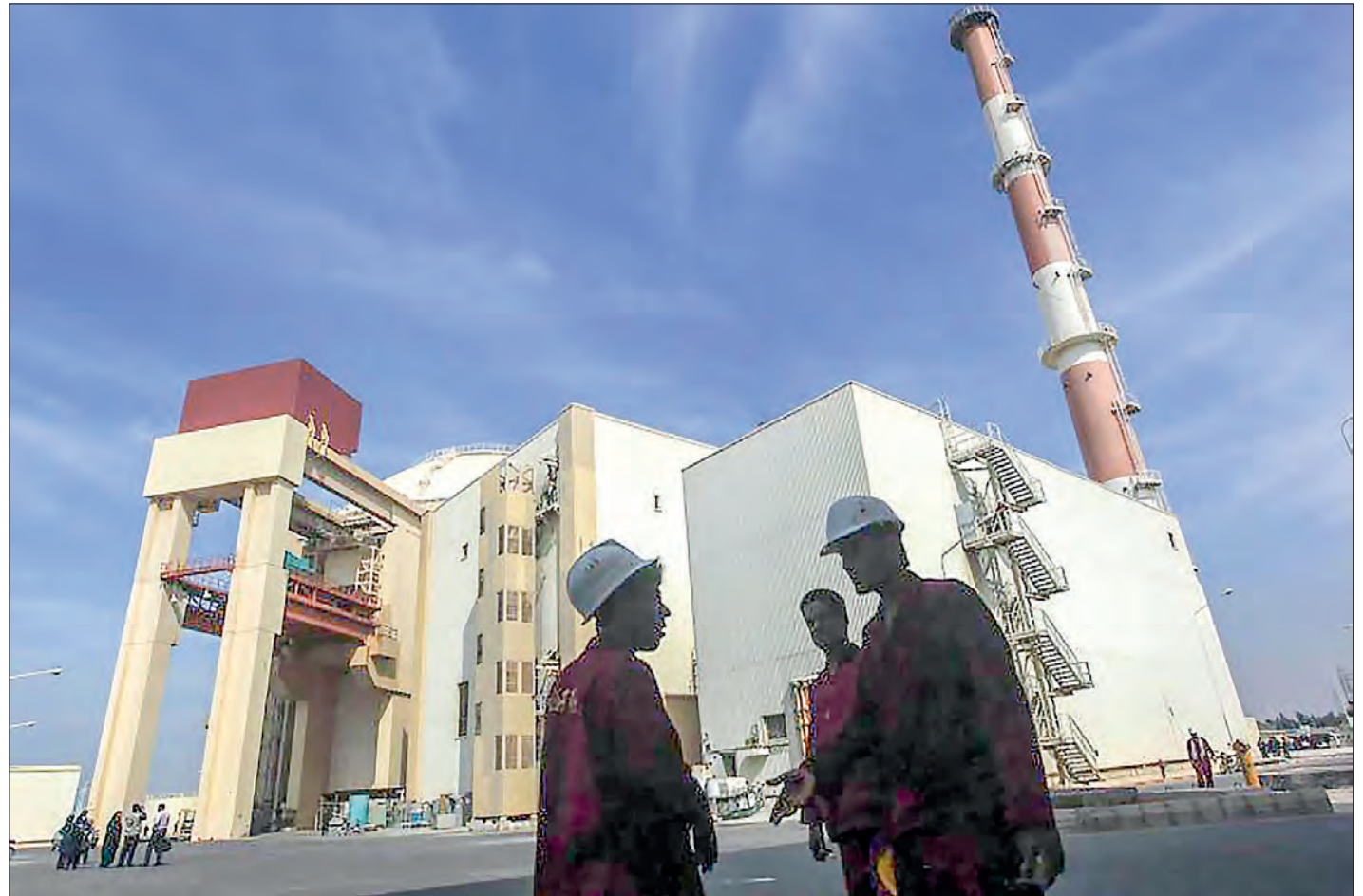
A file picture shows the reactor building at the Russian-built Bushehr nuclear power plant in southern Iran.

US President Donald Trump has consistently emphasized rolling back environmental regulations, and prioritizing fossil fuel industries over renewable energy initiatives. — Xinhua