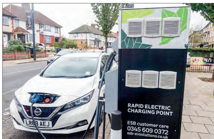
An electric vehicle (EV) is seen at a charging point in London, UK, 26 October 2021.

The three parties will exchange views on the Iranian nuclear issue and other issues of mutual interest, said the spokesperson. — Xinhua