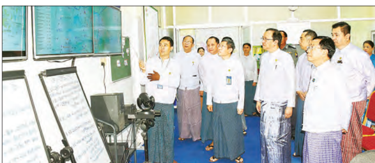
This photo shows emergency patients being transported step by step by calling the emergency number 192.

This emergency response system is a collaborative effort between the Myanmar Red Cross Society and the Ministry of Health. Of the nine ambulance stations in Nay Pyi Taw, seven are operated by the Ministry of Health, while the Myanmar Red Cross Society runs the remaining two. The service began operations on 20 February and will be further expanded to other regions and states. — ASH/MKKS