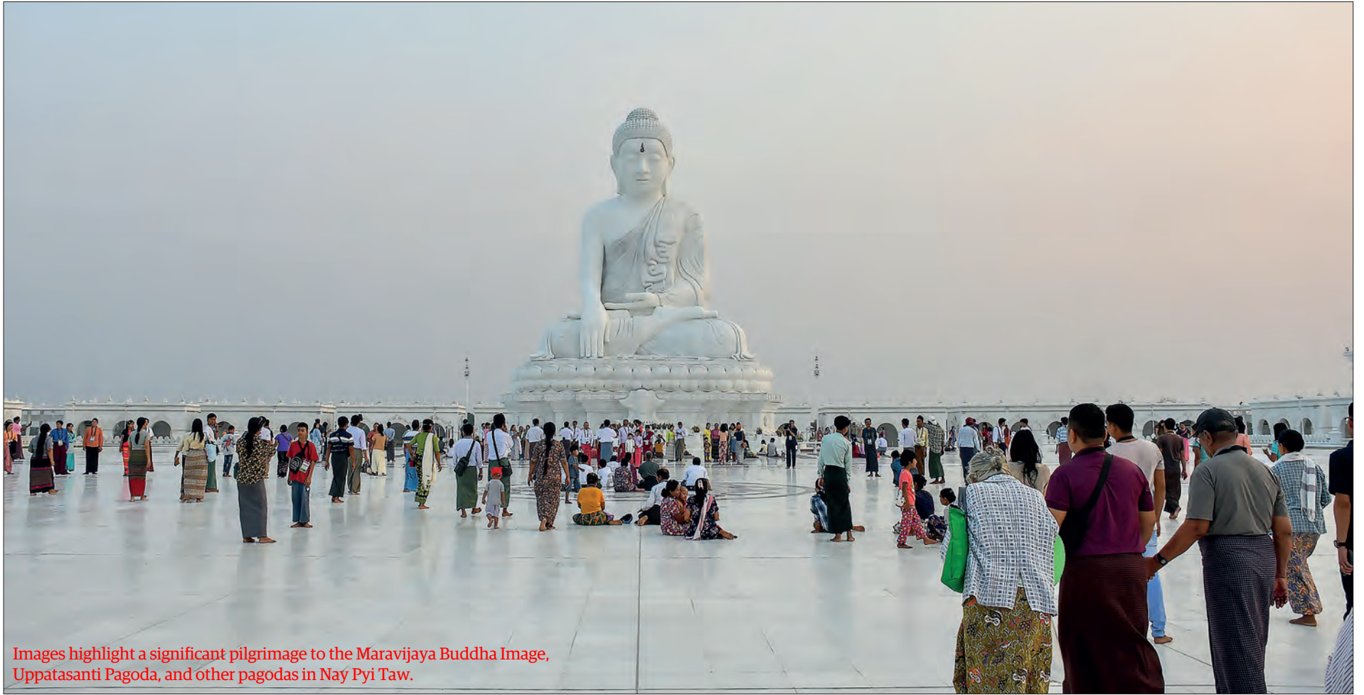
Images highlight a significant pilgrimage to the Maravijaya Buddha Image, Uppatasanti Pagoda, and other pagodas in Nay Pyi Taw.