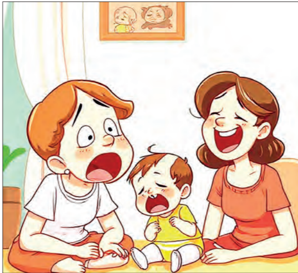
ကလေးရှက်တော့ငို၊ လူကြီးရှက်တော့ရယ် /khalay shet dau ngo, luji shet dau yi /

“You see a spear, not fate.” This proverb highlights the contrast between visible burdens and unseen destiny. We perceive tangible challenges, like a spear, but future outcomes remain obscure. While some attribute life to fate, it urges proactive control. Though we can't dictate all events, choices influence our path. Action, not passive waiting, shapes our goals. This teaches self-empowerment; diligent effort and wise decisions