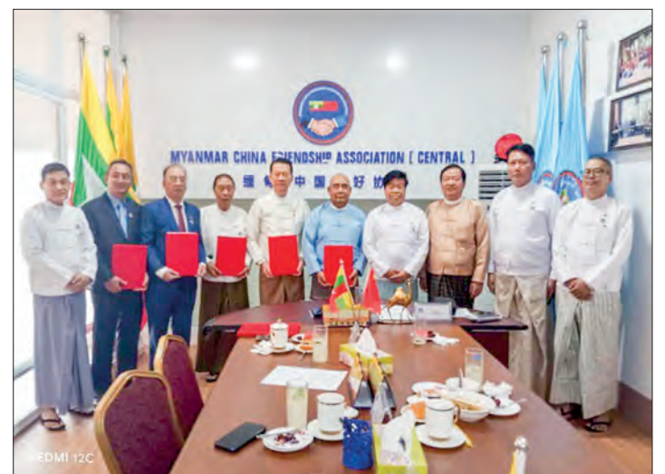
Officials from the Myanmar-China Friendship Association (Central) and its partners at the signing ceremony.

The MoU is aimed at deepening friendship, promoting cooperation and setting up an affiliated association.