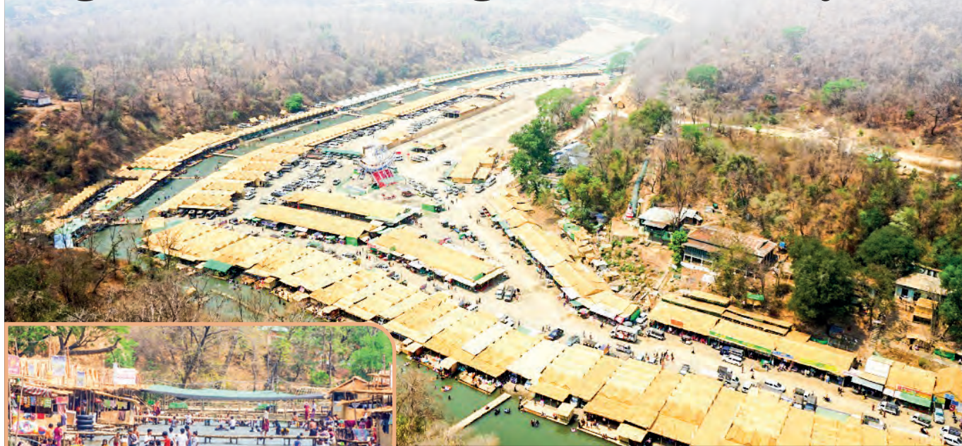
An aerial drone photo captures Mann Shwesettaw Pagoda and its surroundings, with visitors enjoying the scenic area and exploring festival stalls.