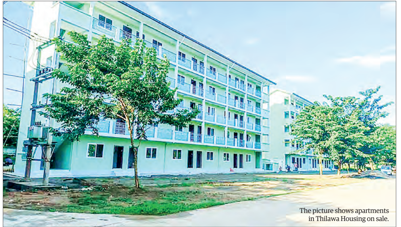
The picture shows apartments in Thilawa Housing on sale.

THE Department of Urban and Housing Development under the Ministry of Construction will issue residence permits for units of Thilawa affordable housings to those who have registered with the DUHD to purchase them.