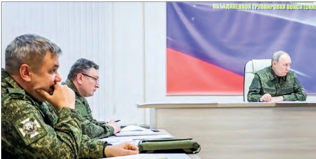
Vladimir Putin on Wednesday held a meeting at one of the command points of the Kursk group of forces, Kremlin Spokesman Dmitry Peskov said.

Russian forces have entered certain areas of the Sumy Region, which is adjacent to the Kursk region, according to Army General Valery Gerasimov.