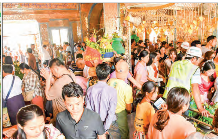
Photos capture the vibrant scenes of merit-makers and devotees flocking to pagodas in Mandalay on Taboung Full Moon Day.

ON the full moon day of Taboung, the famous pagodas in Mandalay were packed with merit-doers, food donors and pilgrims to Buddha Pujaniya pagoda festivals.