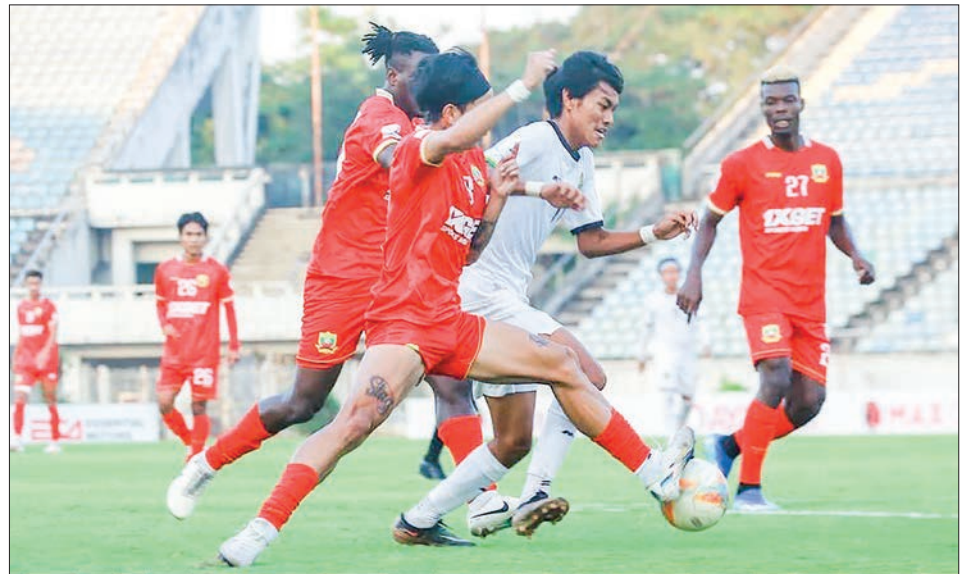
Dagon Star United and Shan United in action at the Thuwunna Youth Training Centre.

SHAN United and Dagon Star United battled to a goalless draw yesterday at Thuwunna Youth Training Centre in Yangon on Fixture 18 of the 2024-2025 Myanmar National League season.