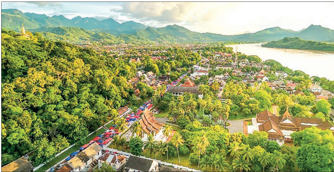
Photo taken on 15 July 2022 shows a view of the town of Luang Prabang, a UNESCO's world heritage site in Laos.

Laos aims to boost sustainable tourism by partnering with the private sector to integrate technology, enhance existing attractions, and improve infrastructure, including green energy and waste management systems.