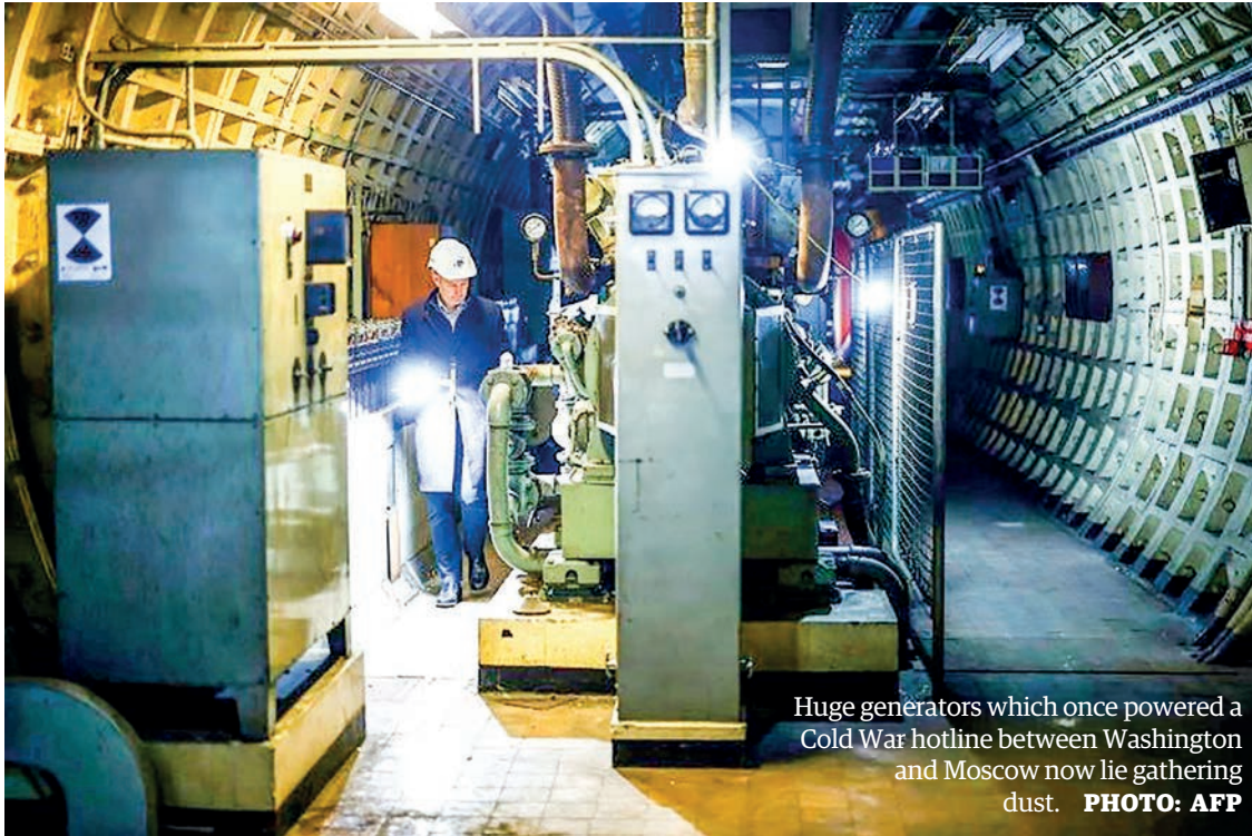
Huge generators which once powered a Cold War hotline between Washington and Moscow now lie gathering dust.