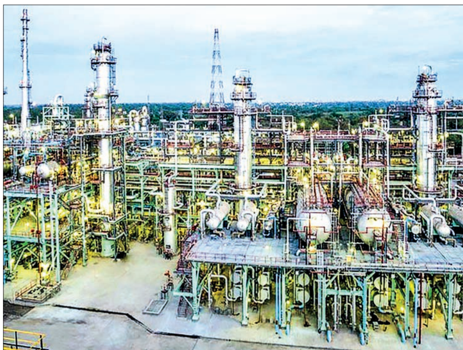
India Oil Corporation Ltd, Bharat Petroleum Corporation Limited, and Hindustan Petroleum Corporation Limited reported gross refining margins of US$ 3.7 per barrel to US$6.0 per barrel in the first nine months of 2024-25

Hindustan Petroleum Corporation Limited reported gross refining margins of US$ 3.7 per barrel to US$ 6.0 per barrel in the first nine months of 2024-25, compared to the unusually high levels of US$9.1 per barrel to US$12.1 per barrel in 2023-24. Fitch's Brent price assumptions reflect the impact of OPEC+'s large spare capacity, increasing global production and moderating demand growth. — ANI