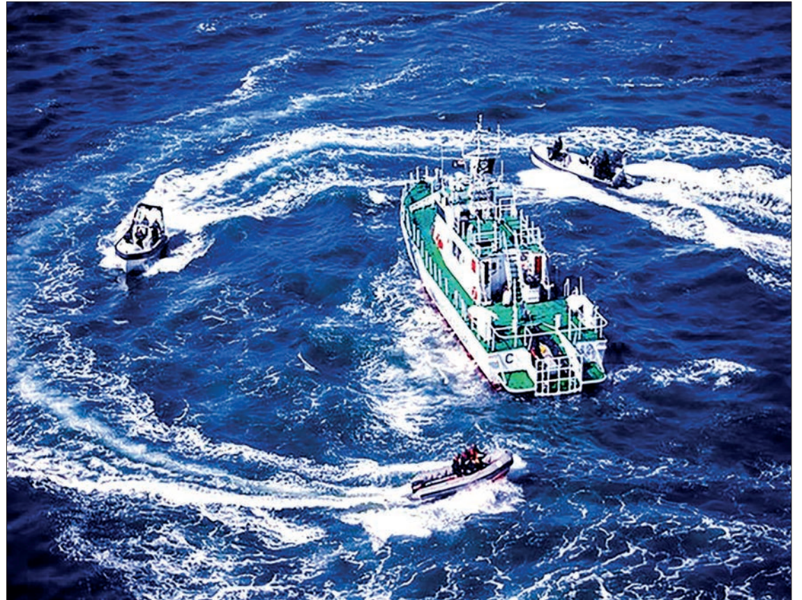
By 2030, the ICG plans to expand further, targeting 200 surface platforms and 100 aircraft. PHOTO: ANI

Since its establishment in 1977 with just seven surface platforms, the ICG has grown into a formidable force, now operating 151 ships and 76 aircraft. — ANI