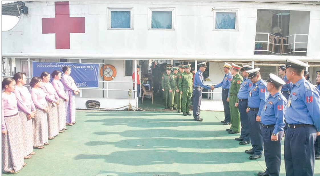
Doctors, nurses and medical professionals from the Tatmadaw Mobile Health Teams are warmly welcomed back by commander, officers and families from Naval Training Command HQ at No 4 Naval Jetty yesterday.

During this mission, healthcare services were provided to 6,833 local people living in villages along the Ayeyawady River. Medical treatments included consultations for 2,002 patients with general illnesses, 294 requiring surgical care, 227 women with OG conditions, 478 children, 1,196 with orthopaedic diseases, 654 with ear, nose, and throat issues, 1,278 with eye conditions and 704 patients with dental is-