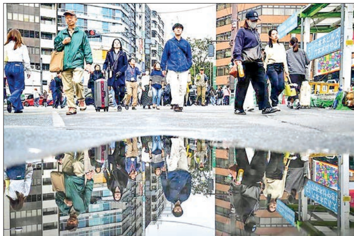
Japan had a record 2.3 million foreign workers as of October 2024, marking a 12.4 per cent increase from the previous year.

Among the most common jobs held by foreign workers were positions in the manufacturing, hospitality, and retail sectors. A "technical intern" programme continued to account for a sizable portion of the foreign workforce, at 20.4 per cent. — AFP