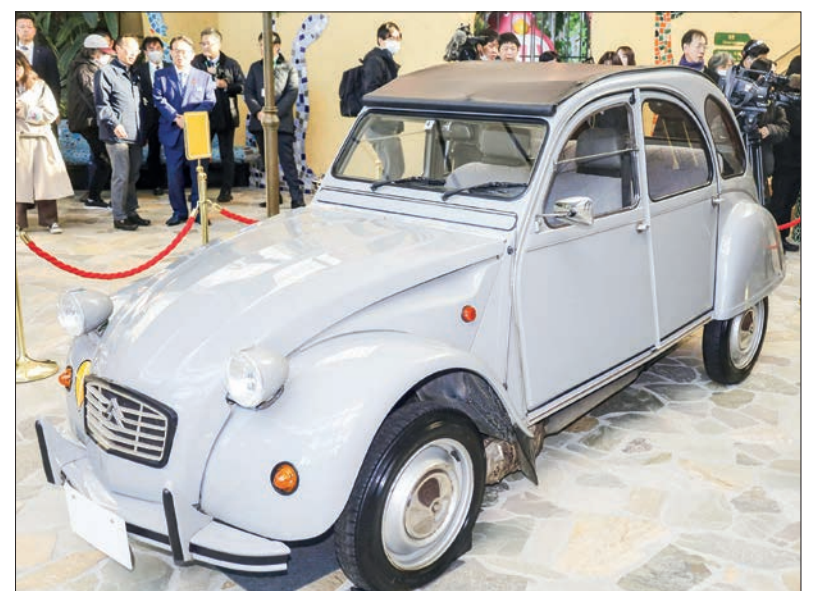
Animation director Hayao Miyazaki's beloved car, a Citroen 2CV, is displayed at Ghibli Park in Nagakute, Aichi Prefecture, on 29 January 2025.

A Citroen 2CV was also portrayed in "Lupin III: The Castle of Cagliostro," the animation film in which Miyazaki debuted as a feature film director in 1979. — Kyodo