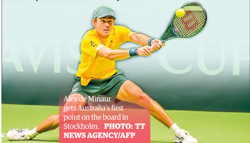
Alex de Minaur gets Australia's first point on the board in Stockholm.

Jannick Sinner's Italy are the two-time defending champions having won the eight-team men's event in Spain in 2023 and last year. — AFP