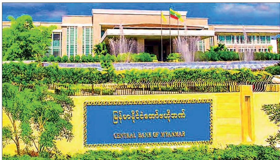
The facade of the Central Bank of Myanmar in Nay Pyi Taw.

CBM aims to curb the instability in the foreign exchange market and the currency devaluation. According to CBM’s notification on 15 March, it has been joining hands with law enforcement agencies to combat and prosecute those who attempt to manipulate the currency market under the existing laws. CBM allowed authorized dealers (private banks) to operate online foreign exchange trading freely as per the market rate depending on supply and demand, starting from 5 December 2023. — NN/KK