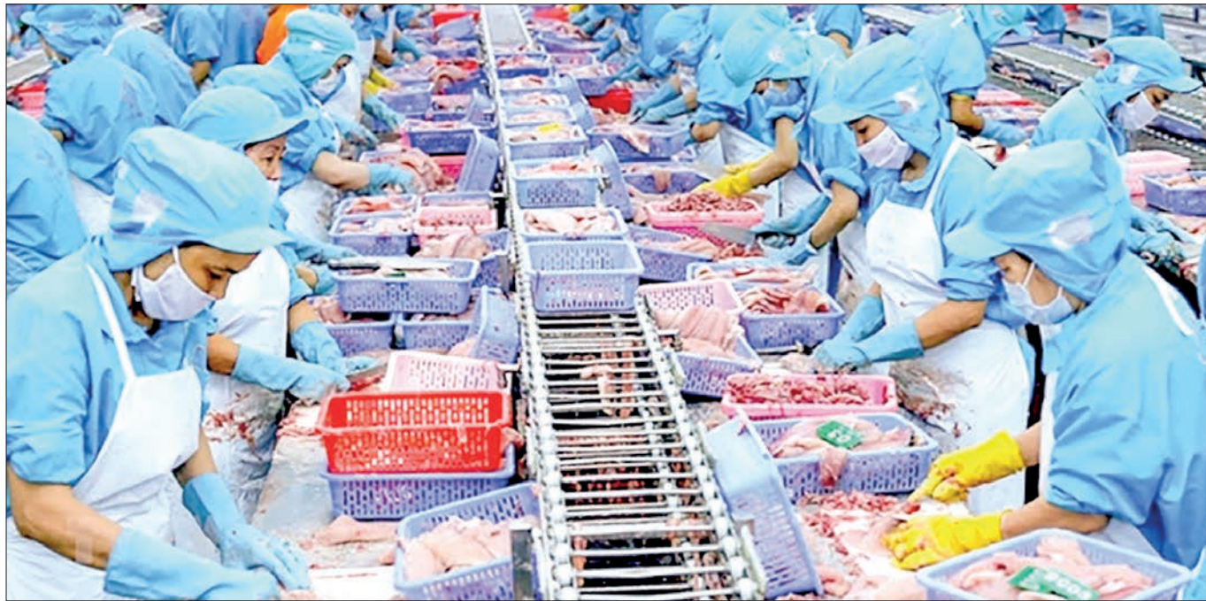
Workers diligently processing and packaging fisheries products of international standard.

MYANMAR Fisheries Federation and Fisheries Products Processors and Exporters Association stated that Myanmar targeted to achieve export value of US$700 million from fisheries exports in the 2024-2025 financial year (from April 2024 to March 2025).