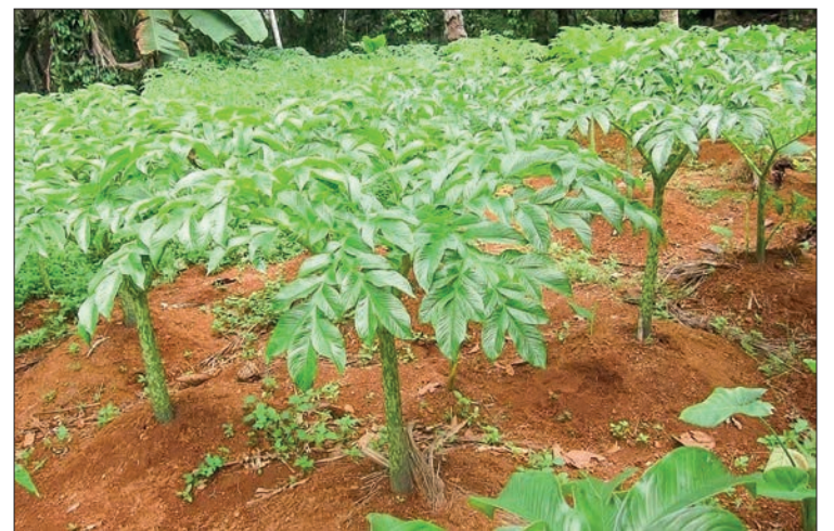
A konjac farm in southern Shan State.

DUE to some reasons, the number of konjac farmers has shrunk, however, there is a likelihood that yam raw materials are expected to be short over the next years, encouraging farmers to expand their plantations in safe areas.