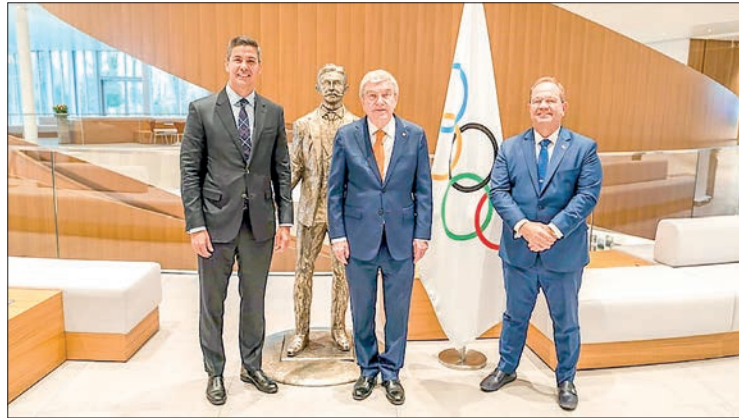
During the meeting, Pena reaffirmed Paraguay's strong belief in the power of sport to build stronger and more united communities, as well as the country's determination to contribute to the Olympic Movement.

During the meeting, Pena reaffirmed Paraguay's strong belief in the power of sport to build stronger and more united communities, as well as the country's determination to contribute to the Olympic Movement, which, "under President Bach's leadership, has strengthened its global