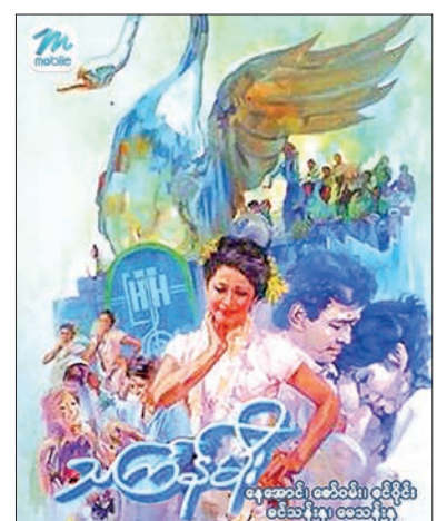
A classic ‘Thingyan Moe’ movie poster.

It will be held in Nay Pyi Taw on 9 February 2025. The judging panel selected 18 films as the final stage after reviewing 49 films and it plans to provide 12 winner awards.