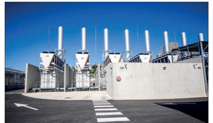
A photograph taken on 8 July 2020 shows generators of the new MRS3 Interxion data centre, settled in a former submarine base built by the Germans during the Second World War, in Marseille harbour, southern France.

THREE data centres in the French port of Marseille are testing water-saving cooling methods by pumping water from an old coal mine. This is part of broader efforts to address the growing environmental impact of generative AI, which consumes significant amounts of water. The data centres use "river cooling" systems,