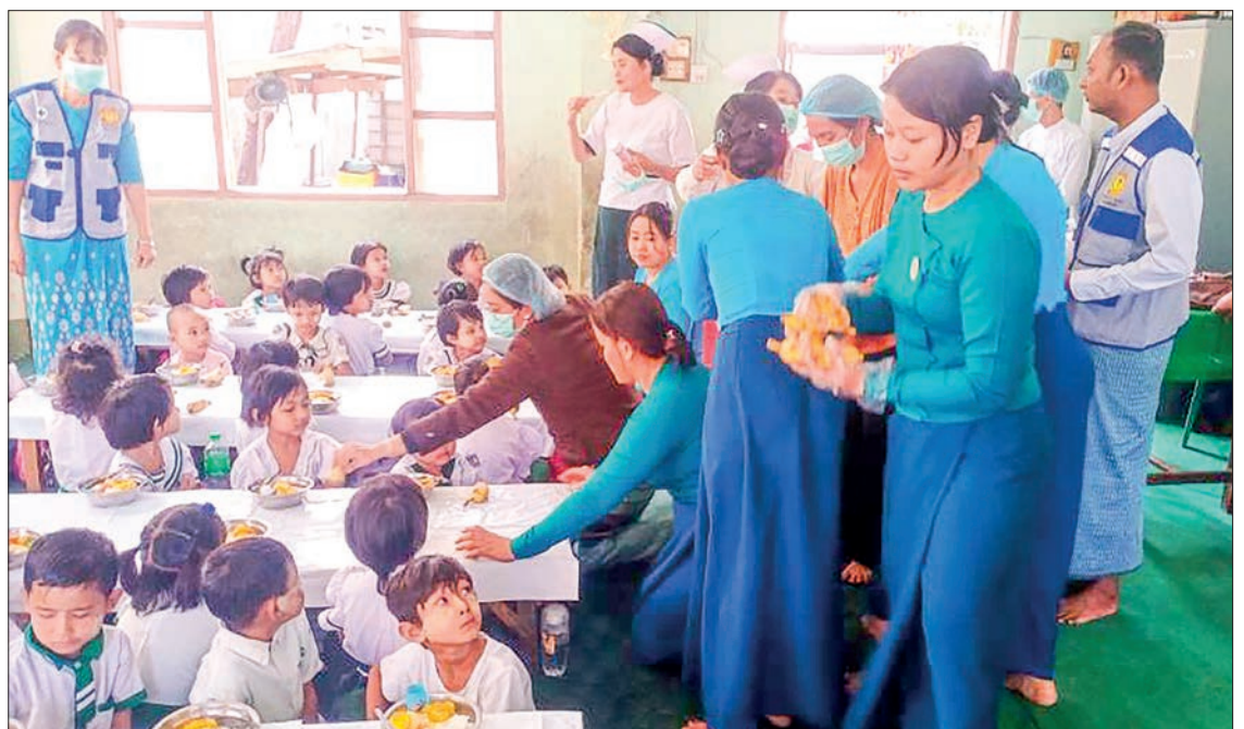
Kindergarten (KG) school children across 54 primary schools in Aungmyaythazan Township, Mandalay Region, have meals during the second round of nutritional support on 31 January 2025.