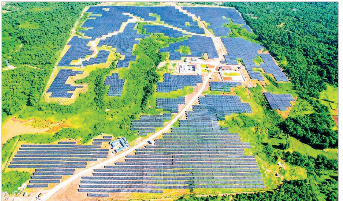
Solar power system in operation.

The Electricity and Energy Development Commission aims to prioritize the development of electricity and energy infrastructure to support daily livelihoods and economic growth, with local and international investments. — ASH/KZL