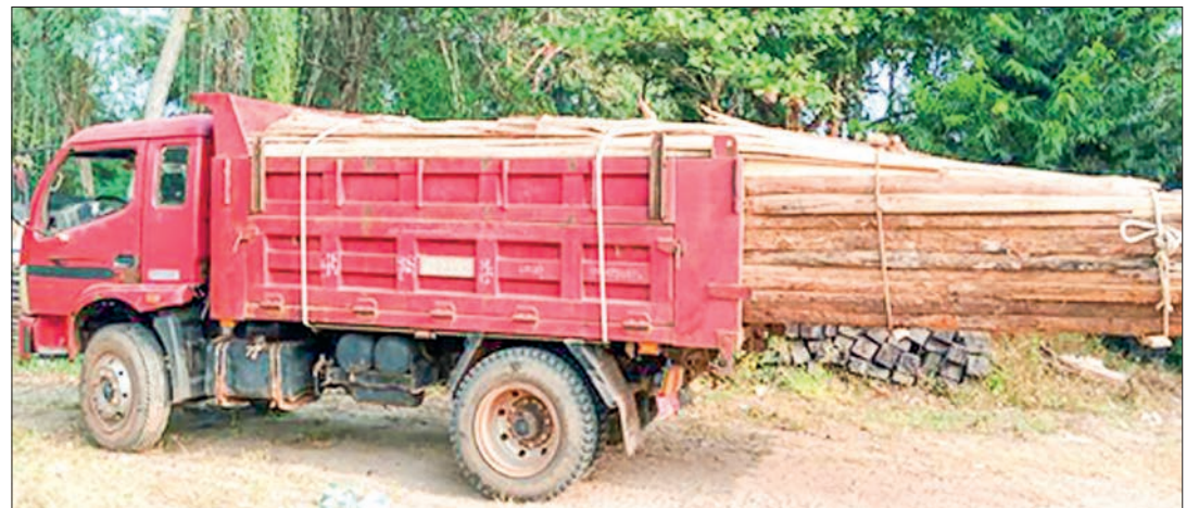
Confiscated timbers in Bago Region.