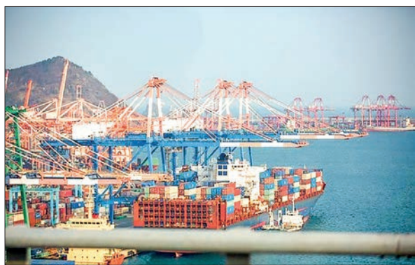
A ship berths a wharf at the port of Busan, South Korea, on 7 March 2023.

SOUTH Korea's export fell in double digits in the first month of 2025 due to fewer business days, government data