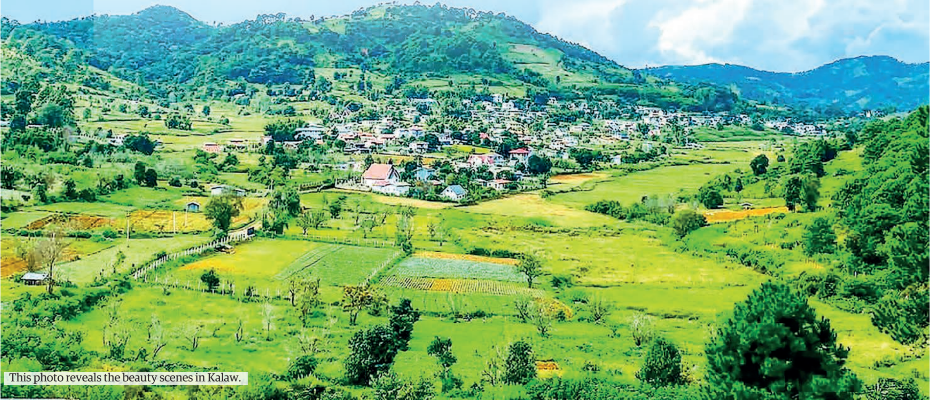
This photo reveals the beauty scenes in Kalaw.

features musical performances including well-known singers and DJ groups. It also offers a variety of consumer goods stalls, restaurants, and small playgrounds for children and young people. — ASH/MKKS