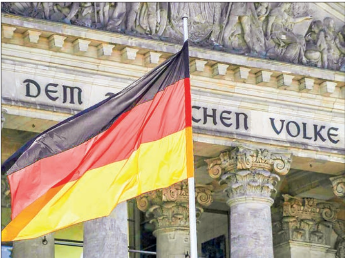
German flag of the building of Reichstag in Berlin.

GERMANS named inflation, pensions and affordable housing as the most pressing issues for the new federal government, which will be formed after the February elections to the lower house of parliament, the Bundestag, according to a survey conducted by the INSA institute for the Bild newspaper. According to 56 per cent of Germans, the most important problem that the new government must deal with is inflation.