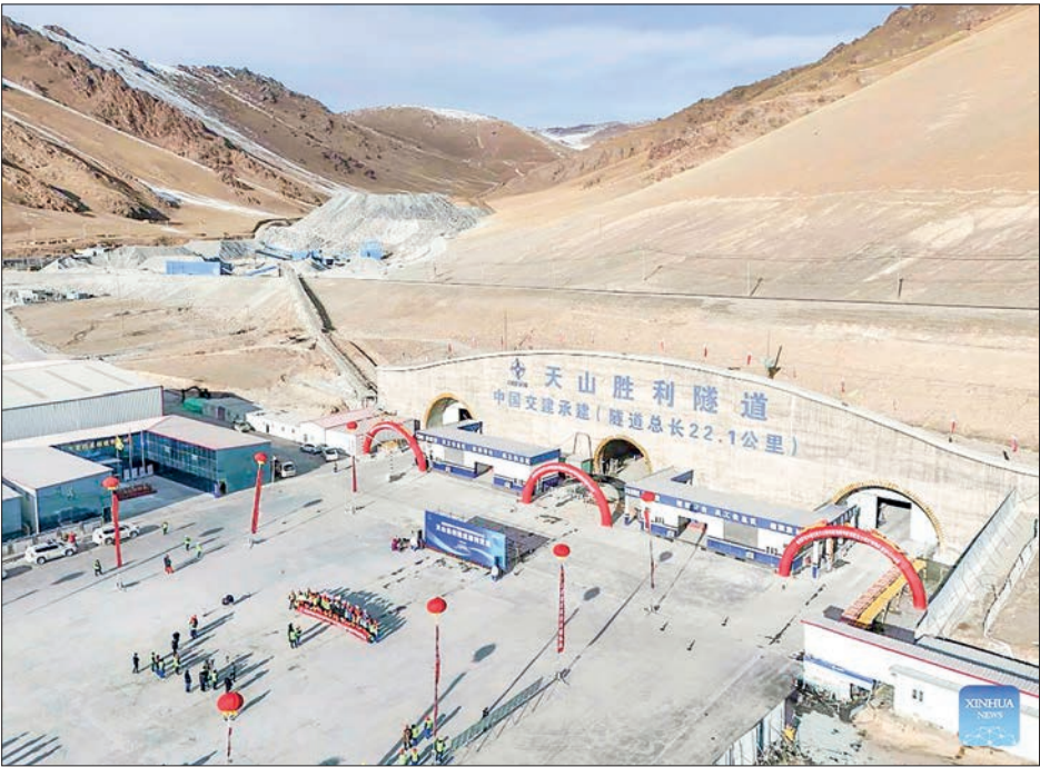
A drone photo taken on 30 December 2024 shows the exit of the Tianshan Shengli Tunnel in Hejing County of Mongolian Autonomous Prefecture of Bayingolin, northwest China’s Xinjiang Uygur Autonomous Region.

THE Tianshan Shengli Tunnel, the world’s longest expressway tunnel, completed tunnelling Monday morning, paving the way for the opening of a new shortcut linking southern and northern parts of China’s Xinjiang Uygur Autonomous Region. The 22.13-kilometre tunnel will reduce the time it takes to drive across the middle section of the Tianshan Mountains from several hours to about 20 minutes once operational. It is a key project of the Urumqi-Yuli Expressway, which runs from the regional capital of Urumqi in northern Xinjiang to Yuli County in southern Xinjiang. The expressway is expected to be fully completed and open to traffic in 2025. The driving time between the two locations will be reduced from about seven hours to just over three hours. Qadir Abliz, a truck driver from Urumqi who makes regular trips between the north and south of the Tianshan Mountains, said the winding mountain roads would often freeze in the winter, and many trucks carrying