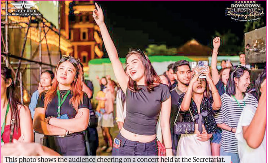
This photo shows the audience cheering on a concert held at the Secretariat.