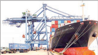
Yangon Port: 62 container vessels scheduled to arrive in Jan 2025