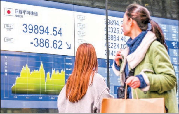
Pedestrians walk past an electronic board showing the closing numbers on the Tokyo Stock Exchange, along a street in central Tokyo on 30 December 2024.