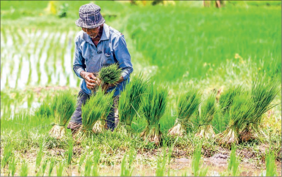
A rice farmer works in the paddy fields in the Kerobokan district of Indonesia's resort island of Bali on 19 December 2024.

Furthermore, Andi said that the government would construct irrigation infrastructures for two million hectares of land. "The development