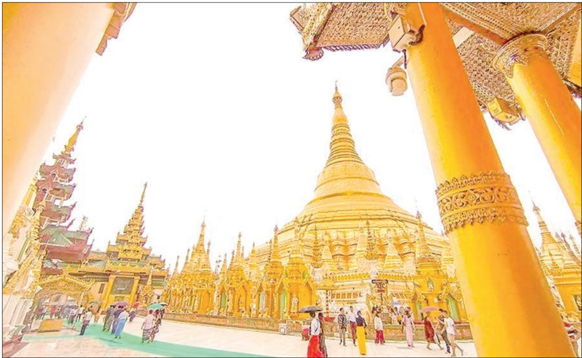
This photo showcases Shwedagon Pagoda in August 2024.

U/General Ne Win, in October 1970 about 3 ½ years before he became the first president of the Socialist Republic of the Un-