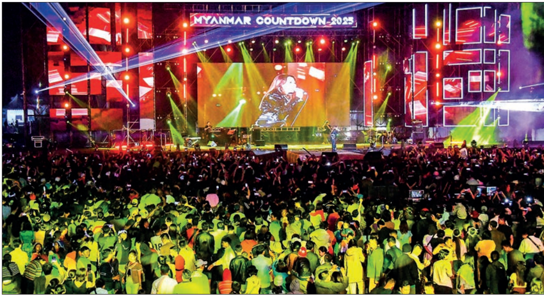
A crowded audience watches the music concert at the New Year's Eve event in Nay Pyi Taw yesterday.

MEMBERS of the Myanmar Police Force and administrative officials must prioritize public welfare while ensuring the safety of the people without imposing burdens. (Excerpt from the speech delivered by Chairman of the State Administration Council Commander-in-Chief of Defence Services Senior General Min Aung Hlaing at the meeting hall of the Eastern Command Headquarters on 3 September 2024)