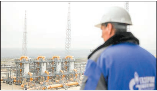
An employee looks at Kazachya gas compressor station, facility of Gazprom's TurkStream gas pipeline, in Krasnodar region, Russia. by 2027, then theoretically everything is possible. The question is, however, why, and whether the Greek side will be ready to pay so much more for the sake of some political considerations. Politics is politics, but in some cases, elementary common sense may prevail," the Russian ambassador concluded. — SPUTNIK

GREECE should be prepared to pay more if it rejects Russian gas for political reasons, Russian Ambassador to Greece Andrey Maslov said in an interview with Sputnik. The United States has set Europe the task of abandoning Russian energy resources by 2027. For this purpose, in particular, an LNG terminal was built in Alexandroupoli and put into operation three months ago. "The Greek government constantly publicly emphasizes the task of abandoning Russian gas. I cannot judge how possible this is. Athens tried to replace Russian supplies with more expensive LNG from other countries, but this resulted in an explosive rise in fuel prices. Greek citizens were forced to pay exorbitant bills for gas and electricity," Maslov said. Theoretically, Greece's refusal of Russian energy resources is possible, but "common sense" may prevail, the diplomat believes. "As for the refusal of our energy resources