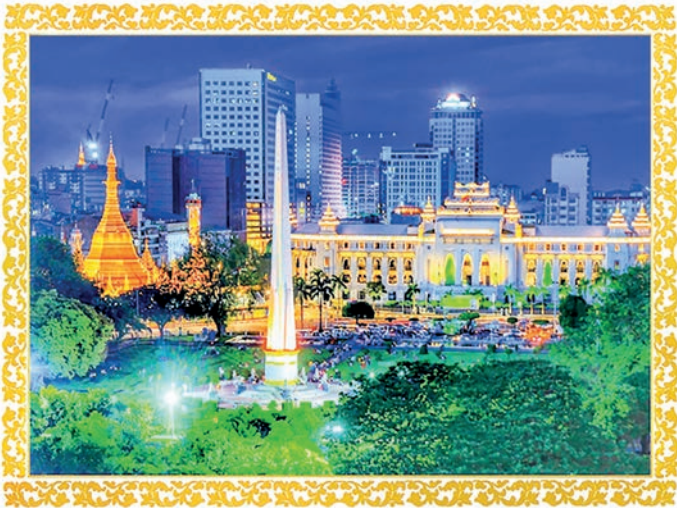
Yangon's night beauty.

(An excerpt from the message sent by Chairman of the State Administration Council, Prime Minister Senior General Thadue Maha Thray Sithu Thadue Thiri Thudhamma Min Aung Hlaing on the occasion to mark the Kayin New Year Day held on 11 January 2024)