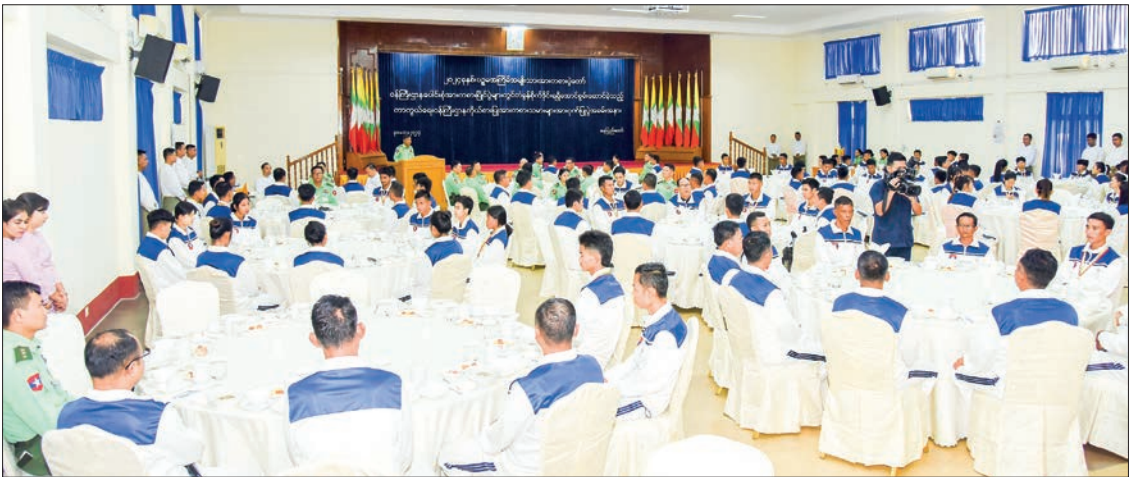
State Administration Council Member Deputy Prime Minister Union Defence Minister General Maung Maung Aye addresses the event to honour the ministry's winning athletes yesterday.

He then added that the development of a nation can be analyzed with its achievements in sports, and urged the athletes to make efforts for the ministry and Tatmadaw, highlighting the motto "promoting sports is akin to defending and safeguarding the nation". He presented cash prizes to the winners and received the champion cup from the winning team. The Ministry of Defence participated in six types of sports, and won 14 gold medals, 10 silver medals and 10 bronze medals, totalling 34, and achieved the inter-ministerial champion cup. — MNA/KTZH