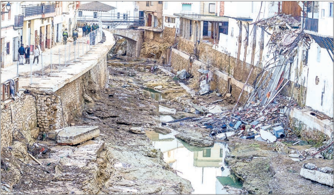
Debris lies in the river next to destroyed houses in Chiva, in the region of Valencia, eastern Spain, in the aftermath of catastrophic deadly floods on 19 November 2024.

CLIMATE change sparked a trail of extreme weather and record heat in 2024, the United Nations said on Monday, urging the world to pull back from the “road to ruin”. The outgoing year is set to be the warmest ever recorded,