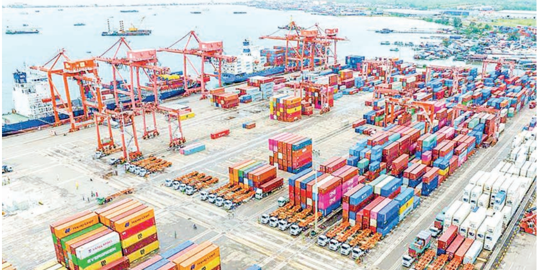
An aerial drone photo taken on 11 September 2024 shows a container terminal at the Sihanoukville Autonomous Port (PAS) in Sihanoukville, Cambodia.