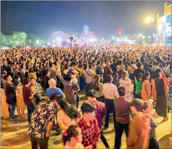
This photo shows the Yangon 2024 Countdown Festival being held on 31 December 2023.

THE Yangon 2025 countdown festival will occur at People’s Square in Dagon Township, Yangon Region, on 31 December 2024, from noon to midnight, as announced by the