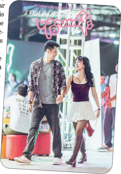
This photo showcases a poster for the ‘Pyin Salat Moe’ film.