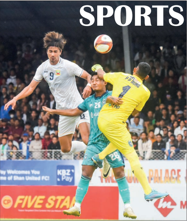
Shan United and Yangon United compete during the first round of the Myanmar National League.