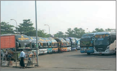
Yangon expands highway bus services for New Year travel