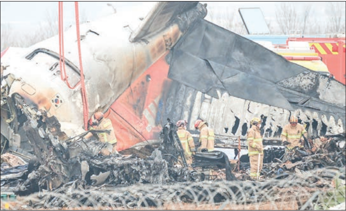
Firefighters and recovery teams work at the scene where a Jeju Air Boeing 737-800 series aircraft crashed and burst into flames at Muan International Airport in Muan, some 288 kilometres southwest of Seoul on 30 December 2024.

NATURAL disasters in Vietnam in 2024 left 514 dead or missing and 2,207 others injured, said Deputy Minister of Agriculture and Rural Development Nguyen Hoang Hiep. The number of fatalities was 3.04 times higher than in 2023 and 2.44 times more than the average number of the 2014-2023 period, local media reported Monday. Among the victims, 345 were killed or went missing in Typhoon Yagi, the strongest storm in the South China Sea in the past 30 years. — Xinhua