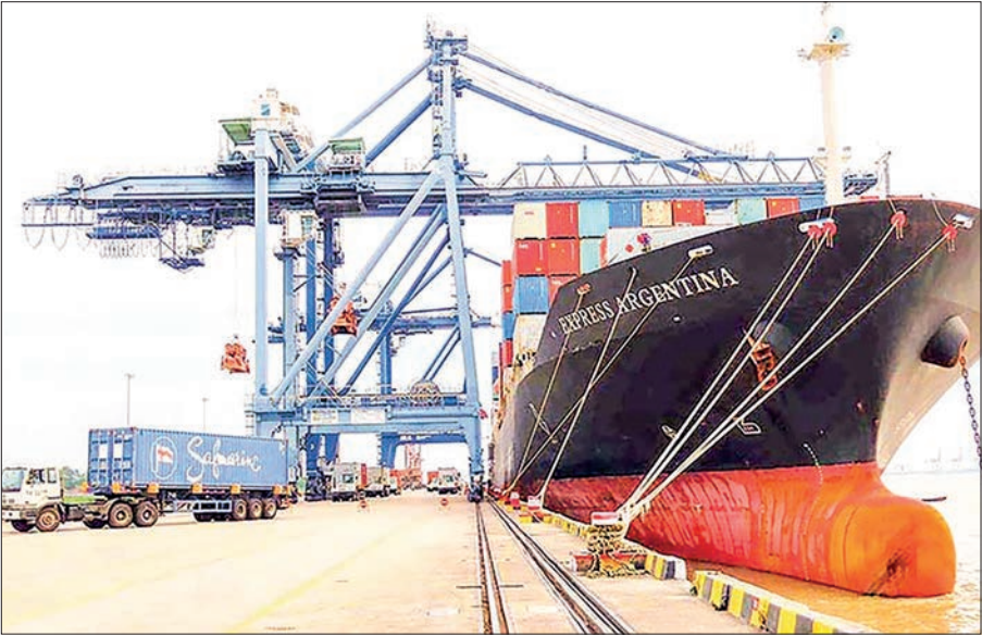
An overseas container vessel docks at Yangon Port for loading and unloading.

Yangon Port handled 629 container vessels in 2023. Thanks to the draft extension, the international ocean liners can access the inner port for now, ac-