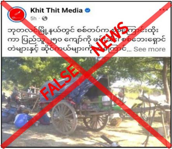
This screenshot reveals false reports.

REPORTS of security forces detaining over 250 innocent people and destroying shelters and motorbikes in Budalin Township, Sagaing Region, have been categorically denied by authorities, who label them as false. A security official described these allegations, circulated by certain media outlets, as unfounded and fabricated. The official stated that security forces are conducting standard security operations in the region and have not been involved in any acts of arson or destruction of civilian properties. The official claimed that the actual perpetrators of such violence are terrorists, who allegedly target villages that do not support them. These groups are accused of burning properties, detaining residents, and committing killings. The circulation of false reports by certain news media is a deliberate attempt to mislead the public, damage the reputation of security forces, and obscure the violent activities of insurgents. According to the official, this misinformation campaign aims to manipulate public perception and divert attention from the actions of terrorist groups. — MNA/MKKS