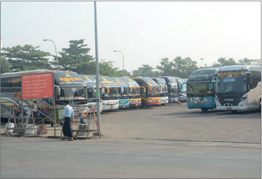
This photo shows express buses at the highway bus stand.

THE Yangon Region Private Transport Supervision Committee (Highways Department) has announced the expansion of bus routes to accommodate travellers from Yangon Region to other regions and states during the New Year holidays. The committee confirmed that the number of highway bus services is being increased based on passenger demand and route requirements. An official explained, “We adjust the number of buses according to passenger volume on each route. For popular destinations like Mandalay, Nay Pyi Taw, and Taunggyi, which already have a high frequency of buses, additional buses are deployed to meet demand. These extra buses are drawn from routes with less traffic.” Currently, over 300 bus routes are operational, served by nearly 800 vehicles daily, transporting more than 10,000 passengers. During the New Year period, the fleet size is being