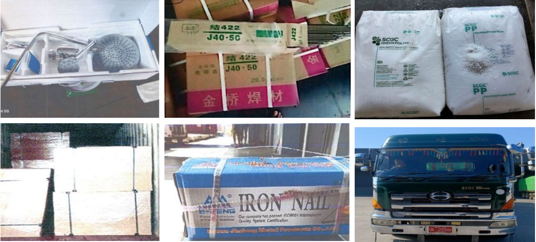
Photos capture confiscated illegal items at Asia World Port Terminal container checkpoint (left&centre) and at the Ywathagyi Dry Port (right).

UNDER the supervision of the Illegal Trade Eradication Steering Committee, efforts to combat the illicit trade are continued effectively by the law. On 27 December, the combined teams impounded 0.252 tonne of illegal teak and 5.249 tonnes of illegal timbers valued at K1.88 million in Pyawbwe and Aungmyaythazan Townships, industrial materials worth K700.72 million without official documents from 13 containers at the Asia World Port Terminal container checkpoint, and two tractor heads with two trailers (estimated value of K175 million) carrying industrial materials, consumer goods and foodstuffs worth K51.17 million without official documents at the Ywathagyi Dry Port. The action was conducted under the Forest Law and Customs procedures. Similarly, on 29 December, the combined on-duty teams nabbed illegal charcoal weighing 2.88 tonnes, 0.555 tonne of illegal teak, 0.192 tonne of illegal hardwood and 0.929 tonne of other illegal timbers (valued at K751,045) in Bago, Nyaunglebin and Pyay districts. The action was taken under the Forest Law. The Illegal Trade Eradication Steering Committee reported 15 arrests on 27 and 29 December, seizing illegal goods worth approximately K929.5 million. — MNA/MKKS