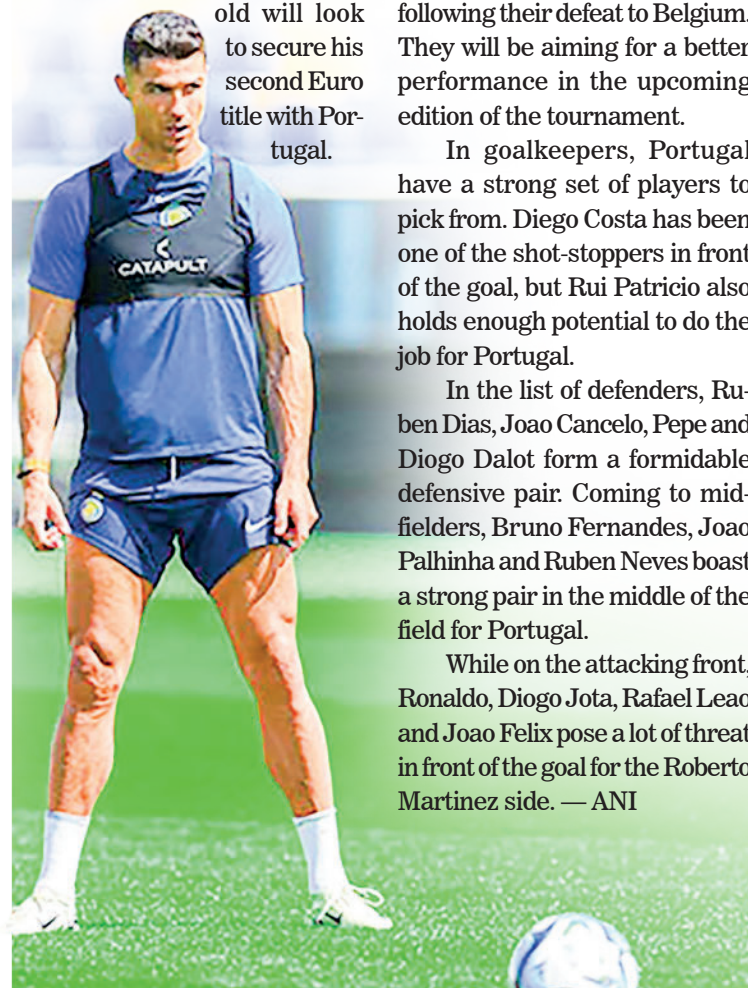
At 39 years old, Ronaldo aims to add to his illustrious career by clinching his second Euro title with Portugal, with the marquee event set to kick off on 15 June.

The marquee event will kick off on 15 June and the 39-year-old will look to secure his second Euro title with Portugal.