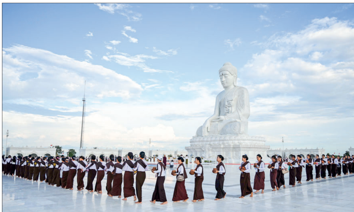
The Kason Water-Pouring Ceremony of the Maravijaya Buddha Image in progress in Nay Pyi Taw yesterday.

tal staff and students poured the Bo tree near the Maravijaya Buddha image and attended the Kason Full Moon Day Dhamma Event held in the Buddha Park of the Maravijaya Buddha Image and listened to the sermon given by Sitagu Sayadaw Dr Bhaddanta Nyanissara.