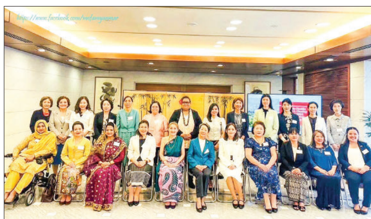
Attendees of the Cheque Sharing Ceremony are seen.

The 2024 ALFS Charity Bazaar of the Asia-Pacific Ladies Friendship Society (ALFS), comprising 26 embassies of Asia-Pacific countries based in Tokyo, was held on 26 March at the Meiji Kinenkan in Tokyo, with participation from 19 embassies, including the Myanmar