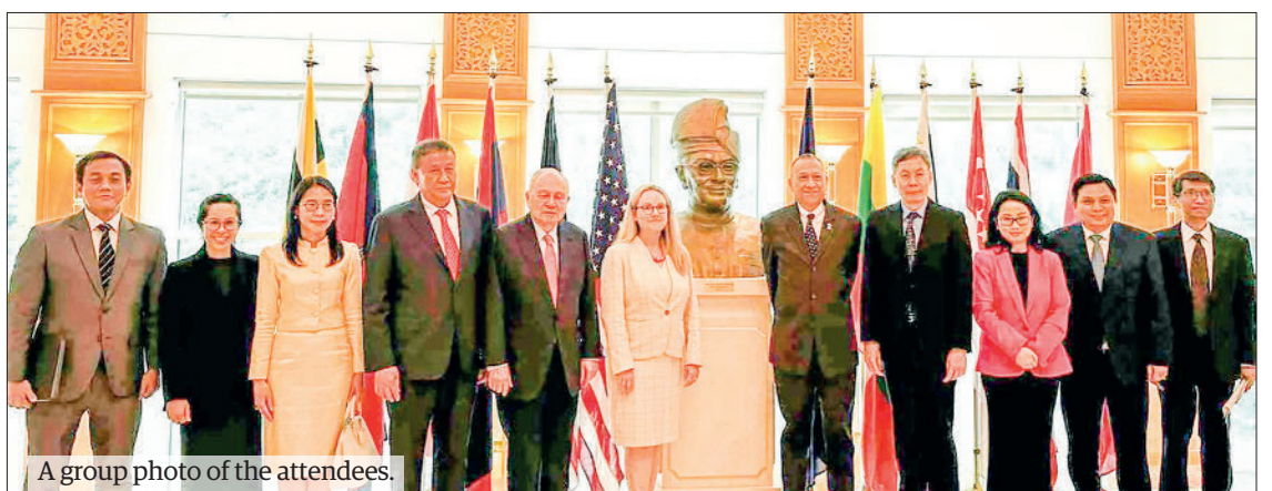
A group photo of the attendees.