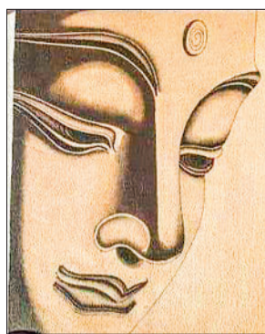
Sand paintings can be seen in Bagan.

BAGAN'S sand paintings, which used to attract foreign tourists, have gained popularity among local people and there are some purchases, according to the painting trade circle in Bagan.