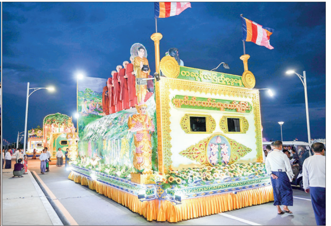
SAC Chair PM Senior General Min Aung Hlaing and dignitaries view round the decorated floats at yesterday's occasion.