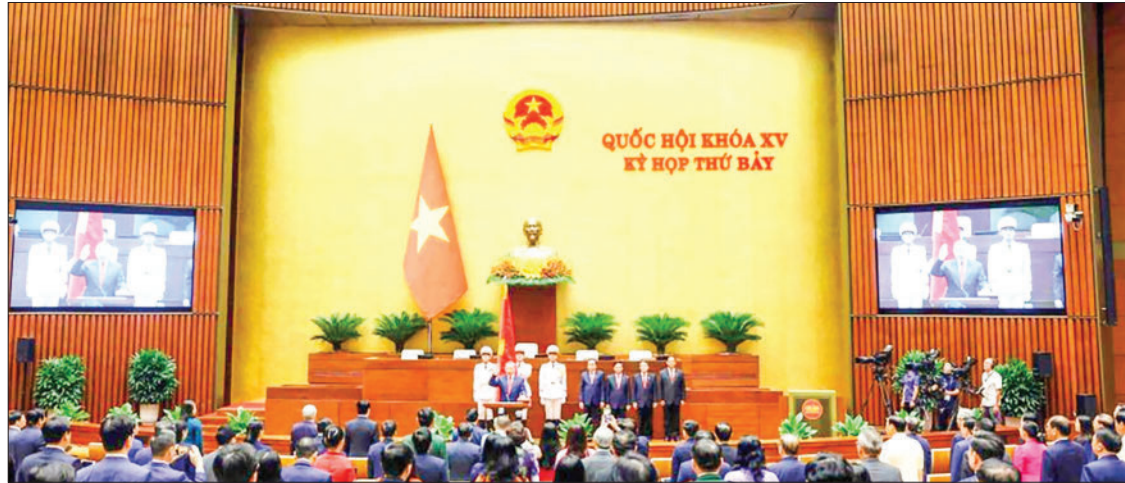
To Lam attends a swearing-in ceremony in Hanoi, Vietnam, 22 May 2024. To Lam, a member of the Politburo of the Communist Party of Vietnam, was elected as Vietnam's new president on Wednesday, local media reported.

Xi emphasized the close ties between China and Vietnam, highlighting their friendship as neighbouring socialist nations.