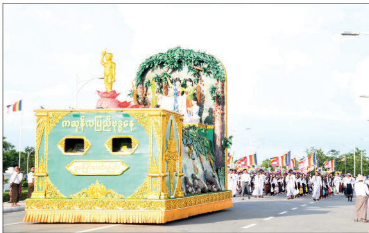
The decorated float go round the Maravijaya Buddha Image in Nay Pyi Taw yesterday.