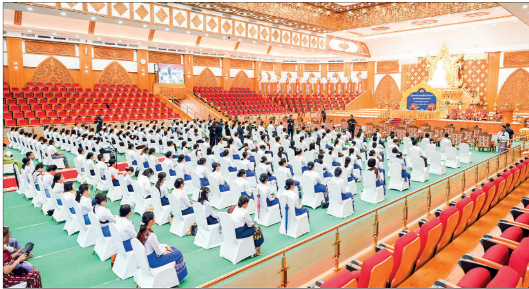
The reading session to commemorate Buddha Day, the full moon day of Kason, in progress yesterday in the Maravijaya Buddha Park in Nay Pyi Taw.