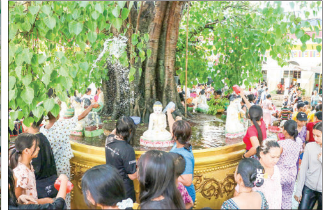
People from Mandalay Region celebrate Kason water-pouring ceremonies at the religious places in Mandalay Region yesterday.

AS Kason Full Moon Day (Buddha Day) is an auspicious day, devotees did good deeds, including pouring water on banyan trees, donating rice to Buddhist monks and launching free food events across Mandalay City.