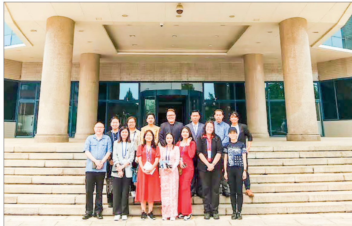
Posing for a documentary photo after China-Media talk show at CRI on 26 April 2024.