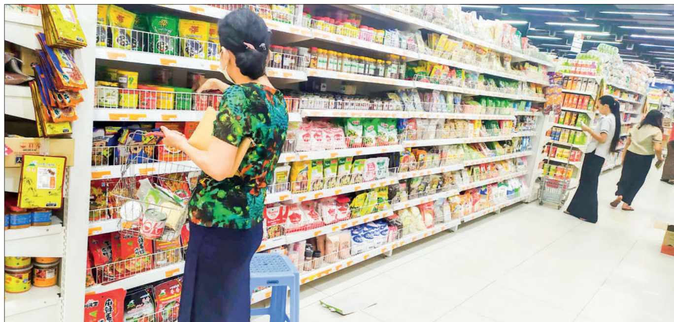
Foodstuffs produced by Myanmar food companies and factories are seen in a supermarket in Yangon.

A total of 1,550 Myanmar food processing companies and factories submitted over 3,000 applications to the General Administration of Customs of the People's Republic of China (GACC) over the past two and half years, according to the Ministry of Commerce.