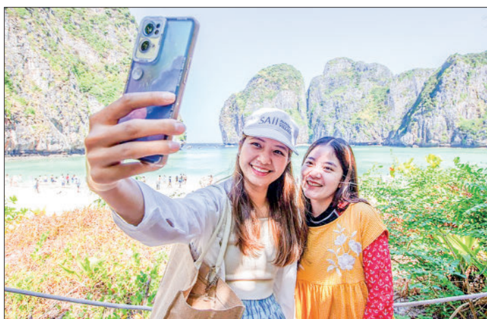
Tourists take a selfie at Phi Phi Islands national park in Krabi, Thailand, 16 February 2023.

There was also a strong growth in the Middle East where international tourism was 36 per cent higher than pre-pandemic levels while Europe received 120 million international tourists, also representing one per cent rise from that of 2019. — Xinhua