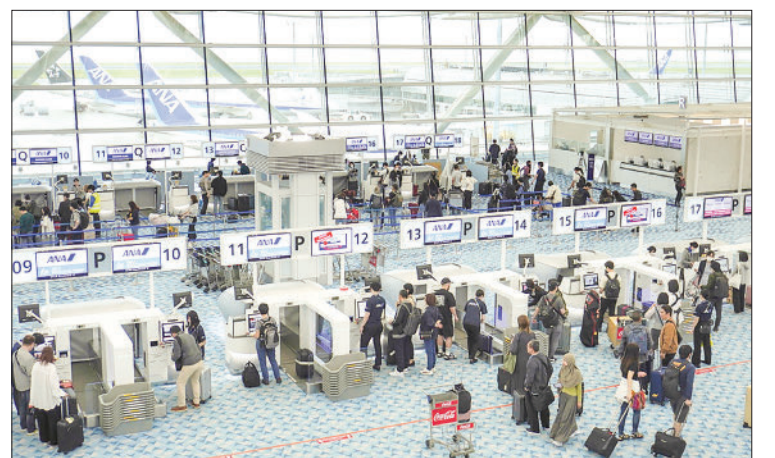
Photo taken on 27 April 2024, shows an international departures lobby at Tokyo's Haneda airport.

located near Tokyo in neighboring Chiba Prefecture. Narita saw around 26 million international passengers in fiscal 2023, more than double the previous year. — Kyodo