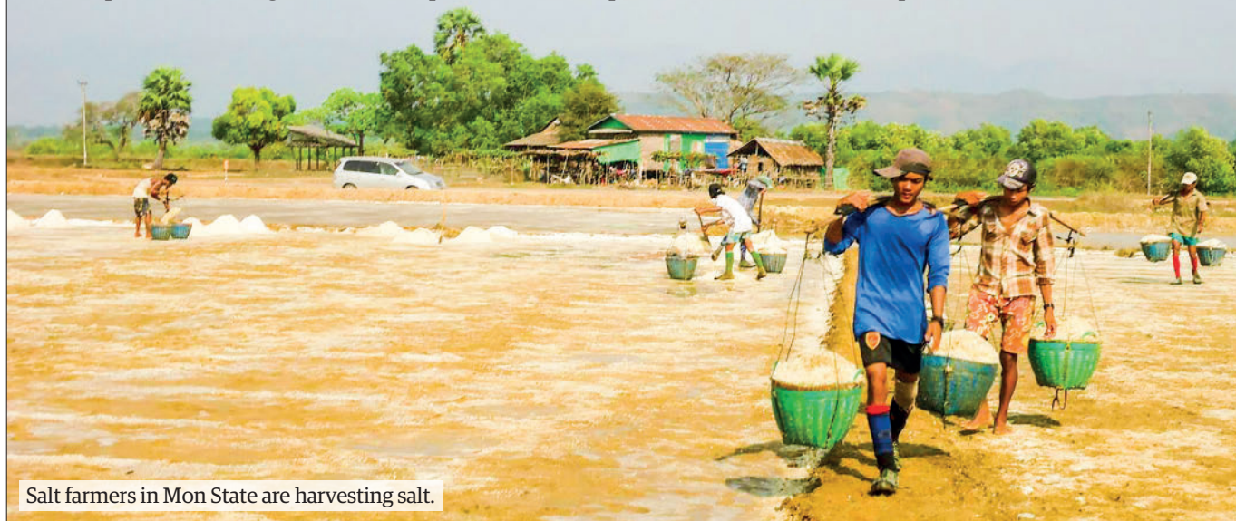
Salt farmers in Mon State are harvesting salt.

Salt is currently harvested and stored in warehouses in good condition. In Myanmar, salt production primarily occurs in the Ayeyawady Region, Rakhine State, and Mon State. Ayeyawady Region accounts for 66 per cent of the country's total salt production, while Rakhine State and Mon State share the remaining 34 per cent. Myanmar ranks 51 st among the 93 countries in the world that produce salt. — TWA/TMT