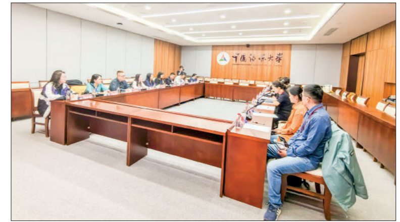
Presentation of digital virtual humans with AI technology at the State Key Laboratory of Media Convergence of the Communication University of China.