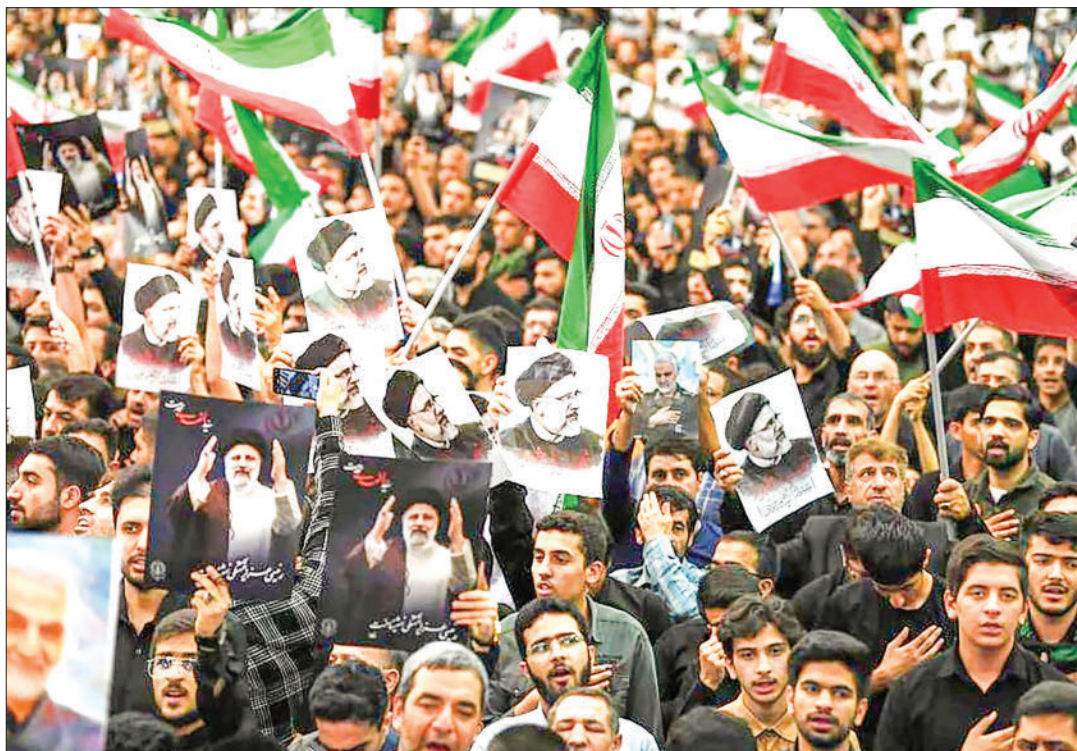
People attend a farewell ceremony held for Iran's late President Ebrahim Raisi, late Foreign Minister Hossein Amir-Abdollahian and others in Tehran, 21 May 2024.

Under the Iranian constitution, an early presidential election must be held within 50 days after the incumbent president is pronounced dead or incapacitated. Meanwhile, Raisi's powers have been transferred to the first vice president, Mohammad Mokher. — SPUTNIK