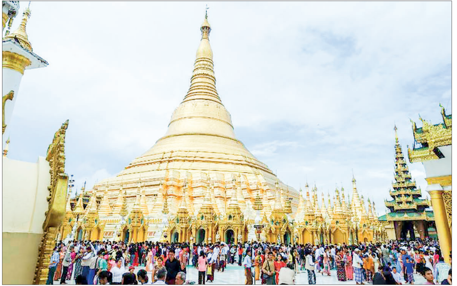
The photo shows the Shwedagon Pagoda with full of pilgrims yesterday.