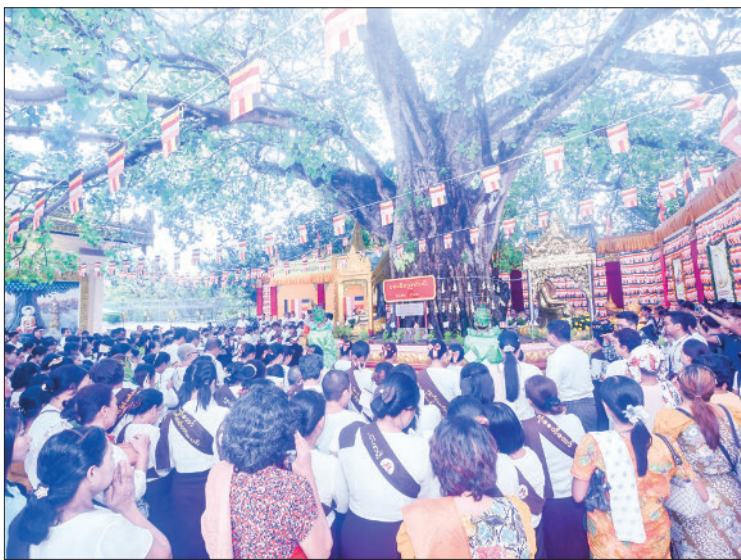
People from Yangon Region celebrate Kason water-pouring ceremonies at the Shwedagon Pagoda and Sule Pagoda in Yangon Region yesterday.