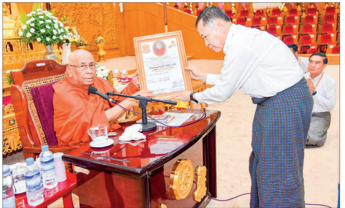
Sitagu Sayadaw gives the Vice-Senior General a certificate of honour.

On the occasion, the Vice-Senior General and his wife and congregation took the Eight Precepts from State Ovadacariya Shwegyin Nikaya Chairman 16 th Sangharaja of Shwegyin Nikaya Chancellor of Sitagu International Buddhist Academies Abhidhaja Maha Rattha Guru Abhidhaja Agga Maha Saddhamma Jotika Agga Pandita Maha Dhammakathika Bahujana Hitadhara Sitagu Sayadaw Dr Bhaddanta Nyanissara and listened to the