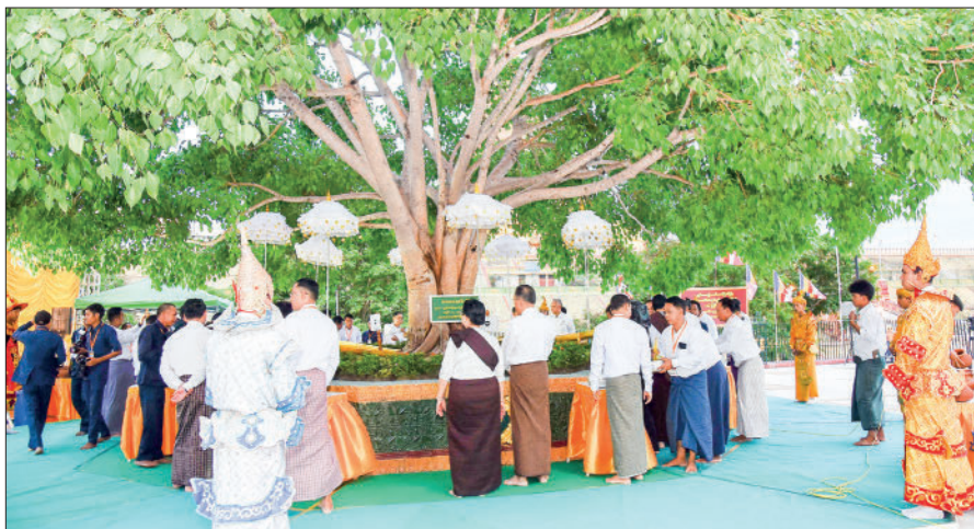
The 16 th Kason Water-Pouring ceremony of the Uppatasanti Pagoda in progress in Nay Pyi Taw yesterday.

water on small banyan trees in the Uppatasanti Pagoda compound, and the master of the ceremony recited a mantra named Maha Bodhi Rokha Thisanapusa. They then sprinkled banyan trees with scented water and paid homage to the trees by clockwise procession. — MNA/KZL