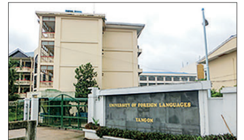
Yangon University of Foreign Languages.

YANGON University of Foreign Languages will offer one-year full-time PhD courses in Chinese and Korean languages for the 2024-2025 academic year.