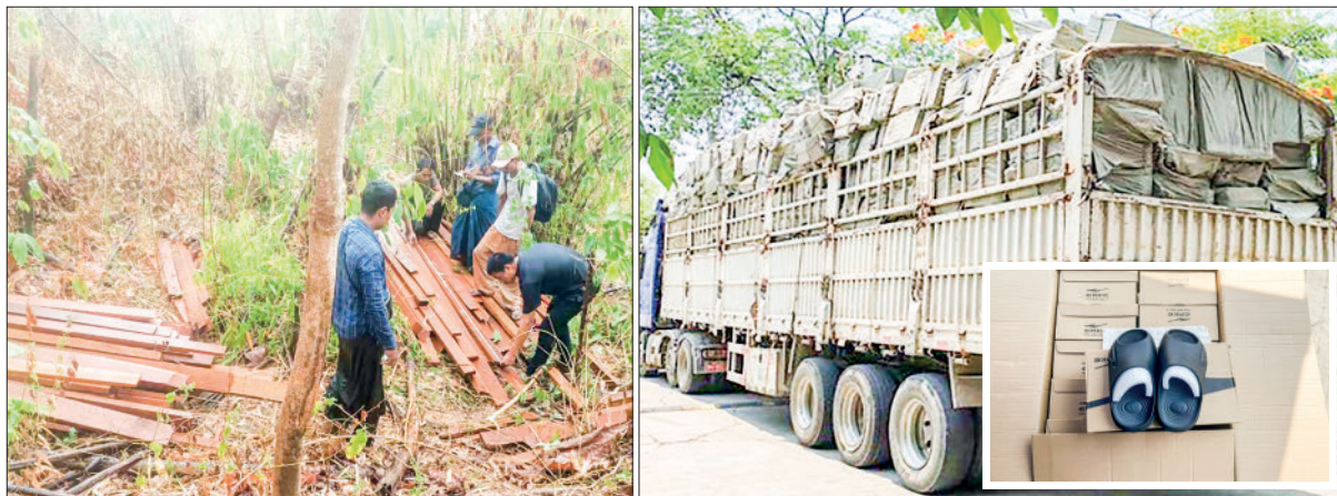
Confiscated illegal timbers in Bago Region (L) and pairs of sandals and a vehicle in Mandalay Region (R).

SUPERVISED by the Illegal Trade Eradication Steering Committee, actions are being taken nationwide against illicit trading in accordance with the law.