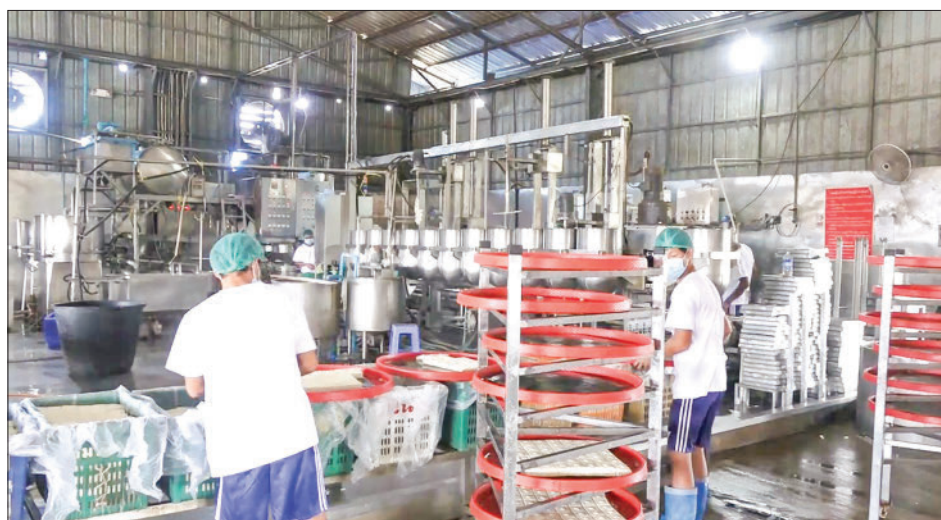
A factory located in the Kyauktan industrial complex in Mawlamyine, Mon State.

Companies cannot directly proceed with registration, and they need to carry out this step through competent authorities and departments concerned by sending an email to dapq@customs.gov.cn or submitting a letter to the Chinese Embassy in Myanmar or the Myanmar Embassy in China. — NN/EM