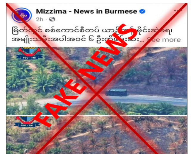
The screenshot validate false claims.

The reports indicate that malicious media are fabricating news stories to create fear among local people by ambushing, shooting and misrepresenting the actions of the security forces. — MNA/TH