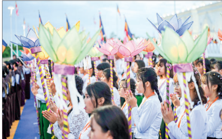
Pilgrims participate in the light offering ceremonies at the Maravijaya Buddha Image in Nay Pyi Taw yesterday.