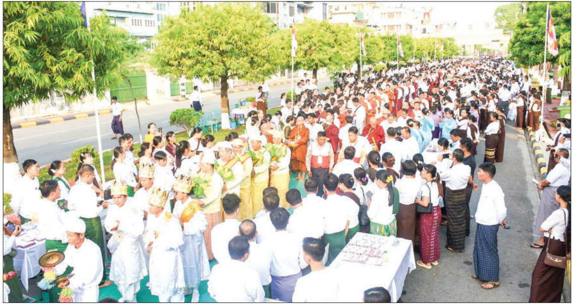
Mandalay Region government and well-wishers donate alms and offerings to 20,272 members of the Sangha on Buddha Day, which falls on the full moon day of Kason, yesterday.

Then, the regional chief minister and wife, the commander and his wife, officials and people donated meals, alms and cash for nine prerequisites to 20,272 members of the Sangha from four corners of Mandalay at the same time.