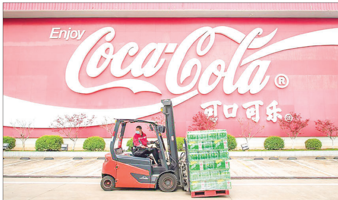
The new facility will be a green, intelligent, environmentally friendly and diversified world-class plant.

Spanning an area of 128,000 square metres, the state-of-the-art facility will feature 11 new beverage production lines, multi-tier warehouses, and ancillary facilities.